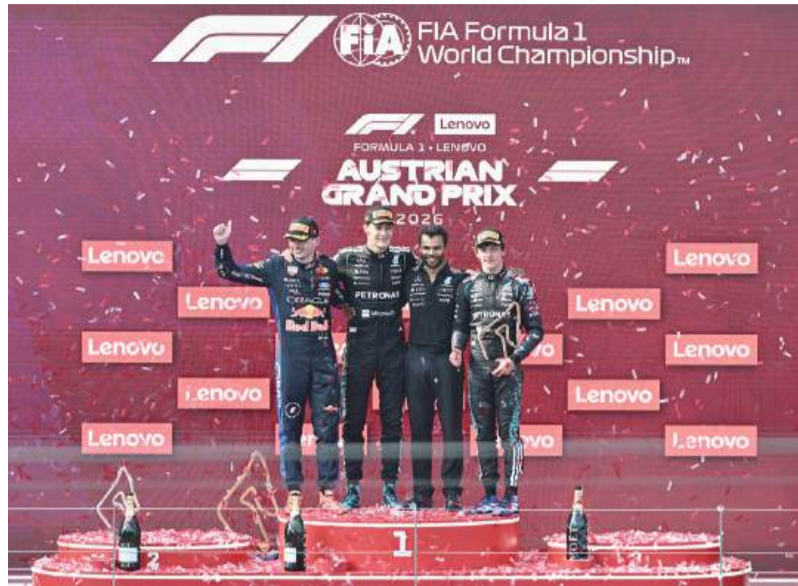
Second placed Red Bull Racing's Dutch driver Max Verstappen (left), winner Mercedes' British driver George Russell (second left) and third placed Mercedes' Italian driver Kimi Antonelli (right) celebrate on the podium after the Formula One Austrian Grand Prix at the Red Bull Ring race track in Spielberg, Austria yesterday.

Verstappen, who started fifth, made light of the temperatures of 37C (air) and 62C (track). He said: "It was a very good race for us.