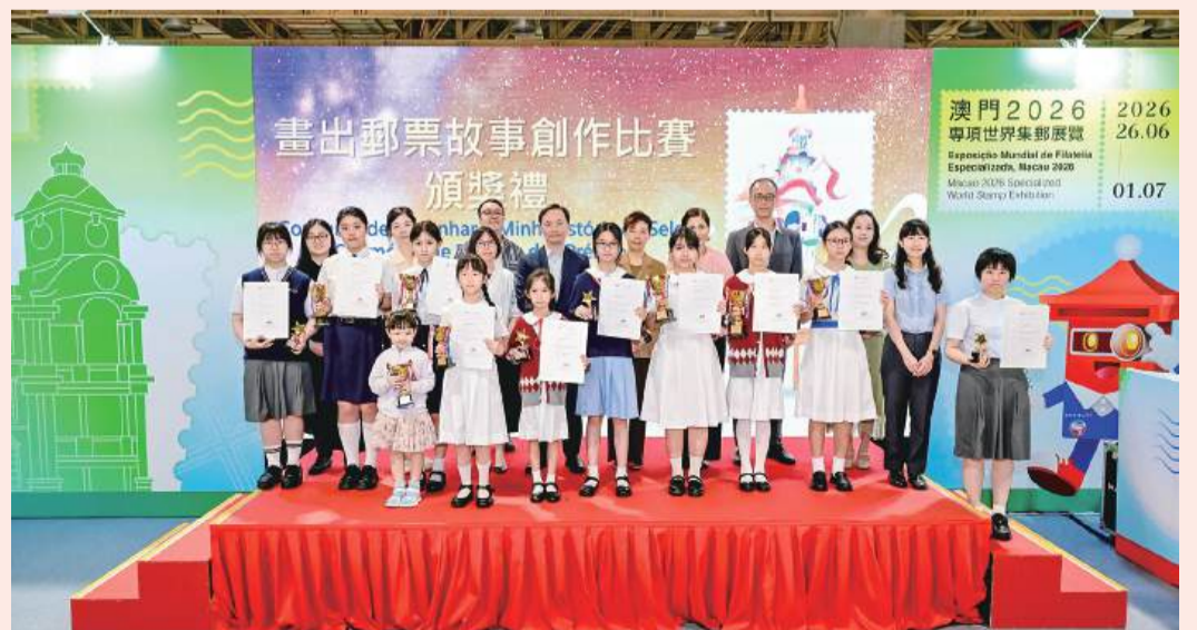
This photo shows the winning students of the "Draw My Story of Stamps Contest".

The ongoing free-admission exhibition, which its themed website described as "the first global-scale philatelic event to be held in Macau", continues through Wednesday, July 1, with more details on https://www.macao2026.org.mo . ■