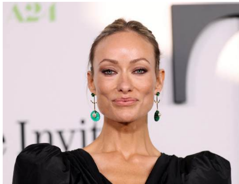
US-Irish actress and director Olivia Wilde poses upon arrival for the Los Angeles premiere of “The Invite” at the Directors Guild of America Theatre in Los Angeles last Tuesday.

“Parks and Recreation,” said the film clicks “even though we’re talking about very dysfunctional people and dysfunctional relationships” – or maybe even because of that fact.