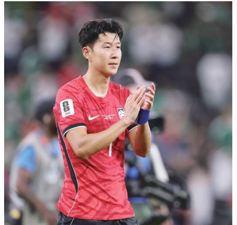
South Korea's forward Son Heung-min applauds the fans at the end of the 2026 World Cup Group A match against South Africa at the Monterrey Stadium in Guadalupe, Mexico, on Wednesday.