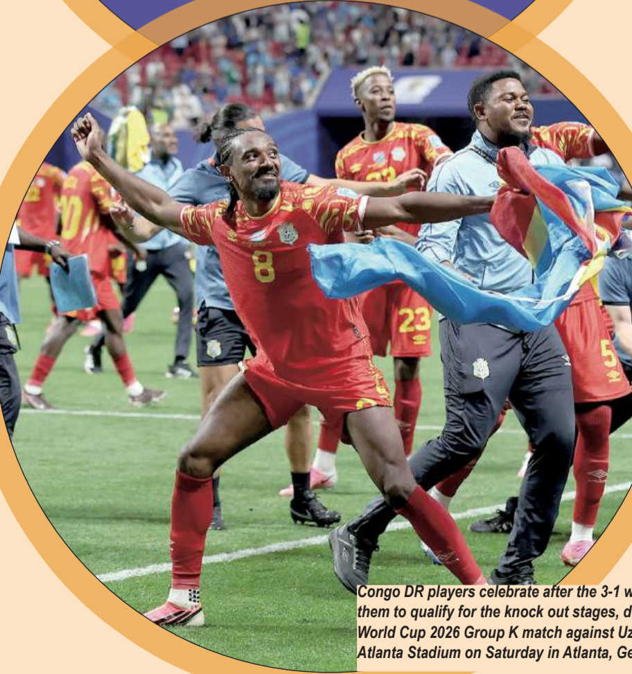
Congo DR players celebrate after the 3-1 win, allowing them to qualify for the knock out stages, during the FIFA World Cup 2026 Group K match against Uzbekistan at Atlanta Stadium on Saturday in Atlanta, Georgia.