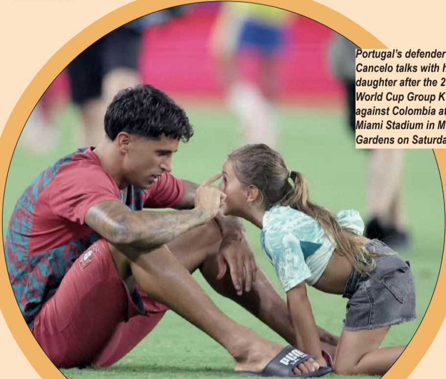
Portugal's defender Joao Cancelo talks with his daughter after the 2026 World Cup Group K match against Colombia at the Miami Stadium in Miami Gardens on Saturday.