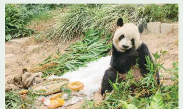
These handout photos provided by the Municipal Affairs Bureau (IAM) on Friday show the two giant panda twins – Jian Jian (left) and Kang Kang – eating their icy birthday cakes in Seac Pai Van Park.