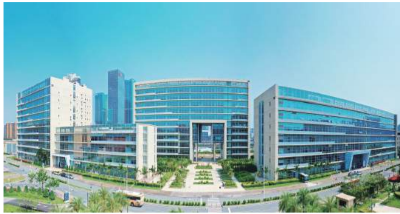
This undated handout photo provided by the public University of Macau (UM) recently shows its scientific research base on its campus in Hengqin.

Coinciding with the launch of the Faculty of Medicine on August 1, the university is also establishing two additional research institutes