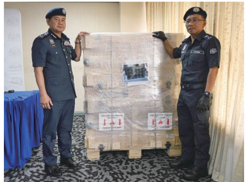
Members of the Royal Malaysian Customs pose for photographs with computers equipped with AI chips confiscated during a press conference in Sepang, Malaysia on Friday.

The now-shelved Pacquiao bout would have rematched the fighters in the top money-spinner in boxing history. – AFP