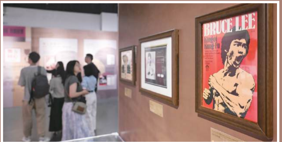
This photo taken on Saturday shows the cover of a Bruce Lee-themed magazine on display at an exhibition in Beijing. The exhibition highlighting friendly exchanges between the civilian sectors of China and the United States has opened at the Overseas Chinese History Museum of China in Beijing. The exhibition features a selection of 100 relics, including gold-mining tools, railroad spikes, documents and newspapers, as well as badges marking China’s war against Japanese aggression, showcasing the contributions made by generations of overseas Chinese throughout US history. – Xinhua

Elections for deputies to the ninth State Duma are scheduled for September 20, 2026. The ongoing United Russia party congress serves as a key platform for the upcoming electoral campaign. – Xinhua