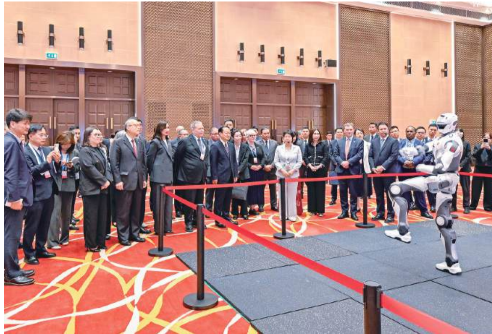
Representatives of APEC member economies watch a robot show at the Forum Macao Complex on Saturday during the cultural and tourism showcase and experience activities organised as part of the 13 th APEC Tourism Ministerial Meeting.

China is willing to strengthen policy alignment with various countries to introduce more facilitation measures in areas such as mutual visa exemptions, fast-track immigration clearance, cross-border payments, and departure tax refunds, thereby continuously improving the ease and convenience of travel, Sun said.