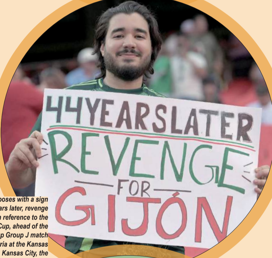
An Algeria fan poses with a sign reading "44 years later, revenge for Gijon" in reference to the 1982 World Cup, ahead of the 2026 World Cup Group J match against Austria at the Kansas City Stadium in Kansas City, the United States on Saturday.