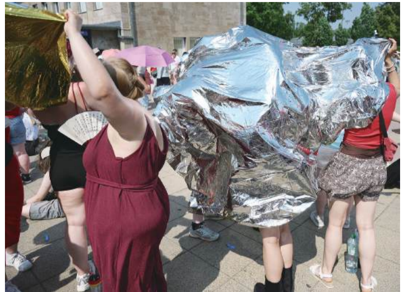
Pedestrians use emergency blankets to protect themselves from the heat as they arrive at the Olympic stadium for a concert of US singer Bruno Mars yesterday, in Berlin, as the German capital was expected to reach temperatures of around 40 degrees Celsius during the current heatwave in Europe.

In France, the highest-level heat alerts were expected to ease yesterday evening, although millions continued to endure sweltering conditions.