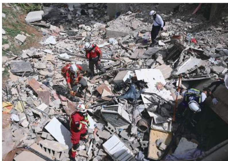
Costa Rican rescuers search through the rubble of a collapsed building in Catia La Mar, La Guaira State, Venezuela, yesterday, following last Wednesday’s twin earthquakes.

Facing public outrage at the response by local officials, Rodríguez thanked other countries for the outpouring of aid.