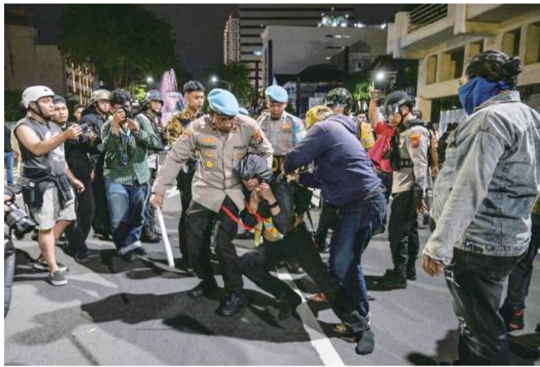
Indonesian police arrest a student following clashes during a protest against a rise in non-subsidised fuel prices, inefficient government spending and military involvement in civilian affairs and the government's free school meals programme (MBG) in Surabaya on Friday.

Authorities arrested 24 people on Friday and released most of