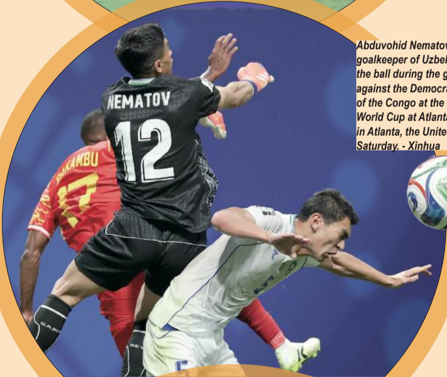
Abduvohid Nematov (centre), goalkeeper of Uzbekistan, saves the ball during the group K match against the Democratic Republic of the Congo at the 2026 FIFA World Cup at Atlanta Stadium in Atlanta, the United States, on Saturday.