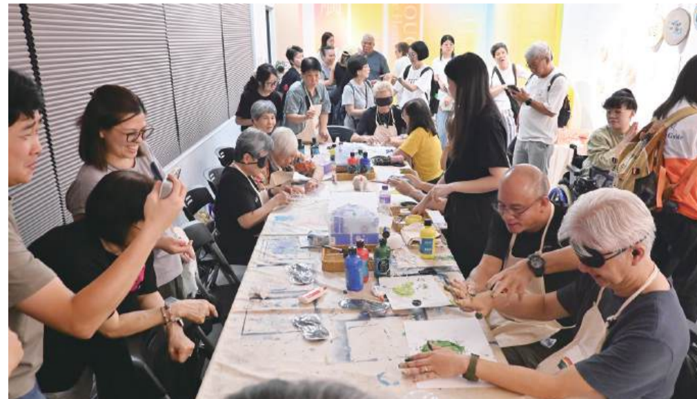
Participants take part in a workshop after the opening ceremony of the exhibition "TOUCH the Heart" at the Cardinal Newman Centre for Culture and Arts Performance of Macau (CCCN)

Having authored several books, yesterday also saw the launch of his latest work "Conquest of Darkness", which was published by the association. The bilingual (Chinese and English) book goes over his recent move back to Macau, challenges and how he faces them,