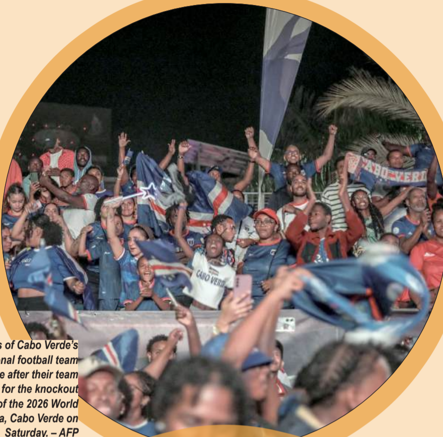
Supporters of Cabo Verde's national football team celebrate after their team qualified for the knockout stage of the 2026 World Cup in Praia, Cabo Verde on Saturday.