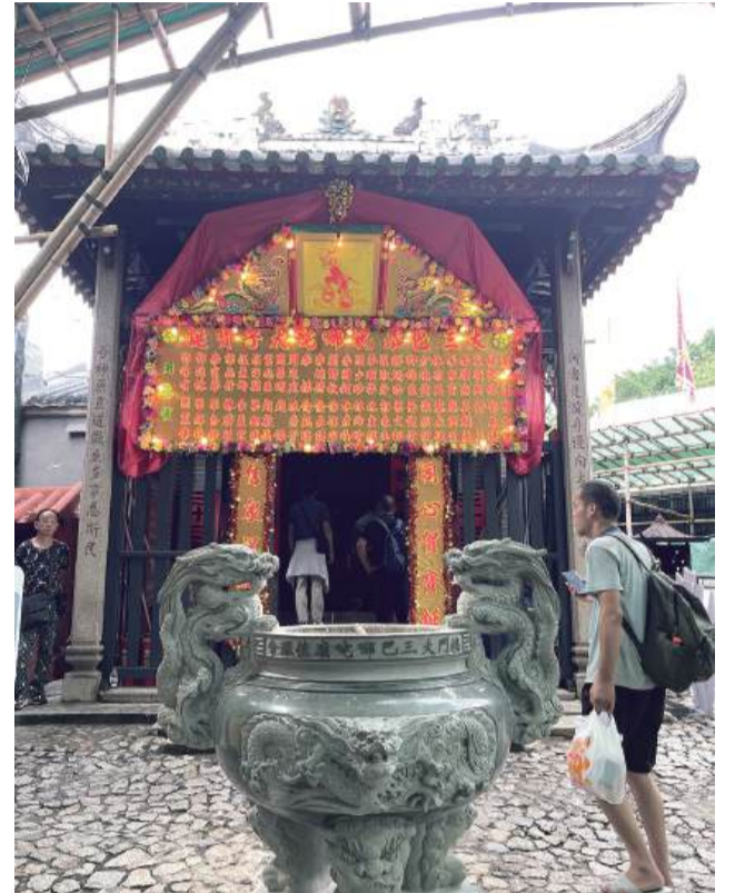
A visitor passes an incense burner in front of Na Tcha Temple on Friday.