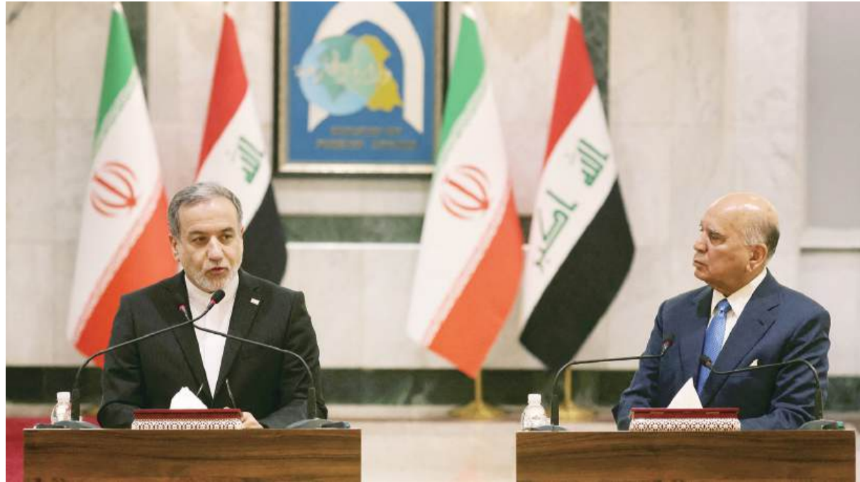
Iranian Foreign Minister Abbas Araghchi (left) speaks as Iraqi Foreign Minister Fuad Hussein looks on during a joint press conference following a meeting in Baghdad yesterday. Araghchi called for the establishment of a security framework with Gulf countries, after Iranian strikes against US bases in the Gulf in retaliation for American attacks.

“Any attempt to adopt new or separate arrangements compared