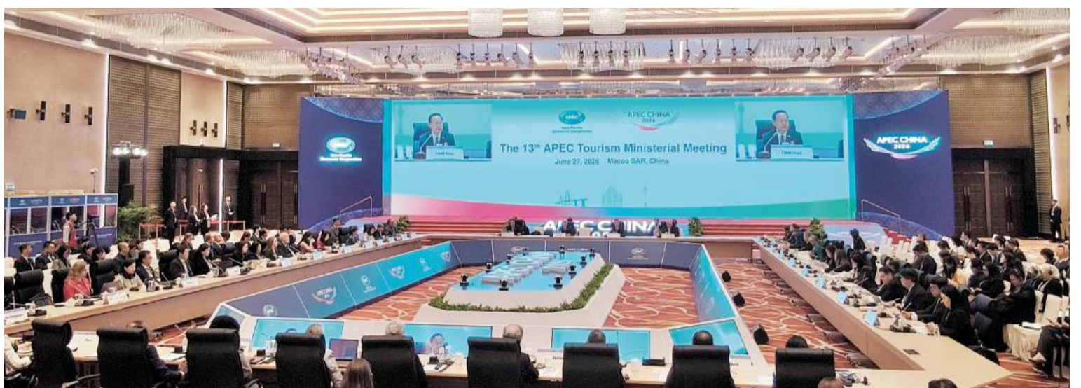
Representatives of APEC member economies listen to Minister of Culture and Tourism Sun Yeli delivering a welcoming address during the opening session of Saturday’s 13 th APEC Tourism Ministerial Meeting at the Forum Macao Complex.

The meeting was held at the Services Platform Complex for Commercial and Trade Cooperation between China and Portuguese-speaking Countries (aka Forum Macao Complex) in Sai Van.