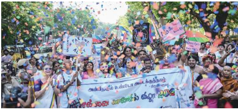
Gender rights activists and supporters of the LGBTQ community take part in a Pride March in Chennai, India yesterday.