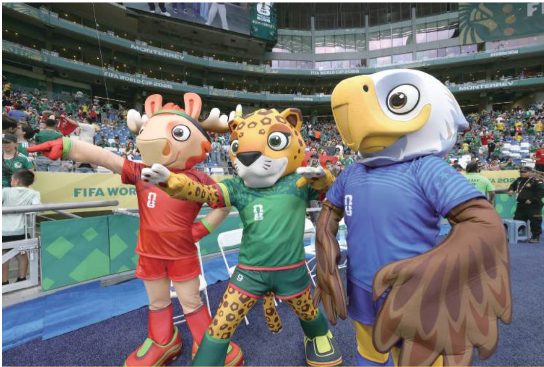
Official mascots Maple the Moose (Canada) (from left to right), Zayu the Jaguar (Mexico), and Clutch the Bald Eagle (US), pose for a picture ahead of the 2026 World Cup Group F match between Sweden and Tunisia at the Monterrey Stadium in Guadalupe, Mexico on Sunday.