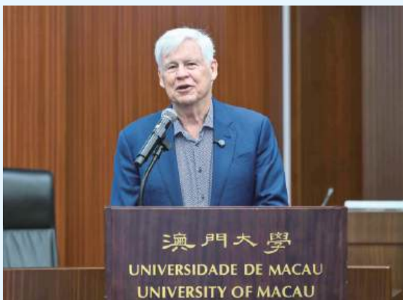
This handout photo provided by the public University of Macau (UM) on Monday shows 2003 Nobel laureate Robert F. Engle speaking during his “Can We Stop Climate Change?” lecture at the campus in Hengqin that day.

* ARCH (Autoregressive Conditional Heteroskedasticity) and GARCH (Generalised ARCH) are statistical models used to analyse and forecast volatility in time series data. They are foundational tools in finance and econometrics, widely used to predict asset risk, price derivatives, and optimise portfolios. In statistics and econometrics, heteroskedasticity happens when the spread—or volatility—of data points is not constant across a dataset. To break it down simply: it means unequal variance. — Gemini