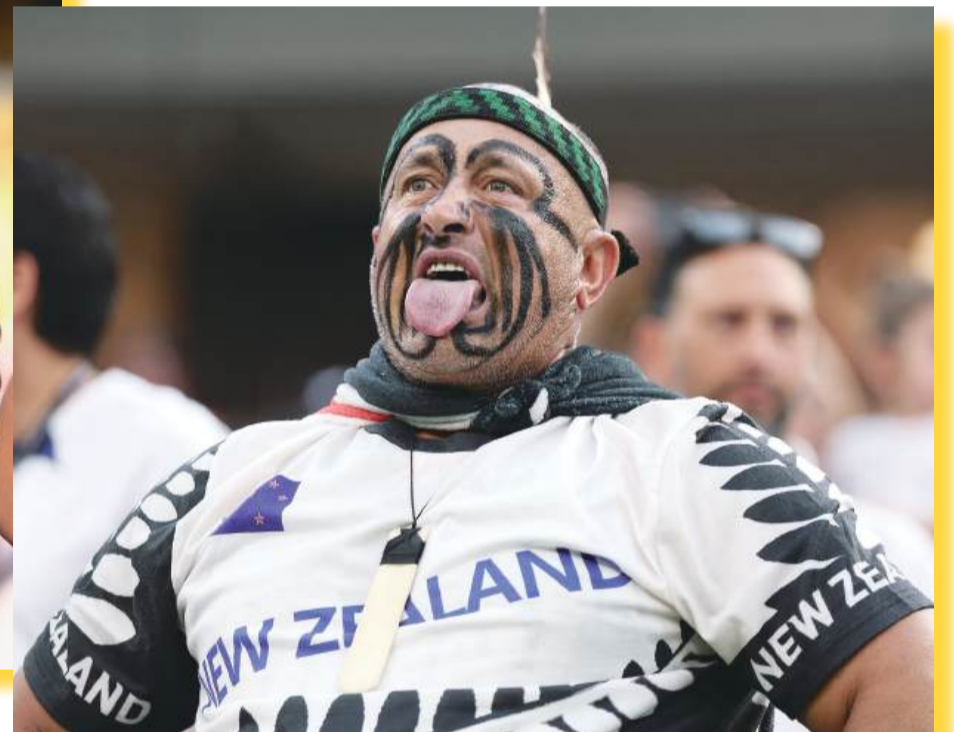
A fan of New Zealand shows their support by performing the haka before the FIFA World Cup 2026 Group G match against IR Iran at Los Angeles Stadium on Monday in Los Angeles, California.