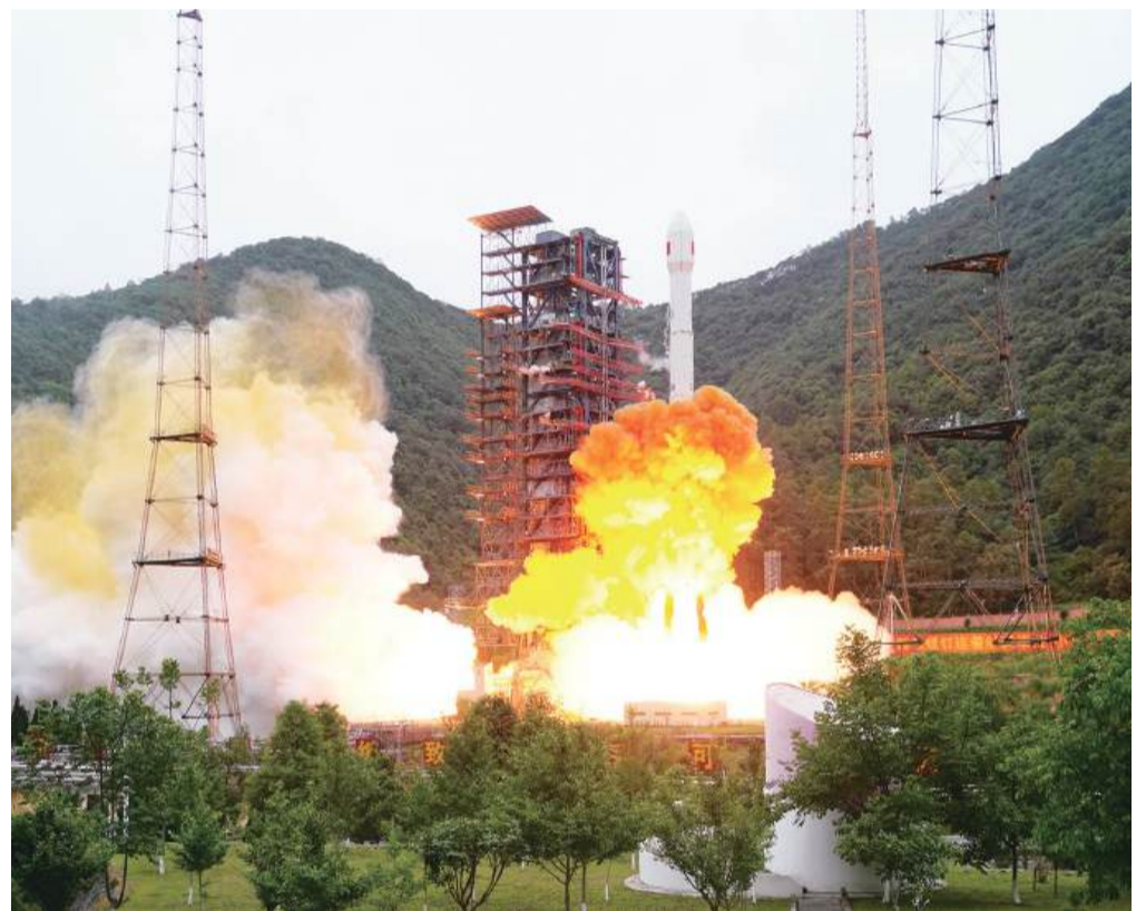
A Long March-3B carrier rocket carrying a new satellite, Shijian-31, blasts off from the Xichang Satellite Launch Center in Sichuan Province, yesterday. The rocket blasted off at 5:45 p.m. and placed the new satellite into space successfully.

"The outside world calls him a hero," the son said. "But in our family, he was an ordinary person." – Xinhua