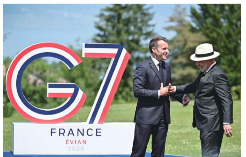
French President Emmanuel Macron (left) welcomes Brazilian President Luiz Inácio Lula da Silva for the official greeting during the G7 summit, in Évian, eastern France, yesterday. The three-day G7 summit, scheduled to end today, in the French town of Evian-les-Bains near Switzerland is being attended by the leaders of the G7 members, as well as those from nine countries invited by France.

Authorities described the seizure as a major step in the fight against drug trafficking, particularly against fentanyl, which they said is more potent and harmful than drugs such as cocaine, heroin and morphine.