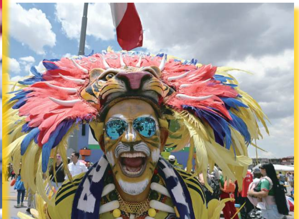
A fan of Colombia gestures while attending the screening of the 2026 World Cup Group G match between Belgium and Egypt at the FIFA Fan Festival at Zocalo square in Mexico City on Monday.