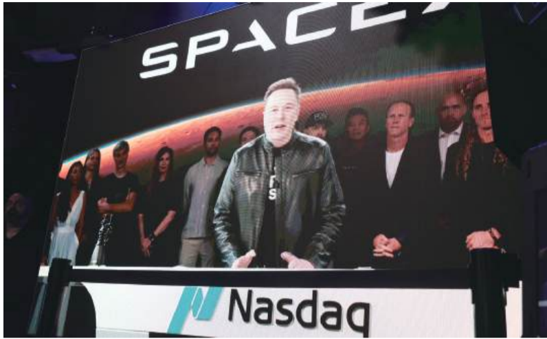
SpaceX founder and CEO Elon Musk speaks via video at the Nasdaq Marketsite in Times Square during the launch of the SpaceX initial public offering (IPO) on the Nasdaq last Friday in New York City.