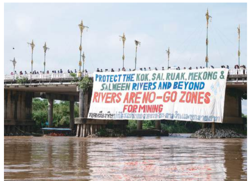
This photo taken on June 5 shows environmental activists and people from affected communities walking to highlight the toxic contamination of rivers affected by gold mining, near the northern Thai city of Chiang Rai.

Thailand’s pollution control department said in April it had found arsenic concentrations of up to 296 milligrams per kilogram of sediment near Chiang Saen — more than nine times the level considered dangerous for aquatic life.