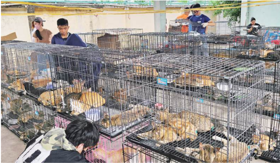
This handout picture taken on Monday and released yesterday by Humane World for Animals Vietnam shows people looking at cats seized by police at a facility in Ho Chi Minh City.

HANOI — More than 40 abducted cats have been reunited with owners after Vietnam police busted a feline theft ring and rescued 400 pets destined to be slaughtered for food, an animal rights group said yesterday.