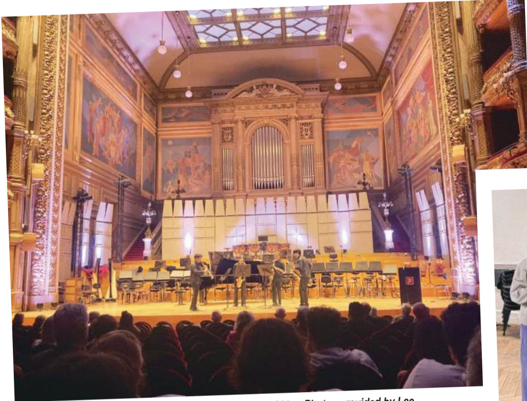
Quatuor Rodin performs at Liège Philharmonic Hall in 2023.