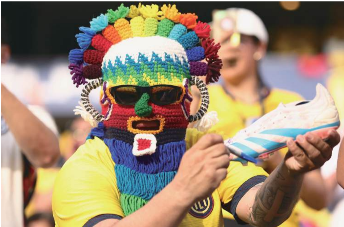
An Ecuadorian fan wears an Aya Huma mask ahead of the 2026 World Cup Group E match against Ivory Coast at the Philadelphia Stadium in Philadelphia on Sunday.