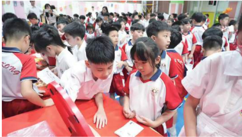
Hou Kong Middle School (Primary Section) students participate in the school's recent English Carnival.

Since 2020, the team has pursued a whole-school approach to hold an annual English-language event. The goal is to provide students with a different learning experience where they can apply English in real-world contexts. The objectives of this year's English Carnival were to strengthen students' confidence in speaking English and to encourage them to explore the world through the language. In the current