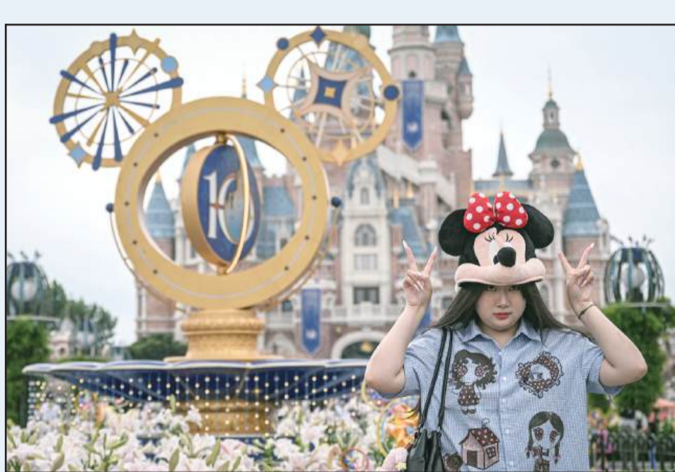
A woman wearing a Minnie Mouse hat poses for in front of the Disney castle at Shanghai Disney Resort in Shanghai yesterday. Shanghai Disneyland officially opened on June 16, 2016. The grand opening featured a multi-day celebration in the Pudong New District, which marked Disney’s first destination resort in mainland China and its sixth resort worldwide.

“Holding Out For A Hero” came out in 1984 and featured on the soundtrack to the huge US box office hit “Footloose”.