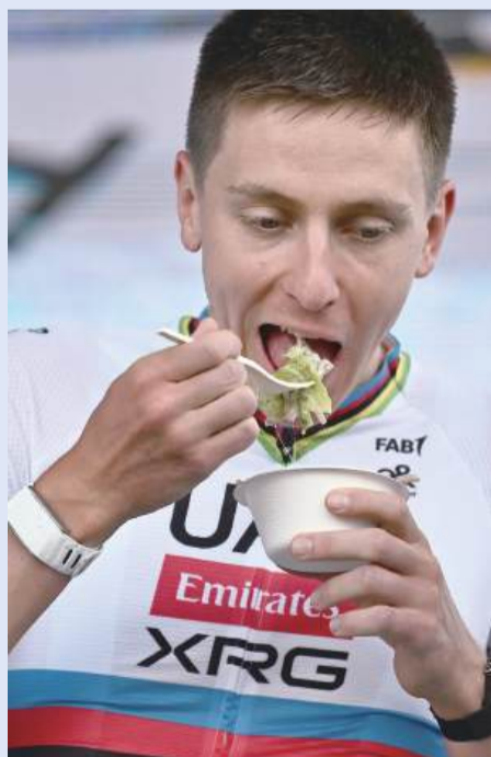
Slovenia's rider Tadej Pogacar of team UAE Emirates - XRG eats local speciality "Pizzoccheri della Valtellina" (a hearty, traditional Italian pasta dish originating from the Alpine Valtellina valley in Lombardy, northern Italy), during the team presentation on the eve of the first stage of the Tour of Switzerland (Tour de Suisse) cycling race, in Sondrio, Italy, yesterday.

The Slovenian is such an overwhelming favourite for victory in the five-day race that the question on