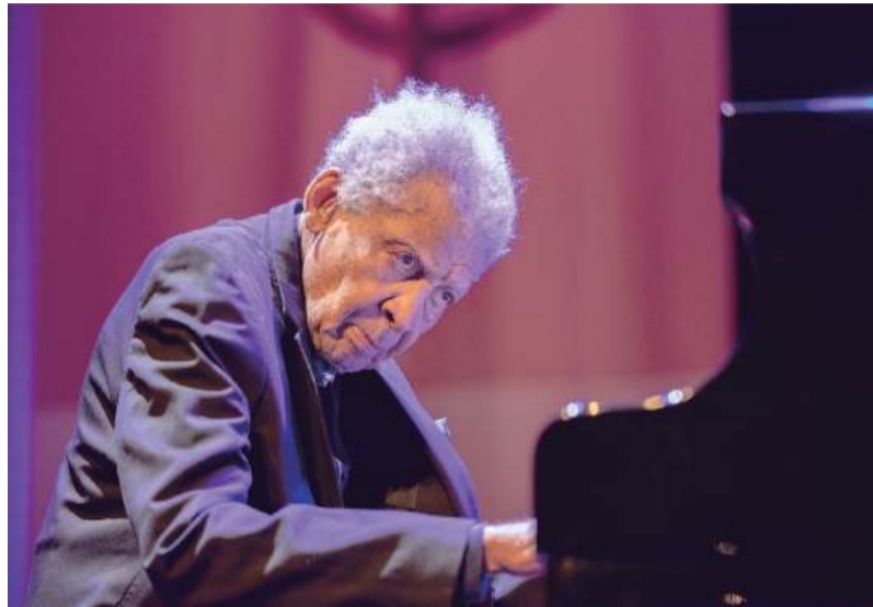
South African pianist and composer Abdullah Ibrahim performs on stage at the Cape Town International Jazz Festival in Cape Town, on March 27, 2026. World-renowned South African jazz pianist and composer Abdullah Ibrahim died on Monday at the age of 91 in Germany, his family has announced in a statement.

In 1965, Ibrahim and his wife moved to New York, where he fronted the Duke Ellington Orchestra on several occasions, studied at the Juilliard School of Music and mixed with other jazz artists.