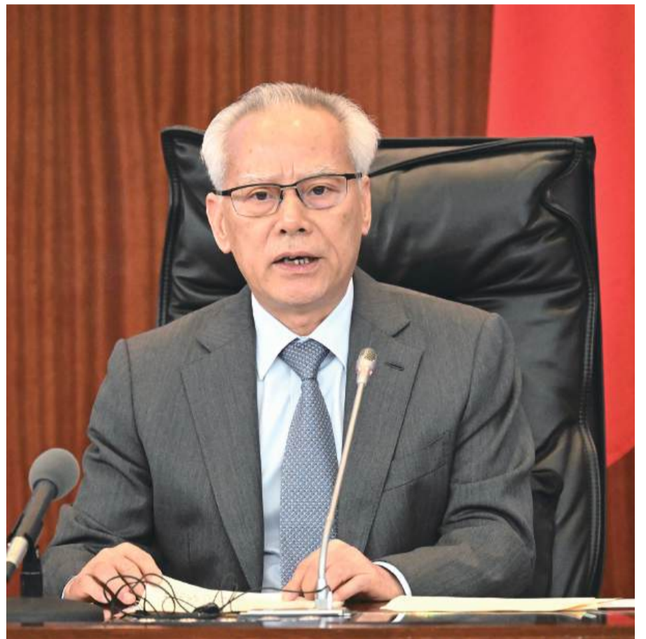
Chief Executive Sam Hou Fai answers questions from lawmakers during yesterday's Q&A session in the Legislative Assembly's (AL) hemicycle.