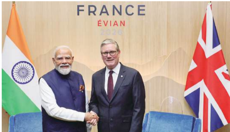
India's Prime Minister Narendra Modi (left) shakes hands with Britain's Prime Minister Keir Starmer during a bilateral meeting on the sidelines of the G7 summit, in Evian, eastern France, yesterday.

Every El Niño is different, but major events often follow familiar patterns. This includes drought across parts of the Amazon, Indonesia and Australia, disrupted monsoons in India, and shifting rainfall throughout the tropics. – AFP