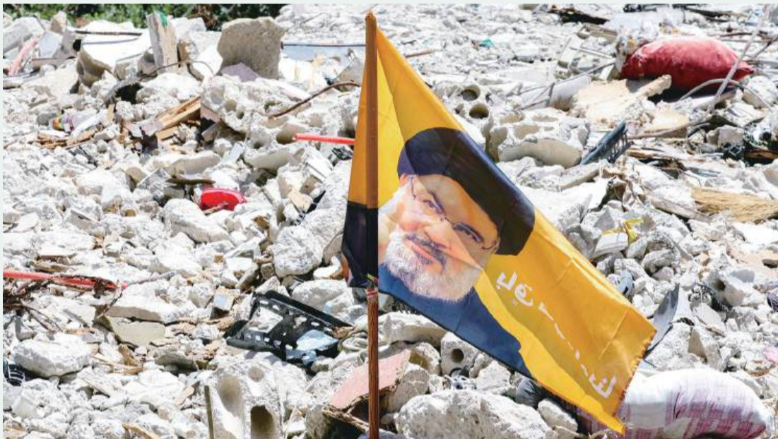
A flag bearing the image of Hezbollah slain leader Hassan Nasrallah, who was killed by an Israeli airstrike on Beirut’s southern suburbs in 2024, is placed amidst rubble in the village of Deir Qanoun al-Nahr in southern Lebanon yesterday.

BEIRUT – Hezbollah’s chief yesterday thanked Iran’s top negotiator for helping stop the “Israeli-American aggression” on Lebanon, after the announcement of a US-Iran deal on ending the Middle East war that includes Lebanon.