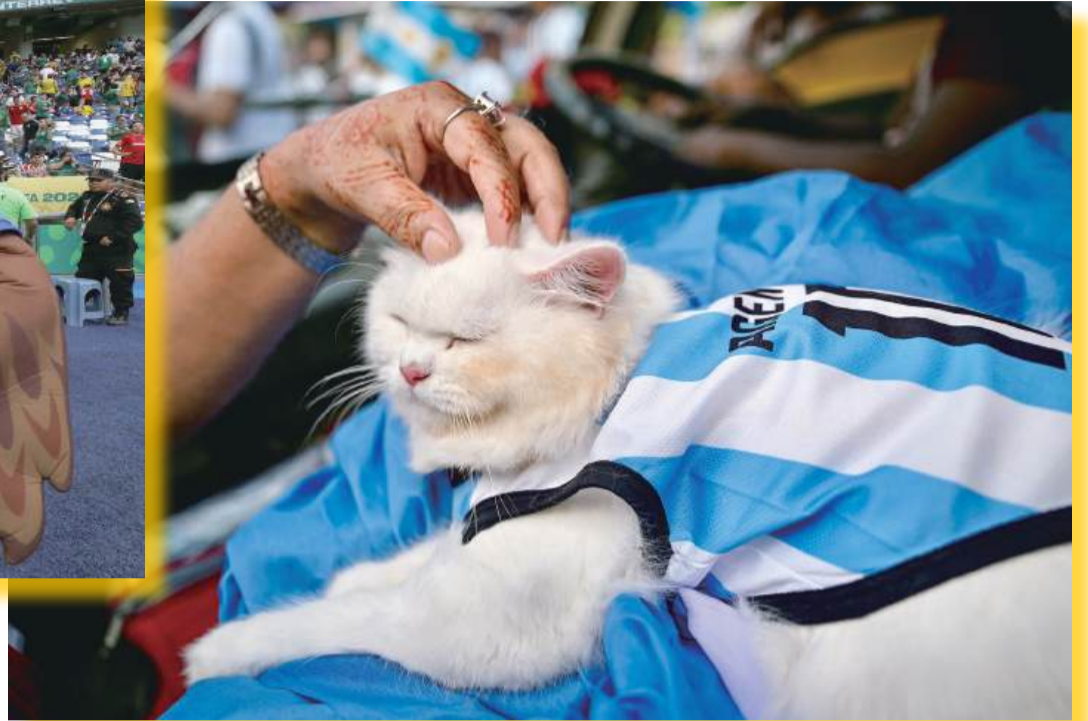
A Bangladesh fan carries a cat dressed in Argentina's jersey during a rally supporting Argentina in the ongoing 2026 FIFA World Cup in Dhaka yesterday.