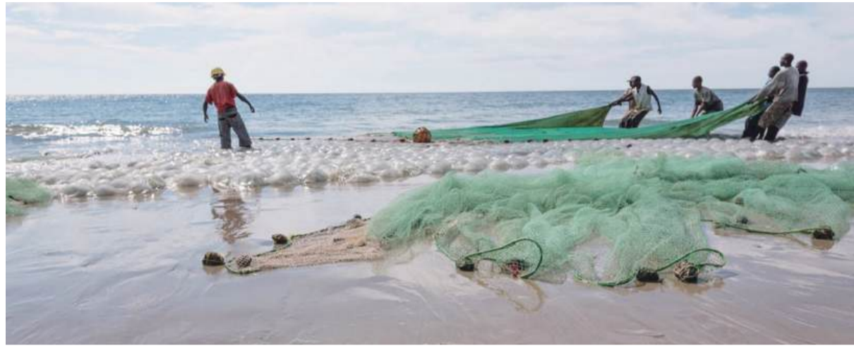
This undated and unlocated photo shows fishermen along Mozambique’s extensive coastline pulling in their day’s catch.

While fuel costs are slightly higher in other countries in the region, the sharp increase, coupled with erratic supply, has hit hard in