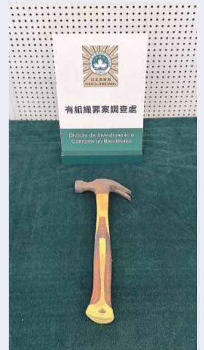
This undated handout photo provided by the Judiciary Police yesterday shows a hammer seized from a parallel-trading den run by the suspect's girlfriend.

den in the northern district, which was operating under the cover of a shop, Chao said, adding that the attack resulted in multiple bruises to the victim's neck, both arms, and back. The suspect then did not allow the victim to leave the shop, according to Chao.