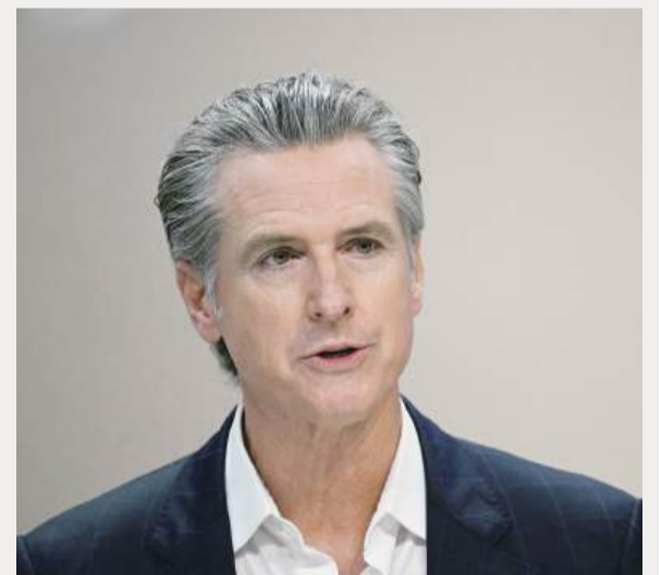
Governor of California Gavin Newsom attends a press conference during the COP30 UN Climate Change Conference in Belém, Pará State, northern Brazil, on November 11, 2025.

Former FBI director James Comey, an outspoken critic of Trump, was indicted in April for allegedly