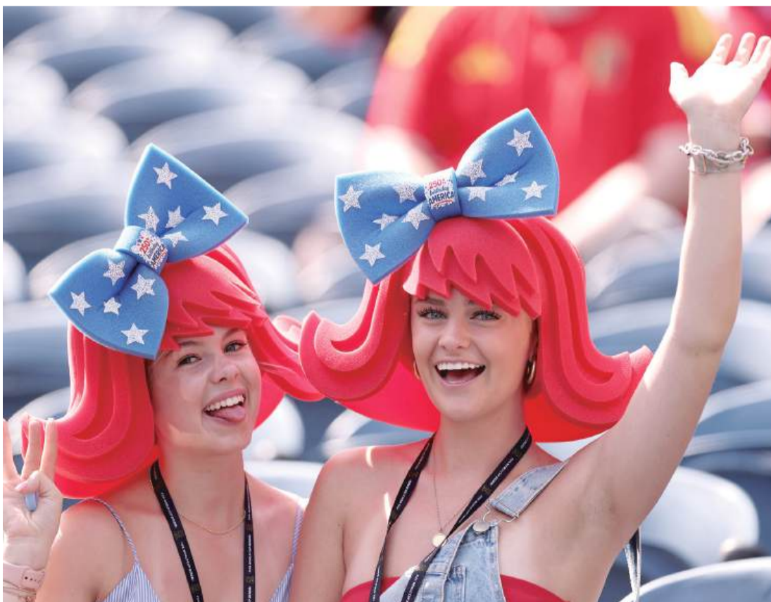
Fans arrive before the FIFA World Cup 2026 Group G match between Belgium and Egypt at Seattle Stadium on Monday in Seattle, Washington.