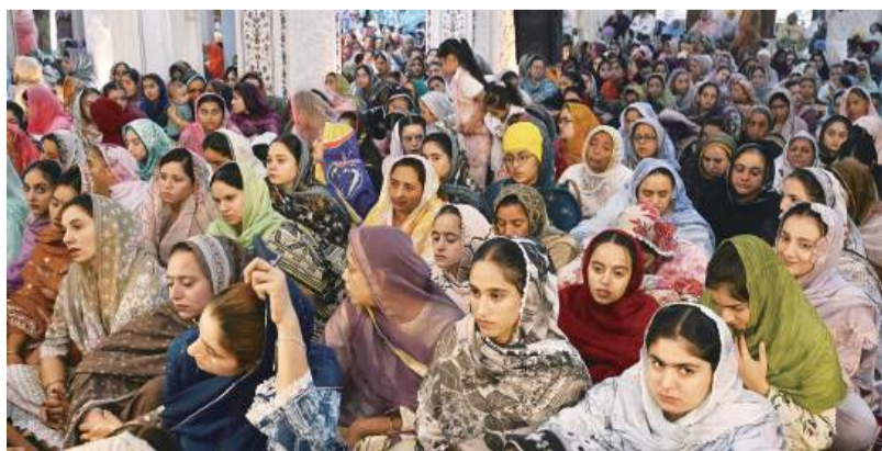
Sikh pilgrims take part in religious rituals to commemorate the martyrdom of Sikh Guru Arjan Dev, at the Gurdwara Dera Sahib in Lahore, Pakistan yesterday. – AFP

He added that the risk map will help pinpoint vulnerable communities and farmland, guide budget and manpower allocation, support farmers in adjusting planting calendars and crop choices, and inform urban planning to avoid building critical infrastructure in hazard-prone areas. – Xinhua