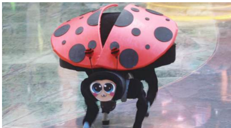
A robotic ladybird navigates through the crowd during yesterday's show at MGM COTAI.

* A hydrangea is a widely cultivated deciduous shrub native to Asia and the Americas. It is best known for its large, rounded clusters of showy flowers that typically bloom from mid-summer through autumn. – Gemini