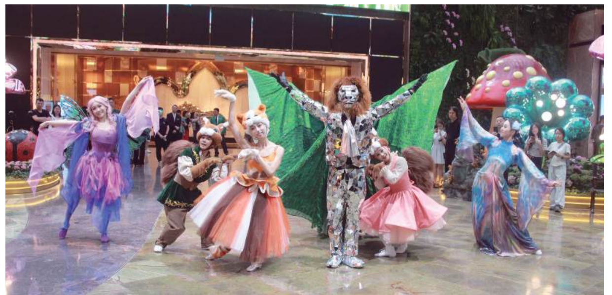
Performers pose during yesterday's “MGM Spectacle: Garden Wonderland” under the Spectacle canopy at MGM COTAI.