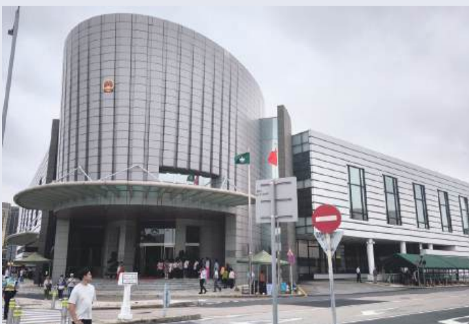
This file photo taken last month shows residents entering the Legislative Assembly (AL) building, when the legislature held its Open Day.