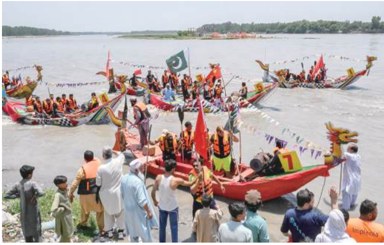
Pakistanis participate in the Chinese Dragon Boat Festival, organised under a cultural exchange between the two countries, in Pakistan's Charsadda on Sunday.