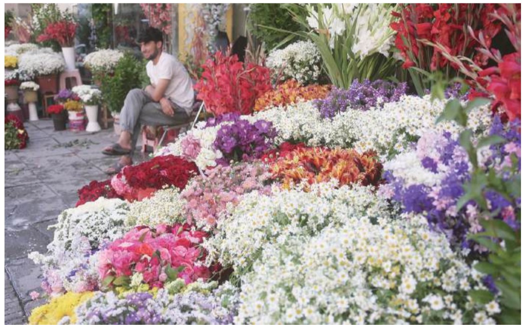
Fresh flowers are displayed at a flower market in Kabul, on Sunday. Deeply woven into Afghanistan's cultural heritage, flowers symbolize beauty, peace, and renewal. As hot weather arrives, booming flower markets and exhibitions reflect Afghans' enduring love for nature and greenery.