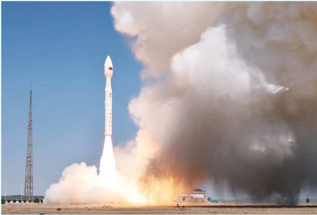
A Lijian-1 Y14 carrier rocket blasts off from a commercial space innovation pilot zone in Jiuquan City, Gansu Province, yesterday. The rocket blasted off at 11:44 a.m. from the zone and successfully sent eight satellites into the planned orbit.