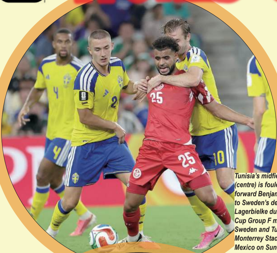
Tunisia's midfielder Anis Slimane (centre) is fouled by Sweden's forward Benjamin Nygren next to Sweden's defender Gustaf Lagerbielke during the 2026 World Cup Group F match between Sweden and Tunisia at the Monterrey Stadium in Guadalupe, Mexico on Sunday.