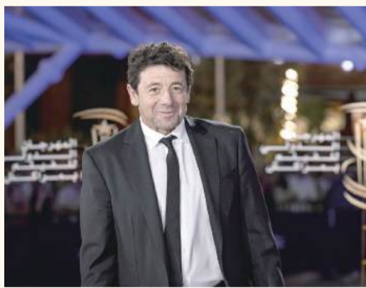
French singer and actor Patrick Bruel poses upon arrival for the opening ceremony of the 19th Marrakech International Film Festival in Marrakech on November 11, 2022.

Bruel is under judicial supervision, meaning he is not allowed to leave French territory.