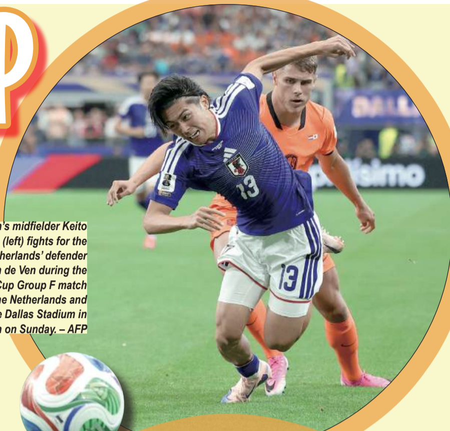
Japan's midfielder Keito Nakamura (left) fights for the ball with Netherlands' defender Micky Van de Ven during the 2026 World Cup Group F match between the Netherlands and Japan at the Dallas Stadium in Arlington on Sunday.