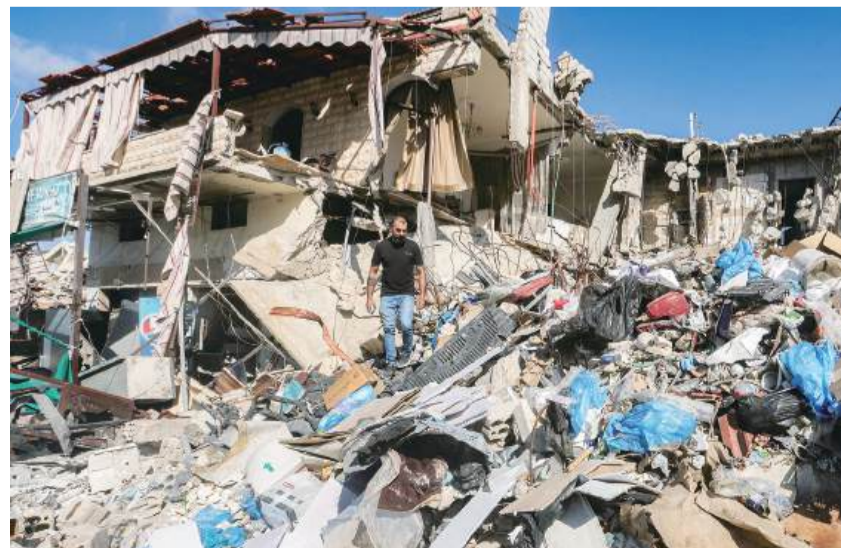
A man inspects his house destroyed by Israeli airstrikes, upon return to his home village of Tibnin in southern Lebanon yesterday.

In December, Israel became the first country to recognise the independence of Somaliland since it declared its autonomy from Somalia in 1991 following a civil war. – AFP