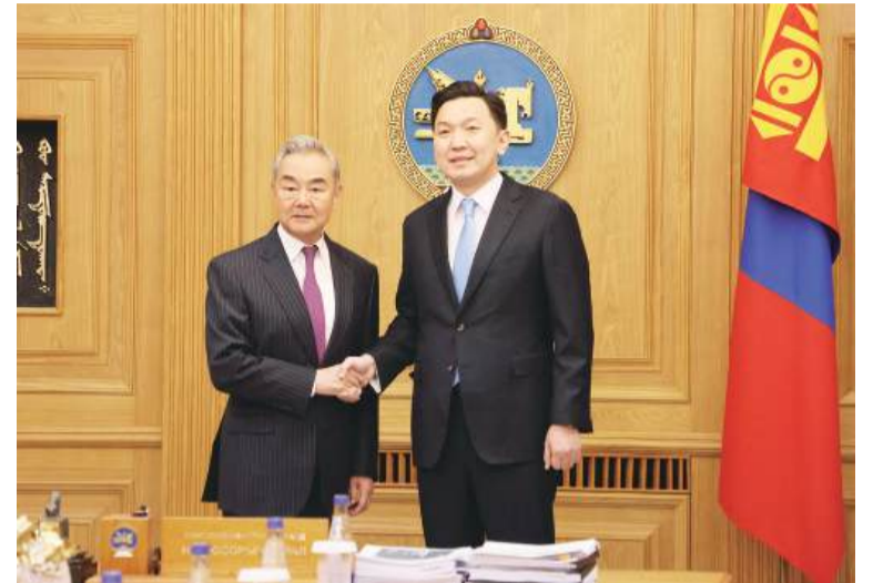
Mongolian Prime Minister Nyam-Osor Uchral (right) shakes hands with visiting Foreign Minister Wang Yi, also a member of the Political Bureau of the Communist Party of China (CPC) Central Committee, in Ulan Bator, Mongolia, yesterday.

The prime minister expressed Mongolia's willingness to work closely with China to effectively implement the important consensus reached by the two heads of state, maintain high-level exchanges, deepen political mutual trust, enhance connectivity, advance cooperation agreements and major projects, and promote the continued development of the Mongolia-China comprehensive strategic partnership.