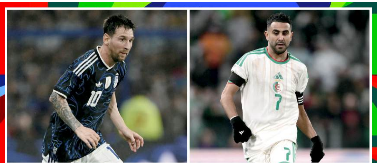
This combination of file photo created yesterday, shows Argentina's forward Lionel Messi in Buenos Aires on March 31 (left); and Algeria's forward Riyad Mahrez in Turin on March 31. (More photos on page 16) Argentina and Algeria will meet in a 2026 World Cup Group J match at the Kansas City Stadium in Kansas City today.