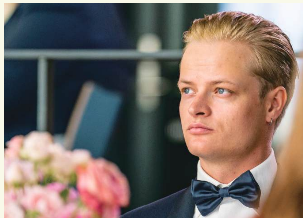
This unlocated file photo taken on June 16, 2022 in Oslo, Norway, shows Marius Borg Høiby, son of Norwegian Crown Princess Mette-Marit.

The scandal erupted on August 4, 2024, when police arrested Hoiby on suspicion of assaulting his then-girlfriend in her Oslo