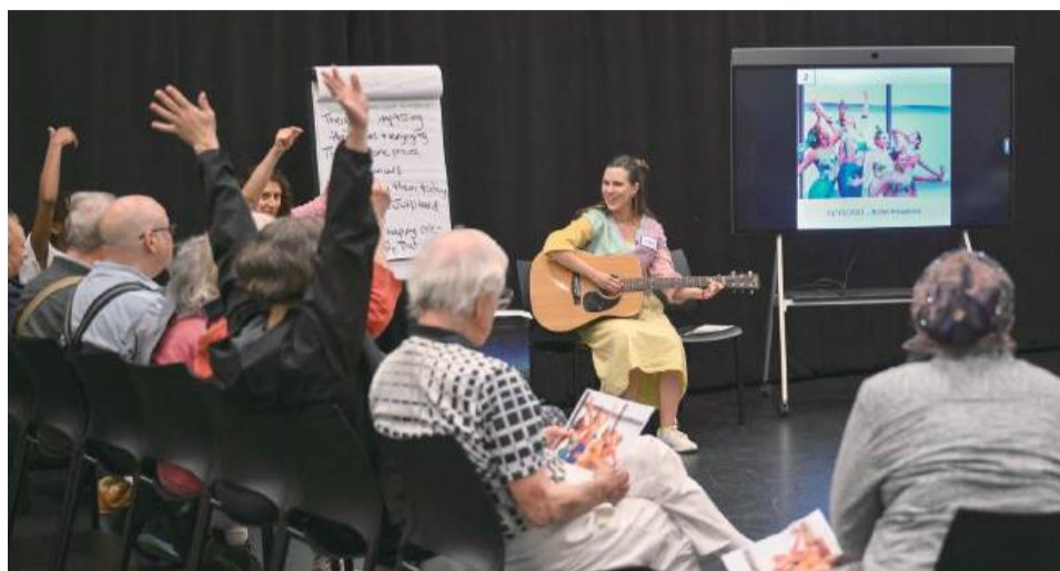
Attendees participate in "Lincoln Center Moments", a first-of-its-kind performance-based programme created specifically for people living with dementia and their caregivers at Lincoln Centre, in New York, on June 3.

According to the World Health Organisation (WHO), as of 2021 some 57 million people had dementia globally, with about 10 million new cases each year. The condition is progressive, and there is no cure.