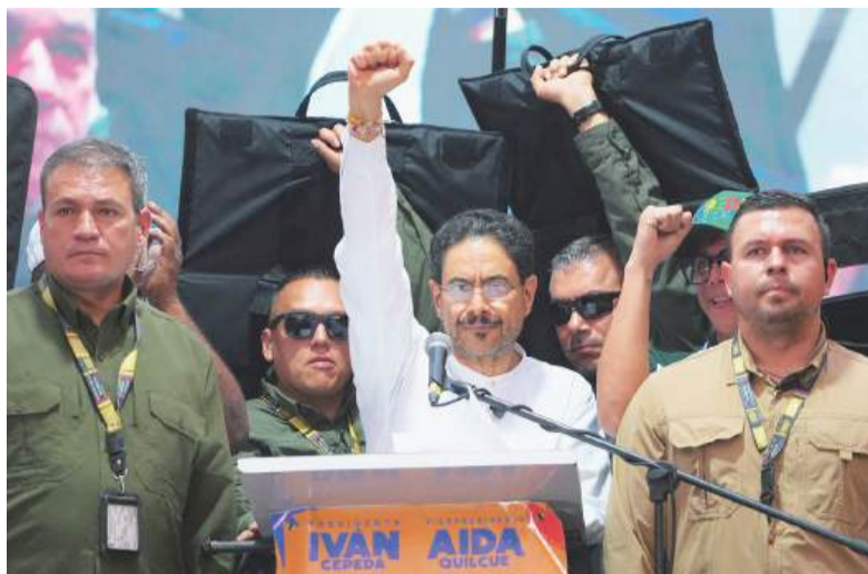
Colombia's leftist presidential candidate Iván Cepeda raises his clenched fist during his closing campaign rally in Barranquilla, Colombia, on Sunday.