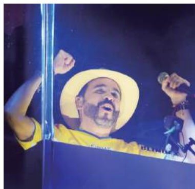
Colombia's rightwing presidential candidate Abelardo de la Espriella gestures as he speaks to supporters behind a bulletproof glass during his closing campaign rally in Buga, Valle del Cauca Department, Colombia on Sunday.