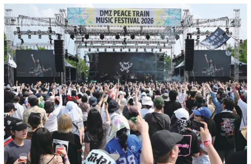
Revellers dance during a performance by South Korean indie rock band “Peace Truck Hijackers” at the DMZ Peace Train Festival in Cheorwon near the North Korean border on Sunday.

Opposition leader Kem Sokha, who had been sentenced to 27 years for treason, was pardoned last month, but his political rights including holding office and voting remain revoked.