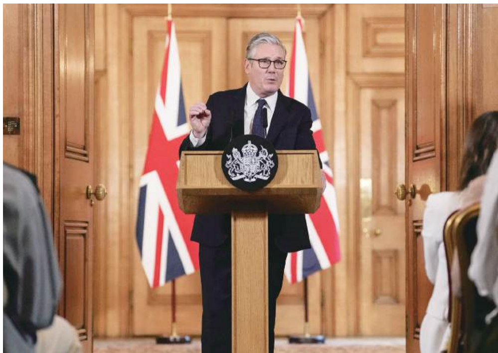
Britain's Prime Minister Keir Starmer gives a press conference at Downing Street in London yesterday, announcing a ban on social media for under-16s.

Australia’s Prime Minister Anthony Albanese welcomed the move in a post on X, saying: “Social media giants operate