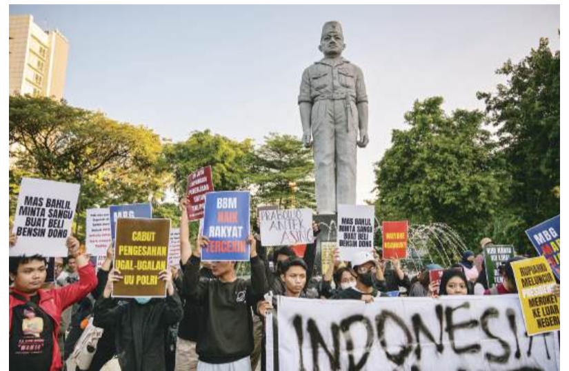
Students protest against a rise in non-subsidised fuel prices and call on the authorities to halt the free school meals programme (MBG), in Surabaya, Indonesia yesterday. – AFP

The inspection uncovered 17 sacks containing Category 1 narcotics. Although the perpetrators escaped across the border, law enforcement secured the contraband and collected forensic evidence. The seized narcotics were transferred to investigators at the local police station for further legal action. – Xinhua