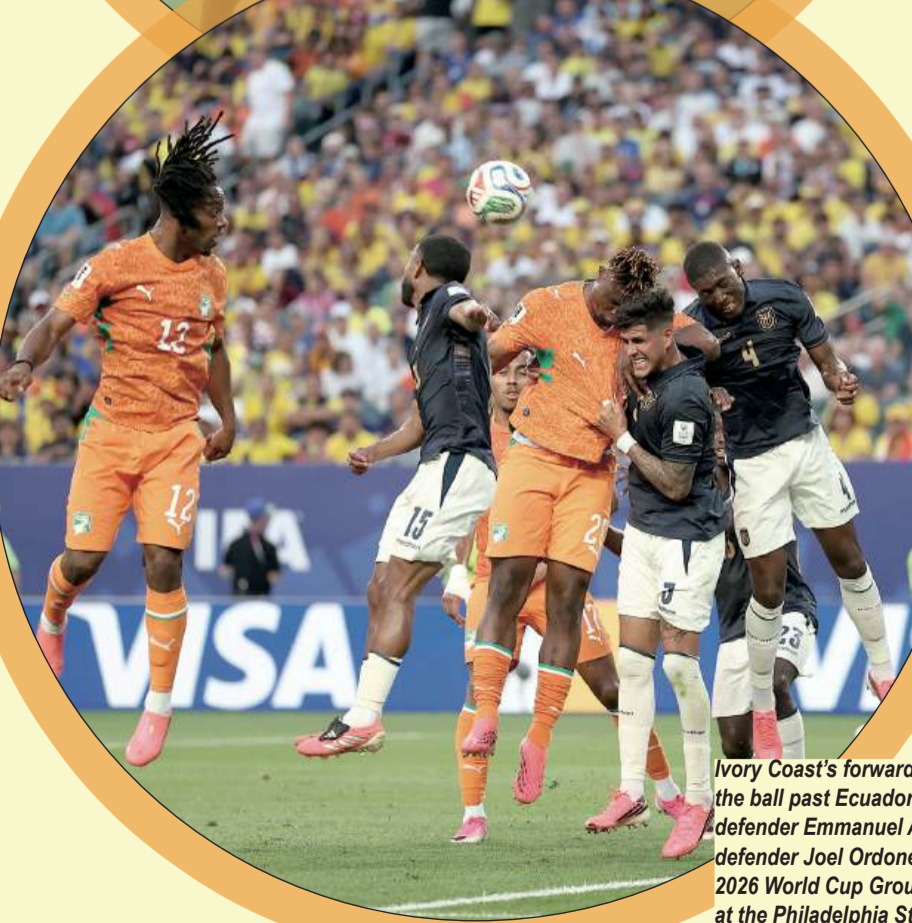
Ivory Coast's forward Elye Wahi (from left to right) heads the ball past Ecuador's midfielder Pedro Vite, Ivory Coast's defender Emmanuel Agbadou, Ecuador's defender Piero Hincapie, defender Joel Ordonez, and forward Enner Valencia during the 2026 World Cup Group E match between Ivory Coast and Ecuador at the Philadelphia Stadium in Philadelphia on Sunday.