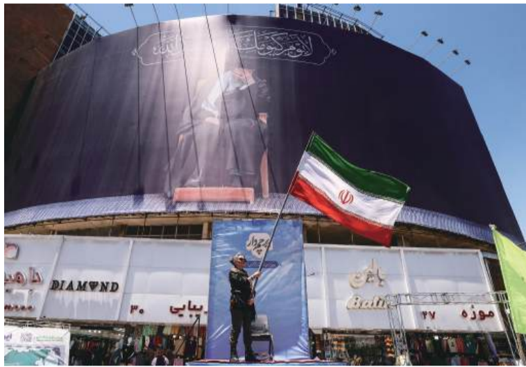
An Iranian woman waves a national flag next to a billboard depicting slain supreme leader Ayatollah Ali Khamenei at Valiasr Square in Tehran yesterday.

"Once finalised, I undertake to explain the details to the public," he said on Friday.