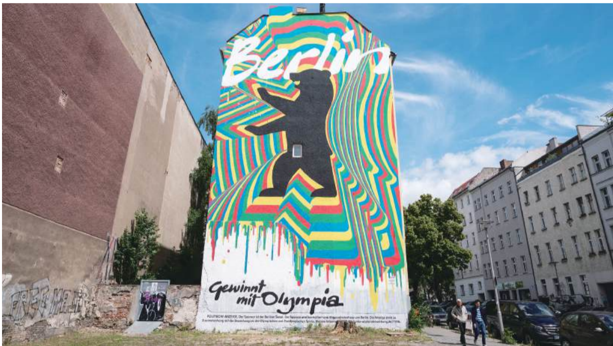
A mural, part of the city of Berlin's campaign to host the Olympic Games in 2036, 2040, or 2044, reads: "Berlin wins with Olympia", in Berlin yesterday.