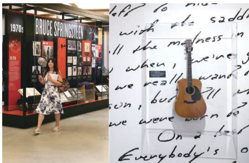
A woman walks past a display during a press preview of the “Bruce Springsteen Centre for American Music” on the campus of Monmouth University in West Long Branch, New Jersey last Tuesday. Springsteen, a winner of 20 Grammys and leading voice of opposition to US President Donald Trump, is the focus of their newly opened museum of US music in his native New Jersey.