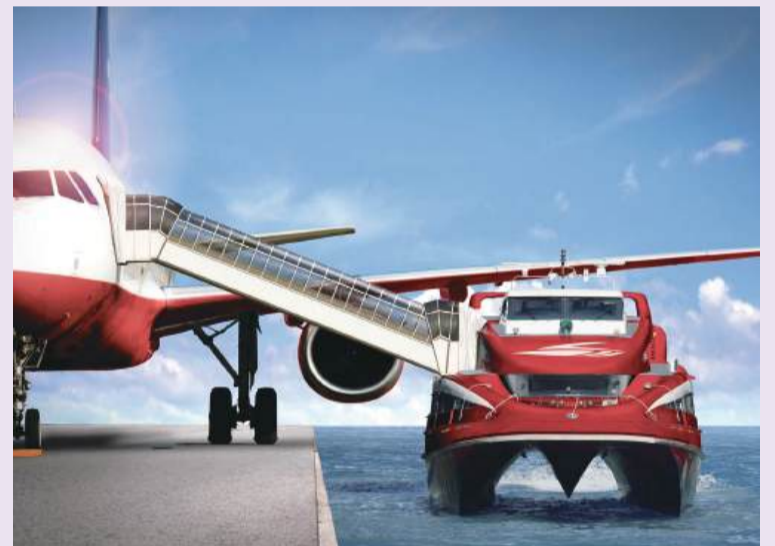
This artist's rendition provided by TurboJET yesterday promotes its Macau-Shenzhen airport ferry service, relocated from Macau Out Harbour Ferry Terminal and Pac On Ferry Terminal.

On Fridays, Saturdays, Sundays and public holidays, an additional ferry from Shenzhen airport to Taipa departs at 8:30 a.m., and from Taipa Ferry Terminal to Shenzhen airport at 10:00 a.m. ■