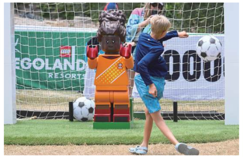
A guest kicks a football towards a LEGO minifigure goalie at The Kickoff during the FIFA World Cup 2026 Experience for fans at LEGOLAND California in Carlsbad, California on Saturday.