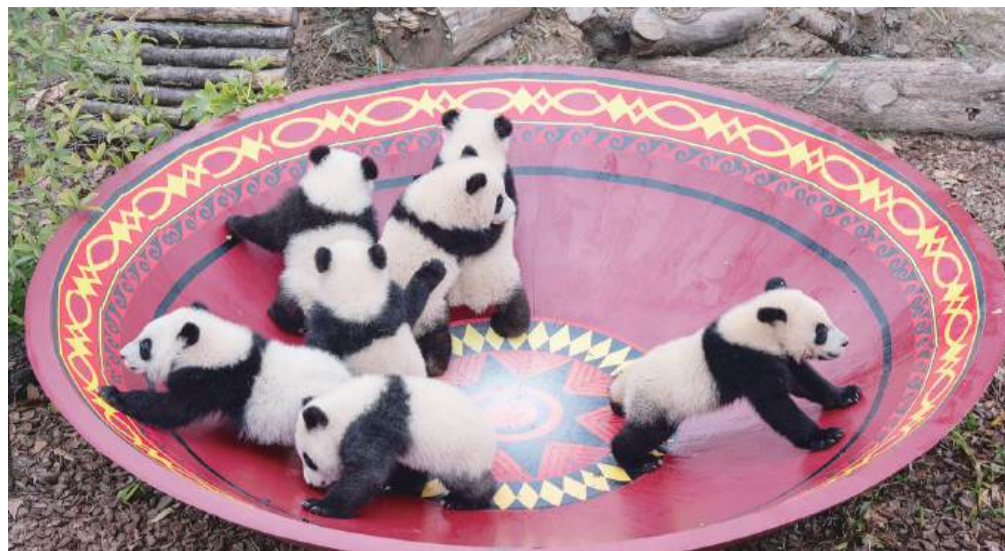
Giant panda cubs are pictured during a group appearance event in celebration of the Spring Festival (Chinese Lunar New Year) at the Chengdu Research Base of Giant Panda Breeding in Chengdu, capital of Sichuan Province, on February 4.

Since the Giant Panda National Park was established, about 72 percent of wild giant pandas have been placed under strict protection. The protected panda habitat area has increased from 1.39 million hectares to 2.58 million hectares. The park has integrated 73 nature reserves across the three provinces, connecting the habitats of 13 local panda