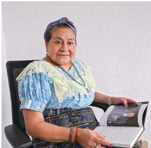
Guatemalan Nobel Peace Prize laureate Rigoberta Menchu poses after an interview with AFP at the offices of her foundation in Guatemala City on Thursday. The term “narco-terrorist” has been weaponised just as the word “communist” was in the past, Guatemalan Nobel Peace Prize laureate Rigoberta Menchu told AFP in the interview.

Menchu slammed the US-Israeli offensive on Iran, which has ravaged the Middle East since its launch in February.