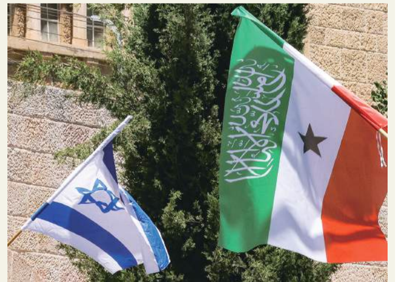
Flags of Somaliland and Israel fly alongside on a street in western Jerusalem yesterday.