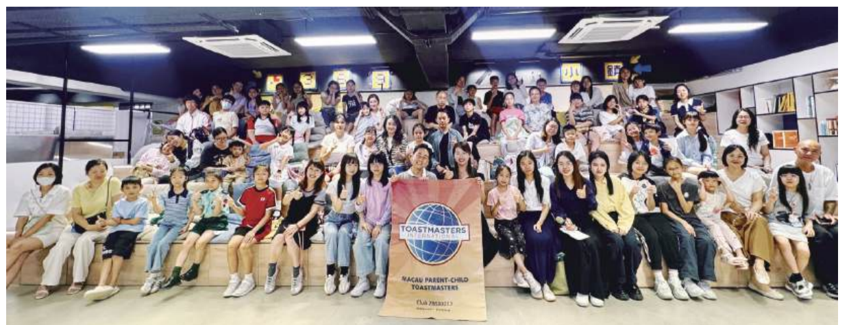
This handout group photo provided by the Macau Parent-Child Toastmasters Club yesterday shows participants posing during their training activity in the runup to next month's Chinese Children's Film Dubbing Contest held at the headquarters of the 369 Cooperation Town Entrepreneurial Youth Association on Avenida do Almirante Lacerda.