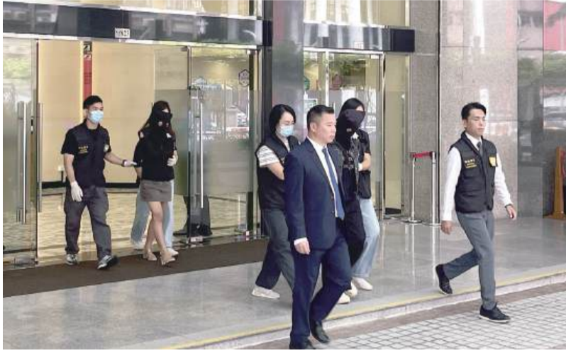
Judiciary Police (PJ) officers escort the two hooded drug suspects from Vietnam to a PJ van outside the PJ headquarters in Zape on Friday. - Photos: Armando Neves

*"Happy powder" is an illicit, fruit-flavoured powdered mix containing an unpredictable cocktail of MDMA, methamphetamine, ketamine, and benzodiazepines designed to be dissolved in drinks. - Gemini