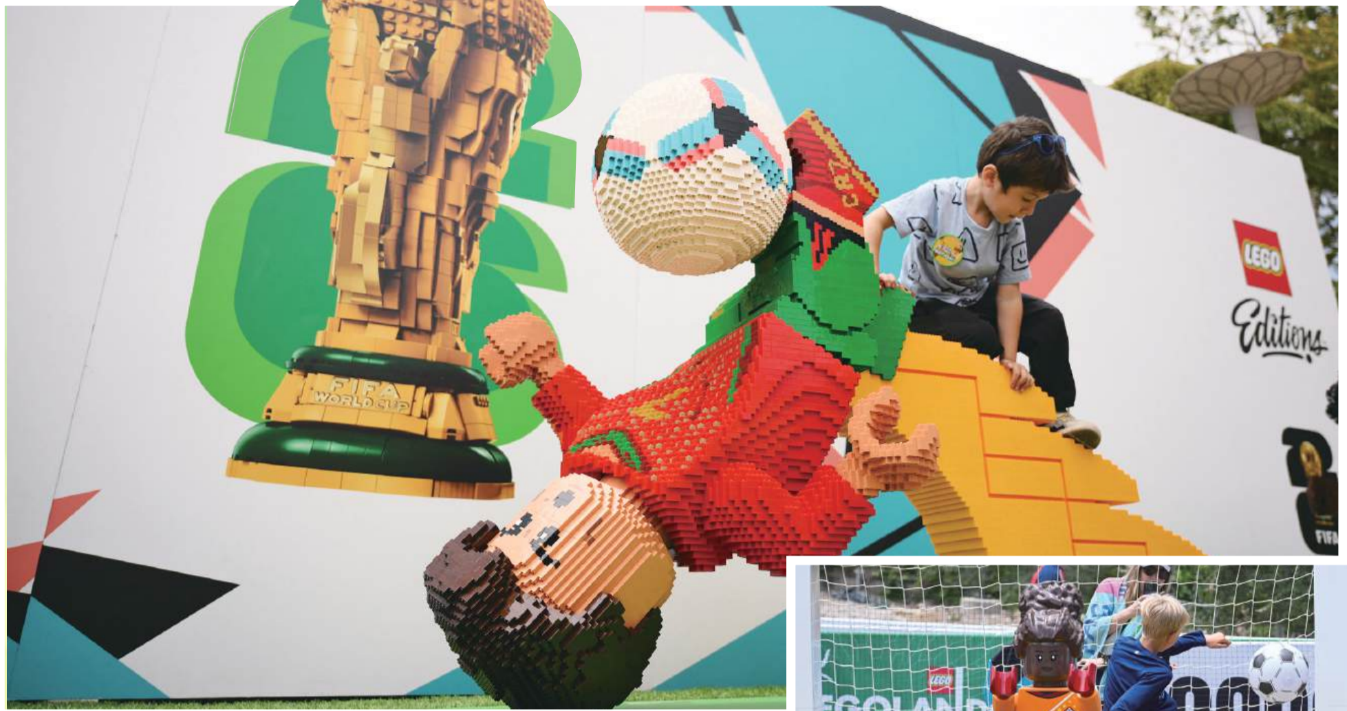
A child climbs on a LEGO figure of Portugal's forward Cristiano Ronaldo, made of over 30,000 bricks, displayed during the FIFA World Cup 2026 Experience for fans at LEGOLAND California in Carlsbad, California on Saturday.