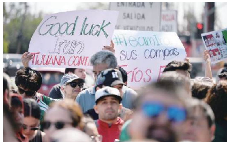
Iran fans wait for the team to leave for US at the Marriott Hotel in Tijuana, Mexico, yesterday, on the eve of their 2026 World Cup Group G match against New Zealand.

The game will be played at 12:00 a.m. tomorrow Macau time.