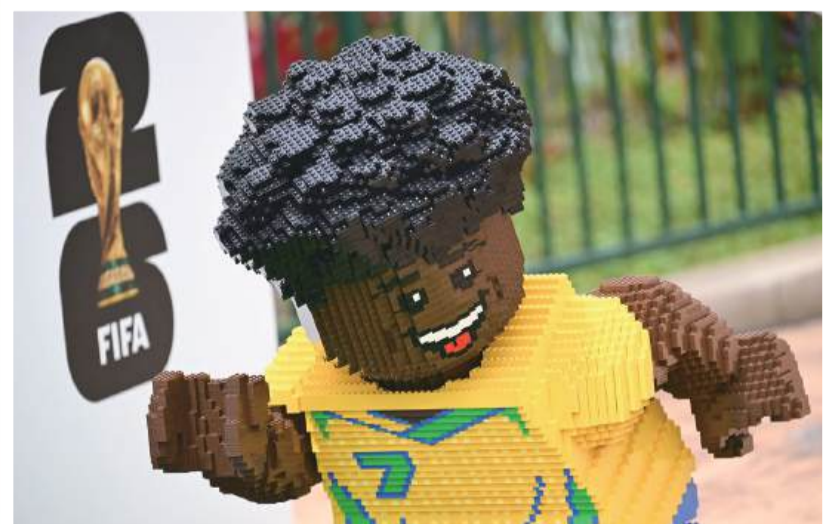
A LEGO figure of Brazil's forward Vinicius Junior, made of over 18,000 bricks, is displayed during the FIFA World Cup 2026 Experience for fans at LEGOLAND California in Carlsbad, California on Saturday.