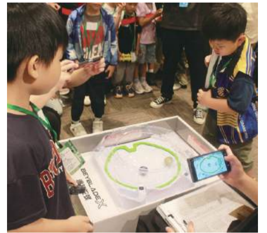
Contestants compete with their Beyblades during Saturday's "OFFLINE X Beyblade: Hong Kong-Macau Interport Competition" at New Yaohan in Nam Van.

*The name Beyblade is a linguistic blend (a portmanteau) that combines elements from both English and Japanese, reflecting the toy's mechanics and cultural heritage. The first part of the name comes from "beigoma",