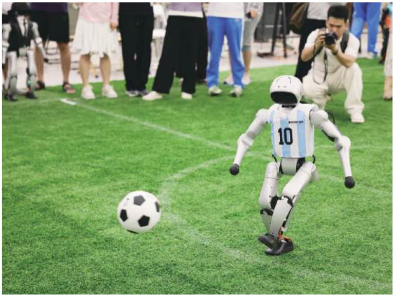
A robot plays football at an embodied intelligence innovation industrial park in Zhongguancun, Haidian District of Beijing, on Saturday. The embodied intelligence innovation industrial park is home to a number of brilliant players in this arena. Thanks to the "high density" of residing companies here, it is very easy for the players to find partners along the industrial chain – literally by stepping up and down the stairways in the office building.

Macau's most popular English-language newspaper – Your trustworthy source of news & views