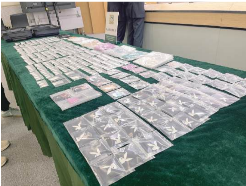
Evidence seized from the duo's home in the city centre is displayed at the PJ headquarters in Zape on Friday.