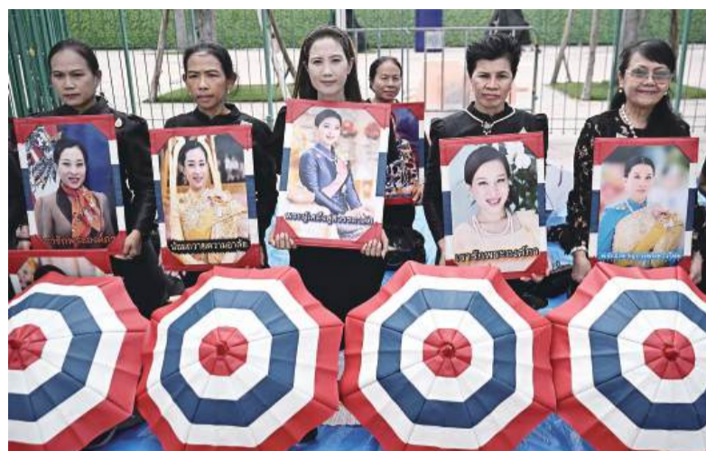
Mourners hold portraits of late Thai Princess Bajrakitiyabha Mahidol outside the Grand Palace in Bangkok on Saturday.

Thailand’s public broadcaster Thai PBS reported that the princess’s