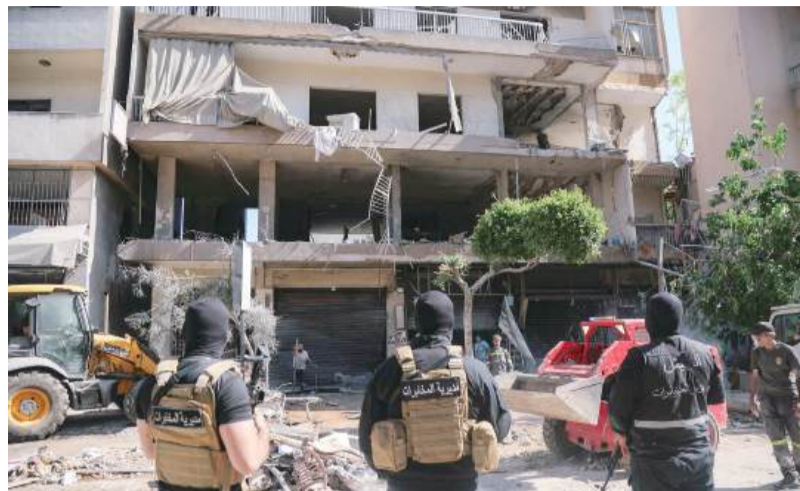
Lebanese army soldiers stand guard as residents clear the rubble at the site of an Israeli airstrike that targeted a building in Beirut's southern suburbs yesterday.

Israel's military had struck Beirut's southern suburbs last week after saying it had intercepted rockets launched by Hezbollah into Israeli territory.