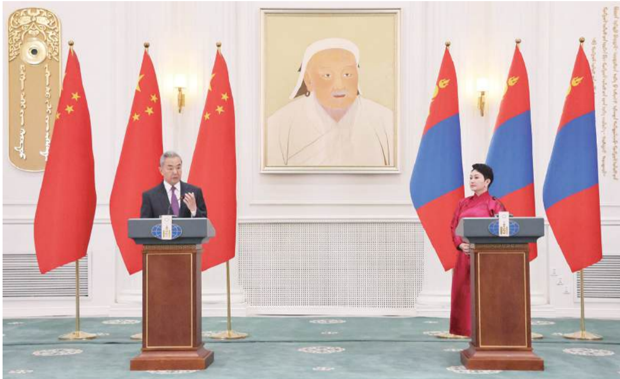
Foreign Minister Wang Yi (left), also a member of the Political Bureau of the Communist Party of China (CPC) Central Committee, and Mongolian Foreign Minister Batmunkh Battsetseg meet the press in Ulan Bator, Mongolia, on Saturday.

Mongolia reiterated its firm adherence to the one-China principle, its opposition to "Taiwan