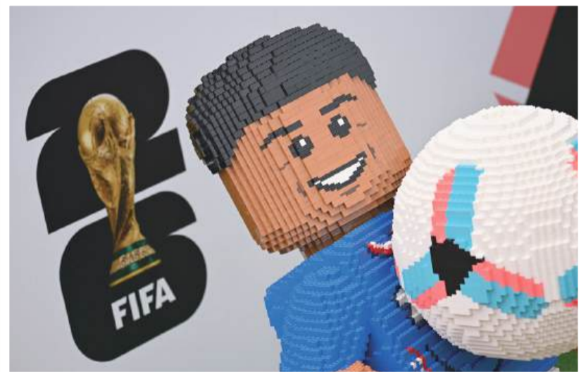
A LEGO figure of France's forward Kylian Mbappe, made of over 17,000 bricks, is displayed during the FIFA World Cup 2026 Experience for fans at LEGOLAND California in Carlsbad, California on Saturday.