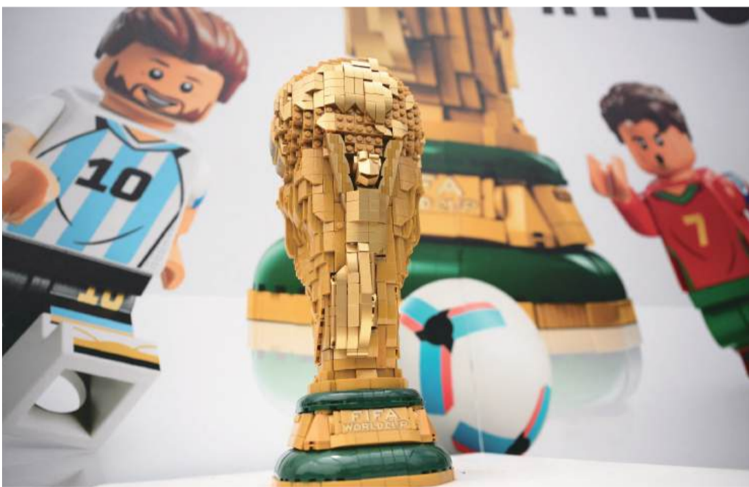
A FIFA World Cup trophy made of LEGO bricks is displayed during the FIFA World Cup 2026 Experience for fans at LEGOLAND California in Carlsbad, California on Saturday.