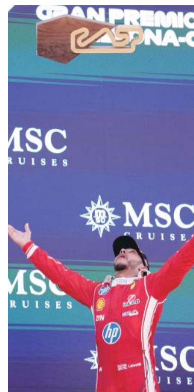
Winner Ferrari's British driver Lewis Hamilton celebrates on the podium after the Catalonia Formula One Grand Prix at the Circuit de Catalunya in Montmeló, on the outskirts of Barcelona, yesterday.