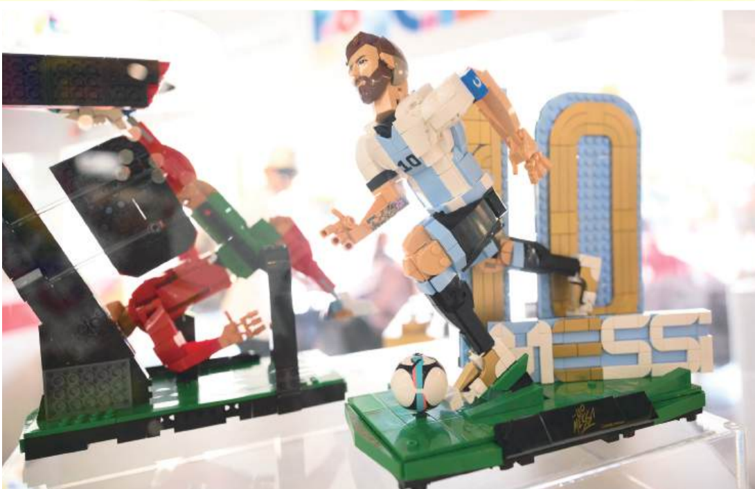
LEGO Editions set of Argentina's forward Lionel Messi is displayed in a store during the FIFA World Cup 2026 Experience for fans at LEGOLAND California in Carlsbad, California on Saturday.