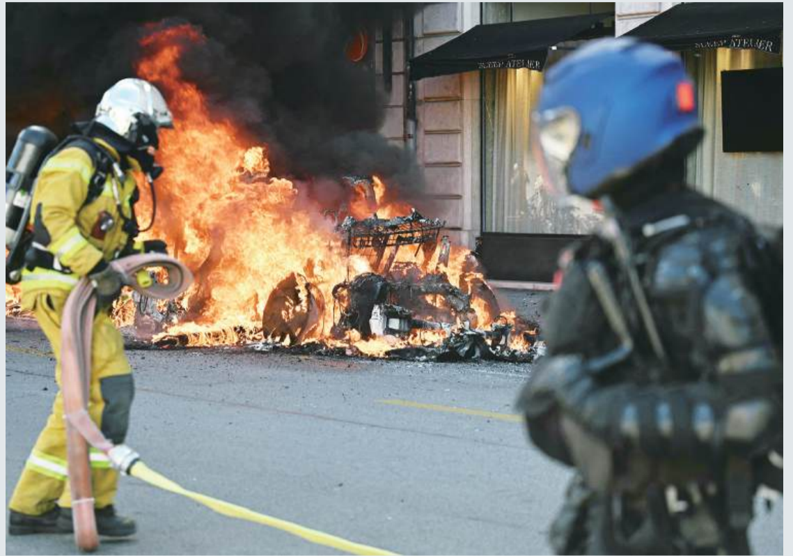
A firefighter direct a hose at a Tesla car set alight during a protest rally of a "No-G7" coalition of over 60 associations, unions and left-wing groups "against fascism and imperialism", a day ahead of the summit's start, in Geneva, Switzerland, yesterday. The 2026 edition of the G7 summit is set to take place between Monday and Wednesday in the French town of Evian-les-Bains near Switzerland.