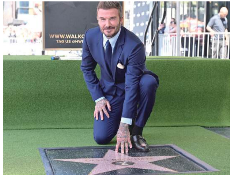
David Beckham poses at his newly unveiled Hollywood Walk of Fame star in Hollywood, California, on Friday.

Beckham also ventured into the entertainment industry, founding the content production company Studio 99 in 2019.