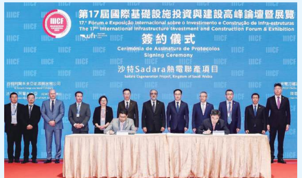
This undated handout photo provided by the Commerce and Investment Promotion Institute (IPIM) on Friday shows a signing ceremony for the Sadara Cogeneration Project in Saudi Arabia, at The Venetian Macao's Cotai Expo.

demonstrating the diverse economic spillover effects of international professional exhibitions on the city's economy, the statement noted. ■