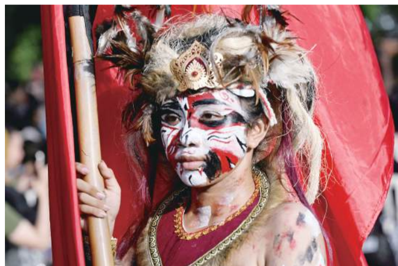
Balinese people take part in a parade during the Bali Art Festival in Denpasar, Indonesia resort island of Bali island on Saturday.