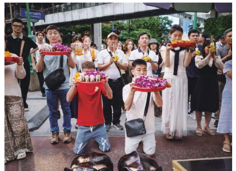
Visitors pray at the Erawan Shrine in Bangkok on Tuesday. – AFP

The lawmakers' proposal did not address the possibility of a woman emperor, an idea that has wide public support. – AFP