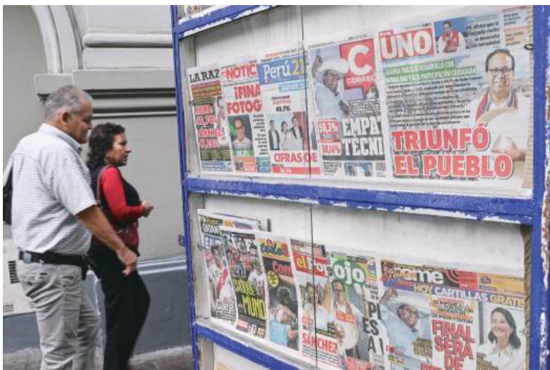
Pedestrians walk past newspaper front pages displayed at a newsstand in the Peruvian capital Lima on Monday, the day after the runoff election.

But she now hopes to ride a wave of support for right-wing candidates who have won recent elections in Bolivia, Chile and Ecuador with a tough-on-crime message.