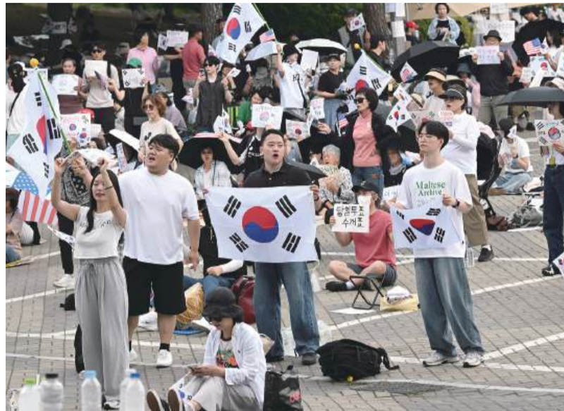
South Korean protesters wave national flags outside a vote-counting centre in Seoul yesterday, to call for a rerun of the local elections due to a shortage of ballot papers. – AFP

Student unions at 18 universities held new demonstrations from 6 pm yesterday.