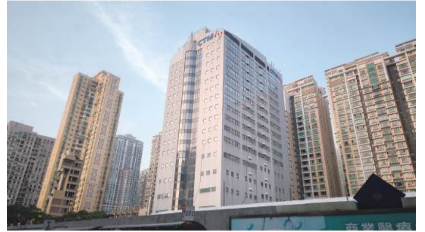
This file photo taken in 2024 shows the CTM headquarters in central Taipa.

Furthermore, the statement said, CEM has launched a solar electricity project to install a floating photovoltaic (FPV) system