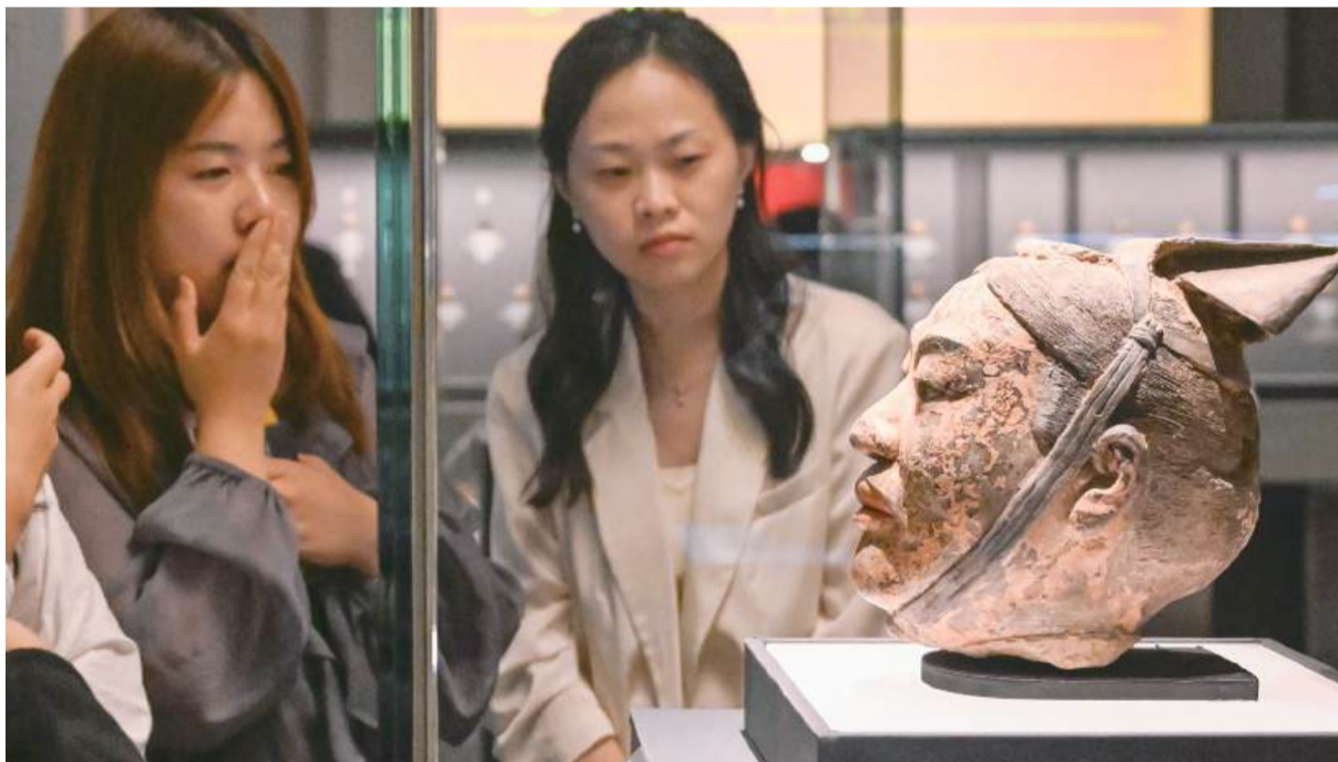
Media workers look at an exhibit during a press preview of the exhibition "Dawn of The First Empire: The Qin's Unification in Archaeological Treasures" at the Shanghai Museum in Shanghai on Tuesday. The exhibition will be open to the public from yesterday to September 7, displaying 328 sets (510 pieces) of cultural relics from 14 archaeological and cultural heritage institutions from northwest China's Gansu and Shaanxi provinces and Shanghai.

Her sentiment is shared by many Chinese after witnessing the country's transformation from poverty to prosperity. Improving people's well-being has been at the