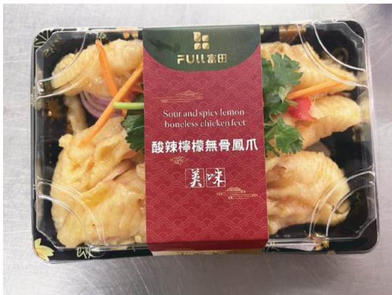
This undated handout photo provided by the Macau Municipal Affairs Bureau (IAM) yesterday show a boneless chicken feet product found to contain Listeria.

According to Hong Kong's Centre for Health Protection (CHP), Listeria is commonly found in the natural environment. The bacteria may be found in some contaminated raw foods, such as