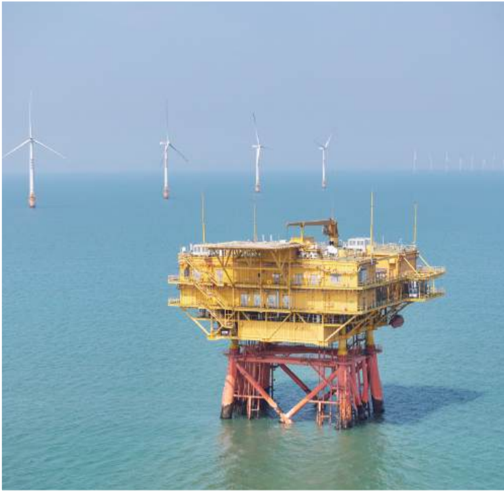
This aerial drone photo taken yesterday shows a step-up substation and surrounding wind turbines at an offshore wind farm in Rudong, Jiangsu Province. Recently, staff members have carried out maintenance of offshore wind turbines and step-up substations at two offshore wind farms, so as to ensure a stable and safe power supply during the incoming high temperature period. From January to May this year, the total power generation capacity of the two wind farms reached 880 million kWh, with an accumulated power output of 10.26 billion kWh since their operation in December 2021.