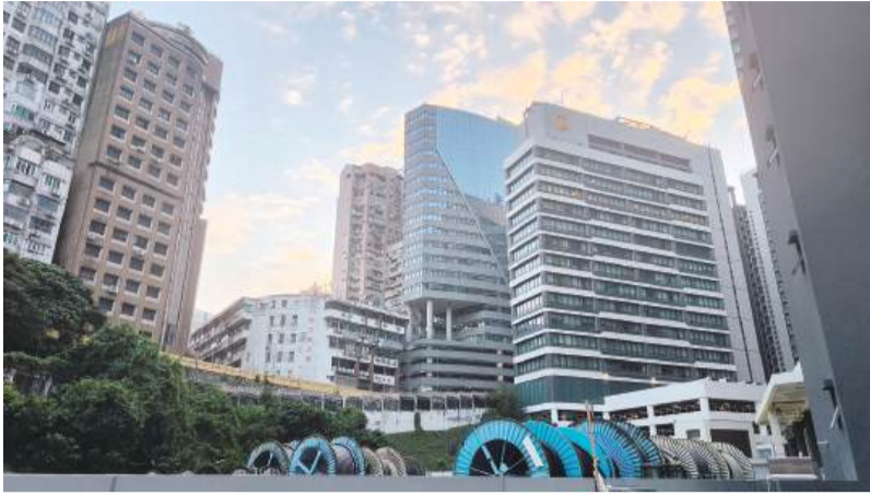
This file photo taken in 2024 shows the CEM headquarters (right) in northern peninsula.

CEM 66kV substations across the city will gradually be upgraded to 110kV ones. The first upgrade project, the statement said, has been