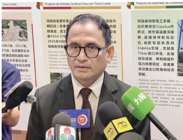
Timor-Leste Petroleum and Mineral Resources Minister Francisco da Costa Monteiro (left) and Guyana Public Works Minister Juan Anthony Edghill speak to reporters at the 17 th International Infrastructure Investment and Construction Forum & Exhibition (IICF) at The Venetian Macao’s Cotai Expo yesterday.

He added that the Timor-Leste government is advancing major projects under its Strategic Development Plan for the South Coast, including a supply base in Suai