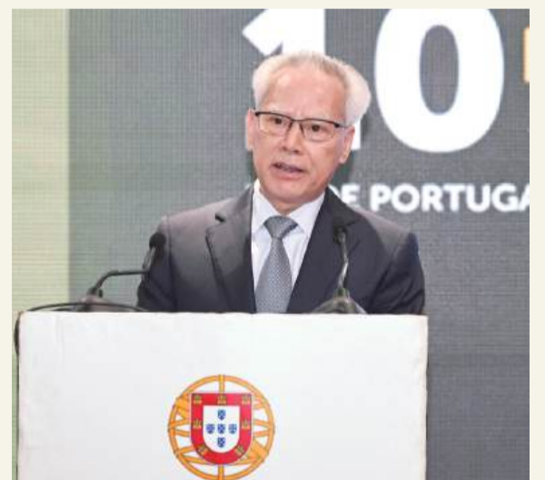
Macau SAR Chief Executive Sam Hou Fai addresses Portugal’s National Day reception at the Macau Portuguese School yesterday afternoon.

According to local statisticians, the Portuguese and Macanese communities are estimated to account for about 2.0 percent of Macau’s population. ■