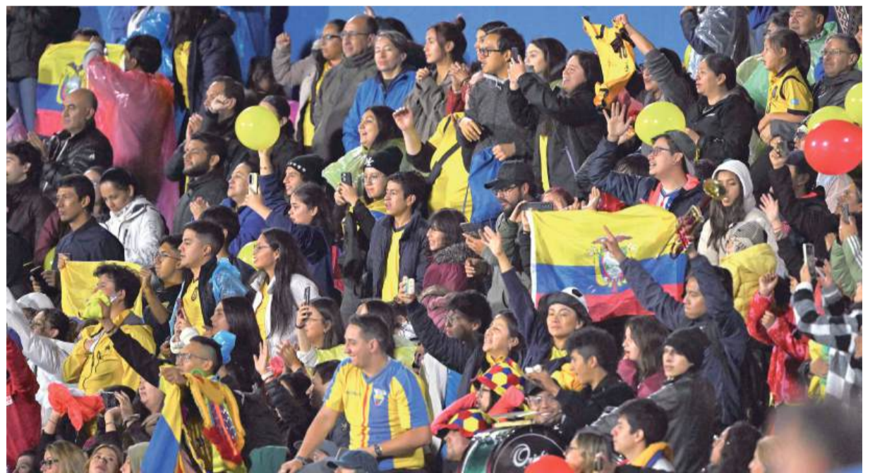
Fans of Ecuador celebrate qualification for the intercontinental playoffs for the 2027 FIFA Women's World Cup at the end of the CONMEBOL Nations League Women against Argentina at the Olimpico Atahualpa stadium in Quito, Ecuador on Tuesday.

Somalia is one of several countries on a travel ban list introduced by President Donald Trump's administration as part of a broader immigration crackdown.