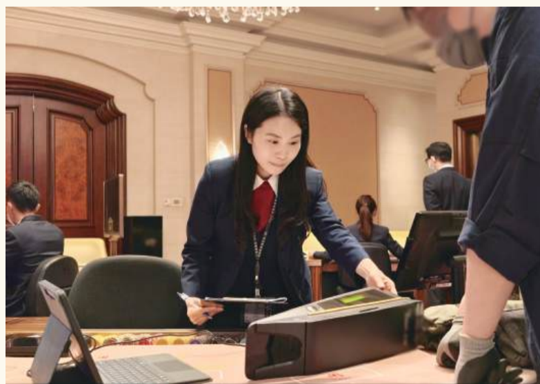
This undated handout photo provided by the Gaming Inspection and Coordination Bureau (DICJ) to public broadcaster TDM earlier this month shows a DICJ inspector examining an electronic card shoe at a local casino.

Concerning claims spread online by individuals who asserted they were "cheated by the black box but successfully recovered their stakes through unofficial channels", the statement underlined that such remarks possess absolutely no factual basis. This type of misinformation, the statement said, is highly likely