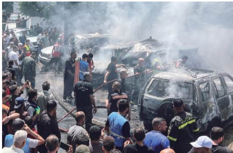
First responders and residents gather at the site of an Israeli airstrike that hit a car in the southern Lebanese city of Sidon yesterday.

The Apache was the second crewed aircraft that Washington has confirmed to have been shot down by Iran during