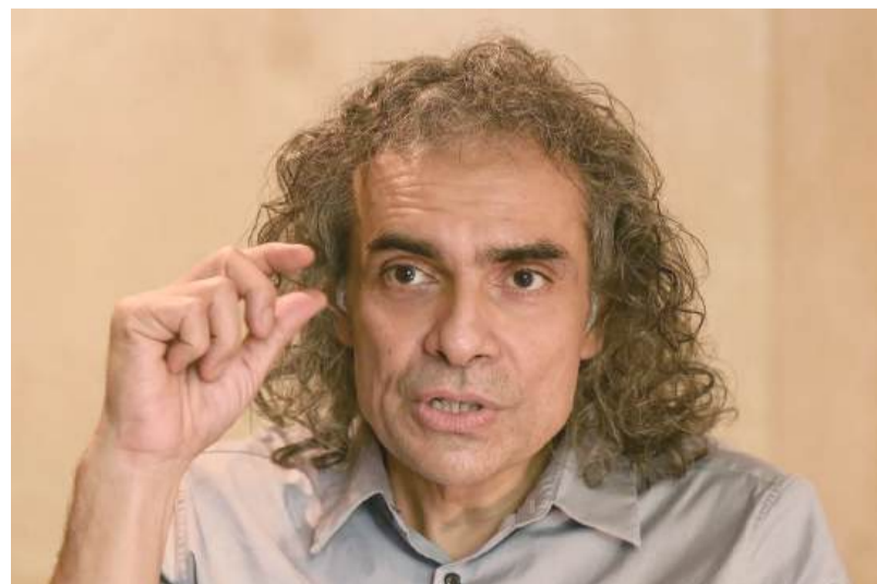
Bollywood filmmaker Imtiaz Ali speaks about his upcoming film ‘Main Vaapas Aaunga’ during an interview with AFP in Mumbai late last month. – AFP

“It is very difficult for the younger generation to find that kind of love. They are yearning for it, they seek it in films.” – AFP