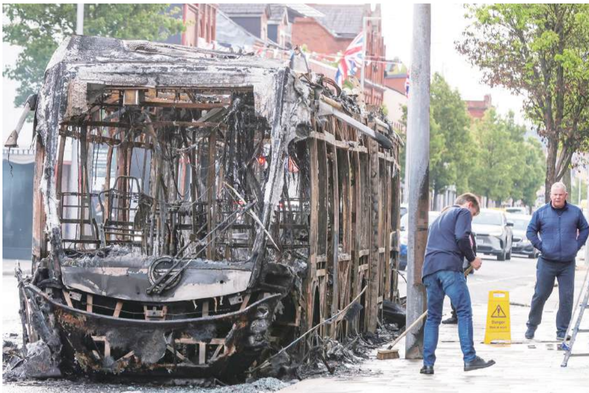
A man sweeps the street next to a burnt-out city bus after anti-immigrant demonstrations turned violent the night before, burning vehicles and homes, in eastern Belfast, Northern Ireland, yesterday.

Butcher said police had to take a baby as young as two months