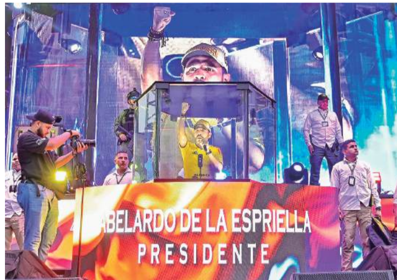
Colombia's presidential candidate Abelardo de la Espriella of the rightwing Defensores de la Patria ("Defenders of the Fatherland") movement gestures as he speaks to supporters behind bulletproof glass during a campaign rally in Cartagena on Tuesday. Colombia will hold the runoff presidential election on June 21.