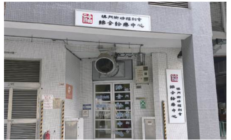
This undated handout photo provided by the Health Bureau (SSM) yesterday shows Macau's first community clinic, at the UGAMM (Kai Fong) integrated treatment centre in Edificio do Bairro da Ilha Verde (青洲坊) in the northern district.

Based on clinical assessment, the clinic's physicians prescribe medications uniformly provided by the Health Bureau. All consultation and prescription records will be