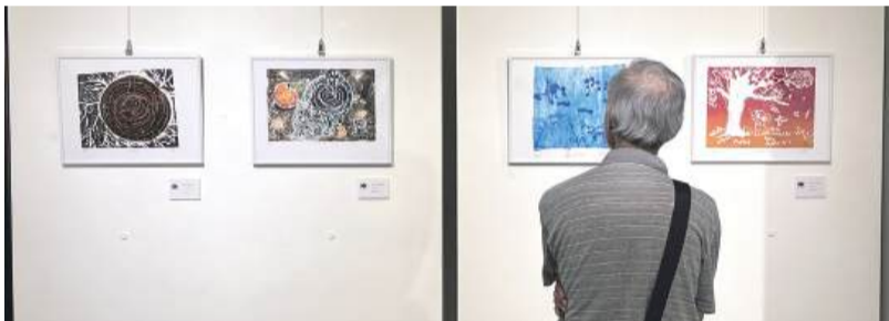
A gallerygoer examines one of the works on display at the Rui Cunha Foundation (FRC) gallery for the recently-concluded “The 7 th Macau Primary and Secondary School Students’ Printmaking Yearly Exhibition”.

*Intaglio is a printmaking technique where an image is carved or etched below the surface of a metal plate. Ink is worked into these recessed grooves and the surface is wiped clean, before a high-pressure press forces damp paper into the lines to absorb the ink. – Gemini