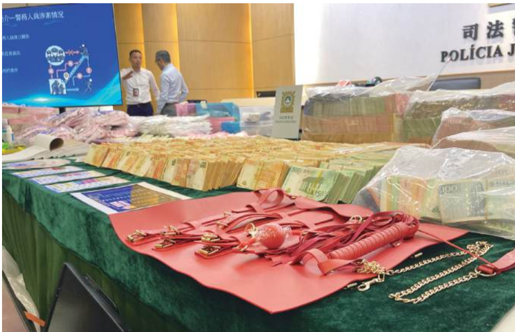
Evidence, including a set of S&M (sadism and masochism) props about the case seized by Judiciary Police (PJ) officers on Thursday, is displayed at PJ headquarters in Zape, during Friday's press conference.