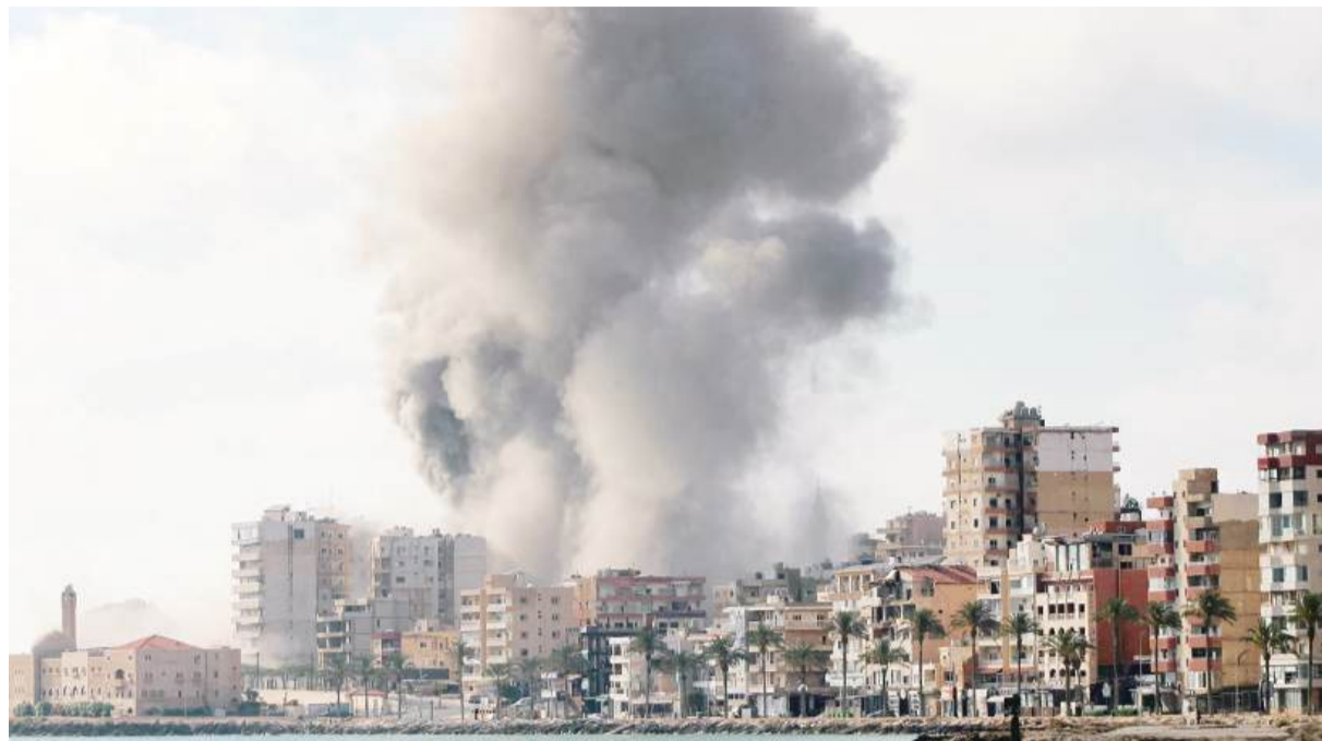
Smoke rises from the site of an Israeli airstrike that targeted a neighbourhood in the southern Lebanese coastal city of Tyre yesterday.

But Hezbollah rejected the agreement, demanding a full Israeli