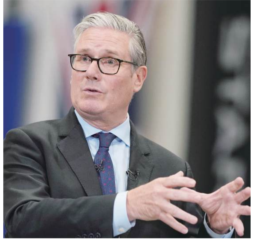
Britain’s Prime Minister Keir Starmer delivers a speech as he visits defence contractor STARK in Swindon, southwest England, on Friday.

Labour veteran Burnham is standing to become an MP again in a June 18 vote in Makerfield in northwestern England. If elected, he would be able to take part in a leadership contest.