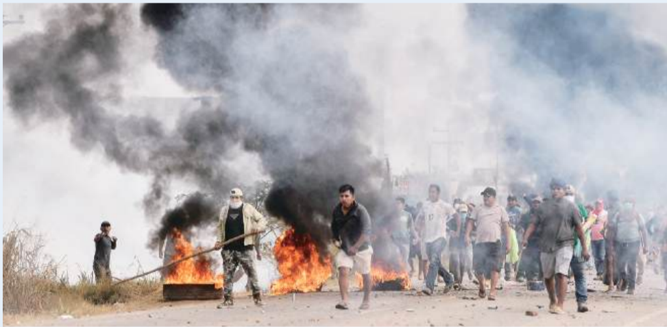
Anti-government demonstrators clash with police officers and civilians during an operation to clear a road blockade in San Julián, Bolivia, on Saturday.