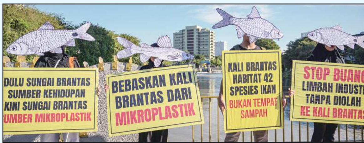
Activists from Ecoton (Ecological Observation and Wetlands Conservation) wearing fish masks take part in a protest calling for clean rivers free of rubbish and industrial waste, as well as protection for the river fish, as part of World Environment Day celebrations in Surabaya, Indonesia on Friday.