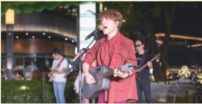
This photo provided by Brian Vong's (BV) representatives shows the Macau singer-songwriter performing at 360 Plaza by the lakeside of Zhuhai Jinwan Art Centre.