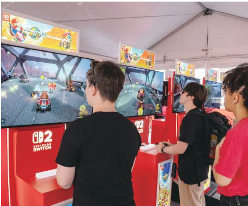
Gamers play Mario Kart World during a launch event ahead of the midnight release of the Nintendo Switch 2 at the Nintendo New York store on June 4, 2025.