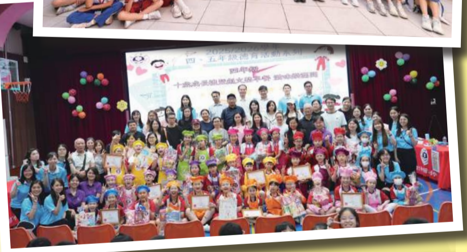
Hou Kong Middle School (primary section) and Shenzhen Shekou Yucai Education Group Yucai No. 2 Primary School students pose at the Macau Grand Prix Museum (MPGM) on May 28.