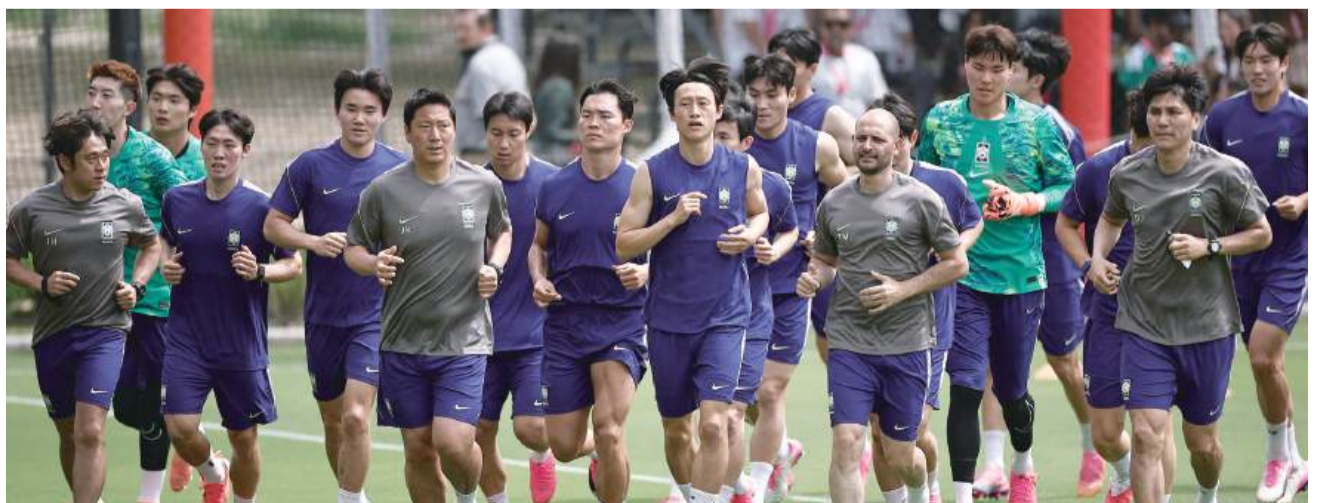
South Korea players jog during a training session at the Verde Valle training ground in Zapopan, Jalisco state, Mexico, on Saturday, ahead of the FIFA 2026 World Cup football tournament.