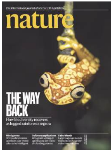
shows the cover of the international academic journal Nature.

Fewer opportunities for practical involvement, combined with reduced interaction between mentors and students, could weaken the transfer of tacit knowledge and professional experience that underpins scientific training, the statement quoted the article as saying. In order to address the issue, the authors call for a balanced approach that preserves educational goals while embracing technological