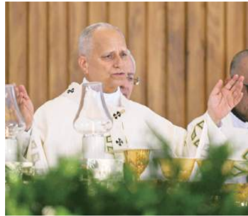
Pope Leo XIV holds a Mass in the Plaza de Cibeles in Madrid yesterday.

Around 56 percent of Spaniards identify as Catholic compared to 90 percent in the 1970s, according to a survey last month by the Centre for Sociological Research, an