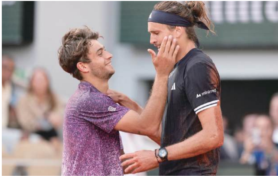
Winner Germany's Alexander Zverev (right) is embraced by Italy's Flavio Cobolli at the end of their single's final singles at the French Open tennis tournament on Court Philippe-Chatrier at the Roland-Garros Complex in Paris yesterday.

The most agonising miss of all was his first major final when he blew a two-set lead and failed to serve for the championship against Dominic Thiem at the 2020 US Open.