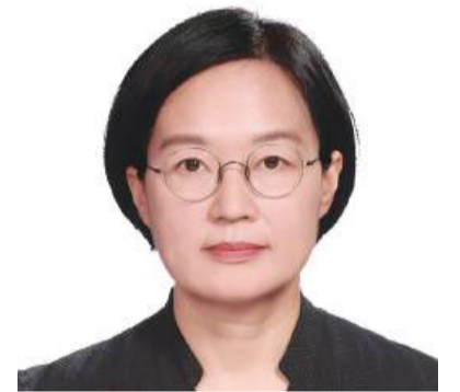
This undated handout photo released yesterday by the presidential Blue House in Seoul shows a portrait of Han Seong-sook, South Korean Minister of Small and Medium-sized Enterprises and Startups. South Korea's President Lee Jae Myung nominated yesterday Startups, Han, to be his next prime minister, making her only the second woman to hold the post if confirmed by parliament. —AFP

Outgoing Prime Minister Kim Min-seok is widely expected to run for the leadership of the ruling Democratic Party. —AFP