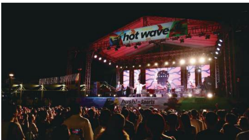
This file photo taken by the Cultural Affairs Bureau (IC) and downloaded from the “hush!” themed website shows a performance taking place during “hush! Beach Concerts x Urban Sports Wellfest 2025”.

More details can be found on www.icm.gov.mo , or related social media pages. ■