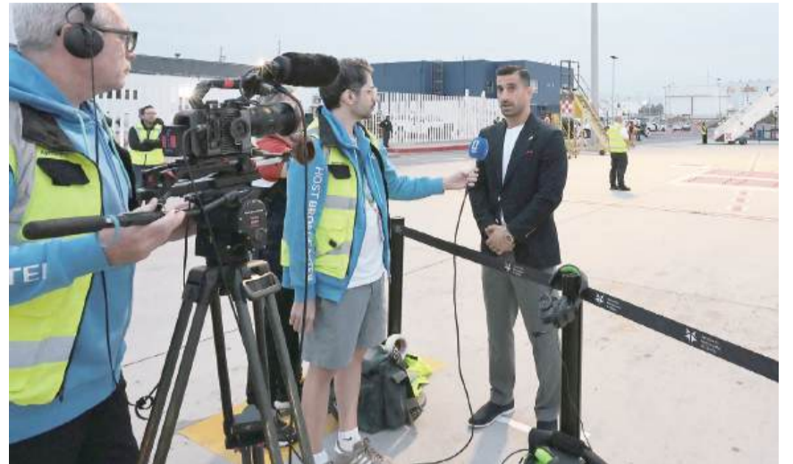
Iran's captain and defender Ehsan Haji Safi speaks with the press on arrival at the Tijuana International Airport in Tijuana, Mexico yesterday, ahead of the FIFA 2026 World Cup football tournament.

But he stated "the team is 100 percent ready" and believed "we can advance" in its group matches."