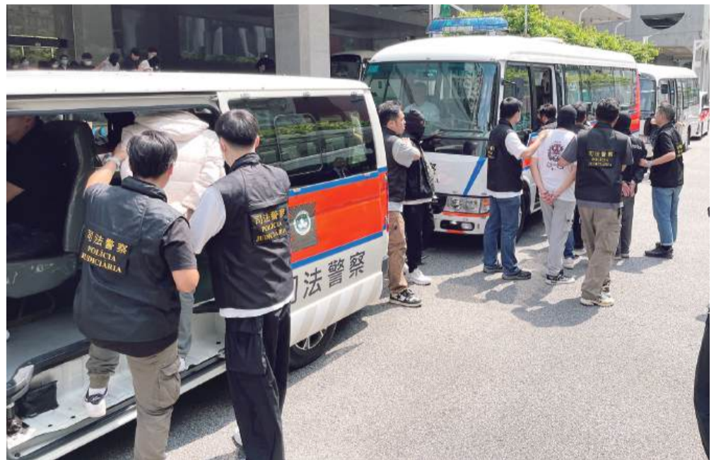
PJ officers escort the 26 hooded suspects to PJ vans outside the PJ headquarters on Friday.