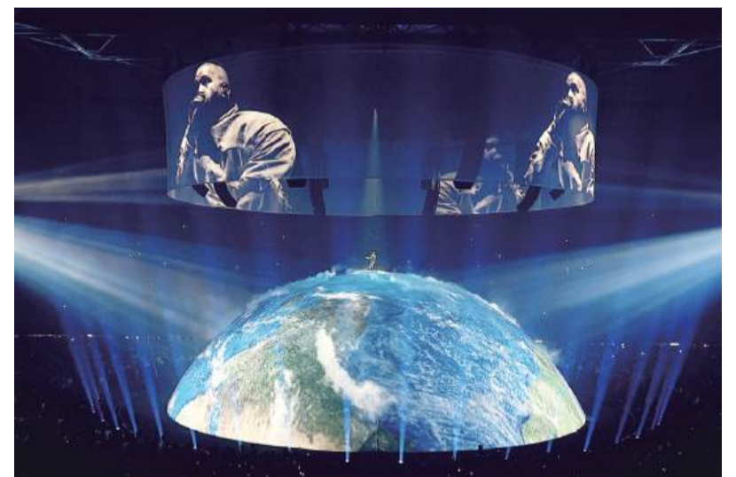
US rapper Ye performs on stage at the GelreDome venue in Arnhem, eastern Netherlands, on Saturday.

The rapper has denied being antisemitic and distanced himself from his remarks on social media, attributing them to his bipolar disorder.