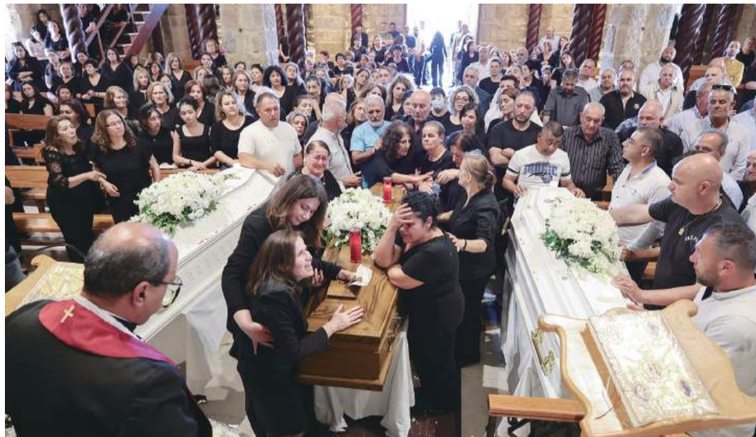
Relatives of a man who was killed along with his son and daughter in an Israeli strike that targeted their car earlier this week in southern Lebanon mourn over their coffins during their funeral in the Christian border village of Qlayaa yesterday. Lebanon's public university said on Tuesday it was postponing some examinations after two students and their father were killed while returning to south Lebanon after sitting exams a day earlier. The state-run National News Agency (NNA) said a dentist from the border village of Qlayaa "was killed with his son and daughter when an enemy drone targeted his car on the Nabatieh-Khardali road" on Monday.

BEIRUT – Lebanon's Hezbollah said it had attacked troops in northern Israel yesterday, as Israeli strikes killed at least nine people in southern Lebanon, dampening hopes for an end to the cycle of violence.