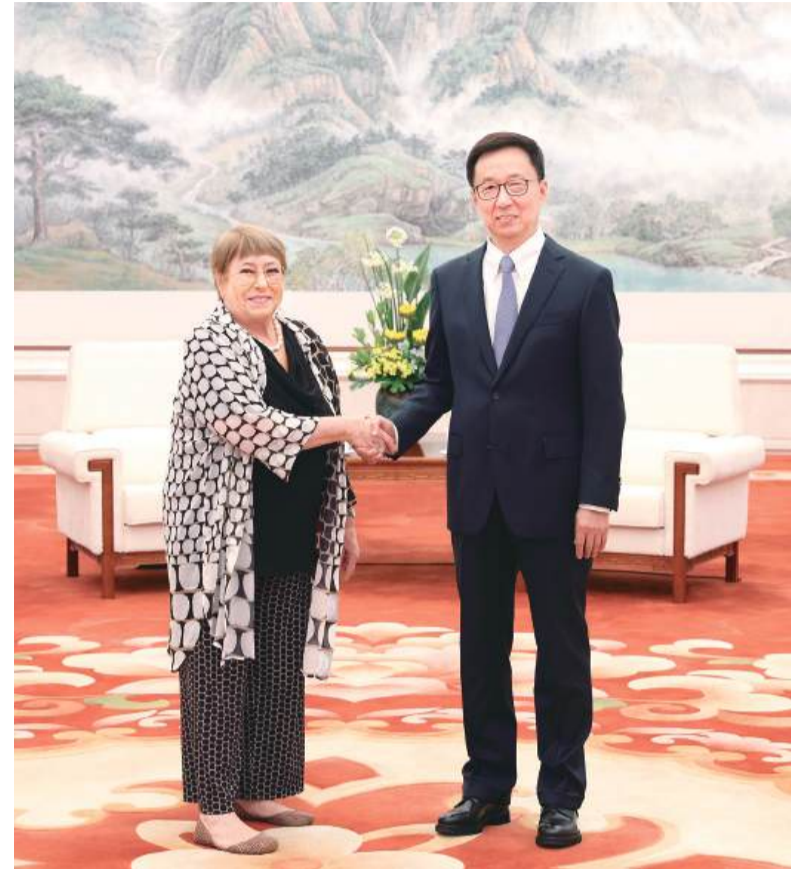
Vice President Han Zheng (right) shakes hands with Michelle Bachelet, candidate for the next United Nations (UN) secretary-general, in Beijing yesterday.

to work with China to follow the original aspiration and purpose of the UN and jointly strengthen the role of the UN. – Xinhua