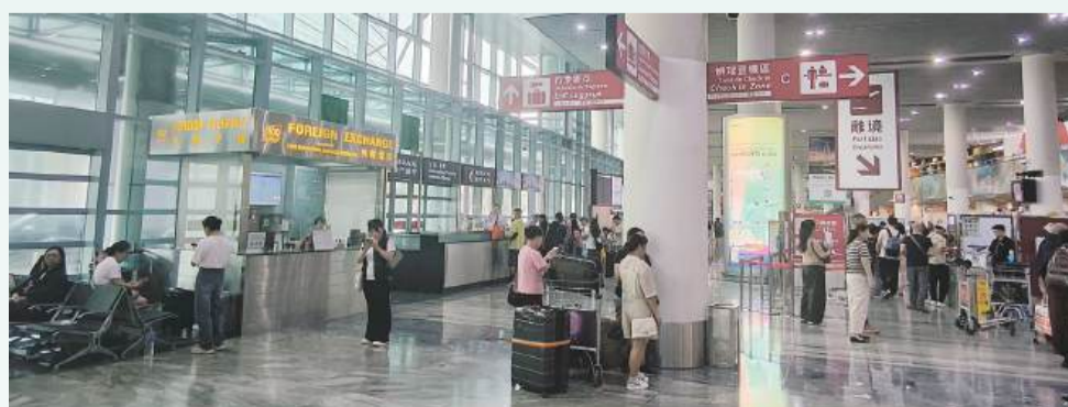
This file photo taken last year shows travellers in the local airport's departure hall.

No replacement has been appointed yet for the position of the MSAR's secretary for economy and finance.