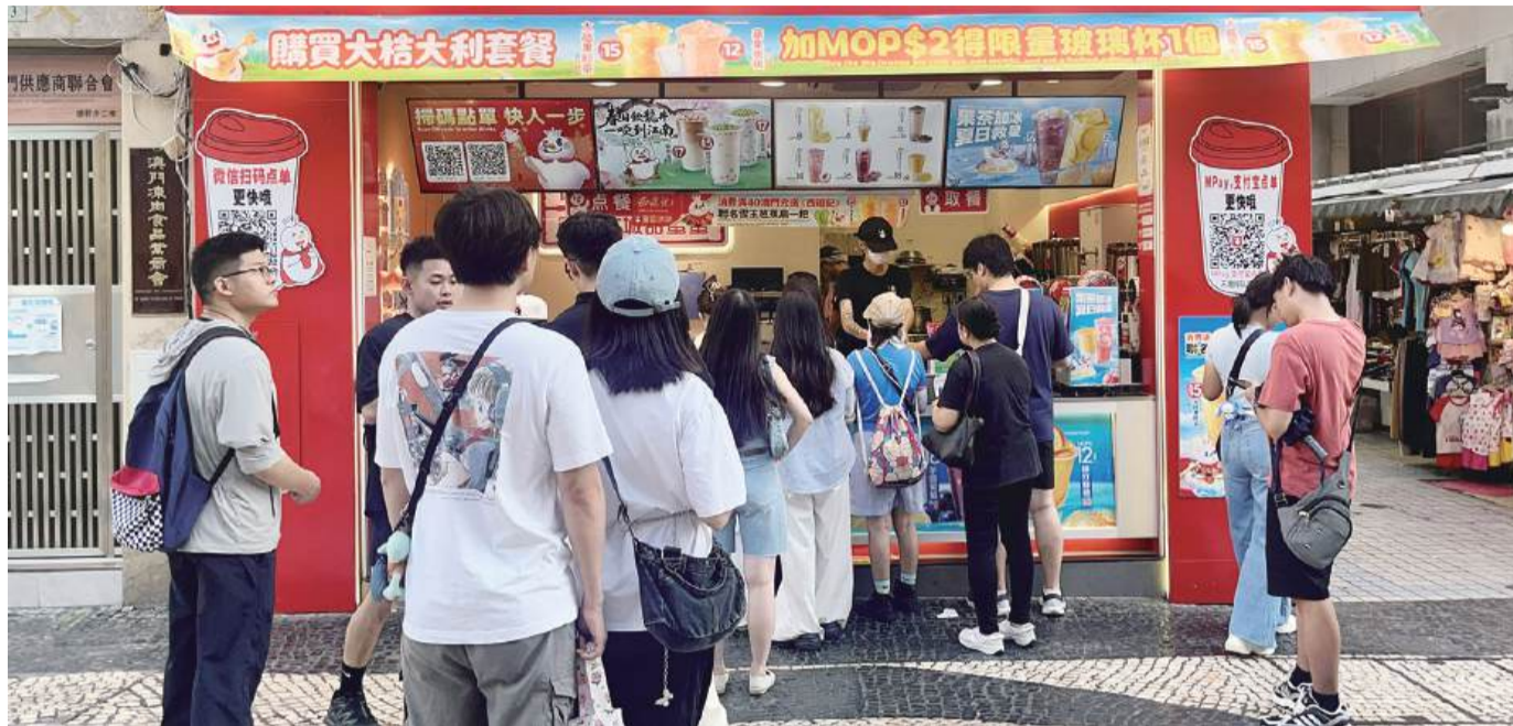
A queue forms in front of MIXUE, in Senado Square, which specialises in ice cream and tea-based drinks, yesterday as people try their best to beat the heat.