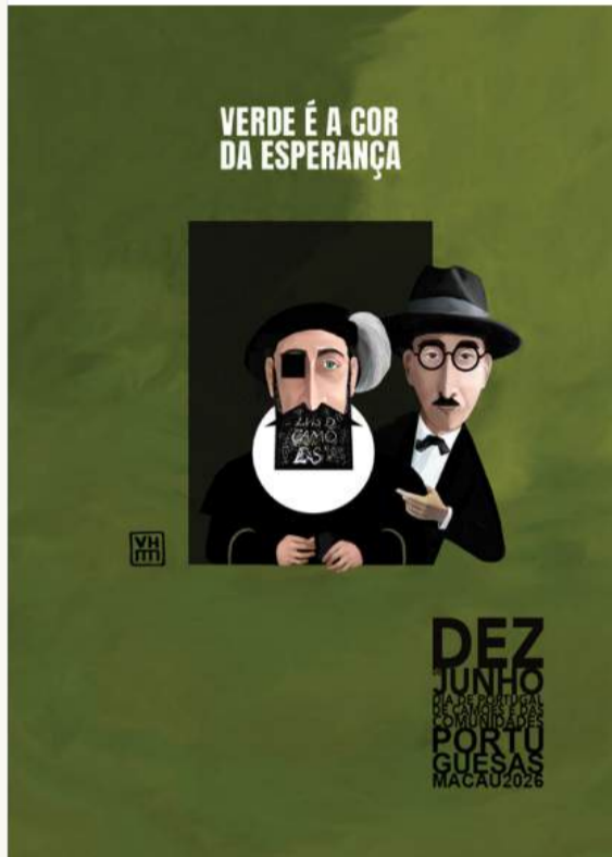
This screenshot taken last night shows the first page of the e-version of the programme for "June, Month of Portugal".

JUNHO, MÊS DE 六月 - 葡萄牙月, 於澳門 PORTUGAL NA RAEM COMEMORAÇÕES DO 10 DE JUNHO DIA DE PORTUGAL, DE CAMÕES E DAS COMUNIDADES PORTUGUESAS 六月十 "葡國日、賈梅士日暨葡僑日"