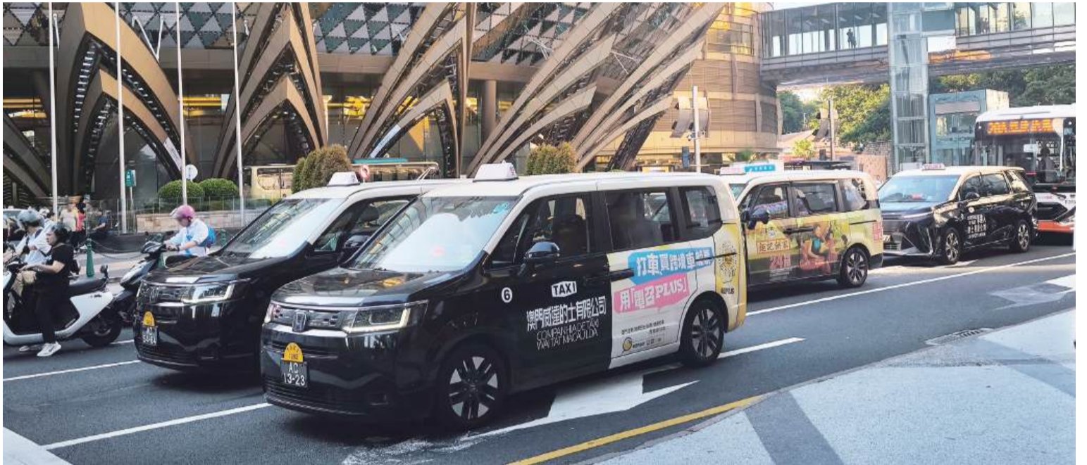
Taxis stop at the traffic light-controlled crossing outside Hotel Lisboa yesterday.

the second tender since the current taxi law took effect in 2019.