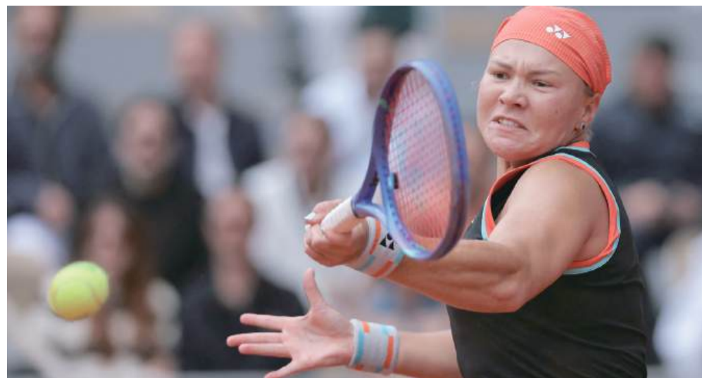
Diana Shnaider plays a forehand return to Aryna Sabalenka during their quarter finals match at the French Open tennis tournament on Court Philippe-Chatrier at the Roland-Garros Complex in Paris yesterday.

"You know those rooms where you just go in and you smash everything?" smiled