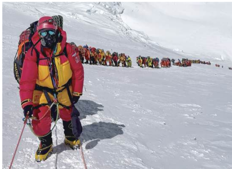
This photograph taken on May 20, shows mountaineers climbing a slope queuing during their ascent to summit Mount Everest in Nepal.

More than one thousand climbers reached the summit of Mount Everest this season, officials said yesterday, making it the busiest season on record.