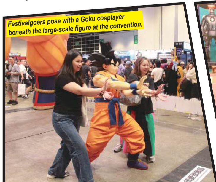
Festivalgoers pose with a Goku cosplayer beneath the large-scale figure at the convention.

*ACG is the short form for ACGHK, which stands for Animation-Comic-Game Hong Kong and is held annually.