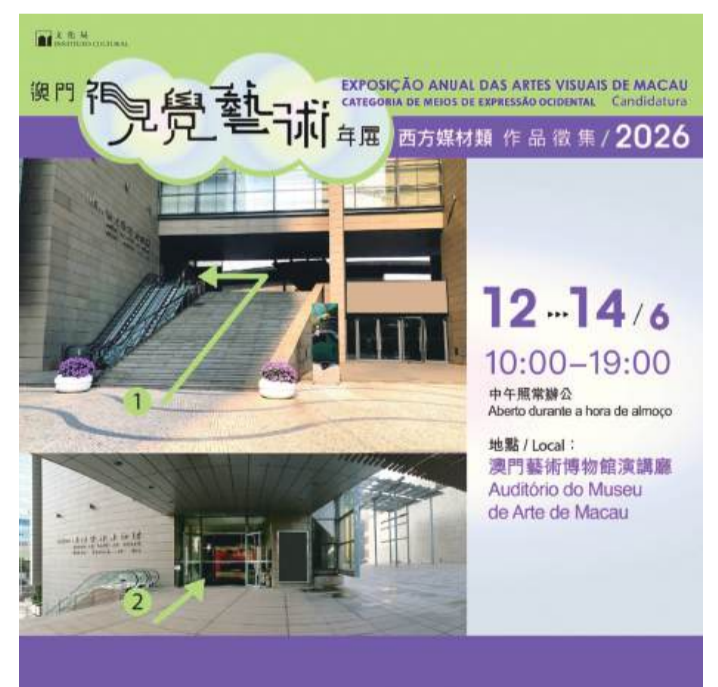
This poster provided the Cultural Affairs Bureau (IC) on Tuesday shows the venue of the upcoming 2026 Macau Annual Visual Arts Exhibition at the Macau Museum of Art (MAM) in Nape, where entries can be submitted from next Friday through Sunday (Jun12-14).

The statement added that exhibition guidelines and entry forms are available to download on the Cultural Affairs Bureau website ( www.icm.gov.mo ) or can be obtained from the IC Visual Arts Division at the Tap Seac Creative Centre (commonly known as the Glass House). For enquiries, call 2836 6866 during office hours or email cam@icm.gov.mo . ■