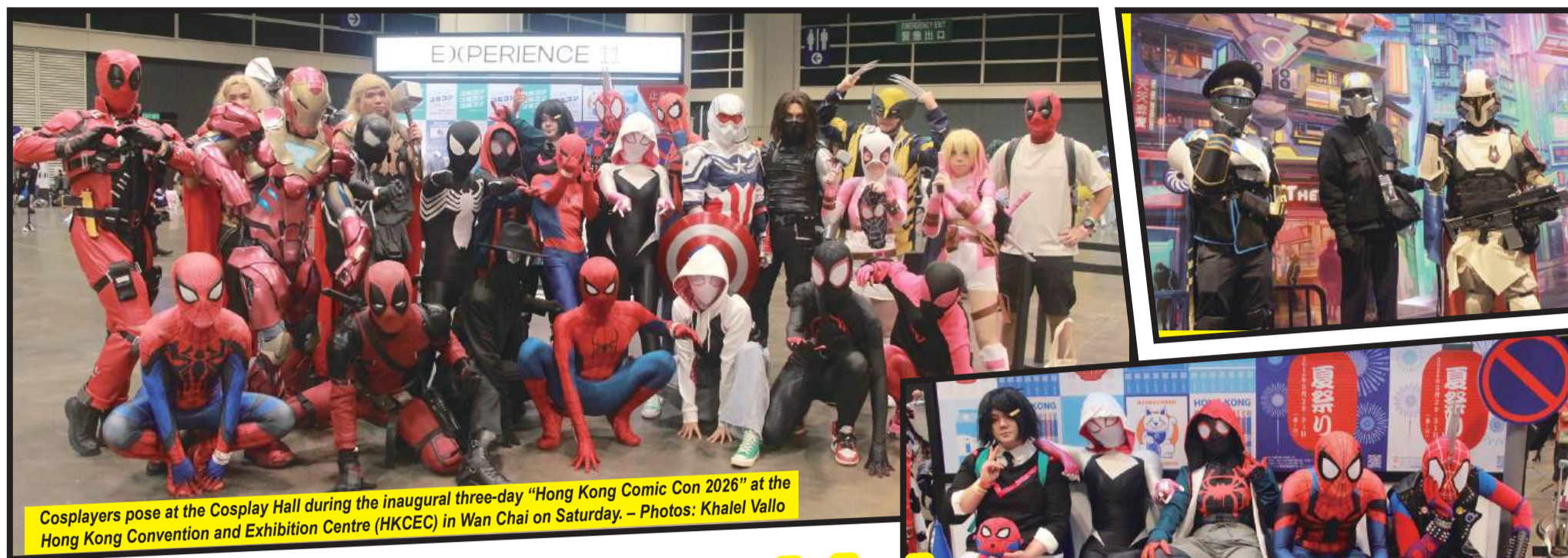
Cosplayers pose at the Cosplay Hall during the inaugural three-day "Hong Kong Comic Con 2026" at the Hong Kong Convention and Exhibition Centre (HKCEC) in Wan Chai on Saturday.