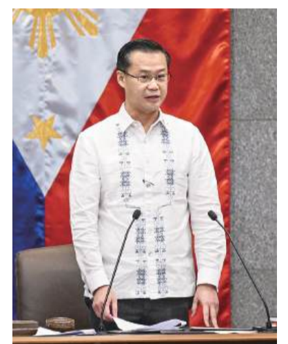
Philippine Senator Sherwin Gatchalian presides as Senate Pro Tempore during the plenary session at the Senate of the Philippines in Pasay, Metro Manila yesterday.

“Get back to work because it’s important... We have to pass a lot of laws.”