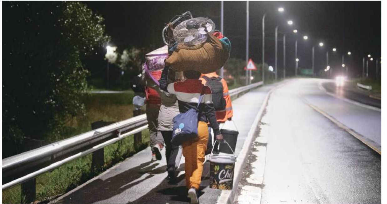
Immigrants carrying their belongings walk on a street in Stanford, about 120 km from Cape Town, on Tuesday, after saying that they were threatened in the communities in which they live. A rising tide in anti-immigrant sentiment, including protest marches and even violent attacks has been taking place in various places around South Africa.