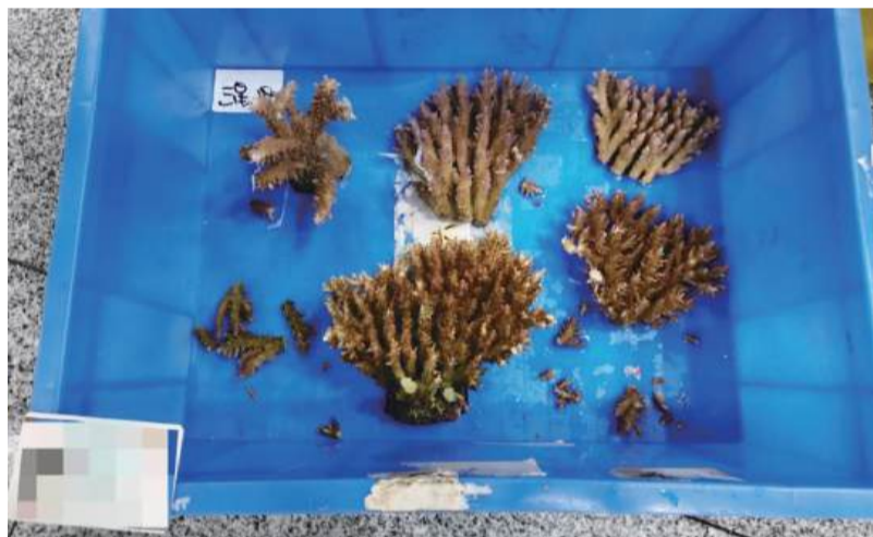
This undated handout photo provided by Gongbei Customs yesterday shows 1.31 kg of stony corals seized by its officers at Gongbei Port (checkpoint) on May 13.

On May 27, the batch of live turtles was identified by the Guangdong Haizheng Forensic Judicial Appraisal Centre as comprising six species, namely the razor-backed musk turtle, eastern box turtle, ornate box turtle, diamondback terrapin, striped mud turtle, and helmeted mud turtle. Among these, the statement said, the razor-backed musk turtle, the striped mud turtle, and the helmeted mud turtle are all listed in Appendix II of the Convention on International Trade in Endangered Species of Wild Fauna and Flora (CITES). ■