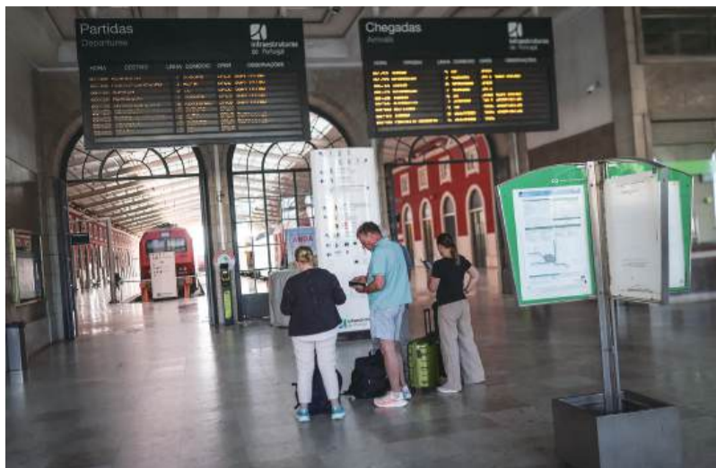
Travellers check their phones at Lisbon’s empty Santa Apolónia train station during yesterday’s nationwide general strike.