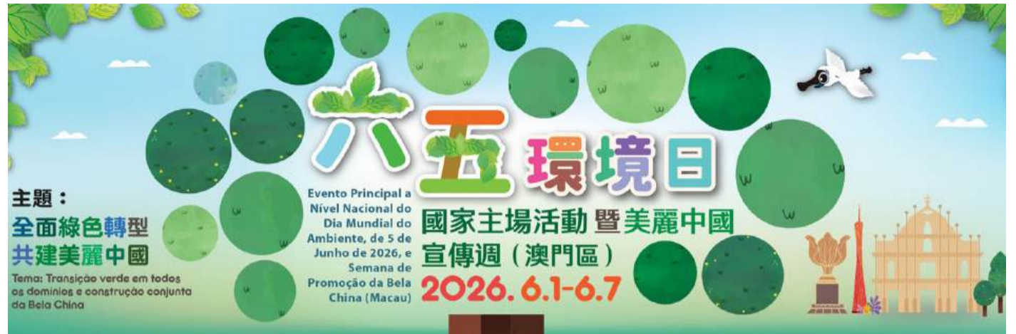
This poster provided by the Environmental Protection Bureau (DSPA) yesterday promotes its energy-saving initiatives for the National Event on Environment Day 2026.