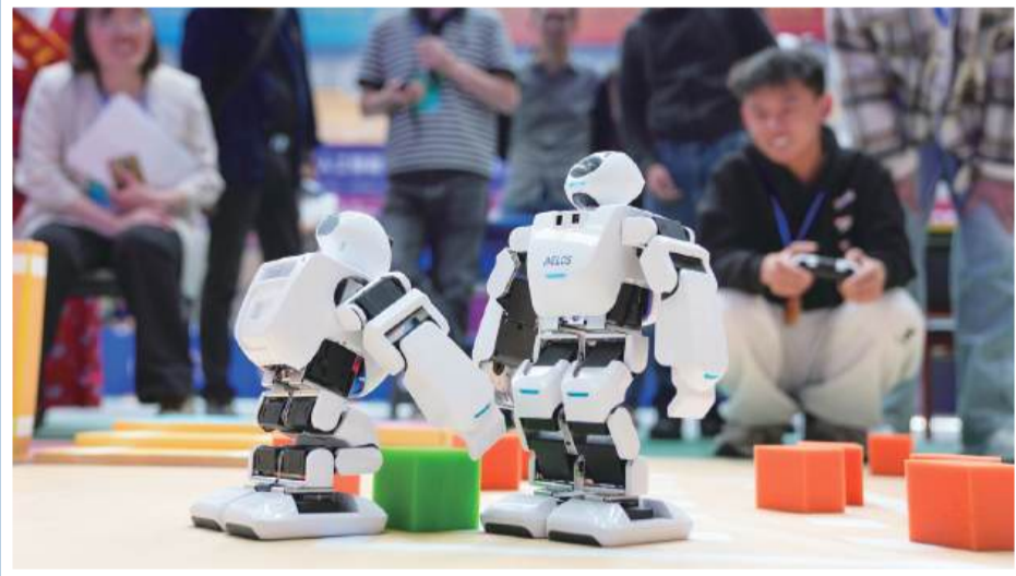
Contestants are in action during an offline contest of the Xizang division of the 28th China Robot and Artificial Intelligence Competition (CRAIC) at Xizang University in Lhasa, Xizang Autonomous Region, yesterday. A total of 81 teams took part in the Xizang division of the 28th CRAIC, including 19 teams from four universities enrolled for the offline contests.