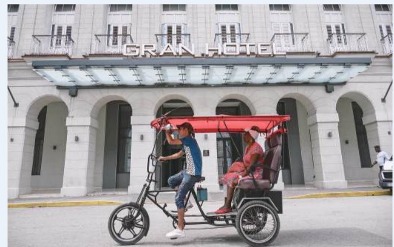
A tricycle passes in front of the Gran Hotel Bristol in Havana yesterday. The Spanish hotel group Melia has stopped managing 15 hotels in Cuba that it operated in partnership with the Gaesa conglomerate, which is linked to the army and subject to United States sanctions.

In response, several countries, including Canada, have issued travel advisories and major airlines including Spain’s Iberia have cut service to the country.