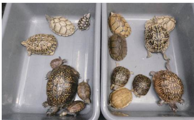
This undated handout photo provided by General Administration of Customs of the People's Republic of China (GACC) yesterday shows 15 turtles seized by Zhuhai's Gongbei Customs at HZMB Zhuhai Port (checkpoint) on April 15.