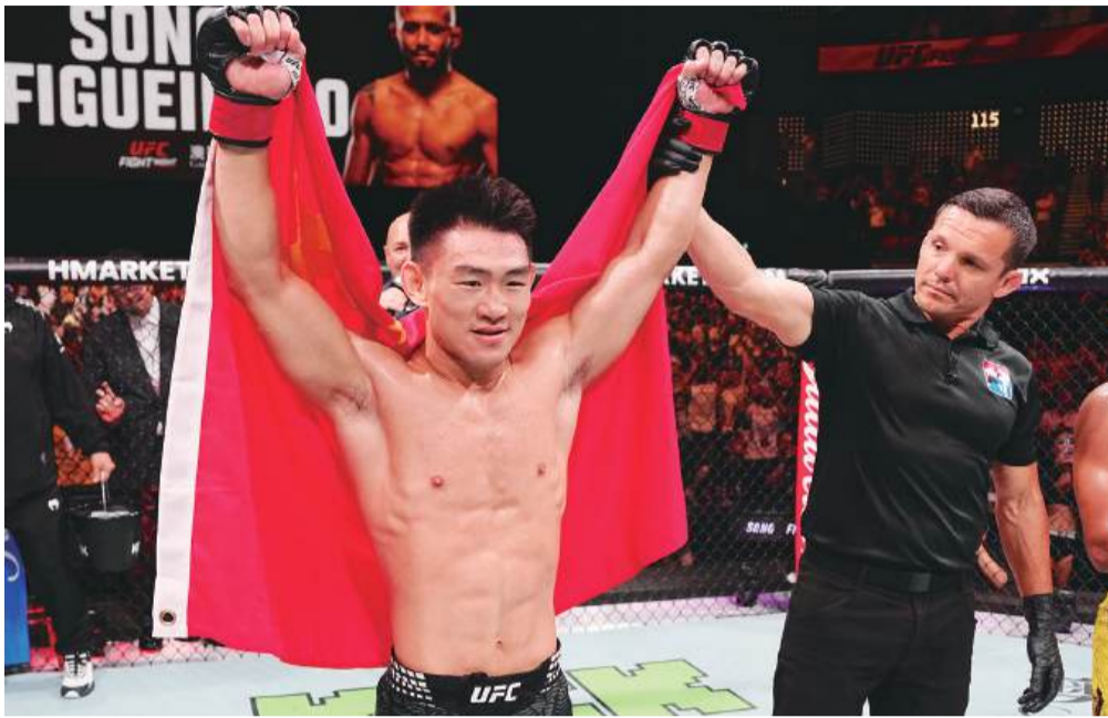
This photo shows Song "Kung Fu Kid" Yadong (left) being declared the winner after his bout with Brazil's Deiveson "Deus da Guerra" Figueiredo at UFC FIGHT NIGHT in Galaxy Arena.