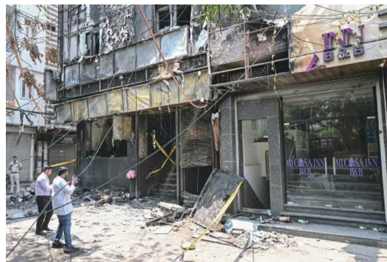
Forensics team members take photographs of the site following a fire that broke out at a hotel in New Delhi, India yesterday.

Locals rushed to the site, as firefighters worked to douse the blaze and ambulances arrived to transport the injured.