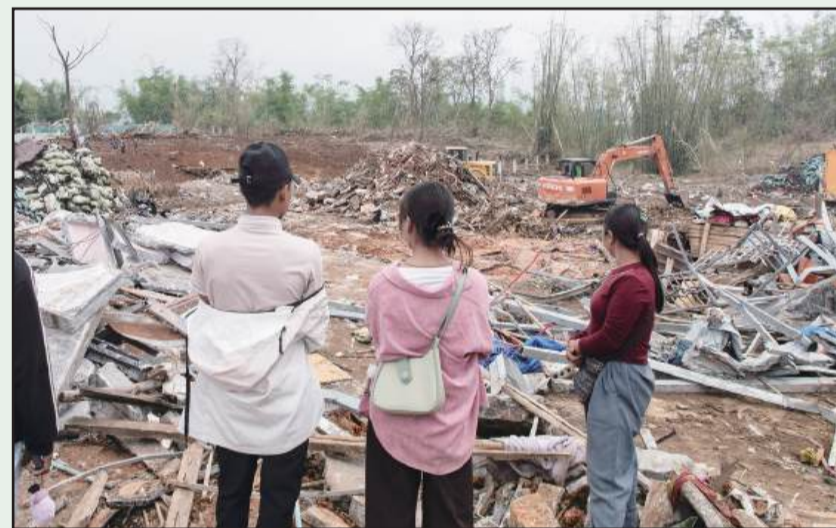
Residents look on amid search operations in the aftermath of an explosion in Kaung Tat village, in Namhkam Township in Myanmar's Shan state yesterday. A blast in northern Myanmar killed dozens of people on Sunday, two rescue workers said, with rebels controlling the region saying it was caused by the accidental detonation of mining explosives. One first responder in Shan state's Namhkam district, where the blast occurred, said 46 people were killed, including six children, and more than 70 others were injured.