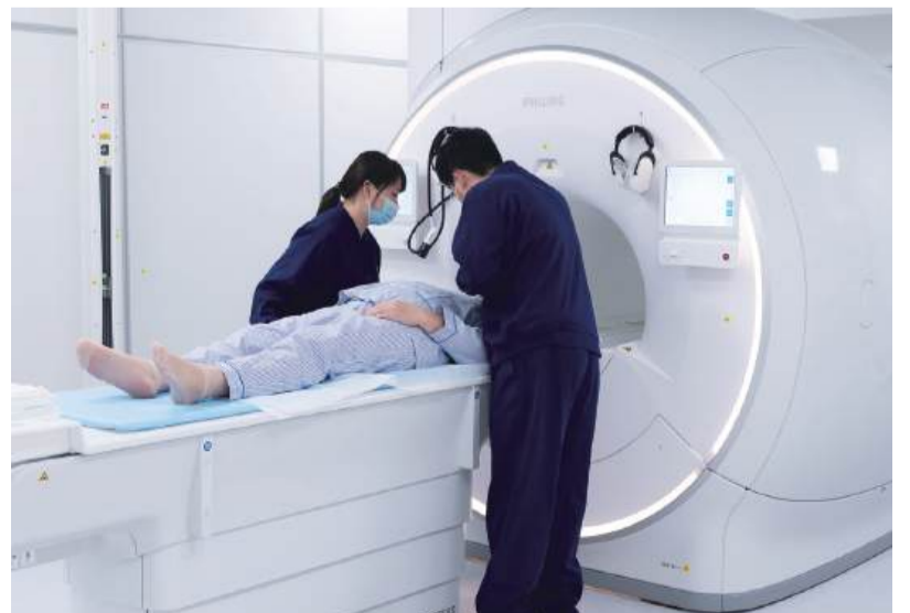
This undated handout photo provided by the Macao Union Medical Centre yesterday shows an elderly patient being tested by the first 3T MRI simulation positioning system at the public hospital in Cotai.

**A meningioma is the most common type of primary brain tumour. It originates in the meninges, which are the protective membrane layers surrounding the brain and spinal cord. - Gemini