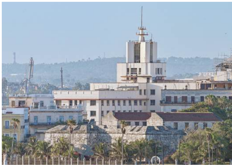
Photo taken on Monday of the headquarters of Cuba's Grupo de Administración Empresarial S.A. (GAESA – Business Administration Group Ltd) in Havana.

“On the contrary, it has been a coordinated response of proven efficiency to the economic siege that has historically sought to suffocate the Cuban Revolution,” it said, referring to the US embargo imposed on the island in 1962.