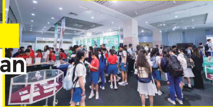
Students and guests view the exhibition during Friday's opening ceremony.

**The following section was translated from Chinese and edited into English with the assistance of Gemini AI. The Post cannot independently verify the accuracy of the translated entomological terminology.