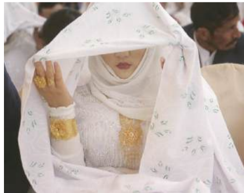
A bride attends a mass wedding ceremony in Kabul, Afghanistan, on Monday.

He said mass weddings offer a practical solution because they relieve families of overwhelming financial pressure while allowing couples to begin married life with confidence and peace of mind.