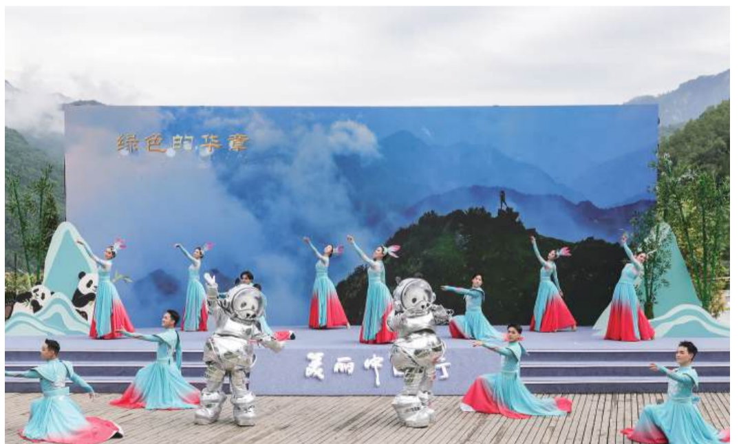
Artistes perform during the opening ceremony of a media tour in Baoxing County of Ya'an, Sichuan Province, yesterday. The media tour of national parks was launched in Baoxing yesterday. Over 140 people participated in the ceremony.

The United States and Mexico wrapped up their initial round of USMCA revision talks last week.