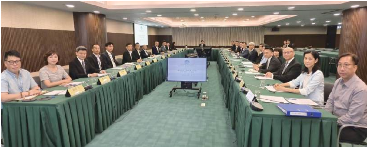
This undated handout photo provided by the Transport Bureau (DSAT) yesterday shows the government's Roadworks Optimisation Coordination Working Group recently holding a meeting to discuss infrastructure projects.