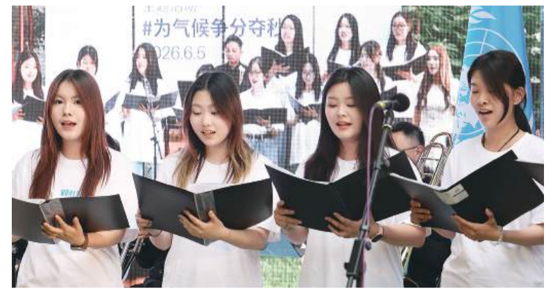
A university students chorus sings during an event marking the upcoming World Environment Day in Beijing yesterday. The even focused on policies and practices for addressing climate change. World Environment Day falls on June 5. – Xinhua

According to the plan, the country will seek to scale up more pioneering industries, such as intelligent design breeding, new-energy agricultural machinery, low-altitude agricultural economy, agricultural bio-manufacturing, and new foods over the coming years. – Xinhua