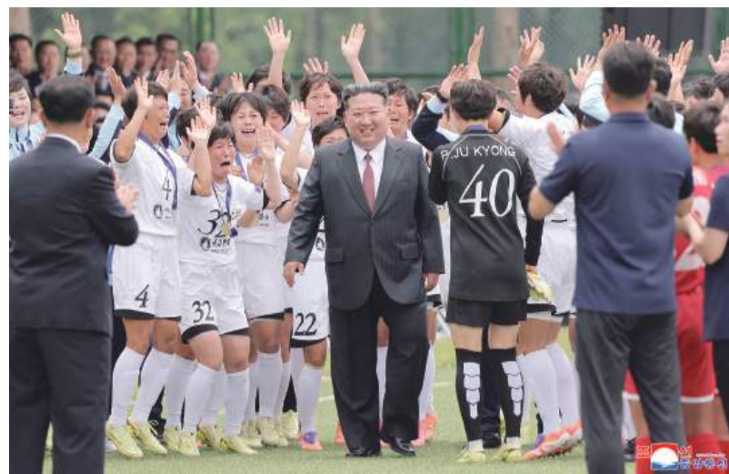
This picture taken on Monday and released by North Korea's official Korean Central News Agency (KCNA) yesterday shows North Korean leader Kim Jong Un (centre) congratulating the players who won the AFC Under-17 Women's Asian Cup, at the Workers' Party of Korea Central School for Cadres in Pyongyang.