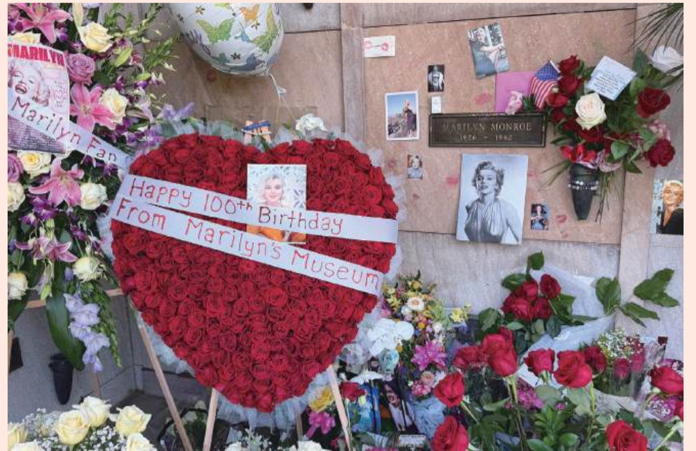
Flowers are placed at Marilyn Monroe’s crypt in the Corridor of Memories mausoleum at Pierce Brothers Westwood Village Memorial Park & Mortuary in Los Angeles on Monday, in commemoration of the 100 th anniversary of her birth.

In the 1950s, while under contract with 20 th Century Fox, she refused to act in the