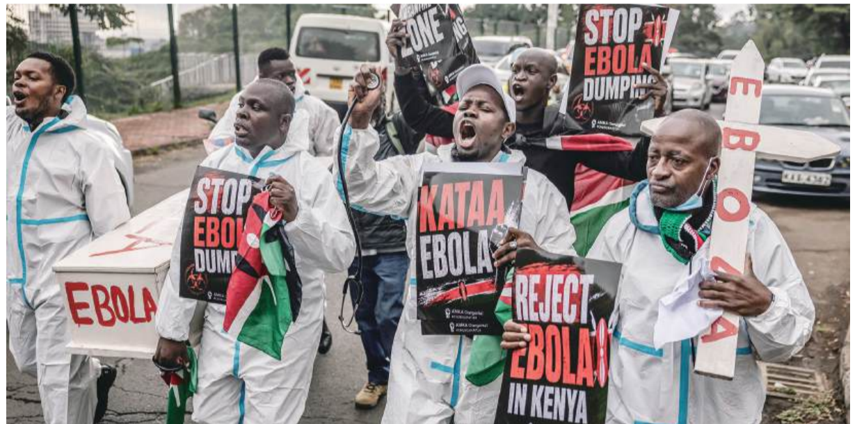
Demonstrators chant slogans as they carry placards and a mock coffin during a protest against a US-built Ebola quarantine centre planned to begin operations at Kenya's Laikipia Air Base, in Nairobi yesterday.

NAIROBI – Two people died during protests over a contested Ebola quarantine centre for US nationals in Kenya, a rights group said yesterday, as President William Ruto defended the planned centre.