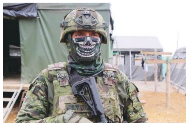
A Ecuadorean soldier wearing a facemask takes part in an operation against illegal mining in Buenos Aires, Imbabura province, Ecuador, last Wednesday.

Last month, a court placed former Socialist prime minister José Luis Rodríguez Zapatero, a Sánchez ally, under formal investigation for influence peddling and other alleged crimes.