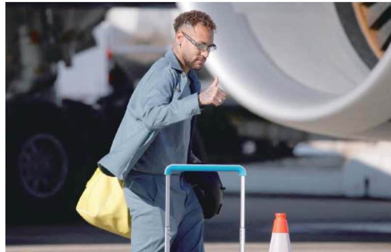
Brazil’s forward Neymar gives a thumbs up as team Brazil arrives at Newark Liberty International Airport (EWR) in Newark, New Jersey yesterday ahead of the FIFA World Cup.

much less feared than in most previous editions.