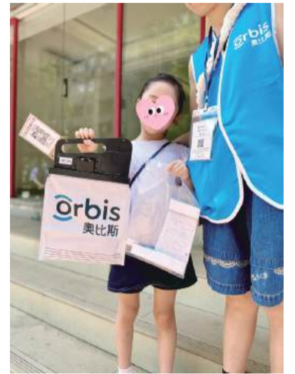
This undated and unlocated handout photo recently provided by Orbis Macau shows a child posing with a volunteer while holding up a donation bag.

The statement said that the NGO will also conduct its first-ever