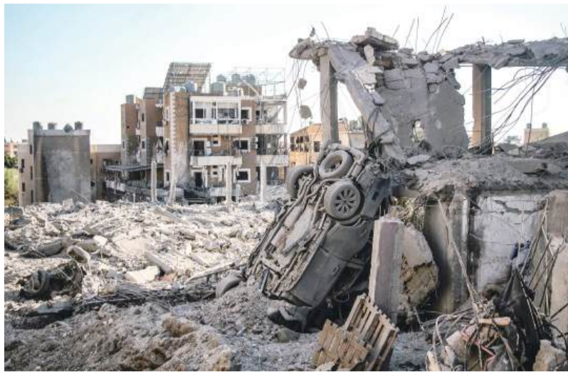
This photo shows the aftermath of Israeli airstrikes in the Burj al-Chamali area near the southern city of Tyre yesterday.

Lebanon's state-run National News Agency (NNA) reported Israeli strikes, some of them deadly, on around 30 locations across the south yesterday.