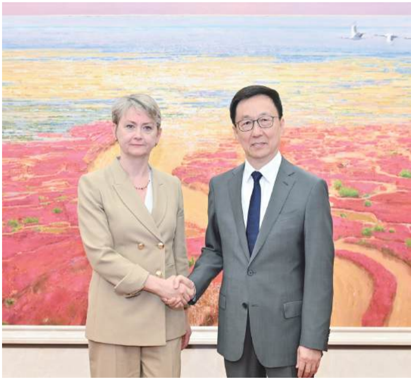
Vice President Han Zheng (right) shakes hands with UK Foreign Secretary Yvette Cooper in Beijing yesterday.