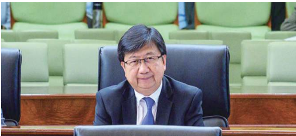
Secretary for Transport and Public Works Raymond Tam Vai Man addresses yesterday's plenary session in the Legislative Assembly's (AL) hemicycle.

The 106-square-kilometre Hengqin island in Zhuhai City is officially known as Guangdong-Macao In-Depth Cooperation Zone in Hengqin, following its inauguration