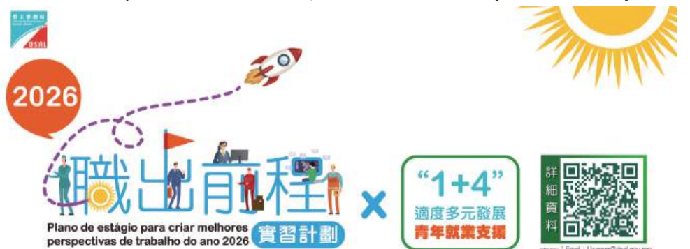
This poster provided by the Labour Affairs Bureau (DSAL) yesterday promotes the "Career Development Internship Programme 2026", which opens today.

Moreover, the statement noted, applications can be submitted through the Macau One Account platform until July 3. ■