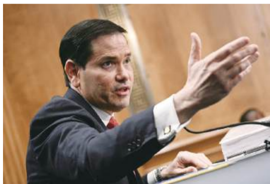
US Secretary of State Marco Rubio testifies during a Senate Foreign Relations Committee hearing concerning the fiscal year 2027 budget for the State Department, on Capitol Hill in Washington, DC, yesterday. Rubio testified publicly before Congress for the first time since the war in Iran began.

Rubio continued: "Iran is being sanctioned because they've highly enriched uranium, Iran is being sanctioned because of their nuclear activities, if they agree to give up those things, there will be sanctions relief."