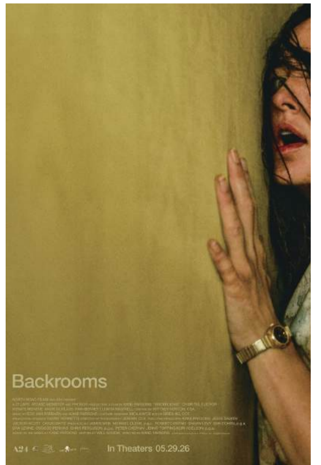
Theatrical release poster for “Backrooms”

“It still requires just finding the great filmmakers, which can come anywhere.” – AFP