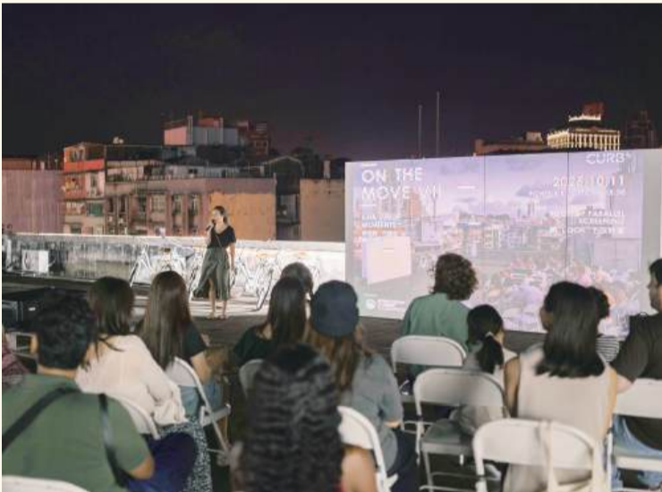
This undated handout photo provided by CURB – Center for Architecture and Urbanism yesterday shows a previous edition of the Rooftop Parallel Screening on the rooftop of Ponte 9 – Creative Platform on Rua das Lorchas. "Ponte 9" is Portuguese for "Pier" or "Wharf" No.9.