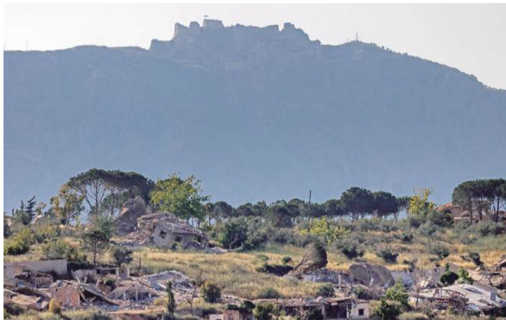
This photo taken from a position in the Upper Galilee region in northern Israel shows destroyed buildings in the southern Lebanon against the backdrop of the medieval Beaufort Castle, locally known as Qalaat al-Shaqif or Shaqif Arnoun, yesterday.