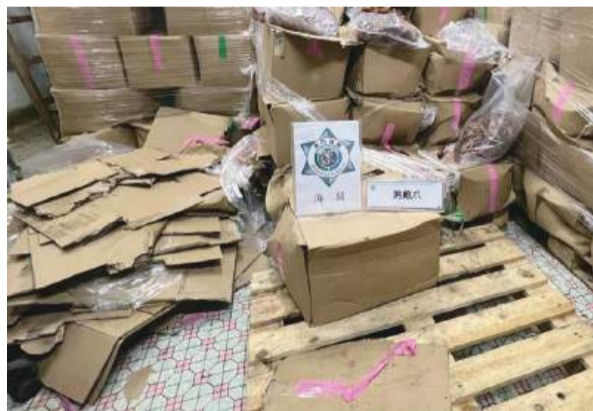
This handout photo released by the Macau Customs Service on Saturday shows cardboard boxes of chicken feet weighing 2.4 tonnes in total, stored at room temperature, at a parallel trading den in the northern district on Friday.

Meanwhile, as the business premises in question did not possess a valid operating licence, the case has been referred to the Financial Services Bureau (DSF) for follow-up. ■