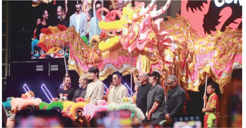
(From left to right) Daniel Logan, Mads Mikkelsen, Byeon Woo-seok, Louis Koo Tin-lok, Christopher Lloyd, Norman Reedus, and Giancarlo Esposito pose during Friday’s opening ceremony.

figures, video game merchandise and an artist’s alley showcasing international comic creators.