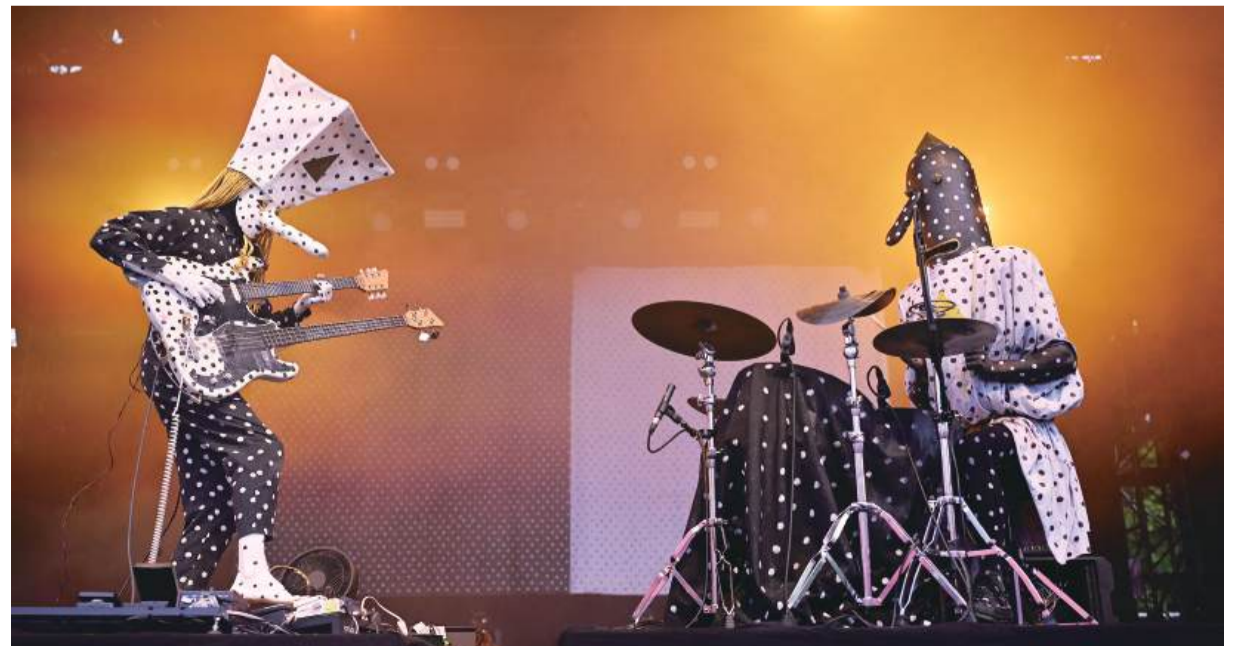
Canada's experimental rock band "Angine de Poitrine" performs during a concert part of the Nuits Botanique ("Botanical Nights") music festival in Brussels in Thursday last week.

*Syncopated ("chopping up") guitar playing – a rhythmic technique where the guitarist intentionally misaligns his or her accents with the underlying pulse of the music. Instead of striking chords or notes directly on the steady main beats (the "strong" beats), they play on the unexpected spaces between those beats (the "weak" beats or offbeats). In music theory, "syncopated" has become the definitive word for any rhythm that intentionally disrupts the regular, expected pulse of a piece of music. – Gemini