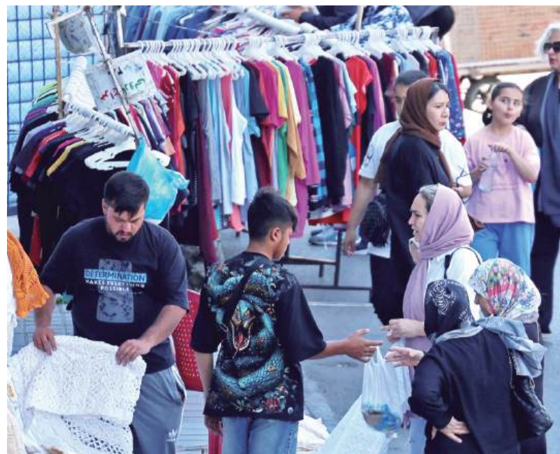
Iranians shop at a market in Tehran’s Sadeghiyeh Square yesterday.