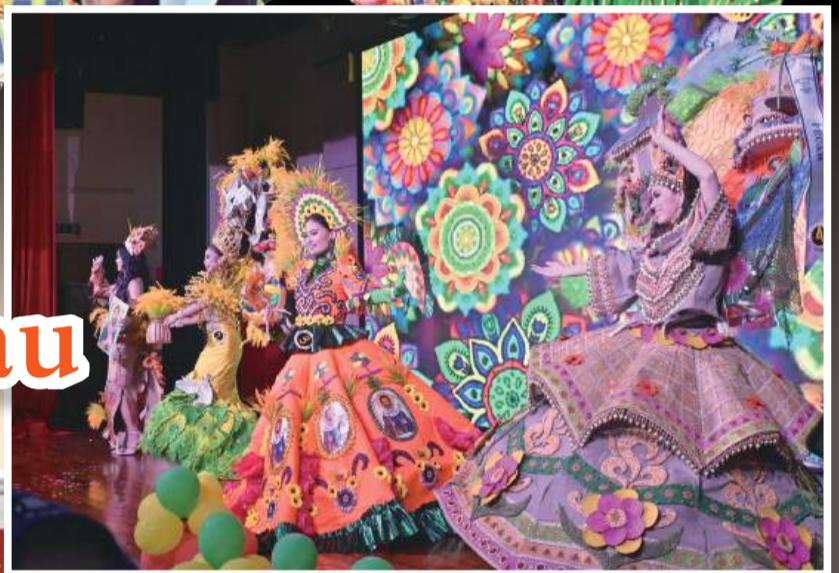
Contestants for yesterday’s parikitan at the 24 th edition of the San Isidro Pahiyas Festival in Macau showcase their costumes and deliver on-stage performances at the Chan Meng Kam Theatre in Iao Hon district yesterday afternoon.

*The word comes from the root word rikit (meaning beauty or loveliness) and translates closely to a competition of “prettiness” or “beautification” (pagandahan) in the Southern Tagalog region. It serves as both a high-fashion beauty pageant and a celebration of local ingenuity. - Gemini