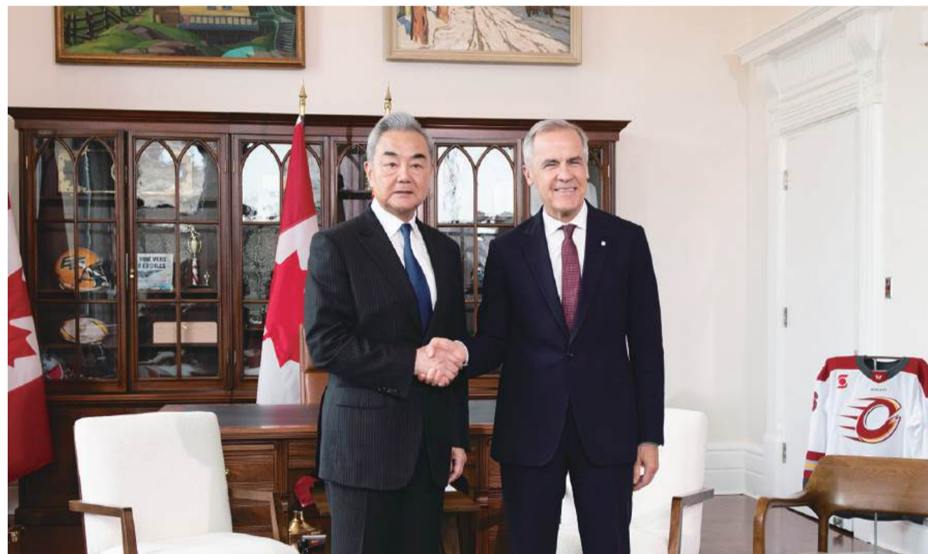
Canadian Prime Minister Mark Carney (right) meets with Foreign Minister Wang Yi, a member of the Political Bureau of the Communist Party of China (CPC) Central Committee in Ottawa, Canada, on Friday.