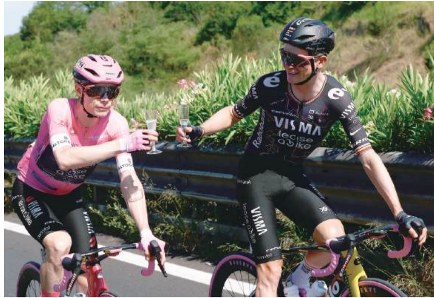
Team Visma Lease a Bike Danish rider Jonas Vingegaard wearing the overall leader's pink jersey holds a glass of sparkling wine with Team Visma Lease a Bike US rider Sepp Kuss during the 21st stage of the Giro d'Italia 2026 - Tour of Italy cycling race of 131km from Rome to Rome, yesterday.

Milan has had a difficult Giro and couldn't stop Paul Magnier winning the points jersey for the sprinters.