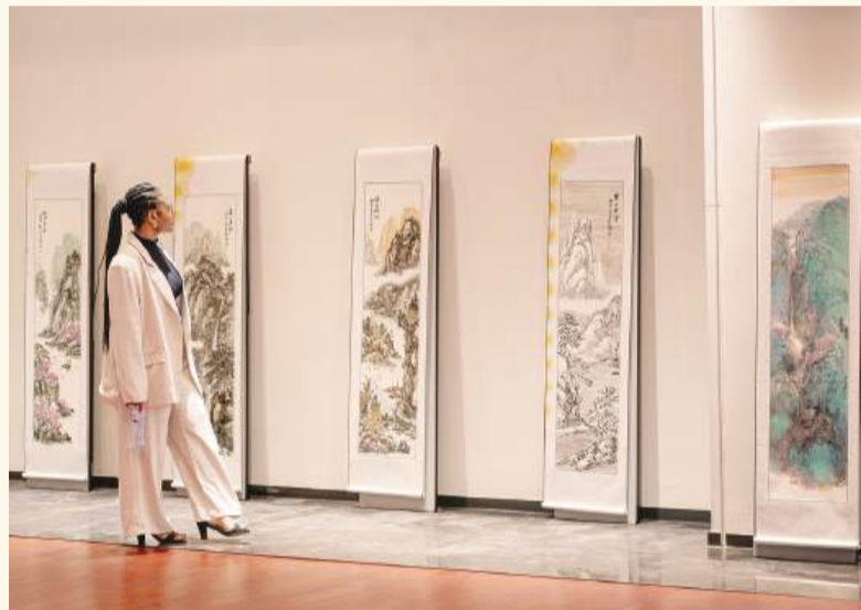
A visitor looks at traditional Chinese paintings during the “Silk Road Art Dialogue” exhibition at the Mozambique-China Cultural Center in Maputo, Mozambique, on Thursday.