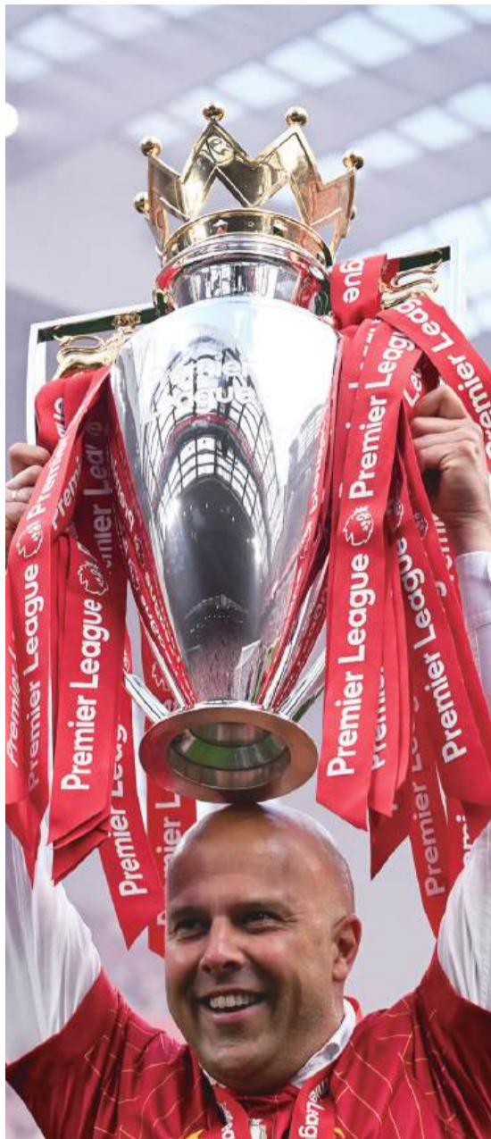
Liverpool's Dutch manager Arne Slot celebrates with the Premier League trophy at the end of the English Premier League match against Crystal Palace at Anfield in Liverpool, north west England on May 25, 2025. Liverpool have confirmed head coach Arne Slot is to depart his role as head coach, according to a club statement on Saturday.