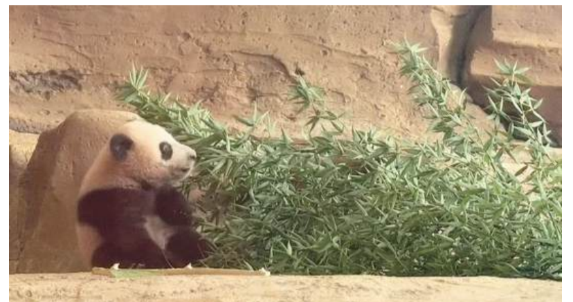
Rio, the first giant panda cub born in Indonesia, is pictured at Taman Safari Indonesia in Bogor, south of Jakarta, on Saturday.

JAKARTA – Taman Safari Indonesia (TSI) officially introduced Rio, the first giant panda cub born in the country, to the public on Saturday in Bogor, south of Jakarta.