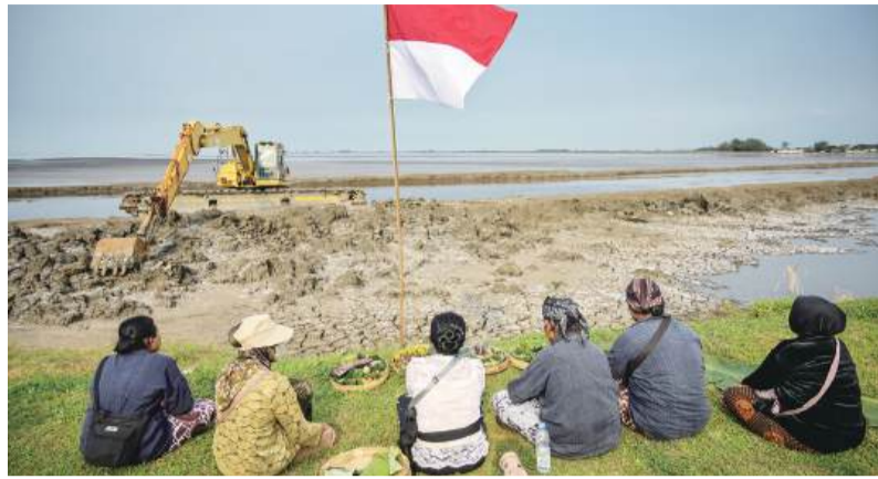
Residents affected by the Lapindo mudflow gather with environmental activists to offer prayers at the embankment of the mud volcano area, marking 20 years since a gas exploration accident triggered a mud flow that inundated more than a dozen villages and permanently displaced tens of thousands of people in Porong, Sidoarjo, East Java province on Saturday.

want it or not, we just go on day by day, trying to be able to adapt with this new circumstance,” the 48-year-old said.