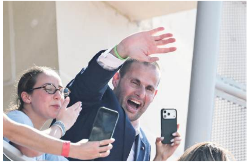
Malta's outgoing Prime Minister and leader of the Labour Party (PL) Robert Abela (centre) waves as he celebrates from his headquarters balcony following the results of Malta's legislative elections, in Hamrun, yesterday. His centre-left party came out on top in the parliamentary elections, giving a historic fourth term to the Labour Party government, which had called a snap election against a backdrop of geopolitical uncertainties.