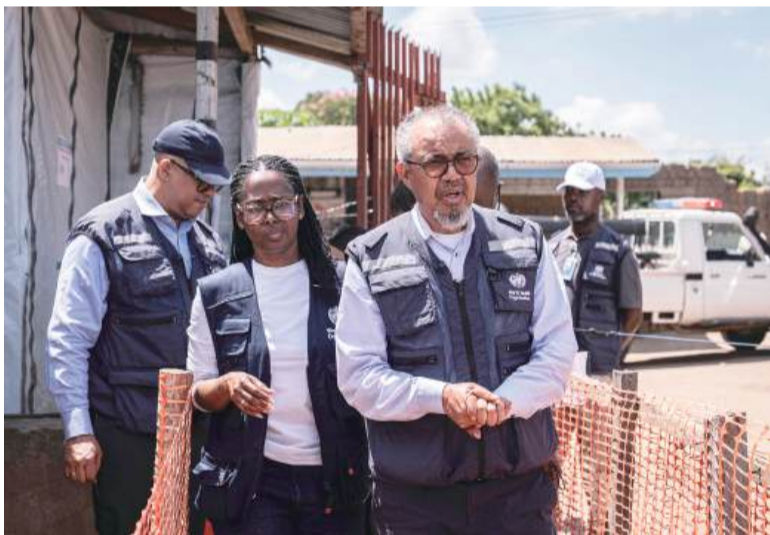
World Health Organisation (WHO) Director-General Tedros Adhanom Ghebreyesus visits an Ebola treatment centre to witness the discharge of recovered patients in Bunia, in the northeastern Democratic Republic of the Congo (DRC), yesterday.