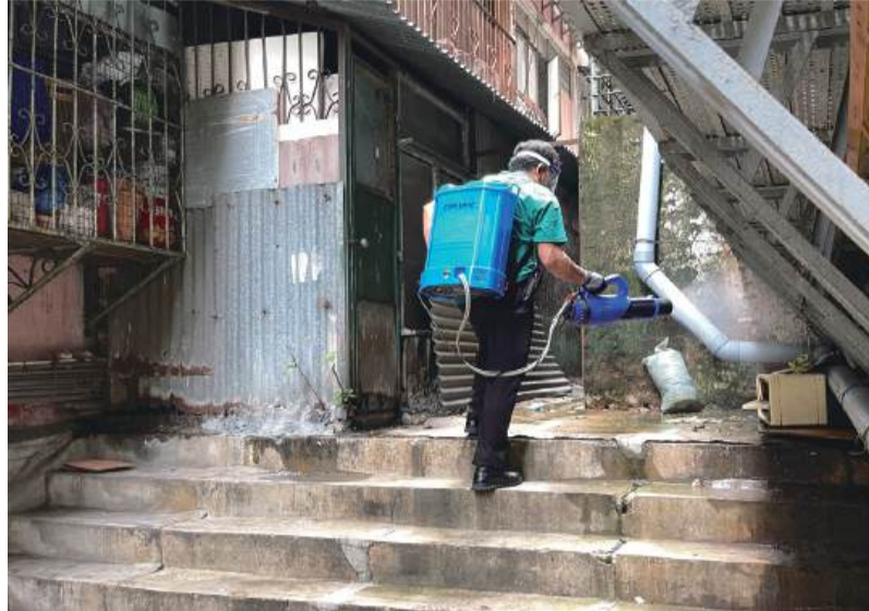
A cleaning worker sprays pesticide in back alley in lao Hon district yesterday.

The cleanup involves conducting assessments and implementing a tiered response for each building,