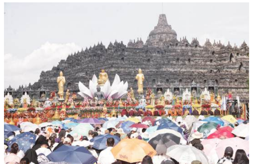
Buddhist monks and devotees participate in Vesak celebrations in front of Borobudur Temple, the world’s largest Buddhist monument and a UNESCO World Heritage Site, in Magelang, Central Java, Indonesia, yesterday. Vesak commemorates the birth, enlightenment and death of Siddhartha Gautama, the Buddha, traditionally believed to have occurred during the full moon of the Vesakha month in the ancient Indian lunar calendar.

“Don’t make things worse, don’t aggravate issues, but look with a longer-term horizon for opportunities to be helpful or to open channels of communication,” he said.