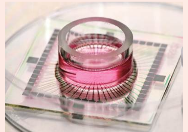
This photo taken on May 5, shows Micro Electrode Array (MEA) chips with nutrients placed on neurons at Cortical Labs’ Physical Containment Level 2 (PC2) laboratory in Melbourne.

From this data, the team adjusts their input to influence and train the neuron’s activity.