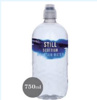
This undated handout photo downloaded last night from the Marks & Spencer online supermarket shows the problematic product that was found to contain enterococci.

*Enterococci are a genus of Gram-positive, facultative anaerobic bacteria that typically occur in pairs (diplococci) or short chains. They are part of the normal intestinal flora of humans and many animals. Enterococci can cause healthcare-associated infections, e.g., urinary tract infections, bacteraemia, endocarditis, wound infections, especially in immunocompromised or hospitalised patients. - DeepSeek