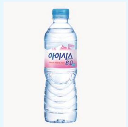
This undated handout photo downloaded last night from the Lotte Chilsung Mall online supermarket shows the problematic product that was found to contain enterococci.