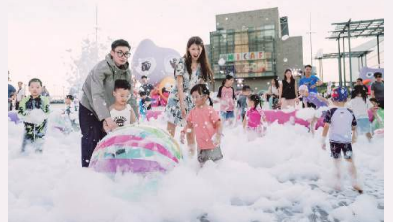
This undated handout photo provided by the Cultural Affairs Bureau (IC) on Friday shows last year's "MICAF Fun Day Arts Carnival" during the "2 nd Macao International Children's Arts Festival" in the Macau Cultural Centre (CCM) Plaza in Nape.

Registration for the workshops in the first phase is available through the "Activity Applications" of the Macao One Account ( activity.mo.gov.mo/activity-h5/activity-list-web ) from 10:00 a.m. on June 5 as well. ■