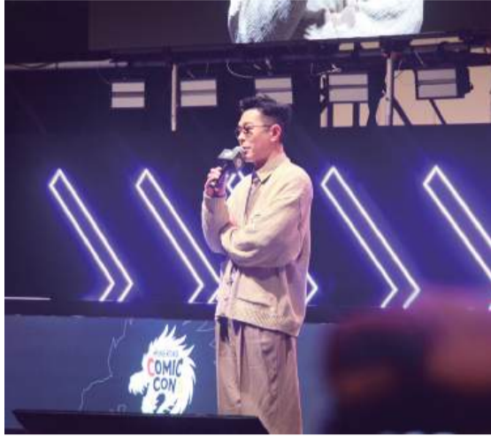
Hong Kong icon Louis Koo Tin-lok addresses the inaugural three-day “Hong Kong Comic Con 2026” opening ceremony at the Hong Kong Convention and Exhibition Centre in Wan Chai on Friday.

He added: “I hope that this year’s Comic Con can help Hong Kong become a better city”, encouraging attendees to share their feedback so future editions could continue to improve. The exhibition floor featured a variety of themed attractions and merchandise booths, including a Star Wars display, a large figure of Son Goku, collectibles such as Funko Pop!