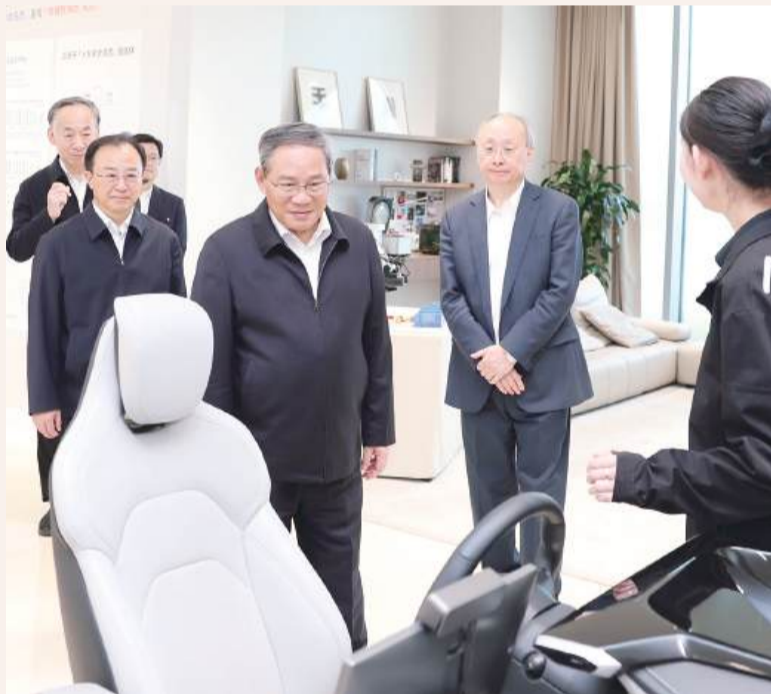
Premier Li Qiang (center), also a member of the Standing Committee of the Political Bureau of the Communist Party of China Central Committee, visits a sci-tech enterprise during an inspection tour in Beijing yesterday.