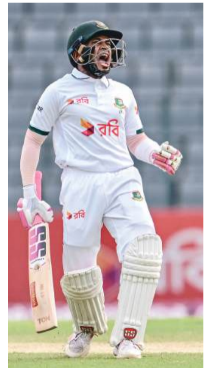
Bangladesh's Mushfiqur Rahim celebrates after scoring a century (100 runs) during the third day of the second Test cricket match against Pakistan at the Sylhet International Cricket Stadium in Sylhet, Bangladesh yesterday. – AFP

Pace bowler Khurram Shahzad took four 4-86 while Sajid claimed 3-126. – AFP