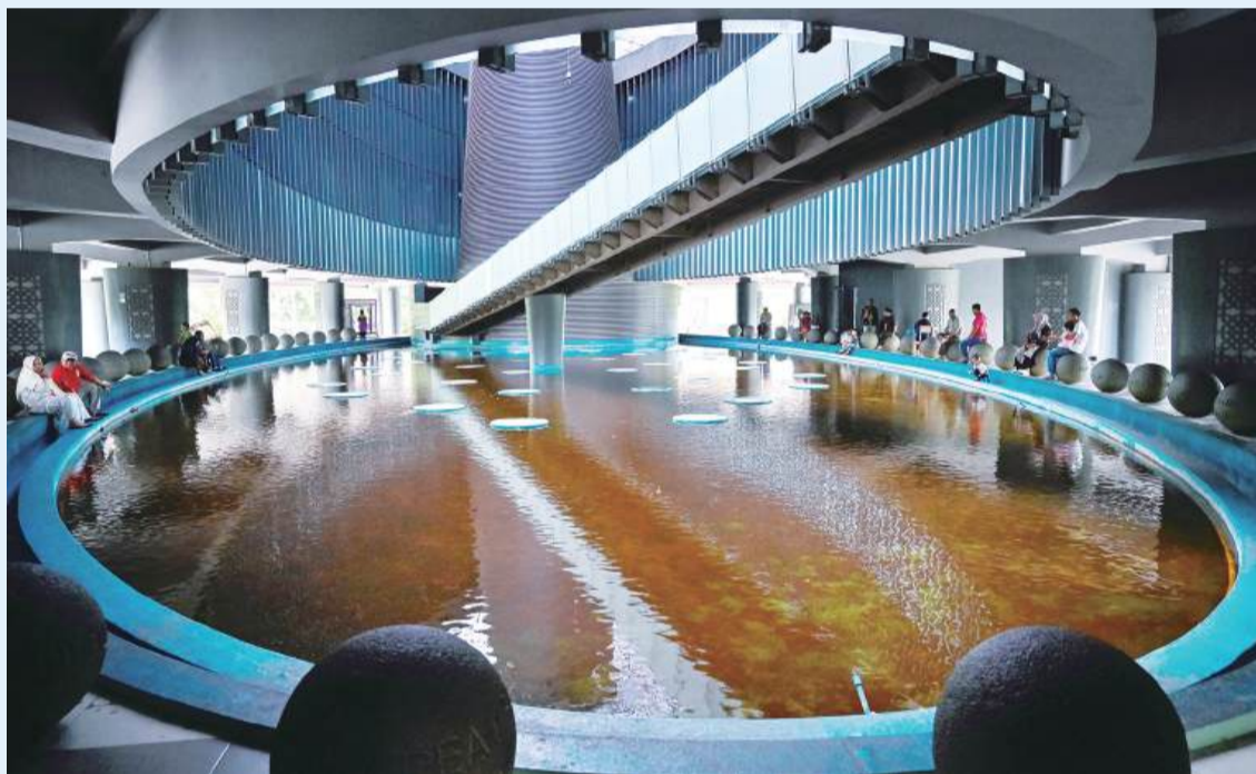
People visit the Aceh Tsunami Museum on International Museum Day in Banda Aceh, Indonesia yesterday.

Duterte swept to victory as the running mate of Ferdinand Marcos in 2022, but the alliance was broken last year when Marcos had her father arrested and turned over to the ICC where he now awaits trial over his deadly drug war.