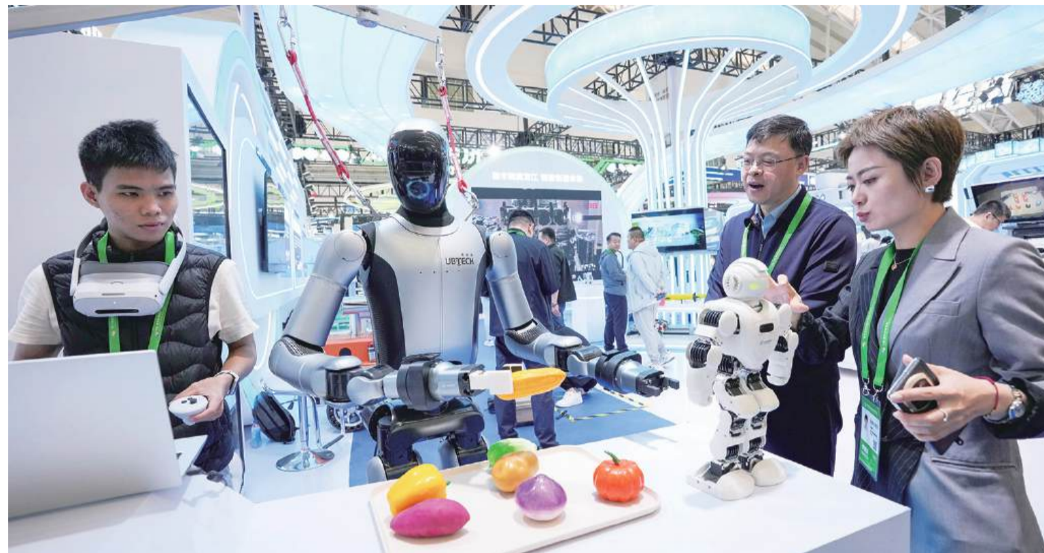
Visitors interact with a humanoid robot at the 10 th China-Russia Expo in Harbin, Heilongjiang Province, on Sunday. The event, which opened Sunday, features more than 1,500 enterprises from 46 countries across a 55,000-square-meter exhibition space.

Timed to coincide with major bilateral anniversaries, Putin's visit falls in the year