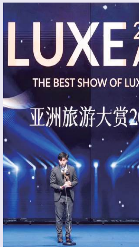
on Friday shows an unidentified awardee acknowledging a prize during the recent LUXE Asia 2026 in Shanghai.

engaged over 300 wedding planners and hoteliers from over 70 countries worldwide, the statement said, with MGTO engaging in and arranging various activities. ■