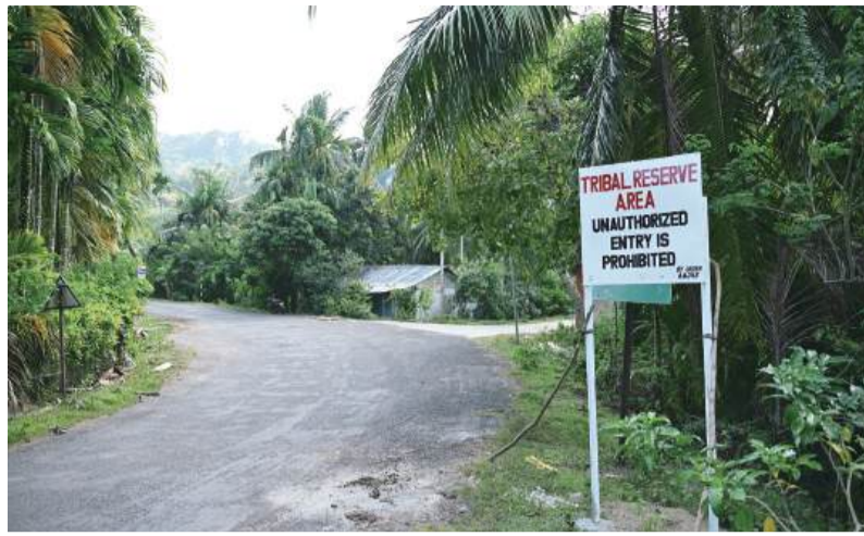
This photograph taken on March 26 shows a board marking a tribal reserve area on the outskirts of Campbell Bay at Great Nicobar island.

protection policy was well-intentioned – but that the modern world was not allowing the Sentinelese to be left on their own.