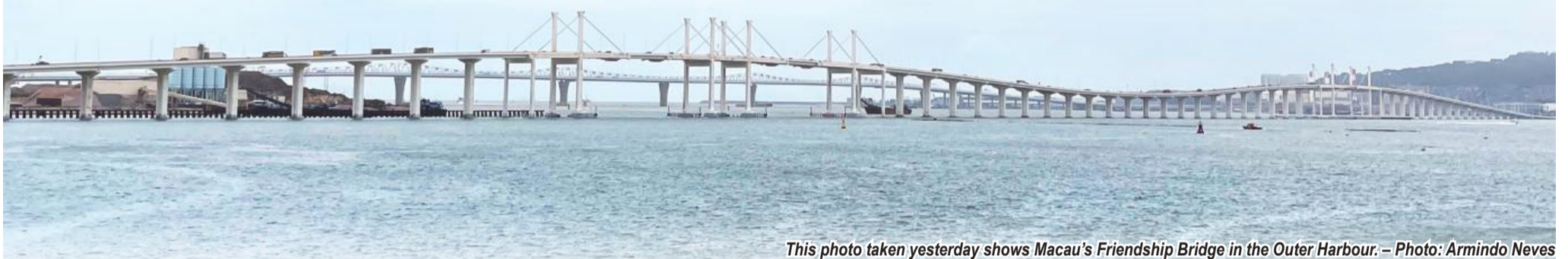
This photo taken yesterday shows Macau's Friendship Bridge in the Outer Harbour.