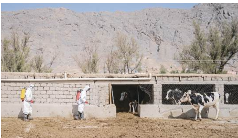
Afghanistan's Ministry of Agriculture, Irrigation and Livestock along with World Health Organisation (WHO) workers spray disinfectant to prevent Crimean-Congo haemorrhagic fever also known as Congo fever, at a cowshed in the Zor village of Kandahar yesterday.

"In the long run, self-contained people may not be able to survive in this competitive world," he said. "We'd at least be able to tell them, 'There are other people who are trying to disturb you'."