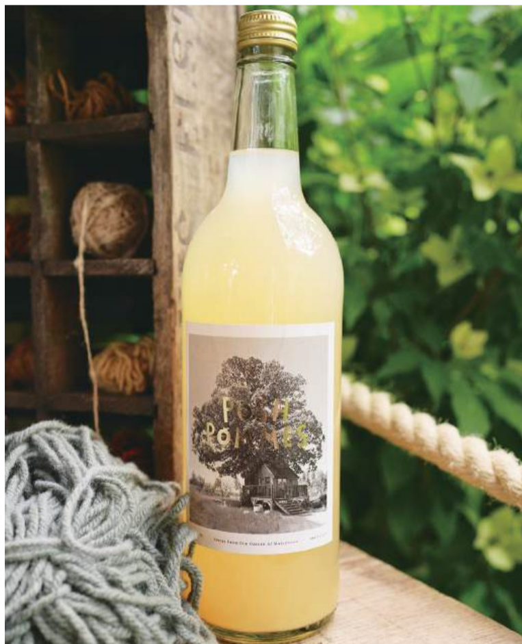
A bottle of Posh Pomes apple juice, by former England footballer Sir David Beckham, is pictured on press day at the 2026 RHS Chelsea Flower Show in London yesterday.