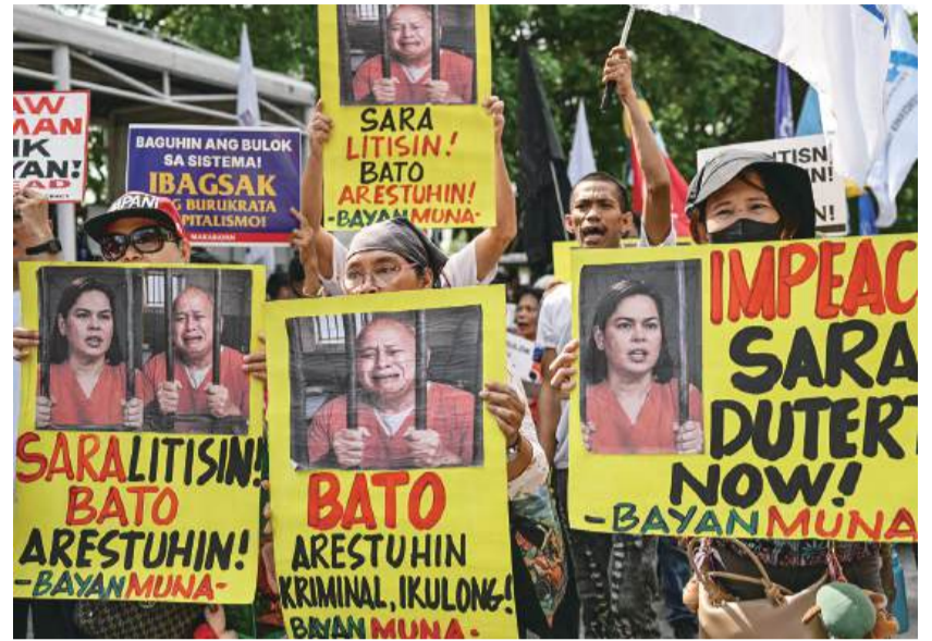
Protesters hold placards during a demonstration to call for the start of the impeachment trial against Philippine Vice-President Sara Duterte and the arrest of Philippine Senator Ronald "Bato" Dela Rosa outside the Senate of the Philippines in Pasay, Metro Manila yesterday.

MANILA – Philippine lawmakers were yesterday sworn in to serve as judges in the trial of impeached Vice President Sara Duterte, the second attempt since last year to force her from office.