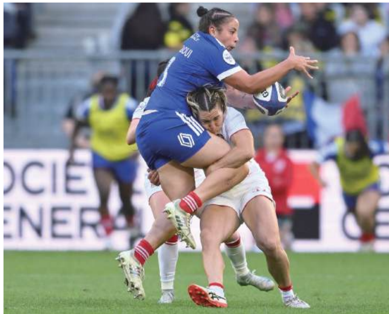
France's prop Assia Khalfaoui (left) is tackled by England's prop Mackenzie Carson during the Women's Six Nations international rugby union match between France and England at the Stade Atlantique in Bordeaux on Sunday.

the right corner before Bourdon Sansus' sniping break from a close-range scrum caught England napping on the hour mark.