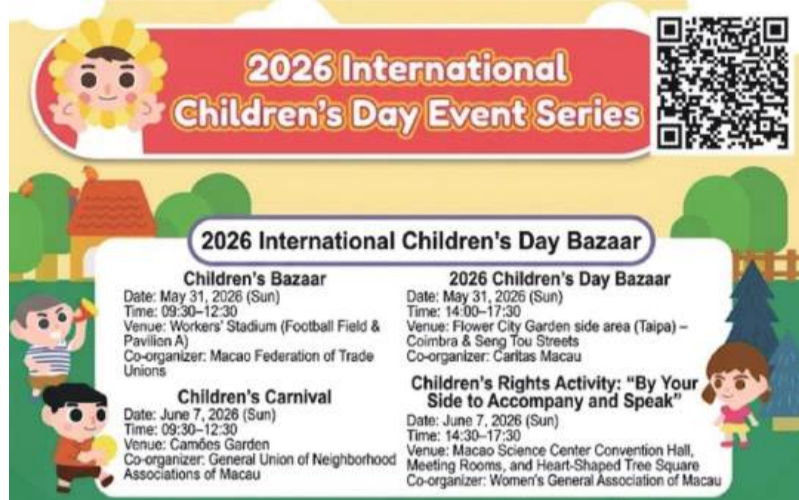
This poster provided by the Social Welfare Bureau (IAS) yesterday promotes the various activities marking the June 1 International Children's Day to be held across Macau around that time.

On International Children's Day itself on June 1, the statement noted