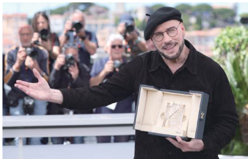
US director, screenwriter and writer John Travolta poses with an honorary lifetime achievement Palme d'Or award during a photocall of his "Propeller One-Way Night Coach" film at the 79th Cannes Film Festival in Cannes, southern France on Saturday.

Travolta, who starred in "Pulp Fiction" which won top prize in Cannes in 1994, appeared visibly emotional as he received a surprise life-time award at his film's premiere on Friday.