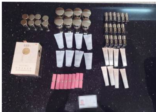
These two undated handout photos provided by Zhuhai Gongbei Customs yesterday shows cigars, cigarettes and cosmetics seized by its officers at the HZMB on May 4 and 7, respectively.