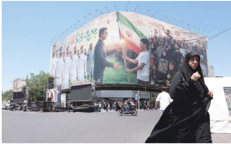
An Iranian woman yesterday walks past a huge billboard supporting Iran's national football team in the upcoming 2026 World Cup, installed on a building in Enghelab Square in Tehran. Iran's national football team was headed to Turkey yesterday to play a final friendly match and apply for visas to fly to the United States for the 2026 World Cup, Iranian media reported. (More details on p.13)

On the possibility of another military confrontation, Baqaei said Iran was "fully prepared for any eventuality".