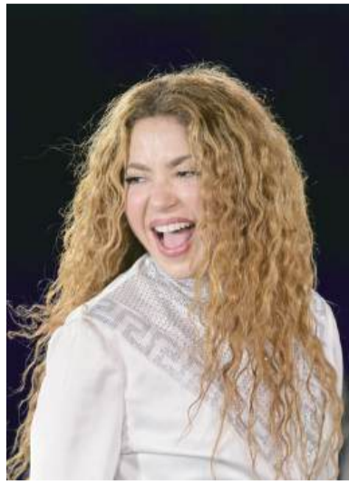
Colombian singer Shakira performs during her “Las Mujeres Ya No Lloran” (“Women No Longer Cry”) world tour in Buenos Aires on March 7, 2025.

The ruling comes as Shakira, 49, is set to wrap up her record-breaking