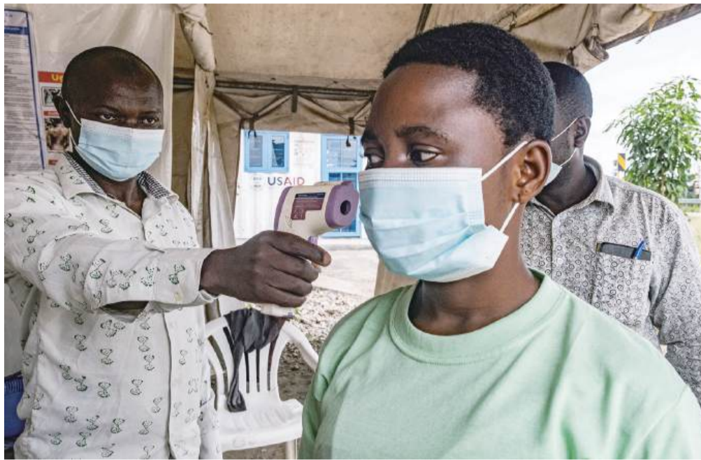
A border health official at the Busunga crossing between Uganda and the Democratic Republic of the Congo (DRC) checks a traveller's temperature using a contactless infrared thermometer in Bundibugyo, yesterday. Ugandan officials confirmed yesterday that a 59-year-old man from the DRC died in Kampala, the capital and largest city of Uganda, after being admitted earlier in the week. Tests showed the victim was infected with the Bundibugyo strain of Ebola, first identified in 2007.

Borders (MSF) said it was preparing a “large-scale response”, calling the rapid spread of the outbreak “extremely concerning”.