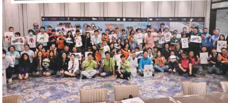
Participants, guests and representatives pose for a group photo during yesterday's "Creating Something Out of Nothing" activity.