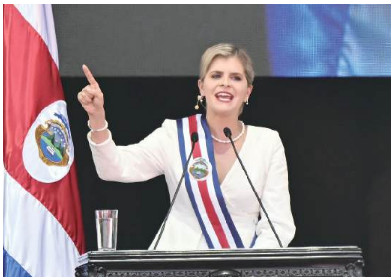
Costa Rica's new President Laura Fernández gestures as she speaks during her inauguration ceremony at the National Stadium in San José on Saturday.

“The Bukele model has no place in Costa Rica,” he said.