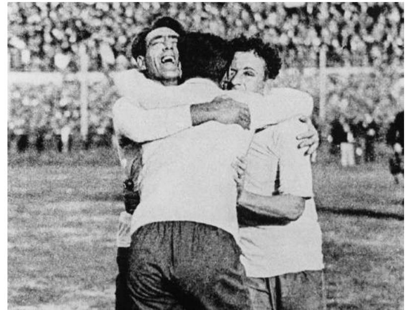
Uruguayans Pedro Cea, (from left to right) Hector Scarone and Hector Castro celebrate after Uruguay beat Argentina 4-2 in the first-ever World Cup final in Montevideo on July 30, 1930.

The expansion has allowed some of the world's smallest countries to qualify for the finals