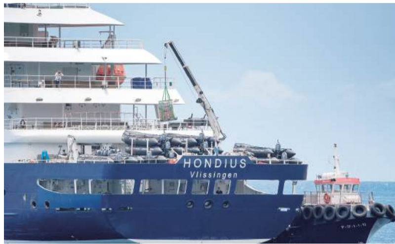
The Dutch flagged hantavirus-stricken cruise ship MV Hondius receives provisions from a boat in the port of Granadilla de Abona on the island of Tenerife in Spain's Canary Islands yesterday.

The US citizen’s tests in Cape Verde, where the MV Hondius stopped before reaching the Canary Islands, gave a result considered by the Americans as a “weak positive”, “although for us it was