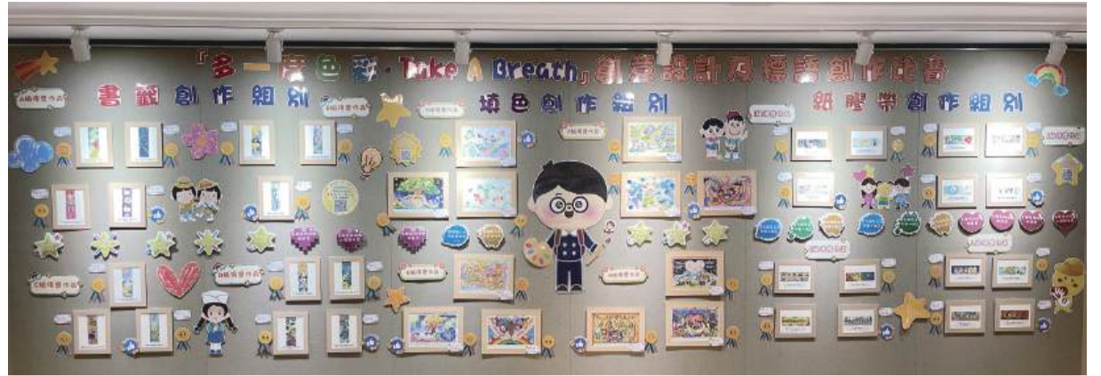
These photos taken yesterday show some of the "Spurring the Steeds for the Expedition" exhibits and award-winning works of the Macau Association for Intellectual Development Services' creative design and slogan competition "Take A Breath", on display at The Plaza Restaurant in Zape.