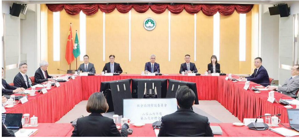
Secretary for Administration and Justice Wong Sio Chak (centre) chairs yesterday's closed-door meeting of the Standing Council on Social Concerted Action at Government Headquarters.

Currently, the number is six days for all private-sector employees with a minimum of one-year employment, regardless of their length of service. During its public consultation, the government was proposing to establish a system where the number of