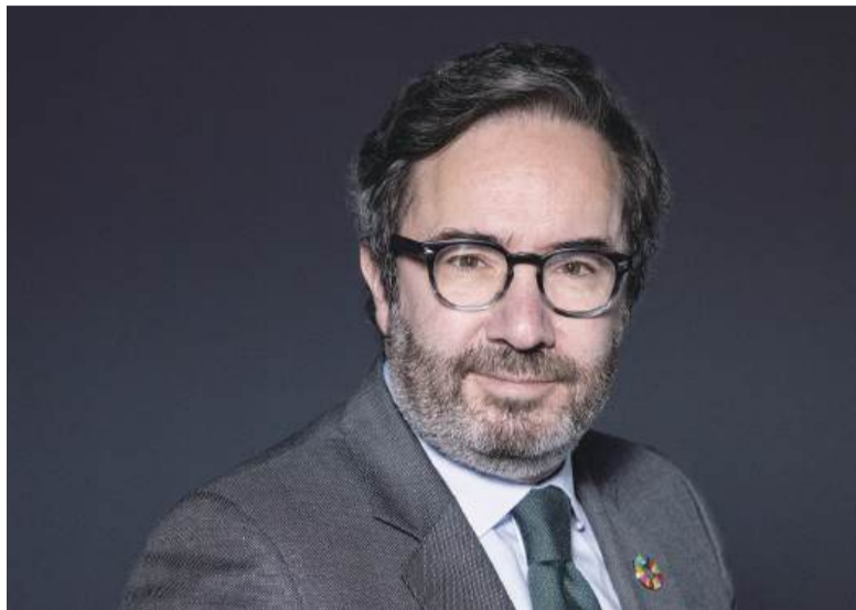
Executive Director of the United Nations Office for Project Services (UNOPS) Jorge Moreira da Silva, a Portuguese UN official in charge of the United Nations task force on the Strait of Hormuz, poses during a photo session in Paris yesterday.

A growing number of countries are showing support for the plan, he said, but the United States and Iran, as well as Gulf countries –