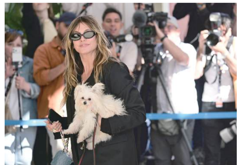
German model Heidi Klum arrives at the Grand Hyatt Cannes Hotel Martinez, on the eve of the opening ceremony of the 79th edition of the Cannes Film Festival in Cannes, southern France, yesterday.

The film features AI-generated footage of Lennon and his wife Yoko Ono – a major talking point