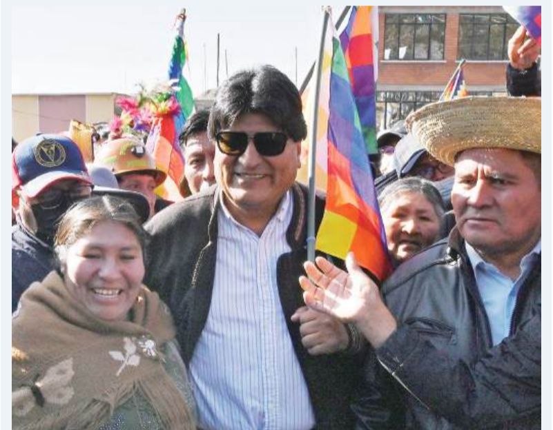
Bolivia's former president Evo Morales (centre) takes part in a protest march on August 25, 2022.

TARIJA, Bolivia – A Bolivian court yesterday suspended the opening of the trial of former president Evo Morales, accused of trafficking a minor, after the defendant failed to appear in court, an AFP journalist observed.