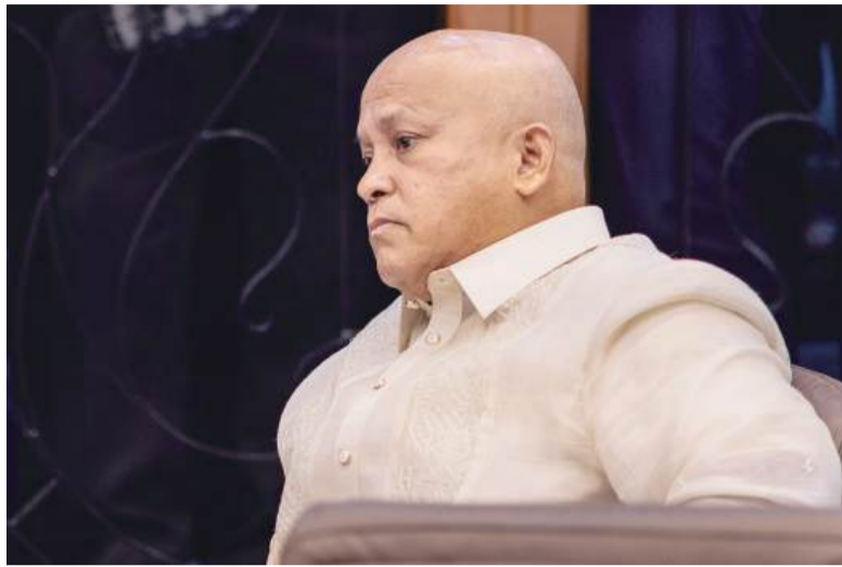
Philippines Senator Ronald Dela Rosa attends a plenary session at the Senate of the Philippines in Manila yesterday.

"They want to fly me to The Hague, to be surrendered there. So