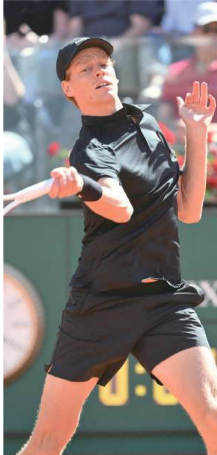
Italy's Jannik Sinner hits a return to Australia's Alexei Popyrin during the ATP Rome Open tennis tournament at Foro Italico in Rome yesterday.

ROME – Jannik Sinner breezed into the last 16 of the Italian Open yesterday after swatting aside Alexei Popyrin in straight sets 6-2, 6-0 and continuing his bid for a first title in Rome.