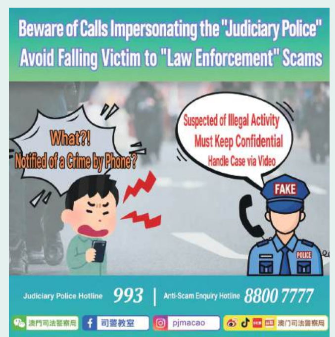
This poster released by the Judiciary Police (PJ) yesterday shows the modus operandi of fake police scams. The AI-translated English text was arranged by the Post.

Members of the public are also advised to use the Judiciary Police's anti-fraud mini-programme on WeChat to check risk levels. Those seeking assistance can call the anti-fraud enquiry hotline on 8800 7777 or the crime-reporting hotline on 993. ■