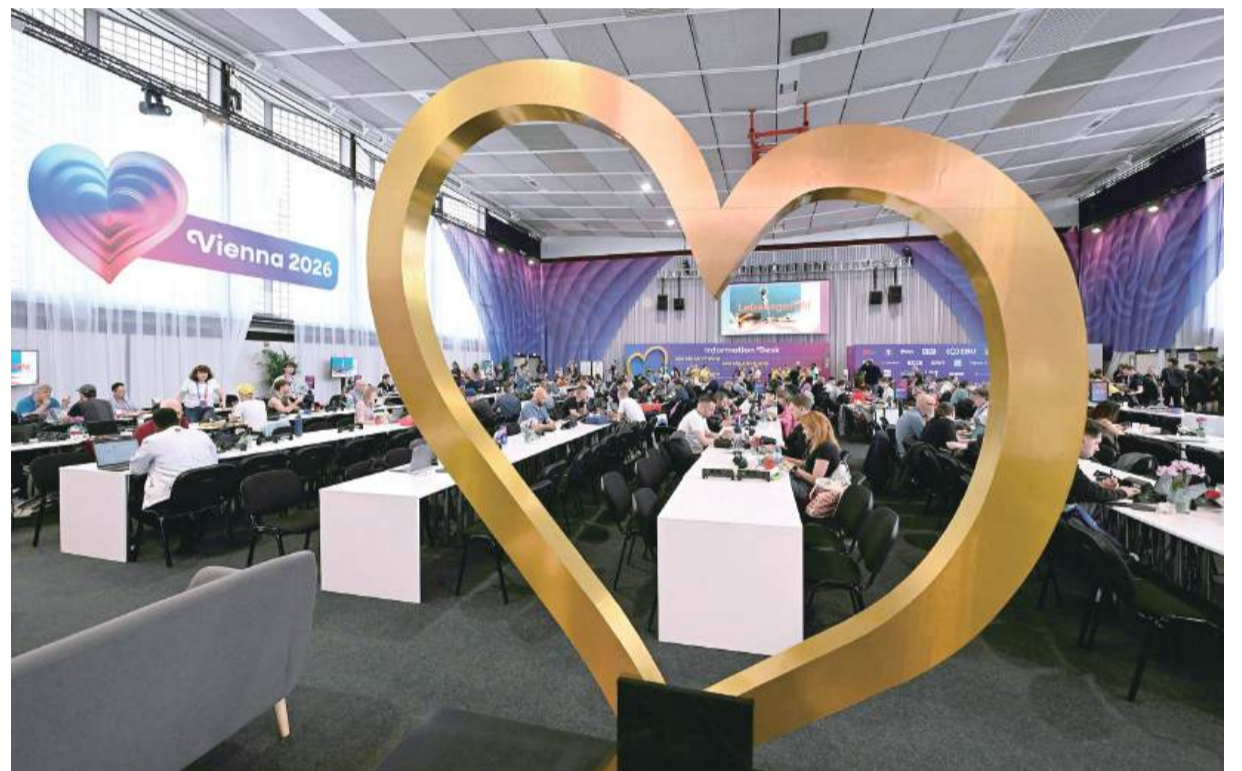
Journalists work at the media centre of the Eurovision Song Contest 2026 (ESC) in Vienna, Austria yesterday, on the eve of the first semi-final of this year's contest.

The Paramount film follows the Oscar- and Grammy-winning singer at her shows in Manchester.