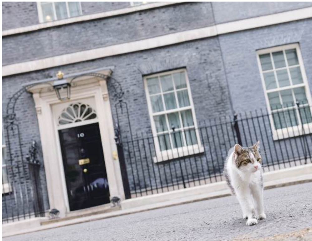
Larry the Downing Street cat walks outside 10 Downing Street, the official residence of Britain’s Prime Minister, currently Labour party leader Keir Starmer, in central London, yesterday. (More on p.16)

Starmer’s party lost control of the devolved Welsh parliament for the first time and failed to make up ground on the pro-independence