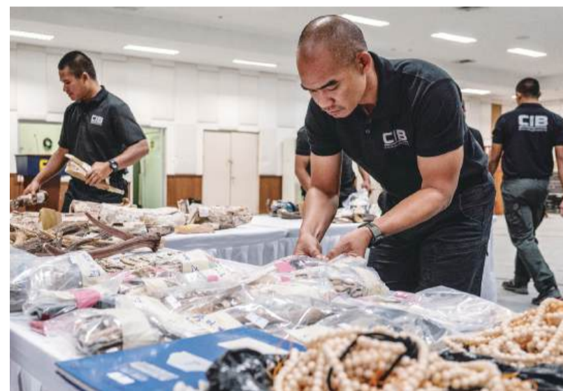
Pieces of seized ivory and other smuggled items are packed away after a press conference at the Central Investigation Bureau (CIB) in Bangkok yesterday.

illegal possession and trade of protected wildlife parts, which carries a maximum penalty of 10 years in prison, a million baht (US$30,800) fine, or both, according to a police statement.