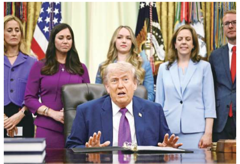
US President Donald Trump speaks during a Maternal Healthcare Event in the Oval Office of the White House in Washington, DC, yesterday.

“The lunatics want to fight till the end. You know, it’ll be a very quick fight.”