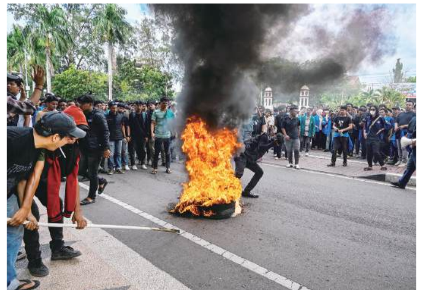
University students burn a tyre during a protest outside the Governor's office in Banda Aceh, Indonesia yesterday, against reforms to the public health insurance system. – AFP

Rights activists in Muslim-majority Indonesia have also filed a complaint with their country's attorney general, accusing the junta he led of atrocities including genocide against the Rohingya minority. – AFP