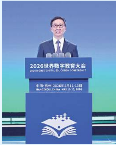
Vice President Han Zheng addresses the opening ceremony of the 2026 World Digital Education Conference in Hangzhou, capital of Zhejiang Province, yesterday.

He also emphasized deepening international exchanges and cooperation to jointly promote the healthy development of digital education.