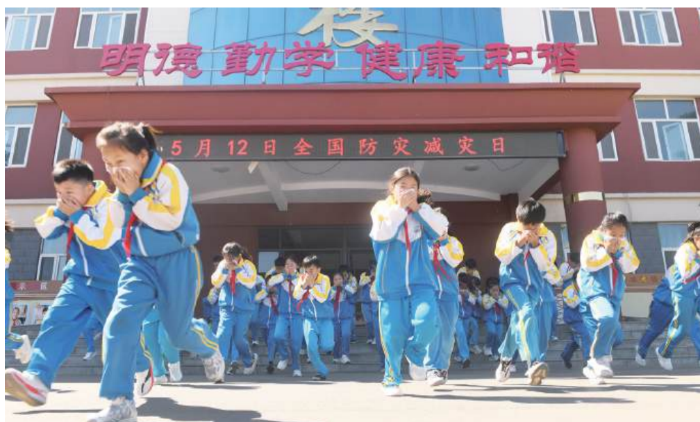
Students take part in a fire emergency evacuation drill in Xinle City, Shijiazhuang, Hebei Province, yesterday. A variety of activities were held across the country marking today's National Disaster Prevention and Reduction Day. – AFP

A main forum was also held on Monday. Other activities at the summit include a cross-Strait media professionals' forum, sub-forums, exhibitions, and exchange and visits. – Xinhua