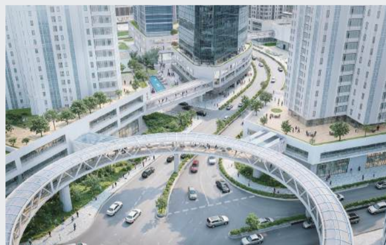
This artist's rendition in the plan's new version shows the future extension of the current Avenida de Guimarães skywalk into the currently undeveloped area, integrating with podium areas of future buildings there.