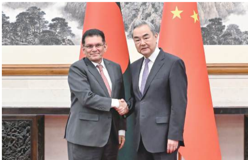
Foreign Minister Wang Yi (right), also a member of the Political Bureau of the Communist Party of China (CPC) Central Committee, shakes with Bangladeshi Foreign Minister Khalilur Rahman in Beijing yesterday. — Xinhua

"The pursuit of 'Taiwan independence' is a dead end and its days are numbered. Any new attempt Lai makes to advance his separatist agenda will only box himself further in. We urge those separatists to turn back from the wrong path and mend their ways sooner rather than later," he said. — Xinhua