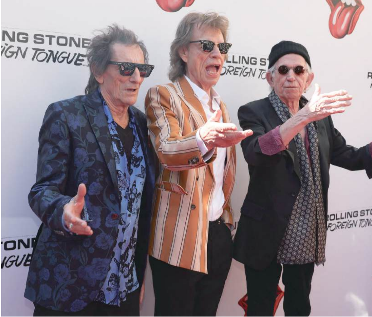
British musicians and members of The Rolling Stones, Ronnie Wood (left), Mick Jagger (centre) and Keith Richards pose upon arrival for “The Rolling Stones: In Conversation with Conan O’Brien” at Weylin in Brooklyn, New York on Tuesday.