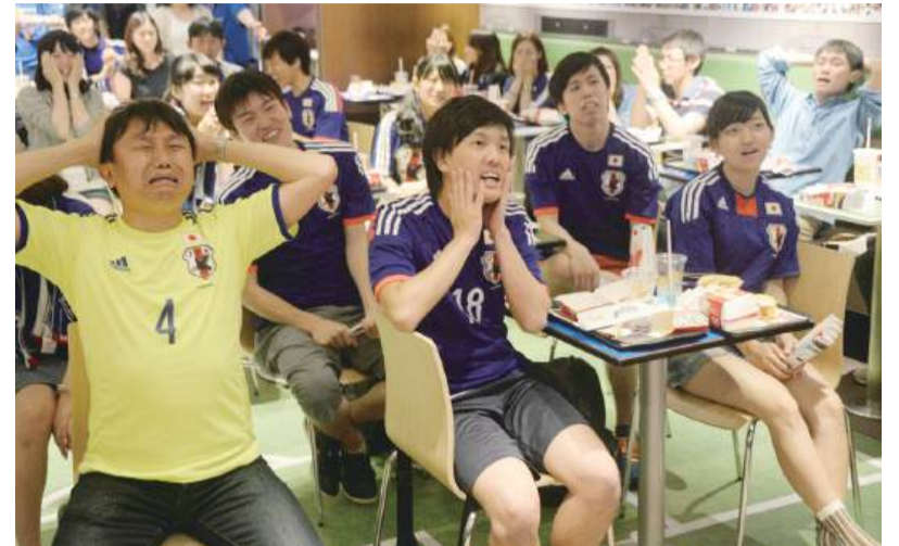
Japanese football fans react after the second goal by Ivory Coast against Japan as they watch TV during the group C first round match of the 2014 FIFA World Cup in Tokyo on June 15, 2014.

The country accounted for 49.8 percent of all hours of viewing on digital and social platforms globally during the Qatar 2022 World Cup, according to FIFA.