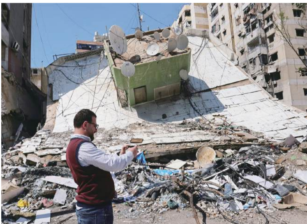
This photograph taken during a media tour organised by the Hezbollah’s media office shows a journalist documenting the destruction near Sayyid al-Shuhada complex in Beirut’s southern suburbs yesterday. Israel and Hezbollah have been trading accusations of violating the ceasefire agreement in force since April 17. Hezbollah has claimed responsibility for several operations targeting Israeli forces in southern Lebanon, as well as attacks on northern Israel.

BEIRUT – An Israeli strike in Lebanon’s eastern Bekaa valley killed four people yesterday, while the Israeli army said it struck Hezbollah targets in the south, after warning residents of a dozen towns to evacuate.