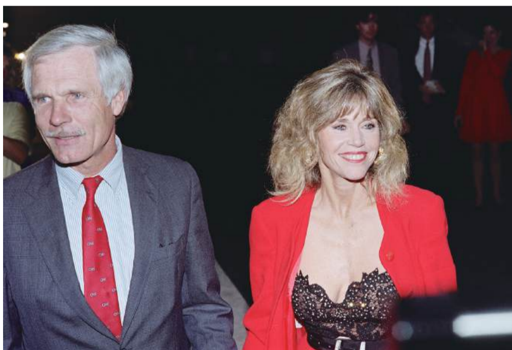
US actress Jane Fonda (right) arrives on September 30, 1992 with husband Ted Turner at the first Annual Environmental Awards in Hollywood.

Turner's television empire expanded beyond CNN and included TBS and TNT channels for sports and entertainment, Turner Classic Movies and Cartoon Network, among others.