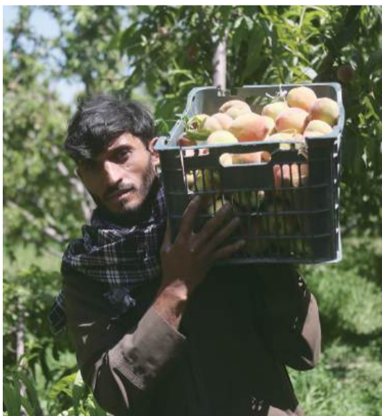
A farmer harvests peaches in an orchard in Nangarhar province, Afghanistan, on Sunday. Despite heavy rains and destructive floods across Afghanistan this year, the abundant precipitation has brought a silver lining for farmers as the harvest season shows stronger yields. In the fertile orchards of Surkh Rod district, eastern Nangarhar province, peach farmers were celebrating a bountiful season.

Addressing a conference in Islamabad, Sharif said that dialogue channels have remained open, and expressed confidence that the engagements between the United States and Iran would soon transform into lasting peace.