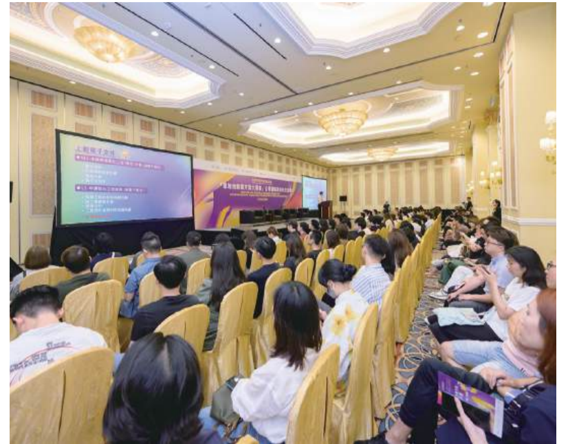
This undated handout photo provided by integrated resort operator Sands China yesterday shows participants taking part in an activity of the previous entrepreneurship recruitment programme.

The two key initiatives this year are "Entrepreneurship Recruitment Programme 2.0 for Rua das