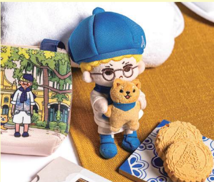
This undated handout photo provided by the Artyzen Grand Lapa Hotel Macau on Tuesday shows the Little Chin and Gatchai plush toy.

The statement said that families who book the "Macao Exploration Room Package" will receive the Little Chin amenities collection as a welcome perk. ■