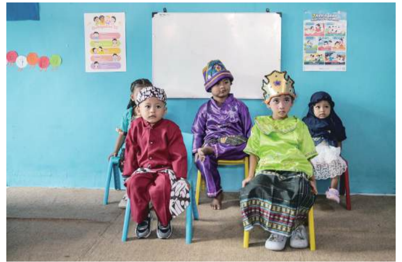
Children waiting their turn to receive the measles-rubella vaccine as part of the government's health programme to combat childhood diseases in Surabaya, Indonesia yesterday.

Trump signed off on a global 10-percent tariff on all countries in February, hours after the Supreme Court ruled many of his levies on imports were illegal. –AFP