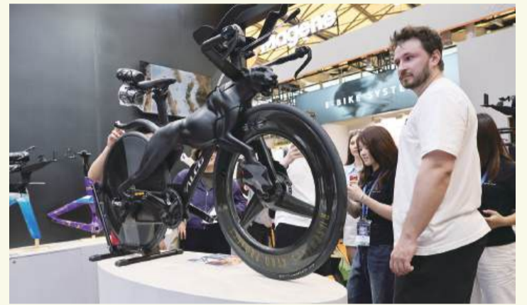
Visitors look at a bicycle displayed at the 2026 China International Bicycle Fair in Shanghai yesterday. The four-day 2026 China International Bicycle Fair kicked off at the Shanghai New International Expo Centre yesterday. – Xinhua

Analysts noted that the strong performance of the May Day consumption market fully demonstrates the considerable resilience and upgrading potential of China's domestic demand, which will provide solid support for the steady growth of the Chinese economy throughout the year. – Xinhua