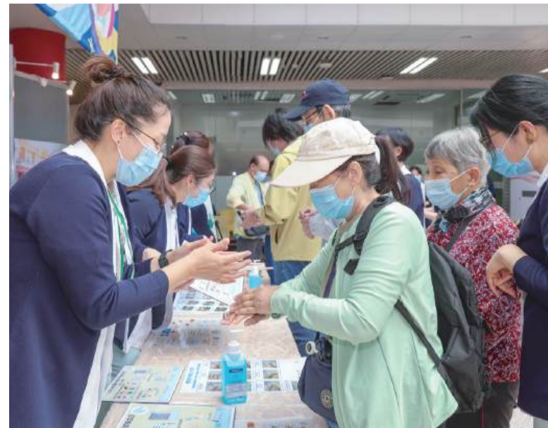
This handout photo provided by the Health Bureau (SSM) yesterday shows local residents actively participating in the activities during the World Hand Hygiene Day in the lobby of the public Conde de São Januário Hospital Centre on Tuesday.