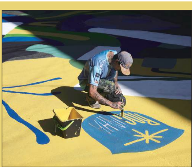
A local artist paints a street ahead of the FIFA World Cup 2026 in the Rocinha favela in Rio de Janeiro, Brazil, on Tuesday. — AFP

"Discussions in a few remaining markets regarding the sale of media rights for the FIFA World Cup 2026 are ongoing and must remain confidential at this stage," it said. — AFP