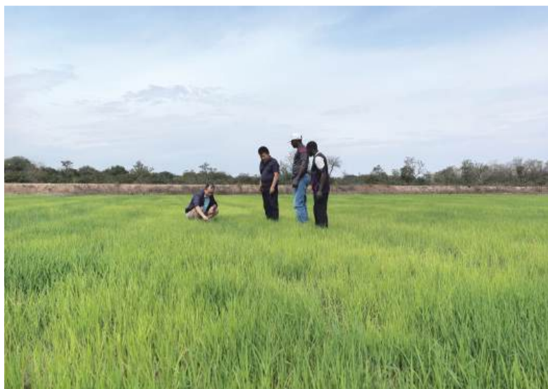
Chinese agricultural experts and local staff members check rice growth at Carantaba Farm in northeastern Guinea-Bissau, on February 11.

The mission has also donated seeds to communities in Bafatá