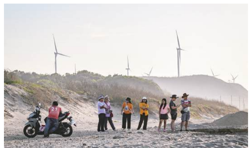
Wind turbines are pictured along the shore as seen from Bangui in the northern Philippines province of Ilocos Norte yesterday.

The police investigator said yesterday that the judge's "bereaved family is stricken by the incident" and requests privacy.