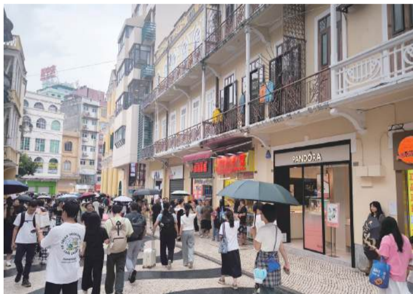
Visitors and residents alike throng Rua de S. Domingos near the S. Domingos Church on Monday, the fourth day of this year's five-day Labour Day holiday period.

According to daily immigration statistics released by the Public Security Police (PSP) during the period, Macau recorded 203,006 visitor arrivals on the first day of this year's five-day Labour Day holiday period, 247,729 on the second day, 182,216 on the third day, 157,214 on the fourth day, and 83,064 on the last day. Consequently, Macau recorded a total of 873,229 visitor arrivals during the five-day period, according to the PSP data. ■