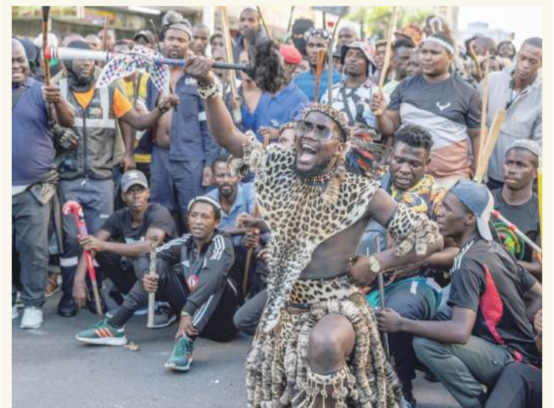
A demonstrators dressed in traditional garb gestures during a protest march against undocumented migrants in Durban, South Africa, yesterday. – AFP

The Israeli military says it has also lost 17 soldiers and a civilian contractor in the fighting. – AFP