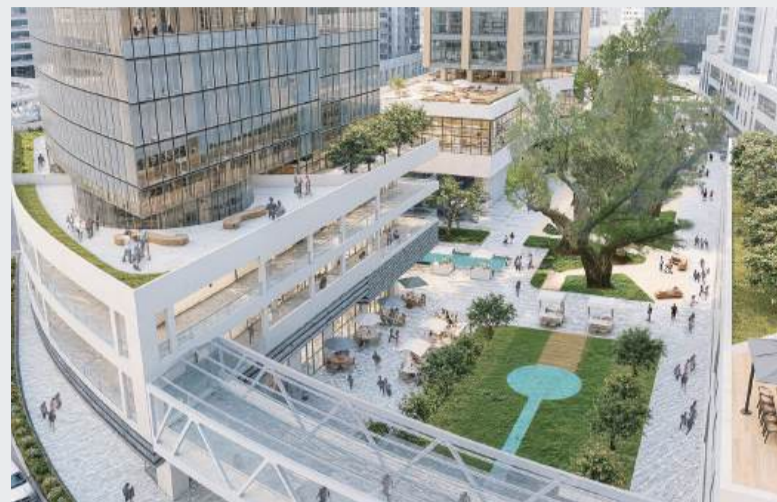
This artist's rendition in the revised version of the government's Taipa Northern Zone Urban Development Plan released yesterday shows the future park surrounded by future buildings where the current cluster of 10 officially protected old trees is situated.

The plan's new version notes that Macau's official urban master plan earmarks the area as a