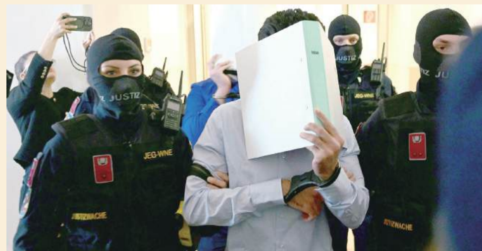
Two defendants in handcuffs are escorted to the courtroom by warrant officers as a trial starts at court in Wiener Neustadt, Austria, yesterday, over a plot to attack a Taylor Swift concert, originally scheduled for August 2024 in Vienna.

Swift later wrote on social media that “the reason for the cancellations filled me with a new sense of fear, and a tremendous amount of guilt because so many had planned on coming to those shows”.