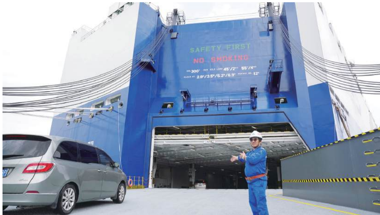
A staff member guides a vehicle onto the car carrier Glovis Leader in Guangzhou yesterday. The car carrier with a maximum capacity of 10,800 car equivalent units, described as the world's largest of its kind, was delivered yesterday.

Classified as a pure car and truck carrier, the ship is 230 meters long and 40 meters wide, with a design draft of 10.5 meters and a cruising speed of 19 knots. It features 14 vehicle decks and can carry a range of cargo, including electric vehicles, hydrogen-powered vehicles and heavy trucks.