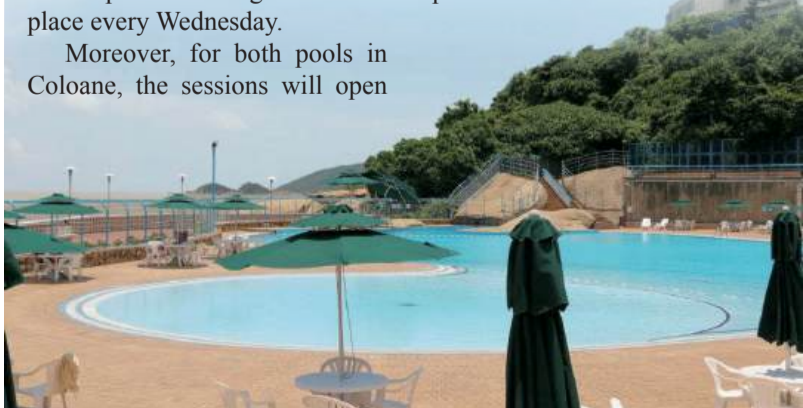
This undated handout photo shows the Cheoc Van Swimming Pool in Coloane.

The reopening of the outdoor pools aims to enhance public access to sports facilities, encouraging residents to stay active during the summer months, the statement said, adding that the pools will be open until October 31. ■