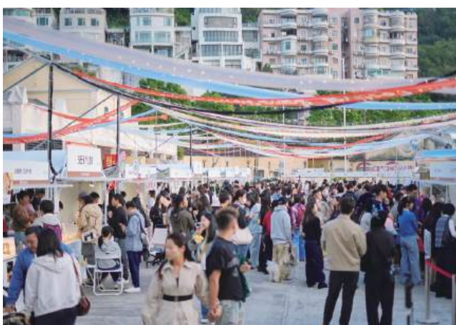
This file photo shows crowds attending last November's "Barra Slow Festival" at Outdoor Plaza in Barra.