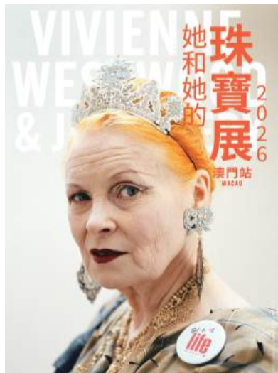
This poster recently provided by SJM Resorts promotes the Vivienne Westwood & Jewellery exhibition at Grand Lisboa Palace (GLP) in Cotai.

"With a design record spanning over 50 years, Vivienne Westwood is now recognised as a global brand and Westwood herself is