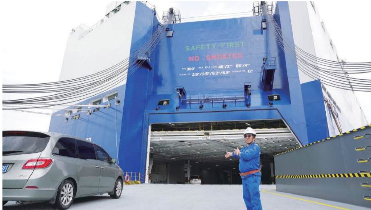
A staff member guides a vehicle onto the car carrier Glovis Leader in Guangzhou yesterday. The car carrier with a maximum capacity of 10,800 car equivalent units, described as the world's largest of its kind, was delivered yesterday.

Classified as a pure car and truck carrier, the ship is 230 meters long and 40 meters wide, with a design draft of 10.5 meters and a cruising speed of 19 knots. It features 14 vehicle decks and can carry a range of cargo, including electric vehicles, hydrogen-powered vehicles and heavy trucks.