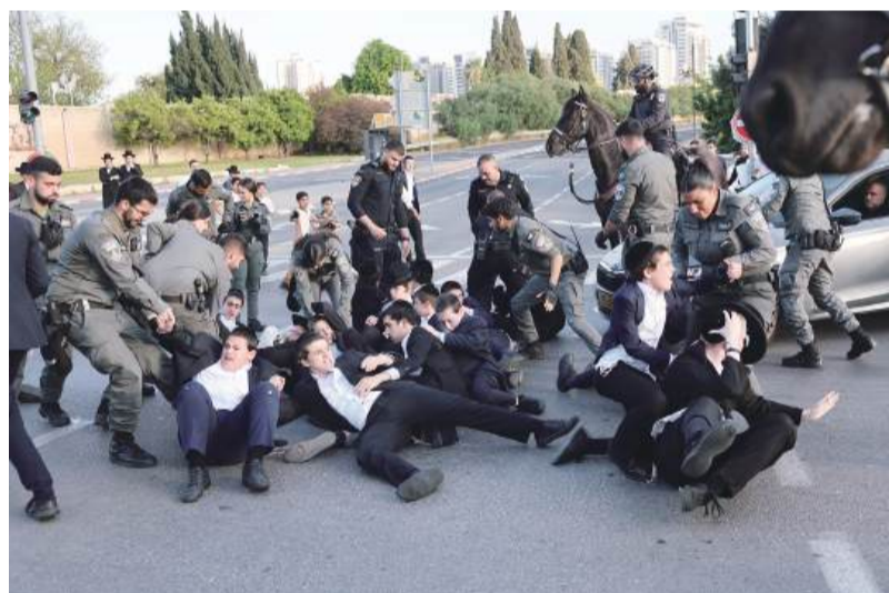
Israeli police disperse ultra-Orthodox Jews, who are largely exempt from military service, protesting against conscription by blocking a highway near the centre of the Israeli city of Bnei Brak yesterday. Israel’s Supreme Court on Sunday ordered the government to cut financial benefits to ultra-Orthodox Jews who refuse to answer conscription call-ups. There is a long-standing exemption from compulsory national service for ultra-Orthodox men who engage in full-time religious study, which dates back to Israel’s founding in 1948. – AFP

“Out of concern for your safety, you are required to evacuate your homes