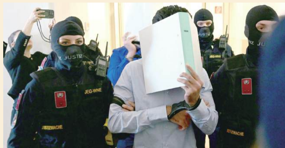
Two defendants in handcuffs are escorted to the courtroom by warrant officers as a trial starts at court in Wiener Neustadt, Austria, yesterday, over a plot to attack a Taylor Swift concert, originally scheduled for August 2024 in Vienna.

Swift later wrote on social media that “the reason for the cancellations filled me with a new sense of fear, and a tremendous amount of guilt because so many had planned on coming to those shows”.