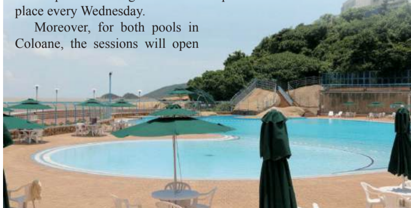
This undated handout photo shows the Cheoc Van Swimming Pool in Coloane.

The reopening of the outdoor pools aims to enhance public access to sports facilities, encouraging residents to stay active during the summer months, the statement said, adding that the pools will be open until October 31. ■