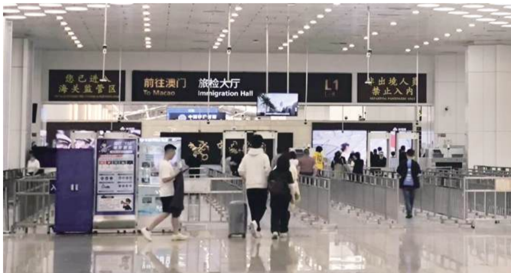
This photo taken early this month shows border crossers at the Hengqin border checkpoint.