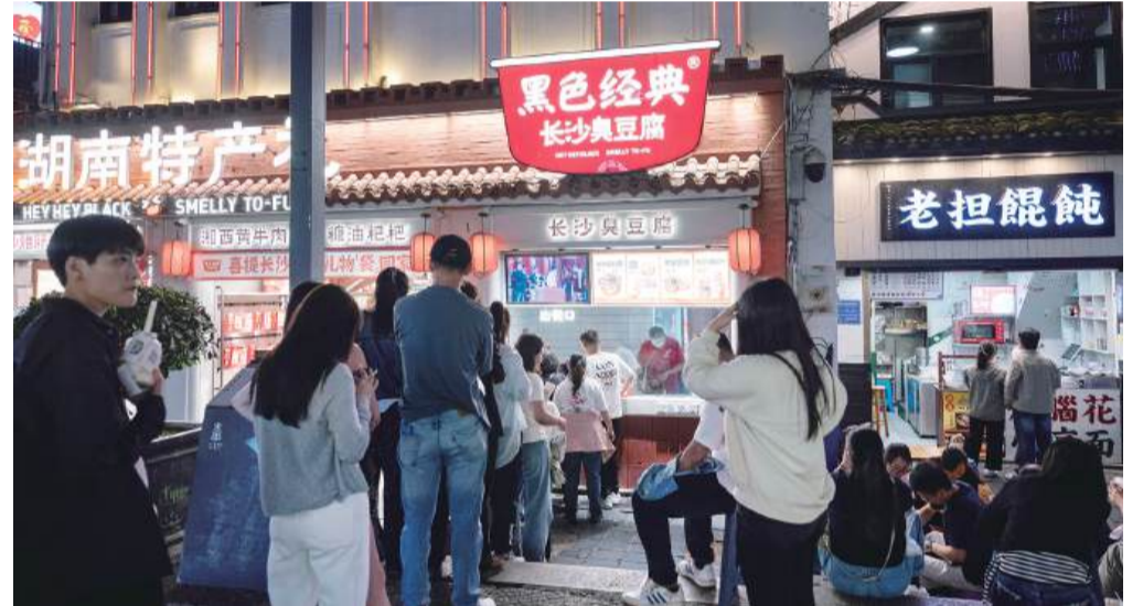
Tourists queue to taste local delicacies in the old quarters of Changsha, capital of Hunan Province, on Saturday. Changsha at night features diverse modes of business: live-streaming, band performances, period costume photography and night-market cuisine, all contributing to the nighttime economic vitality of the city. – Xinhua

The complete reunification of China is unstoppable. The one-China principle is where the arc of history bends and public opinion trends, and upholding it is clearly the right thing to do. Such consensus will gain even more robust support through concrete actions from the international community. – Xinhua