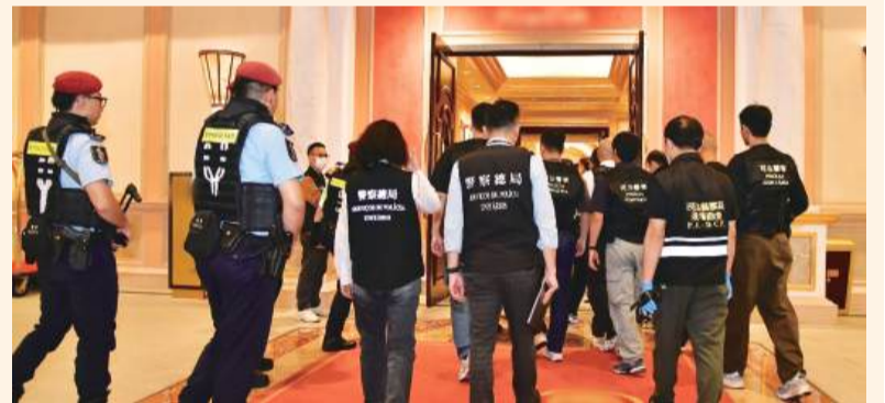
This file photo released in November last year shows police officers conducting an operation to prevent and combat crime at a local casino in October last year.

According to the statistics announced on the GSS website, the