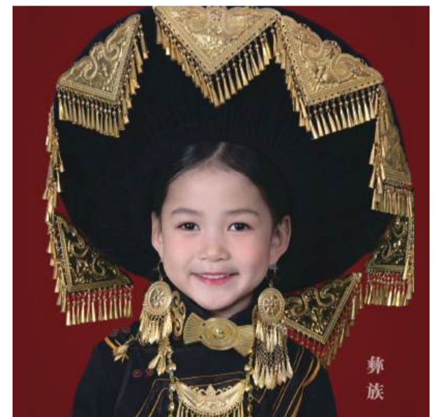
A young model showcases the ornate gold headwear and jewellery of the Yi people from Guizhou's "Village T". (file photo)

The festival debuts the "Asian Tea Culture Market," "Intangible Cultural Heritage Market," and Guizhou's "Village T" ethnic fashion showcase. Special highlights include the "Water Mirror: Tea Tasting Ceremony" guided by tea masters, the chef-driven "Infuse & Indulge: Culinary Tea Ceremony," and two bamboo installations – the "Tea Pavilion" and "Tea Performance Stage" – designed by Macau-