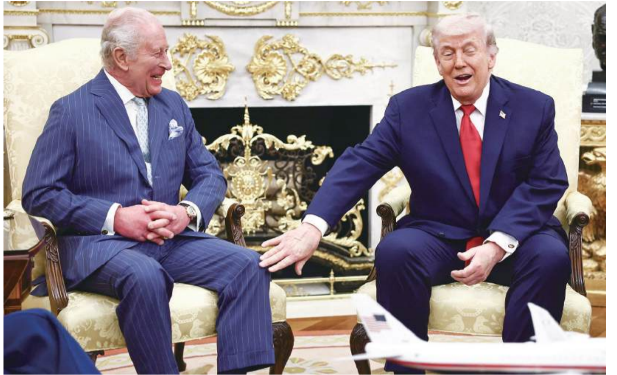
US President Donald Trump (right) shares a lough with Britain's King Charles III in the Oval Office of the White House in Washington, DC, yesterday.