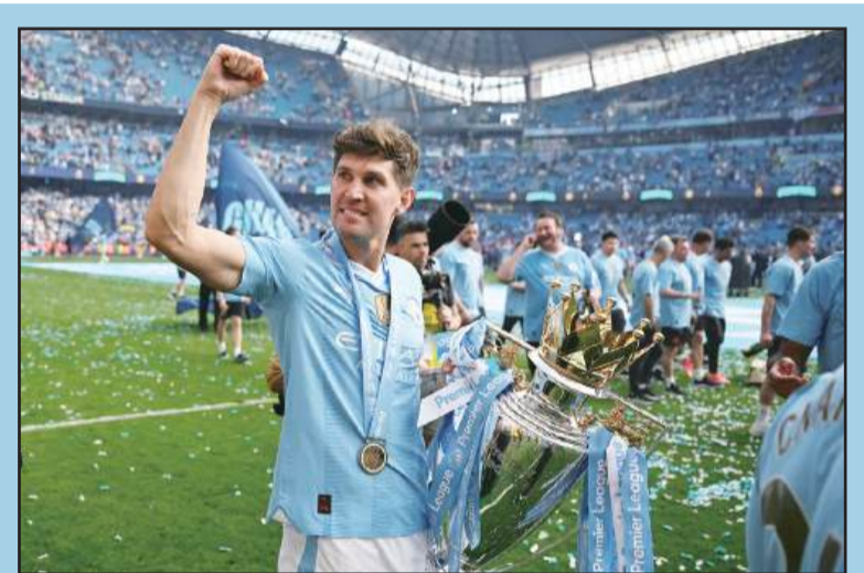
Manchester City's English defender Stones holds the Premier League trophy during the presentation ceremony following the English Premier League match against West Ham United at the Etihad Stadium in Manchester, north west England, on May 19, 2024.

Milan are on course to return to the Champions League, with Massimiliano Allegri's team third in Italy's top flight, six points ahead of fifth- and sixth-placed Como and Roma ahead of Sunday's trip to Sassuolo. —AFP