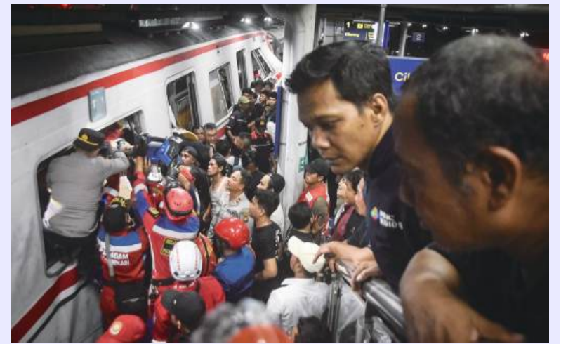
Rescuers work at the site of a train collision after a passenger train locomotive pierced through the rear car of a commuter train at Bekasi Timur station in Bekasi, West Java, Indonesia yesterday.

JAKARTA – The death toll from Monday night’s collision between two trains in Bekasi, West Java, Indonesia, has risen to 15, with dozens of others injured, police said yesterday.