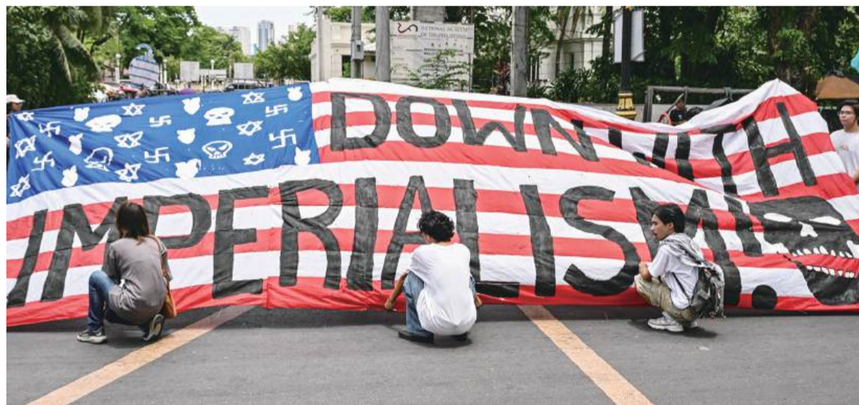
People take part in a protest against the US-Israel military actions in Iran, in Manila yesterday. –AFP

An investigation into the cause of the incident is being conducted by the rail operator and the National Transportation Safety Committee. –Xinhua