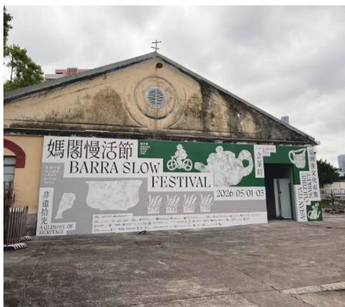
This photo taken yesterday shows preparations for the upcoming Barra Slow Festival.