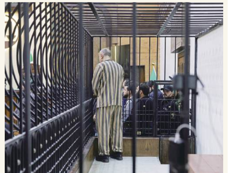
The former head of political security in south Syria’s Daraa province, Atif Najib, attends his first trial session at the Palace of Justice, in Damascus yesterday. – AFP

Syria’s new authorities have repeatedly vowed to provide justice and accountability for Assad-era atrocities. – AFP