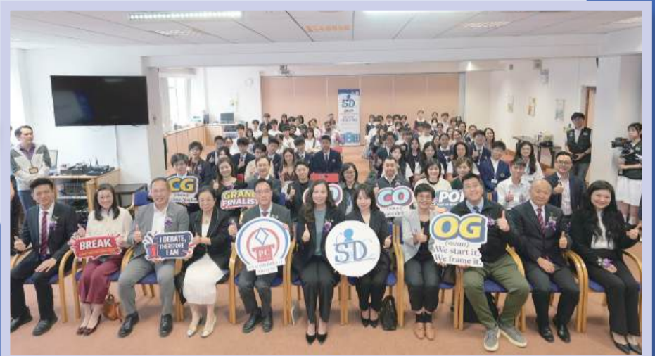
The guests and participants pose for a group photo at the opening ceremony last Saturday.

*STEAM is an educational acronym that represents five key disciplines used together to guide student inquiry, dialogue, and critical thinking. The acronym stands for: S – Science; T – Technology; E – Engineering; A – Arts; M – Mathematics. – Gemini