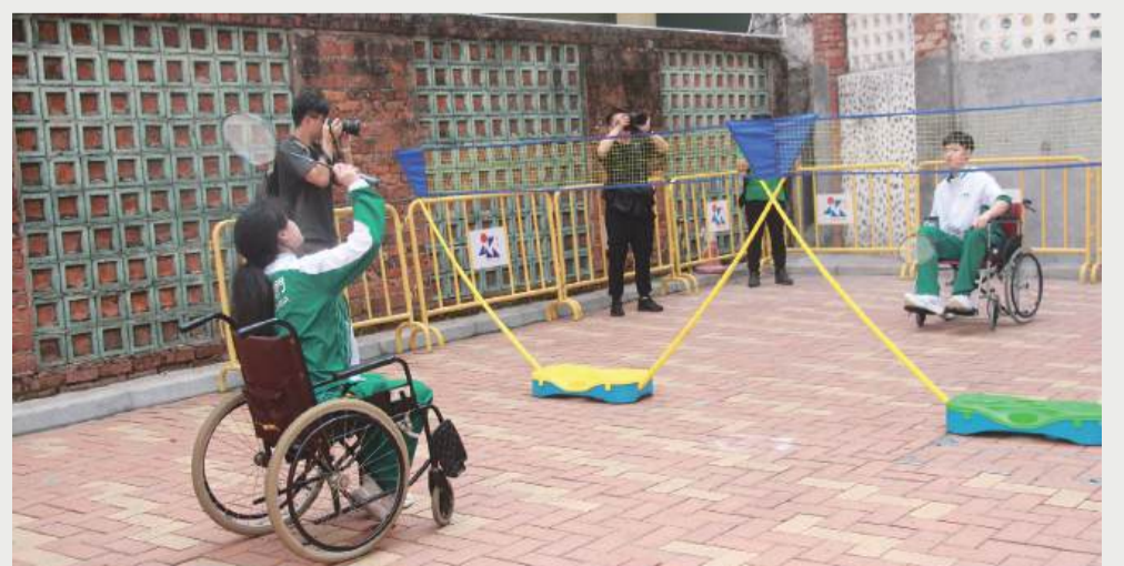
Young athletes compete in a wheelchair badminton game during yesterday's "Dynamic Community – 2026 Sports Day for People with Disabilities" in Praça dos Lótus in Ilha Verde district.

Looking ahead, he expressed hopes to further develop disability sports in Macau. "We hope to use this as a starting point to organise more sporting activities and support athletes with disabilities to take part in competitions, gradually building the development of disability sports". ■