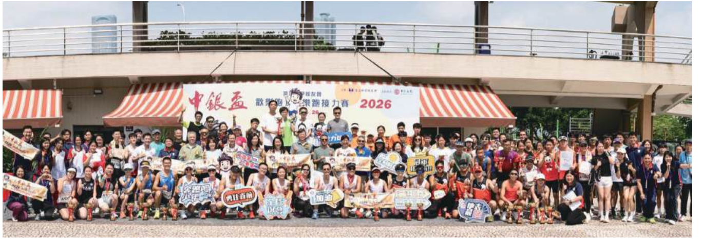
Participants in Hou Kong Middle School's "fun run" pose for a group photo in the Taipa Waterfront Leisure Area yesterday.