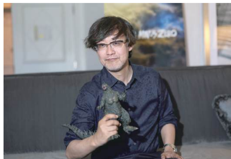
Japanese filmmaker and visual effects supervisor Takashi Yamazaki poses during a photo session during Cinemacon on April 14, 2026 in Las Vegas, Nevada.

The director added that audiences will be able to identify with the sheer effort required to summon the strength to recover and find the will to go on living.