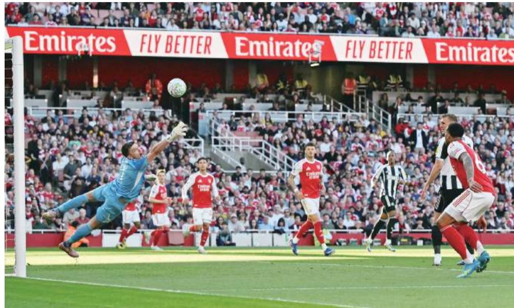
Newcastle United's English goalkeeper Nick Pope dives but concedes the opening goal from Arsenal's English midfielder Eberechi Eze (unseen) during the English Premier League match between Arsenal and Newcastle United at the Emirates Stadium in London on Saturday.

Arsenal could increase their advantage over City to six points before the Blues play again, when they face Fulham next week.