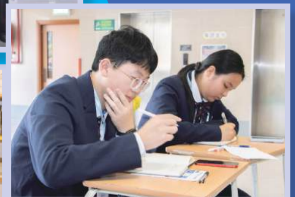
Students are preparing for their debate.