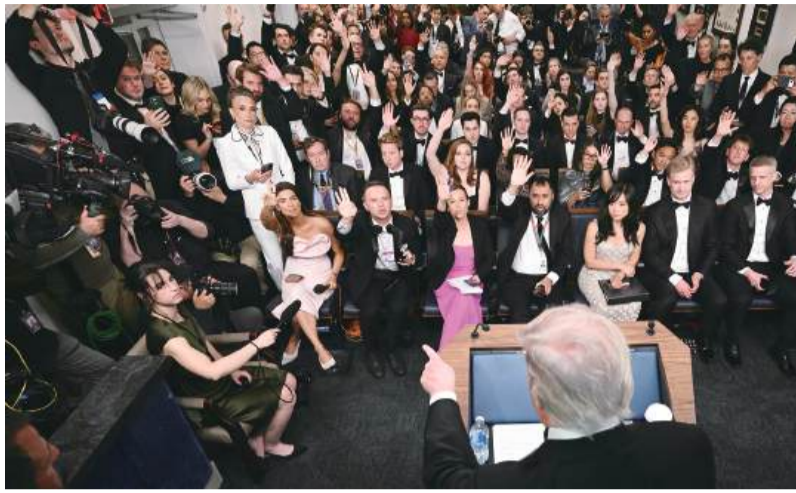
US President Donald Trump takes questions during a press briefing in the Brady Briefing Room at the White House in Washington, DC, shortly after a shooting incident at the White House Correspondents' Dinner on Saturday.

"We believe that he travelled by train from Los Angeles to