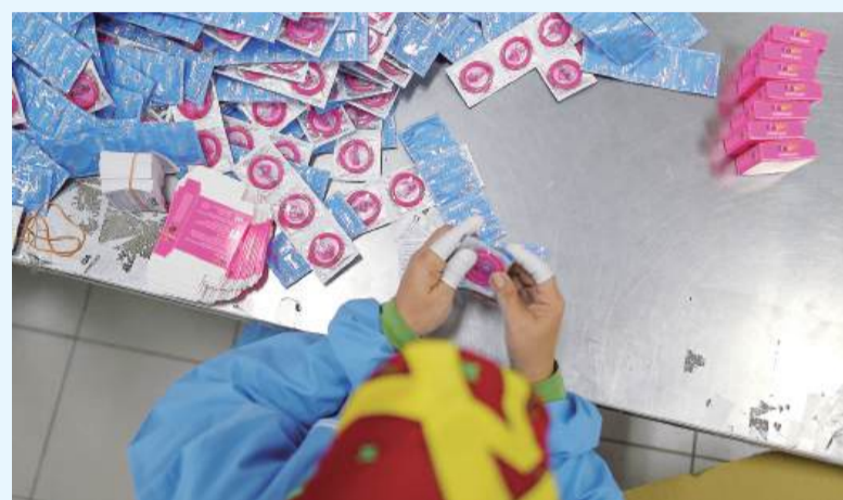
In this picture taken September 20, 2017, a worker packs condoms at the Malaysian condom-maker Karex Industries headquarters in Port Klang.