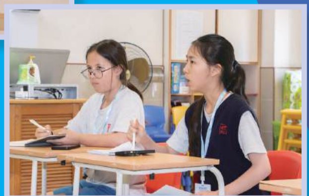
Students from Pui Ching Middle School speak during the debate.