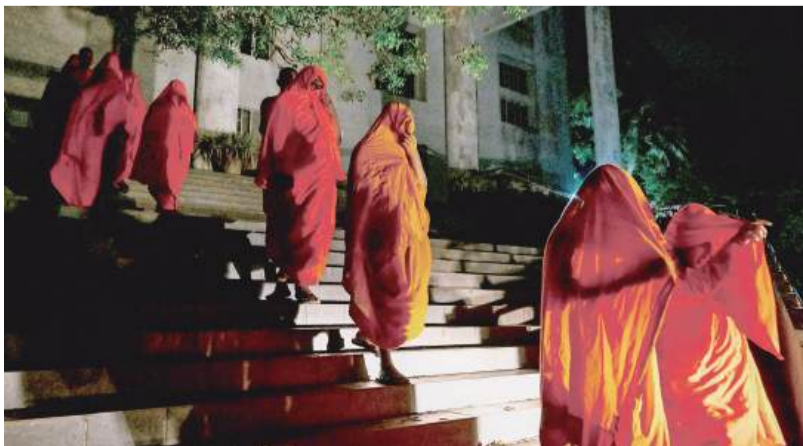
Sri Lankan monks are taken to a detention centre in Colombo, Sri Lanka after a court hearing in Negombo yesterday.

Sri Lankan authorities have also made several detections of large hauls of heroin and other narcotics smuggled in via small fishing boats in recent years.