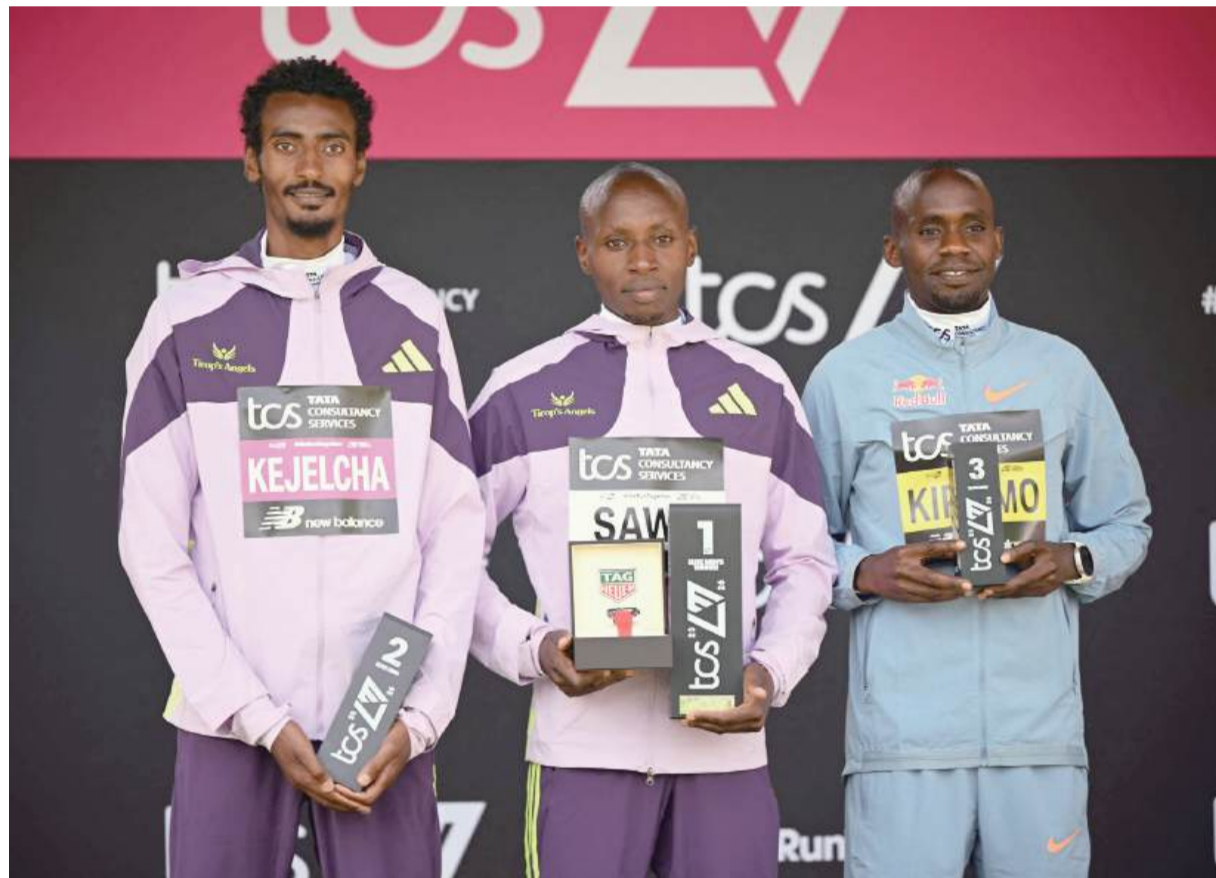
Second place, Ethiopia's Yomif Kejelcha (left), winner, Kenya's Sebastian Sawe (centre) and third place, Uganda's Jacob Kiplimo pose with their trophies at the presentation ceremony for the men's elite race at the 2026 London Marathon in central London yesterday.