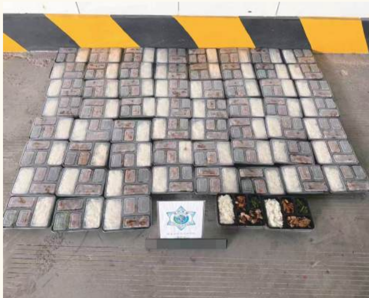
This undated handout photo provided by the Macau Customs Service on Saturday shows 51 kg of cooked food in lunch boxes seized by its officers at the Hengqin border checkpoint.