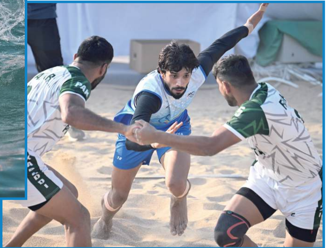
Neeraj (centre) of India competes during the Beach Kabaddi men's semifinal match against Pakistan at the 6th Asian Beach Games in Sanya, Hainan Province, yesterday.