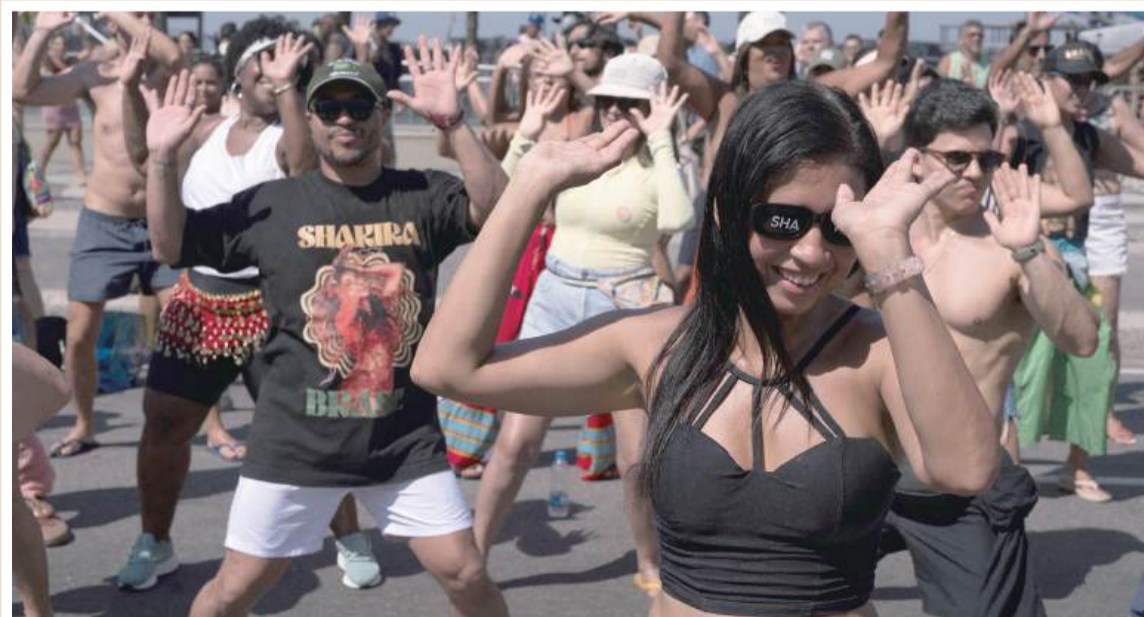
Fans of Colombian singer Shakira learn to dance the choreography of her song "Waka Waka (This Time for Africa)" at the Copacabana promenade, in front of the stage where she will perform in one week, in Rio de Janeiro yesterday.