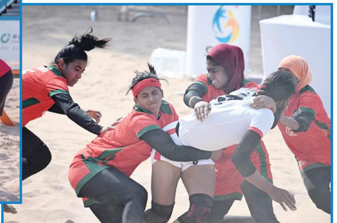
Players compete during the Beach Kabaddi Women's Team Group B match between Nepal and Bangladesh at the 6th Asian Beach Games in Sanya, Hainan Province, yesterday.