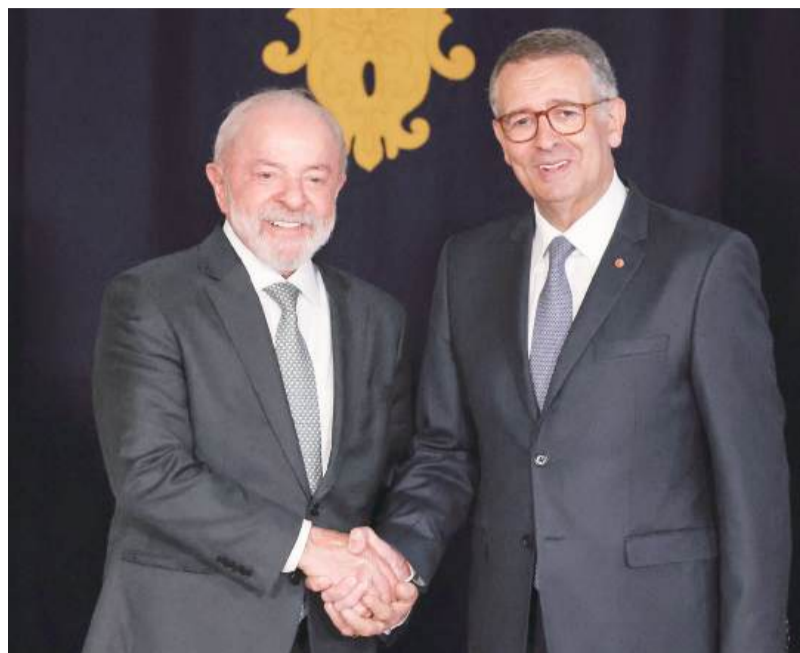
Portuguese President António José Seguro (right) shakes hands with his Brazilian counterpart Luiz Inácio Lula da Silva at Belém Palace in Lisbon moments before their meeting last Tuesday.

“We cannot allow the world to bow down to the behaviour of a president who believes that he can impose tariffs on products, punish countries, and wage war by email