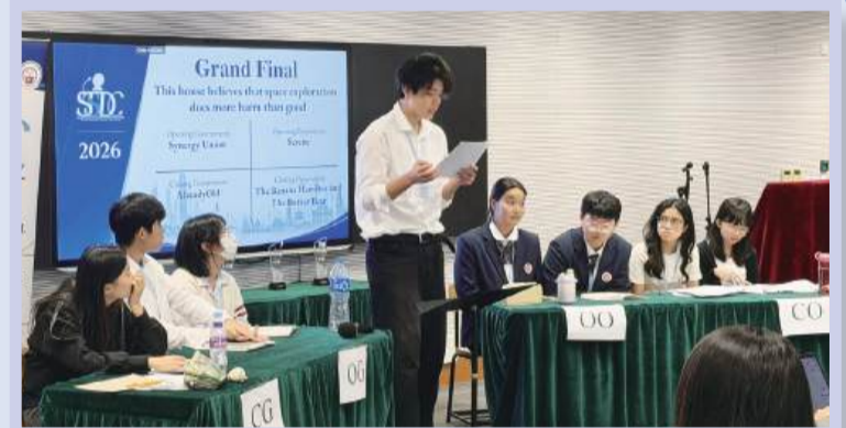
Students are debating in the final round.