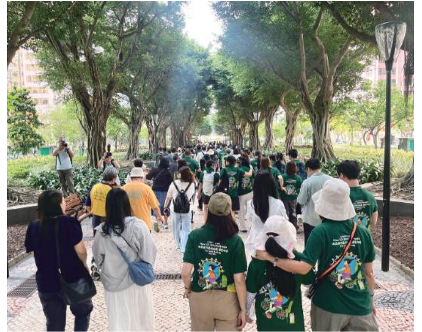
Activities including the Green Walkathon take place for Macau IC2 Association's World Earth Day initiative.