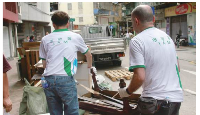
This undated and unlocated handout photo released by the Municipal Affairs Bureau (IAM) on Friday shows workers in charge of clearance and transportation of solid waste in streets and neighbourhoods assist in the clearance of rubbish.

Before the issuance of Tropical Cyclone Signal No. 8, the bureau would coordinate with the waste management