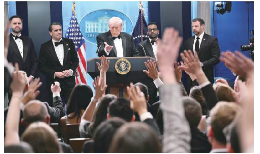
US President Donald Trump (centre) takes questions during a press briefing in the Brady Briefing Room at the White House in Washington, DC, shortly after a shooting incident at the White House Correspondents' Dinner on Saturday.