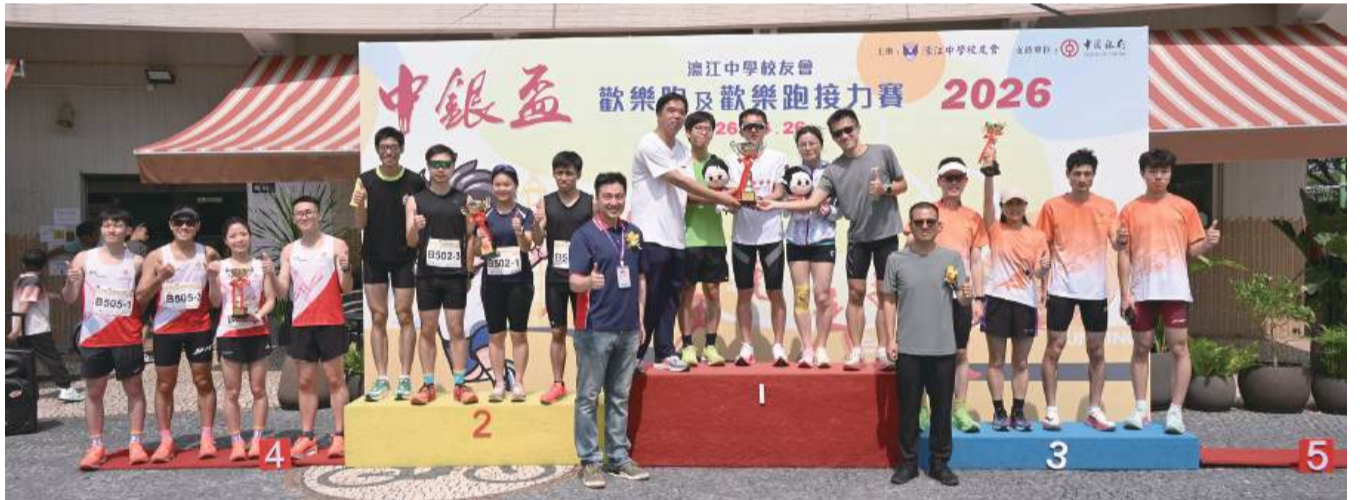
These three photos taken during yesterday's Hou Kong Middle School "fun run" show various aspects of the one-day activities.