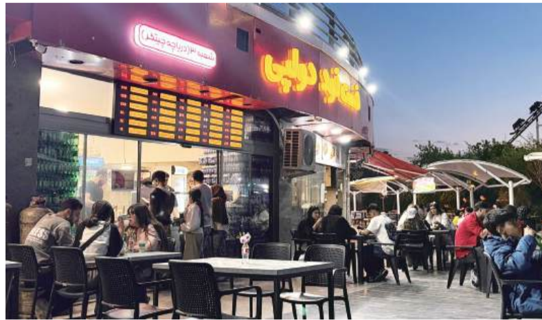
Iranians stop for something to eat and drink near Chitgar Lake, an artificial recreational lake and park officially known as the Lake of the Martyrs of the Persian Gulf, in northwestern Tehran, yesterday. Iran’s foreign minister returned to Islamabad, Pakistan, for more consultations yesterday, as international mediators tried to keep peace talks on track despite the US President calling off his envoys’ planned trip.

trip meant a return to open hostilities, Trump said: “No, it doesn’t mean that.”