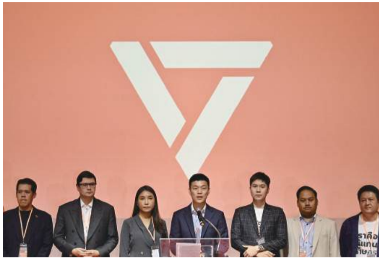
Natthaphong Ruengpanyawut (centre), member of parliament and leader of Thailand's opposition People's Party, speaks during a press conference alongside fellow party MPs accused of proposing amendments to the lese-majeste law, in Bangkok on Friday.

At a news conference after Friday's ruling, Natthaphong said the legal reform effort was "never intended to undermine the democratic system under the monarchy".