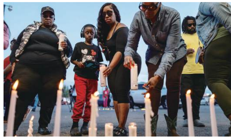
Mourners attend a candlelight vigil on Sunday in Shreveport, Louisiana, where eight children were killed and two women were wounded during a domestic violence shooting earlier that day, according to local authorities.

individual that fired gunshots at these locations," Bordelon said, calling the incident a "domestic disturbance."