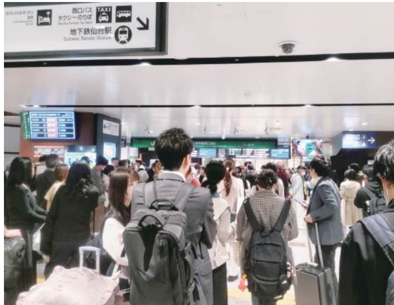
This photo shows a general view of a crowded railway station as the Shinkansen services are suspended after an earthquake hit northern Japan, in Sendai city of Miyagi Prefecture yesterday.

There were no immediate reports of serious injuries or significant damage, Chief Cabinet Secretary Minoru Kihara told a news conference.