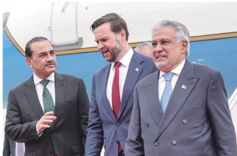
US Vice President JD Vance (centre) speaks with Army Chief and Field Marshal Syed Asim Munir (left) and Pakistan's Foreign Minister Ishaq Dar after arriving for the US-Iran peace talks in Islamabad, Pakistan on April 11.

Building on that momentum, Pakistan's leaders have been pushing for a second round of talks in Islamabad, with security being stepped up across the capital on Sunday in anticipation.