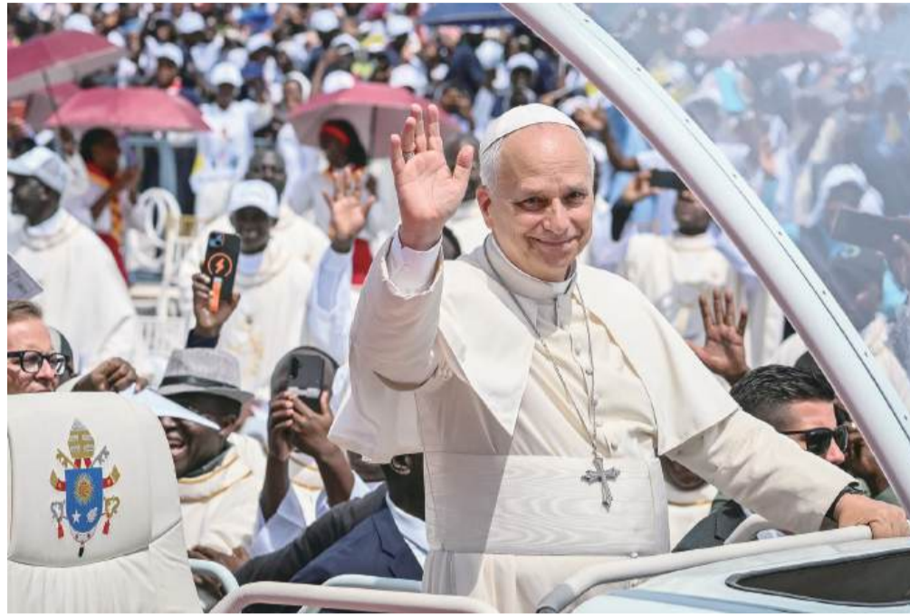
Pope Leo XIV waves to the crowd from the Popemobile as he arrives for Mass in Saurimo, northeastern Angola, on the eighth day of an 11-day apostolic journey to Africa, yesterday.

“Consequently, when injustice corrupts hearts, the bread of all becomes the possession of a few.”