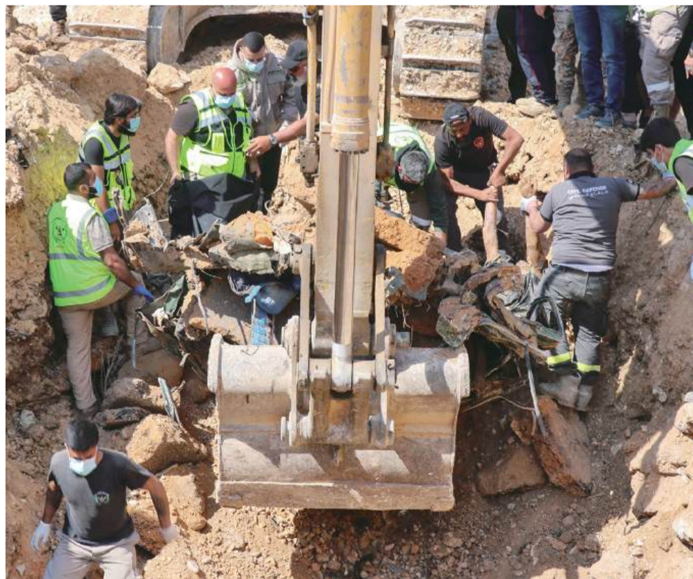
Lebanese Civil Defence personnel remove a body from a destroyed car next to the bomb-damaged Qasmiyeh bridge near the southern city of Tyre yesterday.

He noted that there was no direct communication with the president, while Hezbollah’s ministers remain in Lebanon’s cabinet.