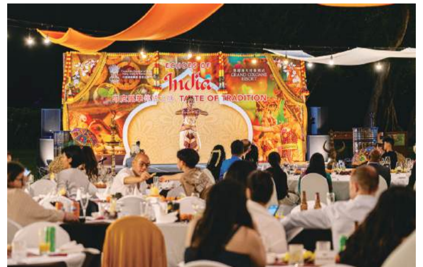
A performance takes place during the "Echoes of India · Taste of Tradition Dinner Buffet" hosted by Grand Coloane Resort on Saturday.