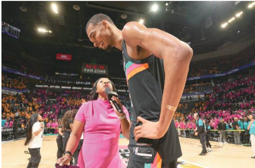
Victor Wembanyama of the San Antonio Spurs talks to the media after the game against the Portland Trail Blazers during Round One Game One of the 2026 NBA Playoffs on Sunday at the Frost Bank Center in San Antonio, Texas.

Wembanyama also headlines the finalists for Defensive Player of the Year, with Oklahoma City centre Chet Holmgren and Ausar Thompson of the Detroit Pistons also on the ballot.