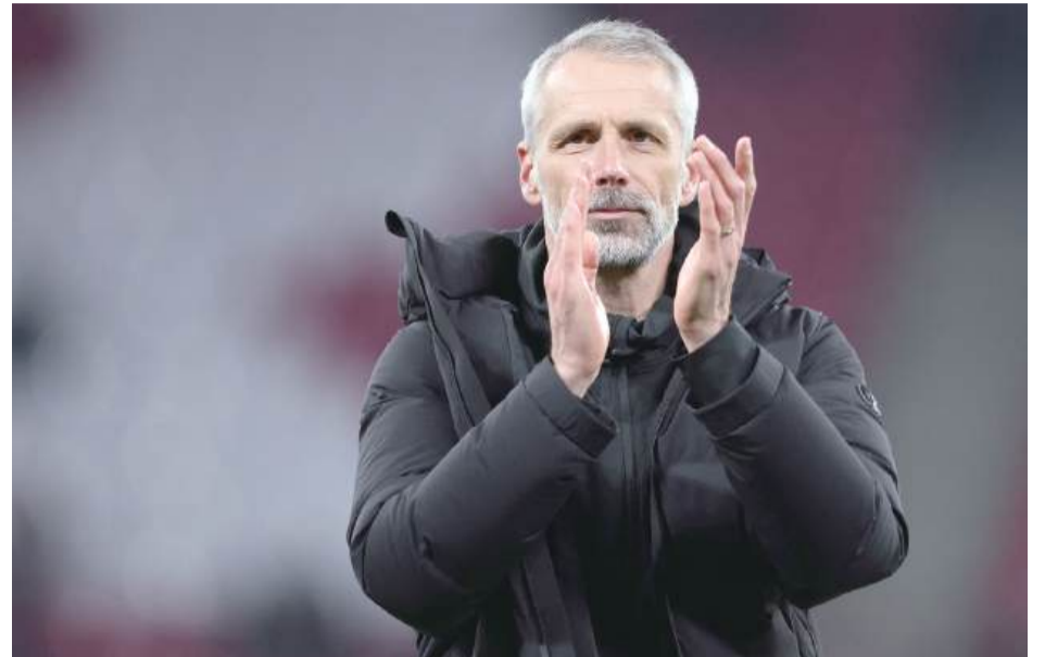
Leipzig's German head coach Marco Rose reacts after the German first division Bundesliga football match against Borussia Dortmund in Leipzig, eastern Germany on March 15, 2025.

Erling Haaland, Jude Bellingham and Dominik Szoboszlai during his career in Germany and Austria and has vast experience of European football.