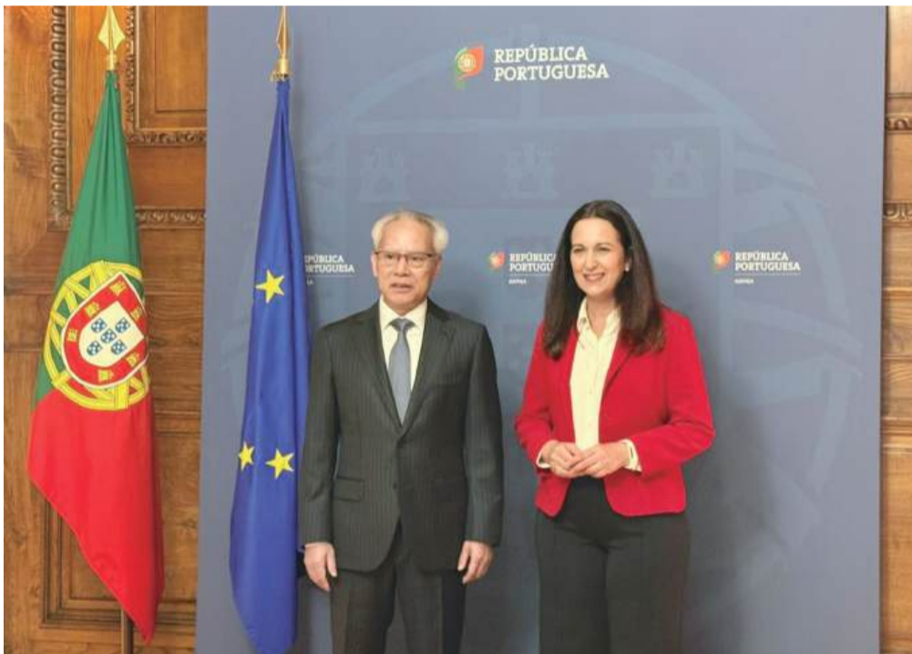
Macau Chief Executive Sam Hou Fai (left) and Portugal's Minister of Justice Rita Júdice pose for a photo on the sidelines of their meeting in Lisbon yesterday morning (local time).