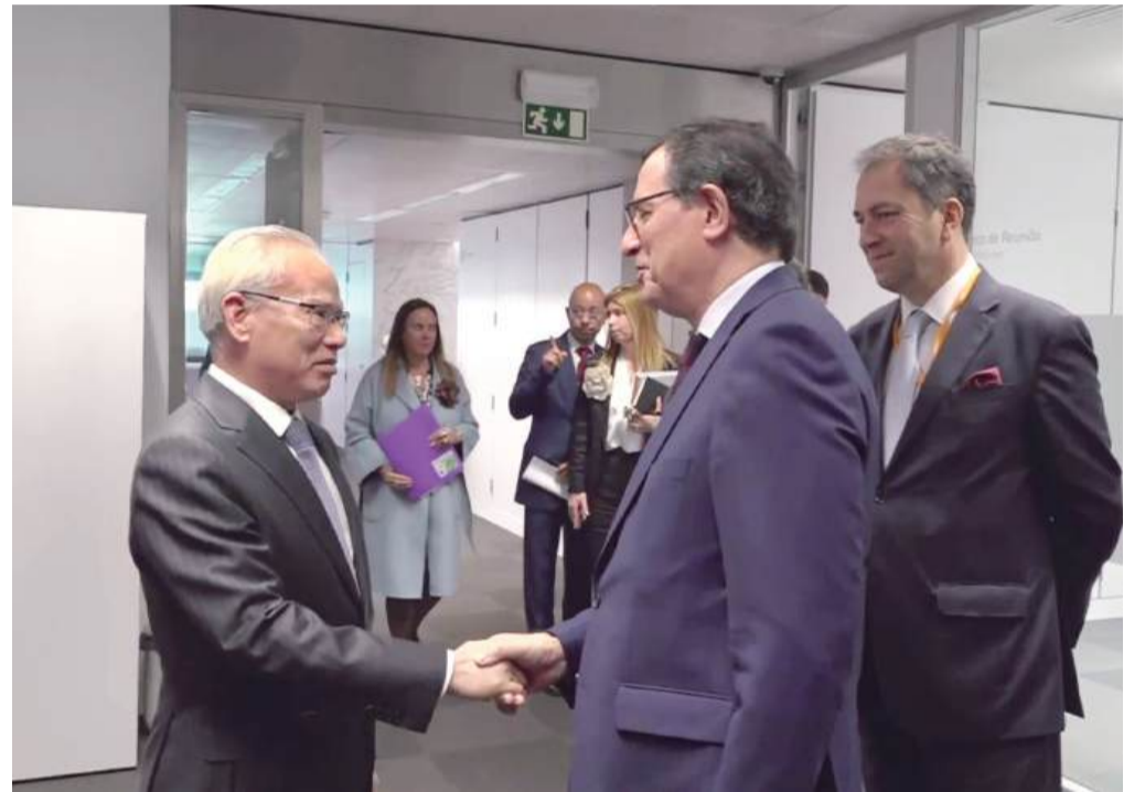
Macau Chief Executive Sam Hou Fai (left) shakes hands with Portugal's Minister of Economy and Territorial Cohesion Manuel Castro Almeida on the sidelines of their meeting in Lisbon yesterday afternoon (local time).