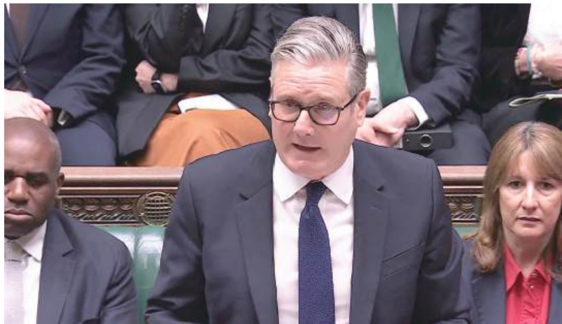
In this video grab taken from footage broadcast by the UK Parliamentary Recording Unit (PRU) via the Parliament TV website yesterday, Britain's Prime Minister Keir Starmer makes a statement on the controversial vetting procedure undertaken for the former UK ambassador to the United States, Peter Mandelson.

Since being named FBI director, Patel has been accused of carrying out a purge of agents perceived as being disloyal to President Donald Trump. Among those dismissed have been agents who worked on criminal cases brought against Trump after he left office in 2021.