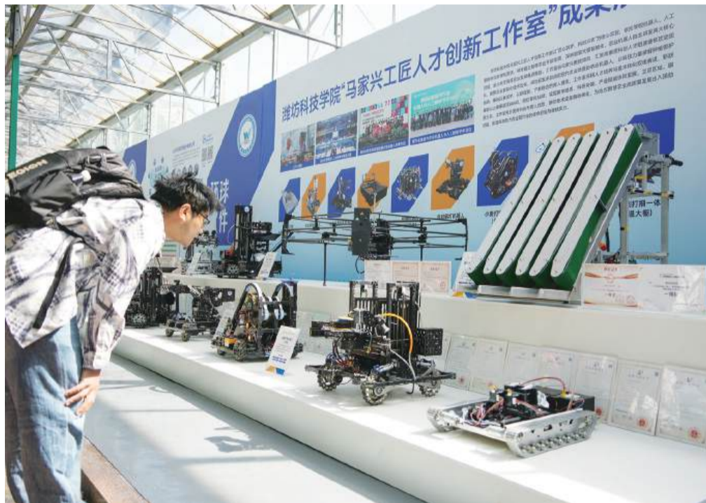
A visitor examines agricultural robots at the 27 th China (Shouguang) International Vegetable Science and Technology Expo in Shandong province. The event opened yesterday and runs through May 30.