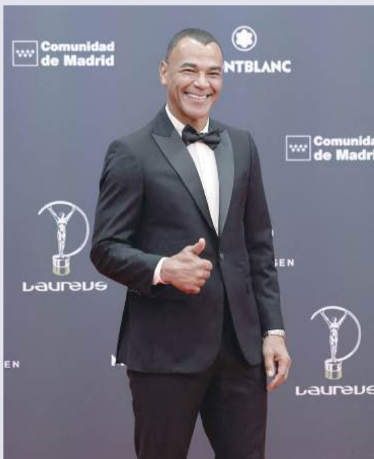
Former Brazilian football player Cafu poses on the Red Carpet ahead of the 27th Laureus World Sports Awards gala in Madrid, Spain yesterday. – AFP

Bookmakers have placed Brazil among the top five favourites, with reigning European champions Spain currently leading the way. – AFP