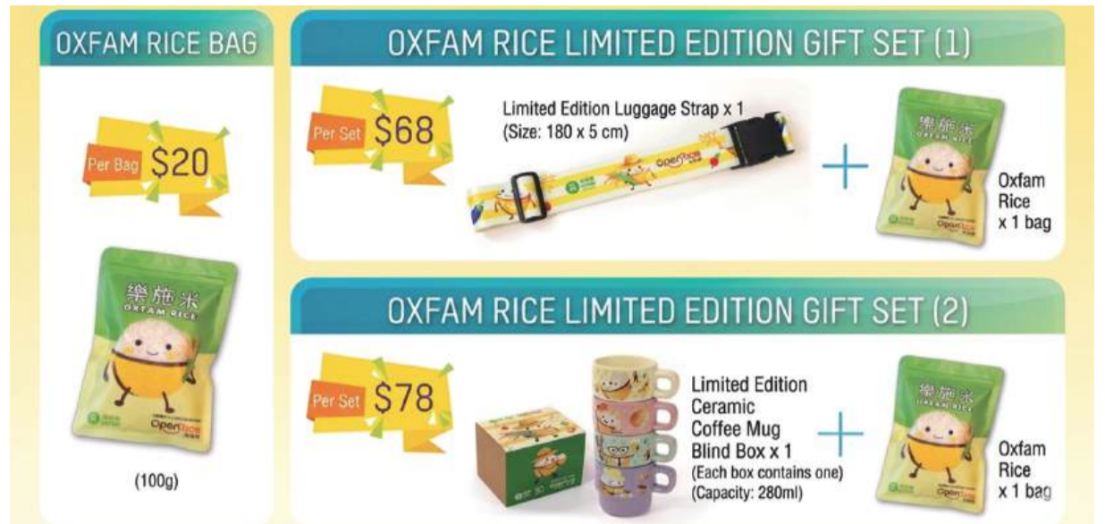
This infographic provided by Oxfam yesterday promotes the products for its two-day "Oxfam Rice Event 2026" across Macau next month.

According to Google's AI chatbot Gemini, Oxfam is a global confederation of 21 independent non-governmental organisations (NGOs) working together in about 80 countries and regions to tackle the root causes of poverty and inequality. Founded in 1942 as the "Oxford Committee for Famine Relief," it has evolved from a small group of academics and activists providing wartime aid into one of the world's most influential humanitarian and advocacy bodies. ■