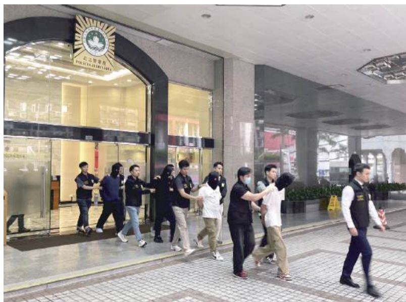
Judiciary Police (PJ) officers escort the hooded suspects to a PJ vehicle outside the PJ headquarters in Zape yesterday. – Photo: Armindo Neves

*This motion picture term covers everything from high-quality replicas used in close-ups to "filler" stacks used in background shots. – Gemini