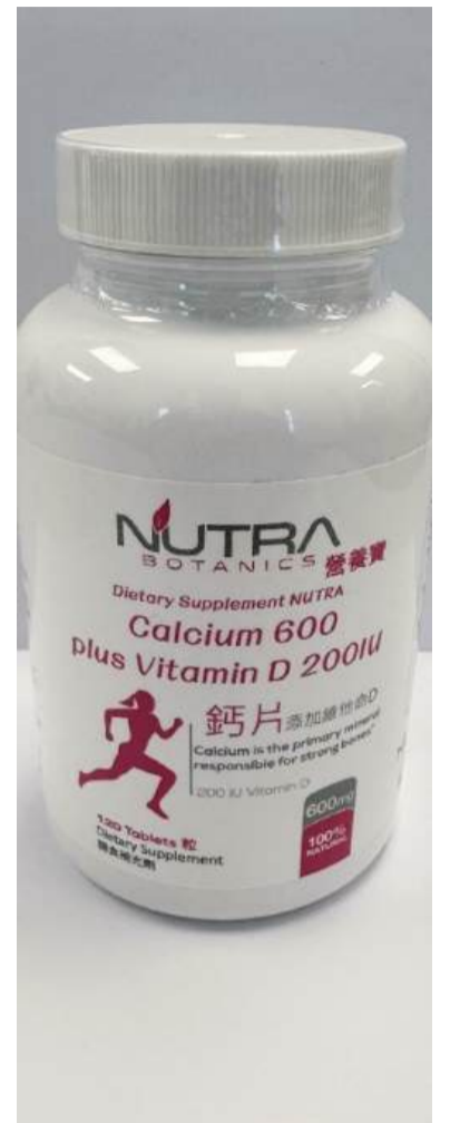
This undated handout photo provided by the Pharmaceutical Administration Bureau (ISAF) yesterday shows the "DIETARY SUPPLEMENT NUTRA CALCIUM 600 PLUS VITAMIN D 200 IU" (batch number 51194).

According to the Health Bureau, residents are advised to maintain adequate nutrient intake through a balanced diet or fortified milk products while discontinuing use of the supplement, and to seek medical advice if needed. ■