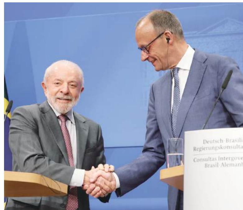
Brazilian President Luiz Inácio Lula da Silva (left) and German Chancellor Friedrich Merz shake hands during a joint press conference after German-Brazilian governmental consultations in Hanover, Lower Saxony, northern Germany, yesterday. The consultations took place on the sidelines of the Hannover Messe industrial trade fair. Brazil is the 2026 partner country of the fair, that will end on Friday.

HANNOVER – German Chancellor Friedrich Merz said yesterday there was no evident justification for the United States to attack Cuba, following months of mounting pressure from President Donald Trump on the communist-ruled island.