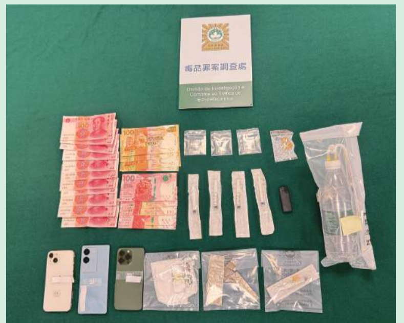
This undated handout photo provided by the Judiciary Police (PJ) yesterday shows evidence seized from the hotel guestroom booked by the drug-taking trio.

drugs, Cheong said, PJ officers confirmed the substances as heroin and crystal meth, adding that the trio's urine tests confirmed their drug use.