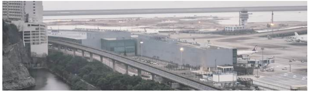
This photo taken from Big Taipa Hill earlier this month shows Air Macau jets parked on the local airport's apron.