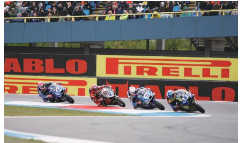
Riders compete during the race 2 of WorldSSP at the FIM Superbike World Championship in Assen, the Netherlands, yesterday.