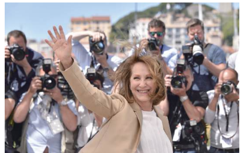
French actress Nathalie Baye poses on May 19, 2016 during a photocall for the film "It's Only The End Of The World ("Juste La Fin Du Monde")" at the 69th Cannes Film Festival in Cannes, southern France.

Their daughter Laura Smet is also a famous actress, who starred alongside Baye as a mock version of themselves – bickering, competitive, yet very close – in the