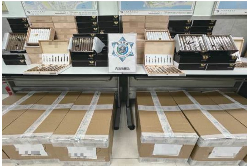
This undated handout photo provided by the Macau Customs Service on Saturday shows cigars seized by its officers at the Inner Harbour Ferry Terminal.