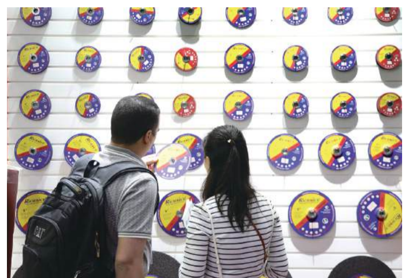
Buyers look at grinding wheels at the 139 th edition of the China Import and Export Fair in Guangzhou, Guangdong Province yesterday.

This year's fair is being held in three offline phases in Guangzhou and will run through May 5. The second phase, scheduled from April 23 to 27, will focus on “quality home