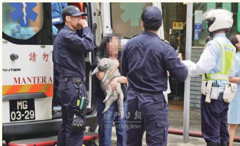
A woman carries a cat in front of a residential building on Avenida do Conselheiro Ferreira de Almeida after a fire probably caused by the "feline suspect" in the kitchen of a flat on the 20th floor on Saturday morning.

Speaking via phone yesterday, a CB spokesperson confirmed that the cat survived the incident. ■