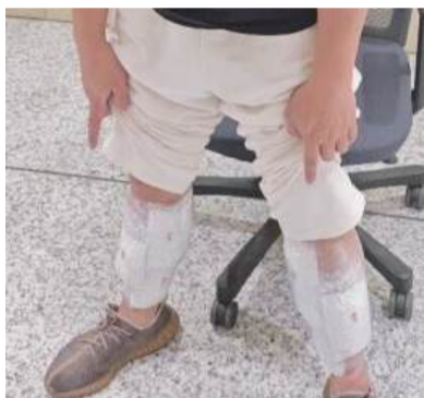
This undated handout photo provided by Zhuhai's Gongbei Customs yesterday shows six packs of silver granules strapped to the smuggler's calves.

Meanwhile, Zhuhai's Gongbei Customs announced in two statements yesterday that its officers seized 7.62 kg of silver granules and 611 cigars at Hengqin border checkpoint on April 10 and 14, respectively.