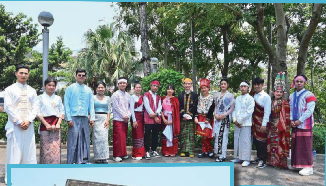
Revellers take part in the festive atmosphere of yesterday's "2026 Macau Myanmar Thingyan Festival" was held at Parque Municipal Dr. Sun Yat Sen (紀念孫中山市政公園)