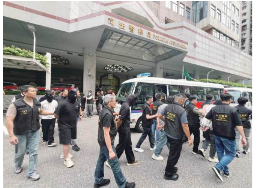
Judiciary Police (PJ) officers escort the 25 hooded fraud, money-laundering and document-forgery suspects to PJ vehicles outside the PJ headquarters in Zape on Friday.

On Thursday, PJ officers arrested the 25 suspects in the peninsula, in three hotel guestrooms in Cotai and at various border checkpoints. They also seized HK$5.7 million in cash and a batch of equipment