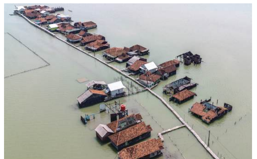
An aerial view shows houses partially submerged in seawater due to tidal flooding along the southern coast of the Java Sea at the Timbulloko village in Demak, Central Java, Indonesia on April Saturday. — AFP

North Korea has sent ground troops and artillery shells to support Russia's invasion of Ukraine, and observers say Pyongyang is receiving military technology assistance from Moscow in return. — AFP