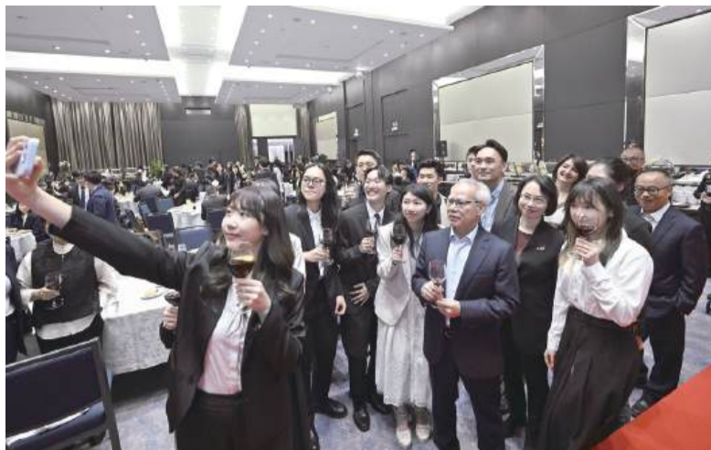
A student takes a selfie with Chief Executive Sam Hou Fai, other Macau officials, and other Macau students studying in Portugal on the sidelines of the meeting at a hotel in Lisbon on Saturday night (local time).

Sam said that the first is to focus on their studies, lay a solid