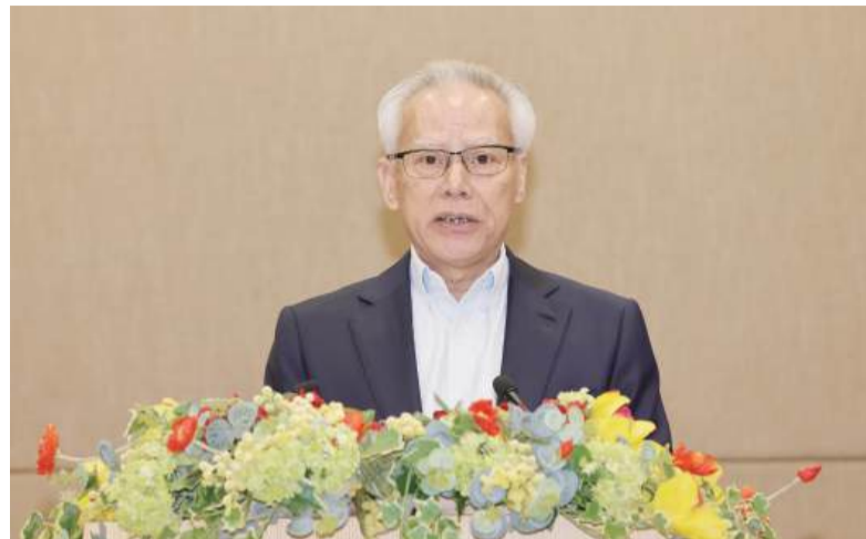
Chief Executive Sam Hou Fai addresses Friday's press briefing at a pressroom in the Hong Kong-Zhuhai-Macao Bridge's (HZMB) Macau checkpoint.