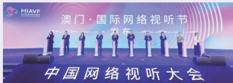
This handout photo provided by integrated resort operator Wynn Macau Limited on Friday shows officiating guests and representatives at a launch ceremony on Wednesday at the main forum of the 13 th China Internet Audio & Video Convention.