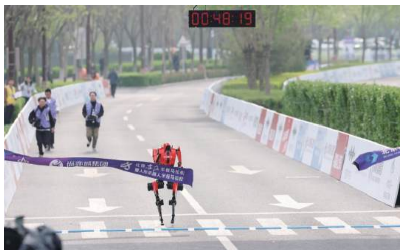
Humanoid robot "Flash" of Jueyingchitu Team in the remote-controlled category crosses the finish line during the Beijing E-Town half-marathon and humanoid robots half-marathon in the Beijing Economic-Technological Development Area in southeast Beijing, yesterday.

In terms of industry scale, data released by the international research firm Omdia show that global shipments of humanoid