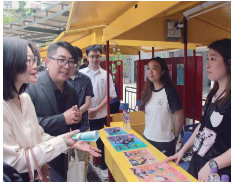
Guests interact with some of the booths during yesterday's "Healthy Mind, Healthy Life: A day to rest, to relieve your stress!" community event in Iao Hon Market Garden in Areia Preta district.

"That's why we want to promote awareness in the community and