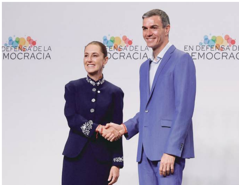
Mexico's President Claudia Sheinbaum (left) greets Spain's Prime Minister Pedro Sánchez at a "Meeting in Defence of Democracy", a gathering of leftist leaders seeking to rally against the perceived threat to democracy from the far right, in Barcelona, Spain on Saturday.