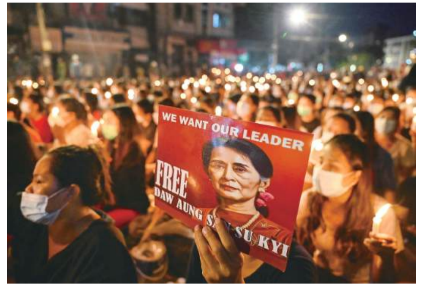
A protester holds a poster with an image of detained civilian leader Aung San Suu Kyi during a candlelight vigil to honour those who have died during demonstrations against the military coup in Yangon on March 13, 2021.

Turk said he was relieved by the “long overdue release” of Win Myint and other prisoners from