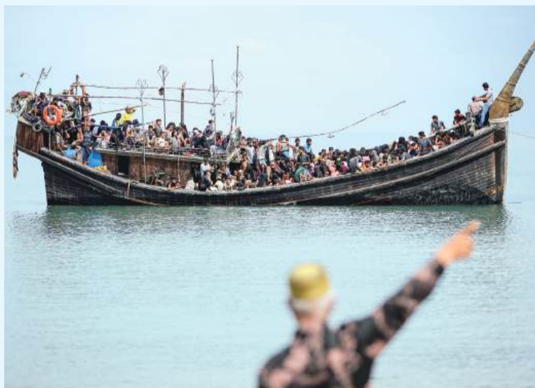
Newly arrived Rohingya refugees are stranded on a boat after the nearby community decided not to allow them to land after giving them water and food in Pineung, Aceh province, Indonesia on November 16, 2023. – AFP

Instead, Ramesh said in a social media post, the government should implement the 33-percent quota “in the existing set up of the Lok Sabha for the 2029 Elections”. – AFP