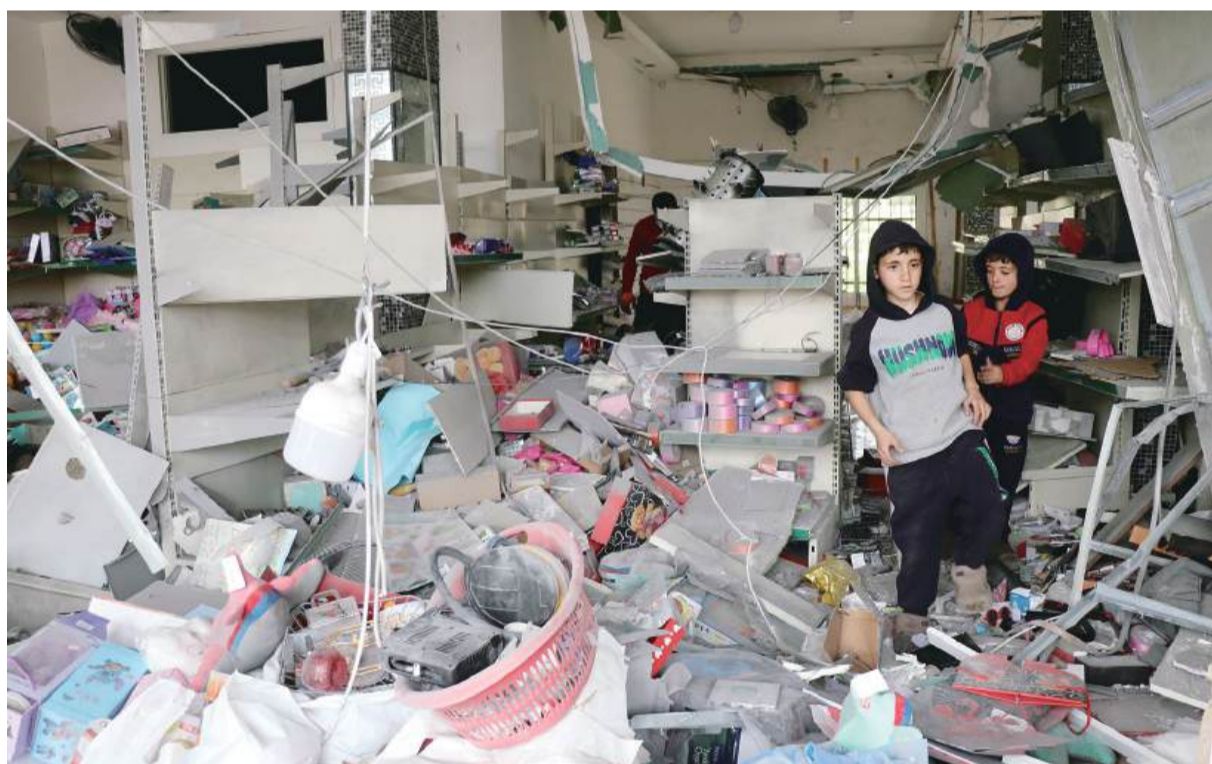
Children walk through a damaged store as displaced residents return to the southern Lebanese village of Srifa yesterday. On Friday, a ceasefire between Israel and Lebanon took effect after the first direct talks between the two sides in decades, bringing a pause to weeks of fighting between Israel and Hezbollah that has killed nearly 2,300 people and displaced more than a million.

BEIRUT – Hezbollah leader Naim Qassem said on Saturday that the ongoing 10-day truce with Israel cannot be one-sided, vowing that his fighters would respond to Israeli attacks on Lebanon.