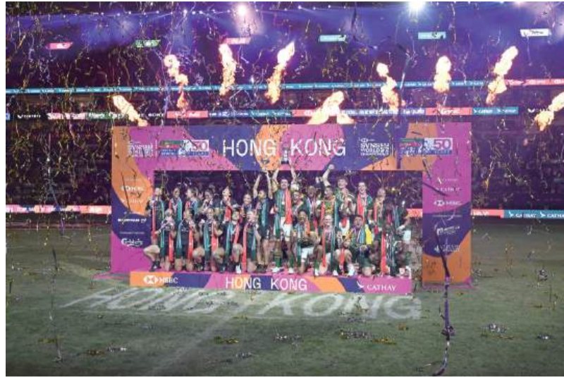
The New Zealand women (left) and South Africa men teams celebrate with their trophies on the podium after winning their cup finals matches on the third day of the 2026 Rugby Sevens Hong Kong tournament at Kai Tak Stadium in Hong Kong yesterday.