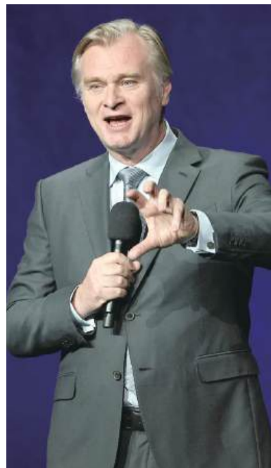
UK-US filmmaker Christopher Nolan promotes the upcoming film "The Odyssey" at the Universal Pictures and Focus Features presentation at The Dolby Colosseum at Caesars Palace during CinemaCon, the official convention of Cinema United, last Wednesday in Las Vegas, Nevada.

all you need to get from the beginning to the end is a seatbelt," he said.