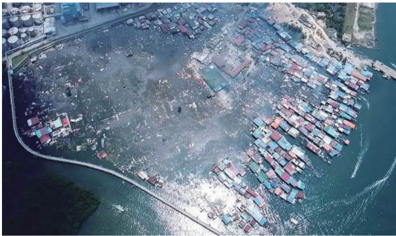
This handout photo taken and released by Malaysia's Sandakan Fire and Rescue Department yesterday, shows a general view of the Kampung Bahagia water village after a fire, in Sandakan, on Malaysia's Borneo island.

KUALA LUMPUR — A huge fire destroyed about 1,000 makeshift homes, many of them built on stilts over water, and displaced thousands of people in a coastal village in Malaysia's Sabah state yesterday, authorities said.