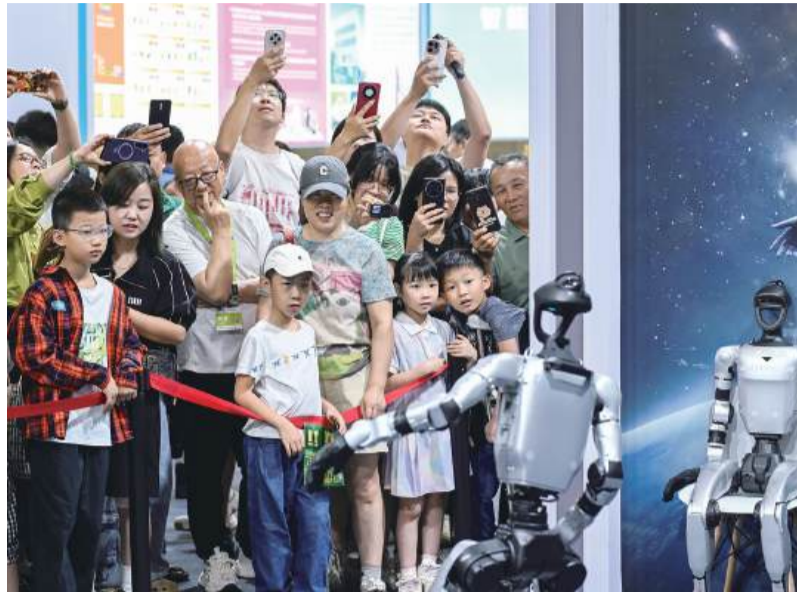
Unitree Robotics' humanoid robots perform during the sixth China International Consumer Products Expo (CICPE) in Haikou, Hainan Province, on Saturday. The sixth China International Consumer Products Expo (CICPE), a key gateway into China's vast consumer market and a platform for China to offer more quality consumer products to the rest of the world, concluded in the tropical island province on Saturday.

“The product portfolio not only shows the group's continuously