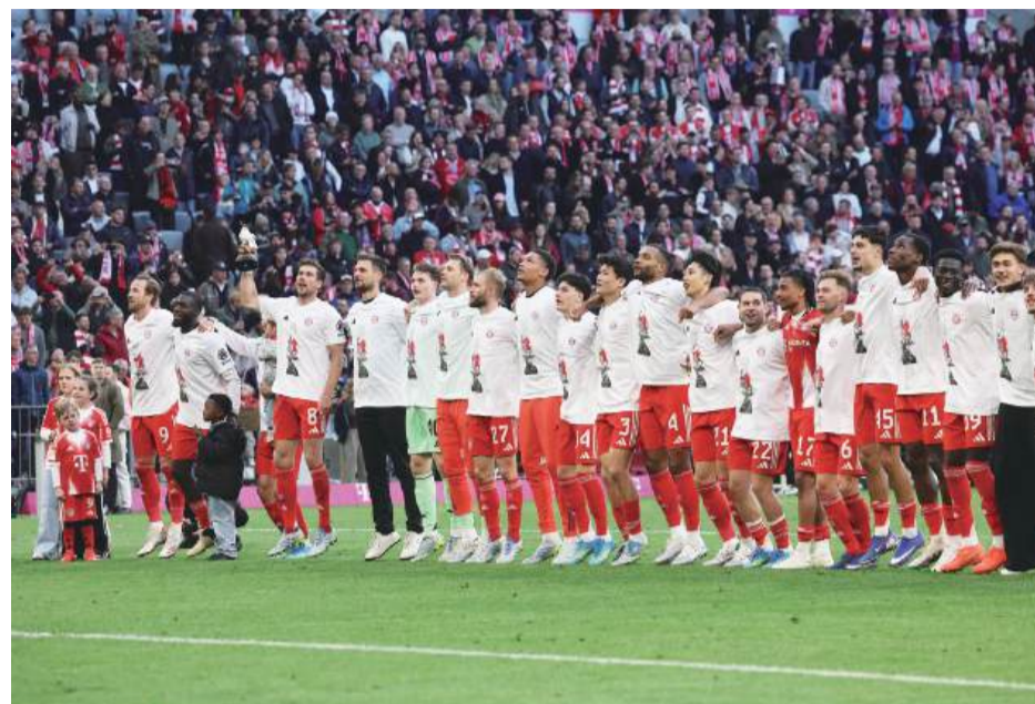
FC Bayern Munich's team celebrates after winning the German first division Bundesliga football match against VfB Stuttgart as well as the Bundesliga title in Munich, southern Germany, yesterday.

Gnabry has returned to form this season in a firing Bayern front line alongside Harry Kane, Michael Olise and Luis Diaz.