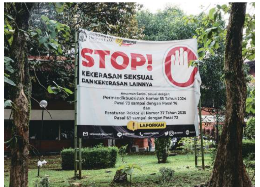
A banner reading "Stop sexual violence and other violence" hangs along a roadside on the University of Indonesia's campus in Depok, West Java yesterday.