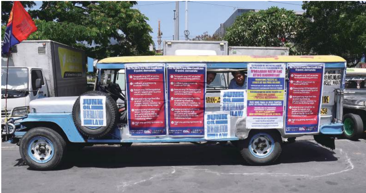
Jeepney drivers peer from a window of their vehicle, plastered with placards on the first day of a three-day jeepney strike along a road in Manila on Wednesday.

Drivers began another round of transport strikes on Wednesday demanding the government rollback the oil price and remove excise tax on oil amid the war in the Middle East.