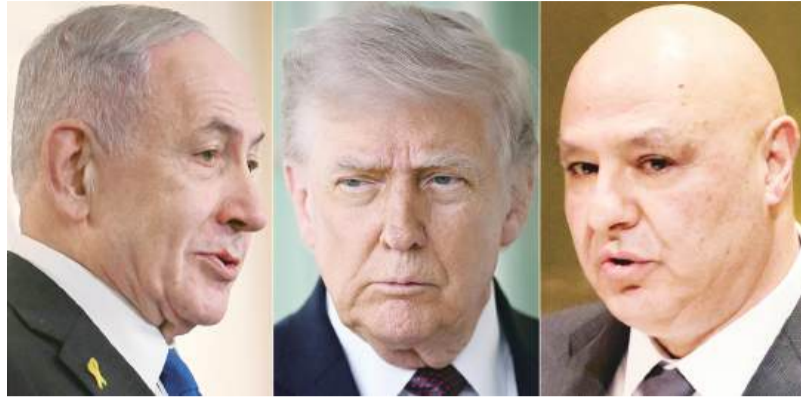
This combination of pictures shows (from left to right) Israeli Prime Minister Benjamin Netanyahu in Washington, DC on September 29, 2025, US President Donald Trump in Washington, DC, on April 13, 2026 and Lebanese President Joseph Aoun in New York City on September 23, 2025.

The first signs of movement on Lebanon came when Trump said