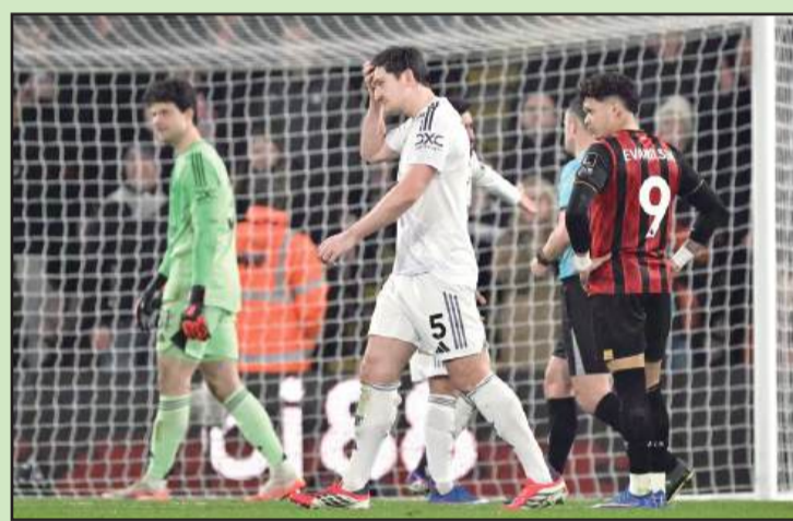
Manchester United's English defender Harry Maguire (centre) is sent off after receiving a red card during the English Premier League match against Bournemouth at the Vitality Stadium in Bournemouth, southern England on March 20.

The World Cup, the first to feature 48 teams, starts on June 11.