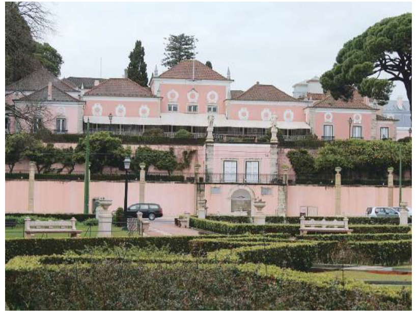
Cars drive past Belém Palace in Lisbon on January 26, 2017, the official residence of the Portuguese president. MSAR Chief Executive is slated to meet President António José Seguro at the palace on the outskirts of Lisbon during his official four-nation tour of Europe.

Next Thursday, the MSAR Government delegation will travel to Geneva in Switzerland, to deepen engagement with international organisations including the WTO. Next Friday, the delegation will