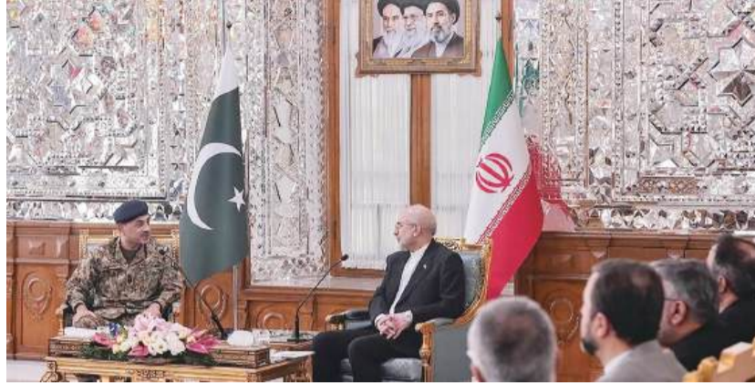
shows Iranian Parliament speaker Mohammad Bagher Ghalibaf (centre) speaking with Pakistan's Army Chief Asim Munir (left) during their meeting in Tehran.

Iran's envoy signals Tehran's readiness for serious talks