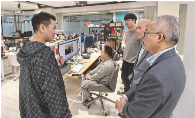
This undated handout photo provided by the Science and Technology Development Fund (FDCT) yesterday shows its members paying a fact-finding visit to one of the fund's beneficiaries.

The statement underlined that the fund has also rolled out the "Funding Scheme for Innovation and Research of Enterprises – Matching Projects", aimed at reducing research and development costs, encouraging greater participation from businesses and promoting the commercialisation of academic research.