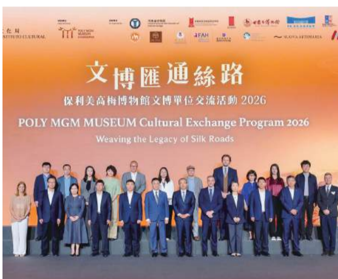
This photo provided by integrated resort operator MGM shows guests and representatives posing during Saturday’s “POLY MGM MUSEUM Cultural Exchange Program 2026—Weaving the Legacy of Silk Roads” held at MGM MACAU.