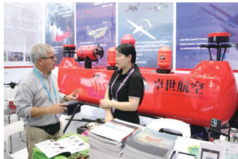
A foreign buyer inquires about a firefighting drone at the 139th edition of the China Import and Export Fair in Guangzhou on Wednesday. The 139th edition of the China Import and Export Fair, also known as the Canton Fair, opened on Wednesday, drawing a record number of over 32,000 participating enterprises. – Xinhua

China's latest five-year plan (2026-2030) calls for the full implementation of an "AI plus" initiative to integrate AI into all sectors of the economy. Even before that, a State Council guideline last year had already set out to foster new forms of AI-powered product consumption. – AFP