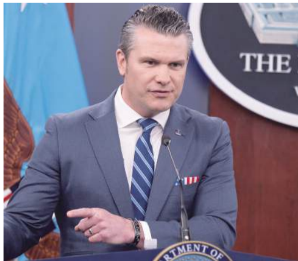
US Secretary of Defense Pete Hegseth speaks during a press briefing at the Pentagon in Washington, DC, yesterday.

Addressing Iranian leaders directly, he said: “We know what military assets you are moving and where you are moving them to. While you are digging out – which is exactly what you’re doing, digging out of bombed out and devastated facilities – we are only getting stronger.”