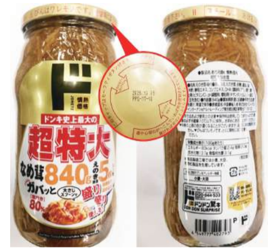
This handout photo combo provided by the Municipal Affairs Bureau (IAM) on Wednesday shows the problematic product that may contain glass shards.

*"情熱価格" ("Passionate Price") is the private brand product line of the Japanese discount store chain Don Quijote (aka Donki). — DeepSeek