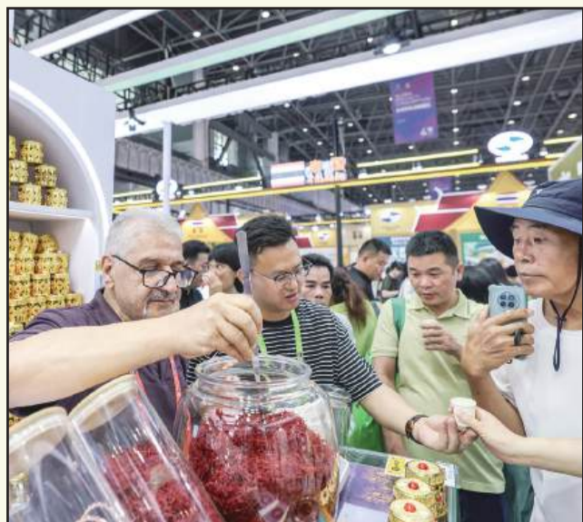
Fairgoers inquire about Iranian products during the sixth China International Consumer Products Expo (CICPE) in Haikou, Hainan Province, on Wednesday. As a major event showcasing the Hainan Free Trade Port (FTP) after it fully launched island-wide special customs operations in December last year, the sixth China International Consumer Products Expo (CICPE) kicked off on Monday in Haikou, capital of Hainan Province, attracting more than 3,400 brands from over 60 countries and regions. Themed "Opening Up Drives Global Consumption, Innovation Empowers A Better Life," this year's six-day expo ends tomorrow. Meanwhile, the 2026 "Shopping in China" International Consumption Season was launched simultaneously. The sixth CICPE has expanded in scale, with an exhibition area of 143,000 square meters, up 13,000 square meters from the previous edition. International exhibits account for 65 percent of the total, an increase of 20 percentage points from last year. – Xinhua

"The public needs to enhance their awareness of science-based cancer prevention. We must also bring together strengths from all sectors of society to broaden the reach of cancer screening," said Liu Hongxu, director of the office of early diagnosis and treatment at the National Cancer Center. – Xinhua