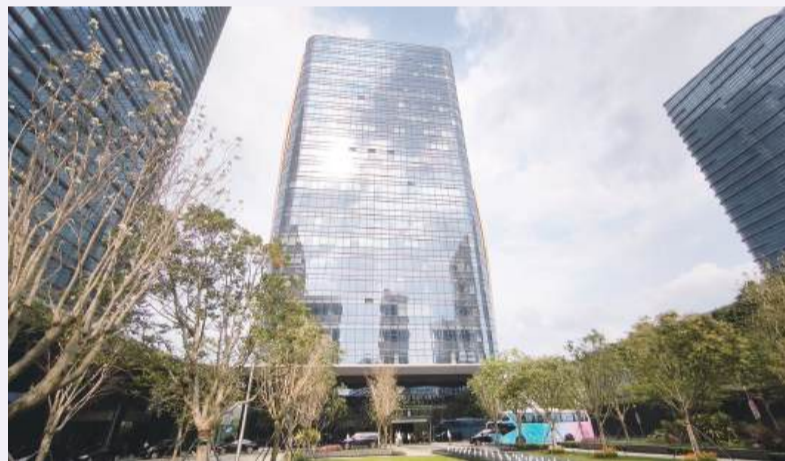
This file photo taken last month shows part of the Service Centre for Economy and Trade between China and Portuguese/Spanish-speaking Countries complex in Hengqin.

As researchers in the political economy of China’s development and overseas investments, this centre looks like another exemplary work of the socialist market economy which is steered by planning (the new strategic positioning of “Macao+Hengqin” as stated in the guidance documents) and government funding (RMB1 billion of CECPS Investment Fund provided by the Government of the Guangdong-Macao In-depth Cooperation Zone and RMB 30 billion Hengqin Industrial Investment Fund) while the service centre is operated as a non-governmental entity on the market.