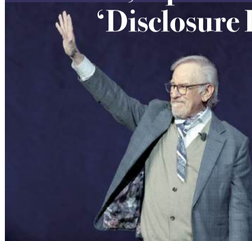
US filmmaker Steven Spielberg waves up arrival on stage during Universal Pictures and Focus Features presentation at CinemaCon at The Colosseum at Caesars Palace in Las Vegas, Nevada, on Wednesday.