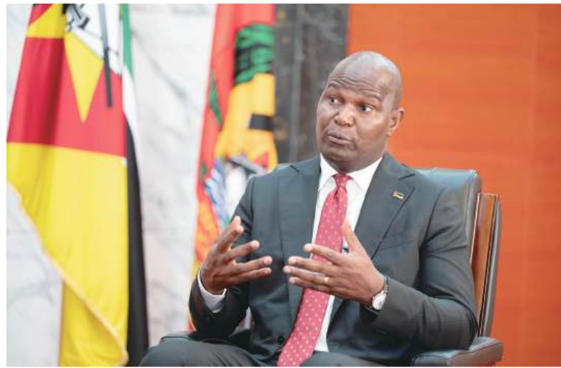
Mozambican President Daniel Chapo speaks during an interview with Xinhua in Maputo last Tuesday.

The Maputo-Katembe Bridge, built by a Chinese company, is the longest suspension bridge in Africa. Before the bridge was built, it