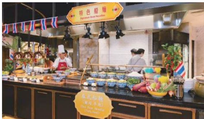
This undated handout photo provided by Studio City Macau last week shows ready-made meals at the Spotlight restaurant’s “The World on A Plate – The Taste of Thailand Buffet” on the integrated resort’s 1 st floor in Cotai.

The “World on A Plate – The Taste of Thailand Buffet” is running at the integrated resort until May 8, which coincided with