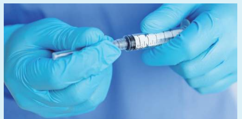
This photo downloaded from Unsplash last night shows a jab being prepared.

The statement reminded that the 2025-2026 seasonal influenza vaccine provides protection against current Influenza A and B strains, being "the most effective measure to prevent infection and reduce the risk of severe illness or death". The statement strongly encouraged vaccination among those who have not had their jab since September last year. ■