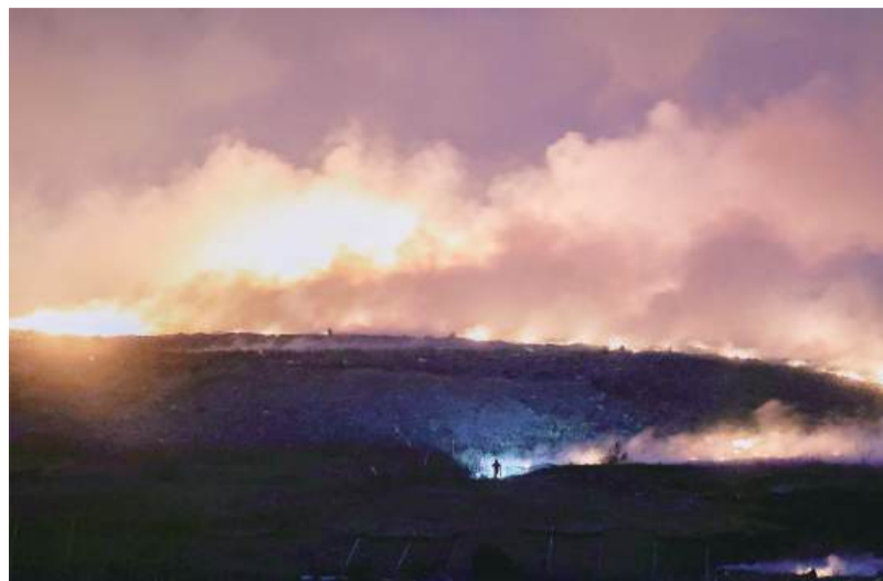
Smoke billows from the blaze at a landfill in Navotas City, the Philippines, on Sunday. Metro Manila has been shrouded in thick haze for days due to a landfill fire, local media reported Sunday.

According to a statement from the Navotas City Disaster Risk Reduction and Management Office, the landfill is not owned by the Navotas City Local Government Unit, and its operations ceased