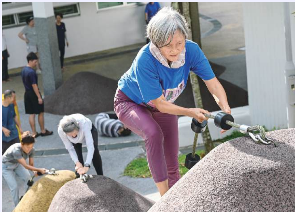
This photograph taken on March 17 shows Singaporean elders taking part in a parkour training session in Singapore.

“Since then, I became like the favourite grandmother. The children recognise me even when I'm far away,” she said.