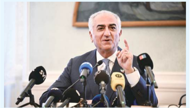
The son of Iran's last shah, exiled Crown Prince Reza Pahlavi, holds a press conference following a meeting with the Christian Democrats and Sweden Democrats parliamentary groups at the Swedish Parliament (Riksdagen) in Stockholm yesterday.