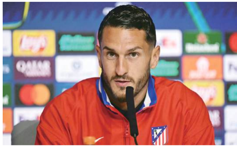
Atletico Madrid's Spanish midfielder Koke gives a press conference on the eve of their UEFA Champions League quarter final second leg against FC Barcelona at Metropolitano Stadium in Madrid, yesterday.