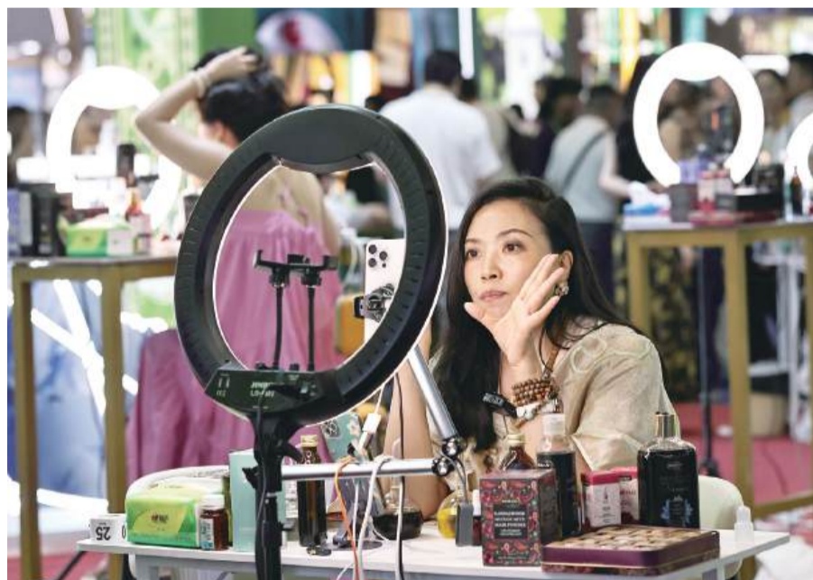
A businesswoman promotes products via livestream during the sixth China International Consumer Products Expo (CICPE) in Haikou, capital of Hainan Province, yesterday. Jointly hosted by China's Ministry of Commerce (MOC) and the Hainan provincial government, the sixth CICPE marks the first edition of the event since the Hainan Free Trade Port fully launched island-wide special customs operations. (More on p.6)