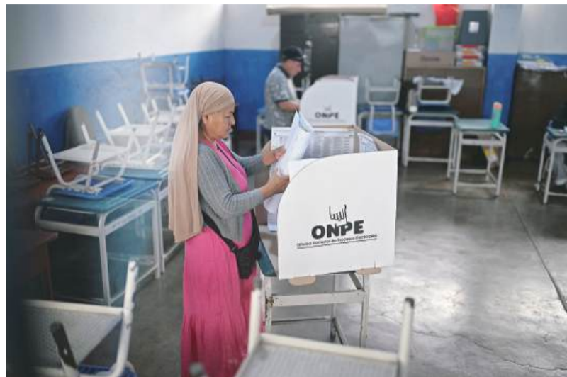
Voters cast their ballots at a school in Lima yesterday, after logistical failures prevented tens of thousands of people from voting in presidential and legislative elections the day before. Rightwing candidate Keiko Fujimori looked set to face a runoff against rightwing rival Rafael López Aliaga after a troubled first-round presidential election on Sunday marred by logistics foul-ups, police raids and allegations of fraud.

Officials said police also raided a private subcontractor blamed for