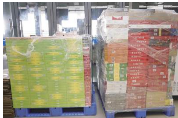
This undated handout photo provided by Zhuhai's Gongbei Customs yesterday shows cigarettes seized by its officers at the Hong Kong-Zhuhai-Macao Bridge (HZMB) Zhuhai checkpoint on March 25.

resident and a mainland Chinese traveller appearing visibly nervous.