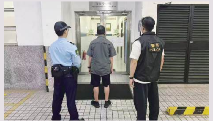
This undated handout photo provided by the Public Security Police (PSP) yesterday shows PSP officers escorting the sexual harassment suspect from Hong Kong surnamed Fung to a local police station.

He pointed out that Fung faces a charge in line with Article 164-A of the Macau Penal Code concerning "sexual harassment." According to the article, he faces up to one year behind bars. ■