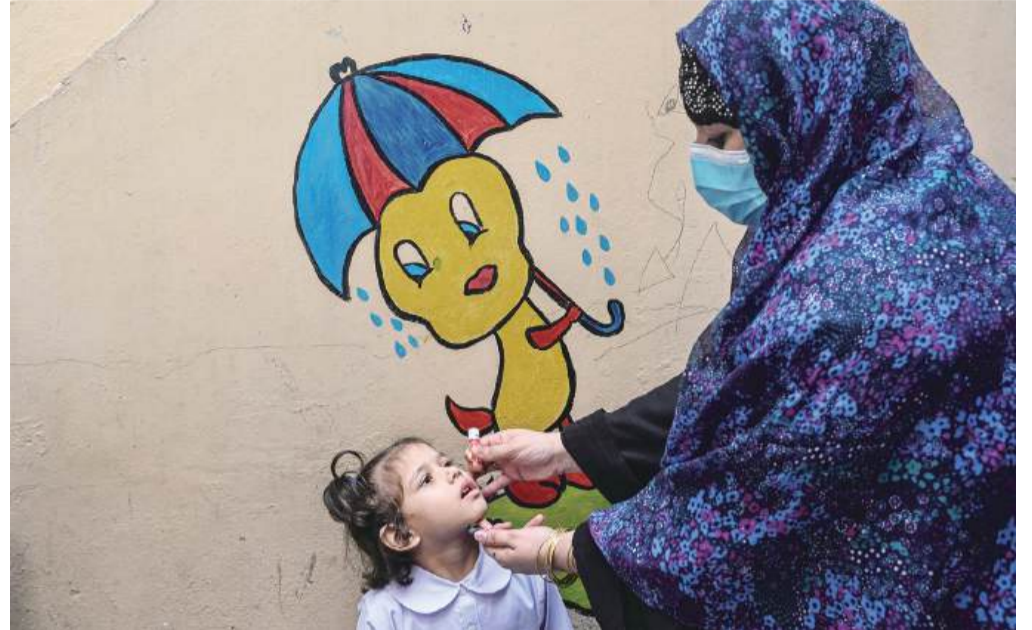
A healthcare worker administers polio drops to a school child during a door-to-door poliovirus eradication campaign in Lahore, Pakistan yesterday.

KABUL – The Afghan government launched the first nationwide polio vaccination campaign of the current year 2026 yesterday to cover around 12.6 million children under five in the post-war nation, the private media outlet Tolonews reported.