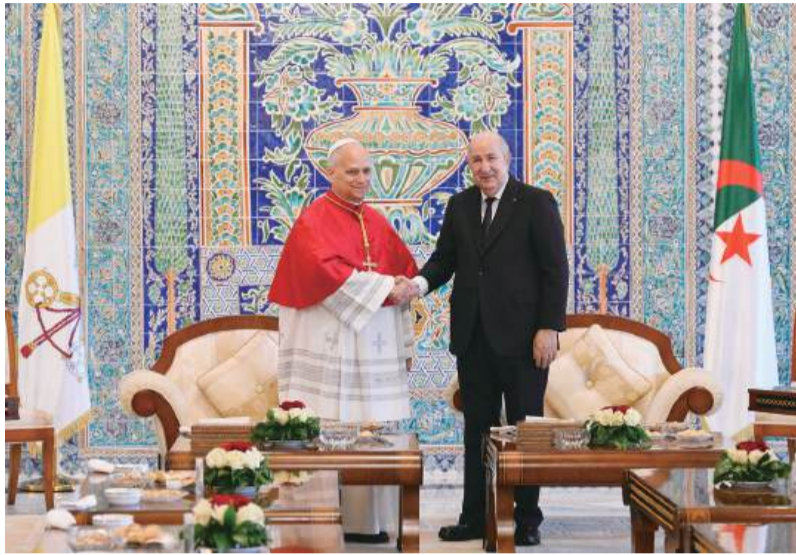
Pope Leo XIV (left) shakes hands with Algerian President Abdelmadjid Tebboune at the Presidential Palace in Algiers yesterday.

Algerian capital yesterday and called for “forgiveness” in a speech paying tribute to victims of the country’s 1954-1962 war of independence from France.