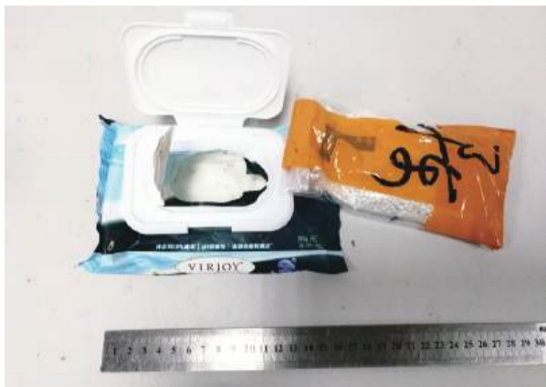
This undated handout photo provided by the Macau Customs Service on Sunday shows silver granules concealed inside a "VIRJOY" moist hand wipes.

During the same period, customs officers at the passenger inspection area of the Hong Kong-Zhuhai-Macao Bridge (HZMB) Macau checkpoint observed a Macau