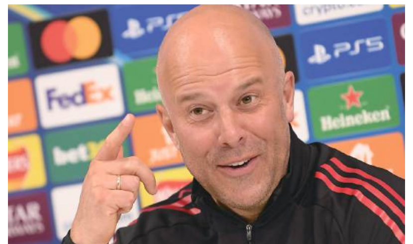
Liverpool's Dutch manager Arne Slot attends a press conference at Anfield stadium in Liverpool, north-west England yesterday, on the eve of their UEFA Champions League, quarter final second leg against Paris Saint-Germain.