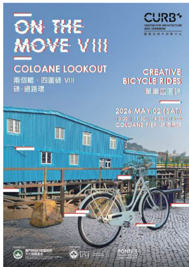
This poster provided by CURB - Center for Architecture and Urbanism promotes the upcoming "ON THE MOVE VIII: Coloane Lookout" event.

According to the statement, the event has been held over the years and is funded by the Cultural Development Fund. The statement highlighted that the initiative is broadly supported and gathers "a growing community through shared experiences of the city". ■