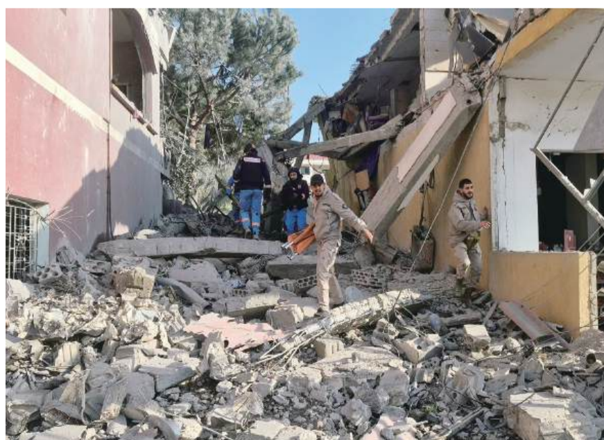
First responders gather at the site of an Israeli airstrike that targeted a neighbourhood in the southern Lebanese village of Kfar Roummane yesterday. Lebanon was pulled into the Middle East war when Hezbollah fired rockets at Israel after US-Israeli strikes killed Iran's supreme leader on February 28. Israel responded with massive strikes and a ground invasion.