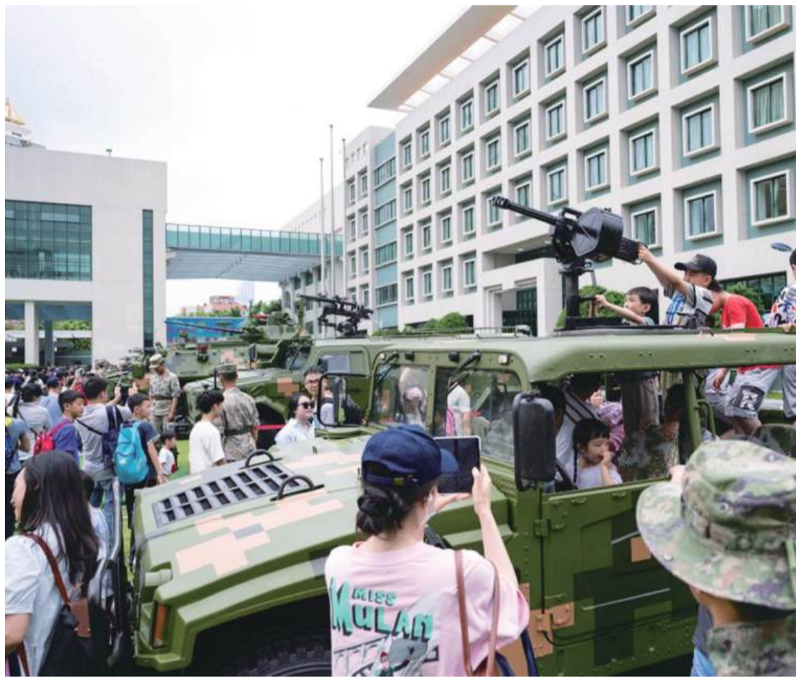
Residents attend an Open Day event at the barracks of the Chinese People's Liberation Army's (PLA) Macau Garrison in Taipa on May 1 last year.

The local barracks has opened to the public 20 times since the PLA was deployed to Macau on December 20, 1999, concurrent with the establishment of the Macau Special Administrative Region (MSAR) that marked Macau's return to the motherland and the end of Portugal's temporary administration of the city. ■