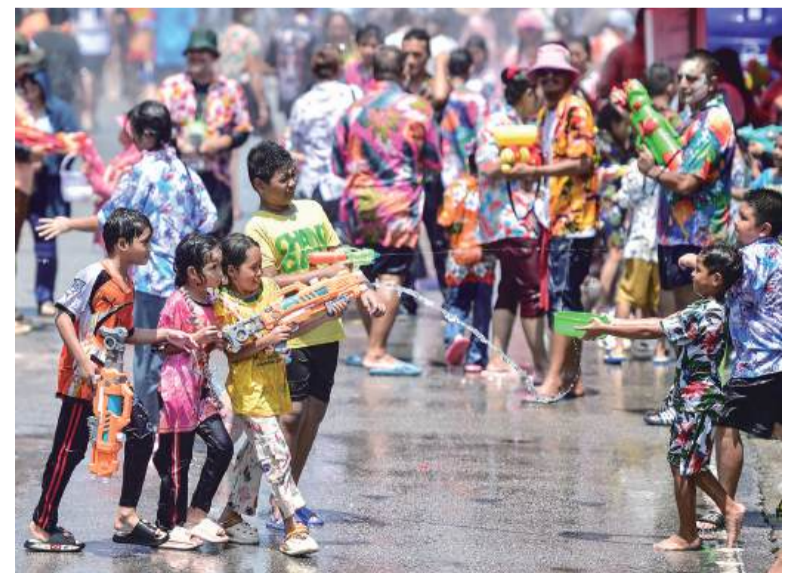
Revellers take part in mass water fights on the first day of Thailand’s Buddhist New Year water festival, also known as Songkran, in the southern Thai province of Narathiwat yesterday. – AFP

They said non-conventional mining methods, such as phytomining, could help secure critical metals for medical and renewable technologies while restoring contaminated soils sustainably. – Xinhua