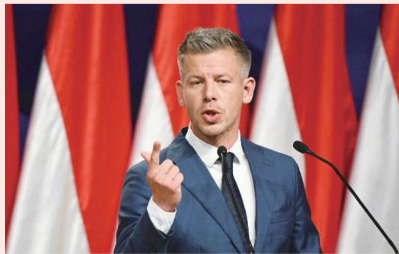
Peter Magyar, election winner and leader of the pro-European conservative TISZA party, delivers a press conference at the HUNGEXPO Congress and Exhibition Center in Budapest, Hungary, yesterday, one day after winning the Hungarian general elections with a two-third majority in parliament.

system and it was about time,” he told AFP.