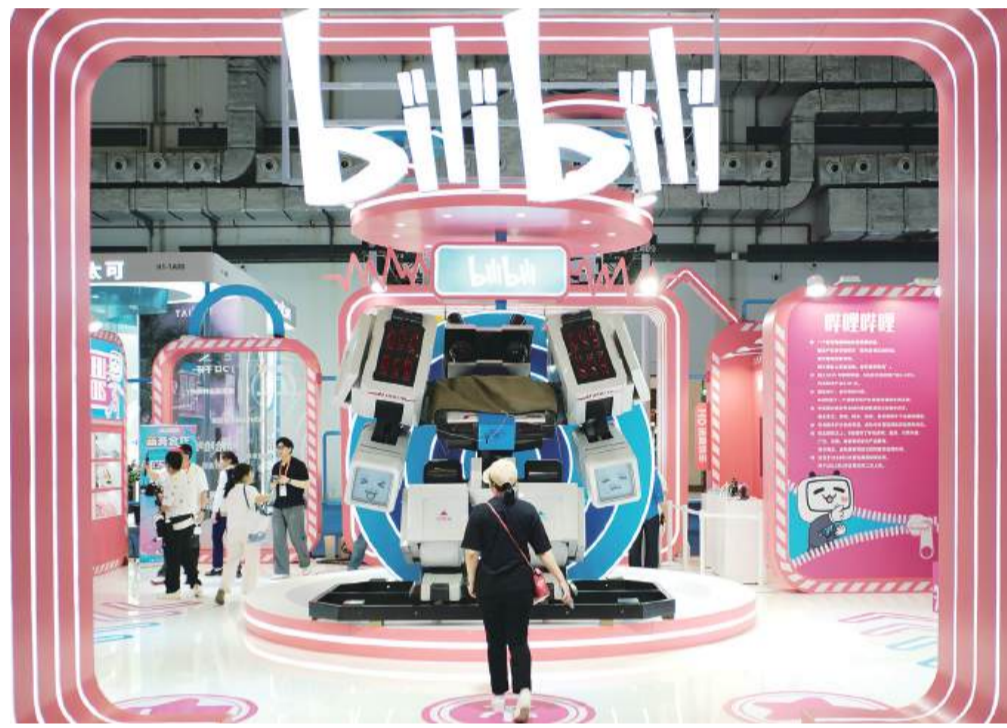
Fairgoers walk near the booth of video-sharing platform Bilibili at the sixth China International Consumer Products Expo (CICPE) in Haikou, capital of Hainan Province. Jointly hosted by the Ministry of Commerce (MOC) and the Hainan provincial government, the sixth CICPE marks the first edition of the event since the Hainan Free Trade Port fully launched island-wide special customs operations. This year, the expo has attracted over 3,400 brands from over 60 countries and regions.

More products of intelligent manufacturing in China have entered the global spotlight at this year's edition. Among the exhibitors, Chinese motorcycle maker ZXMOTO stands alongside global giants like Aston Martin and Bombardier, demonstrating the rising technological prowess and overall competitiveness of made-in-China products.