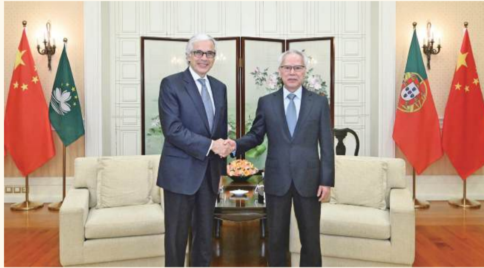
Chief Executive Sam Hou Fai (right) shakes hands with the president of Portugal's Assembly of the Republic (parliament), José Pedro Aguiar-Branco, at Government Headquarters in Nam Van on Friday.

According to the statement, Sam noted that he will lead a local government delegation to Portugal later this month, pointing out that the visit will include meetings with the highest number of Portuguese officials and the broadest scope to date, demonstrating the great importance the local government attaches to strengthening friendly relations