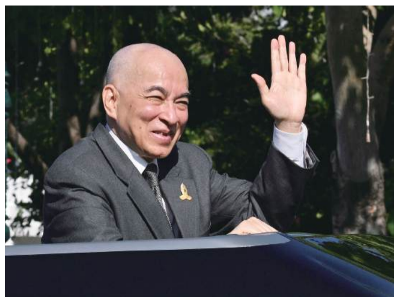
Cambodia's King Norodom Sihamoni greets people at the Independence Monument during a ceremony marking Cambodia's 71st Independence Day celebrations in Phnom Penh on November 9, 2024.

"What they're doing is not enough... we can't feel it." – AFP (More on Middle East war on pages 10 & 11)