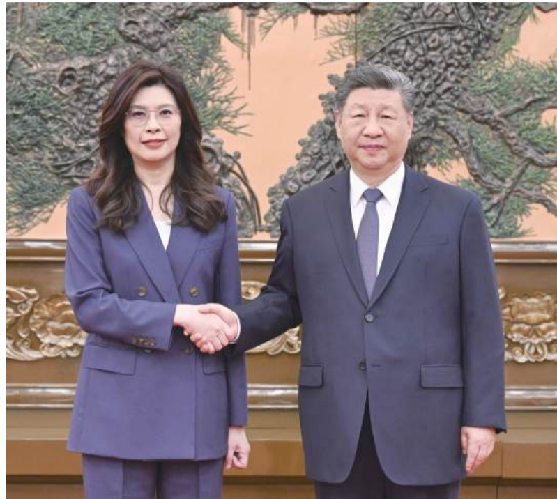
Xi Jinping (right), general secretary of the Communist Party of China (CPC) Central Committee, meets with Chinese Kuomintang (KMT) Chairwoman Cheng Li-wun in Beijing on Friday morning.

“We welcome any proposals conducive to the peaceful development of cross-Strait relations and will spare no effort to advance any endeavors that promote such development,” Xi said, adding that “Taiwan independence” is the chief culprit undermining peace across the Taiwan Strait. “We should