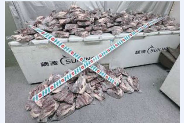
This handout photo released by the Macau Customs Service on Friday shows the seized frozen steak stored at room temperature at a parallel trading den in the peninsula's northern district on Thursday.

Gongbei Customs reminded the public that a large amount of cash is a restricted entry and exit item. Passengers entering and exiting the mainland are required to follow the national regulations and take the initiative to declare any amount of cash exceeding 20,000 yuan or its equivalent in non-mainland currency they are carrying. Any traveller violating the regulations faces a fine. ■