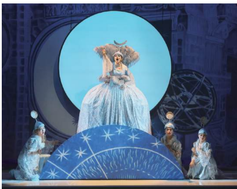
Actors perform "The Magic Flute", an opera composed by Austrian musician Wolfgang Amadeus Mozart, during the closing performance of the 41 st Shanghai Spring International Music Festival in Shanghai yesterday.