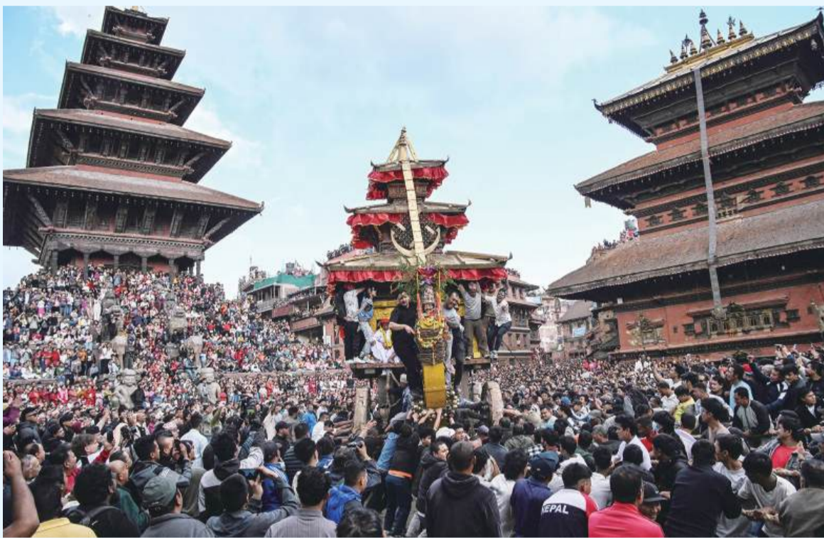
Devotees pull a wooden chariot carrying an idol of the Hindu deity Bhairav during the ‘Bisket Jatra’ festival marking the Nepali New Year in Bhaktapur on the outskirts of Kathmandu on Friday.

South Korea, an ally of Israel’s biggest international backer the United States, has generally maintained a balanced stance on strife in the Middle East, without backing any one side in the conflict.