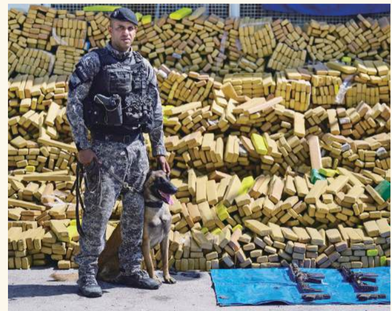
A female police dog that took part in an operation in which 48 tons of marijuana were seized, poses in front of packages containing the drug and weapons at the City of Police in Rio de Janeiro on Wednesday.

RIO DE JANEIRO – Brazilian police last week seized a record 48 tonnes of marijuana in a favela (shantytown) in Rio de Janeiro, uncovered by chance by a sniffer dog during a regular operation against criminal factions.