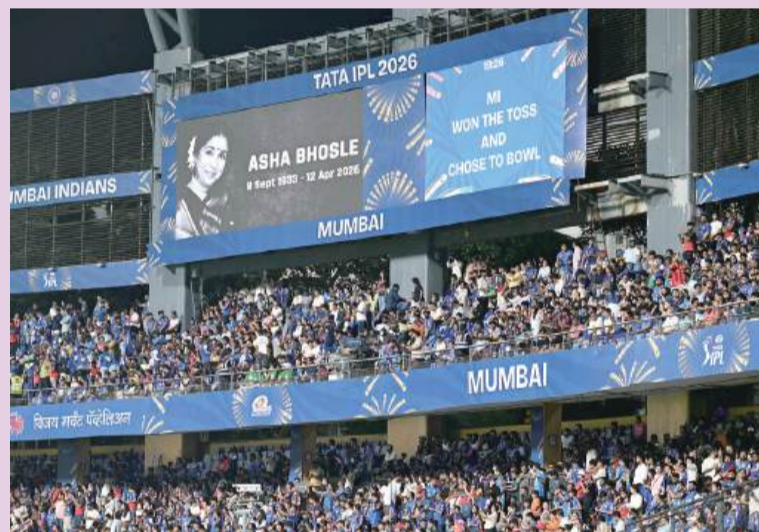
A portrait of late Bollywood playback singer Asha Bhosle is displayed on a digital screen as a mark of tribute before the start of the 2026 Indian Premier League (IPL) T20 match between Mumbai Indians and Royal Challengers Bengaluru at the Wankhede Stadium in Mumbai yesterday. Bhosle, whose voice defined Bollywood music through the 1970s and 80s, died yesterday in Mumbai aged 92, her family said.

MUMBAI – Legendary Indian playback singer Asha Bhosle, whose voice defined Bollywood music through the 1970s and 80s, died yesterday in Mumbai aged 92, her family said.