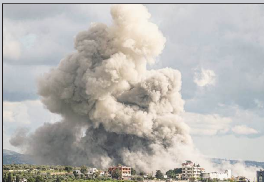
Smoke rises from the site of an Israeli airstrike that targeted an area in the southern Lebanese city of Nabatieh yesterday. Lebanon’s health ministry said yesterday the death toll since the start of the war between Israel and Iran-backed Hezbollah had reached 2,020. The new toll from the Lebanese health ministry includes 248 women, 165 children and 85 medical and emergency personnel killed, along with 6,436 people wounded since Lebanon was drawn into the Middle East war on March 2. – AFP

“We are fully ‘LOCKED AND LOADED,’” he wrote. – AFP