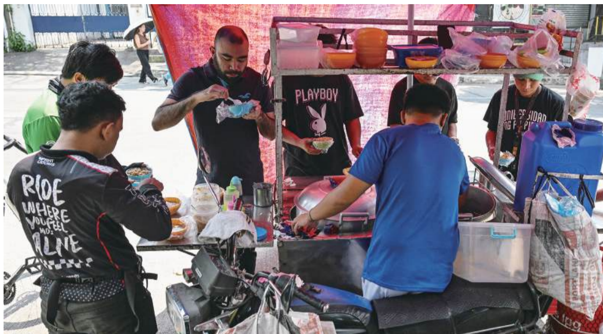
People eat braised beef stew locally known as 'pares' at a stall in Manila last Tuesday.