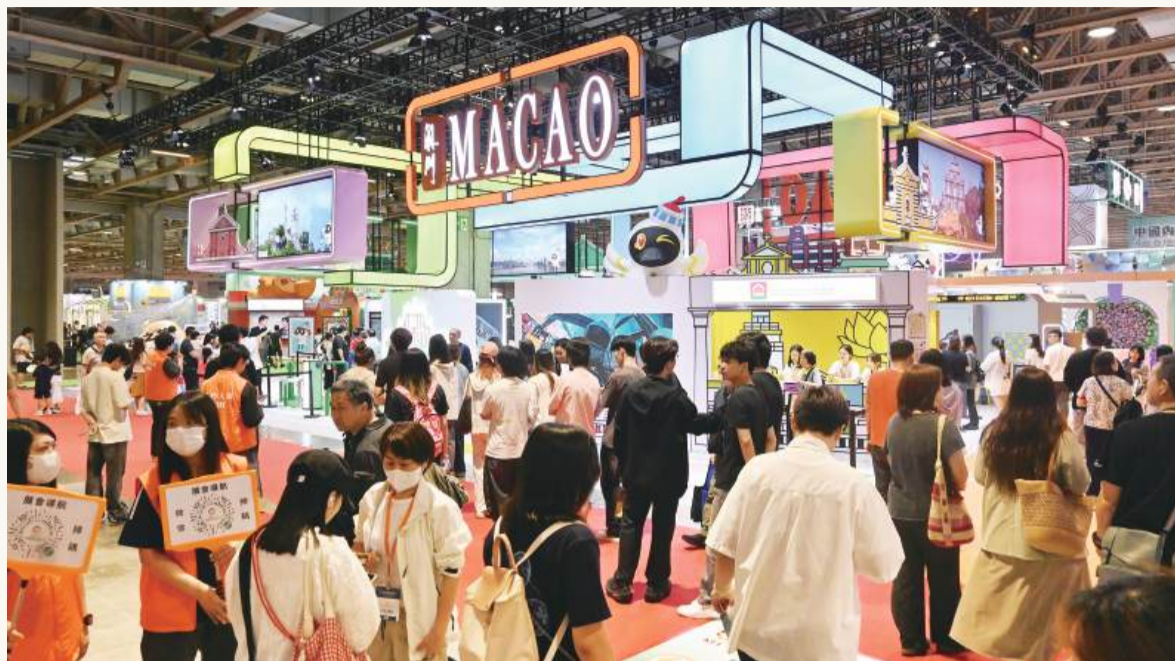
Fairgoers walk around the 14 th Macao International Travel (Industry) Expo during its last day yesterday.