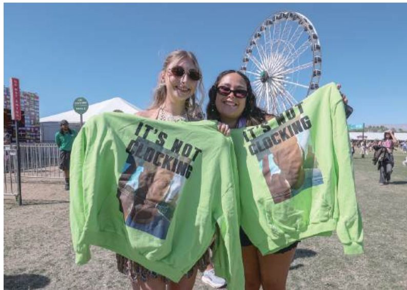
Fans show their Justin Bieber sweaters during the 2026 Coachella Valley Music and Arts Festival in Indio, California on Saturday.

Other acts in the spotlight on Saturday included Nine Inch Noize – the collaboration between legendary industrial band Nine Inch Nails and