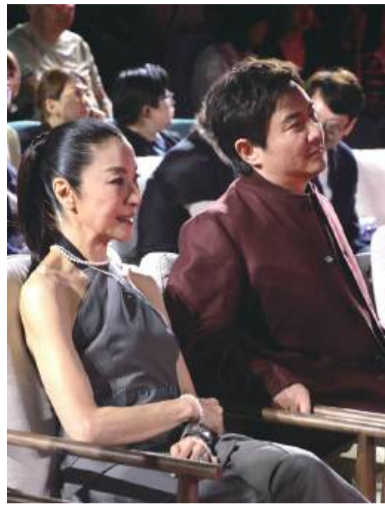
Malaysian-Chinese Academy Award winner Michelle Yeoh (left) sits next to mainland Chinese comedian Shen Teng during yesterday's 3 rd Macau International Comedy Festival at the Hengqin Culture and Art Complex closing ceremony.

Additionally, the closing ceremony was attended by mainland Chinese stars Shen Teng (沈騰) and Ma Li (馬麗). According to DeepSeek, Shen and Ma are a celebrated Chinese comedic actor duo, best known for their long-running partnership in sketch comedy, film, and theatre. They are the core members of the Mahua FunAge; their on-screen chemistry, often portraying a bickering couple or hapless partners,