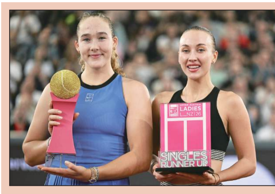
Russia's Mirra Andreeva (left) poses with her golden trophy and Austria's Anastasia Potapova with her silver trophy pose after the women's single final match of the WTA Upper Austria Women's Linz tennis tournament in Linz, Austria yesterday. Andreeva made the perfect start to her clay court campaign as she came from a set down to beat Potapova 1-6, 6-4, 6-3 to land the WTA event in Linz yesterday.

He stayed upright but when it came to the sprint, Van Aert had his number.