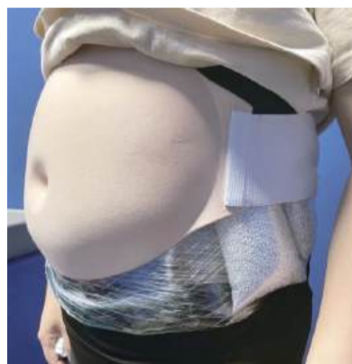
These two handout photos provided by Zhuhai's Gongbei Customs on Wednesday shows 19.206 kilograms of silver granules seized from a female driver feigning to be pregnant, in arrivals of the Hengqin joint checkpoint on March 13.