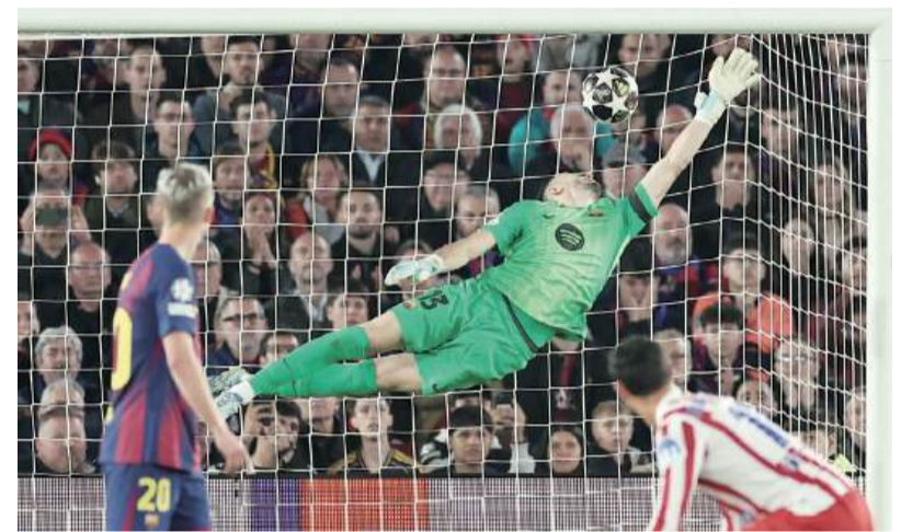
Atletico Madrid's Argentine forward Julian Alvarez (not seen) scores his team's first goal in spite of Barcelona's Spanish goalkeeper Joan Garcia during the UEFA Champions League quarter final first leg between FC Barcelona and Club Atletico de Madrid at Camp Nou Stadium in Barcelona on Wednesday. Atletico Madrid won the game 2-0.