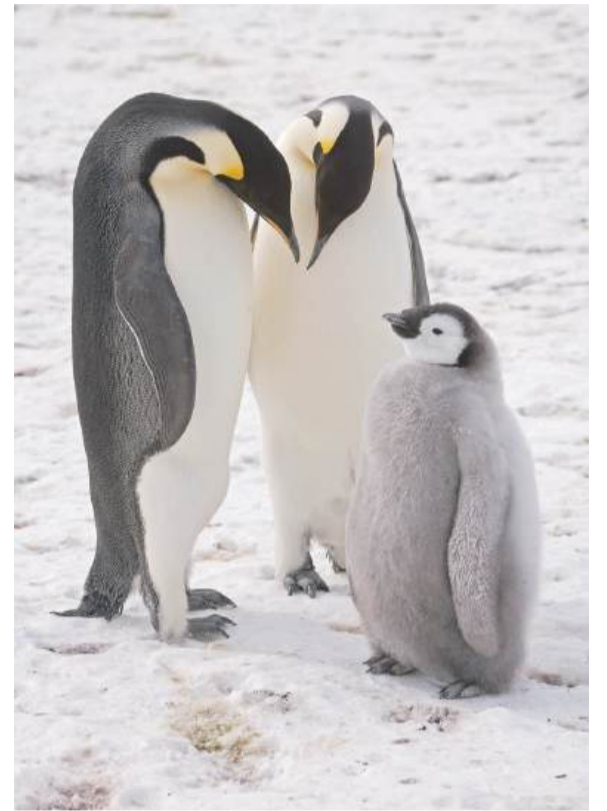
This undated handout photograph, released by The British Antarctic Survey on Wednesday, shows emperor penguins and a chick at the Halley Research Station in Antarctica.

But as global temperatures have reached new