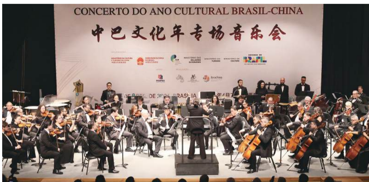
This photo taken on Tuesday shows the “China-Brazil Cultural Year” concert held at the FHE Poupex Theater in Brasília, Brazil. The “China-Brazil Cultural Year” concert opened in the Brazilian capital on Tuesday. Jointly presented by the China National Symphony Orchestra and the Cláudio Santoro National Theater Symphony Orchestra from Brazil, it showcased the cultural charm of both countries through a dialogue of music.

The orchestras will also travel to the historic Brazilian cities of Natal on Thursday and Fortaleza on Saturday to perform classic works from both countries.