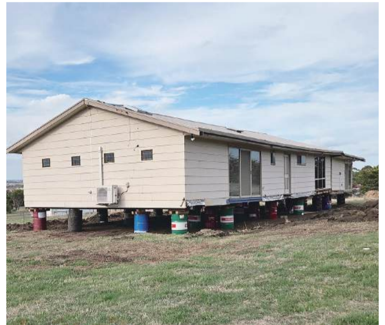
An undated handout photo received yesterday, from Melanie Moor shows a house being made ready to be moved to its correct location after being built on a neighbouring section, in Camperdown, west of Melbourne. – AFP