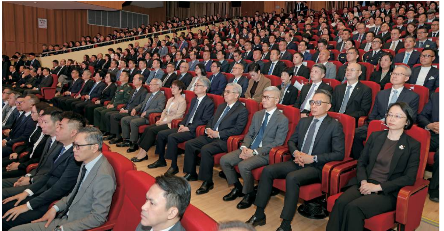
Dignitaries and other guests attend yesterday's session at the University Hall on the University of Macau (UM) campus.

Yesterday's GCS statement said that the central authorities' respective entities attached great importance to the session so that they