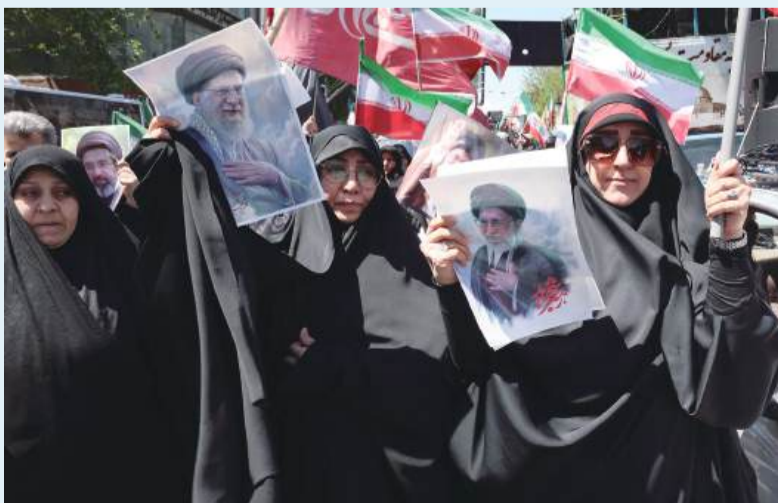
Mourners hold portraits of Iran's slain supreme leader Ayatollah Ali Khamenei during a rally to commemorate his death in Tehran yesterday.

The most notable gatherings took place in the capital Tehran, where airstrikes have ceased since a fragile ceasefire came into effect on Tuesday night, as well as the northwest city of Urmia and northeast Gorgan.