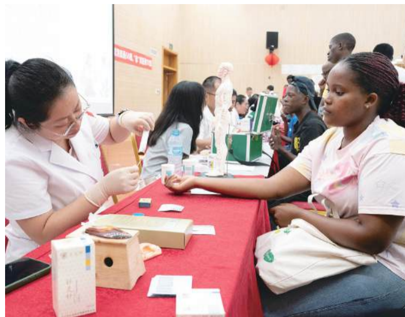
Doctors from the 25 th Chinese medical team in Mozambique provide free medical care at the Confucius Institute of Eduardo Mondlane University in Maputo, Mozambique, on Monday.