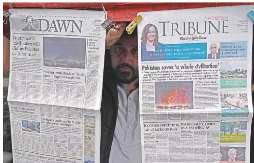
A vendor displays morning newspapers at his roadside stall in Islamabad, Pakistan on Wednesday. Pakistan's Prime Minister Shehbaz Sharif said on Wednesday that the United States, Iran and their allies had agreed to a ceasefire “everywhere”, including Lebanon, following mediation by his government to stop weeks of fighting. — AFP

Afghanistan frequently experiences deadly floods, landslides and storms, particularly in remote areas with fragile infrastructure. — AFP