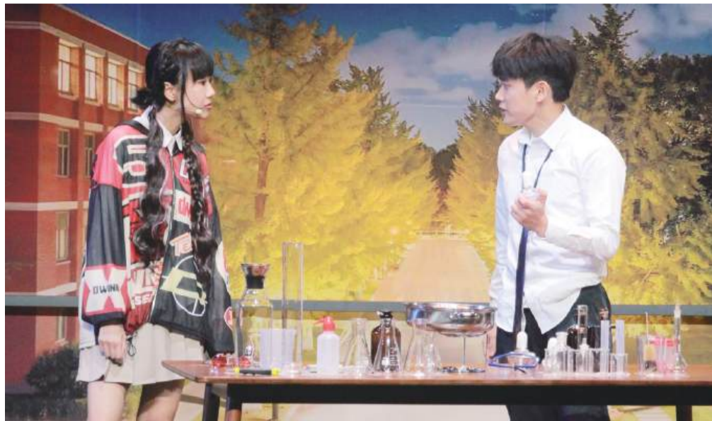
Stage actors perform during the first day of the 3 rd Macau International Comedy Festival at the Hengqin Culture and Art Complex yesterday.