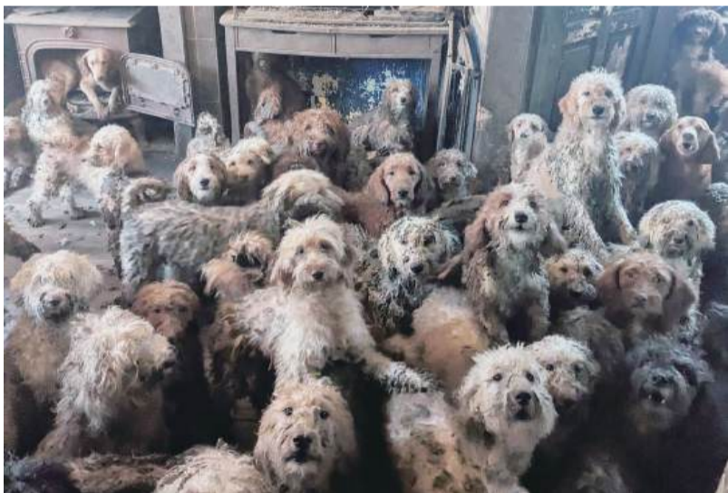
This undated handout photo released to AFP by the Royal Society for the Prevention of Cruelty to Animals (RSPCA) shows scores of poodle-cross dogs being kept in one home, at an undisclosed location in Britain. – AFP

“Over-breeding can take over, and conditions can spiral out of control,” she added. – AFP