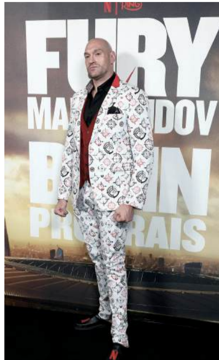
British boxer Tyson Fury poses on the red carpet to attend a “Grand Arrival” event in central London on Wednesday, ahead of the heavyweight boxing match between Britain’s two-time former world heavyweight champion Fury and Russia’s Arslanbek Makhmudov on Saturday.

“Forget Wilder, the man is a shell of himself. Forget anyone else. Let me get