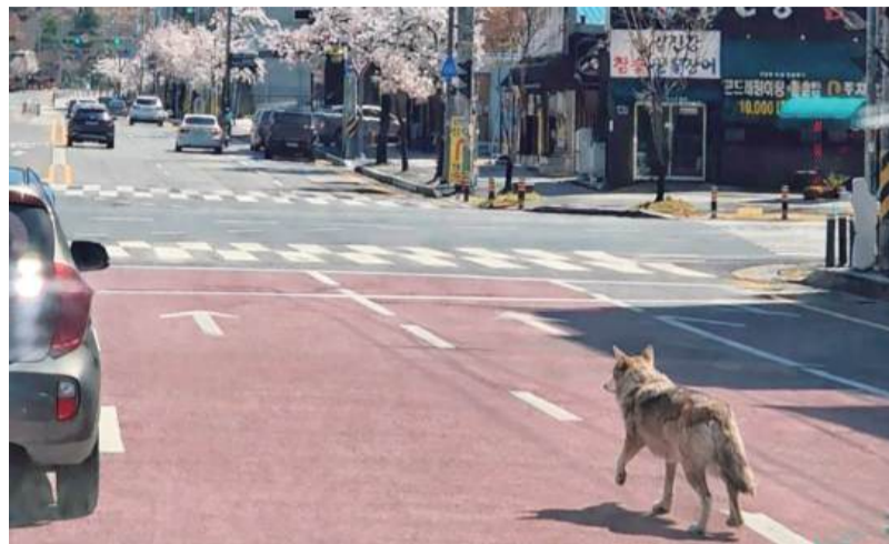
This picture taken and released on Wednesday by Daejeon Fire Headquarters via Yonhap shows a wolf that escaped from a zoo walking on a road in Daejeon, South Korea. – AFP

“We deployed drone cameras early in the morning but had to pull