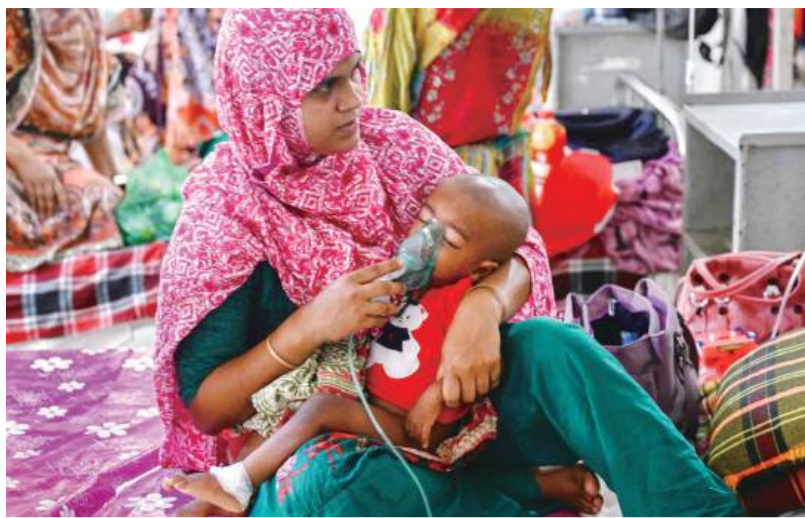
A mother holds a nebulizer on the face of her child receiving treatment for measles in a paediatric ward at a hospital in Dhaka, Bangladesh yesterday. Bangladesh said it suspected measles killed at least 98 children in the past three weeks, official data showed on April 5, with Dhaka ramping up vaccination efforts in the worst-affected areas. — AFP