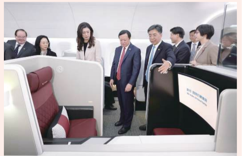
Cheng Li-wun (third from left), chairwoman of the Taiwan-based Chinese Kuomintang (KMT), leads a KMT delegation in a visit to the Commercial Aircraft Corporation of China (COMAC) in Shanghai yesterday.

Several young people from Taiwan shared their experiences of work, daily life, and personal growth in Shanghai.