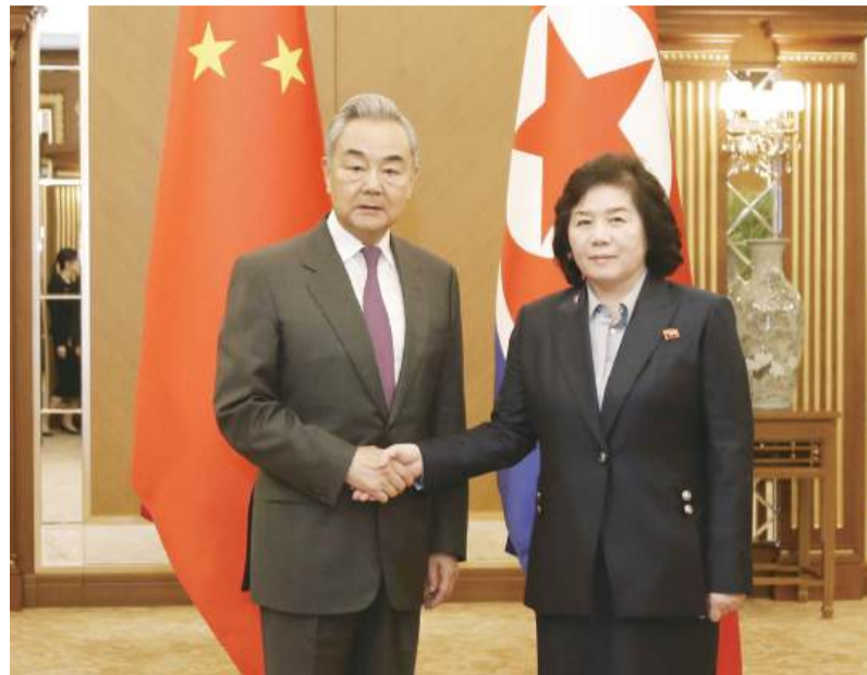
Foreign Minister Wang Yi (left), also a member of the Political Bureau of the Communist Party of China Central Committee, shakes hands with Foreign Minister of the Democratic People's Republic of Korea (DPRK) Choe Son Hui in Pyongyang yesterday.

Wang said China is willing to work with the DPRK side to hold commemorative events for the 65 th anniversary of the signing of the treaty, strengthen high-level exchanges, enhance dialogue and practical cooperation at all levels and in various fields, deepen people-to-people exchanges and mutual understanding, and contribute to respective economic