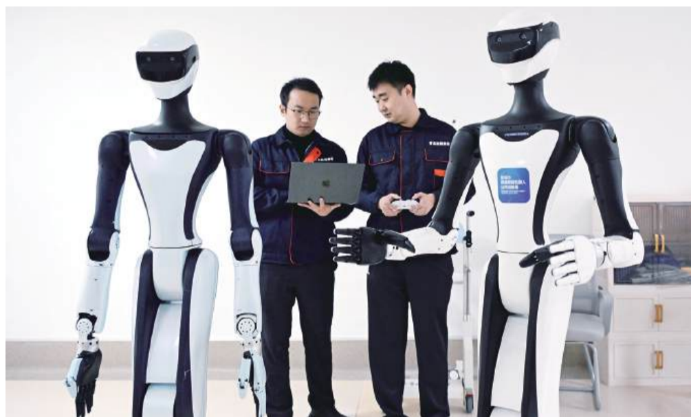
Staff members train robots at the Qingdao Training Center for Elderly Care Robots in Qingdao Shandong Province, yesterday. The Qingdao Training Center for Elderly Care Robots was established in February to teach machines the delicate art of caring for aging humans. Human trainers here guide various robots through repetitions of grasping objects, maintaining balance and twisting switches while mastering the delicate motor skills humans often take for granted. The center has become a hub for tech ambition, with 45 companies, including Haier, Hisense and Agibot, deploying 210 products for modular training across ten categories such as medication delivery, emotional companionship and dementia intervention. The facility creates what officials describe as a closed loop where robots are trained and tested, data is shared, standards are verified, and products are then pushed to market.