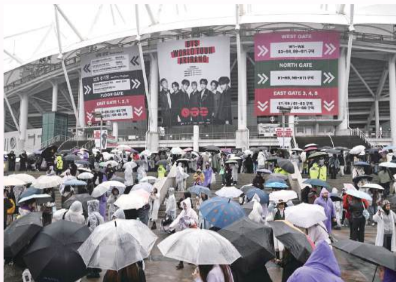
BTS fans arrive at a stadium for a gig by K-pop boy band BTS in Goyang, South Korea, yesterday. BTS kicked off their world tour yesterday, riding the momentum of a chart-topping comeback album and a landmark performance in the heart of Seoul recently.

It follows last month’s statement performance on the doorstep of the historic Gyeongbokgung Palace, which drew more than 100,000