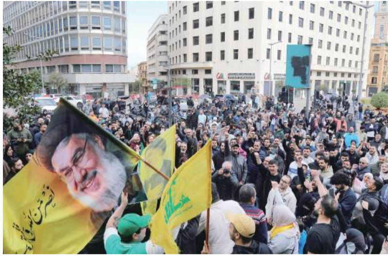
Hezbollah supporters wave a flag bearing a portrait of slain Hezbollah leader Hassan Nasrallah as they stage an anti-government protest outside the Lebanese governmental palace in Beirut yesterday.

requests to open direct negotiations with Israel, I instructed the cabinet yesterday to begin direct negotiations with Lebanon as soon as possible," Netanyahu said.