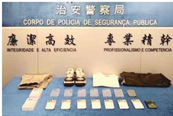
The two undated handout photos provided by the Public Security Police (PSP) yesterday show the fake iPhones and other evidence seized, and a PSP officer escorting the suspect to a police station.