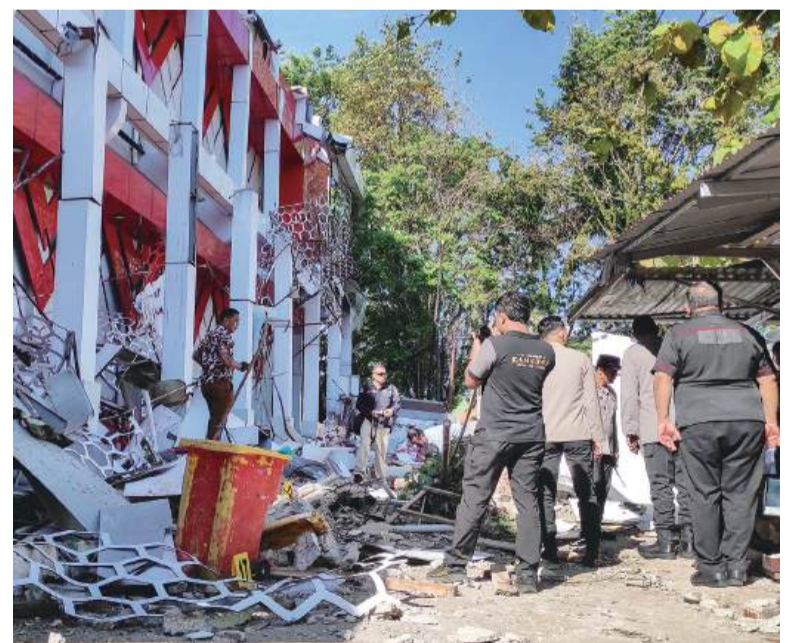
Police officers look at a building of the North Sumatra's National Sports Committee of Indonesia (KONI) damaged following a severe 7.4-magnitude offshore quake in Manado, North Sulawesi yesterday.

A 2018 government probe identified 15 companies involved in similar scams, but no action was taken, allowing them to persist despite new guidelines introduced after warnings from insurers. – AFP