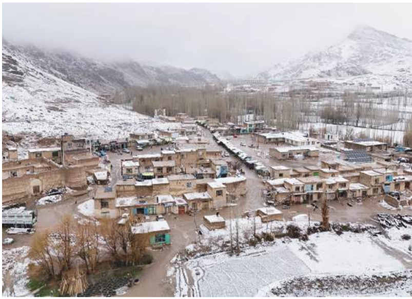
A view of a snow-covered area in Ghazni province, Afghanistan yesterday.