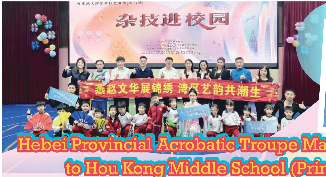
Photos taken in the school's hall yesterday

The Macau Post Daily's The Young Post will be published every Monday to present and discuss topical issues that may interest not only the younger but also all the other generations.