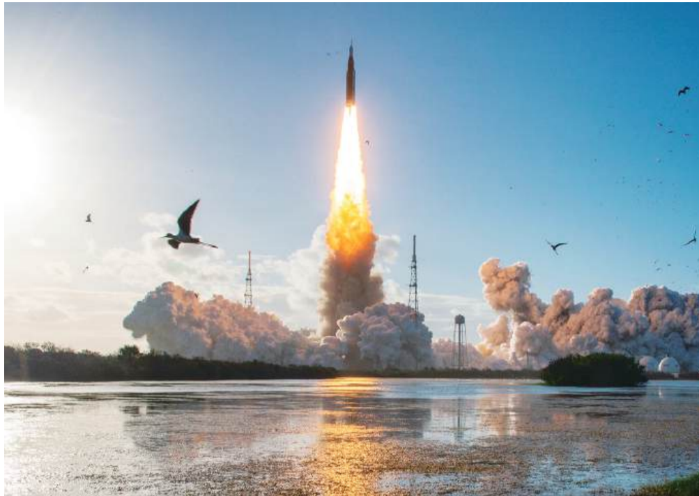
The Artemis II crewed lunar mission lifts off from Pad 39B at Kennedy Space Centre in Cape Canaveral, Florida, on Wednesday. Four astronauts blasted off aboard a massive NASA rocket on Wednesday on a long-anticipated journey around the Moon, the first crewed lunar flyby in more than 50 years.

brave astronauts" at the top of his televised address on Wednesday evening on the war against Iran, calling the launch "quite something."