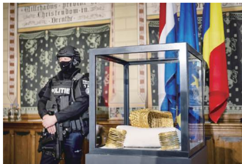
Under police guard, the recovered gold helmet of Cotofenesti and two gold bracelets that were stolen from the Drents Museum are displayed in a glass box in Assen yesterday.

In the aftermath of the theft, then Romanian prime minister