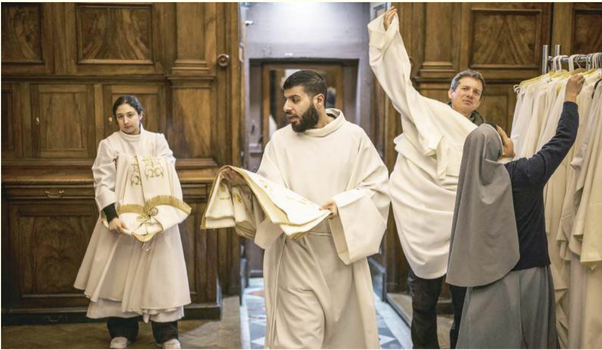
Deacons prepare garments ahead of the Maundy Thursday's Washing of the Feet ceremony at the Christ the Saviour Church in the old city of Jerusalem yesterday. Holy sites in Jerusalem's old city have remained closed for security reasons since the outbreak of the Middle East war on February 28, when Israel and the US launched strikes on Iran.

TEHRAN — Iran yesterday threatened “crushing” attacks on the United States and Israel, firing missiles at Tel Aviv after US President Donald Trump vowed to bomb the Islamic republic “back to the Stone Ages”.