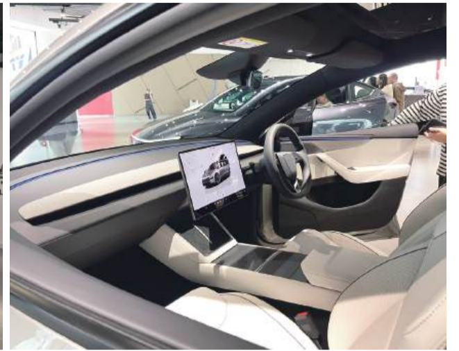
Interior of Tesla Model Y L at Lisboeta Macau in Cotai yesterday.