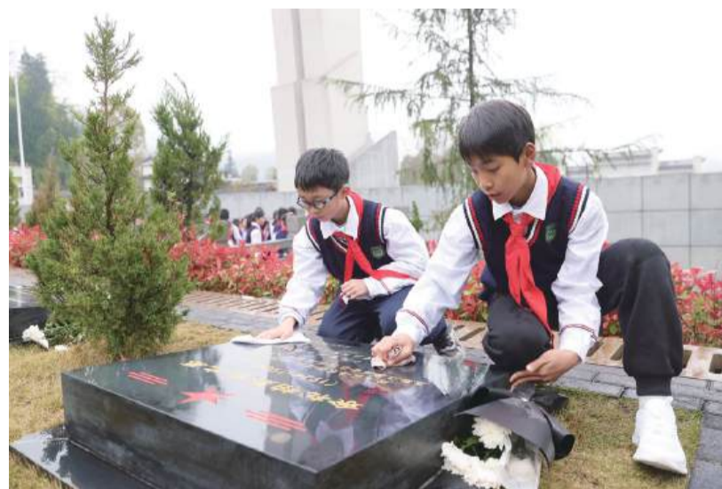
Students clean tombstones at a martyrs' cemetery in Qianjiang District, Chongqing Municipality, yesterday. Citizens across the country attended various activities to pay tribute to martyrs ahead of the Qingming Festival, or Tomb-Sweeping Day, which falls on Sunday, April 5, this year.

Macau's most popular English-language newspaper – Your trustworthy source of news & views