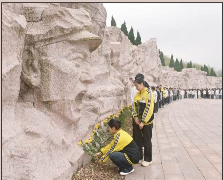
Students lay flowers for Red Army martyrs at a memorial park in Quanzhou County, Guangxi Zhuang Autonomous Region, yesterday. A solemn ceremony takes place ahead of the Qingming Festival, or Tomb-Sweeping Day, to pay tribute to the fallen. – Xinhua

Wang noted that China appreciates Saudi Arabia's commitment to promoting peace and ceasefire, and stands ready to work with Saudi Arabia to make efforts for the early restoration of regional peace. – Xinhua