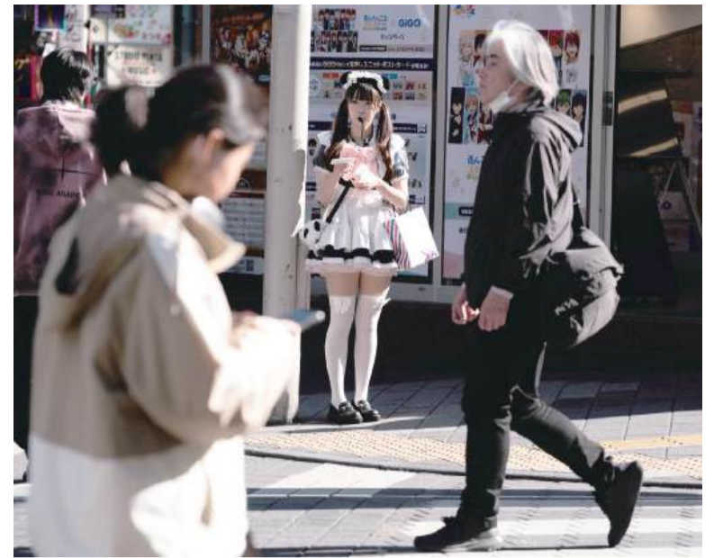
A woman dressed in an anime outfit hands out flyers to people passing in a busy shopping area in Toshima City, Tokyo yesterday. – AFP

The Philippines' announcement of an accord with Iran comes just days after neighbouring Malaysia said its tankers would be permitted to pass through the Strait of Hormuz without paying any toll to Tehran. – AFP