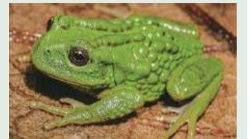
This handout photograph taken and released by the Ceja de Selva (“Eyebrow of the Jungle”) Institute for Sustainable Development Research shows a Gastrotheca mittaliiti , a new species of frog discovered in the Peruvian Amazon. The miniature marsupial frog in the Peruvian Amazon carries its young in a natural pouch on its back, a research institute reported on Wednesday.

The discovery was published in the New Zealand scientific journal Zootaxa and undertaken in collaboration