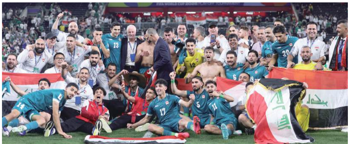
Iraq's players celebrate after winning the 2026 FIFA World Cup qualifiers final playoff against Bolivia at the BBVA Stadium in Guadalupe, Nuevo Leon state, Mexico, on Tuesday.

Music, fireworks and the occasional round of gunfire erupted across Iraq's capital Baghdad early Wednesday after the national team qualified for the World Cup for the first time in decades.