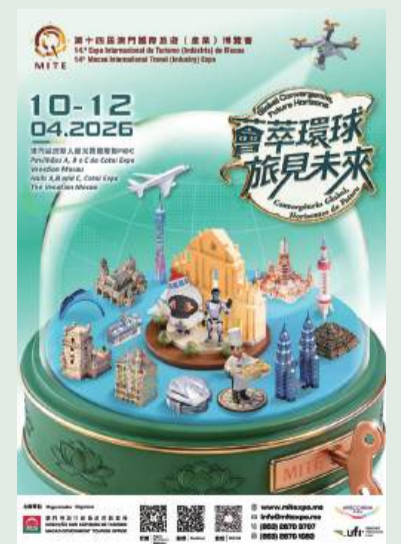
This poster provided by the Macau Government Tourism Office (MGTO) yesterday promotes its upcoming three-day 14 th Macao International Travel (Industry) Expo (MITE) slated to start next Friday at The Venetian Macao’s Cotai Expo.

In addition, instant discount vouchers will be available through Luso International Banking Ltd. via its WeChat mini-programme. The vouchers offer a 100-pataca discount for purchases of 1,000 patacas or above at participating exhibitors, the statement said, noting that the expo will be open to the public with free admission across all three days, alongside shuttle bus services and free parking, as organisers aim to attract visitors and further boost Macau’s tourism sector. ■