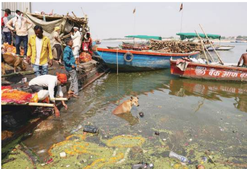
A dog takes a dip in the polluted waters of river Ganges at Manikarnika Ghat in Varanasi, India yesterday. — AFP

“Even after some people had already died due to gunfire on September 8, neither the then prime minister nor any other officials took initiative to stop the shooting,” it added. “Due to such negligence and careless conduct, further human casualties occurred.” — AFP