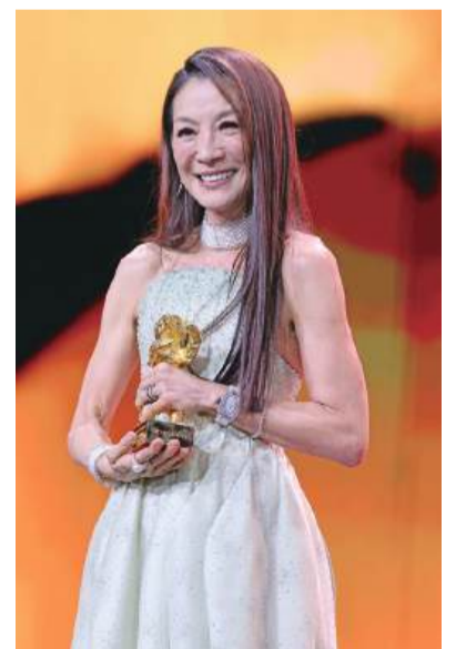
Michelle Yeoh poses with her Honorary Golden Bear at the 76th Berlinale International Film Festival in the German capital on February 12.

*Dato’ and Tan Sri are titles of the Malaysian honours system. Dato’