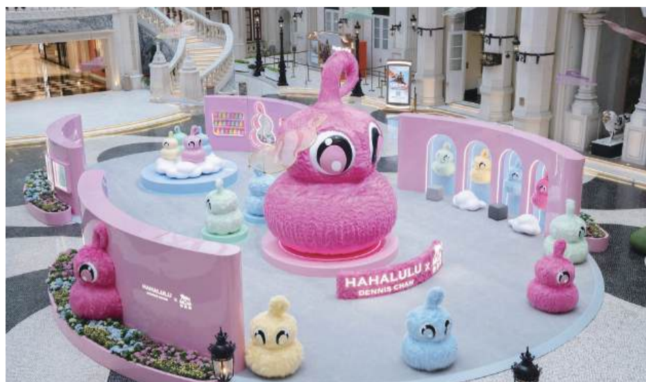
This photo provided by integrated resort operator MGM yesterday shows the "HAHALULU x MGM Trend Art Exhibition" at Grand Praça of MGM MACAU in Nape.