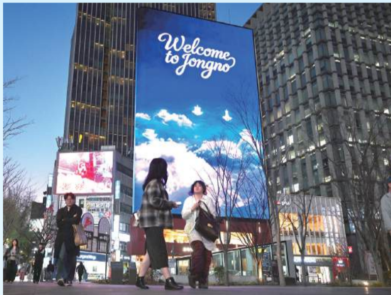
Pedestrians walk in front of digital billboards at Gwanghwamun Square in Seoul on Wednesday. Hopes of making downtown Seoul dazzle more than Times Square in New York have hit a setback with new guidelines to dim the massive digital billboards that light up the South Korean capital after a barrage of complaints. The guidelines took effect on Wednesday.

“Gwanghwamun Square will be reborn as a new media gallery that