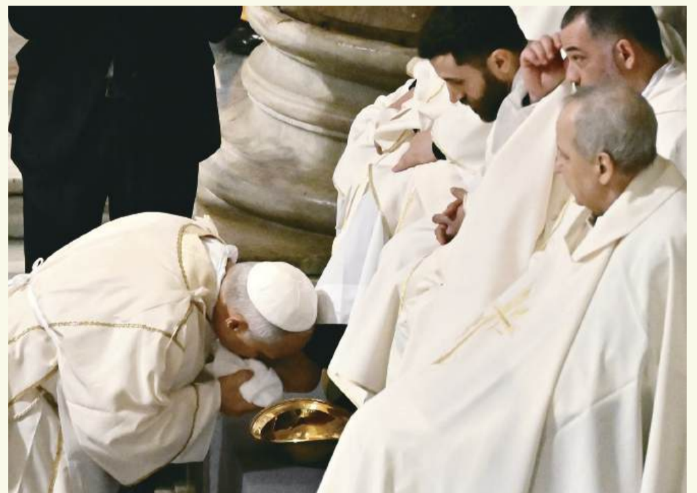
Pope Leo XIV performs the "Washing of the Feet" during the Mass of the Lord's Supper at the St. John Lateran archbasilica in Rome yesterday.

On this occasion, Leo returned to tradition by performing the traditional "washing of the feet" of 12 Roman priests.