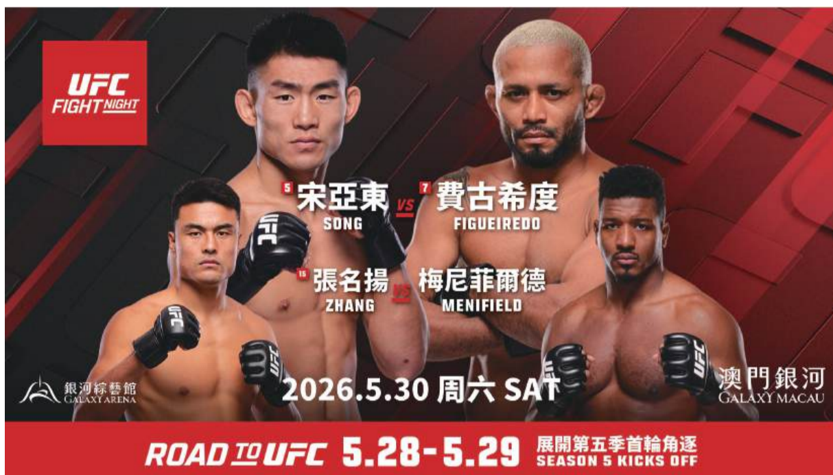
This poster provided by Galaxy Macau yesterday shows the headline fighters in next month's UFC FIGHT NIGHT at Galaxy Arena in Cotai.

The late May events mark the beginning of a four-year agreement that will bring multiple UFC Fight Night events to Macau through 2029, aiming to further strengthen the city's position as a regional hub for major international sporting events, according to the statement. ■