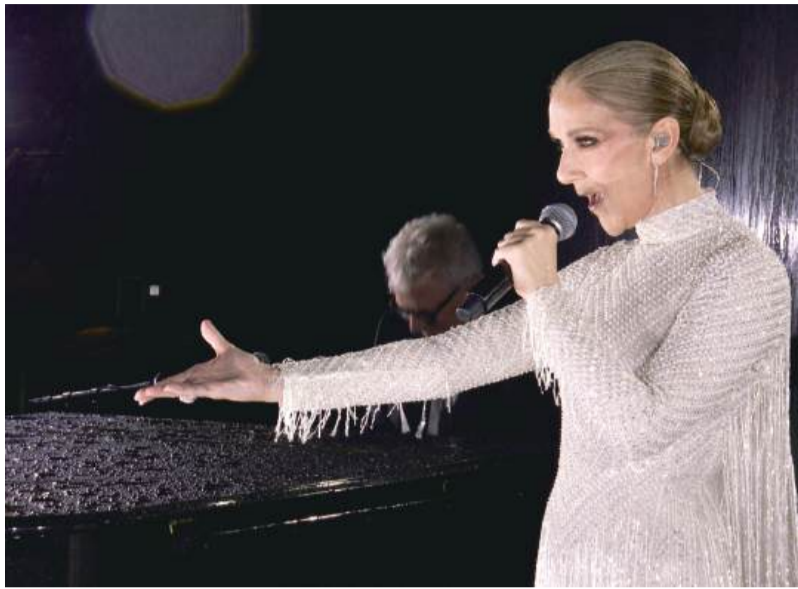
This grab of a video released by the Olympic Broadcasting Services shows Canadian singer Céline Dion performing on the Eiffel Tower during the opening ceremony of the Paris 2024 Olympic Games, in Paris, on July 26, 2024.

“I want to let you know that I’m doing great, managing my health,