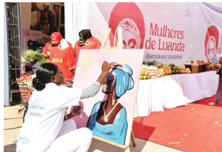
A woman paints during the Women's Meeting of Luanda Province at the Bay of Luanda in Angola last week. More than 100,000 women on Saturday attended the inaugural Women's Meeting of Luanda Province, held under the theme “Women of Luanda, Essence that Transforms”. – Xinhua

The facility is intended to support European launch and recovery operations, positioning Portugal as an Atlantic hub within the broader European space ecosystem. – Xinhua