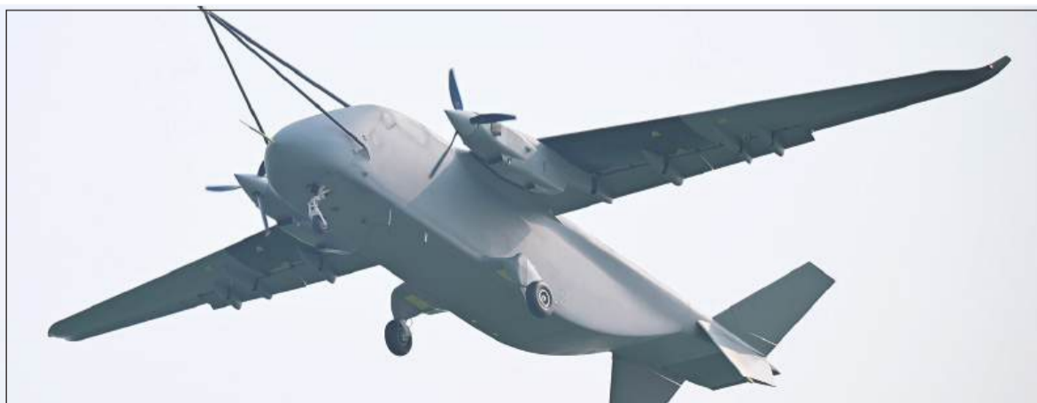
A Changying-8 cargo unmanned aerial vehicle (UAV) conducts a test flight at an airport in Zhengzhou, Henan Province, yesterday. The cargo UAV successfully completed its maiden flight at an airport in Zhengzhou yesterday. The fixed-wing cargo UAV is China's first 7-tonne-class cargo UAV platform validated through flight test. The Changying-8 cargo UAV has an ultra-large cargo compartment with a volume of 18 cubic meters, a maximum takeoff weight of 7 tonnes, and a maximum payload capacity of 3.5 tonnes. It can accommodate diverse loading requirements, including conventional supplies, fresh and cold-chain goods, and emergency equipment. The aircraft boasts a maximum range exceeding 3,000 kilometers.