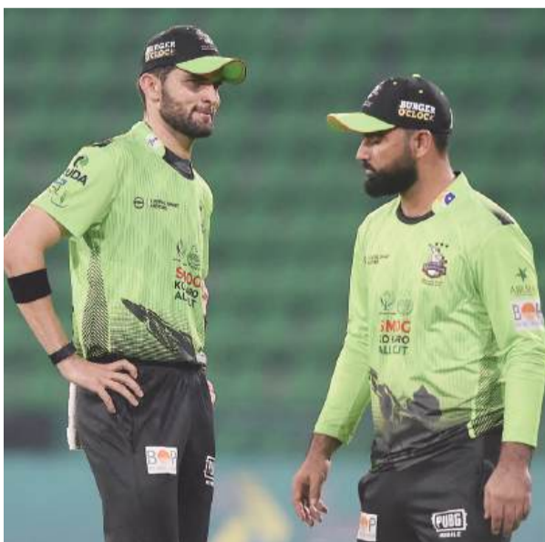
Lahore Qalandars' captain Shaheen Shah Afridi (left) speaks with teammate Fakhar Zaman during the Pakistan Super League (PSL) T20 match against Karachi Kings at the Gaddafi Cricket Stadium in Lahore, Pakistan on Sunday 2026.