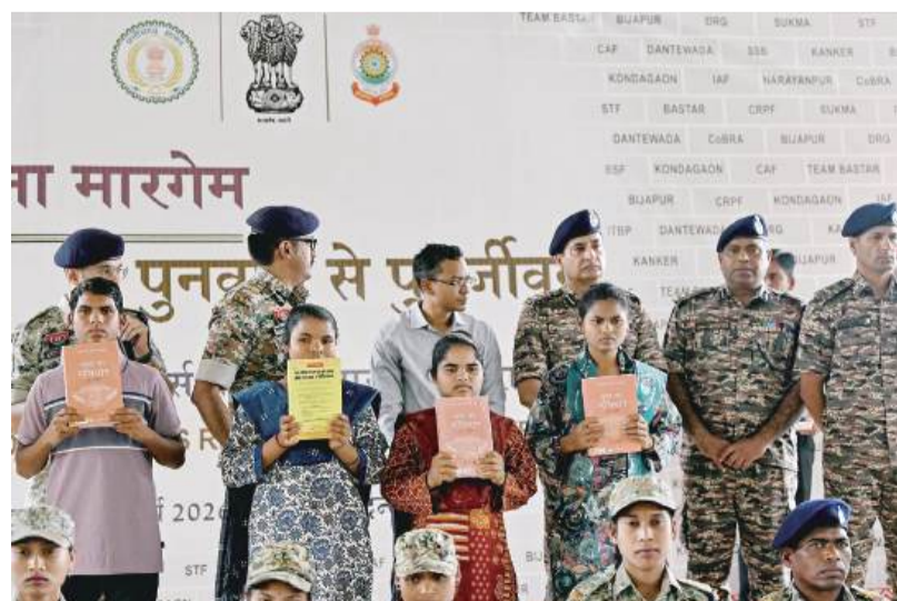
Security personnel pose with Maoist rebels and fighters upon their surrender, at a police facility in Dantewada in Chhattisgarh state's Bastar division, India yesterday. India on Monday, declared the country free of the Maoist insurgency, fulfilling a long-standing deadline to defeat the decades-long rebellion.