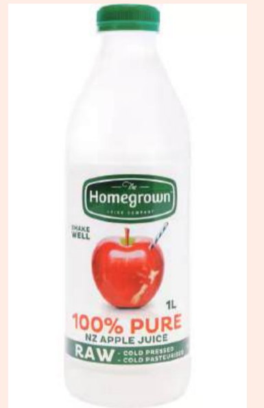
This image downloaded from Woolworths website yesterday shows its "100% PURE NZ APPLE JUICE".

According to the statement, businesses possessing the products should also immediately cease supplying and selling them, and contact the bureau's Food Safety Department on 2833 8181, while continuing to monitor the situation to prevent the affected products from circulating in the market. ■