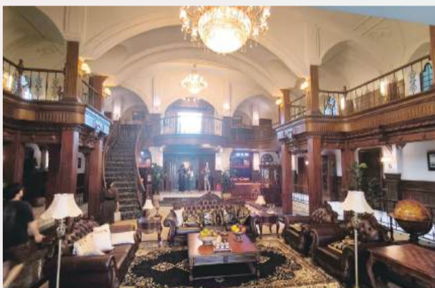
Journalists visit a film set in the Hengqin International Film Studio during last week's tour.

Last week's media trip was jointly organised by the Macau Government Information Bureau (GCS), the zone's Administrative Affairs Bureau, and the Publicity, Culture and Sports Department of the Central People's Government Liaison Office in the MSAR.