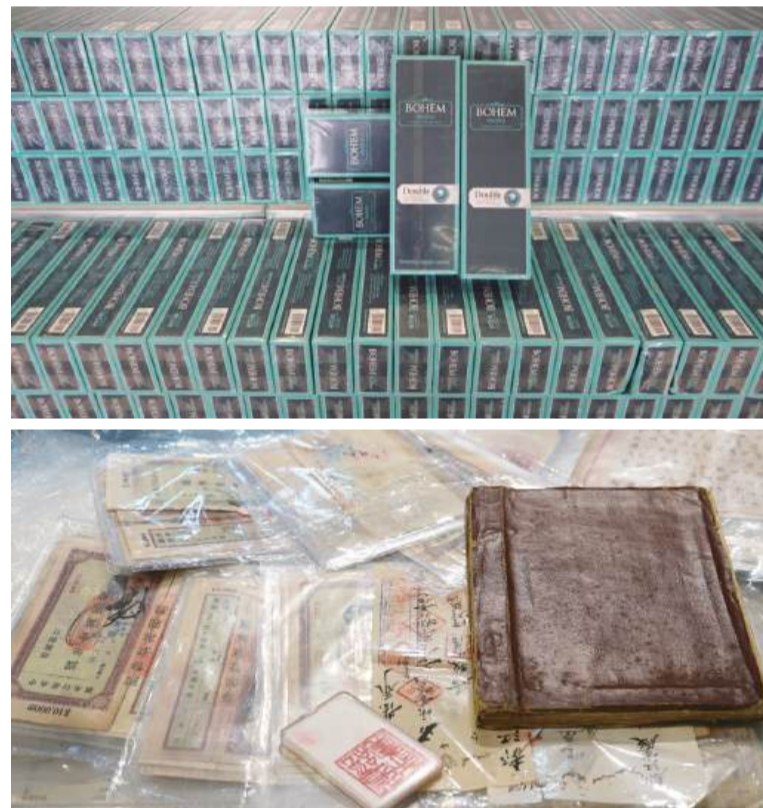
These undated handout photos provided by Zhuhai's Gongbei Customs yesterday shows cigarettes and cultural relics seized by its officers at the Hong Kong-Zhuhai-Macao Bridge's Zhuhai checkpoint and Qingmao checkpoint, respectively.

According to the statement, customs officers at the Qingmao checkpoint's passenger inspection hall noticed an abnormal image during the X-ray inspection of a traveller's hand luggage.