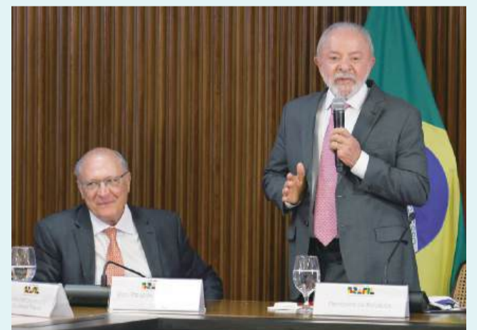
Brazil's President Luiz Inácio Lula da Silva (right) delivers a speech next to Vice-President Geraldo Alckmin during a ministerial meeting at the Planalto Palace in Brasília yesterday.

The younger Bolsonaro, who serves in the Senate, was anointed presidential candidate by his father after the Supreme Court sentenced the latter to 27 years in prison for plotting to stay in power after losing the 2022 election to Lula.