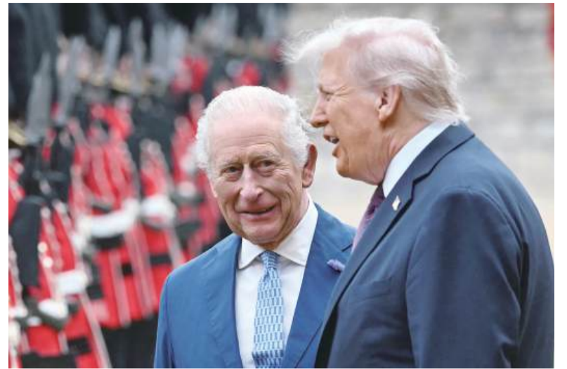
Britain's King Charles III (left) and US President Donald Trump talk as they inspect a guard of honour during a ceremonial welcome in the Quadrangle at Windsor Castle, in Windsor, on September 17, 2025, during the US president's second state visit.

"I'm disappointed with Keir," Trump has also said, slamming Starmer's "big mistake".