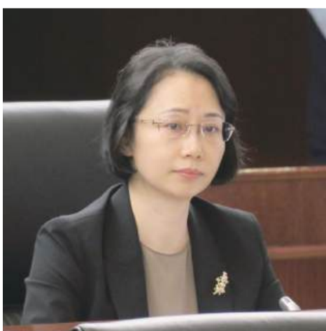
Secretary for Social Affairs and Culture Wallis O Lam addresses yesterday's plenary session in the legislature's hemicycle.