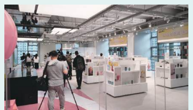
Journalists visit the park's Global Product Selection Centre last week.