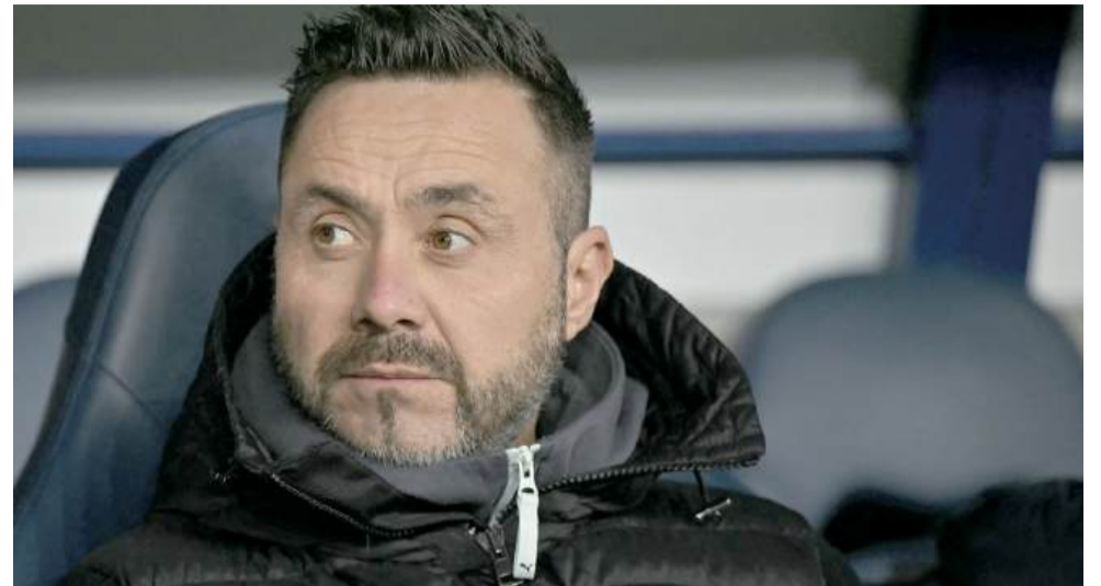
Marseille's Italian coach Roberto De Zerbi looks on from the technical area during the French Cup round of 32 football match against FC Bayeux at the Michel-d'Ornano Stadium in Caen on January 13.

His time at Marseille also started well, with the club finishing second to Paris Saint-Germain in Ligue 1 last season to qualify for