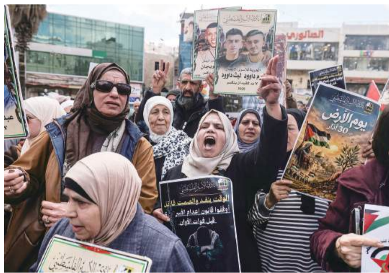
Relatives of Palestinian prisoners hold portraits and shout slogans during a rally in the Israeli-occupied West Bank city of Nablus yesterday, protesting against a bill approved by Israel's parliament that would allow the execution of Palestinians convicted on terror charges for deadly attacks.

"This fascist and racist legislation reflects the reality of the occupation," he said. "It applies to Palestinians – not to Israeli Jews who carry out daily violence against Palestinian civilians."