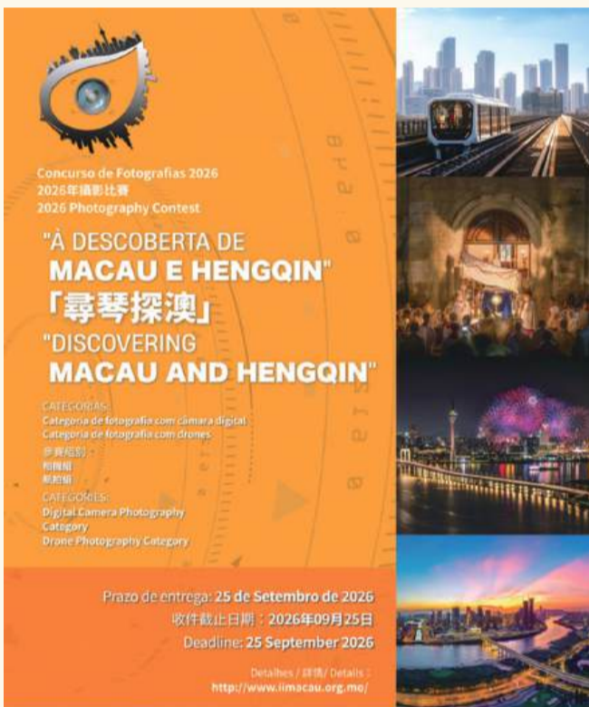
This poster provided by the International Institute of Macau (IIM) promotes its 2026 Photography Contest titled "Discovering Macau and Hengqin".

The deadline for submissions is September 25. Further details are available from IIM's website https://iimacau.org.mo/ . ■