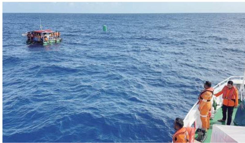
Rescuers approach surviving crew members during a rescue operation in the waters of South Bolaang Mongondow, North Sulawesi, Indonesia, yesterday. All 21 crew members of the motor vessel Nazila 05 were rescued alive by a joint search and rescue (SAR) team after the boat sank in waters north of Taliabu Island in Indonesia's North Maluku province, local authorities said yesterday.

occurrence in the Southeast Asian archipelago, due in part to lax safety standards and inclement weather.