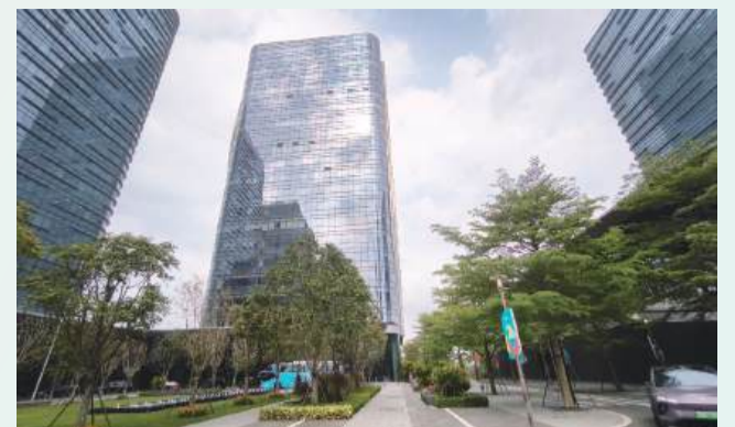
This photo taken last week shows Block 8 of the complex.

She noted that the zone's executive committee bought a commercial complex in Hengqin comprising nine high-rises for the establishment and operation of the Service Centre.