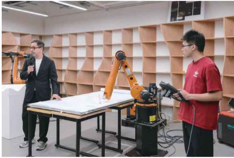
This undated handout photo provided by the University of Saint Joseph (USJ) shows two KUKA robots at the USJ Robotic Lab at the Kent Wong Exhibition Gallery on the Ilha Verde Campus of the private Catholic university. The photo provided by the university was uncaptioned.

The statement noted that the lab's projects bring together cutting-edge technology with traditional craftsmanship and locally sourced