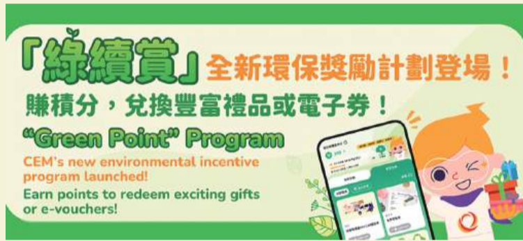
This poster provided by CEM yesterday promotes the use of its new "Green Point" environmental incentive.

"Through this initiative, CEM hopes to integrate energy conservation and carbon reduction into the daily lives of citizens, encouraging more citizens to join the movement and injecting a steady stream of green momentum into Macau's sustainable development", the statement said. ■