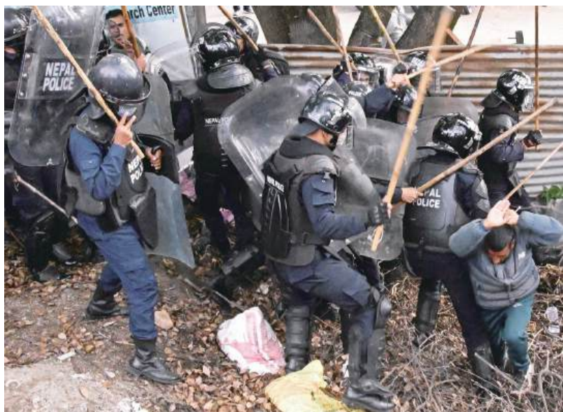
Police personnel clash with supporters of Nepal's former prime minister Khadga Prasad Sharma Oli, during a protest against his arrest in Kathmandu on Sunday. Nepal's Supreme Court yesterday ordered the government to justify the detention of former prime minister Oli, arrested for his alleged role in a deadly crackdown on 2025 protests that ousted him.

The order came as hundreds of his supporters marched demanding the release of Oli, blocked by heavy police deployments as they neared the charred old parliament building, set on fire in the September violence in which at least 76 people were killed. — AFP