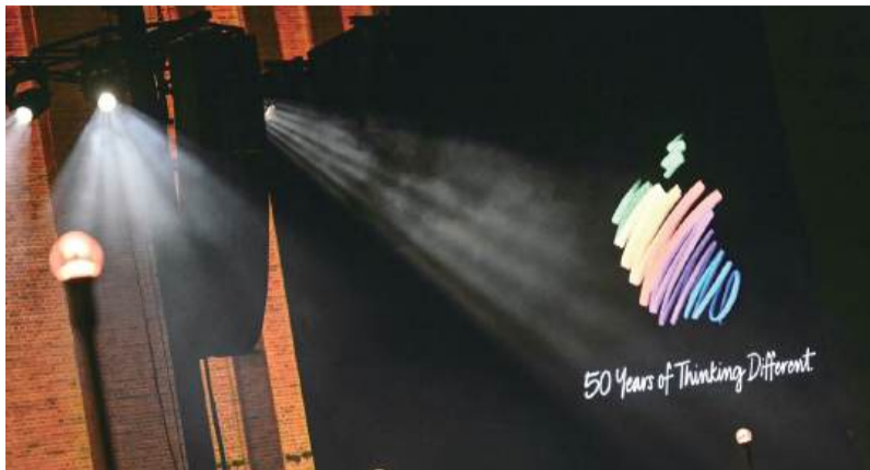
The Apple logo is pictured on a large digital screen at the start of celebrations at the Battersea Power Station in central London last Wednesday, to mark the 50 th birthday of US tech giant Apple. Apple celebrates its 50 th anniversary as AI challenges the Silicon Valley legend to prove it can deliver yet another culture-changing innovation. Apple's hit products – the Mac, the iPhone, the Apple Watch and the iPad – command a cult-like following, long after the company's humble beginnings on April 1, 1976 in Steve Jobs' Cupertino, California garage.

simple notion that technology should be personal, and that belief – radical at the time – changed everything,” chief executive Tim Cook said in an anniversary letter posted online.