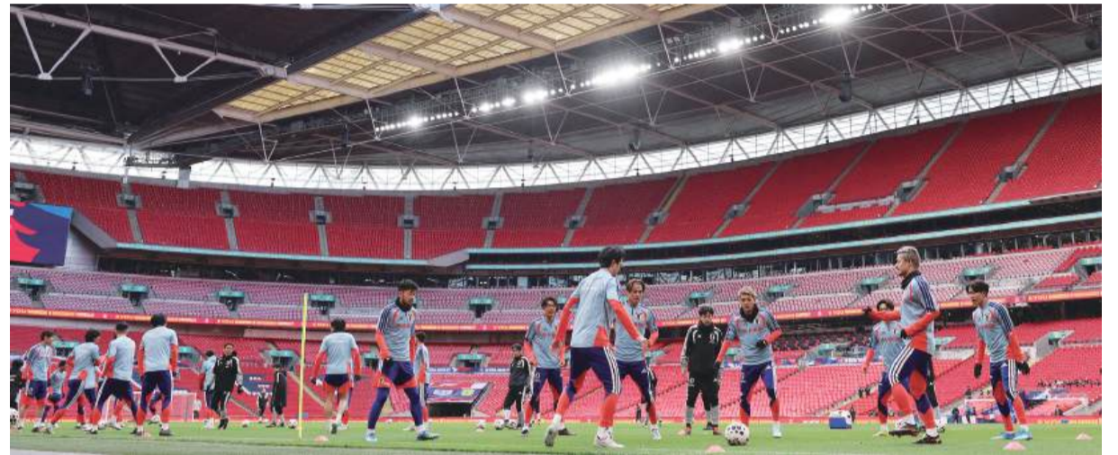
Japan's players take part in a team training session at Wembley Stadium, in London, yesterday, on the eve of their international friendly football match against England. The game will be played at 2:45 a.m. tomorrow Macau time. – AFP

"I will only be satisfied if the people watching the team can see that is going on." – AFP