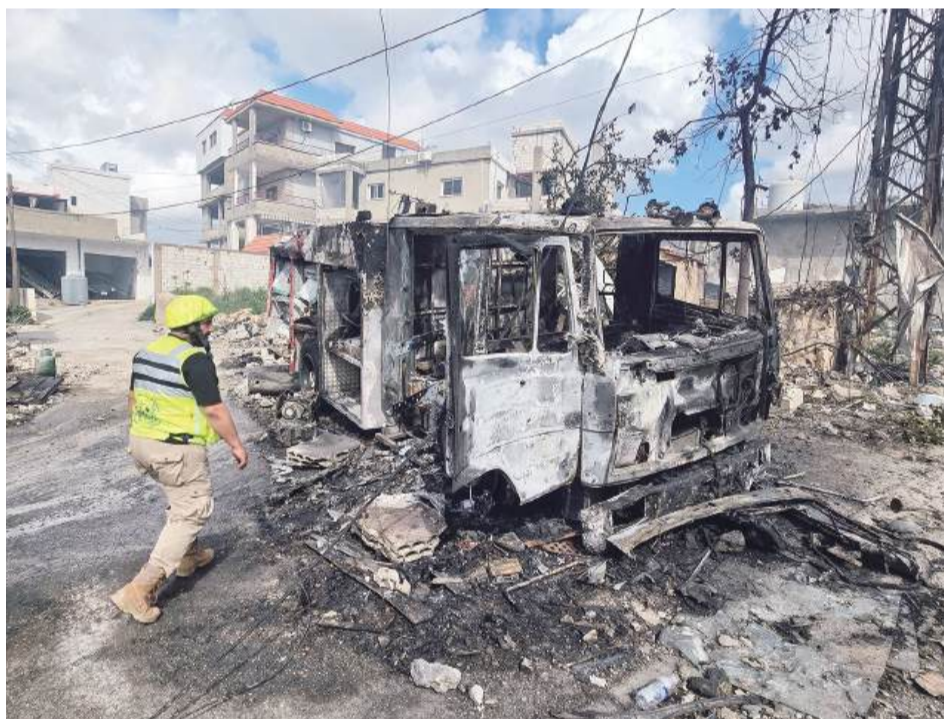
A first responder walks towards the wreckage of a vehicle at the site of an Israeli airstrike in the southern Lebanese village of Hanouiyeh, east of Tyre, yesterday. Israel renewed its bombardment of Beirut's southern suburbs on March 30 while continuing air strikes on Lebanon's south, one of which targeted an army checkpoint and killed a soldier.

A military source told AFP that the strike was the first direct targeting of a