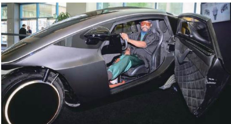
US musician and tech entrepreneur Will.i.am poses inside Trinity, an AI-powered electric three-wheeled vehicle, at Nvidia's annual GTC developers conference, in San José, California on March 17, 2026.

An initial production of run of 500 units is planned, with an aim to begin deliveries in August of next year, and to keep the vehicle's price at less than US$30,000.