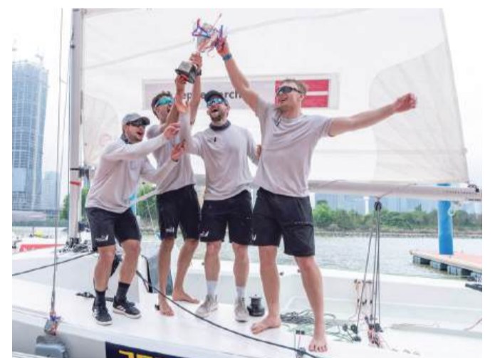
on Sunday shows the Danish team celebrating their victory at the 2026 World Match Racing Tour – Macao Match Cup, on their boat at the pier of the International Yacht Club in Taipa that day.