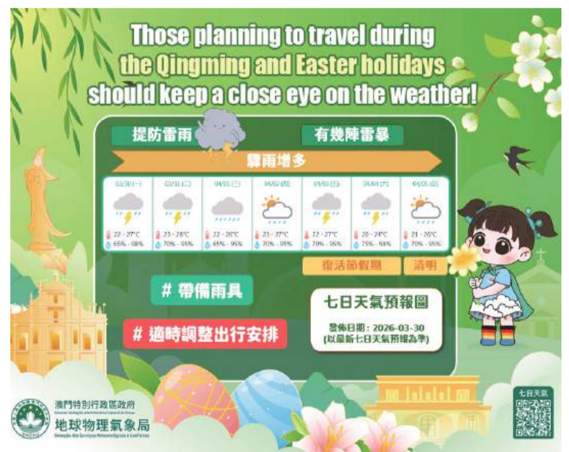
This image provided by the Macau Meteorological and Geophysical Bureau (SMG) yesterday forecasts this week’s weather in Macau.

The bureau urges residents to stay updated on the latest weather information from local meteorological authorities, whether they are planning local activities or travelling abroad, the statement said, adding that in the event of severe convective weather, they should seek shelter immediately in