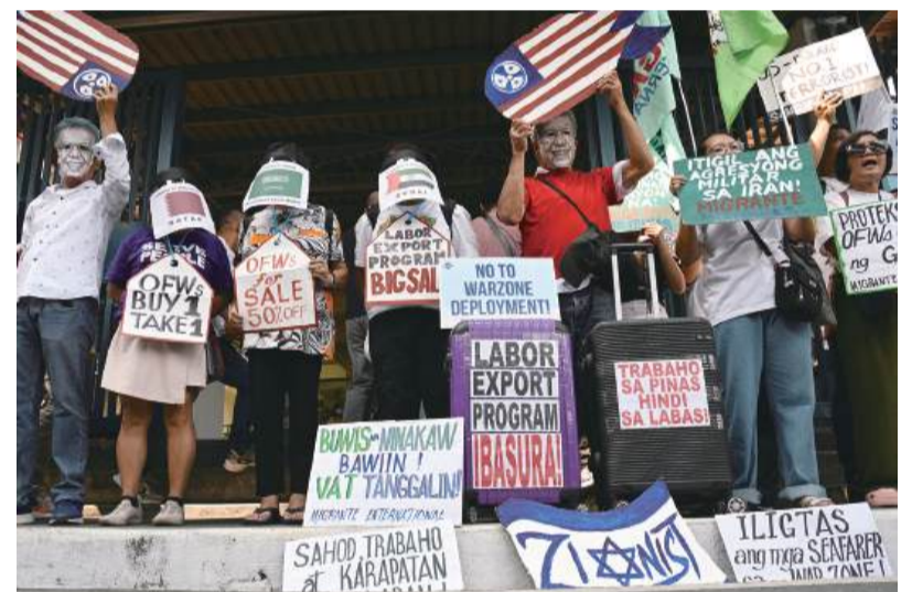
Activists demonstrate in front of the Department of Migrant Workers (DMW) headquarters in Manila yesterday, as they call for the protection of Philippine migrant workers in the Middle East after US-Israeli strikes on Iran last month triggered a war in the region. — AFP

On March 7, three Ghanaian soldiers were wounded by gunfire in a border town in southern Lebanon. — AFP