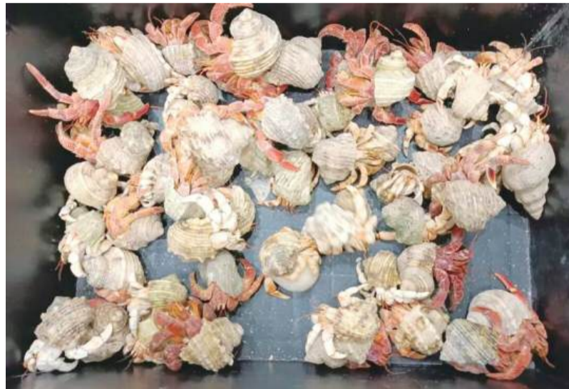
This undated handout photo released by Gongbei customs yesterday shows the seized hermit crabs.

Yesterday's statement said that, based on technical assessments, Gongbei customs has confirmed that the crabs are all Coenobita perlatus specimens. ■