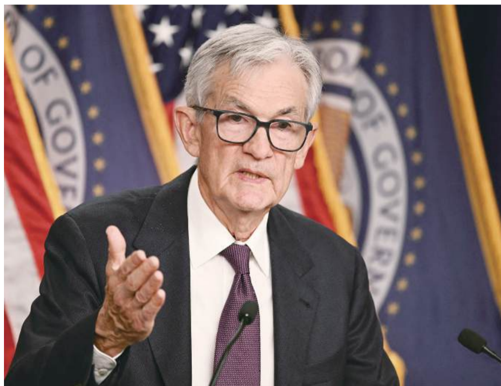
US Federal Reserve Chair Jerome Powell speaks during a press conference following the Federal Open Market Committee meeting at the Federal Reserve Board Building in Washington, DC, on March 18, 2026. Powell said yesterday that the US central bank can look past the energy shock from war in the Middle East, but may have to act if rising costs change expectations about inflation.

WASHINGTON – US Federal Reserve Chair Jerome Powell said yesterday that the central bank can look past the energy shock from war in the Middle East, but may have to act if rising costs change expectations about inflation.