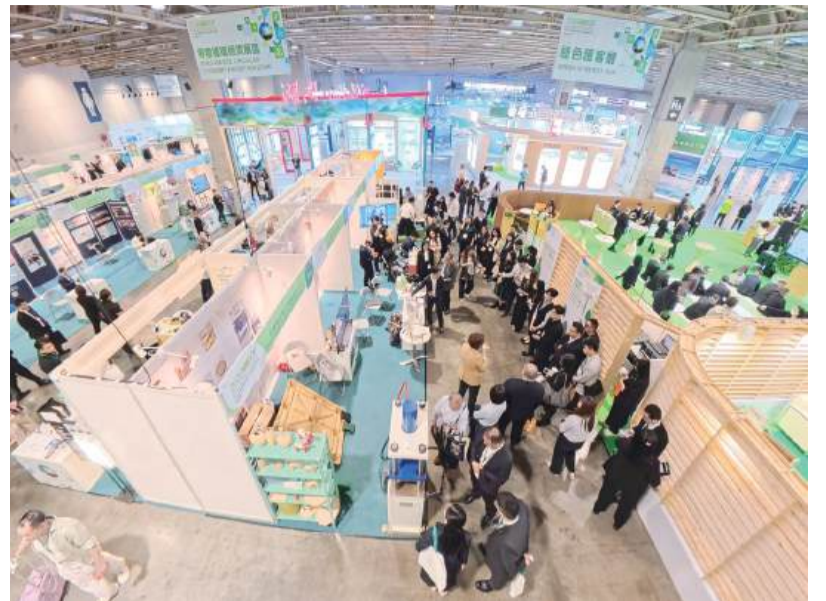
This photo provided by the Macao International Environmental Cooperation Forum and Exhibition (MIECF) on Saturday shows a top-down view of some of the three-day fair's zones.

The Commerce and Investment Promotion Institute (IPIM) also presented Macau and Hengqin's investment advantages to over 170 enterprises. So far, 35 firms from Brazil, Portugal and the Chinese mainland have signalled intent to invest in Macau – a 60 percent year-on-year increase. The statement added that 15 of them have begun or completed procedures to set up companies in Macau. ■