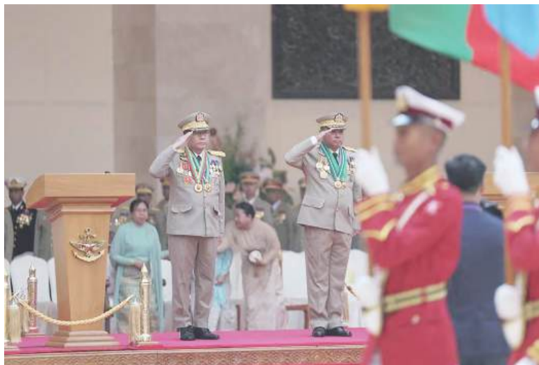
This handout picture taken and released yesterday by the Myanmar Military Information Team shows Myanmar's outgoing military chief Min Aung Hlaing (left) and his successor Ye Win Oo saluting an honour guard during a handover ceremony in Naypyidaw.