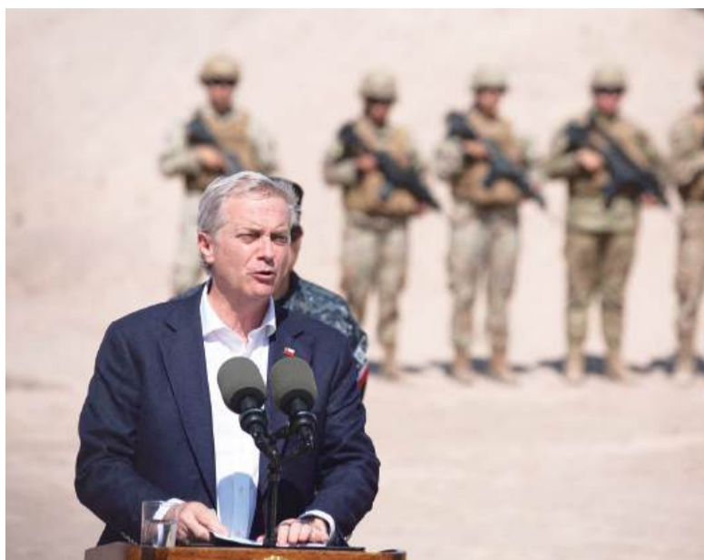
Chile’s rightwing President José Antonio Kast speaks next to soldiers near the Chacalluta border post along the Chile-Peru border on March 16, 2026.

Kast’s election brought the most right-wing president to power in Chile since the military dictatorship of Augusto Pinochet from 1973 to 1990.