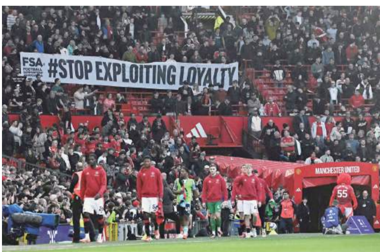
United fans, many wearing black as a protest, display a banner in the crowd against seat prices and the current ownership of Manchester United ahead of the English Premier League football match against Arsenal at Old Trafford in Manchester, north west England, on March 9, 2025.

He has made just seven appearances for the Serie A champions in all competitions this term as they have endured a tough title defence - Napoli currently trail league leaders Inter Milan by seven points. – AFP