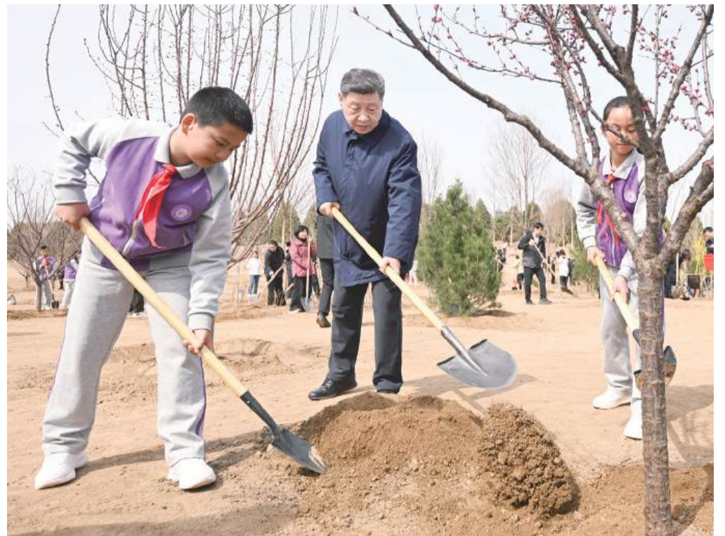
President Xi Jinping (center), also general secretary of the Communist Party of China (CPC) Central Committee and chairman of the Central Military Commission, plants a tree during a voluntary tree-planting activity at Baishan Town in Changping District of Beijing yesterday.

Xi emphasized the importance of facilitating the channels for realizing the value of ecological products, and advancing urban and rural greening in a coordinated manner.