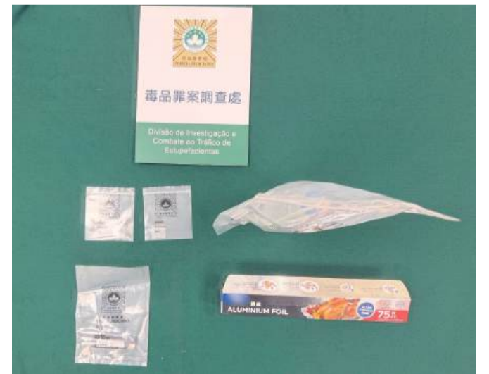
This undated handout photo provided by the Judiciary Police (PJ) yesterday shows evidence seized from the hotel guestroom booked by the drug-taking quartet and the suspects' drug-taking paraphernalia.

The quartet have meanwhile been transferred to the Public Prosecutions Office (MP), facing charges of drug-taking and possession of drug-taking paraphernalia; additionally, Gao faces a drug-trafficking charge. ■