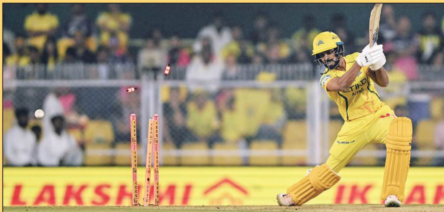
Chennai Super Kings' captain Indian cricket player Ruturaj Gaikwad is clean bowled during the 2026 Indian Premier League (IPL) T20 match against Rajasthan Royals at the Barsapara Cricket Stadium in Guwahati, India yesterday. Rajasthan Royals won by 8 wickets with 47 balls left.

Bearman said: "I think we've, as a group, warned the FIA what can happen, and this has been a really unfortunate result."