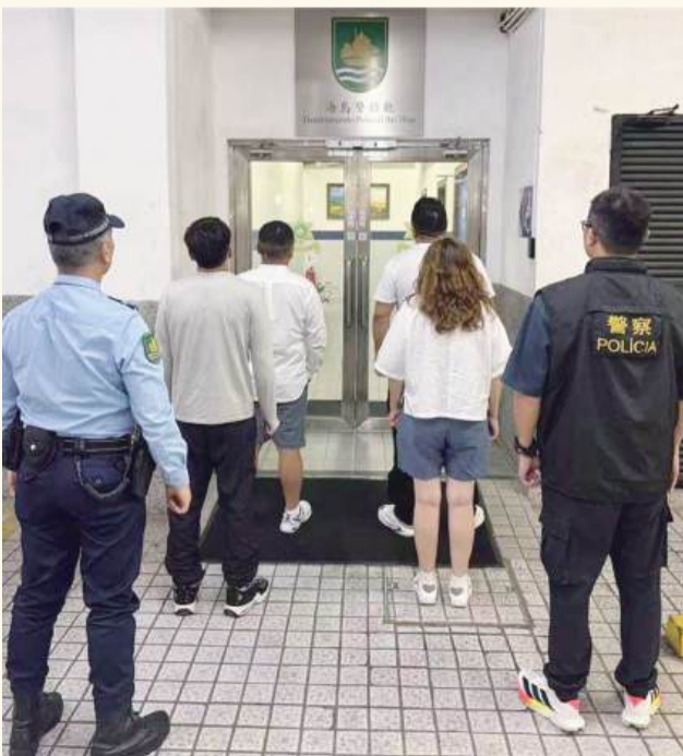
This undated handout photo provided by the Public Security Police (PSP) yesterday shows PSP officers escorting the four Mongolian theft suspects to a police station.

The quartet have meanwhile been transferred to the Public Prosecutions Office (MP), facing theft charges. ■