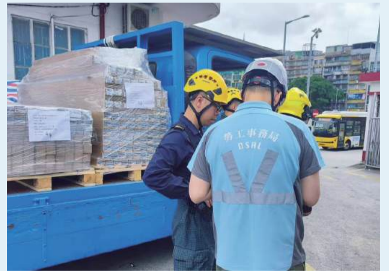
This handout photo provided by the Labour Affairs Bureau (DSAL) yesterday shows personnel dispatched by the bureau to the scene to assess the situation after the accident earlier that day.

The bureau expressed deep condolences to the victim’s family and said it would provide appropriate support and assistance, the statement said, adding that it