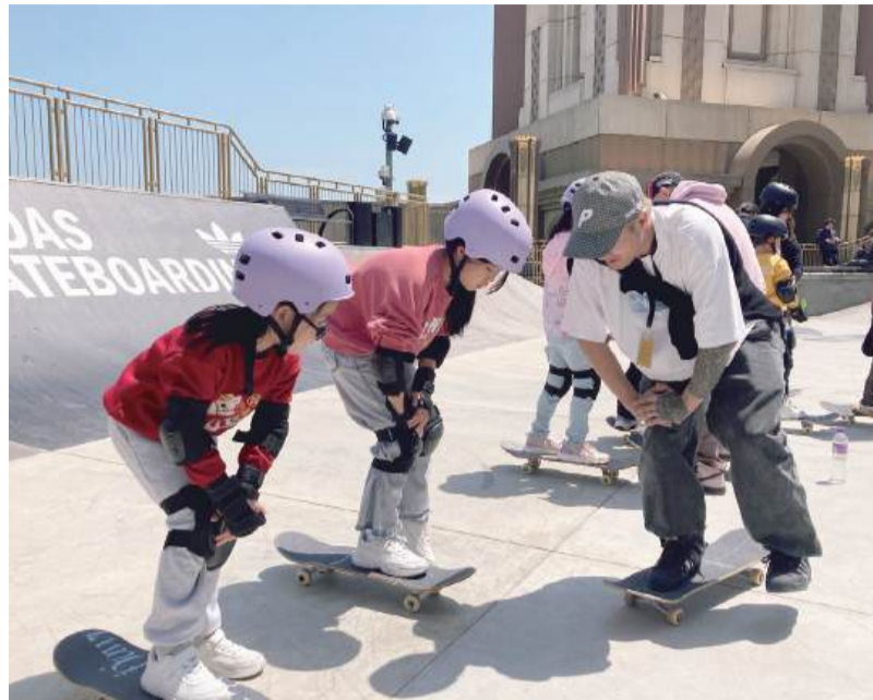
This undated handout photo provided by Melco Resorts & Entertainment yesterday shows participants in one of the skateboarding activities recently hosted by the integrated resort operator at Studio City Sk8te Park.

According to the statement, to further engage with the local community, the company also donated event tickets to local students, families, and persons with disabilities through partnerships with several associations, including Macao True Goodwill Friend Association, Fuhong