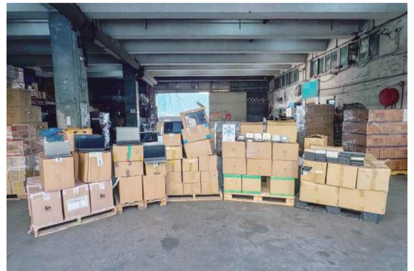
This handout photo released by the Macau Customs Service last night shows the seized used electronic products at a pier in the Inner Harbour.

According to the statement, the Macau Customs Service will fine the logistics company concerned in accordance with the relevant provisions listed in the External Trade Law. The company faces a fine of up to 50,000 patacas, and the seized goods will be confiscated by the customs, the statement noted. ■