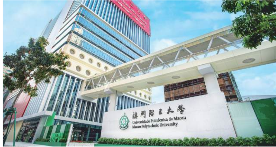
This photo provided by the Macao Polytechnic University (MPU) shows its campus on Rua de Luís Gonzaga Gomes (高美士街).