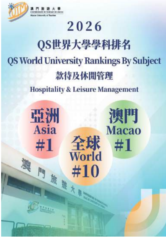
This poster provided by the Macao University of Tourism (UTM) yesterday shows its recent accolades from the QS World University Rankings by Subject 2026.