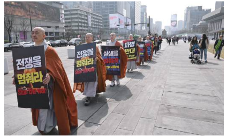
South Korean Buddhist monks carry placards reading “Stop the war” as they march during a prayer service opposing the war on Iran at Gwanghwamun Square near the US embassy in Seoul yesterday.

The visit was wrapped up with Kim personally accompanying Lukashenko to the airport for a “warm farewell”, it added. – AFP