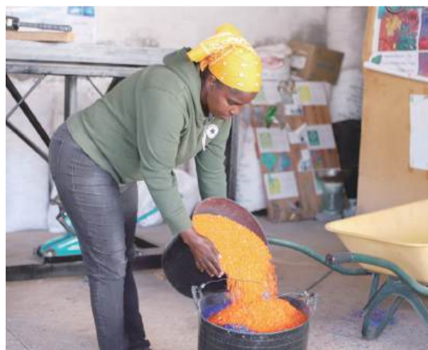
At a community microenterprise in Praia, Cape Verde, last Thursday, a worker transfers recycled plastic pellets into a bucket to prepare the material for the next stage of heat pressing.

Launched in 2019, the initiative later developed into a community-