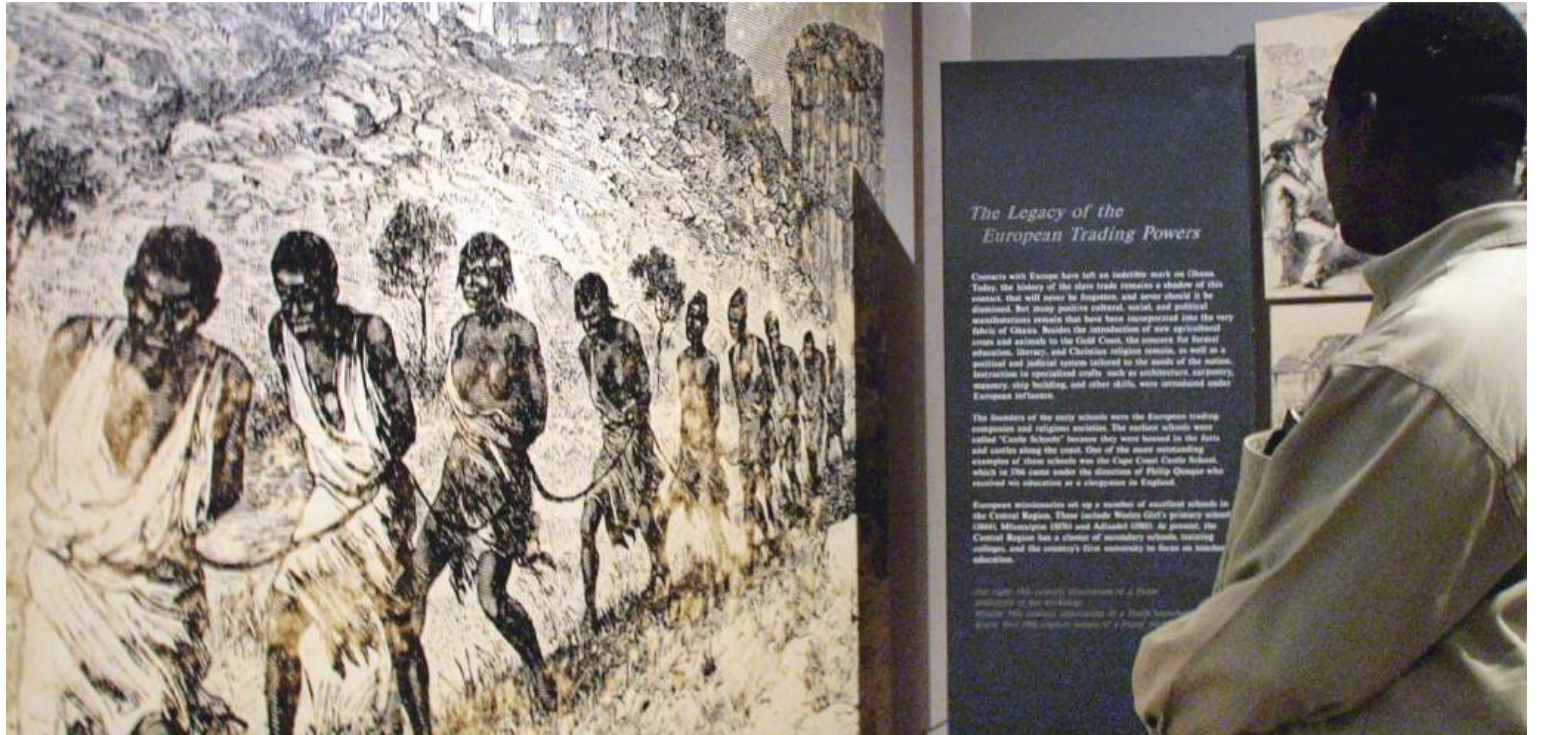
A man looks at slavery images at the Cape-Coast Castle museum in Ghana on August 16, 2001. The UN General Assembly on March 25, 2026 designated the transatlantic African slave trade as “the gravest crime against humanity,” in a move advocates hailed as a step towards healing and possible reparations. The resolution was adopted to applause by a vote of 123 in favour, three against – the United States, Israel and Argentina – and 52 abstentions, including Britain and member states of the European Union.

“To justify the unjustifiable, slavery's proponents and beneficiaries constructed a racist ideology – turning prejudice into a pseudoscience.”