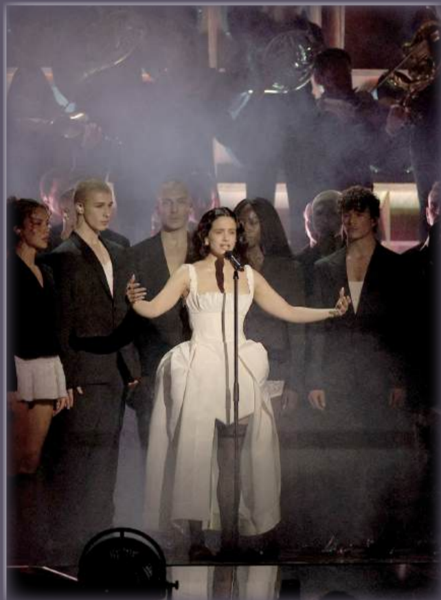
Spanish singer-songwriter Rosalía (centre) performs on stage during the BRIT Awards 2026 at the Co-op Live arena, in Manchester on February 28, 2026. Rosalía was forced to interrupt a concert in Milan, northern Italy, half way through due to food poisoning, according to fan footage posted on social media on Wednesday.

The album features lyrics sung in 13 languages including German, English and Sicilian in addition to her native Spanish.