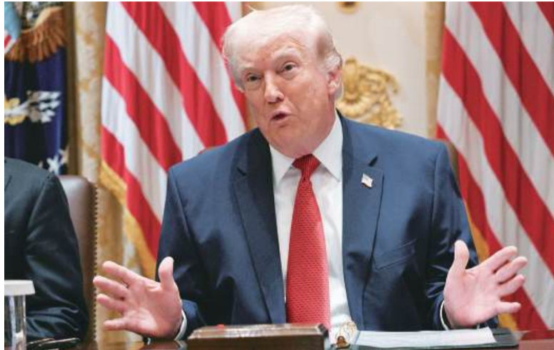
US President Donald Trump speaks during a cabinet meeting in the Cabinet Room of the White House yesterday in Washington, DC.

“I’ll say it publicly. We’re very disappointed with NATO, because NATO has done absolutely nothing,” Trump said.