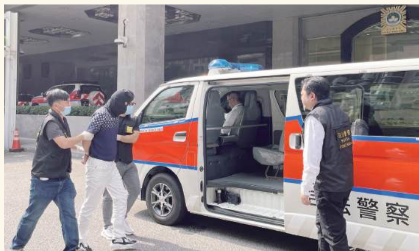
Judiciary Police (PJ) officers escort the hooded fraud suspect from the Chinese mainland to a PJ van outside the PJ headquarters in Zape yesterday.