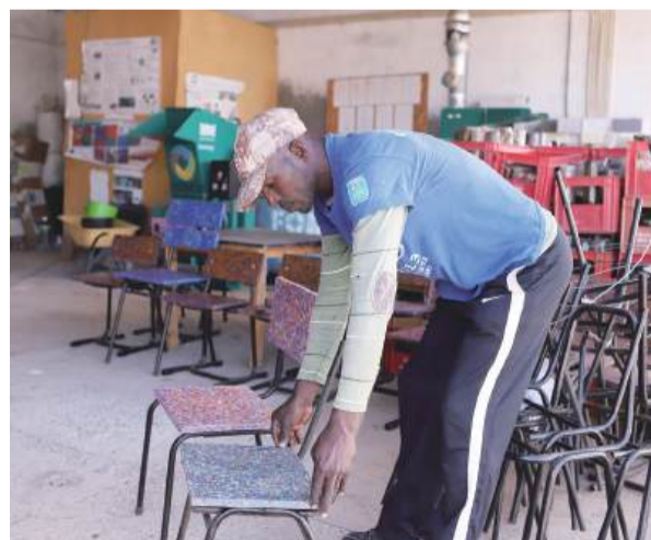
A worker arranges chairs for students restored with recycled materials at a community microenterprise in Praia, Cape Verde, on March 19, 2026.

based business. Today, the impact is visible in São Francisco, where cleaner streets reflect a growing awareness of recycling and waste management.