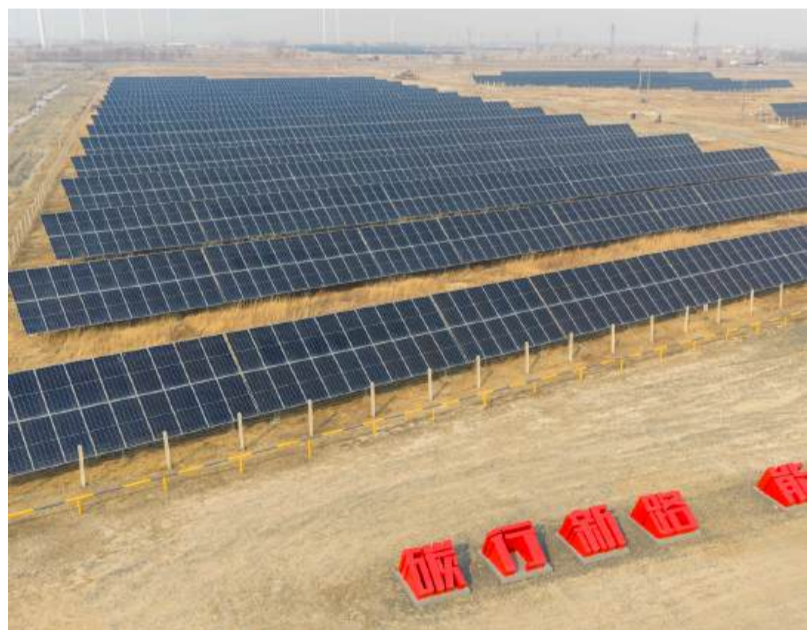
This aerial drone photo taken on Wednesday shows the photovoltaic panels at the low-carbon demonstration zone of Lamadian Oilfield in Daqing, Heilongjiang Province. As an important energy production base in China, Daqing Oilfield has been exploring new pathways for green transformation and development in recent years. While maintaining stable production of traditional energy, it has actively promoted the construction of photovoltaic, wind power and geothermal energy projects.