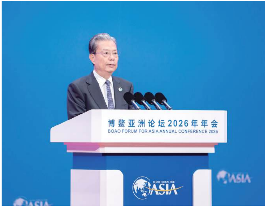
Zhao Leji, chairman of the National People's Congress Standing Committee (NPCSC), addresses a plenary session of the Boao Forum for Asia (BFA) Annual Conference 2026 and delivers a keynote speech in Boao, Hainan Province, yesterday.

The broader region has followed a similar trajectory, transforming from a fast-moving