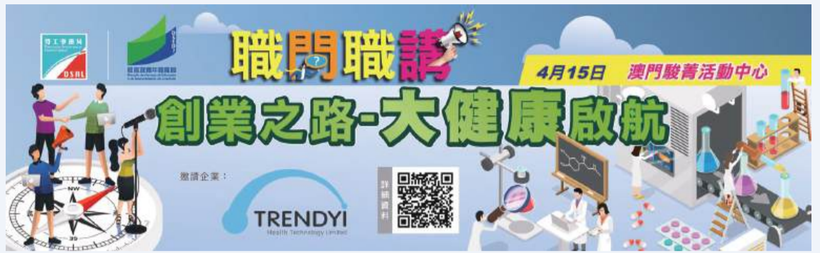
This poster provided by the Labour Affairs Bureau (DSAL) yesterday promotes its Big Health job seminar on April 15 at the Youth Activities Centre in Areia Preta district.