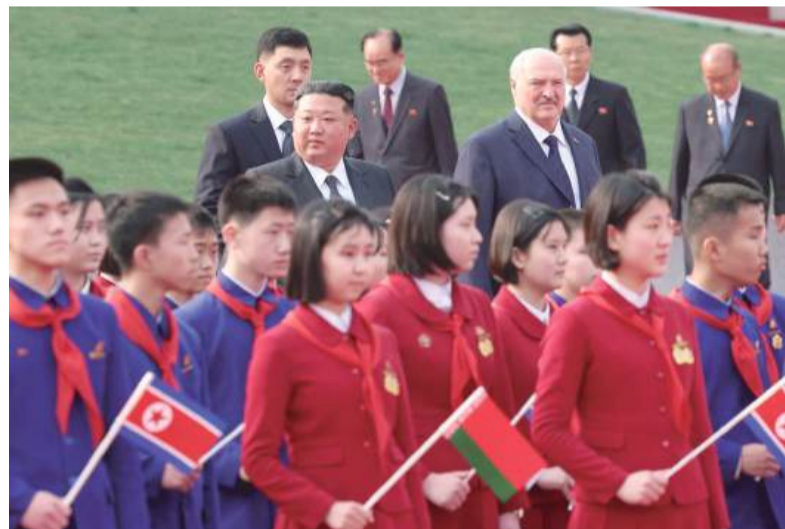
In this handout picture taken and released by the Belarusian presidential press service yesterday, Belarus' President Alexander Lukashenko (second right) and North Korean leader Kim Jong Un attend a welcoming ceremony prior to their talks in Pyongyang.

Trump met Kim in his first term and there has been speculation of a re-run when the US president makes his delayed upcoming visit to China.