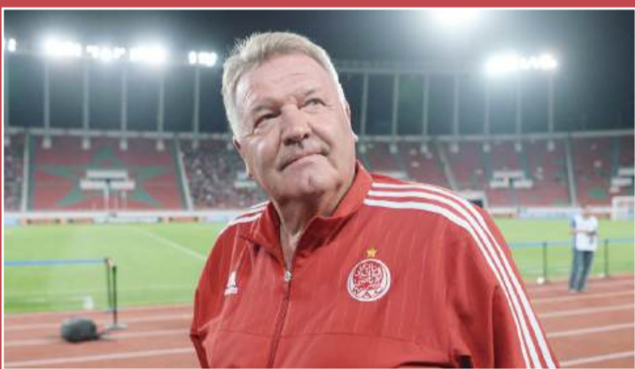
Wydad Athletic Club's coach John Toshack arrives at the match against the Asec Mimosas club during the 20 th CAF Champion League in Rabat, Morocco on August 14, 2016.

"You deserve a send off that reflects your status at LFC - the greatest," Robertson posted on Instagram. "Second to none."