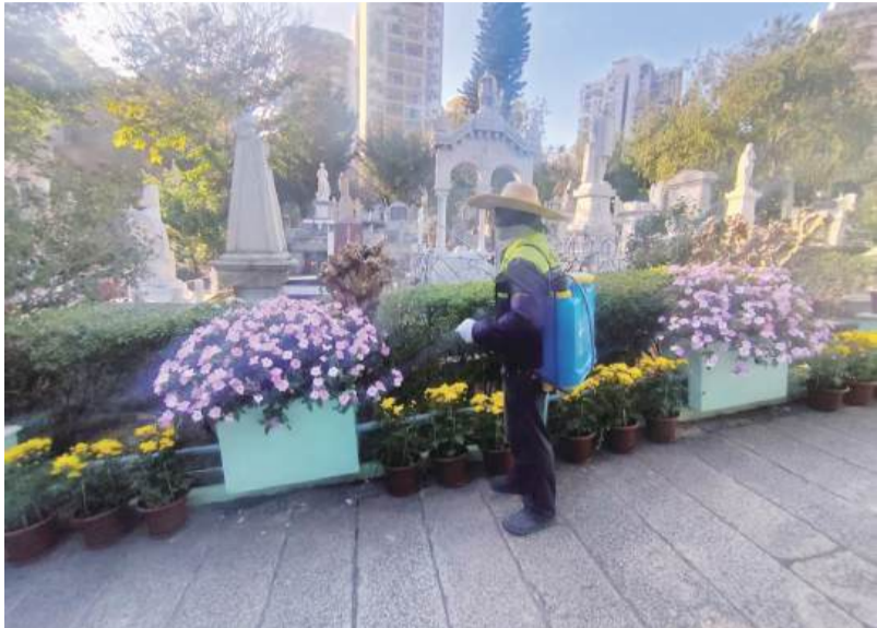
This undated handout photo, taken at São Miguel Arcanjo Cemetery and provided by the Municipal Affairs Bureau (IAM) yesterday shows a technician applying mosquito control insecticide.