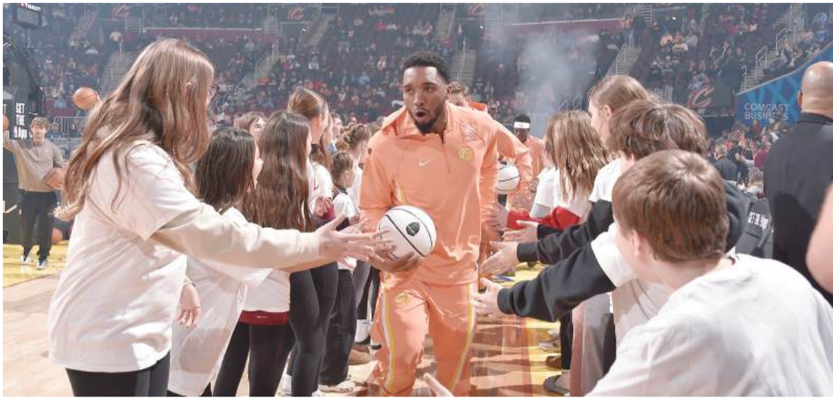
Donovan Mitchell of the Cleveland Cavaliers enters the court before the game against the Orlando Magic on Tuesday at Rocket Arena in Cleveland, Ohio.