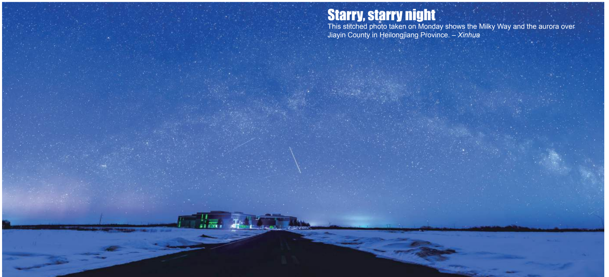
This stitched photo taken on Monday shows the Milky Way and the aurora over Jiayin County in Heilongjiang Province.