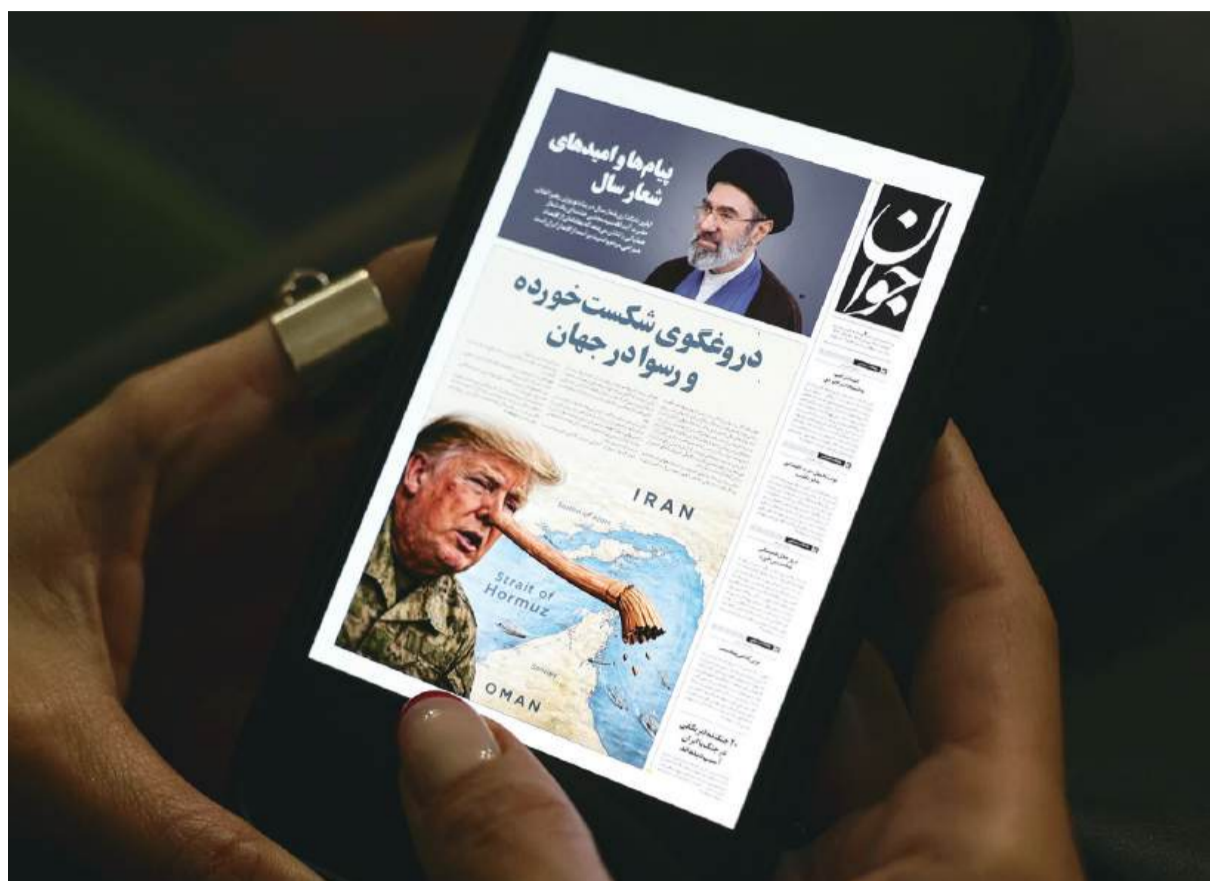
An Iranian woman reads a digital copy of the Javan newspaper on her mobile phone in Tehran yesterday. Iranian newspapers yesterday ridiculed what they called Donald Trump's "lies" about ongoing diplomatic discussions to end the war, publishing cartoons of the US president styled as Pinocchio.

Iran's military said its cruise missiles fired at the USS Abraham Lincoln carrier group had "forced