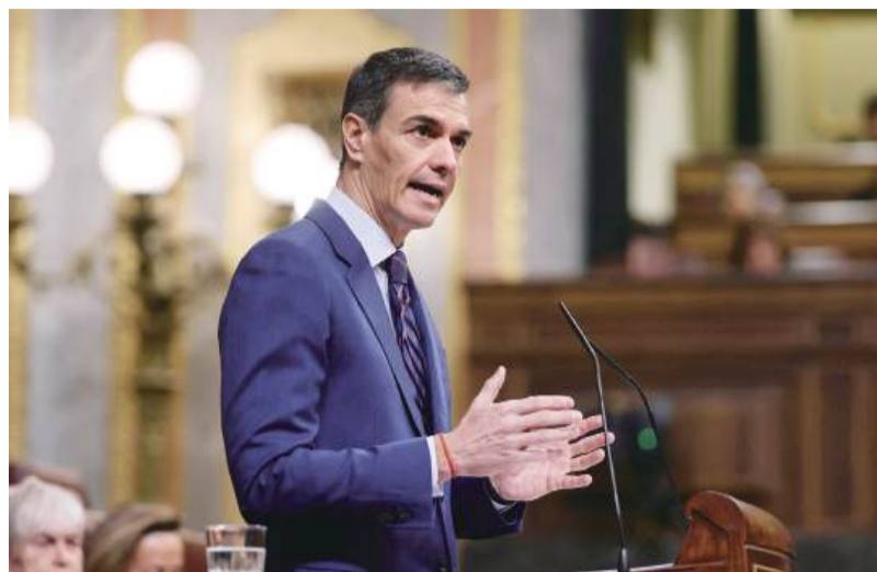
Spain's Prime minister Pedro Sánchez addresses parliament over the war in the Middle East at the Congress in Madrid yesterday.

week a sweeping package worth five billion euros (US$5.8 billion) aimed at cushioning the economic impact of the Middle East war, which included reductions on taxes on fuel.