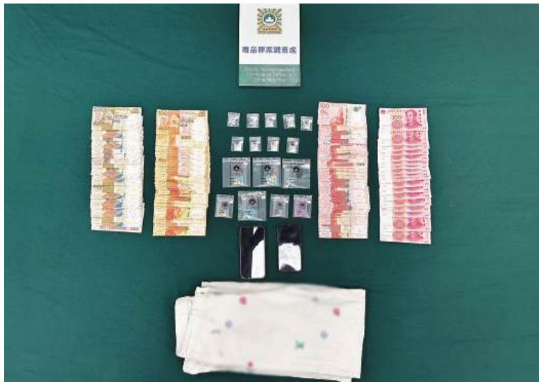
This undated handout photo provided by the Judiciary Police yesterday shows evidence seized from the Vietnamese drug trafficking suspect surnamed La.

In La's flat, in the city centre, PJ officers seized 37 ecstasy pills, complete with packaging, weighing a total of 22.92 grams; five small packets of crystal meth, weighing a total of 5.52 grams; and four small packets of ketamine, weighing a total of 4.3 grams; as well as HK$45,000 (46,278 patacas) and 1,900 yuan in suspected proceeds from drug-related activities, Ho said, adding that the estimated street value of the drugs was