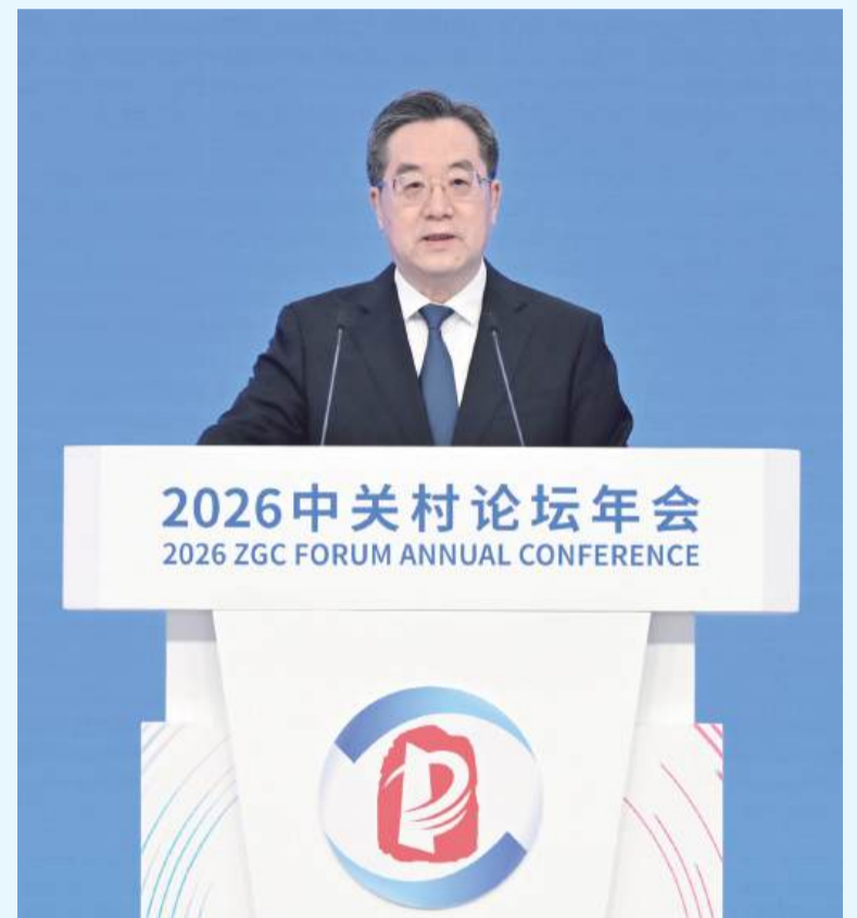
Vice Premier Ding Xuexiang, also a member of the Standing Committee of the Political Bureau of the Communist Party of China (CPC) Central Committee, addresses the opening ceremony of the 2026 Zhongguancun Forum (ZGC Forum) Annual Conference in Beijing yesterday.

Ding noted that during the 14 th Five-Year Plan period (2021-2025), China had achieved significant new progress in the sci-tech sector. The country's sci-tech strength was markedly enhanced, and its influence as