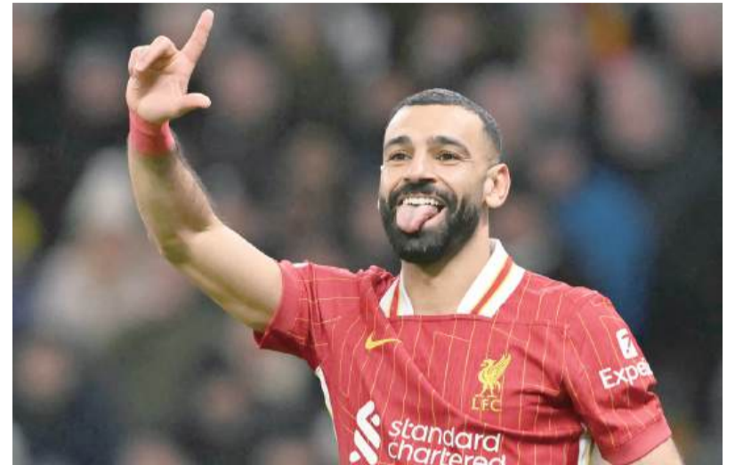
Liverpool's Egyptian striker Mohamed Salah celebrates after scoring their fourth goal during the English Premier League match against Tottenham Hotspur at the Tottenham Hotspur Stadium in London, on December 22, 2024.

Soon afterwards he left for the Africa Cup of Nations but he returned