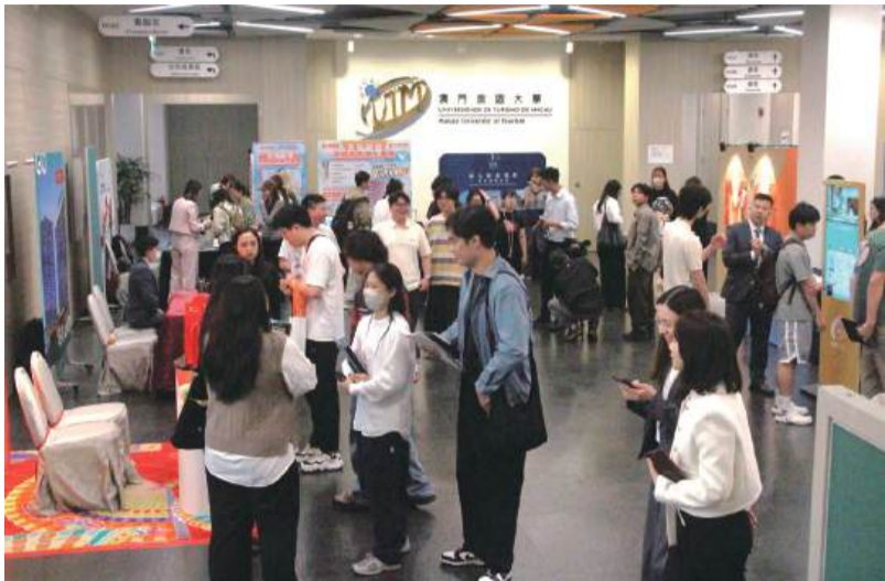
Students engage with employers from various sectors during the public Macao University of Tourism's (UTM) Career Day on its Taipa campus yesterday.