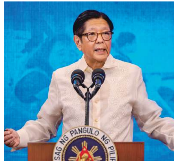
Philippine President Ferdinand Marcos speaks during a press conference at the Malacañang Palace in Manila yesterday. Marcos earlier declared a state of "national energy emergency" on Tuesday, citing risks to the domestic fuel supply and energy stability created by the Middle East war.