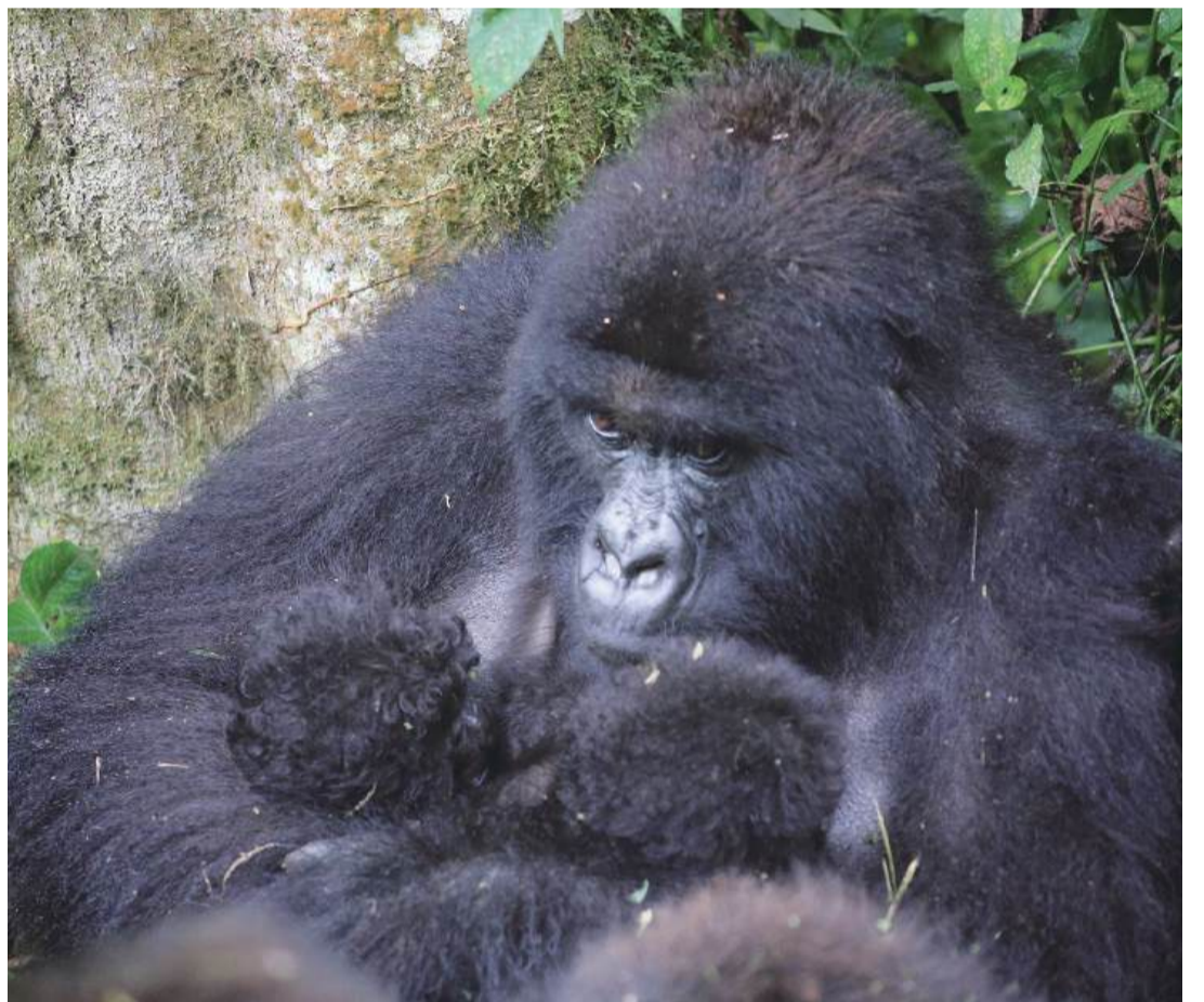
This handout photo distributed by the Virunga National Park shows a couple of twin baby mountain gorillas being held by their mother in the Mikeno sector of the park last Thursday.

KINSHASA – In a rare occurrence in the eastern Democratic Republic of Congo, twin mountain gorillas were recently born in the Virunga National Park, renowned for its biodiversity but threatened by conflict.