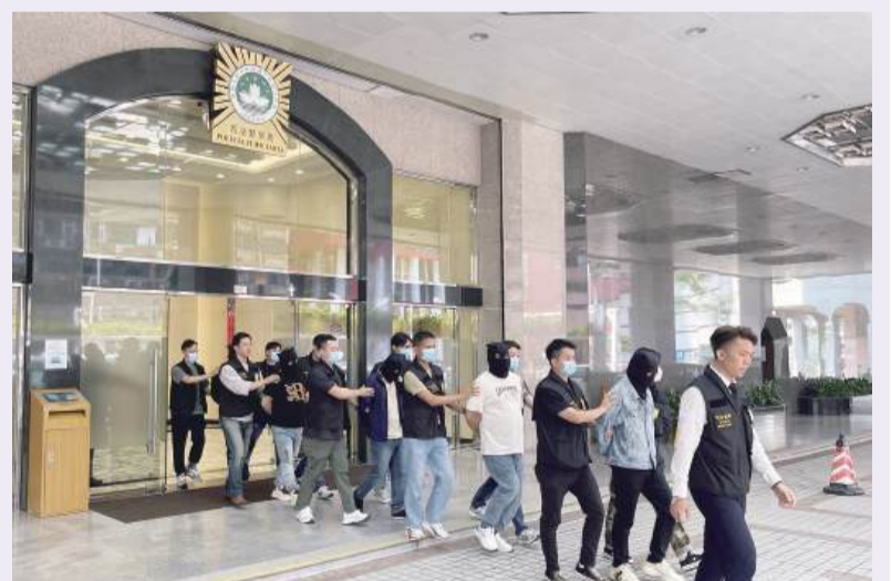
Judiciary Police (PJ) officers escort the five hooded casino loan-sharking suspects from the Chinese mainland to a PJ van outside the PJ headquarters in Zape yesterday.