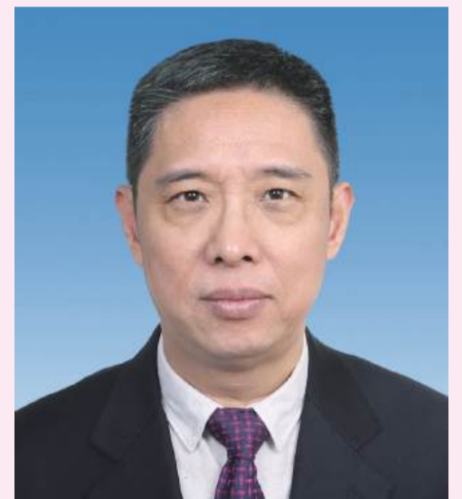
Undated file photo of Yang Weiqun, a newly appointed deputy director of the Liaison Office of the Central People's Government in the MSAR

Before working for the China International Development Cooperation Agency, Yang, born in February 1968, worked in the Ministry of