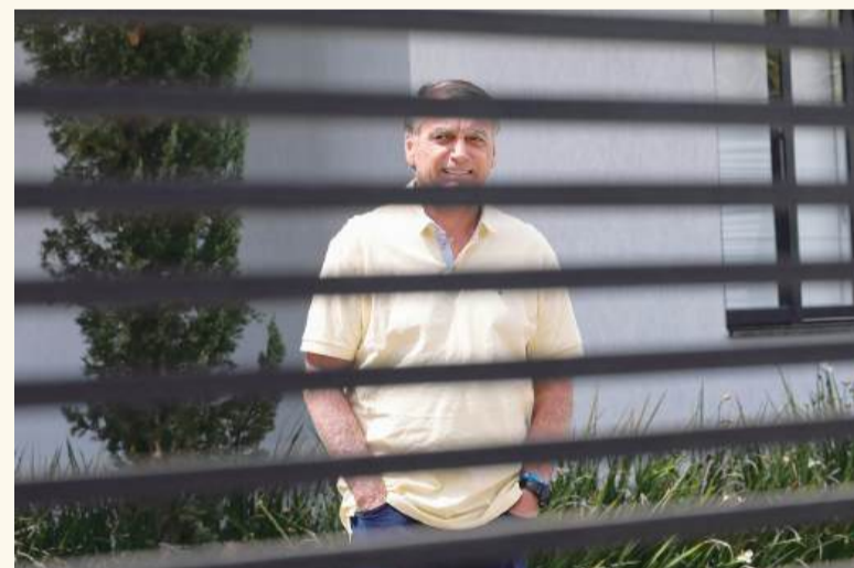
Former Brazilian President Jair Bolsonaro poses at his fenced property behind in Brasília on September 3, 2025.

Some opinion polls show a dead heat in a potential run-off election between Flávio Bolsonaro and Lula, 80, who is seeking a fourth term.