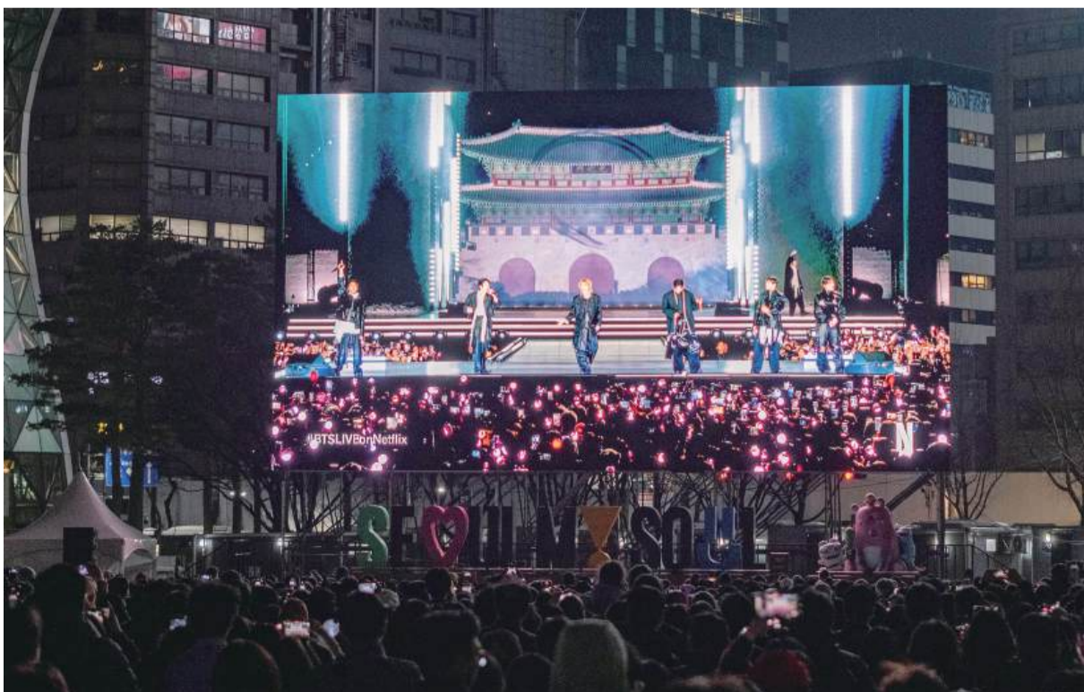
Fans watch the comeback concert of K-pop boy group BTS on a screen at the venue in Seoul on Saturday.