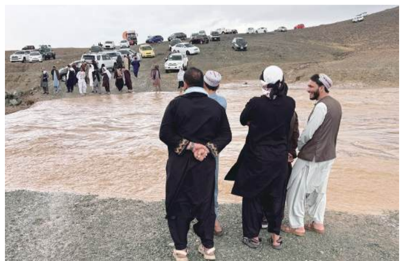
Afghans with their cars wait to cross a flooded road after rainfall in Kandahar yesterday.

According to a UN toll, not taking into account the drug rehabilitation centre strike, at least 76 Afghan civilians have been killed in the fighting since it intensified on February 26. – AFP