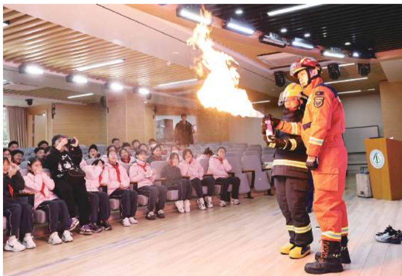
Firefighters help students understand the dangers of flammable materials during a lecture at a middle school in Shanghai's Changning District yesterday. A new term kicked off for primary and secondary schools as well as kindergartens in many parts of the Chinese mainland yesterday.

Mao noted that maintaining security and stability in the region serves the common interests of the international community, warning against further repercussions on the global economy as a result of regional turmoil. – Xinhua