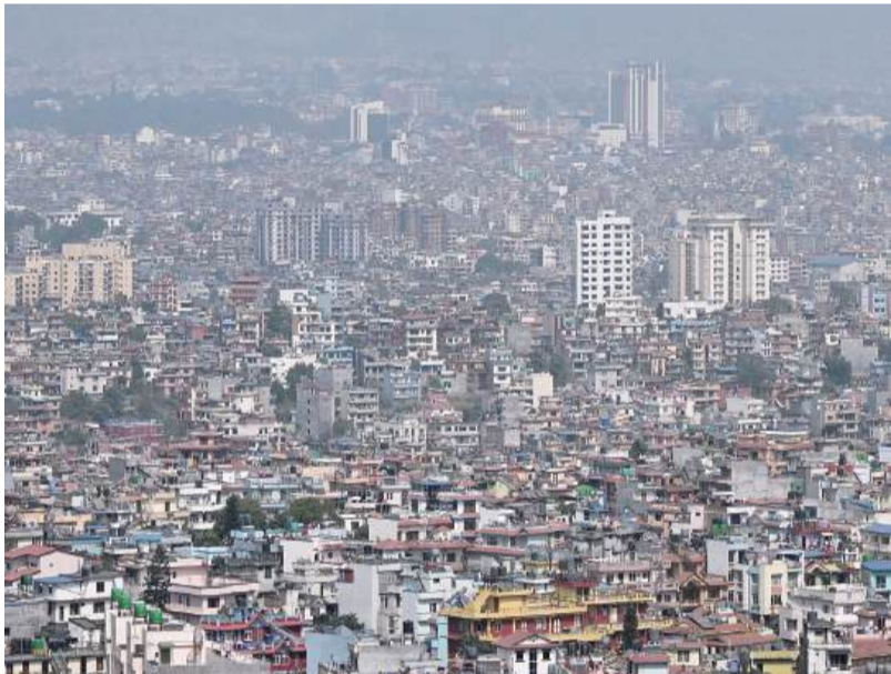
A general view of buildings in a densely packed neighbourhood in Kathmandu yesterday ahead of parliamentary elections in Nepal. – AFP

The embassies of the United States and Britain both urged citizens in Pakistan to be cautious. – AFP