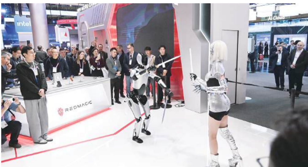
Fairgoers watch a performance by a robot and a woman at the booth of ZTE during the 2026 Mobile World Congress (MWC) in Barcelona, Spain, yesterday. The 2026 MWC opened yesterday in Barcelona, Spain, under the theme “The IQ Era,” with a focus on intelligent infrastructure, AI connectivity and integration, enterprise-level AI applications, AI ecosystem collaboration, inclusive technology and innovation-driven transformation. – Xinhua

China's social security system was further expanded last year. By the end of 2025, 1.08 billion people were covered by basic pension insurance and 1.33 billion by basic medical insurance. Last year, a total of 1.21 million units of government-subsidized housing were started or secured as part of broader efforts to improve social services, the NBS noted. – Xinhua