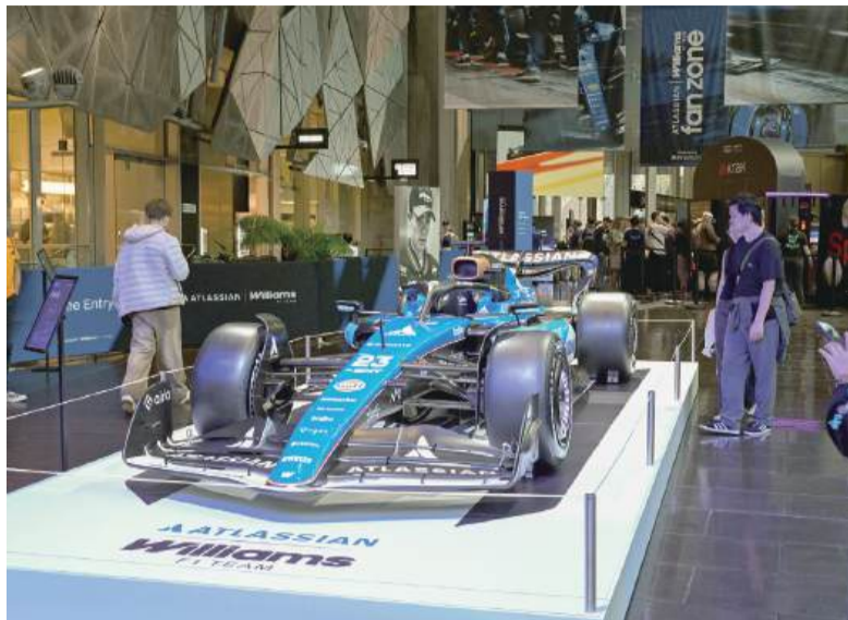
People walk through a Williams F1 team fan zone in Melbourne's central business district yesterday, ahead of the season-opening Australian Formula One Grand Prix. Australian Formula One chief Travis Auld said yesterday travel chaos due to US-Israeli strikes on Iran is not expected to impact the season-opening Grand Prix, but more than 1,000 staff have had to scramble and change flights.

Changes aplenty here but the big one is the introduction of active aero which allows cars to adjust the angle of both front and rear wing elements depending on where they are on track. This, again, should cut drag and boost top speed.