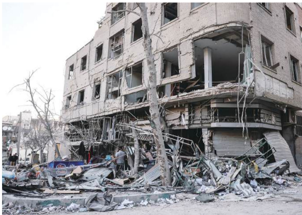
Residents stand amid debris beside a damaged residential building near Niloufar Square in Tehran during the ongoing joint US-Israeli military campaign on Iran yesterday. The United States and Israel launched strikes against Iran on February 28, killing Iran's supreme leader and top military leaders, prompting authorities to retaliate with strikes on Israel and across the Gulf. – AFP

"Hence allowing defensive not offensive strikes, although the difference between the two is, in practice, often very minimal," she said. – AFP