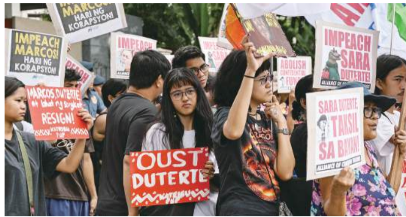
Protesters call for the impeachment of Philippine Vice President Sara Duterte outside the House of Representatives in Quezon City, Metro Manila yesterday.

"The political context will be very different, especially now that Sara declared her candidacy", University