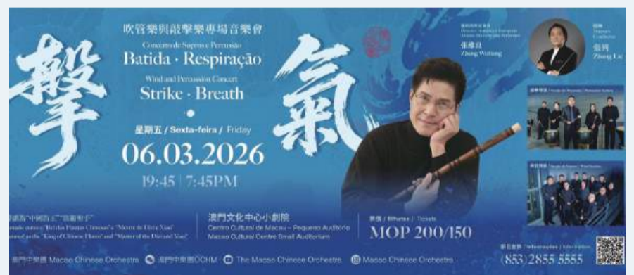
This poster provided by Cultural Affairs Bureau (IC) yesterday promotes its "Strike · Breath" wind and percussion concert slated to be staged on Friday at the Macau Cultural Centre's (CCM) Small Auditorium.