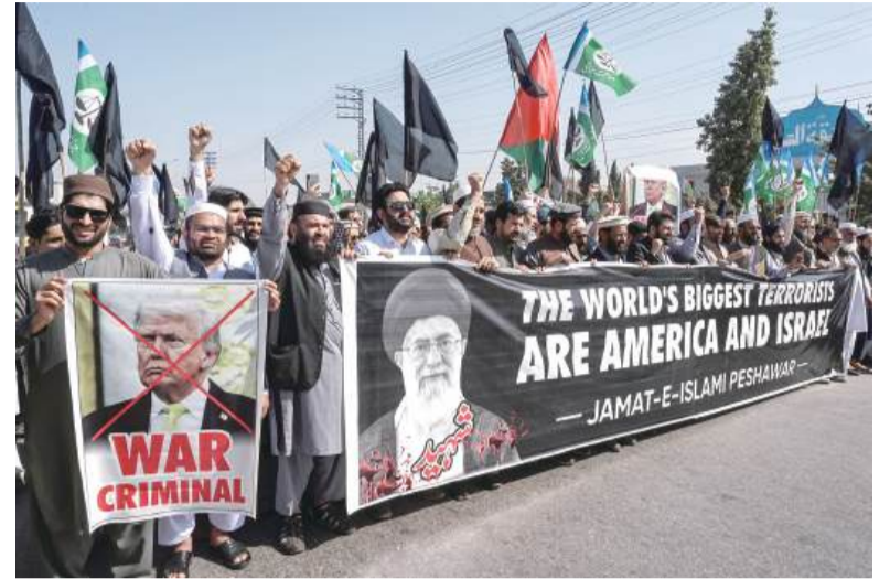
Activists and supporters of the Jamaat-e-Islami party shout slogans during an anti-US and Israel protest in Peshawar, Pakistan yesterday after the death of Iran's supreme leader Ayatollah Ali Khamenei amid US-Israel strikes.

Pakistani stocks plunged yesterday. The benchmark KSE-100 Index declined by 9.6 percent, shedding 16,089 points in what