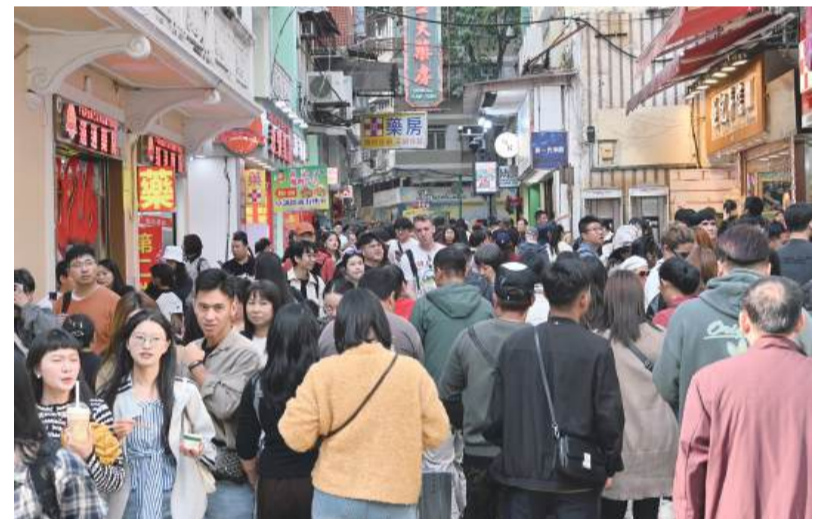
This photo taken in late January shows visitors crowding Rua da Palha near the UNESCO World Heritage-listed Ruins of St Paul's.

Mainland Chinese accounted for 74.17 percent of all visitor arrivals. A total of 278,453 foreign nationals visited Macau in January, up by 15.5 percent year-on-year. South Koreans (75,198) and Filipinos (45,425) continued to be Macau's top two foreign visitor segments.