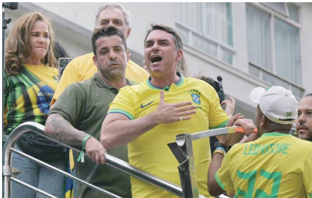
Senator and presidential candidate Flávio Bolsonaro (centre) gestures to supporters of his father, Brazil's former president Jair Bolsonaro (2019-2022), sentenced to 23 years and 3 months for an attempted coup, during a demonstration in São Paulo on Sunday.

SÃO PAULO—Flávio Bolsonaro, son of Brazil's jailed former leader, on Sunday sought to rally and unite conservatives ahead of October elections in which he hopes to follow in his father's footsteps.