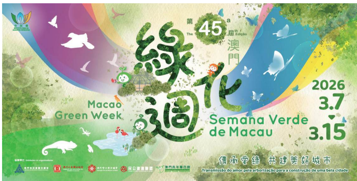
This poster provided by the Municipal Affairs Bureau (IAM) yesterday shows the Macao Green Week running from March 7-15.

Moreover, the bureau will continue to organise eco-tours in Hengqin to provide the public with