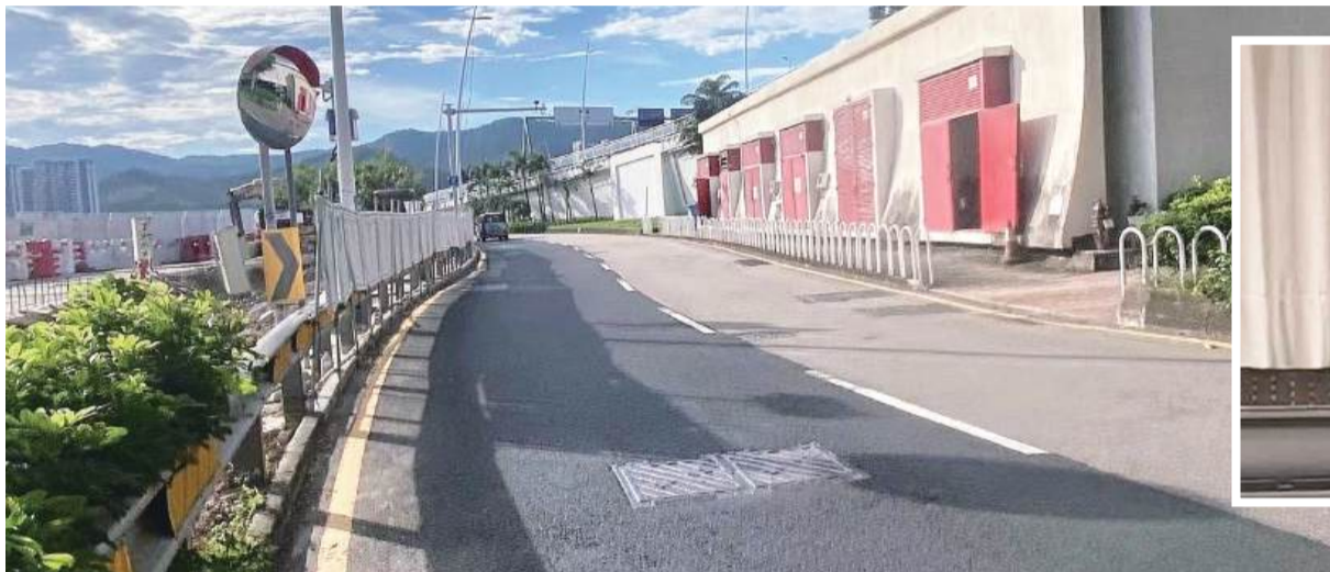
This DSAT photo released yesterday shows a manhole cover on Avenida Panorâmica do Lago Sai Van, near the exit of the Macau-Taipa Sai Van Bridge. This section of the avenue is one of various roads where the government plans to reduce the number of manhole covers in future roadwork projects.

The Transport Bureau (DSAT) released information of yesterday's