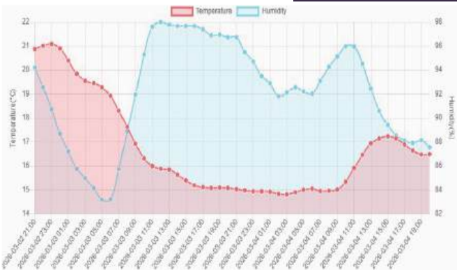
This temperature forecast chart provided by the Meteorological and Geophysical Bureau (SMG) last night forecasts that the local temperature will fall to as low as 15 degrees Celsius today.

*During a total lunar eclipse, the Earth aligns directly between the Sun and the Moon, casting a shadow on the Moon. As sunlight passes through Earth’s atmosphere, shorter wavelengths – blue and violet light – scatter more than longer wavelengths – red and orange light. The filtered light that reaches the Moon is primarily red, giving it a reddish hue. – Poe