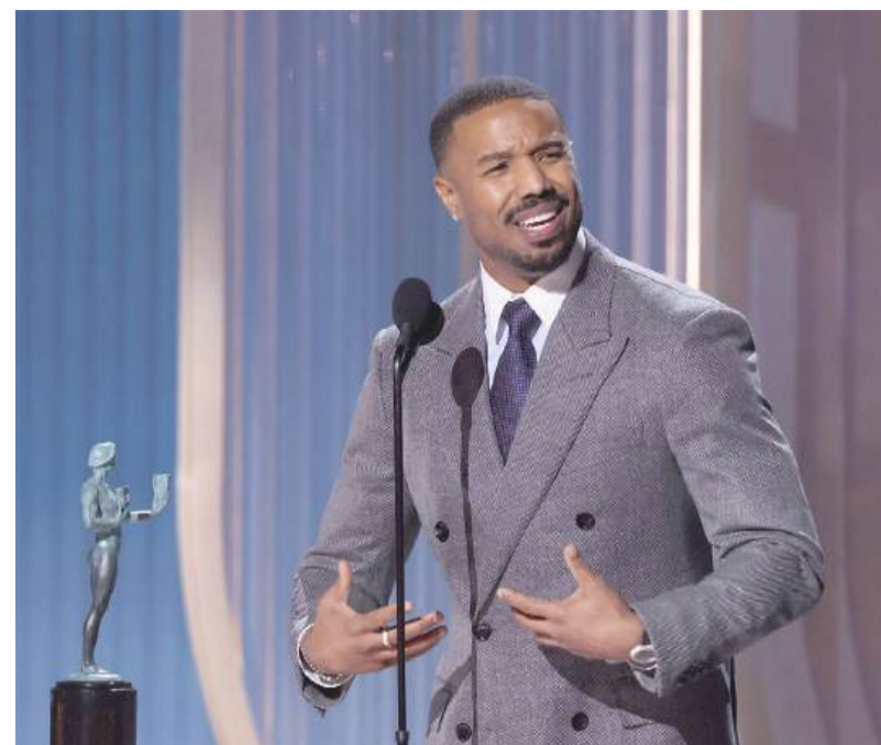
US actor Michael B. Jordan accepts the award for Outstanding Performance by a Male Actor in a Leading Role in a Motion Picture for "Sinners" during the 32nd Annual Actor Awards at the Shrine Auditorium in Los Angeles on Sunday.

was dominated by Apple TV's Hollywood satire "The Studio" which won three statuettes, including a posthumous award for Catherine O'Hara, who died in January.