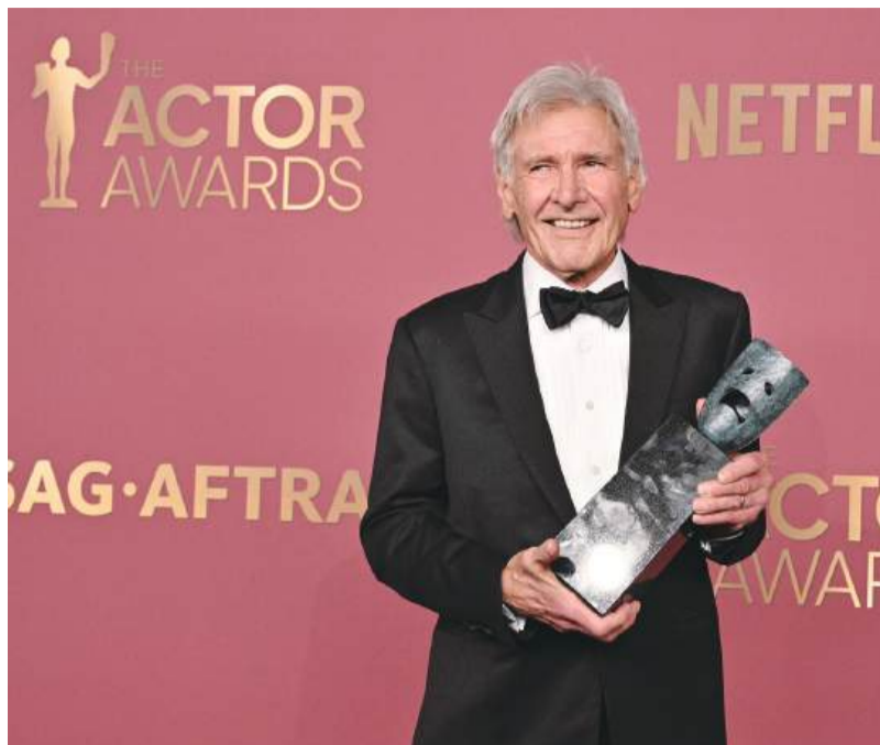
US actor Harrison Ford, 83, poses with the 61st SAG-AFTRA Life Achievement Award during the 32nd Annual Actor Awards at the Shrine Auditorium in Los Angeles on Sunday.

Michael B. Jordan pulled off a surprise win in a category that Timothee Chalamet ("Marty Supreme") has dominated all season.