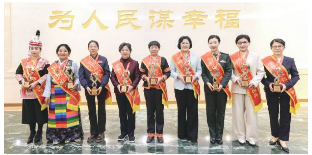
Female role models, who were granted the title of national “pacemakers,” pose after a meeting marking International Women's Day, which is observed on March 8, and honoring outstanding female role models across the country in Beijing yesterday. The meeting was held here by the All-China Women's Federation (ACWF) yesterday. – Xinhua

The new five-year plan outline, which sets forth China's strategic intentions and government priorities, will shed light on policy continuity, explaining why China will undoubtedly remain a major powerhouse of global economic growth and benefit the world through its modernization. – Xinhua