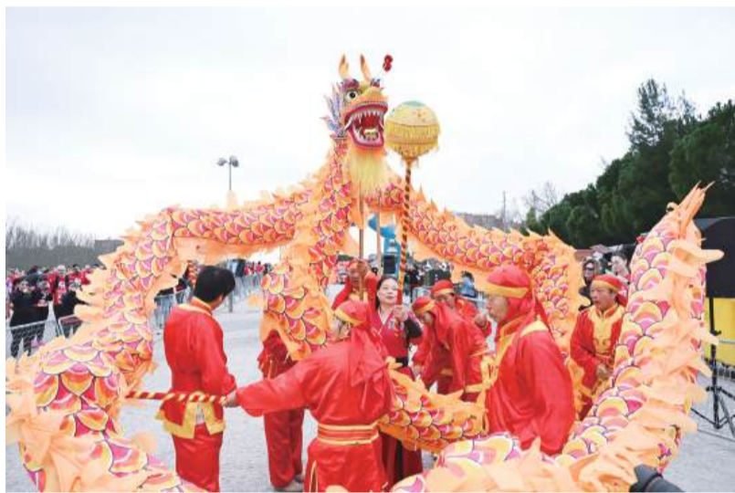
Overseas Chinese perform the traditional dragon dance during an event in celebration of the Chinese New Year in Madrid, Spain, on Sunday.

China expects Gulf countries to strengthen independence, oppose external interference, develop good-neighborly relations, enhance solidarity and cooperation, and take their future into their own hands, Wang said. – Xinhua