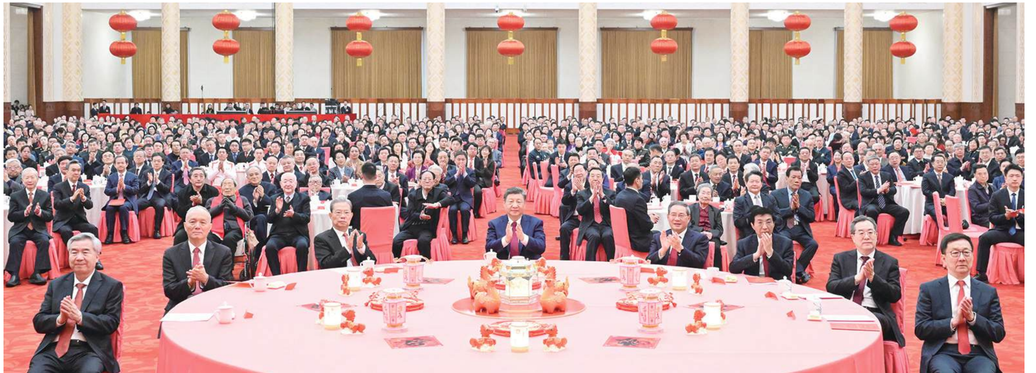
Party and state leaders Xi Jinping (4 th left), Li Qiang (4 th right), Zhao Leji (3 rd left), Wang Huning (3 rd right), Cai Qi (2 nd left), Ding Xuexiang (2 nd right), Li Xi (left) and Han Zheng attend a reception to usher in the Chinese New Year at the Great Hall of the People in Beijing on Saturday.

Li Qiang presided over the reception. Senior officials Zhao Leji, Wang Huning, Cai Qi, Ding Xuexiang, Li Xi and Han Zheng were also present at the event.