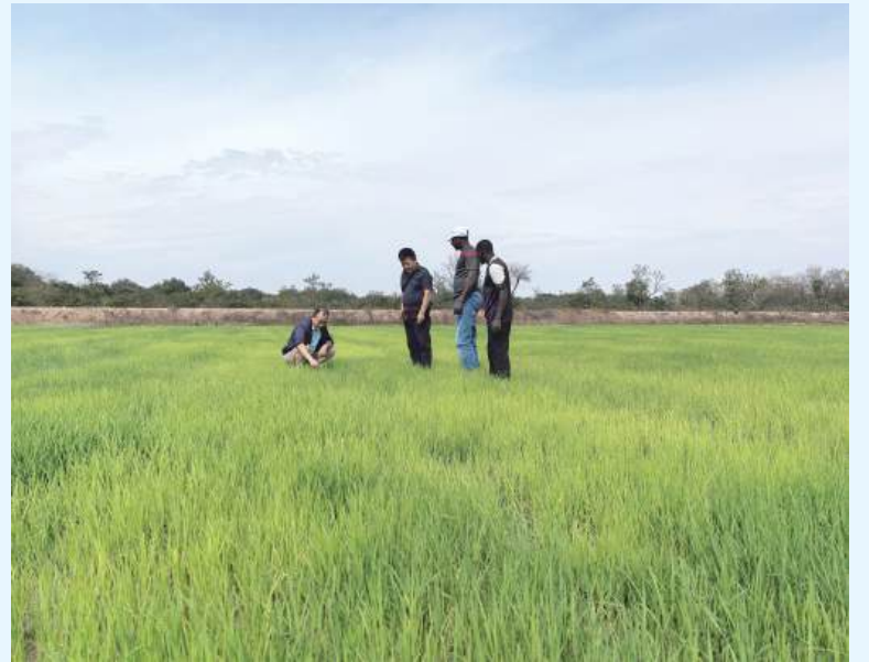
Chinese agricultural experts and local staff members check rice growth at Carantaba Farm in northeastern Guinea-Bissau, on Wednesday.