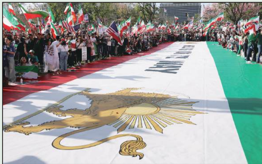
Demonstrators take part in a march in support of the people of Iran by members of the American-Iranian community in Los Angeles on Saturday. The demonstration comes after the bloody crackdown on protesters last month, while US President Donald Trump has been massing warships in the Middle East and declared Friday that a change of government in Iran would be the "best thing that could happen".

MSF says it did not do so because Israel failed to give assurances the staff would be safe.