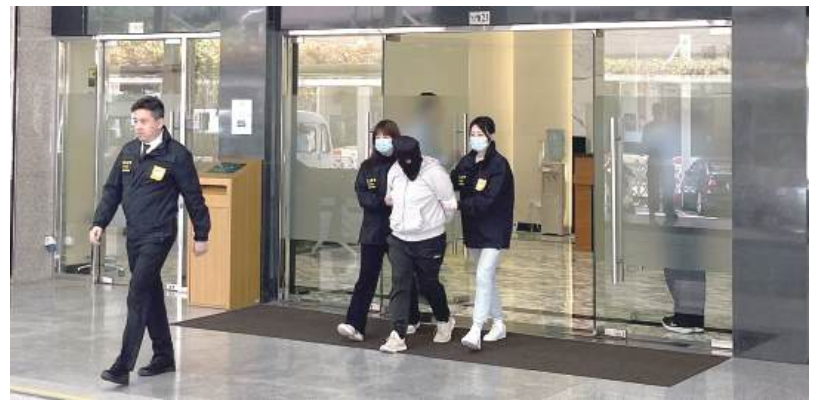
Judiciary Police (PJ) officers escort the hooded fraud and theft suspect to PJ van outside the PJ headquarters in Zape on Friday.