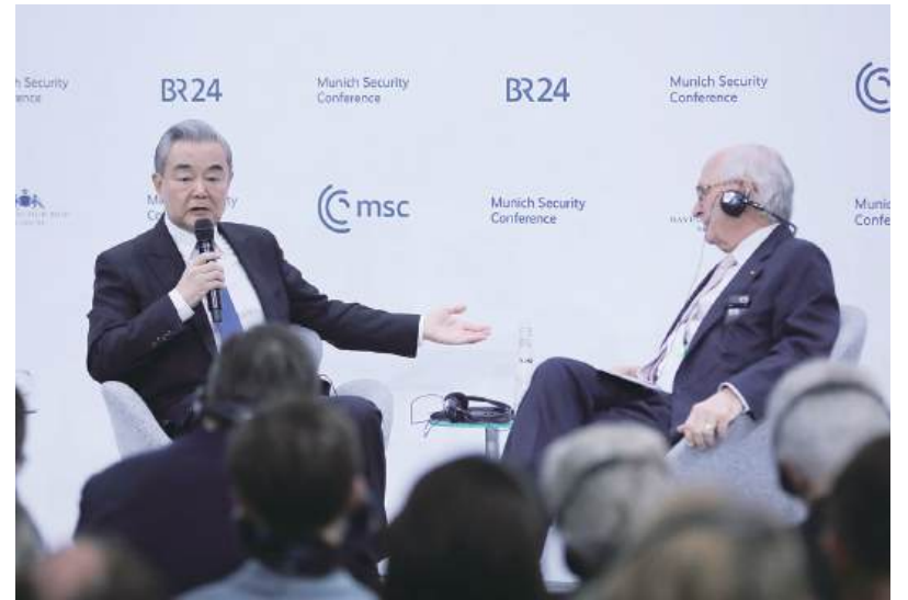
Foreign Minister Wang Yi responds to questions after delivering a speech at the "China in the World" session of the Munich Security Conference in Munich on Saturday.

He pointed out that the current Japanese prime minister has publicly claimed that any contingency in the Taiwan Strait would constitute a so-called "survival-threatening situation" for Japan to exercise collective self-defense. This is the first time in the 80 years since the war that a Japanese prime minister has publicly made