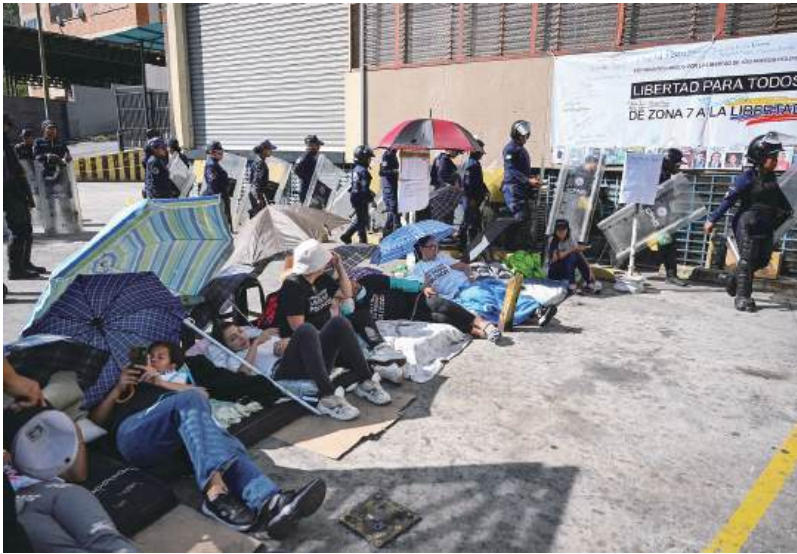
Relatives of political prisoners lie on the ground in front of police officers during a protest outside the Bolivarian National Police (PNB) Zona 7 prison in Caracas on Saturday.

Hours earlier, National Assembly President Jorge Rodriguez announced the release of 17 prisoners in a post on social