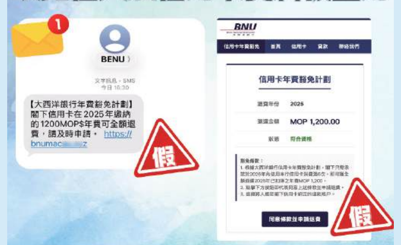
This poster provided by the Judiciary Police (PJ) on Saturday urges residents to beware of fraudulent SMS messages.