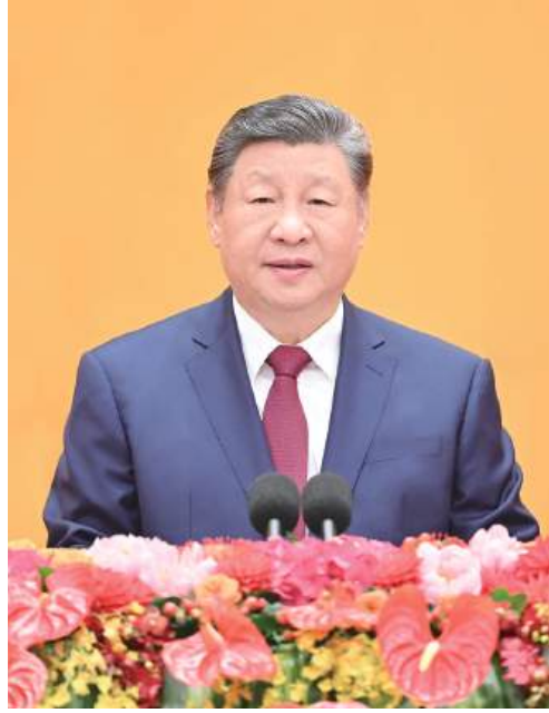
President Xi Jinping, also general secretary of the Communist Party of China (CPC) Central Committee and chairman of the Central Military Commission, delivers a speech at a reception to usher in the Chinese New Year at the Great Hall of the People in Beijing on Saturday.

BEIJING — President Xi Jinping yesterday extended Spring Festival greetings at a reception in Beijing to usher in the Chinese New Year — the Year of the Horse.