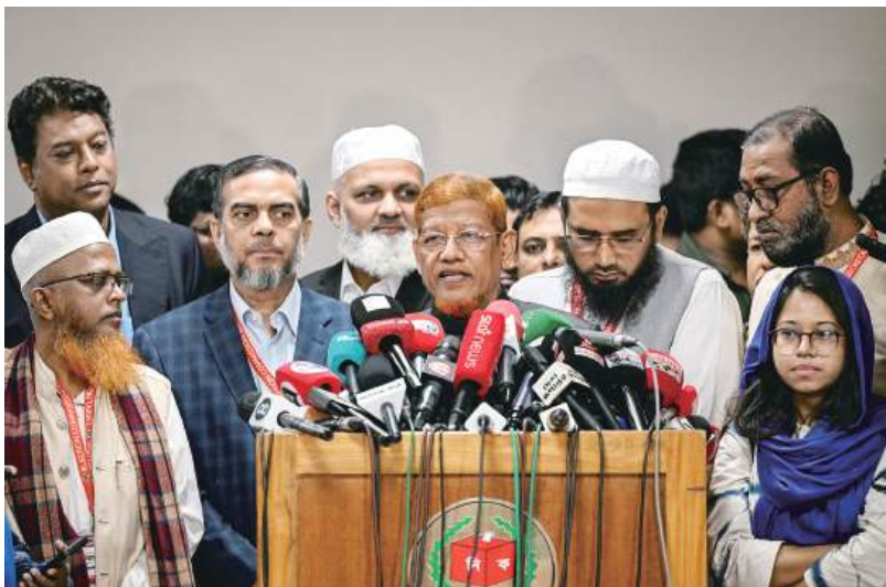
Bangladesh Jamaat-e-Islami party's leader Hamidur Rahman Azad (centre) along with the alliance delegation addresses the media after a meeting with officials at the Election Commission (EC) office in Dhaka yesterday.

Four members of minority communities won seats, including two Hindus — a population that makes up roughly seven percent in Muslim-majority Bangladesh.