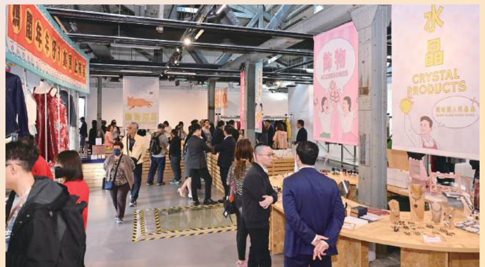
This photo provided by integrated resort operator MGM on Friday shows the Multi-Brand Concept Store at the "Barra Lucky Blessing Market"

**Poon choi, or "basin dish," is a traditional Cantonese and Hakka celebratory meal originating from Hong Kong's New Territories, featuring multiple layers of premium ingredients—such as braised pork, seafood, and vegetables—slow-cooked in a large pot. It symbolises communal unity, prosperity, and abundance, commonly enjoyed during the Lunar New Year. — Google AI Mode