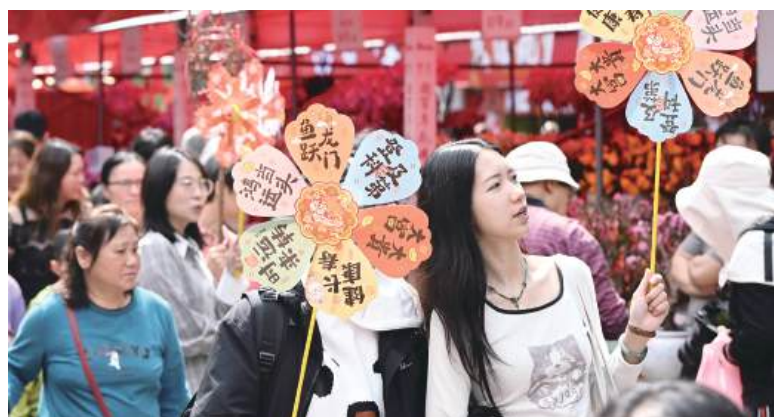
People visit a flower market in Yuexiu District, Guangzhou, Guangdong Province, yesterday. China is alive with vibrant celebrations with the Spring Festival just around the corner. – Xinhua

She thanked the Chinese side for granting visa-free treatment to Canadian citizens, and expressed the hope that the two sides will maintain close dialogue and cooperation, strengthen people-to-people exchanges, and promote the positive and steady development of bilateral relations. – Xinhua