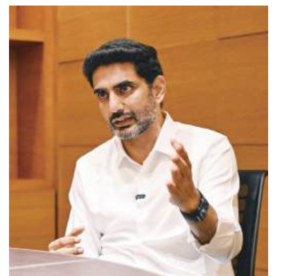
This photograph taken on January 4 shows information technology minister for India's Andhra Pradesh state Nara Lokesh speaking during an interview with AFP in New Delhi.

"But it has created those jobs in countries that have embraced the industrial revolution."