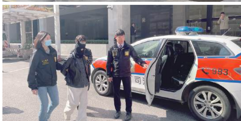
Judiciary Police (PJ) officers escort the three hooded illegal currency exchange suspects to PJ vans outside the PJ headquarters in Zape on Friday.