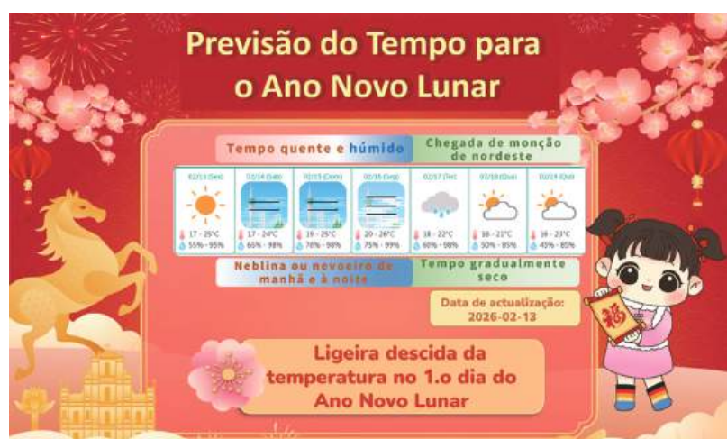
This photo downloaded from the Meteorological and Geophysical Bureau (SMG) yesterday shows its weather forecast for the Spring Festival.

From the second day of the Year of the Horse, the weather is predicted to become drier, with mostly cloudy skies and occasional sunny intervals, the bureau said. Residents are advised to pay attention to weather changes and dress appropriately for outdoor activities. ■