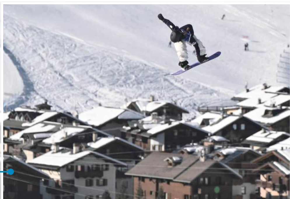
Japan's Reira Iwabuchi competes in the snowboard women's slopestyle qualification run 1 during the Milano Cortina 2026 Winter Olympic Games at Livigno Snow Park, in Livigno (Valtellina), Italy yesterday.