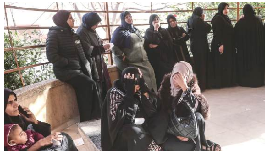
Palestinians displaced from their homes destroyed by Israeli military strikes, gather as they mourn during the funeral of several Palestinians killed in an overnight Israeli strike, according to medics at Nasser Hospital in Khan Yunis, in the southern Gaza Strip yesterday.

GAZA CITY – Gaza's civil defence agency reported that Israeli strikes killed at least 12 people since dawn yesterday, while a military official said the attacks were in response to ceasefire violations.