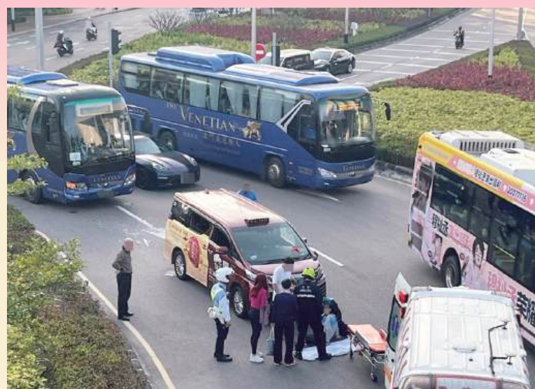
This undated photo shows firefighters and police officers working at the scene where a tourist coach collided with a taxi opposite of the military barracks on Estrada da Baía de Nossa Senhora da Esperança (望德聖母灣大馬路) in Taipa yesterday.

All the injured were conscious and in stable condition, and were taken to the private Kiang Wu Hospital Taipa Medical Centre. The details and cause of the accident are pending announcement by the police, the statement said. ■