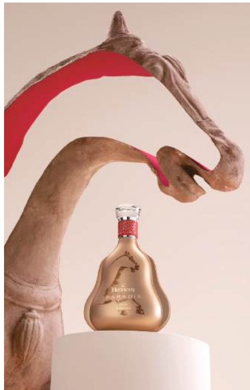
This photo recently provided by Hennessy shows the "Hennessy Paradis" featuring the new design.

The collection features Hennessy V.S.O.P, Hennessy X.O, and Hennessy Paradis that each have a "dynamic interpretation of the