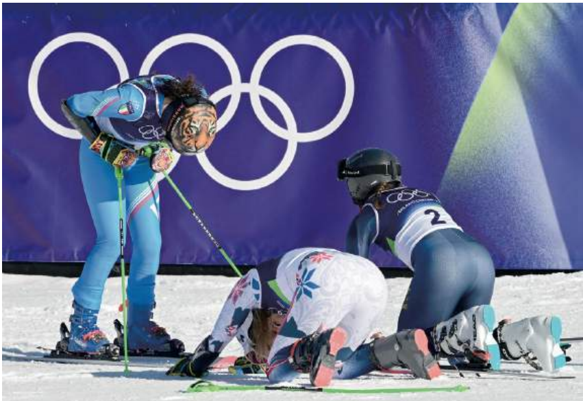
Tied silver medallists Norway's Thea Louise Stjernesund (centre) and Sweden's Sara Hector (right) react as Italy's Federica Brignone wins the gold medal in the women's giant slalom event during the Milano Cortina 2026 Winter Olympic Games at the Tofane Alpine Skiing Centre in Cortina d'Ampezzo, Italy yesterday.