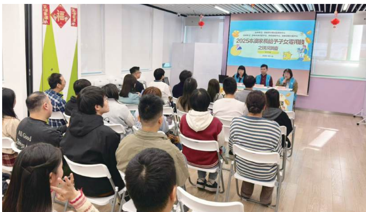
Kai Fong representatives present the findings of the survey during Friday's press conference at Kai Fong's Areia Preta community service centre.

According to the press conference, the survey's findings show that most of the respondents with children aged between 7 and 10 said that they still give their kids pocket money in cash. More specifically, only 25 percent of the respondents with children aged