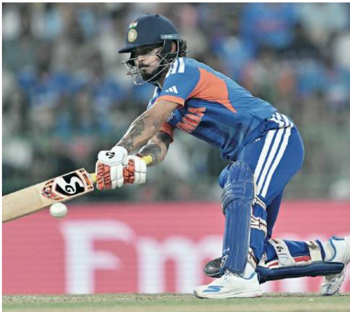
India's Ishan Kishan plays a shot during the 2026 ICC Men's T20 Cricket World Cup group stage match between India and Pakistan at the R Premadasa Stadium in Colombo, Sri Lanka yesterday.