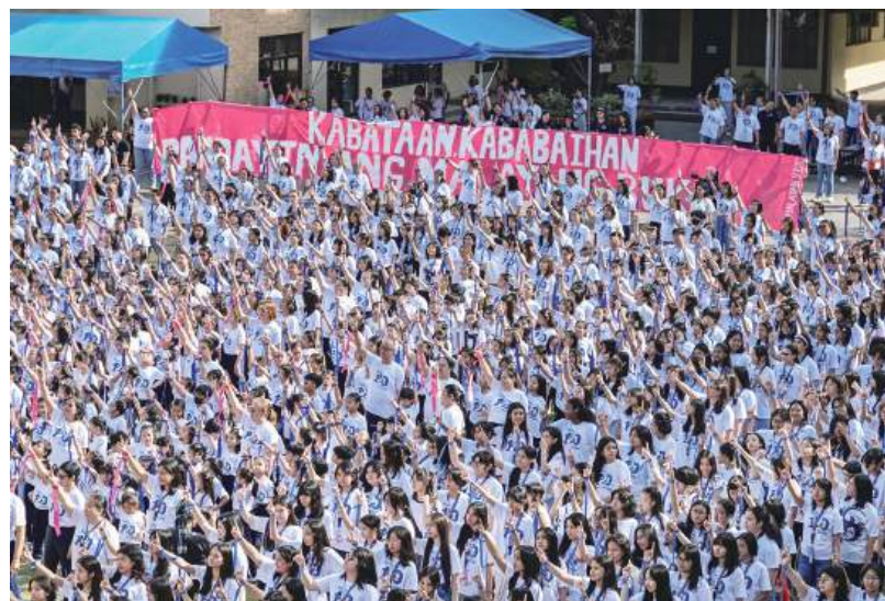
Students dance during the global action on violence against women and children dubbed "One Billion Rising" (OBR) at St. Scholastica's College in Manila on Friday.

Hanoi is targeting double-digit growth this year.