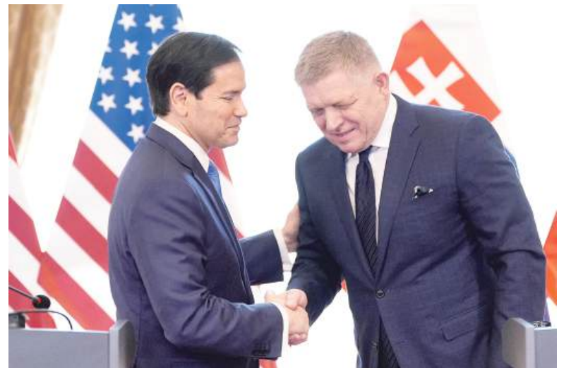
US Secretary of State Marco Rubio (left) and Slovakia’s Prime Minister Robert Fico shake hands at the end of a joint press conference in Bratislava, Slovakia, yesterday.

The Slovak leader said after the Mar-a-Lago meeting that he and