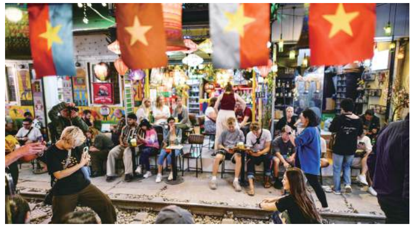
Tourists take photo along the railway track on the popular train street in Hanoi on Friday. — AFP

The conflict was a major factor for many voters, with analysts saying a wave of nationalism propelled Anutin to victory. — AFP