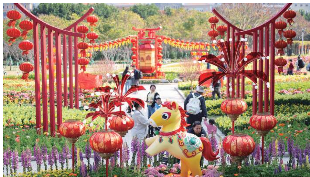
Revelers visit a flower exhibition at the Taipa Houses Museum yesterday. The flower exhibition celebrates the upcoming Chinese New Year. Many places in Macau have been festively decorated to welcome the Year of the Horse, which starts next Tuesday.