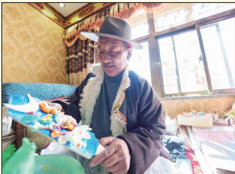
A craftsman makes a butter sculpture at a workshop in Lhasa, capital of the Xizang Autonomous Region, yesterday. Butter sculptures in vivid shapes of trees, flowers, birds, stars, etc. are gradually gaining popularity in the markets across the city ahead of the Tibetan New Year. These sculptures, made skillfully with colored butter, convey people's good wishes for the New Year. — Xinhua

Panchen Rinpoche said he will always firmly uphold the leadership of the CPC, resolutely safeguard national unity, and make greater contributions to promoting ethnic unity, religious harmony and Xizang's stability, development and progress. — Xinhua