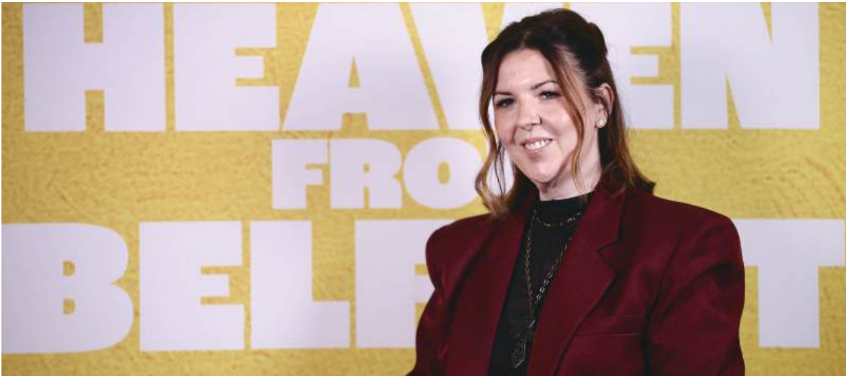
Irish screenwriter Lisa McGee poses during a special screening for the new Netflix show ‘How to Get to Heaven from Belfast’, at the BFI Southbank in London on Tuesday.