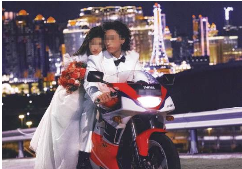
This photo downloaded from Xiaohongshu last night shows two models wearing wedding apparel but no helmets on a motorbike. For privacy reasons, the faces and licence plate number have been pixelated by the Post.

The statement did not reveal the culprits’ place of residence. However, images of the Macau Road Traffic Law-violating photoshoot were still circulating on the Chinese mainland’s Xiaohongshu (aka RedNote or “Little Red Book”) social networking and e-commerce platform last night. ■