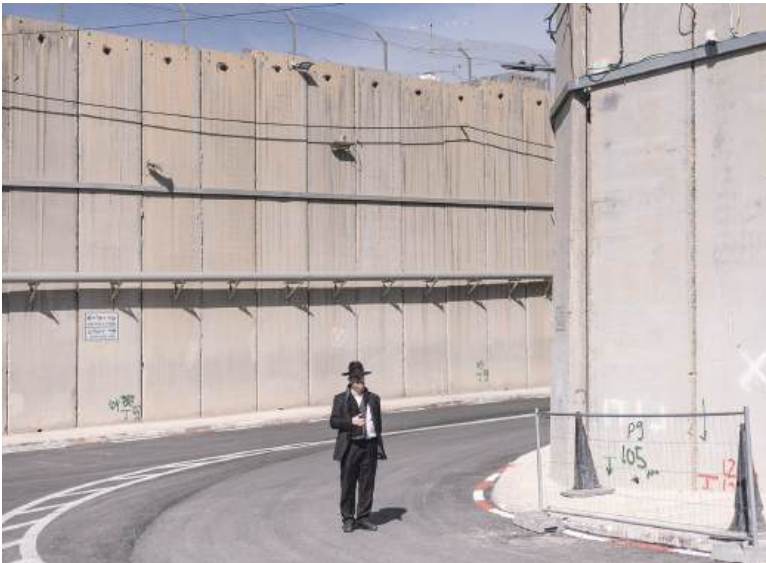
An ultra-Orthodox Jewish man stands close to the Israeli built controversial separation barrier at Rachel’s Tomb, Judaism’s third holiest shrine in Bethlehem, in the Israeli-occupied West Bank yesterday. The barrier is a combination of concrete walls and wire fences running north to south that Israel says is necessary to protect it self from Palestinian militants. However, large sections of it encroach on the West Bank, and the Palestinians call it a land grab. The International Court of Justice (ICJ) issued a non-binding ruling in 2004 that parts of the barrier in the West Bank are illegal and should be removed. The barrier is supposed to follow the Green Line that marks Israel’s borders before the 1967 Six Day War, when the Jewish state captured the Golan Heights, east Jerusalem, the Gaza Strip and the West Bank. – AFP

West Bank Palestinians are also displaced when Israel’s military destroys structures and dwellings it says were built without permits. – AFP