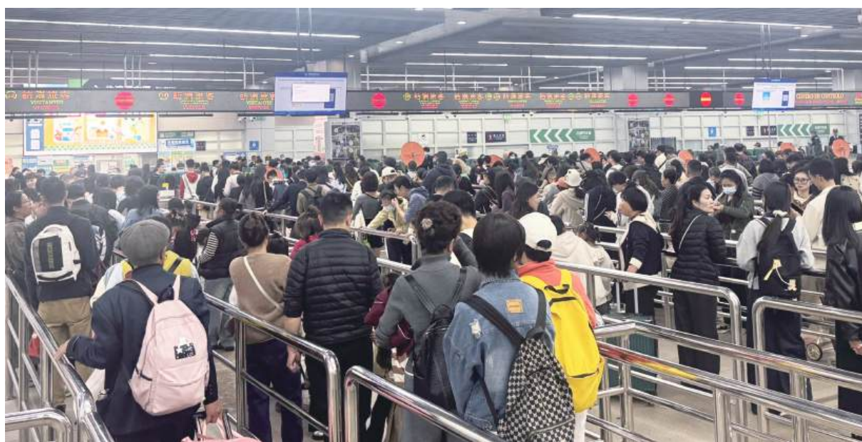
Crowds of visitors and residents queue at immigration counters at the Barrier Gate checkpoint yesterday.

Macau's border checkpoint entries and exits comprise local residents, visitors, non-resident workers (NRWs), non-local students