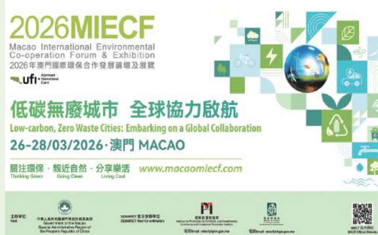
This poster provided by the Macao International Environmental Cooperation Forum & Exhibition (MIECF) yesterday promotes its 2026 edition to be held from March 26 through 28 at The Venetian Macao’s Cotai Expo.

The event is co-organised by Pan-Pearl River Delta region governments, co-ordinated by the Commerce and Investment Promotion Institute (IPIM) and the Environmental Protection Bureau (DSPA), aiming to support Macau’s economic diversification strategy through green development and global environmental cooperation. ■