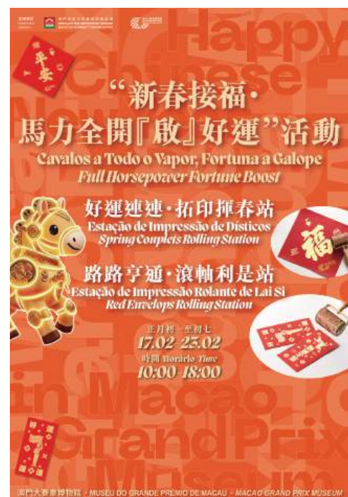
This poster provided by the Macau Government Tourism Office (MGTO) yesterday promotes its "Full Horsepower Fortune Boost" programme slated to start on Tuesday, the first day of the Chinese New Year (aka Spring Festival), at the Macau Grand Prix Museum (MGPM) in Zape.

Moreover, the museum gift shop will launch a promotional sale from now until