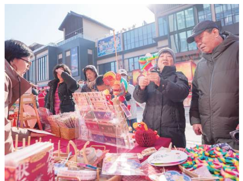
Shoppers select "fanlihua," a paper-made traditional flipping toy, at a stall during a festive fair held in the Longfusi commercial area of Beijing's Dongcheng District. The fair, held in celebration of the upcoming Spring Festival, offers diverse consumption scenarios for citizens and tourists. It will last until March 3.