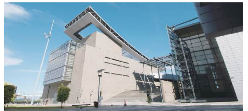
This undated handout photo downloaded from the Macau Government Tourism Office's (MGTO) website yesterday shows the Macau Cultural Centre in Nape.

The statement noted that the government decided to launch its regular community exchange activity, starting from January 2026, in compliance with its people-centred