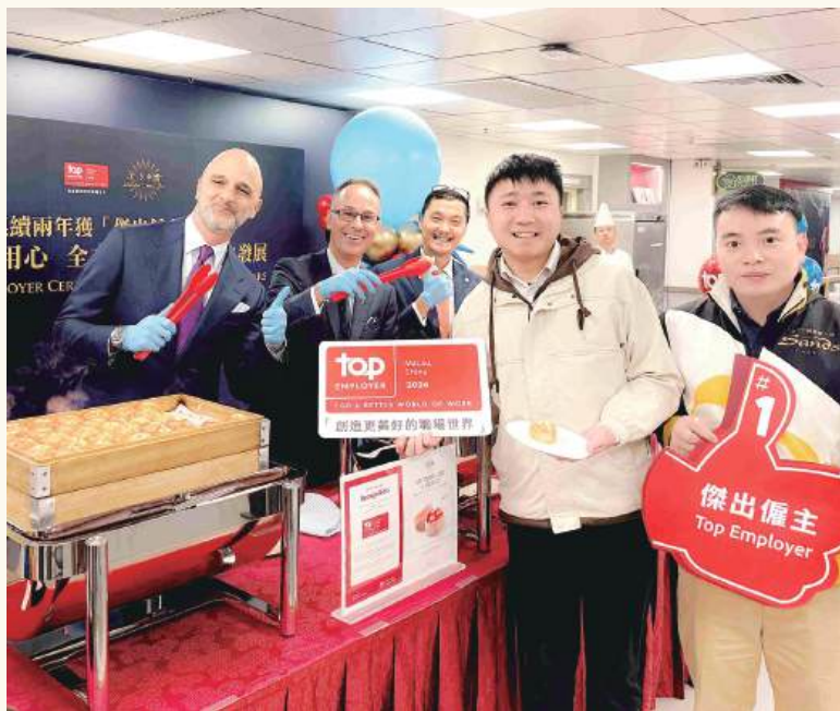
This photo provided by Sands China yesterday shows executives distributing pastries to staff at back-of-house areas to celebrate the "Top Employer" award, thanking them for their dedication and contributions.