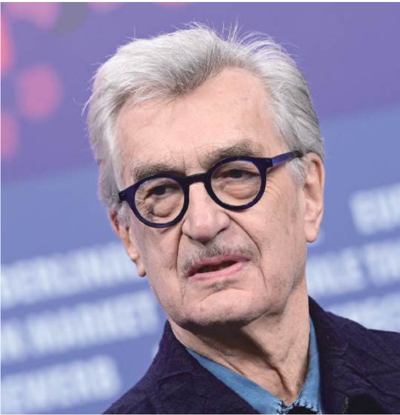
Jury President and German director Wim Wenders attends a press conference of the International Jury of the 76th Berlinale, Europe’s first major film festival of the year, in Berlin yesterday. The annual film-fest began yesterday.