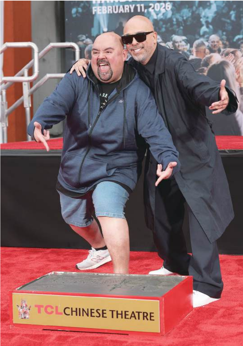
Filipino-American comedian and actor Jo Koy, (right) and Mexican-American comedian Gabriel “Fluffy” Jesús Iglesias pose after Koy’s Hand and Footprint Ceremony at TCL Chinese Theatre in Los Angeles on Wednesday.