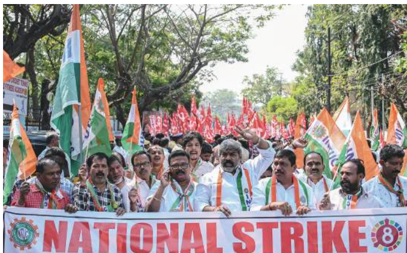
Members of trade unions and left political parties take part in a rally amid a nationwide strike over various issues in Hyderabad, India yesterday.

Forty-six elephants were killed in train accidents in 2025, according to official data. Overall, 397 elephants died in Sri Lanka in that year.