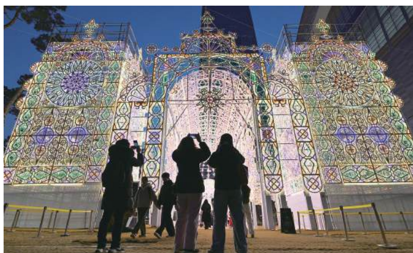
People pose for photos in front of illuminated installations during a light festival in a park of the Lotte World Tower in Seoul yesterday, ahead of the Lunar New Year holiday.

"We define how AI is developed and used in Singapore. We will set clear rules to ensure it is applied responsibly and safely," Wong said in his speech.