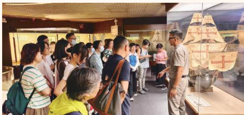
This handout photo provided by the Marine and Water Bureau (DSAMA) yesterday shows a guide introducing exhibits to visitors.