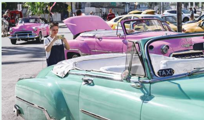
A tourist takes a photo of a classic American car in Cuba’s capital Havana on Wednesday.

Several foreign airlines have dropped routes in response, while governments, including Russia’s,