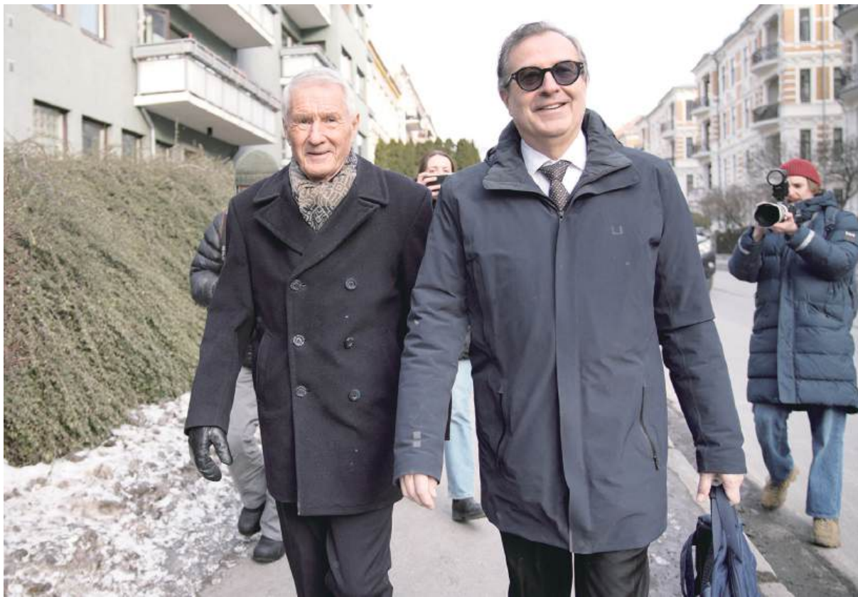
Lawyer Anders Brosveet (right) and former prime minister of Norway Thorbjorn Jagland walk along a street in Oslo yesterday.

The searches were made possible by the lifting of his immunity on Wednesday by the Council of