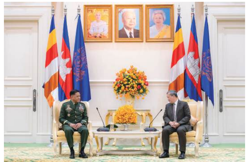
This handout photo taken and released by Agence Kampuchea Press (AKP) yesterday shows Cambodia's Prime Minister Hun Manet (right) speaking with Armed Forces of the Philippines Chief of Staff General Romeo Brawner Jr. during a meeting at the Peace Palace in Phnom Penh.

On its website, the NPA warns against the rise in the so-called "fake police scam", reminding the public that unlike these scammers, real policemen would never make video calls, share screenshots of someone's arrest warrant or use their smartphones to show police badges.