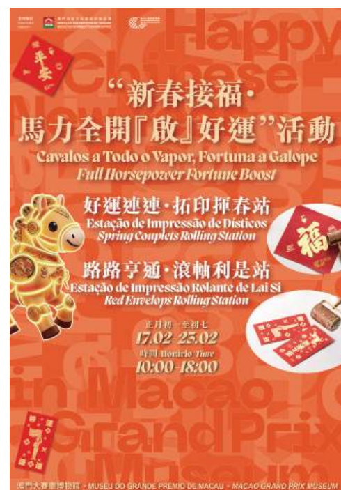
This poster provided by the Macau Government Tourism Office (MGTO) yesterday promotes its "Full Horsepower Fortune Boost" programme slated to start on Tuesday, the first day of the Chinese New Year (aka Spring Festival), at the Macau Grand Prix Museum (MGPM) in Zape.

Moreover, the museum gift shop will launch a promotional sale from now until