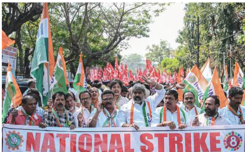
Members of trade unions and left political parties take part in a rally amid a nationwide strike over various issues in Hyderabad, India yesterday.

Forty-six elephants were killed in train accidents in 2025, according to official data. Overall, 397 elephants died in Sri Lanka in that year.