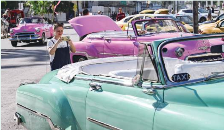
A tourist takes a photo of a classic American car in Cuba’s capital Havana on Wednesday.

MOSCOW – Russia is expected to supply Cuba with oil as part of a “humanitarian” effort, the Izvestia newspaper reported yesterday. Cuba is suffering its worst energy crisis in years, driven largely by the United States throttling supplies of Venezuelan oil. Russia’s ministry of economic development told the daily that “as far as we know, Russia is expected to soon supply oil and petroleum products to Cuba as humanitarian aid”. On Monday, the Kremlin, a traditional ally of Cuba, accused the United States of attempting to “suffocate” the island nation. Already under US trade embargo for over 60 years, Cuba is struggling with fast-dwindling fuel stocks and taking drastic rationing measures, including preventing airlines from refuelling. Several foreign airlines have dropped routes in response, while governments, including Russia’s,