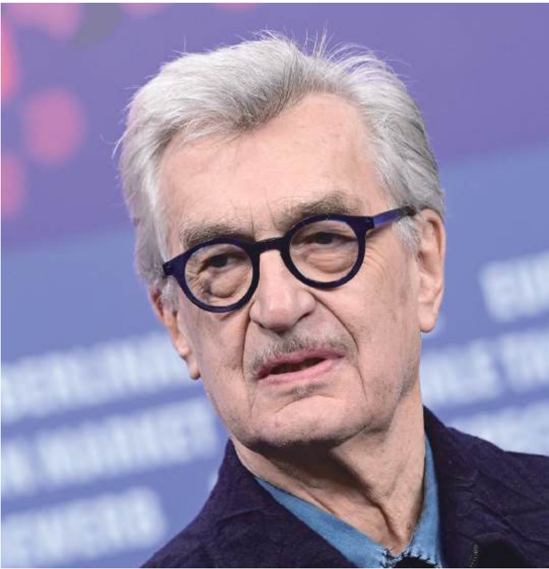
Jury President and German director Wim Wenders attends a press conference of the International Jury of the 76 th Berlinale, Europe’s first major film festival of the year, in Berlin yesterday. The annual film-fest began yesterday.