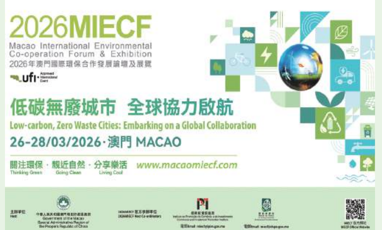
This poster provided by the Macao International Environmental Cooperation Forum & Exhibition (MIECF) yesterday promotes its 2026 edition to be held from March 26 through 28 at The Venetian Macao’s Cotai Expo.

The event is co-organised by Pan-Pearl River Delta region governments, co-ordinated by the Commerce and Investment Promotion Institute (IPIM) and the Environmental Protection Bureau (DSPA), aiming to support Macau’s economic diversification strategy through green development and global environmental cooperation. ■