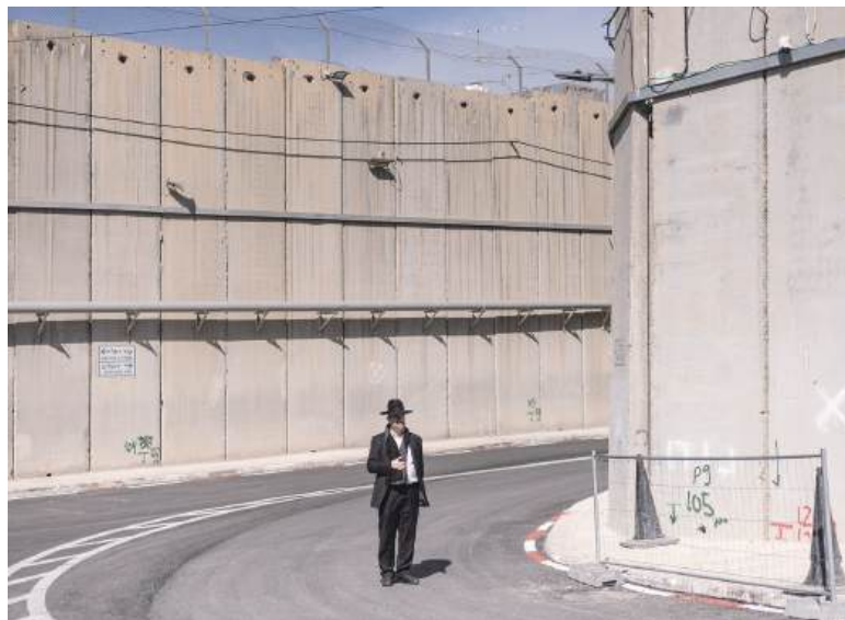
An ultra-Orthodox Jewish man stands close to the Israeli built controversial separation barrier at Rachel’s Tomb, Judaism’s third holiest shrine in Bethlehem, in the Israeli-occupied West Bank yesterday. The barrier is a combination of concrete walls and wire fences running north to south that Israel says is necessary to protect it self from Palestinian militants. However, large sections of it encroach on the West Bank, and the Palestinians call it a land grab. The International Court of Justice (ICJ) issued a non-binding ruling in 2004 that parts of the barrier in the West Bank are illegal and should be removed. The barrier is supposed to follow the Green Line that marks Israel’s borders before the 1967 Six Day War, when the Jewish state captured the Golan Heights, east Jerusalem, the Gaza Strip and the West Bank.

Israel has “categorically” rejected the inquiry’s report, describing it as “distorted and false” and has called for the body’s abolition.