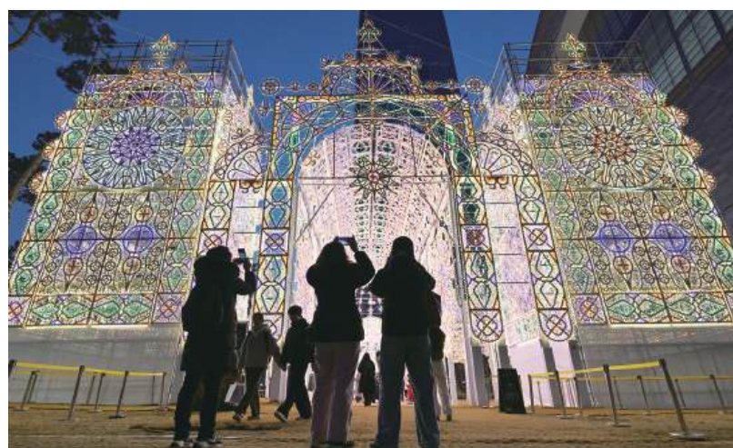
People pose for photos in front of illuminated installations during a light festival in a park of the Lotte World Tower in Seoul yesterday, ahead of the Lunar New Year holiday.

"We define how AI is developed and used in Singapore. We will set clear rules to ensure it is applied responsibly and safely," Wong said in his speech.