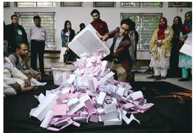
An electoral official opens a ballot box as counting starts at a polling station during Bangladesh's general election in Dhaka yesterday.