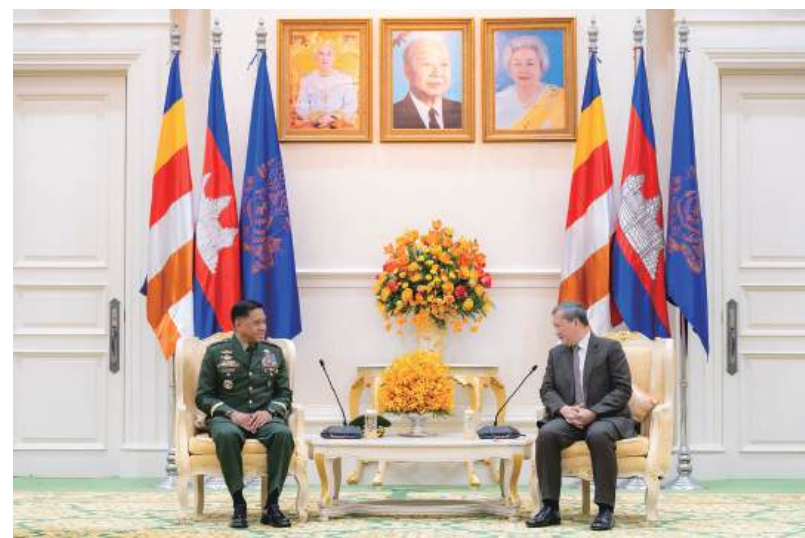
This handout photo taken and released by Agence Kampuchea Press (AKP) yesterday shows Cambodia's Prime Minister Hun Manet (right) speaking with Armed Forces of the Philippines Chief of Staff General Romeo Brawner Jr. during a meeting at the Peace Palace in Phnom Penh.

On its website, the NPA warns against the rise in the so-called "fake police scam", reminding the public that unlike these scammers, real policemen would never make video calls, share screenshots of someone's arrest warrant or use their smartphones to show police badges.