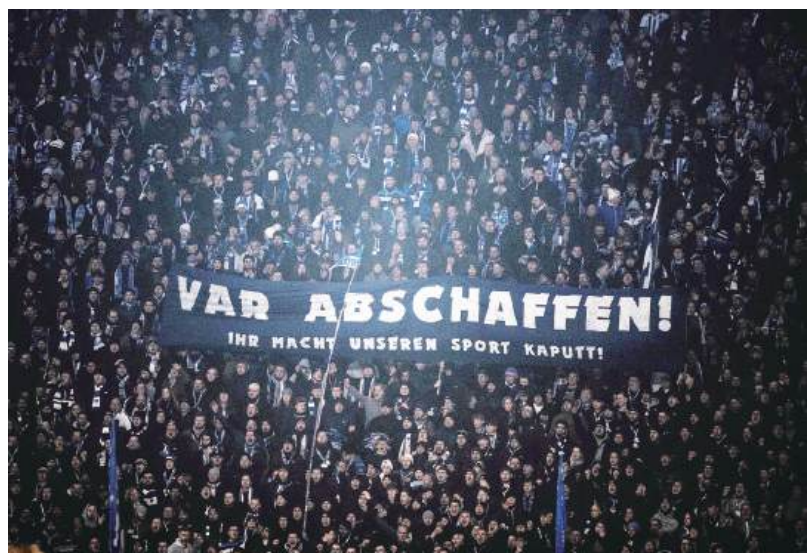
Hertha fans display a banner reading "Abolish the VAR (Video Assistant Referee), it ruins our sport" during the German Cup (DFB-Pokal) quarter-final against SC Freiburg in Berlin on Tuesday.