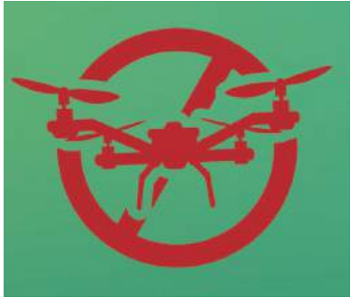
This poster provided by the Civil Aviation Authority of Macau (AACM) yesterday shows its drone ban logo.

The measure aims to prevent risks or interference during the city's traditional firework displays. Violations will result in penalties pursuant to Paragraph 2 of Article 59 of Law No. 4/2025 (Civil Aviation Activity Law). The statement urges the public to heed the ban in order to maintain safety and order throughout the displays. ■