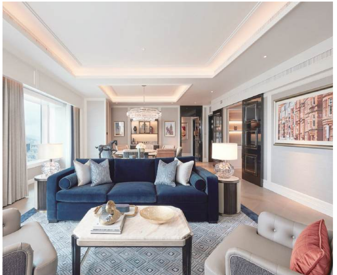
This photo provided by Sands China yesterday shows the Lancaster Suite of Paiza Grand at Londoner Grand.

More news about other award winners tomorrow. ■