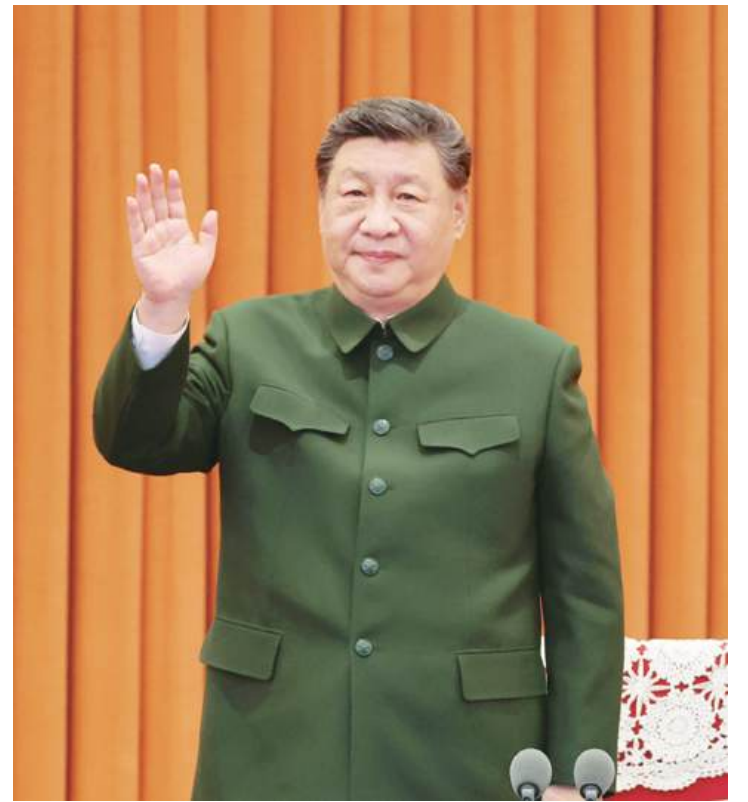
Xi Jinping, General Secretary of the Central Committee of the Communist Party of China (CPC), President of the People's Republic of China (PRC), and Chairman of the Central Military Commission (CMC), waves while inspecting the combat readiness and mission execution of the entire armed forces via video link from the Bayi Building in Beijing on Tuesday.

"Maintaining combat readiness during holidays is a fine tradition of our armed forces," Xi said, urging the military to stay vigilant and safeguard both national peace and the well-being of the people.