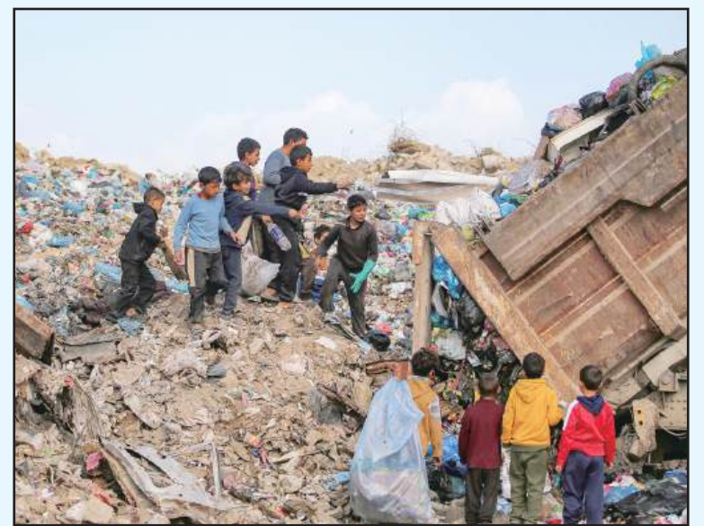
Children sort through waste at a trash mound at the Maghazi camp for Palestinian refugees in the central Gaza Strip yesterday.

A Palestinian technocratic committee has been set up with a goal of taking over day-to-day governance in the Strip, but it remains unclear whether, or how, it will address the issue of demilitarisation.