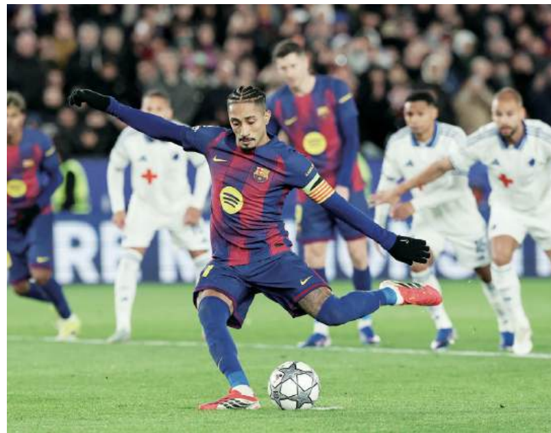
Barcelona's Brazilian forward Raphinha scores his team's third goal from the penalty spot during the UEFA Champions League league phase day 8 match against FC Copenhagen at the Camp Nou Stadium in Barcelona on January 28.