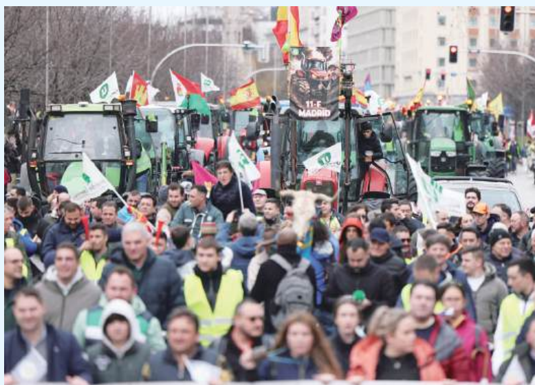
Spanish farmers protest with tractors against the recent EU-Mercosur trade deal and the economic pressures facing the Iberian country's agricultural sector, in Madrid yesterday. Spain on Monday celebrated the approval by EU nations of a vast trade deal with South American bloc Mercosur, championed by business groups but loathed by European farmers. – AFP

He promised compensation for affected farmers and safeguards to limit imports if domestic producers