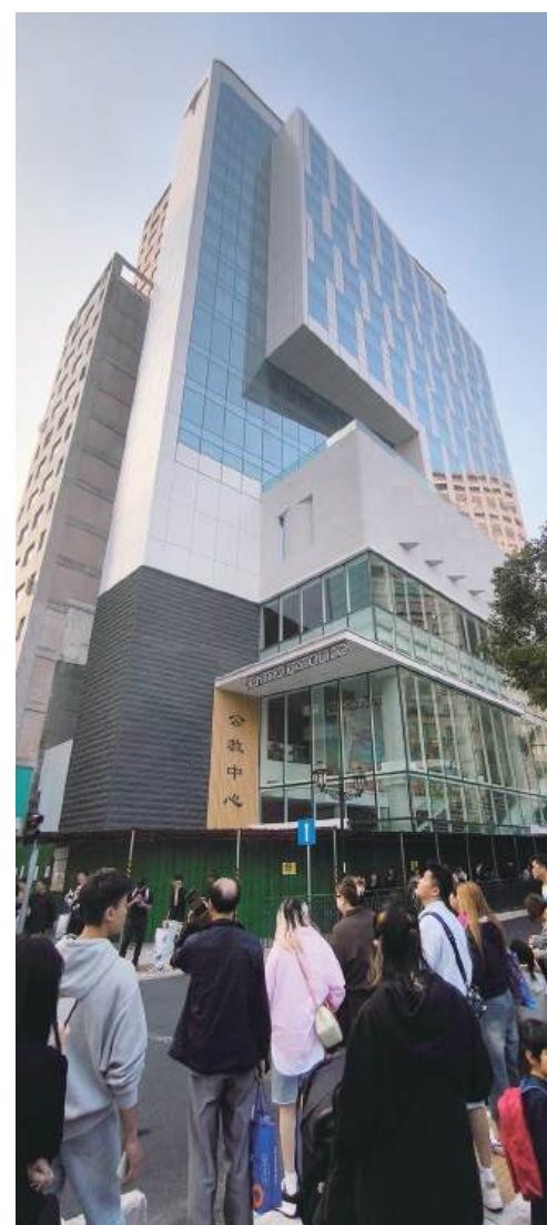
Pedestrians walk past the Macau Catholic Centre yesterday.

This photo provided by the Catholic Centre of Macau yesterday shows the interior of the nearly completed centre on Rua do Campo.