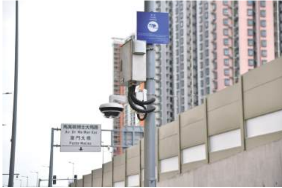
This undated handout photo released by the Unitary Police Service (SPU) yesterday shows a camera of the police forces' citywide CCTV surveillance system newly installed in Zone A.

Yesterday's SPU statement said that the 10 new cameras have been installed in areas around the three HOS estates, namely Tong Seng Building, Tong Chong Building, and Tong Kai Building. ■