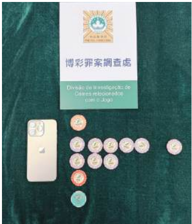
This undated handout photo provided by the Judiciary Police (PJ) yesterday shows a smartphone and HK$18,600 in chips seized from the illegal currency exchange suspect, along with HK$1,000 in chips confiscated from his client.