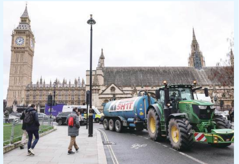
A farm tractor pulls a trailer displaying a banner which reads “Starmer full of sh1t” as a protest against Britain’s Prime Minister Keir Starmer, on the streets by Parliament Square in central London yesterday.

She accused Starmer of “stuffing government with hypocrites and paedophile apologists”.