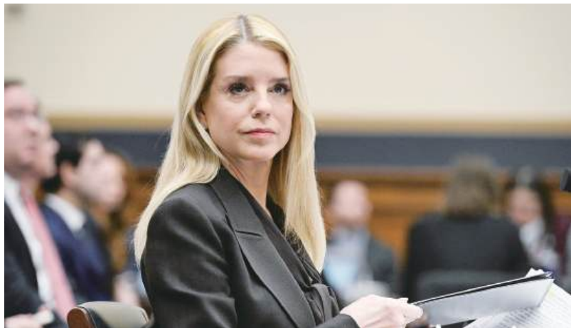
US Attorney General Pam Bondi takes her seat before testifying before a House Judiciary Committee hearing on “Oversight of the Department of Justice” on Capitol Hill in Washington, DC, yesterday.