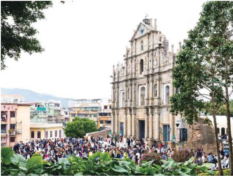
This undated handout photo provided by the Cultural Affairs Bureau (IC) yesterday shows its UNESCO World Heritage-listed Ruins of St. Paul's after completion of its second-phase restoration.

The first phase of the restoration was completed last year, involving the Virgin Mary statue on the third