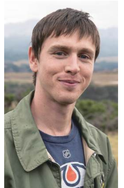
August 29, 2025 file photo of English actor and director Harris Dickinson posing at the 2025 Telluride Film Festival Patron’s Brunch.

“I’m interested in the idea of what happens when society falls, what happens when we are left with nothing or we’re stripped of everything.”