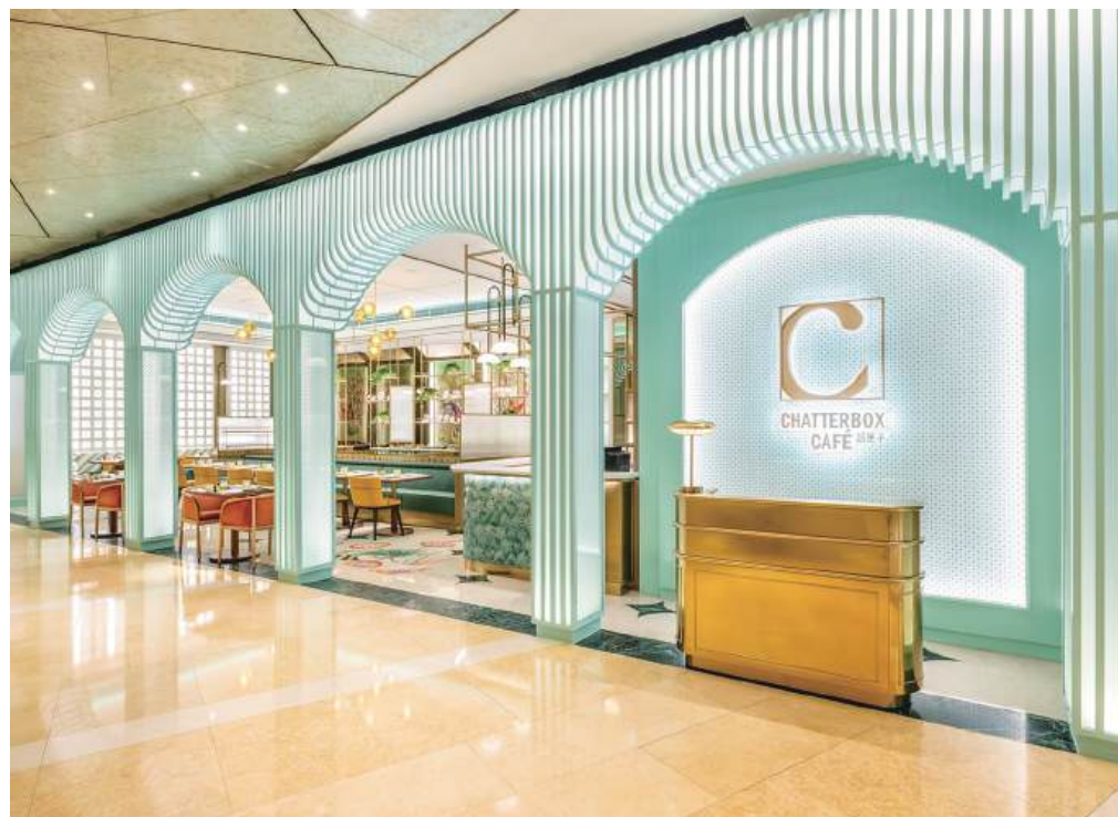
This undated handout photo recently provided by MGM shows the exterior of Singapore dining brand Chatterbox Café at MGM MACAU in Nape.

The restaurant operates daily from 11 a.m. to 11 p.m. and is located at MGM MACAU on Avenida Dr. Sun Yat Sen. Further information is available on the company's official website https://www.mgm.mo/en/dining/mgm-macau/chatterbox-cafe . ■