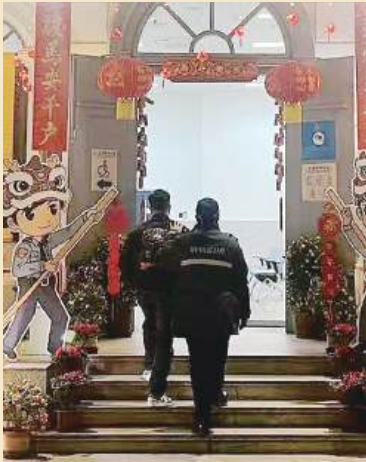
This undated handout photo provided by the Public Security Police (PSP) yesterday shows a PSP officer escorting the drunk-driving suspect into a police station.