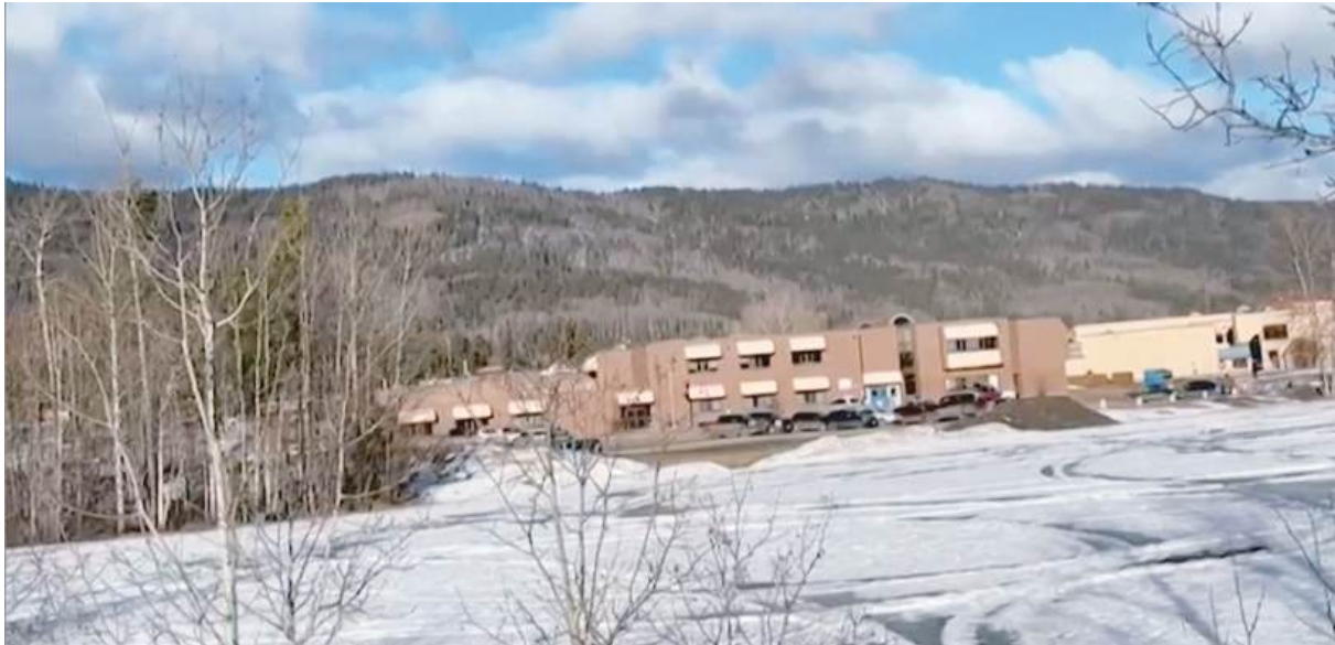
This screengrab of a video provided by local journalist Trent Ernst shows the middle school and high school building where Tuesday's shooting took place, leaving at least nine people dead in the small town of Tumbler Ridge, British Columbia, Canada.