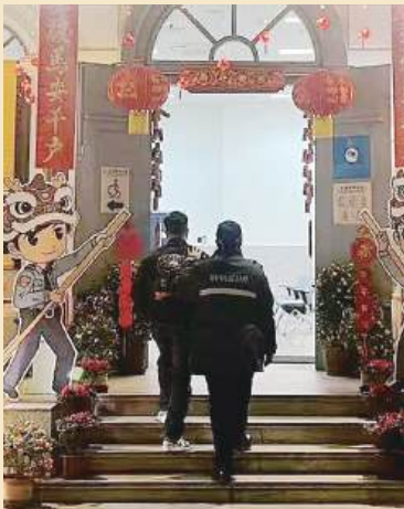
This undated handout photo provided by the Public Security Police (PSP) yesterday shows a PSP officer escorting the drunk-driving suspect into a police station.