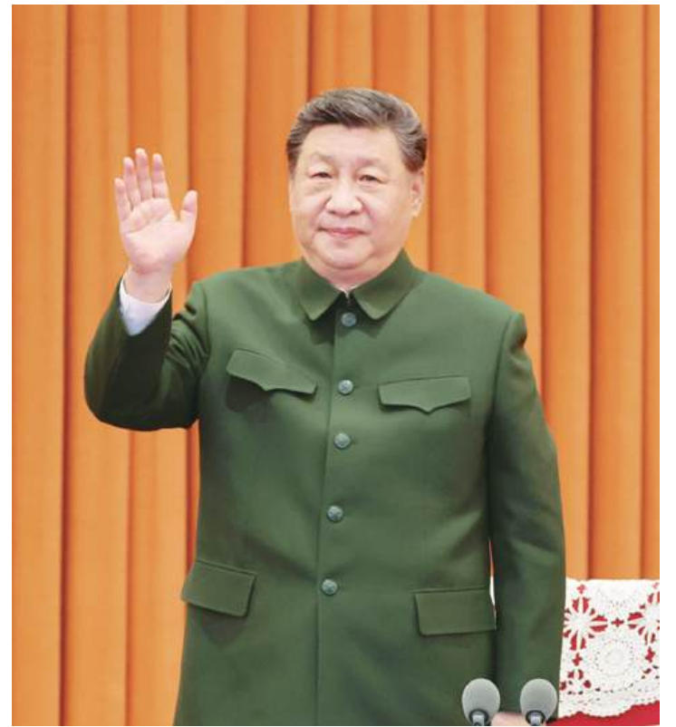
Xi Jinping, General Secretary of the Central Committee of the Communist Party of China (CPC), President of the People's Republic of China (PRC), and Chairman of the Central Military Commission (CMC), waves while inspecting the combat readiness and mission execution of the entire armed forces via video link from the Bayi Building in Beijing on Tuesday.

"Maintaining combat readiness during holidays is a fine tradition of our armed forces," Xi said, urging the military to stay vigilant and safeguard both national peace and the well-being of the people.