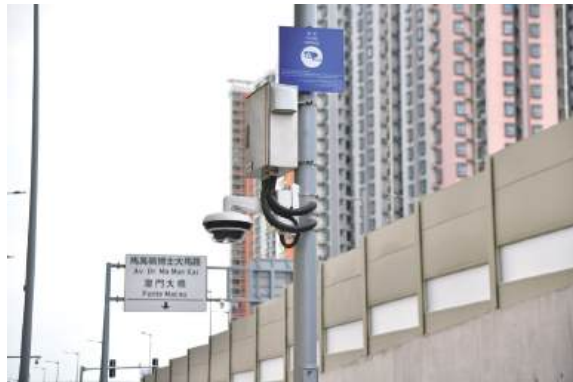
This undated handout photo released by the Unitary Police Service (SPU) yesterday shows a camera of the police forces' citywide CCTV surveillance system newly installed in Zone A.

Yesterday's SPU statement said that the 10 new cameras have been installed in areas around the three HOS estates, namely Tong Seng Building, Tong Chong Building, and Tong Kai Building. ■