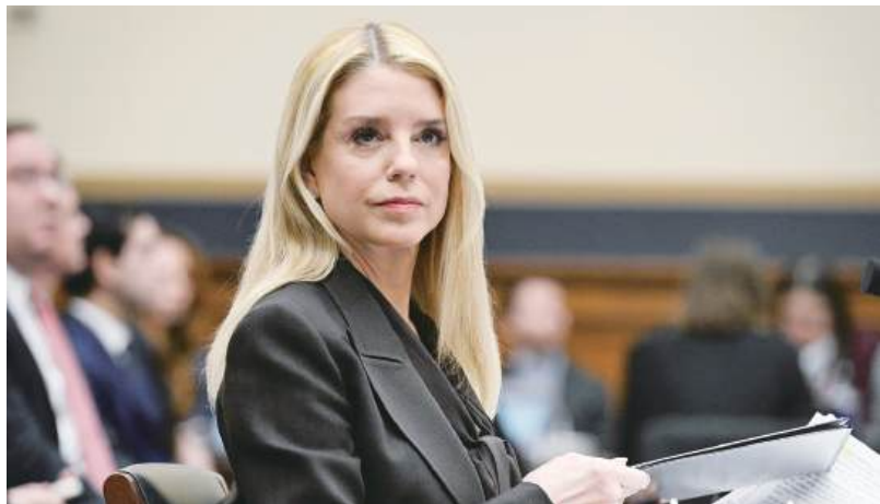
US Attorney General Pam Bondi takes her seat before testifying before a House Judiciary Committee hearing on “Oversight of the Department of Justice” on Capitol Hill in Washington, DC, yesterday.