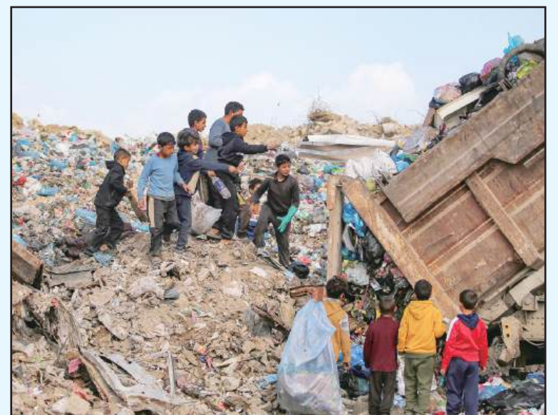
Children sort through waste at a trash mound at the Maghazi camp for Palestinian refugees in the central Gaza Strip yesterday.

A Palestinian technocratic committee has been set up with a goal of taking over day-to-day governance in the Strip, but it remains unclear whether, or how, it will address the issue of demilitarisation.