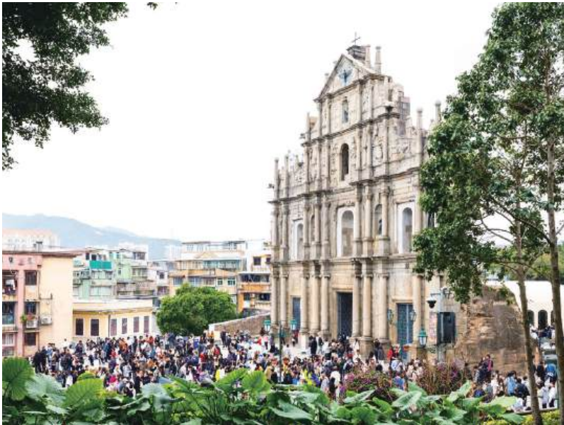
shows its UNESCO World Heritage-listed Ruins of St. Paul's after completion of its second-phase restoration.

The first phase of the restoration was completed last year, involving the Virgin Mary statue on the third