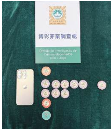
This undated handout photo provided by the Judiciary Police (PJ) yesterday shows a smartphone and HK$18,600 in chips seized from the illegal currency exchange suspect, along with HK$1,000 in chips confiscated from his client.