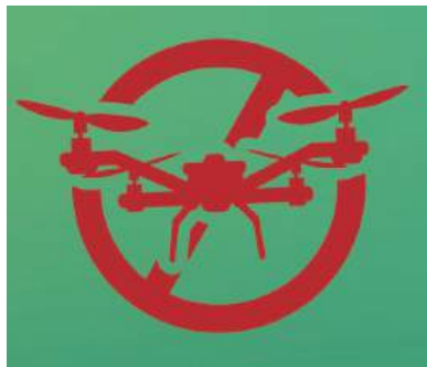
This poster provided by the Civil Aviation Authority of Macau (AACM) yesterday shows its drone ban logo.

The measure aims to prevent risks or interference during the city's traditional firework displays. Violations will result in penalties pursuant to Paragraph 2 of Article 59 of Law No. 4/2025 (Civil Aviation Activity Law). The statement urges the public to heed the ban in order to maintain safety and order throughout the displays. ■