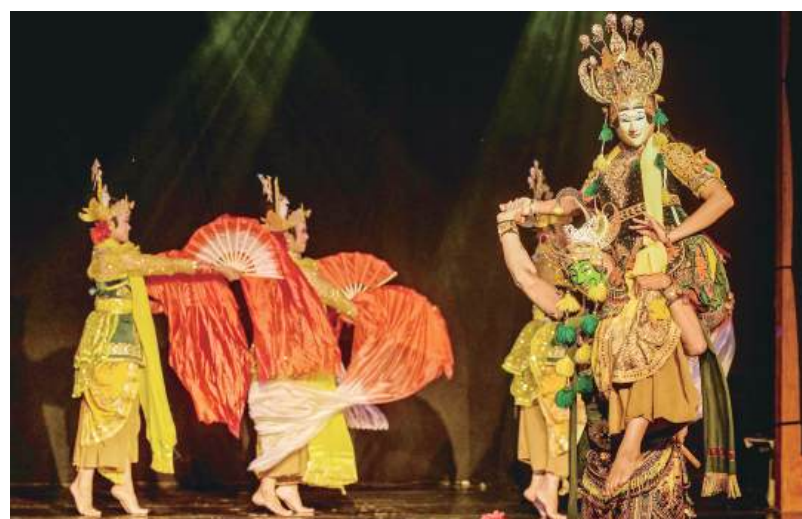
Artists perform a mask dance featuring the heroic Panji characters at Taman Budaya in Surabaya on Tuesday.

"Therefore, harmonizing conservation goals with local development needs is not merely a social objective, but an ecological necessity for the survival of the region's extraordinary biodiversity," he said. — Xinhua