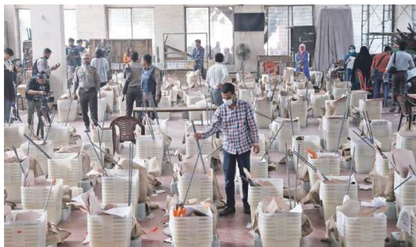
Staff members check ballot boxes ahead of the general election in Dhaka, Bangladesh, yesterday. — Xinhua

Police records show that five people were killed and more than 600 injured in political clashes during the campaign period from December 11 to February 9. — AFP