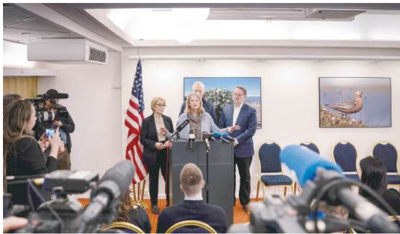
US Republican Senator Lisa Murkowski (centre) speaks to the press next to US Democrat Senator Maggie Hassan (left) and US Democrat Senator Gary Peters during a press conference in Nuuk, capital of Greenland, yesterday. A delegation of United States senators visited Greenland yesterday to “rebuild the trust” shattered by President Donald Trump’s threats to annex the Arctic island, the lawmakers said. – AFP

In the report, Draghi advocated for a European preference in defence procurement and in the space sector, albeit in a targeted manner. – AFP