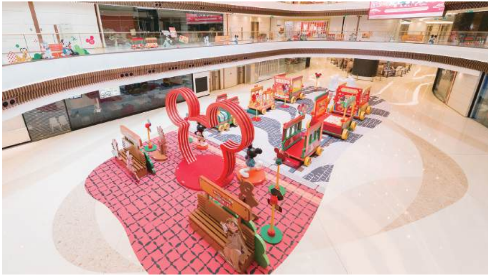
This photo recently provided by NOVA Mall shows a top-down view of the Mickey & Friends railway station installation in Taipa.