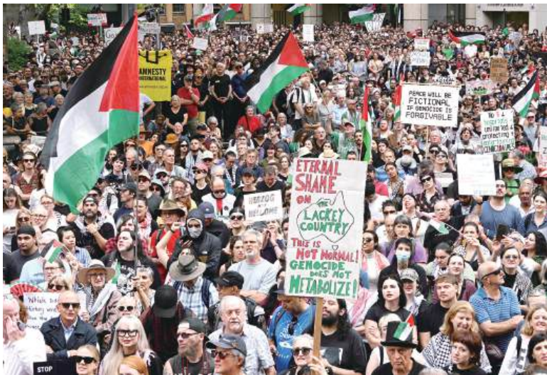
Pro-Palestinian protesters take part in a demonstration against Israeli President Isaac Herzog's visit to Australia in Sydney yesterday.