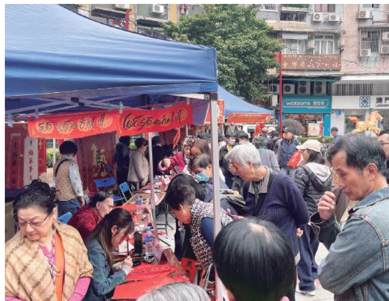
Pedestrians gather around Chinese New Year (CNY – aka Spring Festival) couplets giveaway booths to receive them free of charge in Rotunda de Carlos da Maia, colloquially known as “Three Lamps” roundabout.