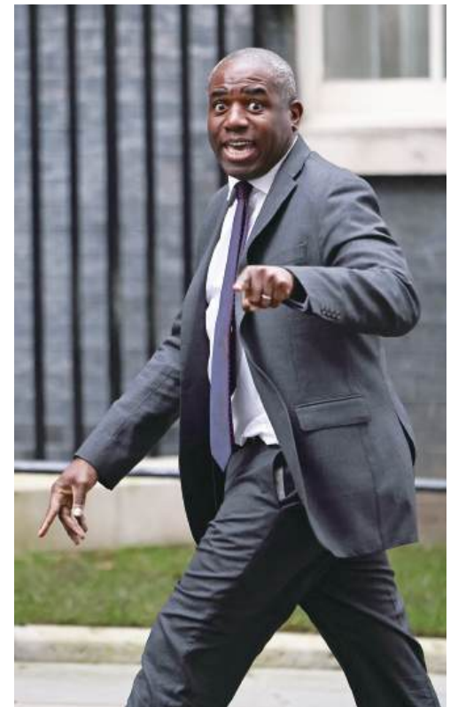
Britain's Justice Secretary and Deputy Prime Minister David Lammy gestures to members of the media as he strides towards 10 Downing Street, the official residence of Britain's Prime Minister, presently Labour party leader Keir Starmer, in central London, yesterday. British Prime Minister Keir Starmer "is concentrating on the job in hand" and will not resign, his official spokesman said yesterday, as the embattled leader faces intense pressure over the Epstein scandal. Starmer was "getting on with the job of delivering change across the country", the spokesman told reporters, hours after the prime minister's communications chief and chief of staff both resigned.