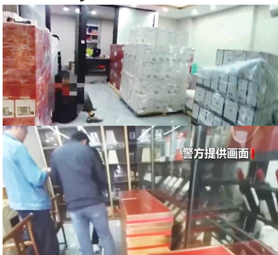
These two undated video grabs uploaded from Zhuhai's Gongbei Customs WeChat official account last night shows smuggled bottles of wine and liquor in a shop in Shenzhen.

*The phrase "smuggling by ants" (蚂蚁搬家) is a metaphor used in Hong Kong, Macau and the Chinese mainland to describe a specific method of small-scale, repetitive smuggling carried out by individuals ("ants") or small groups (like an army of ants). – DeepSeek/MPD