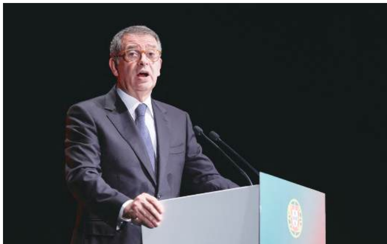
Portugal's centre-left President-elect António José Seguro addresses supporters after his victory in the second-round vote in Lisbon early yesterday (local time).

right candidate to make it through to a run-off vote in Portugal.