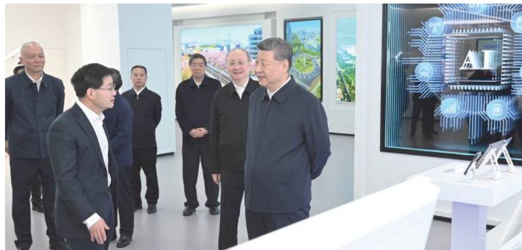
President Xi Jinping (right, front), also general secretary of the Communist Party of China (CPC) Central Committee and chairman of the Central Military Commission, visits an information technology (IT) innovation park in Beijing yesterday. At the park, Xi learned about IT application and innovation, and was briefed on Beijing's efforts to expedite the development of an international sci-tech innovation center. Xi checked the display of sci-tech innovation outcomes, and talked with researchers and heads of sci-tech enterprises. (More on p.7)