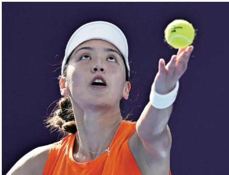
Wang Xinyu serves during the women's singles round of 64 match against Emiliana Arango of Colombia at the WTA Qatar Open 2026 tennis tournament in Doha, Qatar, yesterday. Wang won the match 6-1, 7-5.