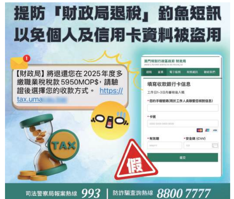
This image released by the Judiciary Police (PJ) yesterday warns the public to beware of “tax refund” scams.

If in doubt, according to the statement, citizens can use the Judiciary Police's “Anti-Fraud Tool” to check for risks, or call the Anti-Fraud Inquiry Hotline on 8800 7777 or the Police Emergency Hotline on 993 for assistance. ■