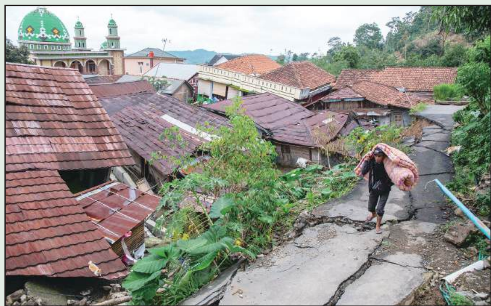
A man salvages his belongings after land movement struck Padasari village in Tegal, Central Java, Indonesia yesterday, damaging homes, public facilities and schools, leading to the evacuation of thousands of residents. — AFP

"I don't think he will just get out of politics — he is a real survivor." — AFP