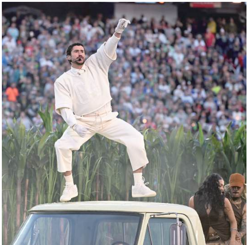
Puerto Rican singer Bad Bunny performs during the Super Bowl LX Patriots vs Seahawks Apple Music Halftime Show at Levi’s Stadium in Santa Clara, California on Sunday.

The NFL entered into an agreement in 2019 with Jay-Z’s