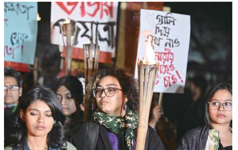
Women carry torches during Shekol Vangar Podojatra (Walk to Break the Chains), a midnight procession held to demand justice and political representation in Bangladesh's upcoming general elections in Dhaka yesterday.

The march, which began at midnight Sunday and ended in the early hours of yesterday, came against a backdrop of rising incendiary rhetoric targeting women at religious and political rallies, and growing attempts to push them out of public life.