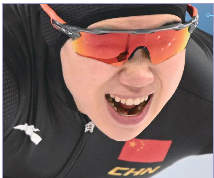
China's Tian Ruining competes in the speed skating women's 1000m during the Milano Cortina 2026 Winter Olympic Games at Milano Speed Skating Stadium in Milan yesterday.