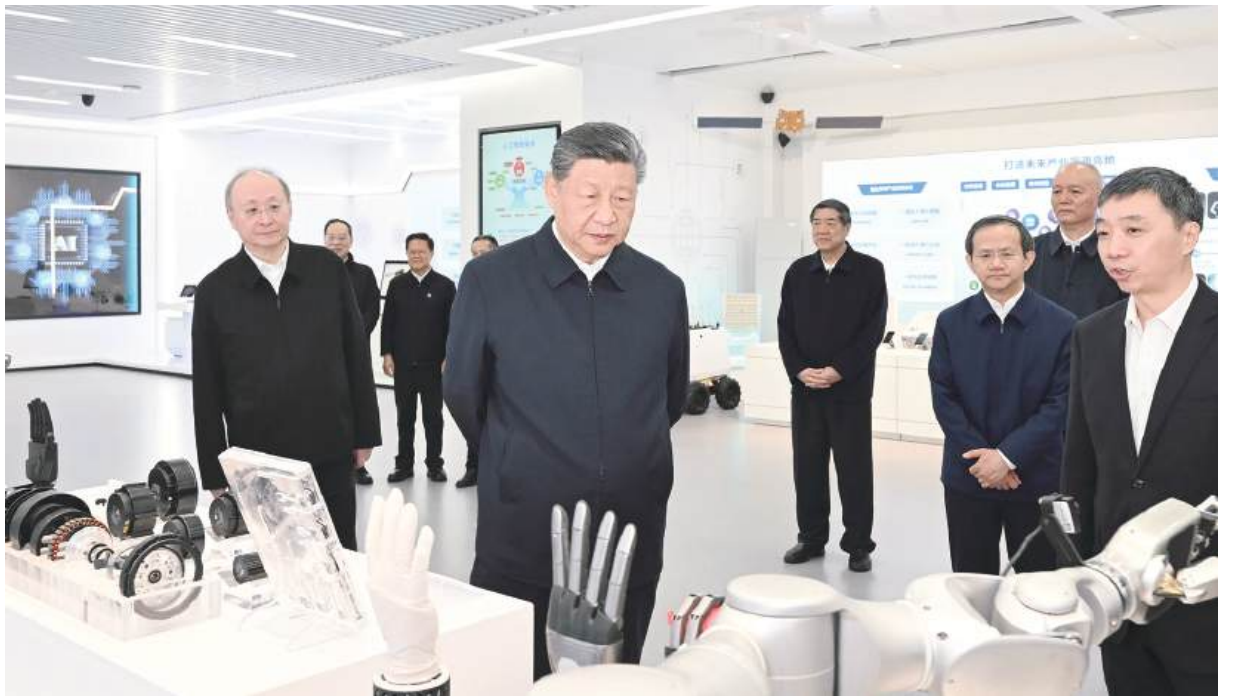
President Xi Jinping (center), also general secretary of the Communist Party of China (CPC) Central Committee and chairman of the Central Military Commission, visits an information technology (IT) innovation park in Beijing yesterday. At the park, Xi learned about IT application and innovation, and was briefed on Beijing's efforts to expedite the development of an international sci-tech innovation center.

BEIJING — Xi Jinping, general secretary of the Communist Party of China (CPC) Central Committee, yesterday stressed self-reliance and strength in science and technology, hailing it as the "key" in building