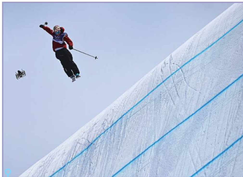
A drone films Austria's Lara Wolf as she competes in the freestyle skiing women's freeski slopestyle final run 1 during the Milano Cortina 2026 Winter Olympic Games at Livigno Snow Park-Slopestyle, in Livigno (Valtellina) Italy, yesterday.