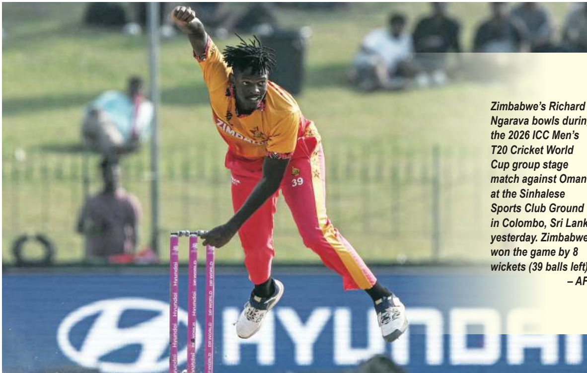
Zimbabwe's Richard Ngarava bowls during the 2026 ICC Men's T20 Cricket World Cup group stage match against Oman at the Sinhalese Sports Club Ground in Colombo, Sri Lanka yesterday. Zimbabwe won the game by 8 wickets (39 balls left)