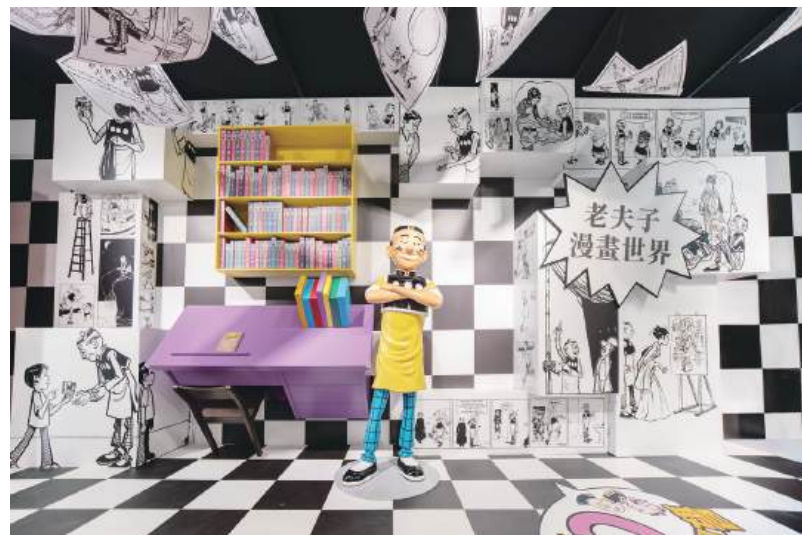
This undated handout photo provided by Melco Resorts & Entertainment Limited yesterday shows its “Time Machine Manuscript Collection” section of the “Old Master Q 60 th Anniversary Fantastic Journey” exhibition at Studio City Macau in Cotai.

* “Old Master Q” (老夫子) is a classic Chinese manhua (comic) character created by the late Hong Kong cartoonist Alfonso Wong (under the pen name Wong Chak) in the 1960s. “Old Master Q” is a bald, elderly man who always wears traditional Chinese attire – a black mandarin jacket and trousers. He is often portrayed as well-meaning but slightly old-fashioned, clever yet sometimes mischievous, navigating the clash between traditional values and a rapidly modernising world. The comics are mostly silent gag strips, i.e., using very few words, relying on visual humour and slapstick. – DeepSeek