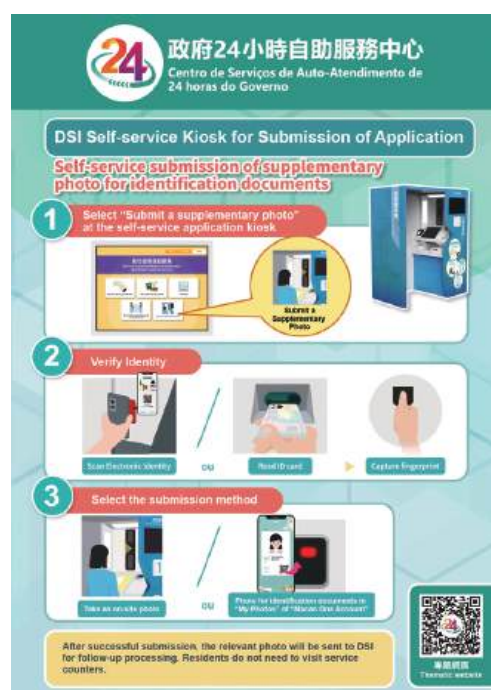
This poster provided by the Identification Services Bureau (DSI) yesterday introduces the self-service machine for submitting supplementary photos for identification documents.

The statement added that after verifying