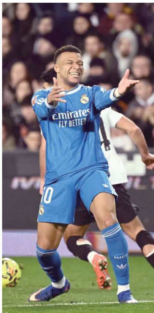
Real Madrid's French forward Kylian Mbappe reacts during the Spanish league match against Valencia CF at Mestalla Stadium in Valencia on Sunday. The match ended with Real winning 2-0.