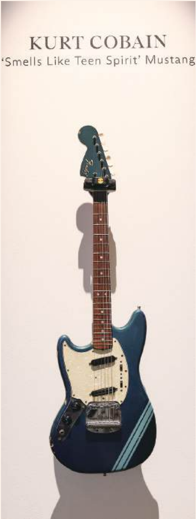
Kurt Cobain’s 1966 Fender Mustang guitar is displayed during a press preview of The Jim Irsay Collection at Christie’s Los Angeles in Beverly Hills, California, on Thursday.