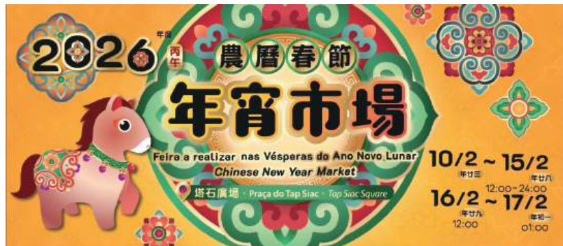
This poster provided by the Municipal Affairs Bureau (IAM) last week promotes its upcoming Chinese New Year (CNY) Market, slated to open in Praça do Tap Siac tomorrow.

The CNY Market aims to provide a festive space to shop and enjoy seasonal cultural activities ahead of the holiday, the bureau said. ■