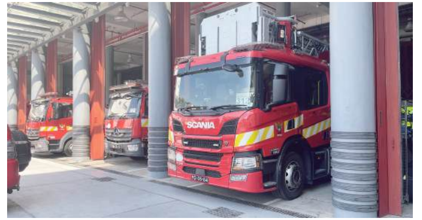
This photo taken on Friday shows fire engines and an ambulance parked at the Sai Van Lake fire station, which is also the Fire Services Bureau's (CB) headquarters.

In response to fire safety hazards in older buildings, Wong said that over 11,000 fire prevention inspections were conducted last year, primarily focusing on the