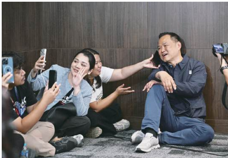
Thailand's Prime Minister and Bhumjaithai Party leader Anutin Charnvirakul speaks to journalists before a press conference while awaiting final results in Thailand's general election in Bangkok yesterday

The Southeast Asian nation's next government will also need to contend with anaemic economic growth—the tourism sector is vital but arrivals yet to return to