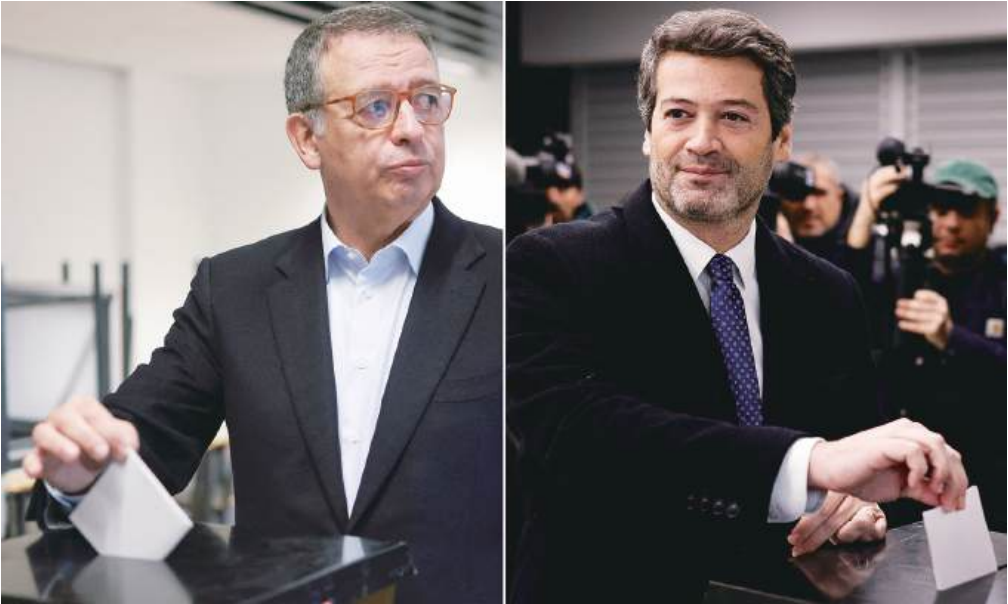
This combination of pictures shows socialist candidate António José Seguro (left) casting his vote in Caldas da Rainha and far-right wing candidate André Ventura voting in Lisbon yesterday during the second round of Portugal's presidential election.

The Macau Literary Festival is an annual event that celebrates the written word and the arts, promoting dialogue between writers, artists and audiences from different cultural and linguistic backgrounds. It has become an essential part of Macau’s cultural calendar, highlighting the region’s unique role as a meeting point between East and West. Launched in January 2012, it will hold its 15 th edition in 2026.