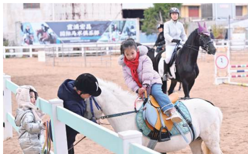
A girl learns how to ride a horse at the racecourse of a cultural and creative base in Xiapu County, Fujian Province, on Saturday. Horse-themed tourism has surged recently in Xiapu as the Year of the Horse approaches.