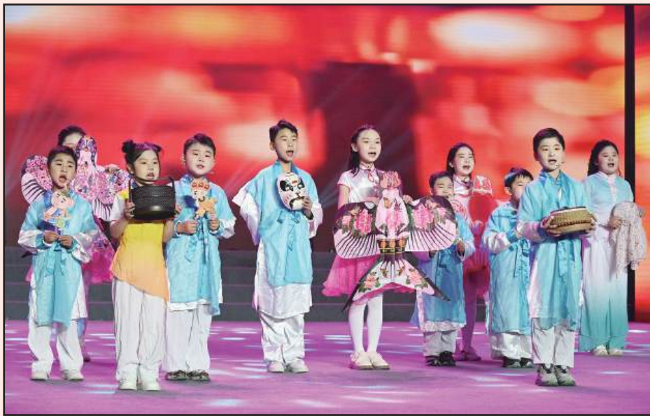
Children perform a poetry recitation at a music hall in Qinyang, Henan Province, yesterday. Various extracurricular activities are available for students across China during the winter vacation.