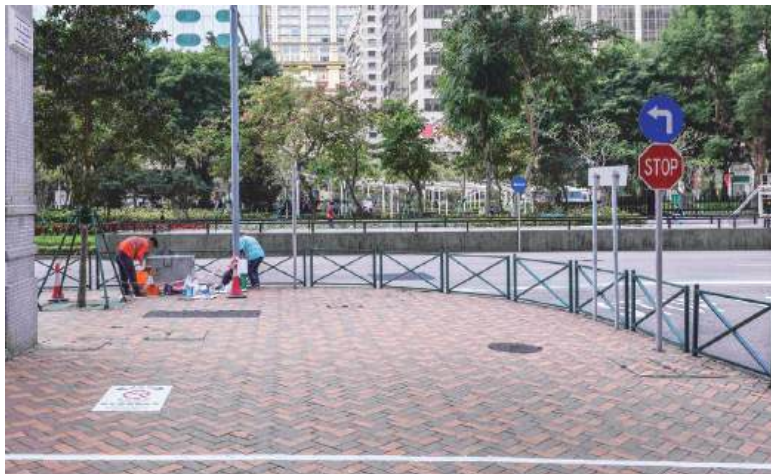
This undated handout photo provided by the Health Bureau (SSM) shows the “Smoke-Free Zone” and the “Designated Smoking Spots” near the public Dr. Carlos d'Assumpção Park (宋玉生公園) being painted on the ground.