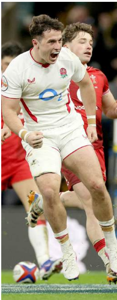
England's wing Henry Arundell celebrates after scoring a try during the Six Nations international rugby union match against Wales at Allianz Stadium, Twickenham, in south-west London, on Saturday.

world in terms of his all-round game. "I back my attacking game all the time so then it's about developing the other sides as well to help the team." 'Smarts and variations' Arundell added: "All wingers want the ball - it would be a bit strange if you didn't as a winger - and there is always a bit of ego with wanting to score tries. "But I've definitely learnt more in the sense of learning and improving different parts of my game, the kick chase and the kick battle and how that can influence the team. "It's the smarts and the variations of the kicking game that make the best teams in the world and that's what we're trying to be." England have now won 12 Tests in a row against all opponents, with coach Steve Borthwick delighted by Arundell's all-round improvement. "We all know Henry is a player who has an incredible ability running with the ball and his ability to find a way to the try-line is excellent," said Borthwick, with England continuing their quest for a first Six Nations title away to Scotland on February 14. "What I have been really impressed is over the last number of months is his attitude to go and improve other aspects of his game." England stand-in captain Jamie George, who led the team against Wales instead of benched regular skipper Maro Itoje, said Arundell's play was reminiscent of a former Red Rose wing. "He really reminds me of Jonny May in so many ways in terms of