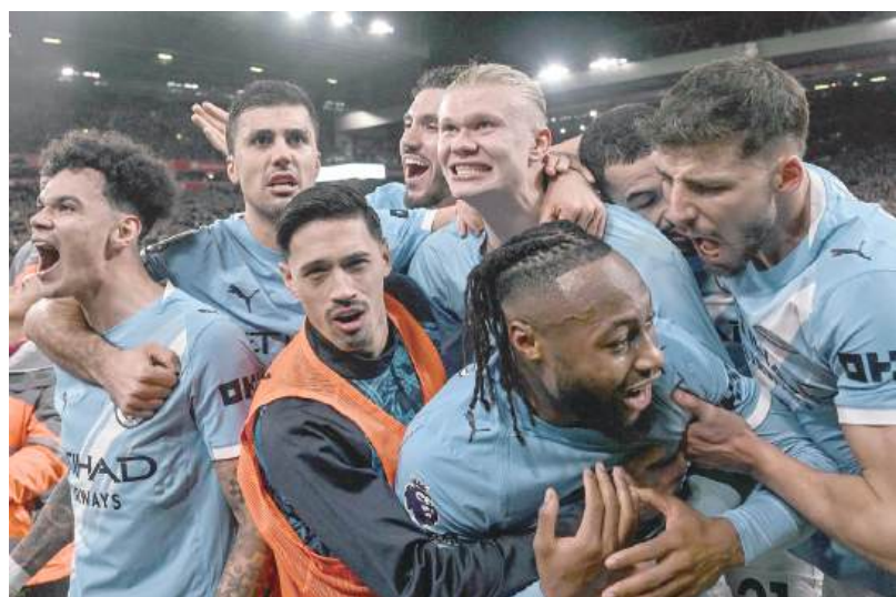
City's Norwegian striker Erling Haaland (centre) celebrates with teammates after scoring his team's second goal during the English Premier League match against Liverpool at Anfield in Liverpool, north west England yesterday.