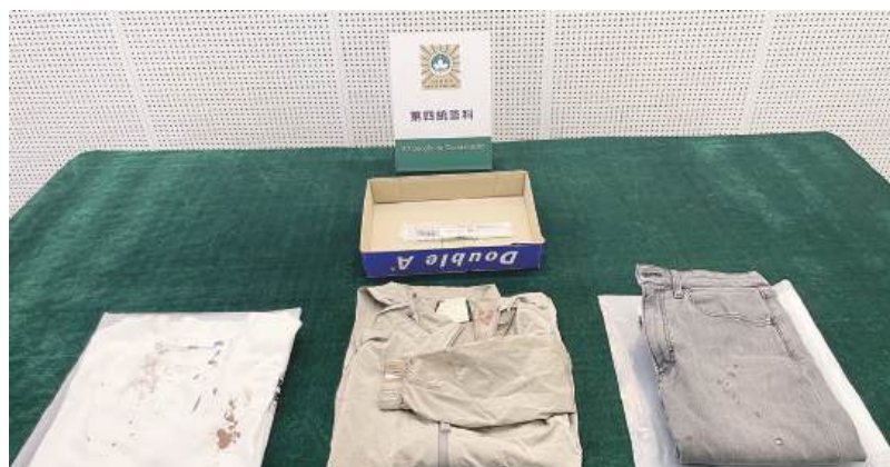
Evidence displayed at the PJ headquarters in Zape on Friday shows a fruit knife and blood-stained clothes related to the first robbery case.

According to Vong, on December 1 last year, a man from the Chinese mainland went to a hotel guestroom in Cotai for a “business meeting”, as scheduled. There, he was threatened with a knife by Li and robbed of HK$100,000 (102,676 patacas) in