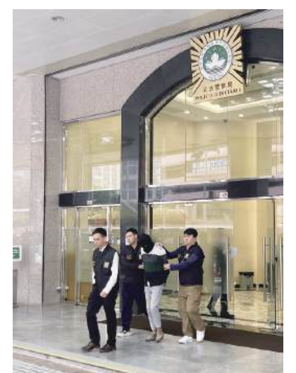
Judiciary Police (PJ) officers escort the hooded fraud and money laundering suspect from the PJ headquarters to a PJ vehicle on Saturday.