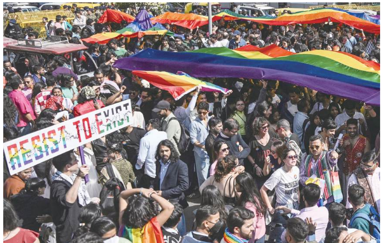
Activists and supporters of the LGBTQ community attend the Delhi Queer Pride parade in New Delhi, India yesterday.

She said in November she only sleeps between two and four hours every night, having raised eyebrows by arranging a 3 a.m. staff meeting.