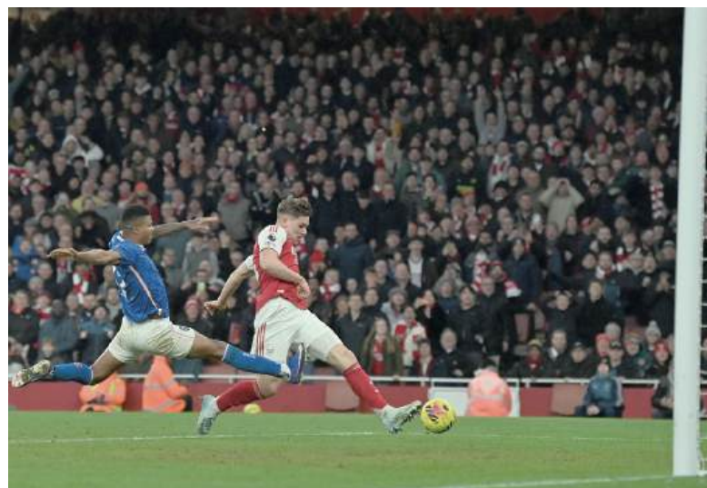
Arsenal's Swedish striker Viktor Gyokeres (right) scores their third goal during the English Premier League against Sunderland at the Emirates Stadium in London on Saturday.