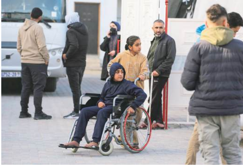
War-wounded Palestinians and other patients prepare to leave the Gaza Strip for treatment through the Rafah border crossing between the Gaza Strip and Egypt after it was opened by Israel for a limited number of people, in Khan Yunis in the southern Gaza Strip, yesterday. Israel partly reopened the Rafah crossing between the southern Gaza Strip and Egypt, the only gateway to the Palestinian territory that does not pass through Israel.

A source at the border on the Egyptian side also confirmed