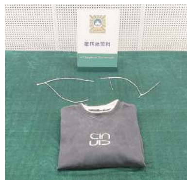
Evidence displayed at the PJ headquarters in Zape on Saturday shows two zip ties and a sweat shirt related to the second robbery case.