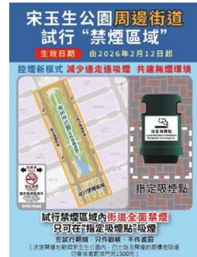
This image provided by the Health Bureau (SSM) on Friday shows the Dr. Carlos d'Assumpção Park’s (宋玉生公園) surrounding streets, pavements and open spaces in Nape where a pilot “smoking-free zone” will begin on Thursday.

The Health Bureau urged smokers to quit for the sake of their own and their families’ health. Those intending to quit smoking can seek a referral to the SSM