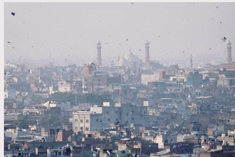
People fly kites during the Basant festival in Lahore yesterday. Brightly coloured kites soared through the skies over Pakistan's eastern city of Lahore this weekend, marking the return of a festival after a 19-year ban that had been imposed over safety concerns. — AFP

"Keep buying them, keep flying them, this helps our business as well," added Ustad. — AFP