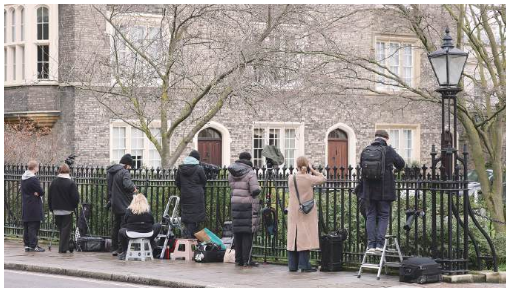
Members of the media gather outside the residence of former UK ambassador to the United States, Peter Mandelson, in central London yesterday. Britain's Foreign Office yesterday said it was reviewing an exit payment to Mandelson who was sacked over his links to convicted US sex offender Jeffrey Epstein.

Trump's decision to pardon him, even as US forces were blowing up alleged drug boats in the Caribbean and tightening the noose on Venezuela's Nicolás Maduro, whom Washington accuses of drug trafficking, drew heavy criticism.