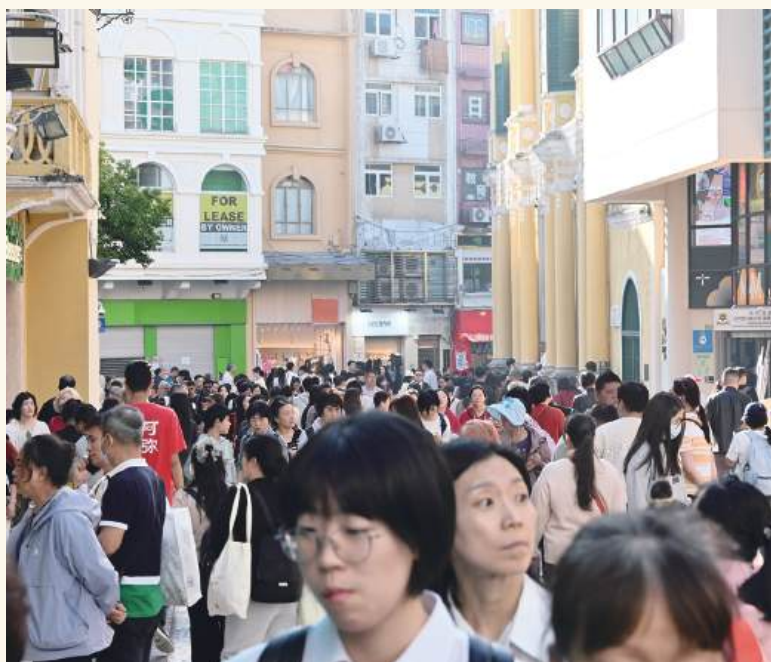
This image show crowds of locals and tourists walking through Largo do São Domingos in the city centre on Thursday.

The statement pointed out that the entry and exit traffic at various checkpoints in Macau are expected to remain high with the approach of the Chinese New Year (CNY) holiday. ■