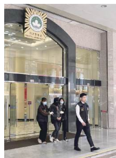
Judiciary Police (PJ) officers escort the hooded money laundering suspect from the PJ headquarters to a PJ vehicle on Friday.