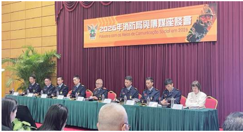
Flanked by other senior officers, Wong Kin, commissioner of Fire Services Bureau (CB), addresses Friday's press conference at the bureau's headquarters next to Sai Van Lake.

Wong pointed out that the main causes of fire alarms were unattended cooking stoves, careless disposal of ignition sources, burning of incense, candles and joss paper,