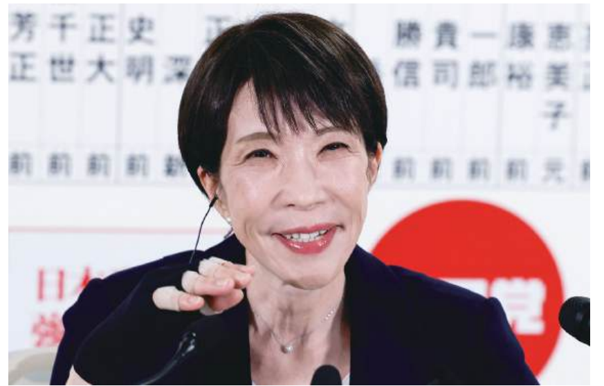
Japan's Prime Minister and President of the Liberal Democratic Party (LDP), Sanae Takaichi, speaks with media on the House of Representatives election day at the LDP headquarters in Tokyo yesterday.

She has also been a regular visitor to the Yasukuni Shrine, which honours convicted war criminals along with 2.5 million war dead and is seen by