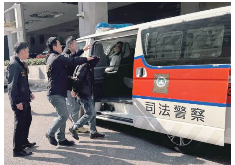
Judiciary Police (PJ) officers escort the hooded fraud suspect to a PJ van outside the PJ headquarters in Zape yesterday.