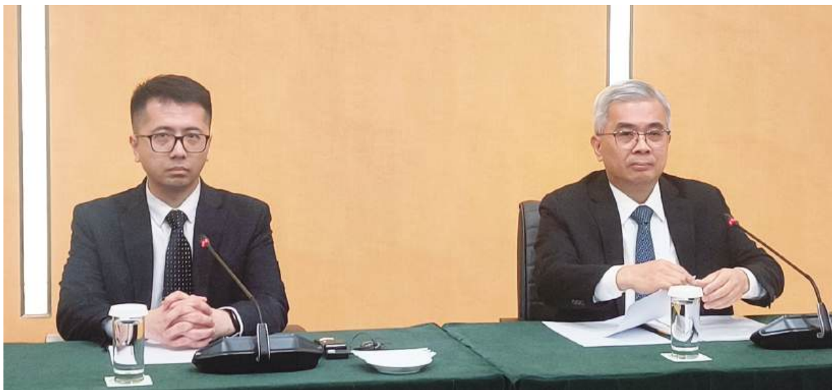
Secretary for Administration and Justice Wong Sio Chak (right) and his chief-of-cabinet Chang Cheong address yesterday's Executive Council press conference at Government Headquarters.

Legislative Assembly (AL) in due course for debate, review and vote. The government proposes that the bill, if passed by lawmakers in its final reading, will take legal effect on the day after its promulgation in the Official Gazette (BO).