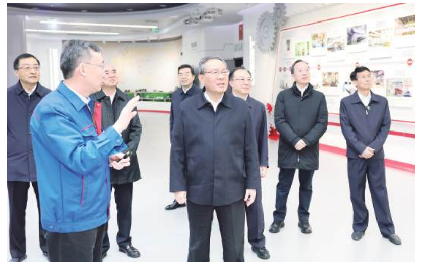
Premier Li Qiang (center), also a member of the Standing Committee of the Political Bureau of the Communist Party of China (CPC) Central Committee, visits the Jier Machine-Tool Group Co. Ltd., in Shandong Province, yesterday. Li paid an inspection visit to Shandong yesterday. — Xinhua

In conjunction with the formulation and implementation of the 15 th Five-Year Plan, they should formulate plans for a series of major initiatives and key projects to achieve greater progress in priority areas, the premier noted. These areas include the development of new quality productive forces tailored to local conditions, the improvement of the domestic economic cycle, and the promotion of the employment and income growth of residents. — Xinhua