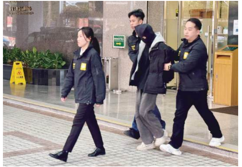
Judiciary Police (PJ) officers escort the hooded drug-trafficking suspect to a PJ van outside the PJ headquarters in Zape yesterday.

The officers found the suitcase unusually heavy after removing all his personal items and realised that the fabric of its side compartments had been unfastened, creating hidden spaces that concealed two bags coated with pungent chilli oil and coffee powder, suspected to mask the drug's scent to deceive sniffer dogs. The officers seized the two bags containing a total of 4.559 kg of a pale powdery substance, which