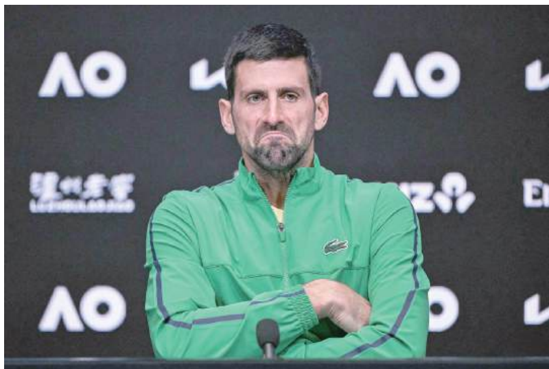
Serbia's Novak Djokovic reacts during a press conference after his defeat against Spain's Carlos Alcaraz in their singles final at the Australian Open tennis tournament in Melbourne on Sunday.

But age and injuries, plus the emergence of world number one Alcaraz and number two Jannik Sinner, have left him unable to win another.