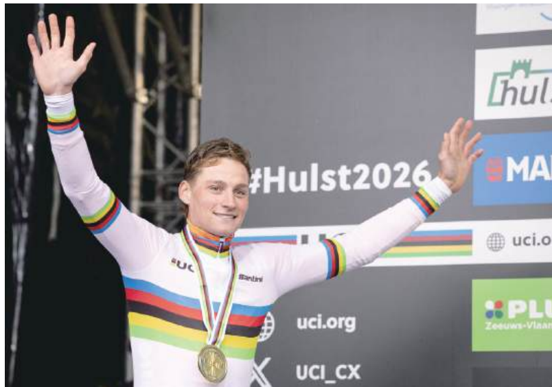
First-placed Netherlands' rider Mathieu van der Poel celebrates on the podium after winning the Cyclocross World Championships in Hulst, Zeeland on Sunday. Dutch cycling giant Van der Poel won a record eighth world cyclo-cross title at Hulst in the Netherlands on Sunday.

There will be two three-day tests in Bahrain later this month before the season begins in Australia on March 8. — AFP