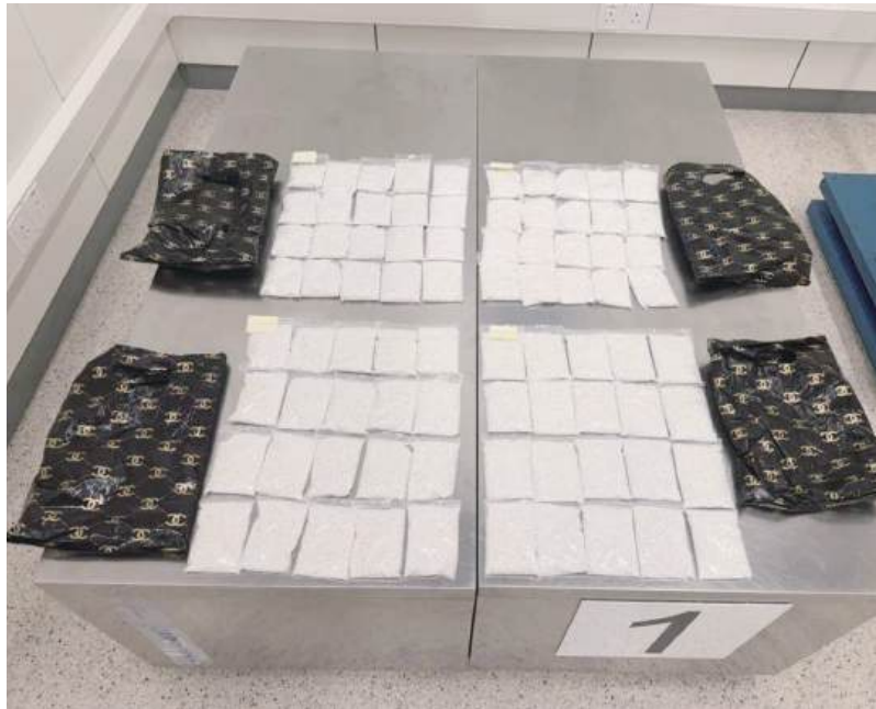
This undated handout photo provided by Macau Customs Service on Sunday shows 40 kilograms of silver granules seized by its officers at the local checkpoint of the Hong Kong-Zhuhai-Macao Bridge on Thursday.

purity, irregularly shaped grains of metallic silver; valued for their high reactivity due to their significant surface area, making them ideal for chemical processing, melting, and jewellery casting. - DeepSeek