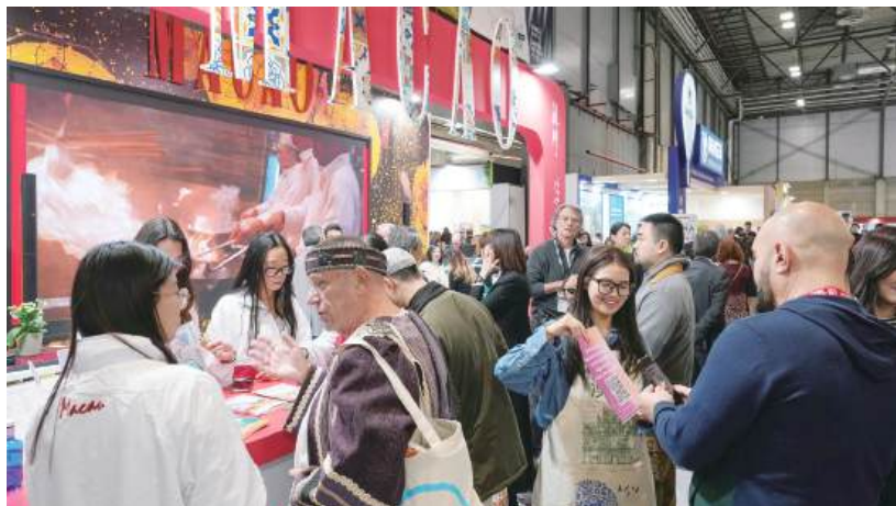
Fairgoers explore the offerings at the Macao Pavilion during Fitur in the Spanish capital Madrid during its international tourism fair, which was held from January 21 through 25.

** Portuguese Association and Travel and Tourism Agencies