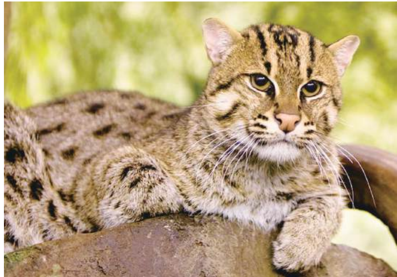
This photo of a Fishing Cat was lifted from Wikipedia, taken by Kelinahandbasket in Cincinnati Zoo on June 25, 2008.

The sighting was confirmed after the fishing cat was photographed 46 times by camera traps in mid-2025, the press release added. — Xinhua