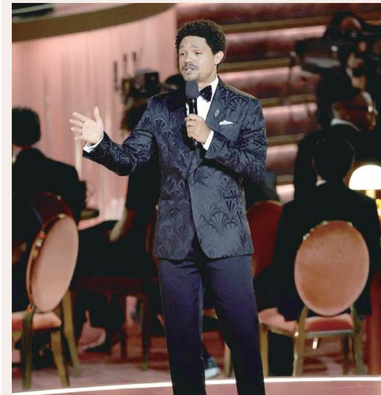
South African comedian Trevor Noah hosts the 68 th GRAMMY Awards at Crypto.com Arena on Sunday in Los Angeles, California.

Tibetan Buddhists believe he is the 14 th reincarnation of a spiritual leader first born in 1391.