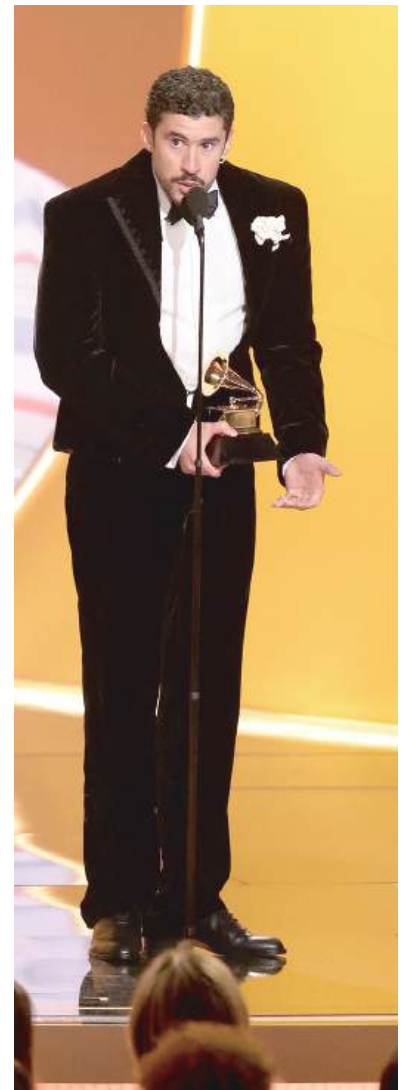
Bad Bunny accepts the Album of the Year award for "Debi Tirar Más Fotos" ("I Should Have Taken More Photos") onstage during the 68 th GRAMMY Awards at the Crypto.com Arena on Sunday in Los Angeles, California.

The majority of the 95 awards were handed out at a pre-gala