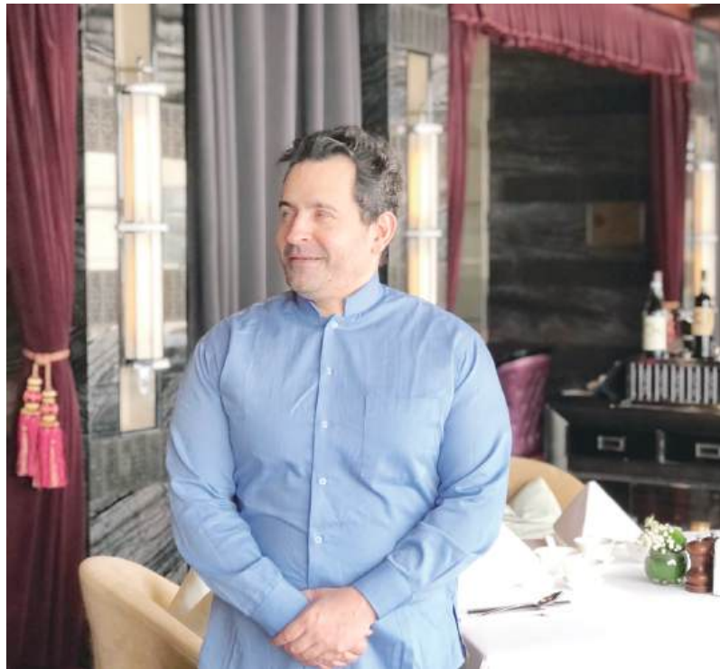
Timor-Leste’s Ambassador to China, Loro Horta, poses during his interview with The Bay in Macao last Wednesday.

“I applaud the prime minister’s resolve to compensate and relocate families that were living near the airport so that the aviation facilities could be modernised,” Horta said, describing it as an unenviable and politically unpopular task. “But even after the runway was extended, aeroplanes still can’t land at night,”