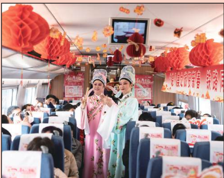
A local opera performance is staged aboard a high-speed train in Anhui Province yesterday. China ushered in its largest annual population migration yesterday, 15 days ahead of the 2026 Spring Festival, also known as the Chinese New Year (CNY).