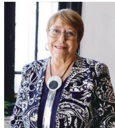
Chile's former president (2006-2010 and 2014-2018) Michelle Bachelet poses during an interview with AFP in Santiago de Chile on December 22, 2025.

Bachelet told AFP "the world is ready" for a woman to take over and make "a different contribution through a different kind of leadership."