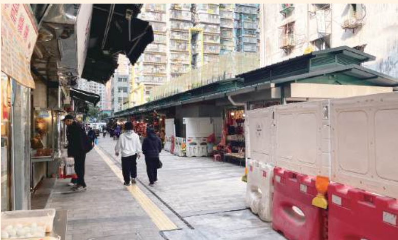
Pedestrians walk past vendor stalls, which are in the final phase of an optimisation project by the Municipal Affairs Bureau (IAM), in Iao Hon district yesterday.

*Joss paper is a type of paper used in Chinese and other Asian cultures, typically burned as an offering to deities or deceased ancestors in various rituals. Joss paper is often made to resemble money or other valuable items and is used in religious practices to symbolise respect and remembrance. — Poe