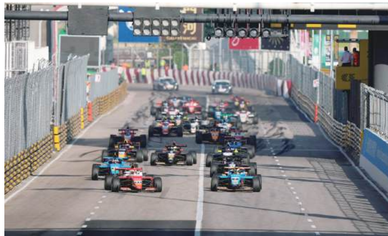
This handout image downloaded from the official Macau Grand Prix (MGP) website yesterday shows Formula 4 cars in action during the 72 nd MGP, one of Macau’s large-scale annual events, on November 17 last year.