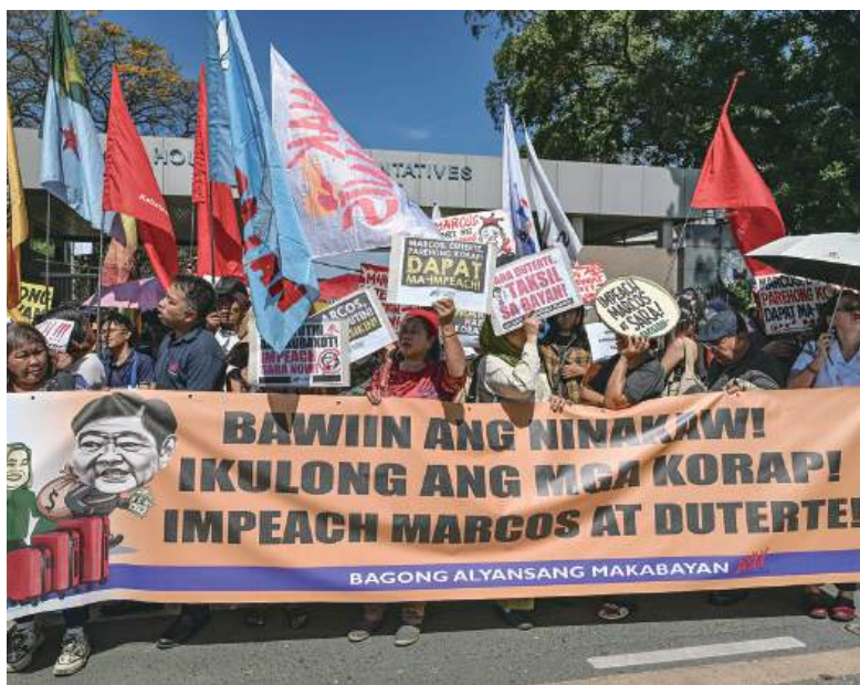
People holding placards protest to call for the impeachment of Philippine Vice President Sara Duterte outside the House of Representatives in Quezon City, Metro Manila yesterday.

Duterte was successfully impeached by the House last year on similar charges brought by a