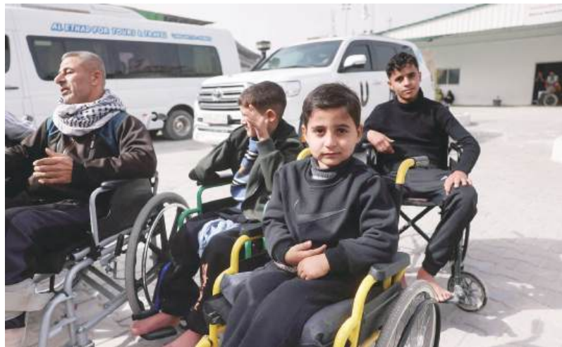
Young Palestinian patients sitting in wheelchairs wait in the grounds of the Red Crescent Hospital to be evacuated from the Gaza Strip via the Rafah border crossing with Egypt for treatment abroad, in Khan Yunis, in the southern Gaza Strip, yesterday.