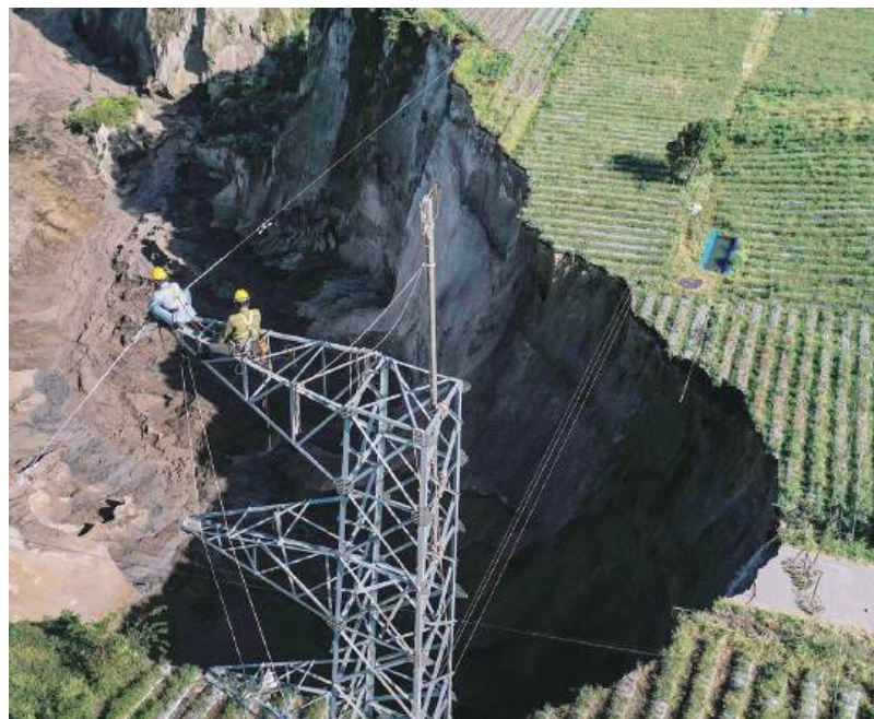
An aerial view shows workers from Indonesia's state electricity company PLN shutting down operations at a high-voltage transmission tower near a ground collapse owing to landsliding at the Pondok Balik village in Ketol district, Aceh province on Sunday. — AFP

Indonesia is prone to floods and landslides during the rainy season, which typically runs from October to March. — Xinhua