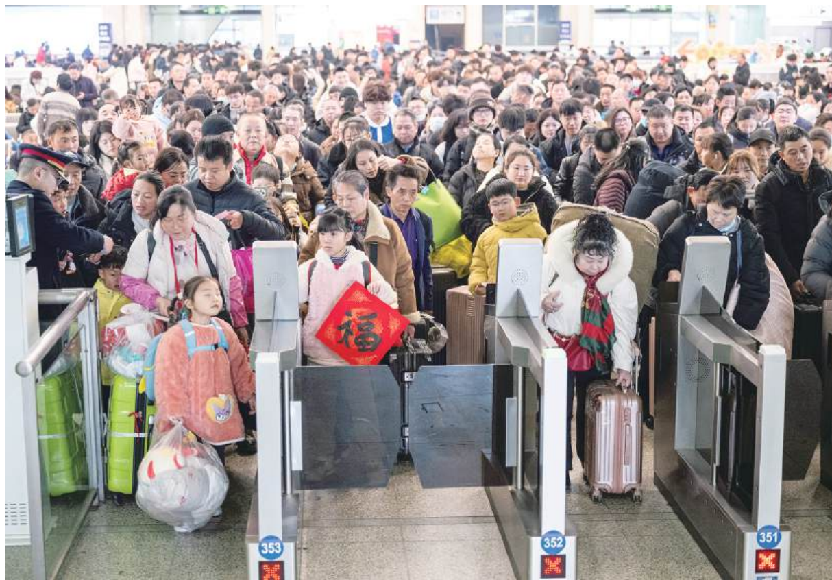
Passengers queue to pass through electronic ticket gates at Hankou Railway Station in Wuhan, capital of Hubei Province, yesterday. China ushered in its largest annual population migration yesterday, 15 days ahead of the 2026 Spring Festival, also known as the Chinese New Year (CNY). A total of 9.5 billion passenger trips are expected during this year's travel rush period that will end on March 13, which would be a historic high.

purity, irregularly shaped grains of metallic silver; valued for their high reactivity due to their significant surface area, making them ideal for chemical processing, melting, and jewellery casting. - DeepSeek