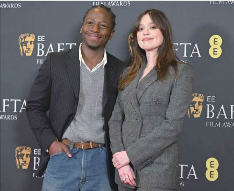
British actor David Jonsson (left), 32, and actress Aimee Lou Wood, 31, pose for a picture at the announcement of the British Academy Film Awards (BAFTA) nominations in central London on Tuesday. In 2025, Jonsson won the BAFTA Rising Star Award and was nominated at the British Independent Film Awards in the Best Lead Performance category for his role in the film “Wasteman”. Wood was nominated for the BAFTA Rising Star Award in 2023.