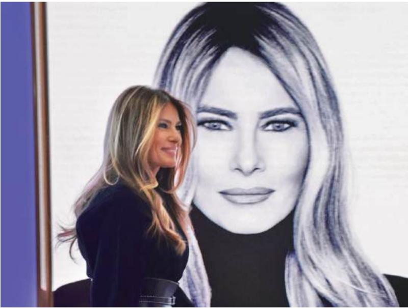
US first lady Melania Trump appears at the New York Stock Exchange (NYSE) where she rang the opening bell on Wednesday in New York City. She made the appearance as part of her publicity tour for the film, “Melania,” which documents her life in the 20 days leading up to President Donald Trump’s second inauguration.