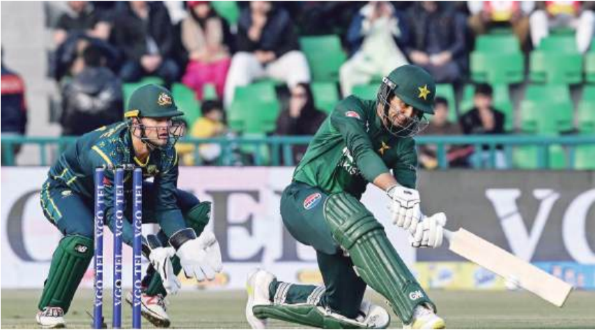
Pakistan’s Saim Ayub (right) plays a shot as Australia’s wicketkeeper Josh Philippe watches during the first Twenty20 international cricket match against Australia at the Gaddafi Stadium in Lahore, Pakistan yesterday.

the first 10 overs as the ball stopped coming onto the bat, but I think we were outstanding with the ball.”