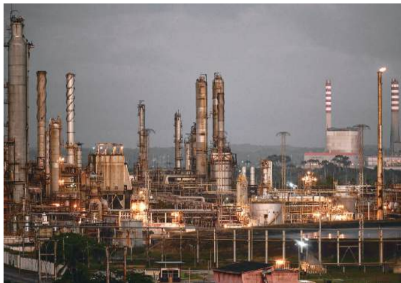
This photo taken last Friday shows Venezuela’s huge refinery El Palito in Puerto Cabello, Carabobo state.