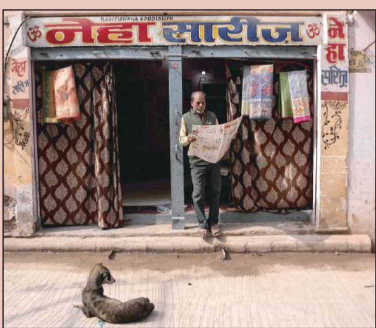
A saree vendor reads a newspaper, while a dog is basking in the sun, outside his shop in Varanasi, India yesterday.

TOKYO – White foam was seen overflowing from a manhole near a US base in Japan's Okinawa Prefecture yesterday, prompting local authorities to investigate a possible link to per- and polyfluoroalkyl substances (PFAS) contamination. A police officer on routine patrol discovered the foam leaked from the sewer linked to the US Marine Corps Air Station Futenma around noon in the city of Ginowan. The city government is investigating the cause of the incident and has collected foam samples to analyze whether it contains PFAS and other potentially harmful substances. The latest overflow echoes earlier incidents reported in 2020, when extinguishant containing potentially harmful PFAS chemicals leaked from the Futenma base, causing white foam to spread through surrounding residential areas, Kyodo News reported. The report said the US military denied any involvement in the case, saying it had no confirmation that foam fire extinguishers or similar equipment were used. PFAS encompasses over 10,000 synthetic chemicals, which were once used for water-repellent finishing and foam-extinguishing agents. A Japanese government survey in 2023 has found concentrations of PFAS chemicals in rivers and groundwater exceeded the country's provisional standard at 242 locations nationwide, raising concern about possible health risks such as cancer. — Xinhua