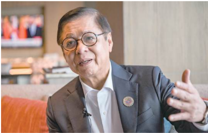
Thailand's Foreign Minister Sihasak Phuangketkeow talks during an interview with AFP on the sideline of the Association of Southeast Asian Nations (ASEAN) Foreign Ministers' Meeting Retreat in Cebu yesterday.