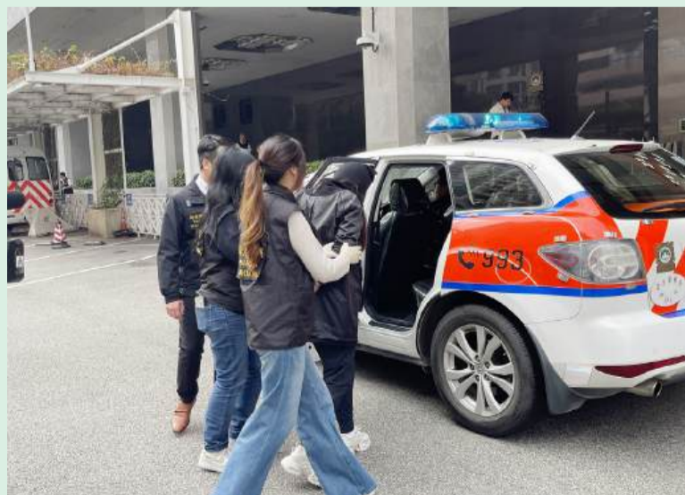
Judiciary Police (PJ) officers escort the hooded fraud suspect from the PJ headquarters to a PJ vehicle yesterday.