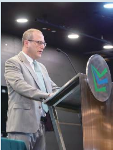
Israeli Consul-General of Israel Amir Lati addresses Tuesday's Holocaust Memorial Day held in Hong Kong.

Consulate General of Israel in Hong Kong info@hongkong.mfa.gov.il