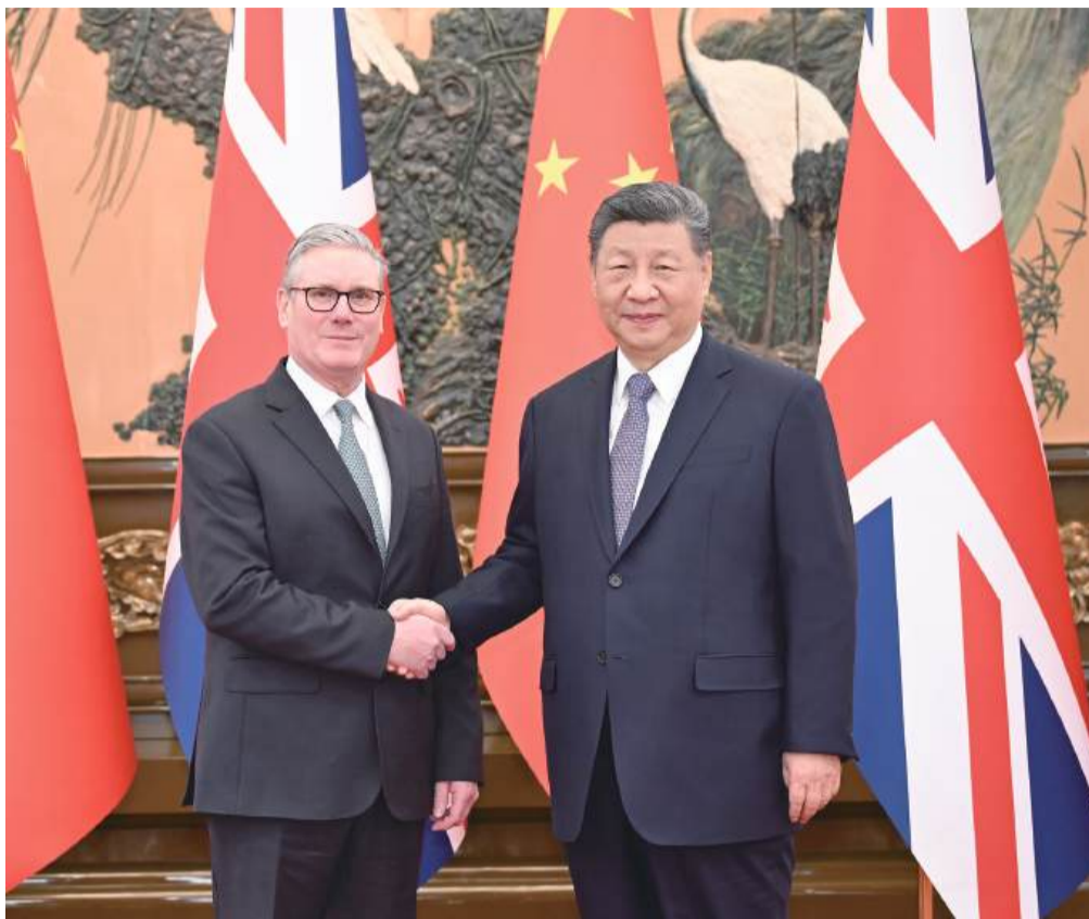
President Xi Jinping shakes hands with British Prime Minister Keir Starmer, who is on an official visit to China, at the Great Hall of the People in Beijing yesterday.

He said members of the British government, parliament and various sectors of localities are welcome to visit China more frequently to foster a balanced, objective, and well-grounded perception of China.