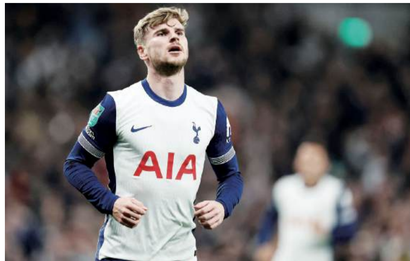
Tottenham Hotspur's German striker Timo Werner celebrates scoring the team's first goal during the English League Cup round of 16 against Manchester City at the Tottenham Hotspur Stadium in London, on October 30, 2024.