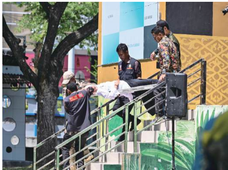
A medical team and Sharia police members carry a woman who fainted after being publicly caned by a member of the Sharia police in Banda Aceh, Indonesia yesterday.

The couple was among six people flogged for breaking the