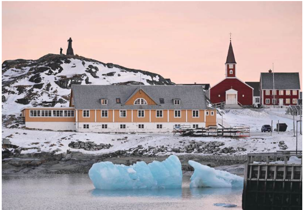
An ice block floats in the water in the city of Nuuk, western Greenland, yesterday.