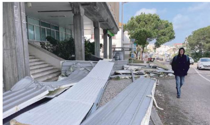
A man walks past debris in a street of Leiria, central Portugal yesterday, after Storm Kristin hit Portugal.