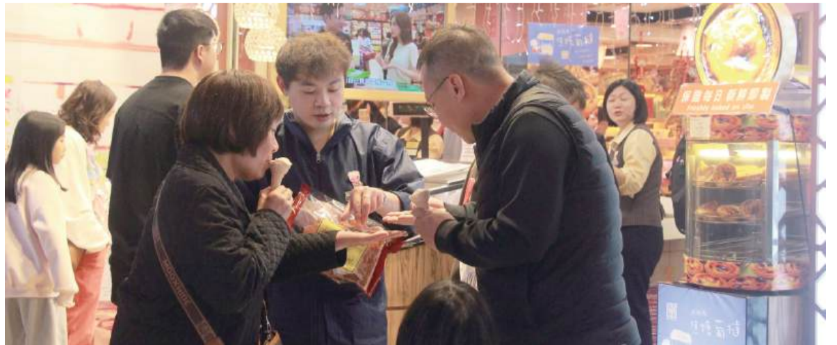
Tourists try free samples outside a cake shop on Rua de S. Paulo close to the UNESCO World Heritage-listed Ruins of St. Paul's and Na Tcha Temple yesterday.