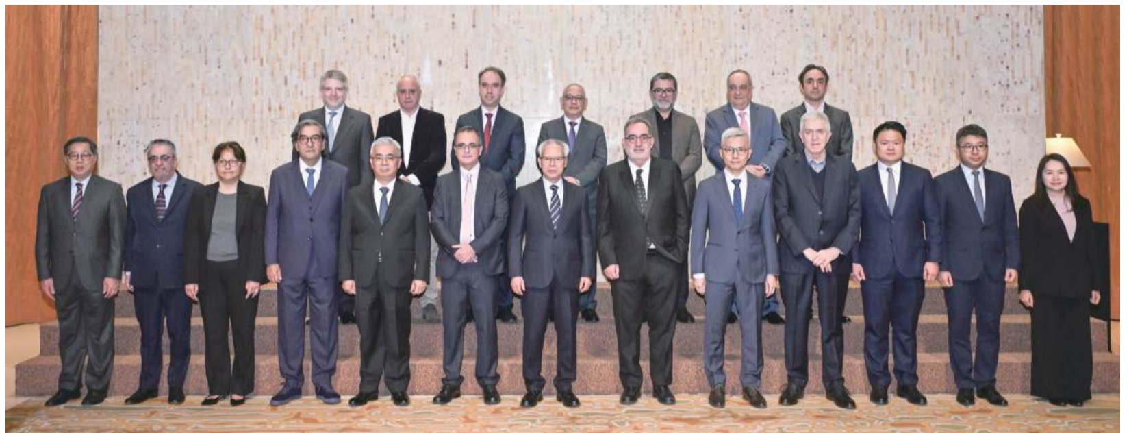
Chief Executive Sam Hou Fai (centre, front) poses with principal and senior government officials and representatives of Macau-based Portuguese- and English-language media enterprises during an official lunch reception at MGM MACAU yesterday.

President Xi Jinping and the central authorities fully acknowledged the MSAR Government’s work performance during the past year, highly praised our aggression,