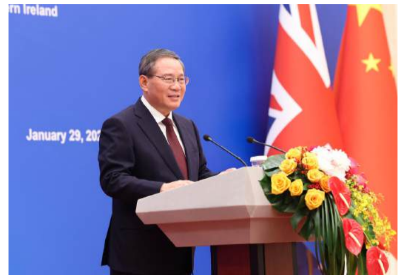
Premier Li Qiang delivers a speech at the closing ceremony of the 2026 UK-China Business Council meeting at the Great Hall of the People in Beijing, yesterday. Li attended the event with British Prime Minister Keir Starmer. Both addressed the meeting.

Noting that the enterprises of the two countries have great