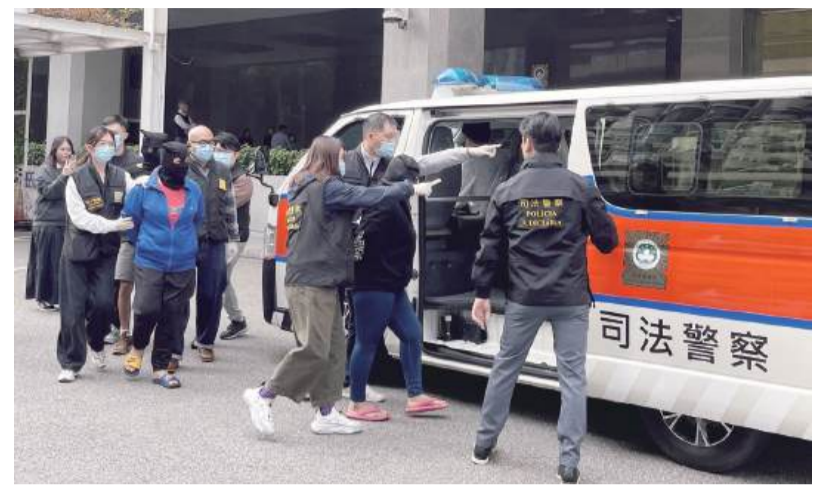
Judiciary Police (PJ) officers escort the three hooded drug suspects to a PJ van outside the PJ headquarters in Zape yesterday.