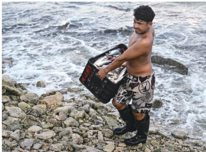
A fisherman carries a box loaded with fish at El Palito beach, in Puerto Cabello, Venezuela’s Carabobo state, last Friday.

“It’s going to give us a big boost because, with jobs available,