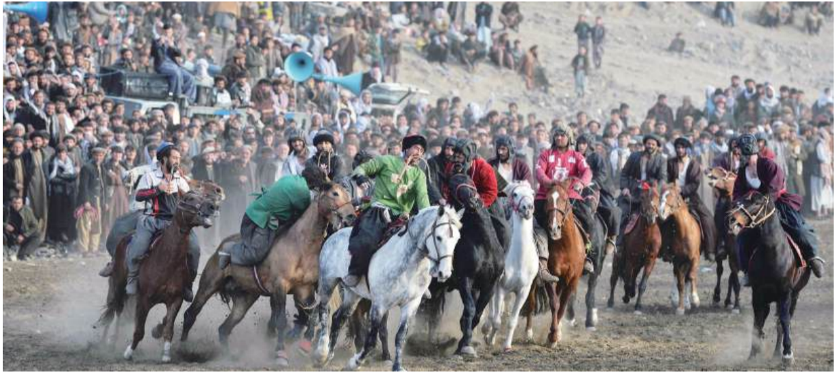
Afghan horsemen compete during 'Buzkashi', a traditional Central Asian sport in the Jurm district of Badakhshan province yesterday.

COLOMBO-Sri Lanka recorded nine cases of child marriage and 79 teenage pregnancies in 2025, the National Child Protection Authority (NCPA) said yesterday. The NCPA said a total of 10,455 complaints related to children were lodged during 2025. Out of these, 545 involved sexual harassment and 231 involved grave sexual abuse. The NCPA also received information on 38 cases of rape, 150 cases of cyber abuse targeting children and 20 attempted child suicides. Three abortions involving teenagers were also recorded. In addition, the agency received 42 complaints concerning children without birth certificates and nine cases of children under the age of five being left behind when their parents migrated overseas. The NCPA said the figures highlight continuing vulnerabilities faced by children and stressed the need for stronger preventive measures, public awareness and coordinated intervention to ensure child protection nationwide. — Xinhua