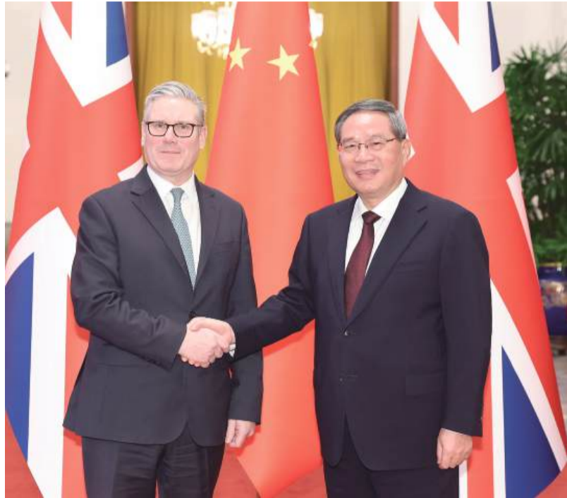
Premier Li Qiang shakes hands with British Prime Minister Keir Starmer, who is on an official visit to China, at the Great Hall of the People in Beijing yesterday.

BEIJING – China and Britain should better leverage their complementary advantages to expand and improve bilateral trade, Premier Li Qiang said when holding talks with visiting British Prime Minister Keir Starmer in Beijing yesterday.