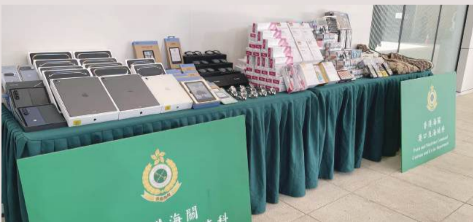
Contraband seized from a Macau-bound vessel in Hong Kong last week, worth more than HK$56 million, is shown to the media in Hong Kong yesterday.

HONG KONG — Customs officers announced yesterday that they seized smuggled goods worth more than HK$56 million last week on a Macau-bound vessel at Black Point near Tuen Mun.