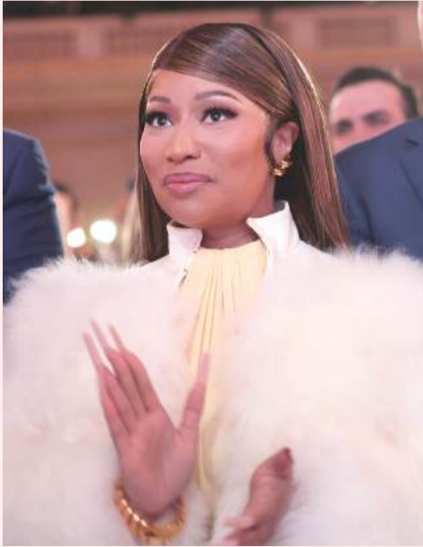
Trinidadian-American rapper Nicki Minaj attends the Treasury Department’s Trump Accounts Summit at Andrew W. Mellon Auditorium on Wednesday in Washington, DC. “Trump Accounts” are a portion of recently passed tax and spending legislation where the federal government will deposit US$1,000 into investment accounts for every child born between 2025 and 2028 once parents sign their children up while filing their income taxes.