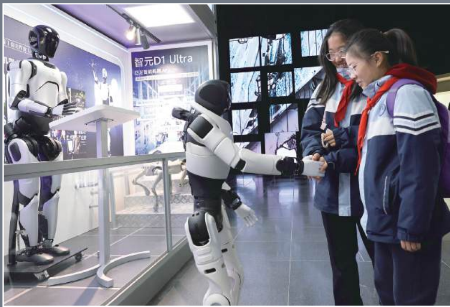
Visitors shake hands with a robot at the Shanghai Science & Technology Museum in Shanghai yesterday. The museum launched its operational stress test yesterday after more than two years of systematic upgrading, with some visitors and the media being invited to visit. It will commence its trial opening to the public during the Spring Festival, aka Chinese New Year (CNY), which begins on February 17.