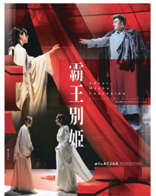
This poster provided by the Cultural Affairs Bureau (IC) yesterday promotes the upcoming immersive drama “Farewell My Concubine” slated to hit the stage from tomorrow through Sunday.