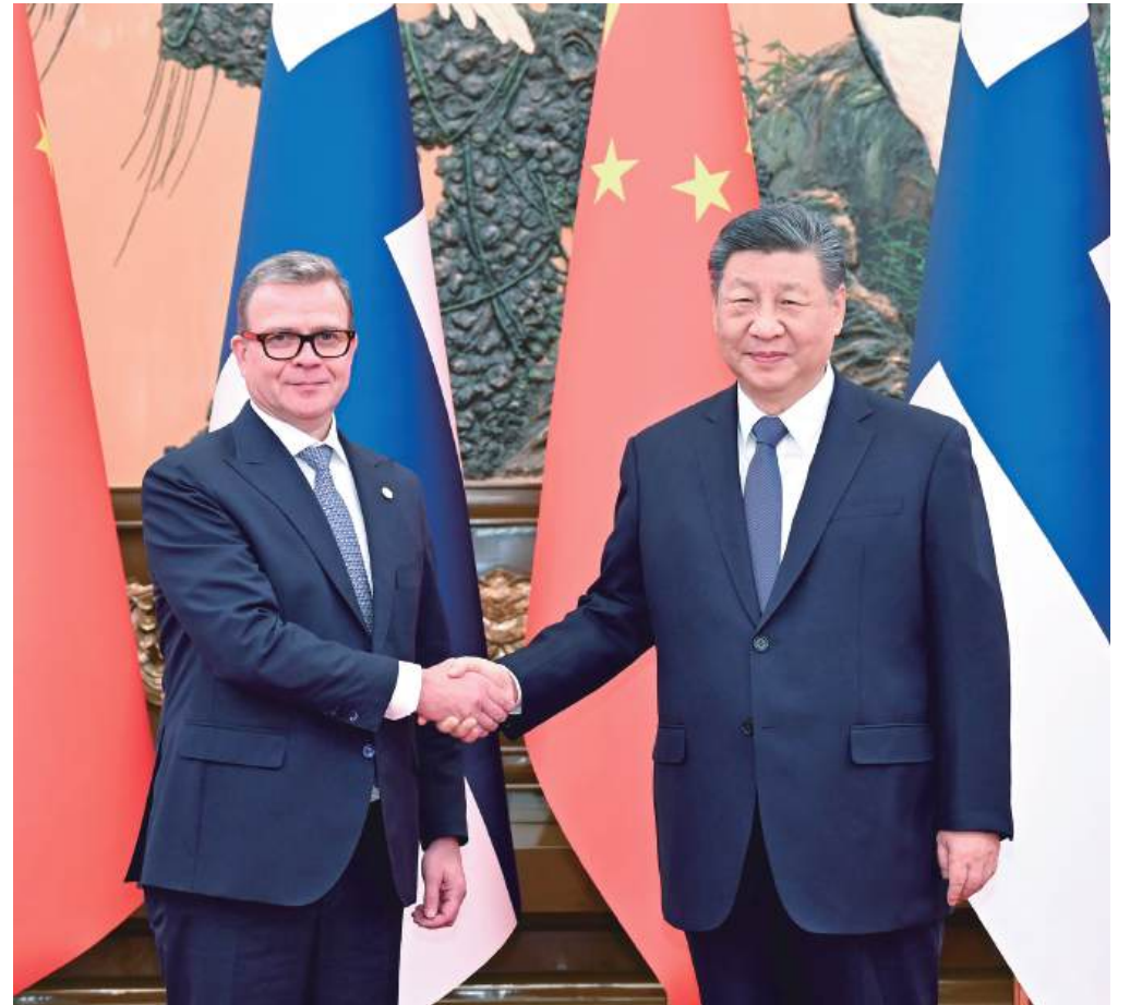
President Xi Jinping (right) shakes hands with Finnish Prime Minister Petteri Orpo, who is on an official visit to China, at the Great Hall of the People in Beijing yesterday.

Noting that the constructive development of Europe-China relations is of great significance, Orpo said Finland advocates Europe's strategic autonomy, supports free trade, and stands ready to play a positive role in helping properly resolve trade frictions between Europe and China and promote the healthy development of their ties. – Xinhua