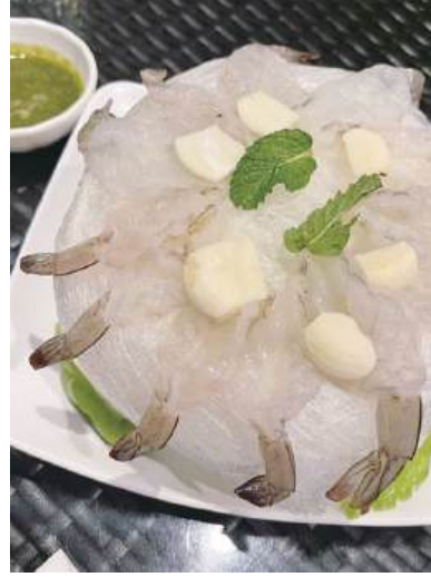
This undated and unlocated file photo downloaded from the mainland's online and on-demand delivery platform Dianping yesterday shows raw marinated shrimp.

This undated handout photo provided by the Municipal Affairs Bureau (IAM) yesterday shows the US brand "Arrowroot Biscuits" infant teething wafers produced by Gerber, which has been found to contain excessive levels of Vibrio parahaemolyticus .