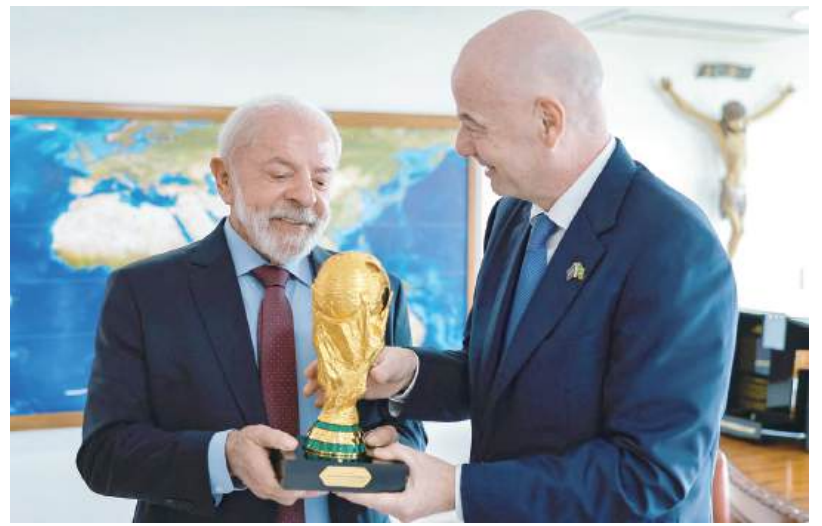
This handout picture released by the Brazilian Presidency shows Brazil’s President Luiz Inácio Lula da Silva (left) receiving a replica of the World Cup trophy from FIFA President Gianni Infantino during a meeting at the Planalto Palace in Brasília on Monday.