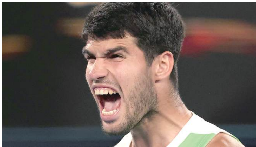
Spain's Carlos Alcaraz celebrates victory over Australia's Alex De Minaur after their men's singles quarter-final match on day ten of the Australian Open tennis tournament in Melbourne yesterday.

In a topsy-turvy opening set, the six-time