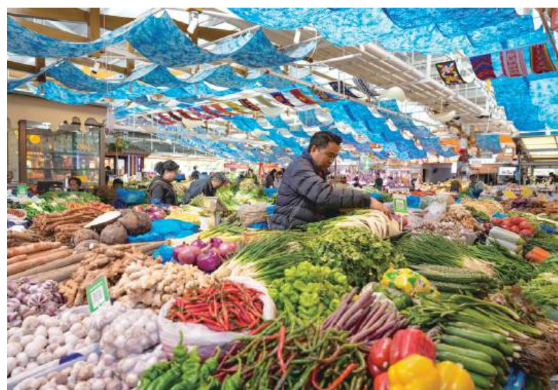
A vendor arranges vegetables at the Daguan Zhuanxin farmers' market in Kunming, capital of Yunnan Province, yesterday. While preserving the original function of a farmers' market, Daguan Zhuanxin has now been upgraded to a complex of cultural experience, dining and entertainment, which offers tourists a window to experience local flavor and vibe.