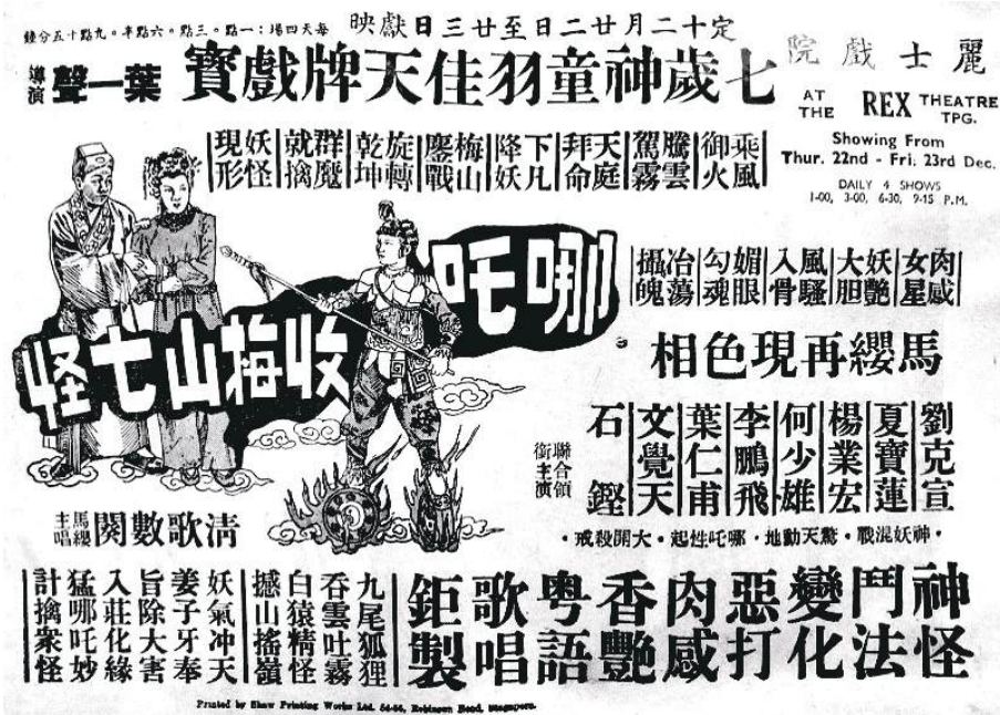
Nazha Conquered the Seven Devils at Mei Hill 哪咤梅山收七怪 (1949)