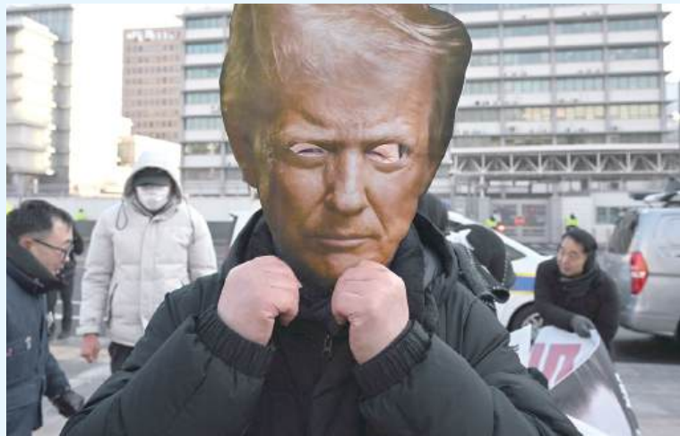
A protester wears a mask of US President Donald Trump during a rally condemning Trump's plans to raise tariffs on South Korea in front of the US embassy in Seoul yesterday.