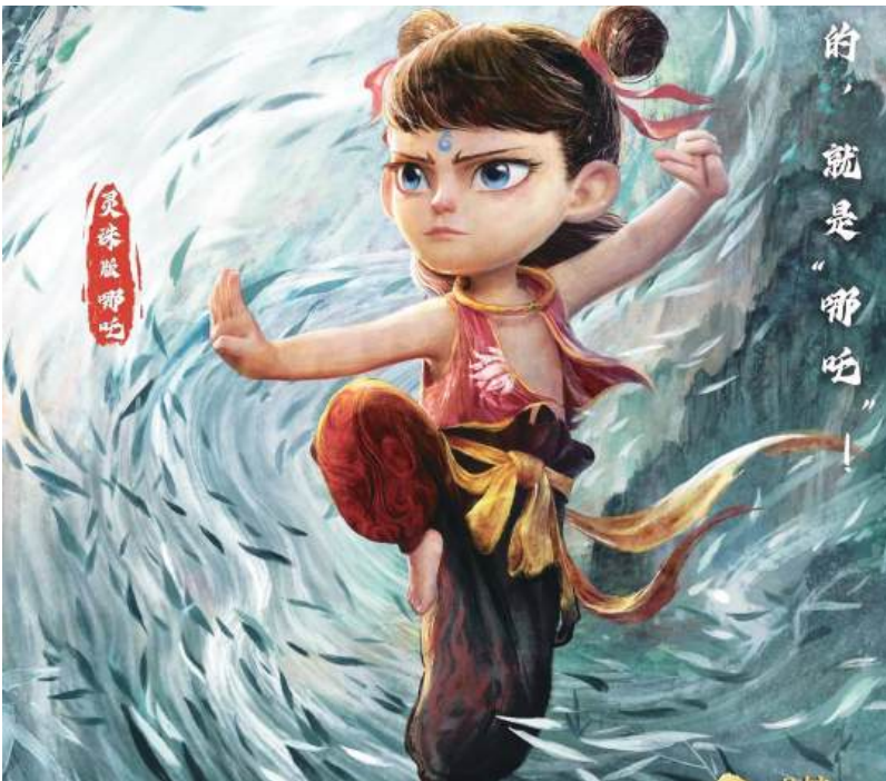
Ne Zha 2 (2025)