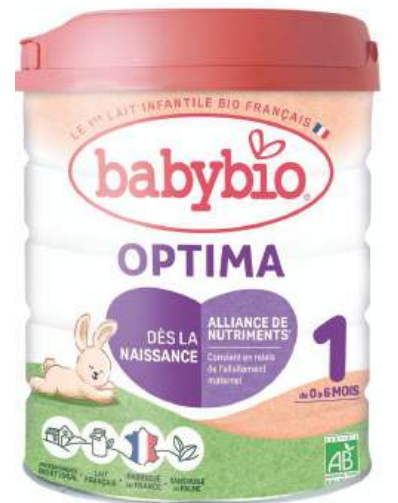
This image shows the BABYBIO OPTIMA 1 400G product, one of the affected batches of infant formula containing the Bacillus cereus .

A raft of infant formula products has been recalled by their respective manufacturers around the world recently for containing the Bacillus cereus , including products from France, Switzerland, and Germany. ■