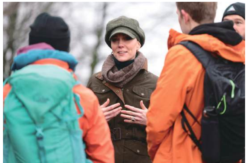
Britain's Catherine, Princess of Wales, reacts during a guided walk in the Peak District with members of the Mind Over Mountains charity, near Curbar, northern England yesterday.

"It's more complicated than that," she told broadcaster France 2. "We first need to make sure that the ban is properly enforced in middle schools." – AFP