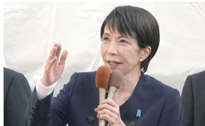
Japan's Prime Minister and President of the Liberal Democratic Party Sanae Takaichi delivers her first campaign speech for the House of Representatives election in Tokyo yesterday.

Voters are raising questions over a recent tax-cut pledge to counter inflation and how it would be financed, while many are also frustrated by the snap election, which has slowed parliamentary debate on the 2026-2027 budget.