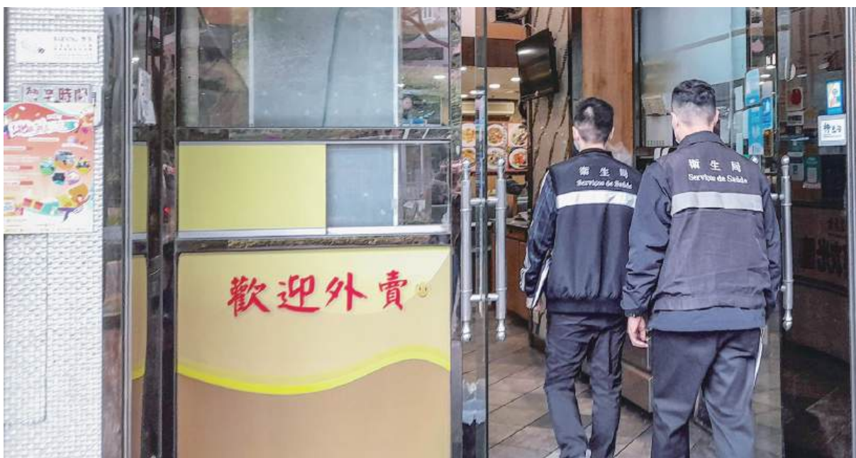
This undated handout photo released by the Health Bureau (SSM) yesterday shows its anti-smoking and anti-alcohol staff entering a restaurant for inspection.

In addition to the 5,008 cases of illegal smoking, the Health Bureau, in conjunction with inspectors from other relevant public entities, fined 316 travellers for bringing e-cigarettes into or taking them out of Macau last year, while 134 offenders were fined for violating various other regulations outlined in the Tobacco Prevention and Control Law.