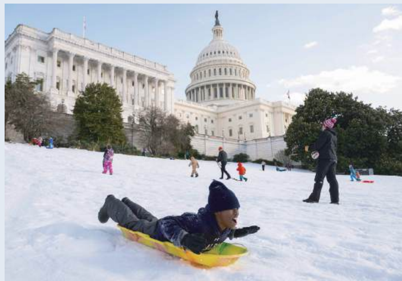
People go sledding near the Washington Monument on the National Mall in Washington, DC, yesterday.

"That makes it even more challenging," he said. – AFP