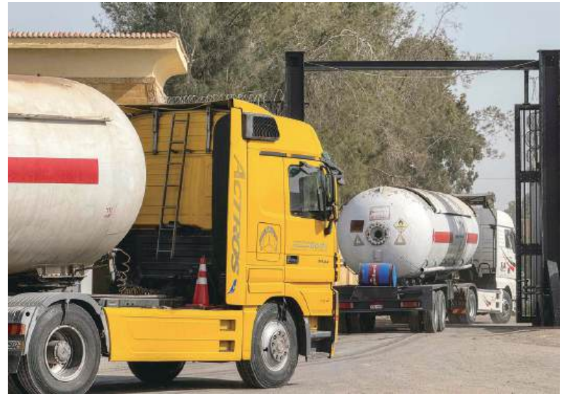
Fuel trucks enter through the Egyptian side of the Rafah border crossing with the Gaza Strip in northeastern Egypt yesterday, as the vital crossing to the Palestinian territory reopens.

Israel's retaliatory offensive has killed at least 71,662 Palestinians, according to figures from the