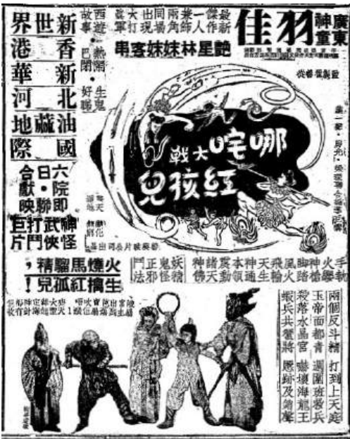
The Battle Between Ne Zha and the Scarlet Boy 哪咤大戰紅孩兒 (1950)