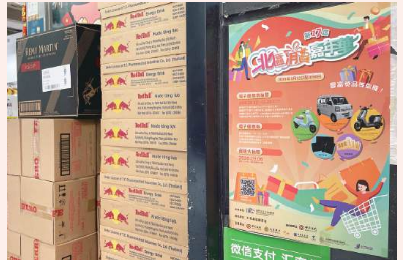
This photo, taken yesterday, shows a poster promoting the Northern District Consumer Carnival displayed on the façade of a market in the district.

An eyewear store owner surnamed Lei, complained that the