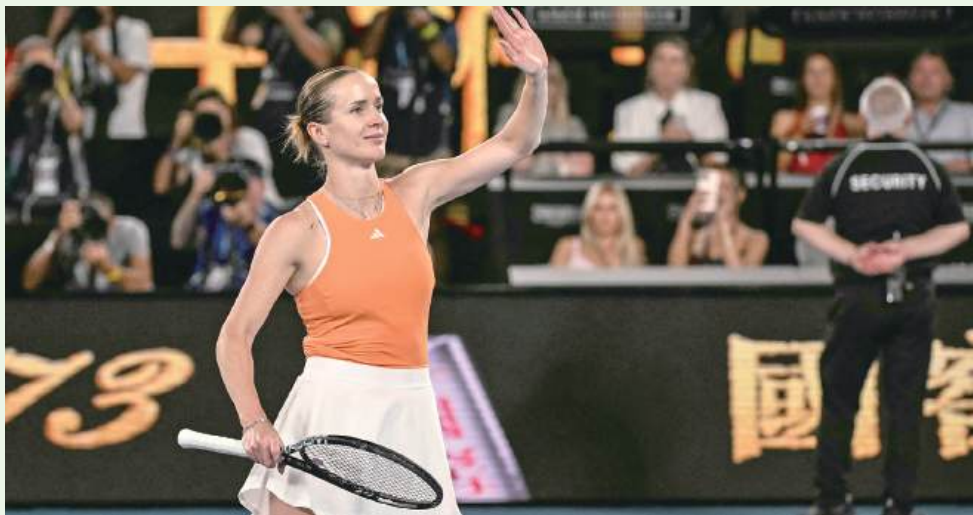
Ukraine's Elina Svitolina celebrates after winning against USA's Coco Gauff during their women's singles quarter-final match on day ten of the Australian Open tennis tournament in Melbourne yesterday. — AFP

It is the first time Svitolina has reached the last four in Melbourne after quarter-final runs in 2018, 2019 and 2025. — AFP