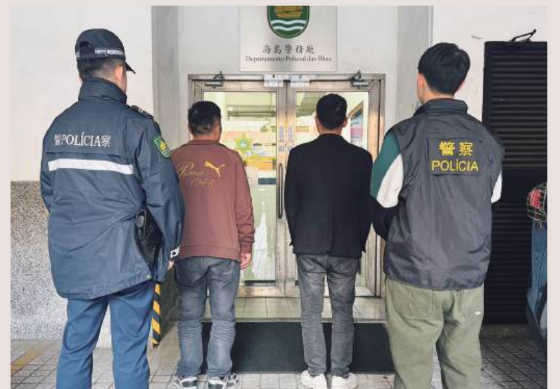
This undated handout photo provided by the Public Security Police (PSP) yesterday shows PSP officers escorting the two theft suspects into a police station.

Through their citywide CCTV surveillance footage, the police identified the Chens as the suspects and apprehended them on Saturday in Rua da Felicidade (福隆新街), seizing various currencies totalling 12,000 patacas, along with a