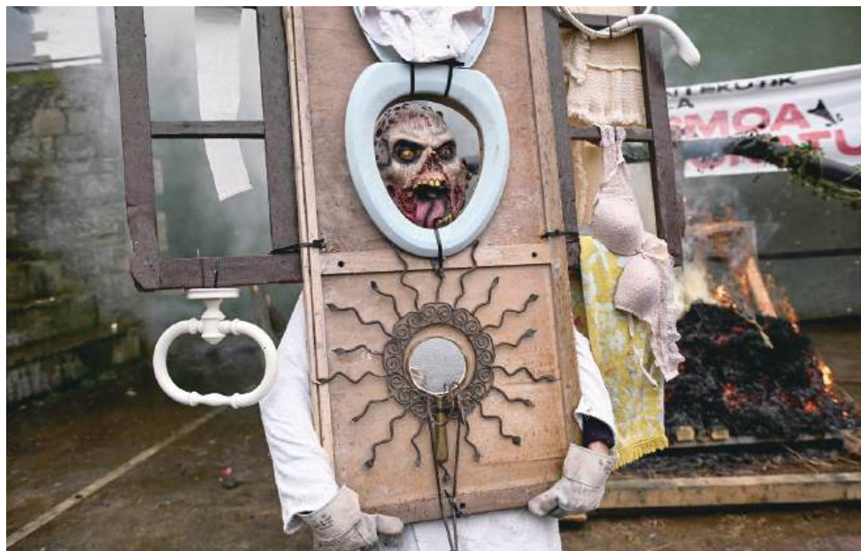
A masked reveller takes part in the traditional carnival of Ituren, a village in the northern Spanish province of Navarre, on Monday. Locals from the neighbouring villages of Ituren and Zubietta dress up and participate in a pilgrimage through both villages in this annual three-day festival, revolving mainly around agriculture and sheep herding.