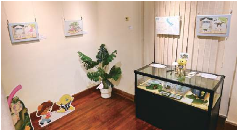
Photo taken of the “The Mysterious Visitor” exhibition yesterday

10 Fantasia gallery, located on 10 Calçada da Igreja de S. Lázaro (瘋堂斜巷10號), is open from 11 a.m. to 6 p.m. from Tuesday through Sunday. It is closed on Mondays. ■