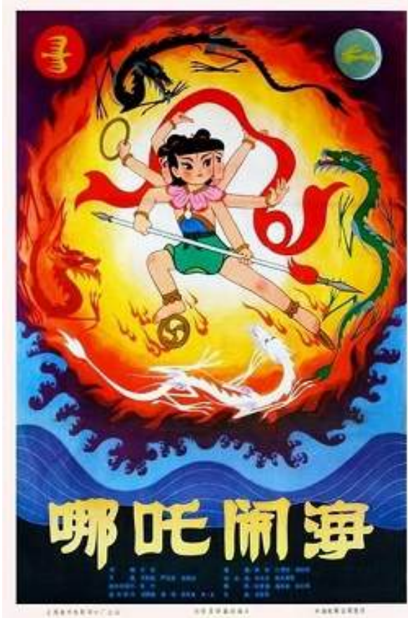
Nezha Conquers the Dragon King 哪咤鬧海 (1979)