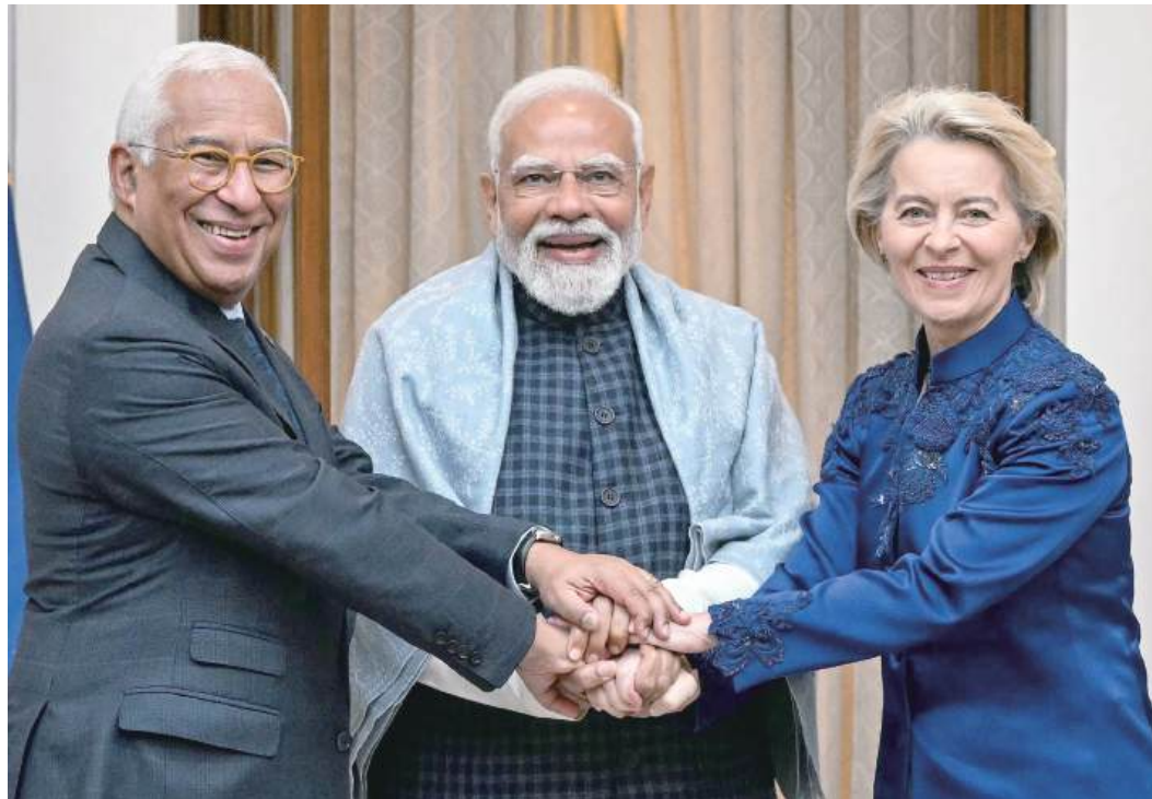
India's Prime Minister Narendra Modi (centre) poses for a photograph with European Commission President Ursula von der Leyen (right) and European Council President Antonio Costa before their meeting at the Hyderabad House in New Delhi yesterday.