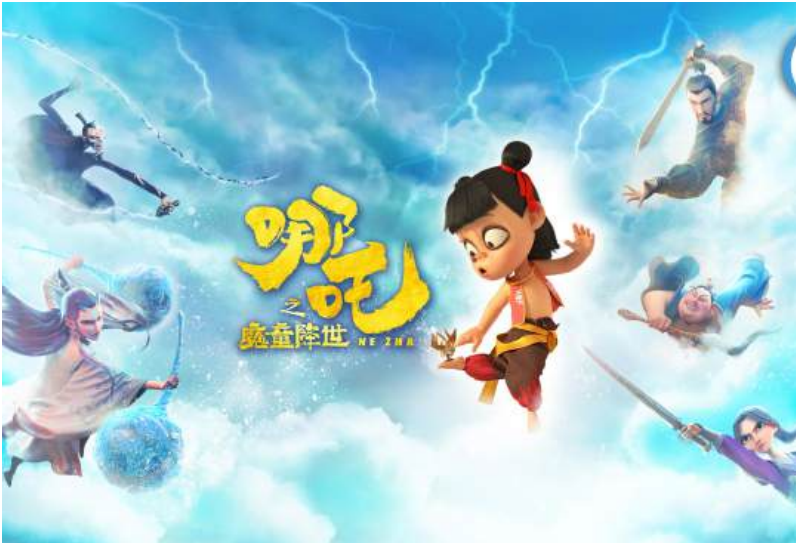
Ne Zha (哪咤之魔童降世, 2019)