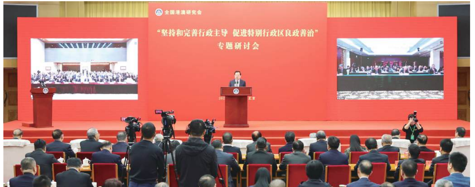
Attendees listen to Xia Baolong's speech during yesterday's thematic seminar about "Upholding and Improving Executive-led Governance to Promote Good Governance in the [Hong Kong and Macau] Special Administrative Regions", with the parallel sessions in Hong Kong (left) and Macau being displayed on the stage by video link.

Xia also said that the implementation of executive-led governance is an essential requirement for addressing the realities of Hong Kong and Macau and achieving efficient governance in the two SARs. Implementing executive-led governance and fully leveraging the leading role of the chief executives and the