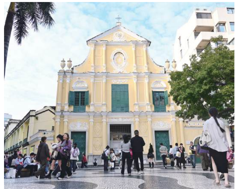
Members of the public gather, take pictures of and walk past Igreja de São Domingos (玫瑰聖母堂 - St Dominic Church) in Largo do Senado.