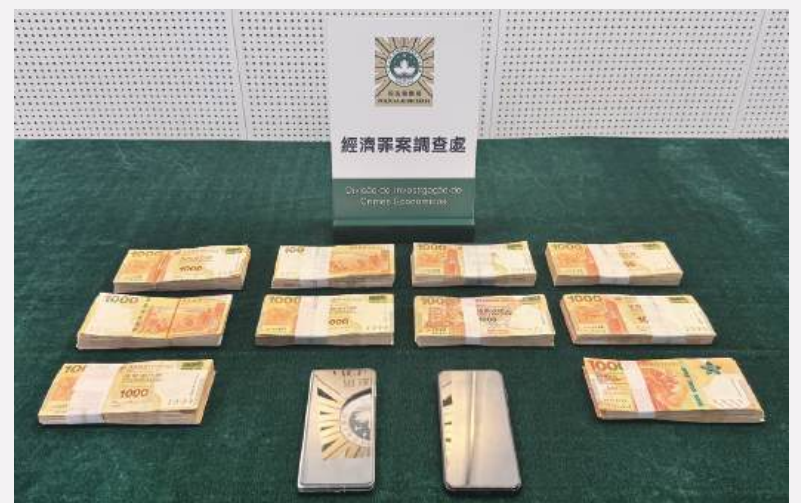
This undated handout photo provided by the Judiciary Police (PJ) yesterday shows the HK$1 million in cash and two smartphones seized from the two suspects.

The duo have been transferred to the Public Prosecutions Office (MP), facing charges of illegal currency exchange and fraud. ■