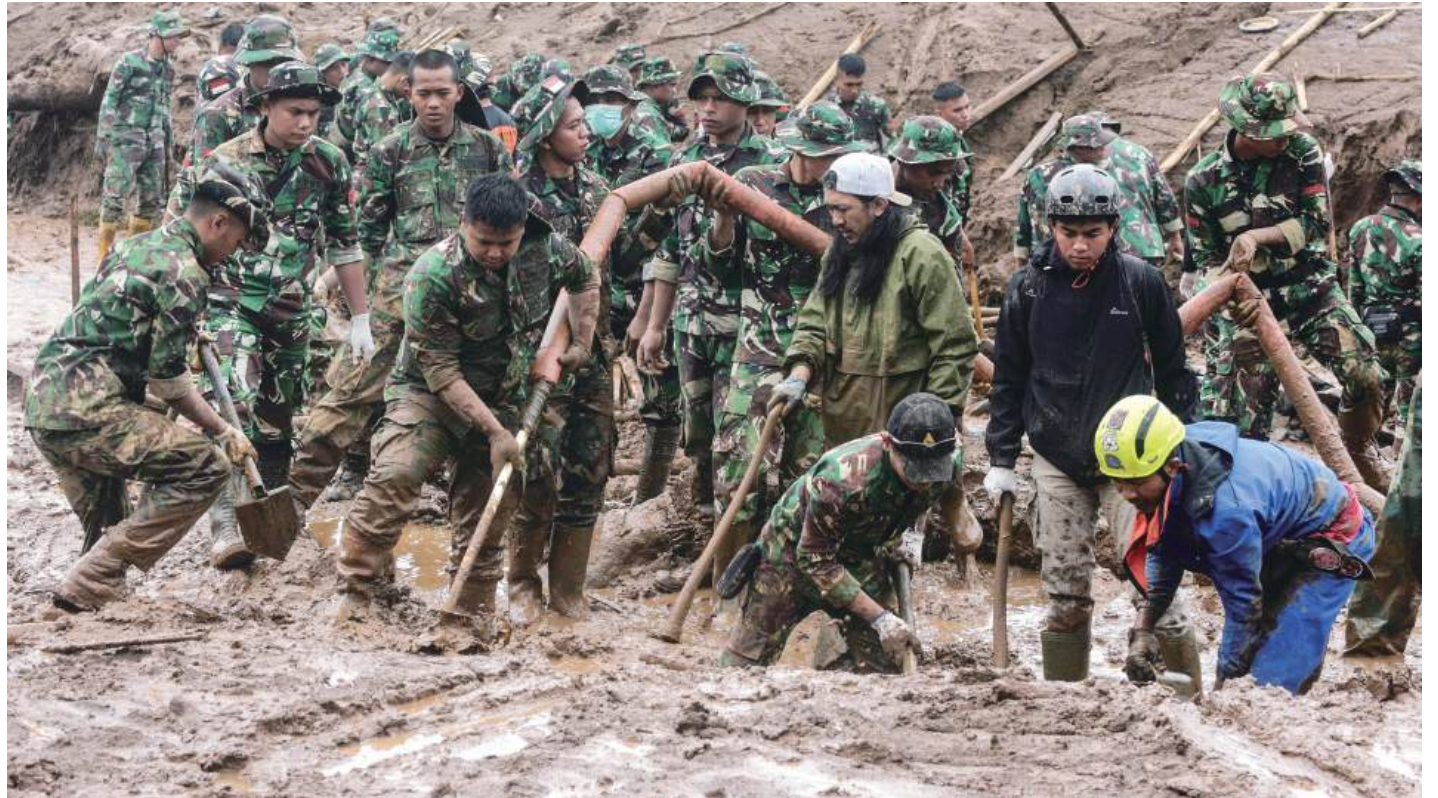
Rescuers search for victims buried by a landslide in Pasirlangu village in Bandung, West Java, Indonesia yesterday.