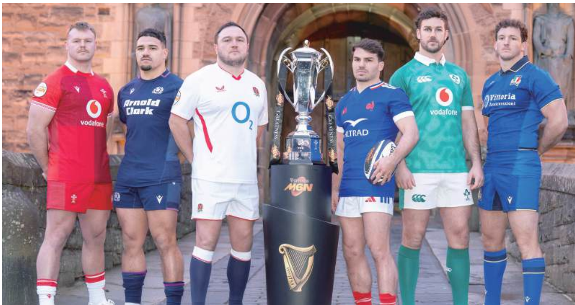
Wales' Dewi Lake (from left to right), Scotland's captain Sione Tuipulotu, England's Jamie George, France's Antoine Dupont, Ireland's Caelan Doris and Italy's Michele Lamaro pose with the trophy during the 6 Nations rugby union tournament media launch in Edinburgh, Scotland, yesterday.

SIX NATIONS — Captain Dewi Lake insisted yesterday that Wales will use the turmoil and uncertainty engulfing the domestic club game as "fuel" to ignite their Six Nations campaign.