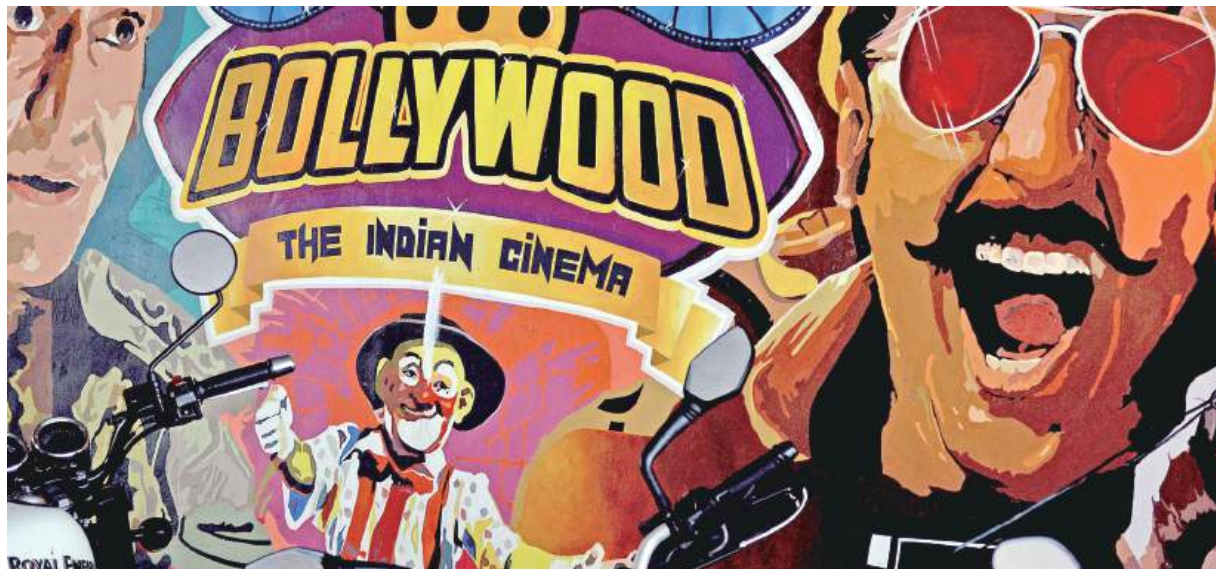
This photo taken on July 21, 2020 shows a wall mural with images of Bollywood actors under a road bridge in Mumbai.

Films centred on geopolitical conflict, internal enemies, and