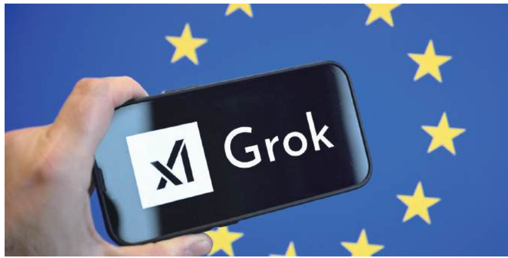
This photo shows a smartphone bearing the logo of Grok, a generative artificial intelligence (IA) chatbot developed by US company xAI in front of a European Union flag in Brussels on January 12.

Brussels said it was investigating whether X had properly mitigated "risks related to the dissemination of illegal content in the EU, such as manipulated sexually explicit images, including content that may amount to child