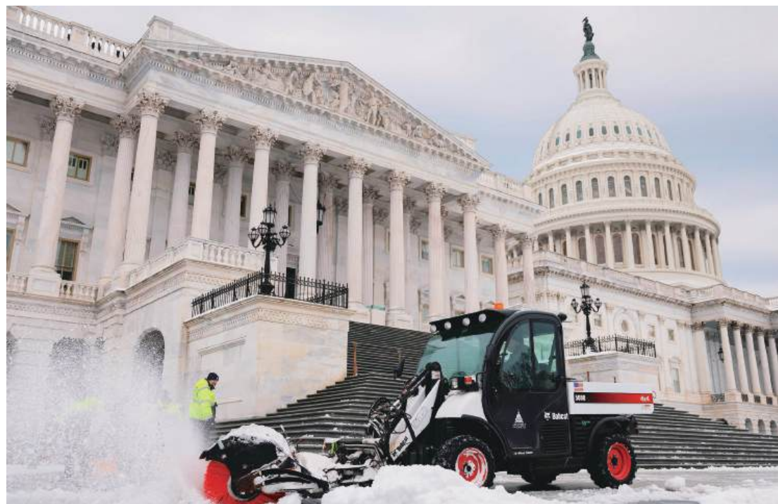
Workers clear snow outside the US Capitol yesterday in Washington, DC. A massive winter storm is bringing frigid temperatures, ice, and snow to millions of Americans across the nation. The storm has reportedly left at least 10 people dead and hundreds of thousands without power. – AFP

US stocks came off to a firmer start, helping European equity markets reverse their earlier weaker trend. – AFP