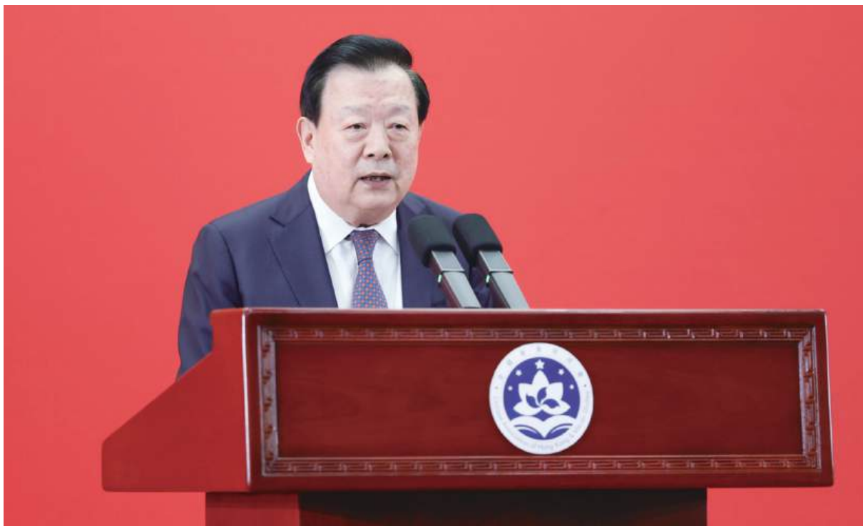
Xia Baolong, director the Hong Kong and Macao Work Office (HKMWO) of the Communist Party of China (CPC) Central Committee and the State Council's Hong Kong and Macao Affairs Office (HKMAO), delivers a speech during yesterday's seminar in Beijing hosted by the Chinese Association of Hong Kong and Macao Studies (CAHKMS).

Xia made the remarks while delivering a speech during a thematic seminar in Beijing yesterday morning hosted by the Chinese Association of Hong Kong and Macao Studies (CAHKMS) about "Upholding and Improving Executive-led Governance to Promote Good Governance in the [Hong Kong and Macau] Special Administrative Regions".