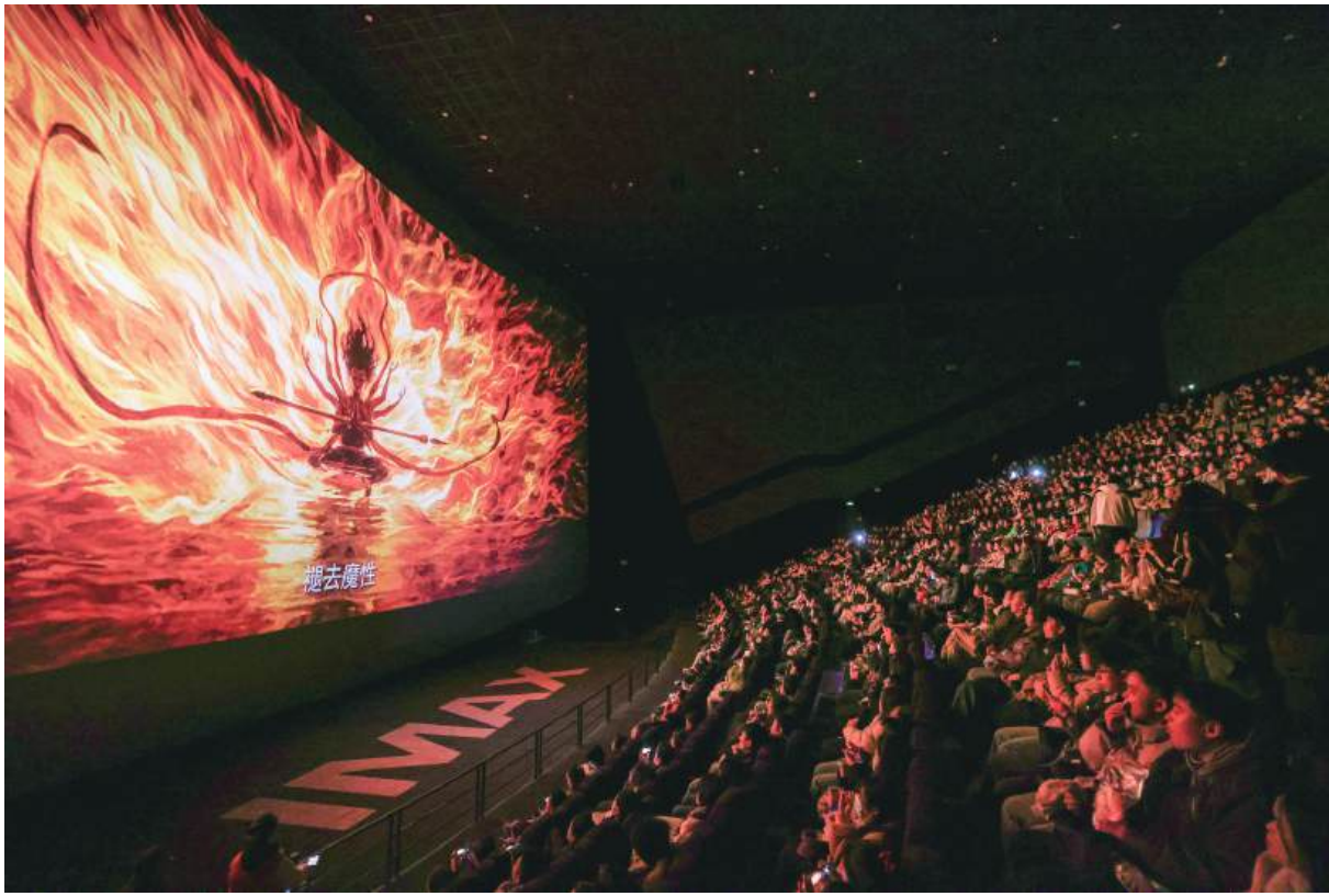
Spectators watch the Chinese animated film "Ne Zha 2" at a cinema in Guiyang, capital of Guizhou Province, on February 25, 2025. Hitting cinemas during the Spring Festival holiday in 2025, "Ne Zha 2" shattered numerous records to become the world's highest-grossing animated film.