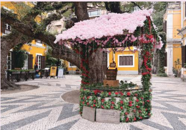
This photo provided by CAC - Círculo dos Amigos da Cultura de Macau on Saturday shows the Albergue Wishing Well and Love Tree on the Albergue SCM patio.