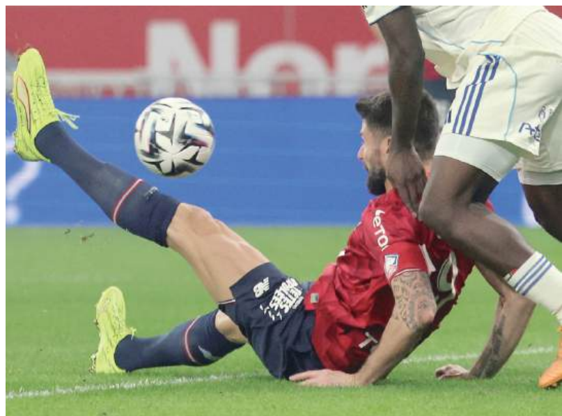
Lille's French forward Olivier Giroud controls the ball on the ground during the French L1 football match against RC Strasbourg Alsace at the Stade Pierre-Mauroy in Villeneuve-d'Ascq, northern France, on Sunday. Strasbourg won the game 4-1.

All the games will be played at 4 a.m. Thursday morning Macau time. /MPD