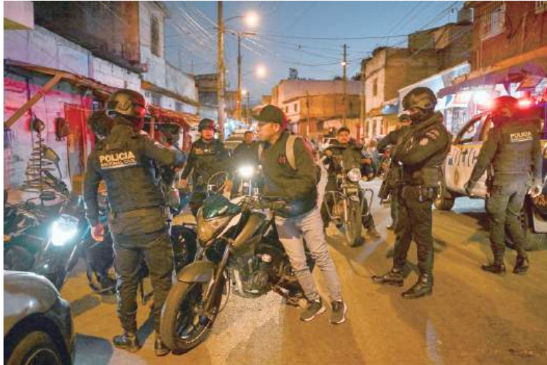
Guatemalan police set up a checkpoint on Thursday in a street in the gang-ridden Gallito neighbourhood during the state of emergency declared by the government in Guatemala City on Thursday. Guatemalan soldiers began patrolling gang-controlled neighbourhoods in the capital on Thursday, after attacks that left 10 police officers dead and prompted the government to declare a state of siege.

The Barrio 18 gang – considered, like MS-19, a terrorist