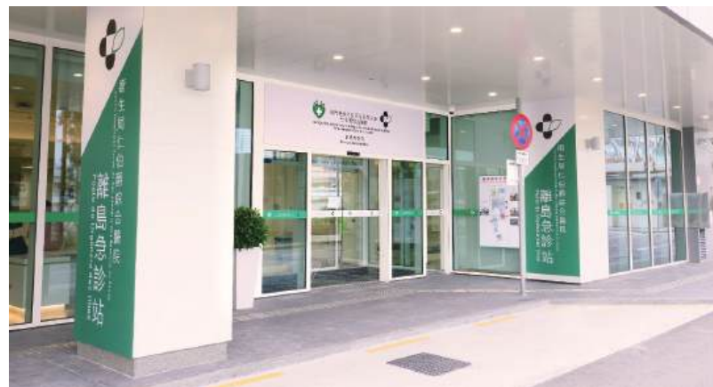
This photo downloaded from the Health Bureau's (SSM) website yesterday shows its Islands Emergency Station of Conde de São Januário General Hospital, which will be handed over to the Islands Healthcare Complex – Macao Medical Centre of Peking Union Medical College Hospital, colloquially known as "Macao Union Medical Centre" (PUMCH), tomorrow.

The statement said that the handover marks an important step in improving the medical service network in Taipa, Cotai and Coloane, and enhancing the quality of emergency care, adding that the centre will continue to work closely with the bureau to safeguard residents' health and safety. ■