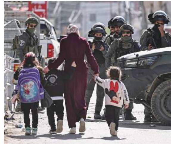
Commuters walk past members of Israeli security forces during a military raid in the neighbourhood of Kafr Aqab near Ramallah, in the Israeli-occupied West Bank, yesterday. Violence in the West Bank, which Israel has occupied since 1967, has soared since the Hamas attack on Israel triggered the Gaza war in October 2023.

RAMALLAH, Palestinian Territories – Voter registration closed across the West Bank on Sunday ahead of municipal elections on April 25, when Palestinians will cast ballots to elect 420 local councils, a rare democratic exercise in the Israeli-occupied territory.