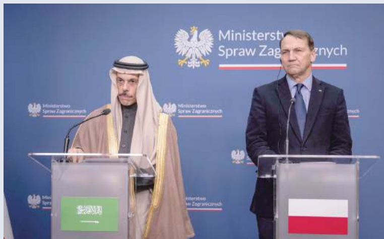
Saudi Arabia’s Foreign Affairs Minister Prince Faisal bin Farhan Al Saud (left) and Poland’s Foreign Affairs Minister Radoslaw Sikorski give a joint press conference after their meeting at the Foreign Office in Warsaw yesterday.

“The UAE has now decided to leave Yemen and I think if that