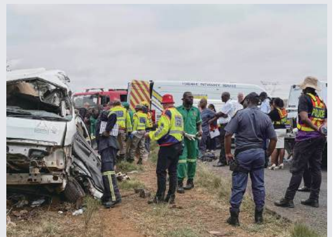
Rescue staff work at the scene of a deadly traffic accident in which a minibus carrying schoolchildren collided with a truck, killing 13 students, in Vanderbijlpark, South Africa, yesterday.