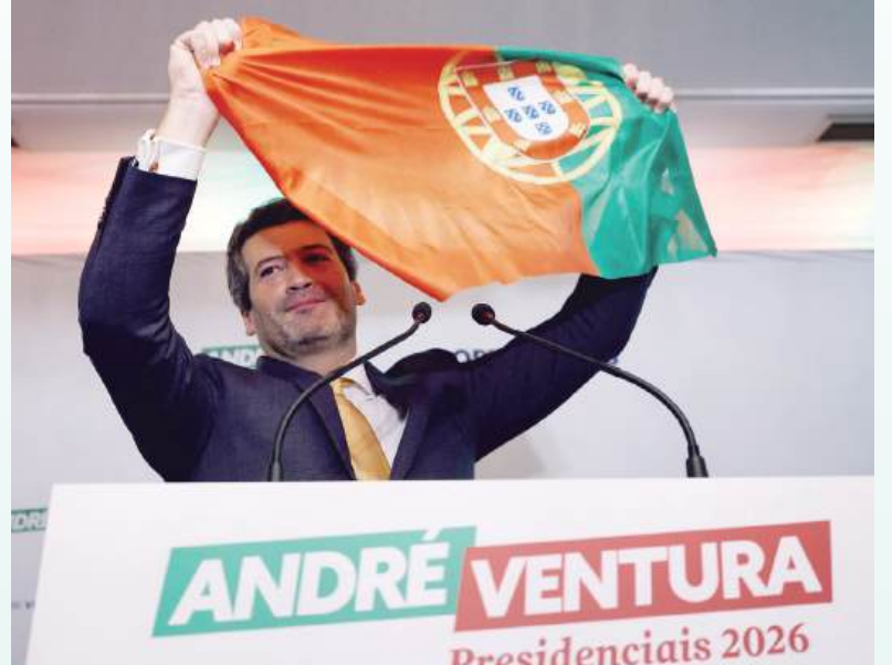
The leader of Portugal's far-right Chega ("Enough!") party, André Ventura, waves a Portuguese flag as he addresses supporters on the night of Portugal's presidential election's first round in Lisbon on Sunday. Ventura, who finished second in the first round, will face the centre-left Socialist Party's candidate José António Seguro candidate in the second round on February 8, near-complete results showed on Sunday.