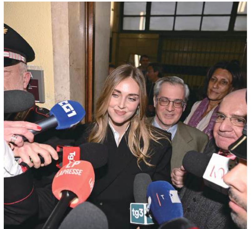
Italian fashion influencer Chiara Ferragni (centre), after being acquitted in her traditional Christmas cake fraud trial, exits the courtroom after her acquittal in Milan, northern Italy on Wednesday.

Easter eggs sold in 2021 and 2022 were also targeted in the scandal, which made headlines in Italy.