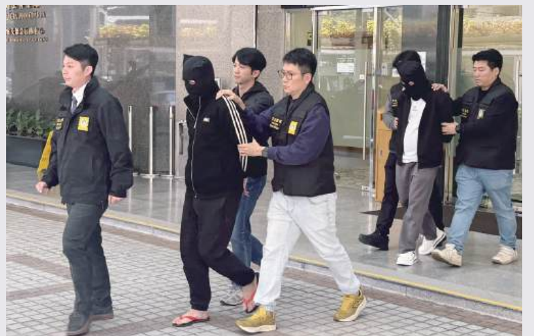
Judiciary Police (PJ) officers escort the two hooded usury and false imprisonment suspects to a PJ van outside the PJ headquarters in Zape yesterday.