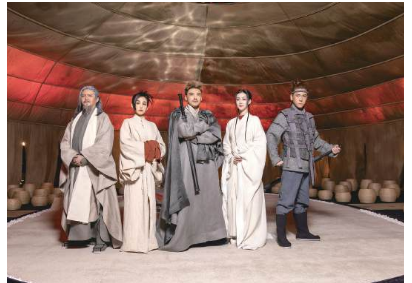
This undated handout photo provided by the Cultural Affairs Bureau (IC) shows the main cast for the "Farewell My Concubine" immersive drama by the Beijing People's Art Theatre, slated to be staged from January 29 to February 1 at the Macau Cultural Centre's (CCM) Box II in Nape.

The immersive stage design aims to place audiences inside a recreated "Chu* military