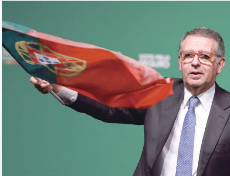
Socialist candidate José António Seguro waves a Portuguese flag as he addresses supporters on the night of Portugal's presidential election's first round in Caldas da Rainha on Sunday. – Seguro won the first round.

Portugal's prime minister, Luis Montenegro of the centre-right Social Democratic Party (PSD),