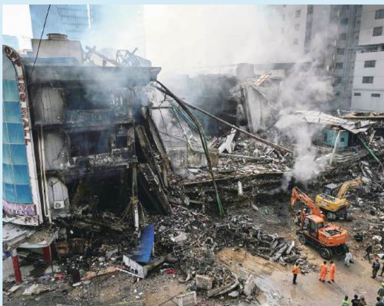
Rescue workers search amid the debris using excavators after a massive fire at a shopping mall in Karachi, Pakistan yesterday. — AFP

Fires are common in Karachi’s markets and factories, which are known for their poor infrastructure. — AFP