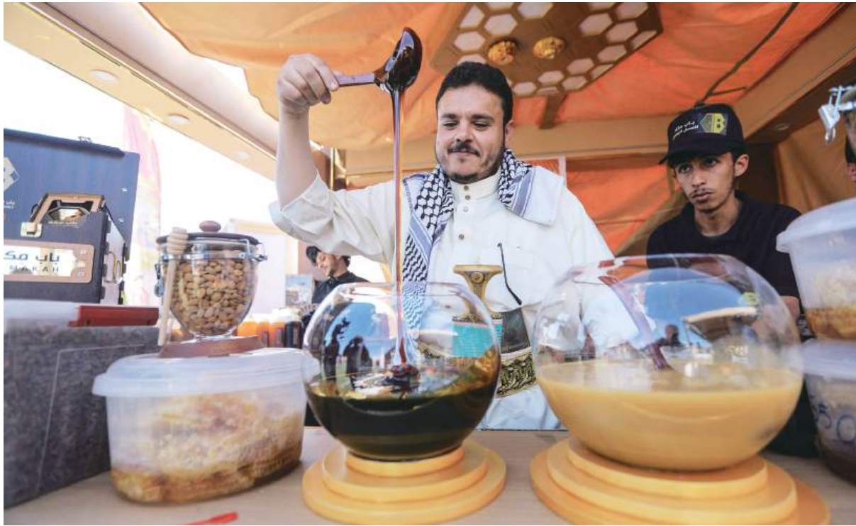
A beekeeper pours honey for sale during the fourth Honey and Bee Products Exhibition in the Houthi-controlled Yemeni capital, Sanaa, on Saturday.

“My fear is that we won’t hear about it until the mortality and the morbidity significantly increases