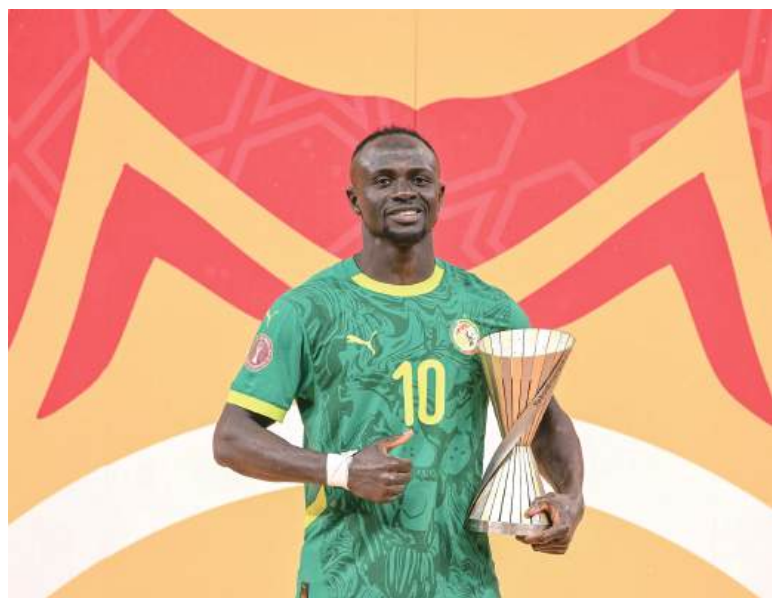
Senegal's forward Sadio Mane poses with the Man of the Competition award after the Africa Cup of Nations (AFCON) final against Morocco at the Prince Moulay Abdellah Stadium in Rabat, Morocco on Sunday. Senegal won the match 1-0.

They closed to within a point of leaders Barcelona in La Liga this weekend after beating Levante 2-0 to record new coach Alvaro Arbeloa's first win at the helm.