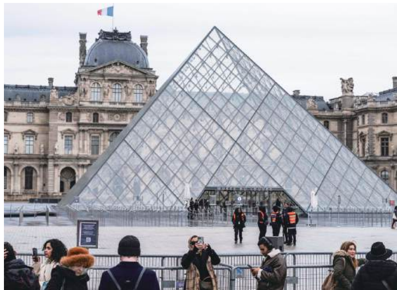
Tourists in Paris stand behind barriers blocking access to the Louvre’s main courtyard as the museum is closed due a strike last Monday.