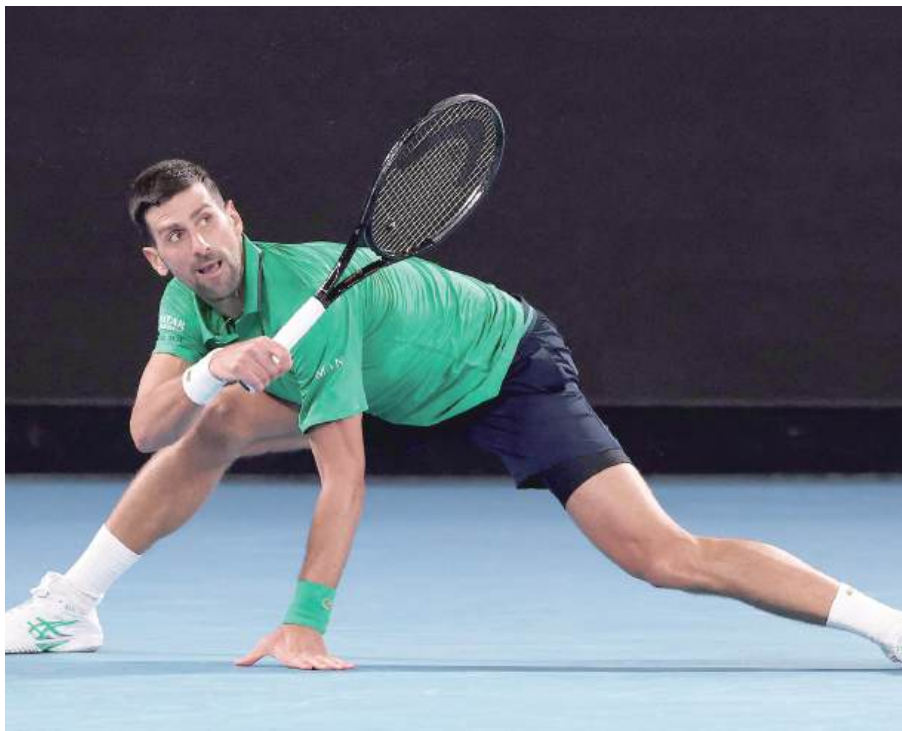
Serbia's Novak Djokovic hits a return to Spain's Pedro Martinez during their singles match at the Australian Open tennis tournament in Melbourne yesterday.

Sixth seed Alex de Minaur, the big home hope, was also a straight-sets winner on another hot day where temperatures reached about 30C and record crowds of