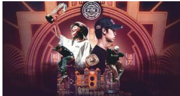
This image downloaded from the Studio City website promotes the FISE: Battle of the Champions slated to take place at the Cotai integrated resort's event centre March 13 to 15.

**According to AI chatbot Poe, in sport, "seeding" means ranking teams or players in a tournament based on their past performance or skill level. This helps ensure that the strongest competitors don't play against each other in the early rounds, making the competition fairer and more exciting.