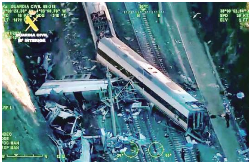
In this still image from video taken and released on yesterday by the Spain's Guardia Civil (gendarmierie), emergency workers are seen at the site where a high-speed Iryo train derailed and was hit by another train as rescue efforts continued in Adamuz, southern Spain, yesterday.

French President Emmanuel Macron and European Commission President Ursula von der Leyen were among world leaders offering condolences.