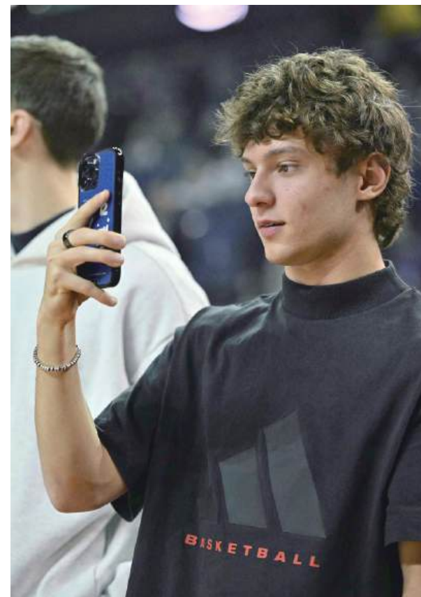
Mercedes' Italian F1 driver Kimi Antonelli attends the 2025/2026 NBA season basketball match between the Memphis Grizzlies and Orlando Magic at the O2 Arena in London on Sunday.

The women's alpine skiing competition begins on February 8 with the downhill race and finishes 10 days later with the slalom.