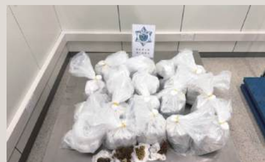
This undated handout photo provided by the Macau Customs Service on Sunday shows the 50 kilograms of stony corals seized by its officers last Monday at the Hong Kong-Zhuhai-Macao Bridge (HKZMB) Macau Port (checkpoint).

*"Stony corals" are marine animals in the order Scleractinia within the class Anthozoa. They are characterised by their ability to secrete a hard, solid skeleton made of calcium carbonate (aragonite). This skeletal structure forms the primary architectural foundation of coral reefs, making them the world's most significant reef-building organisms. – DeepSeek