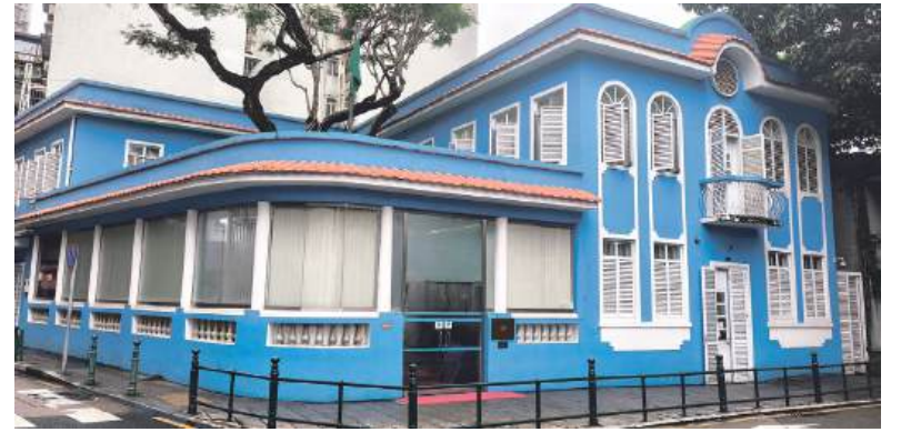
This file photo taken last year shows the headquarters of the Social Welfare Bureau (IAS) on Estrada do Cemitério.

After including the new category of beneficiaries (those with a severe or profound level of primary psychosis) announced yesterday, the caregiver subsidy programme now covers those who