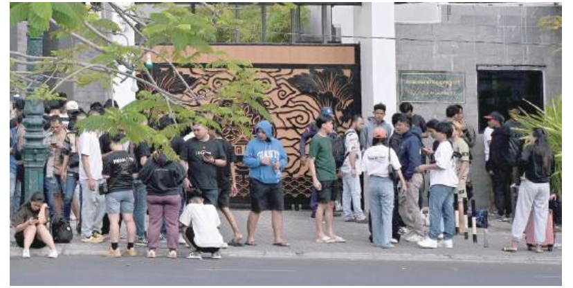
People gather in front of the Indonesian Embassy in Phnom Penh yesterday. More than 400 Indonesians were freed by cyberscam networks in Cambodia this month, Jakarta said yesterday, after Phnom Penh announced a fresh crackdown on the illicit industry following the arrest of a prominent alleged boss.

Some who went to the embassy were "involved in online scams for years, some only arrived in Cambodia a few months ago", he said.