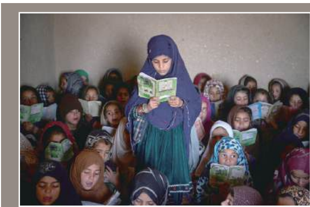
An Afghan girl reads the holy Koran at a madrasa, or Islamic school, in the 13 th district of Kandahar on Sunday.