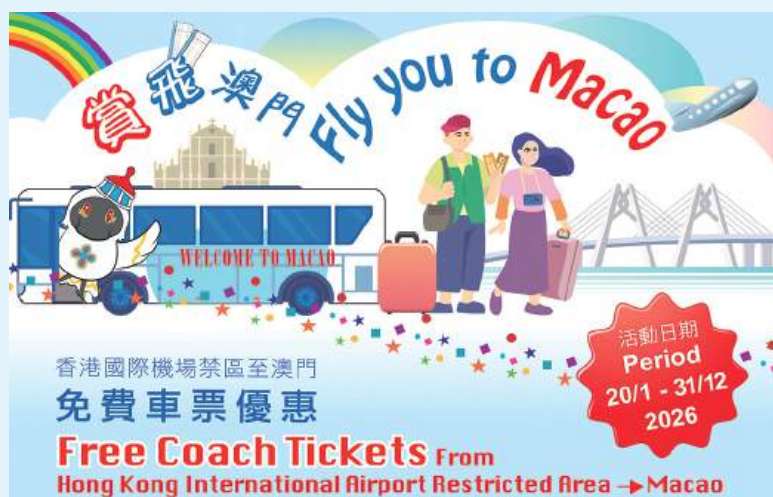
This infographic provided by the Macau Government Tourism Office (MGTO) yesterday promotes its year-long special offer of free direct coach tickets from the restricted area of Hong Kong International Airport to Macau, starting today.

*Chu (楚) was a powerful feudal state during the Zhou Dynasty in ancient China. It existed from around c. 1030 BCE to 223 BCE, making it one of the longest-lasting states of the period. - DeepSeek