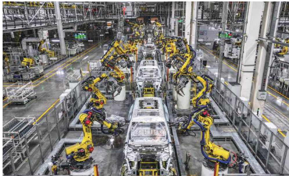
This drone photo shows the robotic production line at the Seres Super Factory in Liangjiang New Area, Chongqing Municipality, on September 19, 2025. Seres is an electric vehicle (EV) manufacturer. The term "Super Factory" typically suggests advanced manufacturing capabilities, often involving automation and innovation.

Service consumption added support. Service retail sales grew 5.5 percent, and