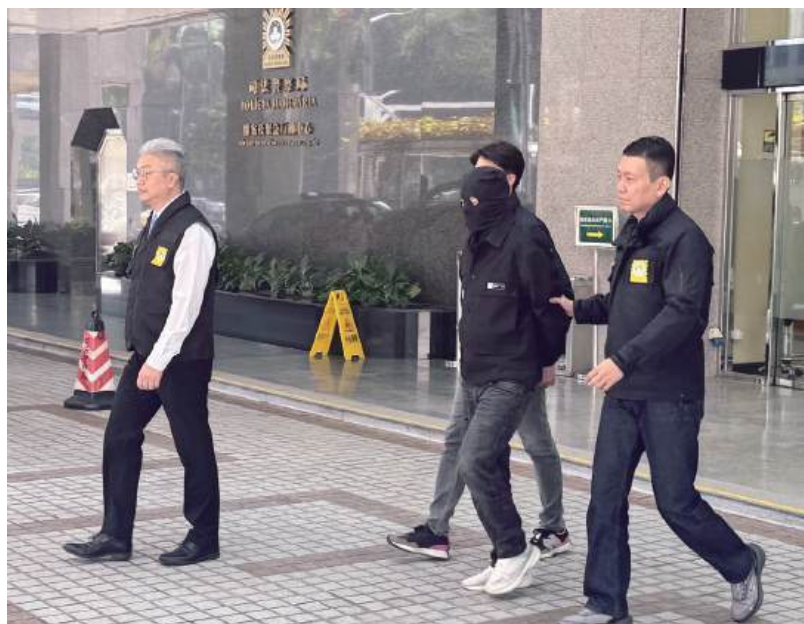
Judiciary Police (PJ) officers escort the hooded car theft suspect to a PJ van outside the PJ headquarters in Zape yesterday.

The duo were transferred to the Public Prosecutions Office (MP) yesterday, facing charges of false imprisonment and usury. ■