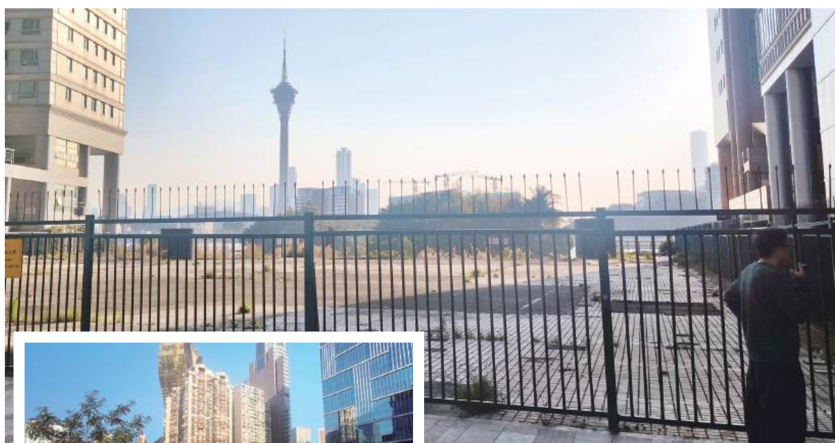
A man smokes outside Plot A9 (top) on the waterfront in Nam Van Lake district yesterday, while pedestrians walk past Plot A4 in the area(left). The two plots, alongside Plot A3 in the area, are three of 13 plots that the government has currently earmarked for recreational and leisure purposes on a temporary basis.