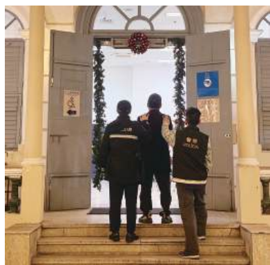
This undated handout photo provided by the Public Security Police (PSP) yesterday shows PSP officers escorting the theft-by-finding suspect into a police station.