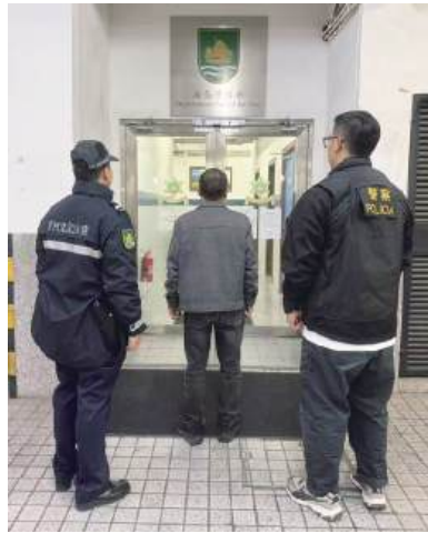
This undated handout photo provided by the Public Security Police (PSP) yesterday shows PSP officers escorting the fraud suspect into a police station.