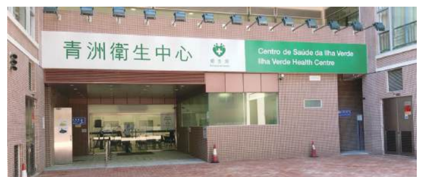
This undated handout photo downloaded from the Health Bureau's (SSM) website yesterday shows its Ilha Verde Health Centre.

levels (such as local hospitals, clinics, or community health programs). This approach aims to ensure that resources are effectively utilised at the grassroots level, addressing specific local needs and improving access to healthcare services for the population. – DeepSeek