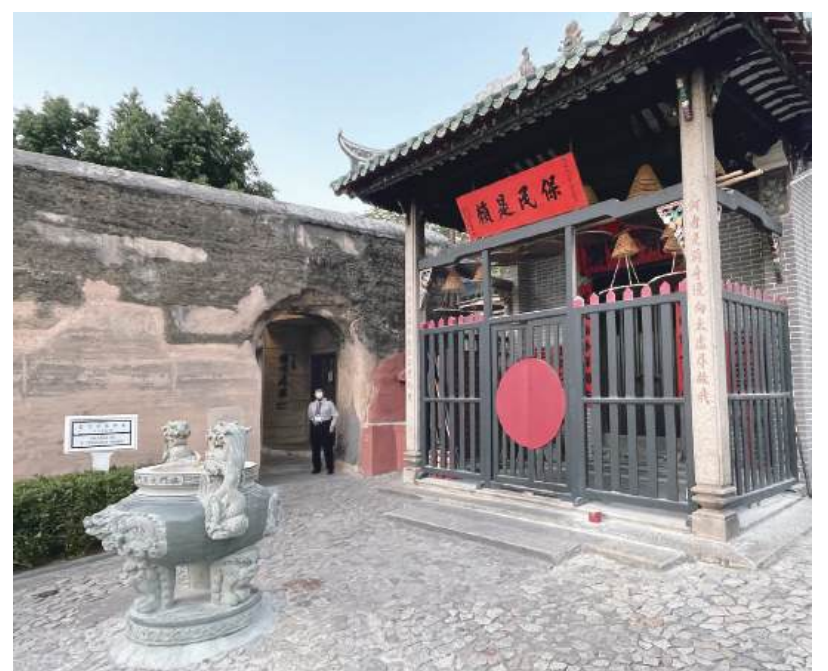
A security guard stands in front of the Na Tcha Exhibition Hall adjacent to the Na Tcha Temple close to the Ruins of St. Paul's and Chi Lam Vai heritage village yesterday afternoon. The Temple and St. Paul's Ruins are UNESCO World Heritage-listed monuments.

Chi Lam Vai (茨林圍) includes a café and souvenir shop dedicated to Na Tcha. ■