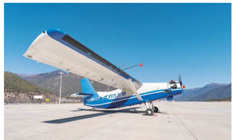
An FP-985 "Taurus" large fixed-wing drone is pictured in Nyingchi city, Xizang Autonomous Region, on December 26, 2025. China's domestically developed large fixed-wing drone, the FP-985 "Taurus," completed a long-distance logistics flight across the high-altitude regions between Sichuan and Xizang yesterday.