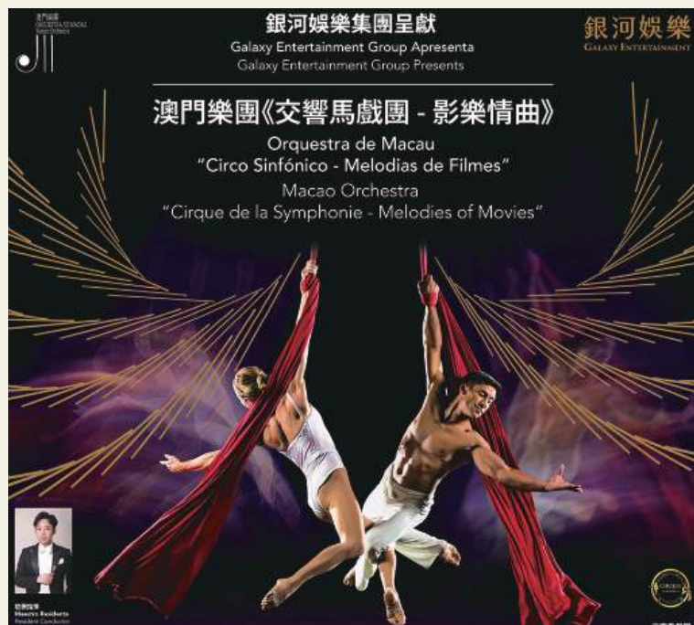
This poster provided by the Cultural Affairs Bureau (IC) yesterday promotes the "Cirque de la Symphonie - Melodies of Movies" which will be held on February 14, Valentine's Day, at Broadway Macau in Cotai

The Macao Orchestra 2025-26 concert season is co-organised by the Cultural Affairs Bureau (IC), Macao Orchestra, and Macau's six integrated resort operators, with support from the Bank of China Macau (BOC) Branch. ■