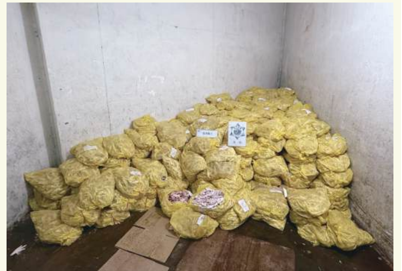
This handout photo released by the Macau Customs Service yesterday shows bags of chicken feet weighing 1.8 tonnes, stored at room temperature, at a parallel trading den in the northern district on Tuesday.