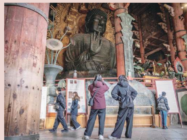
Tourists visit the 15-metre-tall Great Buddha statue which was built in 752 AD, at Todaiji Temple in Nara, Japan yesterday.

The Philippines lies along the Pacific “Ring of Fire,” making it highly prone to earthquakes and volcanic eruptions.