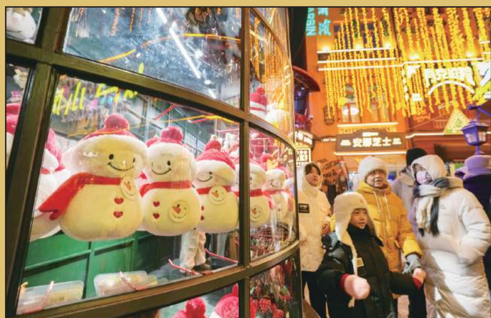
Revelers visit Central Street in Harbin, capital of Heilongjiang Province, on Sunday. As one of the most popular attractions in Harbin, Central Street, which is renowned for its diverse European-style architecture, wows tourists with its colorful lights at night during the city's tourism boom this winter.

While a Zika virus infection is typically mild for most people, it can be lethal, but this is rare and primarily affects specific, vulnerable groups, such as newborns. ■