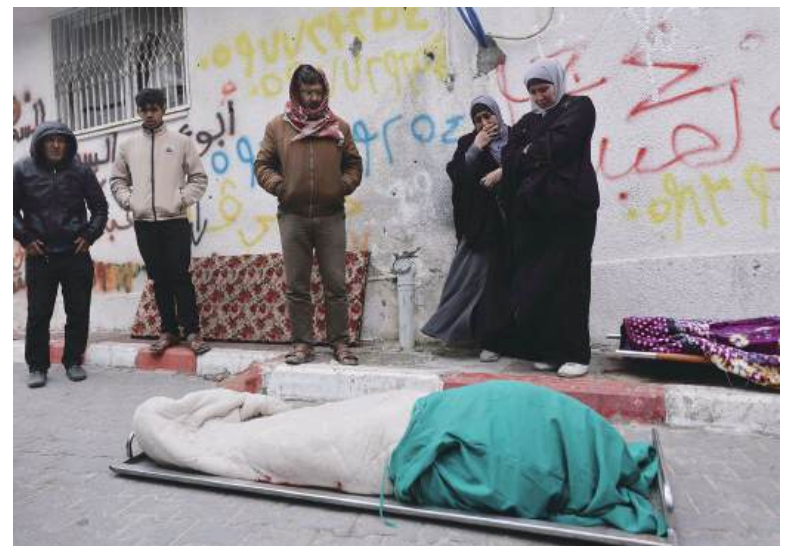
Palestinians mourn over a body during the funeral of three displaced members of the Hamoda family who died after parts of a war-damaged building where they had taken shelter collapsed on a windy winter day in Gaza City yesterday. A fragile ceasefire has been in place since October, following a deadly war waged by Israel in response to Hamas's unprecedented October 7, 2023 attack on Israel. Nearly 80 percent of buildings in Gaza have been destroyed or damaged by the war, according to UN data.