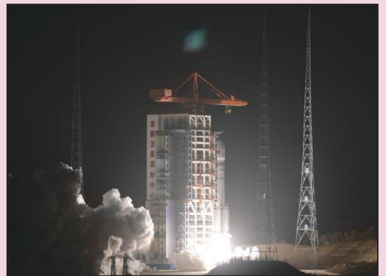
A modified version of the Long March-6 rocket carrying the Yaogan-50 01 remote sensing satellite blasts off from the Taiyuan Satellite Launch Center in Shanxi Province last night. Launched at 10:16 p.m., the satellite has entered planned orbit. The launch was the 624 th flight mission undertaken by the Long March rocket series and marked China's first successful orbital launch of 2026.