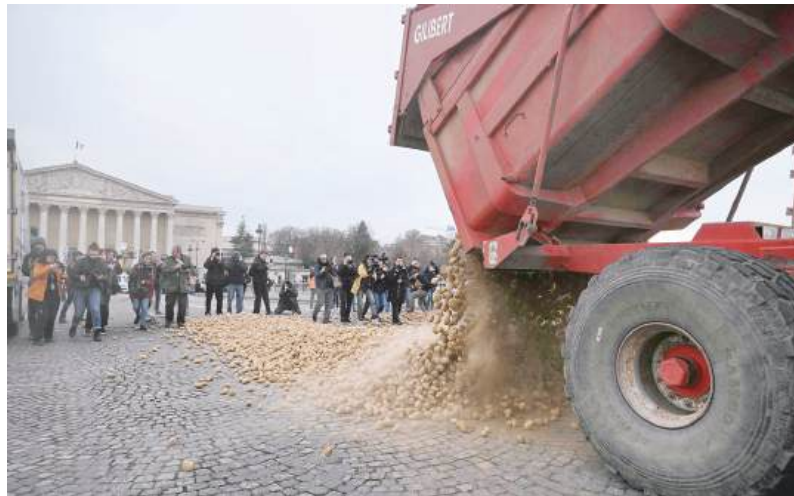
French farmers dump potatoes during a protest in front of the National Assembly to demand "concrete and immediate action" from the government, in Paris yesterday. Called by two farmers' unions and a few days before the signing of the EU-Mercosur/Mercosul agreement, a convoy of farmers entered the capital yesterday morning (local time).

The first convoy of about 15 tractors rolled into the French capital