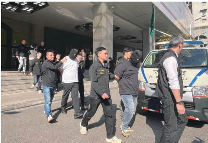
Judiciary Police (PJ) officers escort the four hooded suspects to a PJ van outside the PJ headquarters in Zape yesterday.