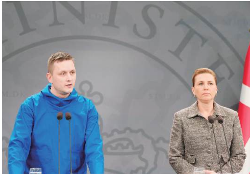
Greenland's Head of Government (Naalakkersuisut) Jens-Frederik Nielsen (left) and Denmark's Prime Minister Mette Frederiksen give a press conference in the Mirror Hall at the Prime Minister's Office in Copenhagen yesterday.

today's meeting at the White House is aimed at ironing out "misunderstandings".