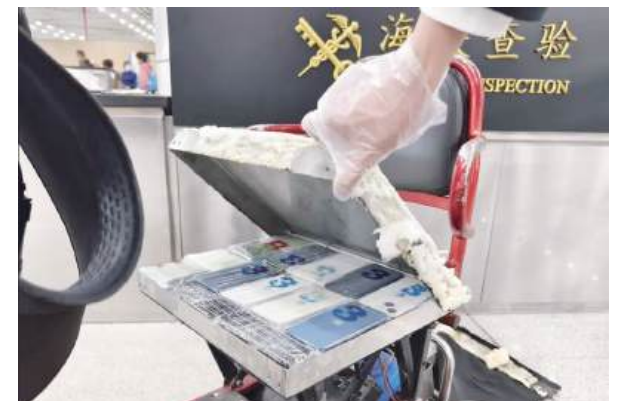
This undated handout photo provided by the General Administration of Customs of the People's Republic of China (GACC) shows 40 used smartphones concealed in a smuggler's electric wheelchair seat.

taxes into the mainland constitutes smuggling. If the circumstances are severe enough to constitute a crime, criminal liability will be pursued. ■