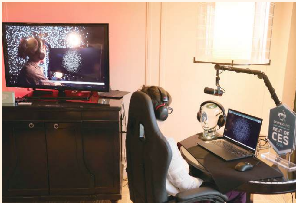
A representation of brain focus as a pattern of dots is displayed by the Prime application as a Neurable researcher demonstrates Neurable and HP Inc.’s HyperX collaboration brain-computer interface and gaming audio headset for neurofeedback to measure brainwave activity (EEG) and improve brain function, during the annual Consumer Electronics Show (CES) in Las Vegas, Nevada last Wednesday. Beyond smart watches and rings, AI is being used to make self-testing for major diseases more readily available, from headphones that detect early signs of Alzheimer’s to an iris-scanning app that helps spot cancer.

“Apple Watch can pick up Parkinson’s, but it can only pick it up once you have a tremor,” Alcaide said. “Your brain has been fighting that Parkinson’s for over 10 years.”