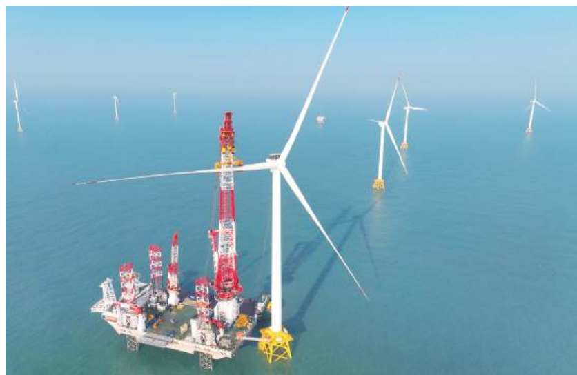
This drone photo taken yesterday shows the construction site of a 20-megawatt offshore wind turbine unit in the coastal waters of southeastern Fujian Province. The wind turbine unit was successfully hoisted and installed yesterday. — Xinhua