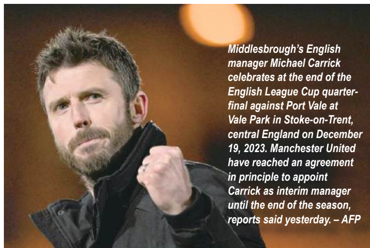
Middlesbrough's English manager Michael Carrick celebrates at the end of the English League Cup quarter-final against Port Vale at Vale Park in Stoke-on-Trent, central England on December 19, 2023. Manchester United have reached an agreement in principle to appoint Carrick as interim manager until the end of the season, reports said yesterday.