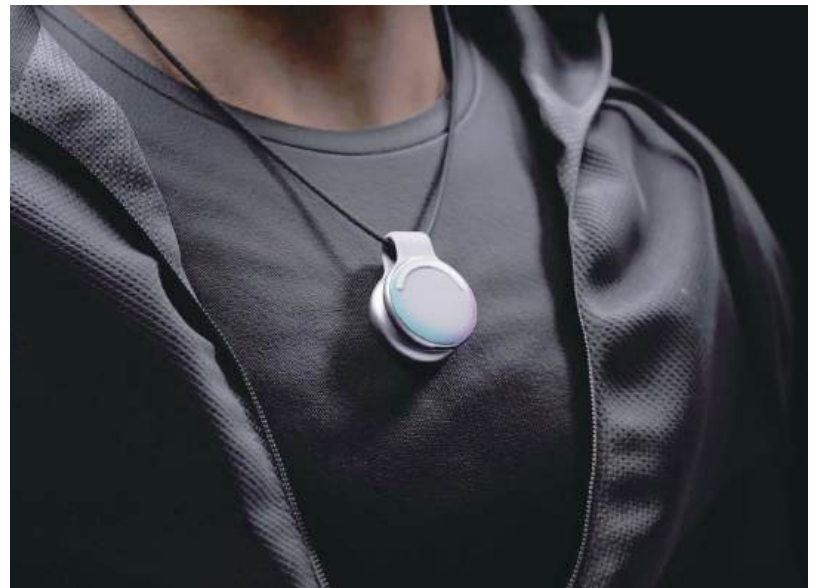
This undated handout photo shows a person posing with a “Limitless Pendant” wearable AI device.