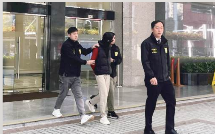
Judiciary Police (PJ) officers escort the hooded theft suspect to a PJ van outside the PJ headquarters in Zape yesterday.