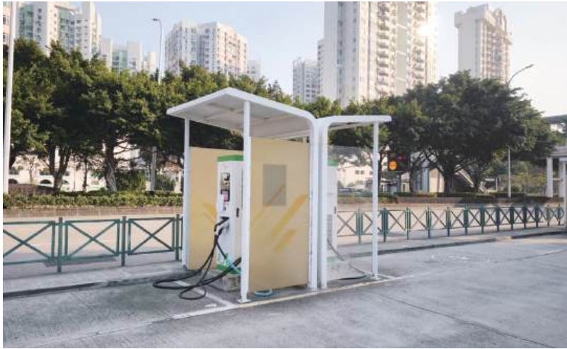
This photo taken yesterday shows street parking spaces equipped with e-car charging piles near the waterfront outside the Ocean Gardens residential neighbourhood in Taipa.

Effective from February 1, slow charging will have a rated output power of over 3.4 kW and up to 7.4 kilowatt, while medium charging will, as currently, have a rated output power of over 7.4 kW and up to 25 kW. Quick charging will have a rated output power of over 25 kW and up to 120 kW from February 1. ■