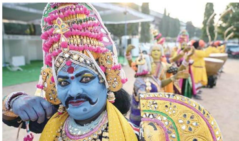
Artists perform the folk dance 'Chindu Yakshaganam' during the harvest festival Makar Sankranti in Hyderabad, India yesterday.