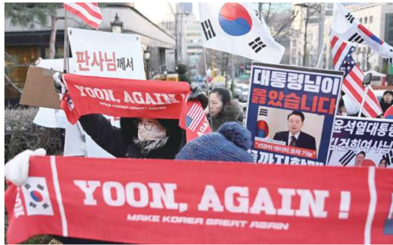
Supporters of South Korea's impeached former president Yoon Suk Yeol gather in front of the Seoul Central District Court in Seoul yesterday, as Yoon's final criminal trial on insurrection charges is scheduled to be held in the court.

defence minister Kim Yong-hyun be sentenced to life imprisonment.