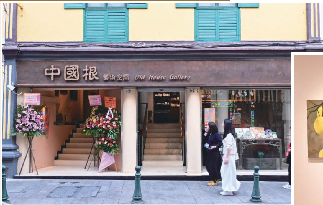
Photo of the façade of the Old House Gallery.