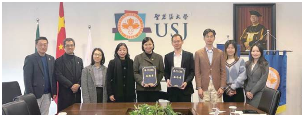
This undated handout photo downloaded from the University of Saint Joseph's (USJ) website yesterday shows USJ and Guangzhou College of Commerce representatives posing during the signing of a new agreement during a ceremony held on USJ's Ilha Verde campus last Thursday.