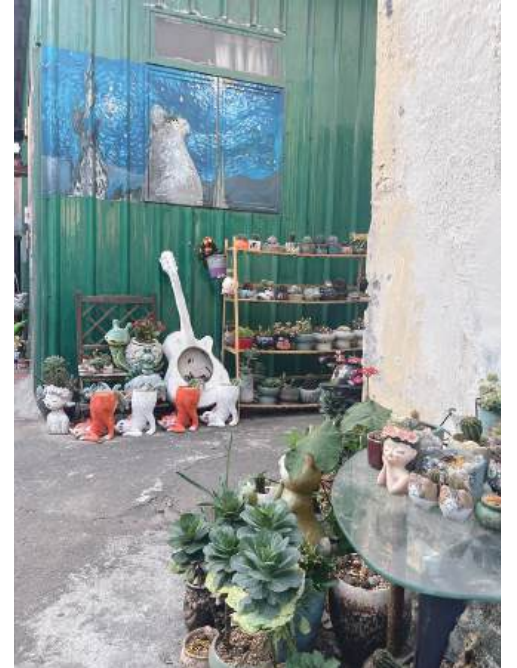
A corner of Chi Lam Vai, a green wall adorned with a mural and various potted plants and decorative figurines neatly arranged by the villagers.

Leong said he hoped that under "legal, reasonable, and fair" conditions, the government will support the village's