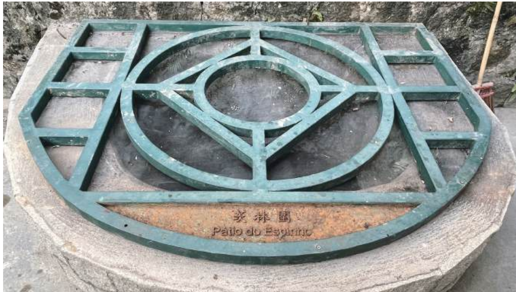
The ancient well in Chi Lam Vai village has been temporarily closed with an iron manhole cover since the recent conclusion of its two-phase clean-up.

In the village, ancient trees, well, and remnants of the wall, serve as significant community landmarks, Leong underlined. Among these, an ancient well was previously sealed due to public hygiene concerns, he said. Following advocacy by residents and