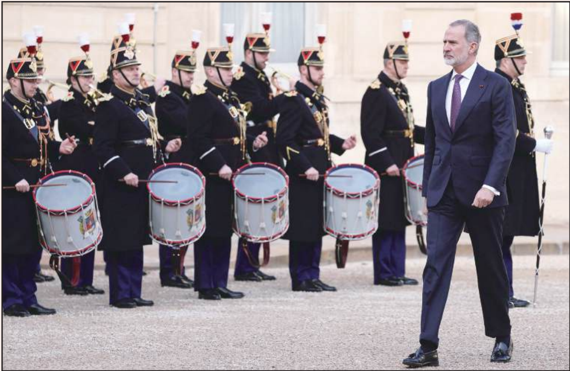
Spain's King Felipe VI arrives to meet French President Emmanuel Macron at the Élysée Palace in Paris yesterday.

in her talks with Leo and sought the pope’s backing for “the prompt advancement of the transition to democracy in Venezuela.” The opposition and the West consider Urrutia the legitimate victor of Venezuela’s last presidential election. Machado was awarded the Nobel Peace Prize last year and dedicated it to Trump, who has made no secret of his frustration at being passed over for the award. In Caracas on Monday, Rodríguez made a number of ministerial changes, naming a former Maduro bodyguard as minister of the presidential office – charged with managing her agenda and liaising with state agencies. She also replaced the head of the presidential guard, who leads the counterintelligence unit. Her government said it was ready to pursue a “new agenda” with the European Union and Britain following talks on Monday with their envoys.