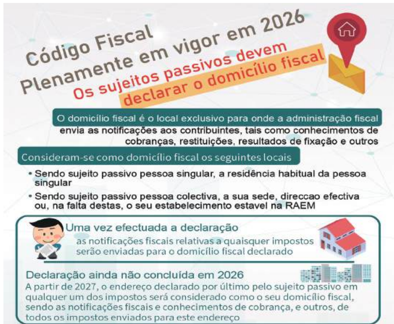
This poster provided by the Financial Services Bureau (DSF) yesterday shows that taxpayers need to declare their tax domicile this year.

Taxpayers, according to the statement, can submit the declaration online via the "Electronic Service" on the website of the bureau, DSF's mobile application, Macao One Account, and the Business & Associations Platform. The statement also said that taxpayers may submit it in person by visiting tax service counters located at the DSF headquarters on Avenida da Praia Grande, the Government Service Centre in Areia Preta, or the Government Service Centre on Rua de Coimbra in Taipa, to submit the declaration form. ■