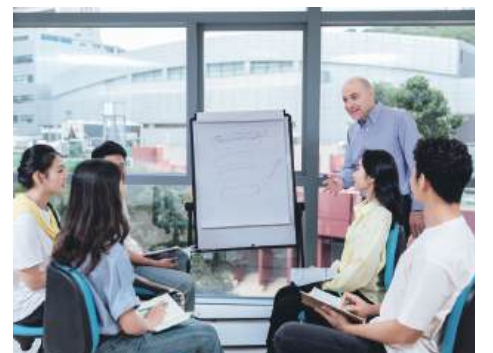
This undated and unlocated handout photo provided by Macao Polytechnic University (MPU) shows a lecturer conducting a class.

* IELTS stands for International English Language Testing System. It is a standardised test that assesses the English language proficiency of non-native speakers. It is widely used for educational, immigration, and professional purposes, and evaluates four key skills: listening, reading, writing, and speaking. — Poe