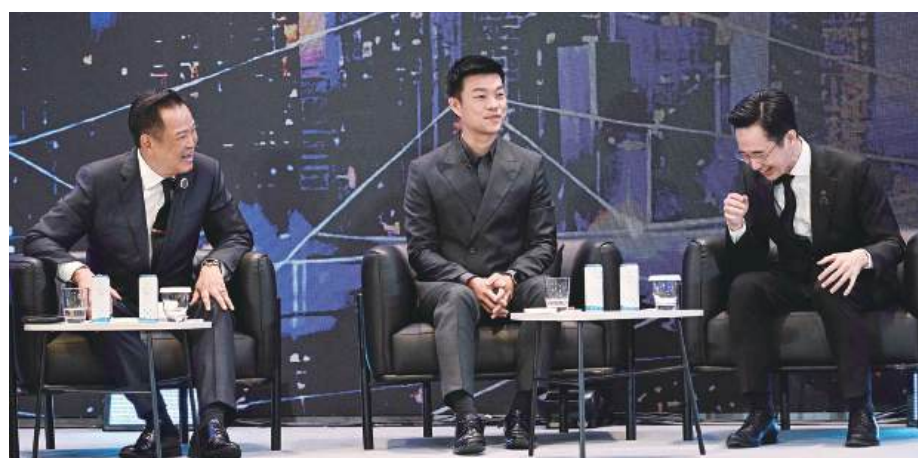
Prime minister and Bhumjaithai Party’s party leader Anutin Charnvirakul, (left to right) People’s Party’s prime ministerial candidate and party leader Natthaphong Ruengpanyawut and Pheu Thai Party’s prime ministerial candidate Yodchanan Wongsawat interact at the Global Dynamics and Thailand’s Future event at Queen Sirikit National Convention Centre in Bangkok on Monday.

European officials and tech campaigners have criticised the latter move, saying it fails to address concerns about sexualised deepfakes.