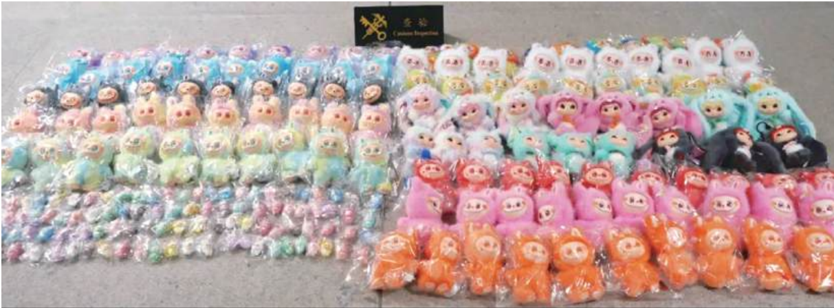
This undated handout photo provided by Zhuhai’s Gongbei Customs yesterday shows 227 bogus Labubu and Wakuku dolls seized by its officers at Qingmao Port (checkpoint) on New Year’s Eve.