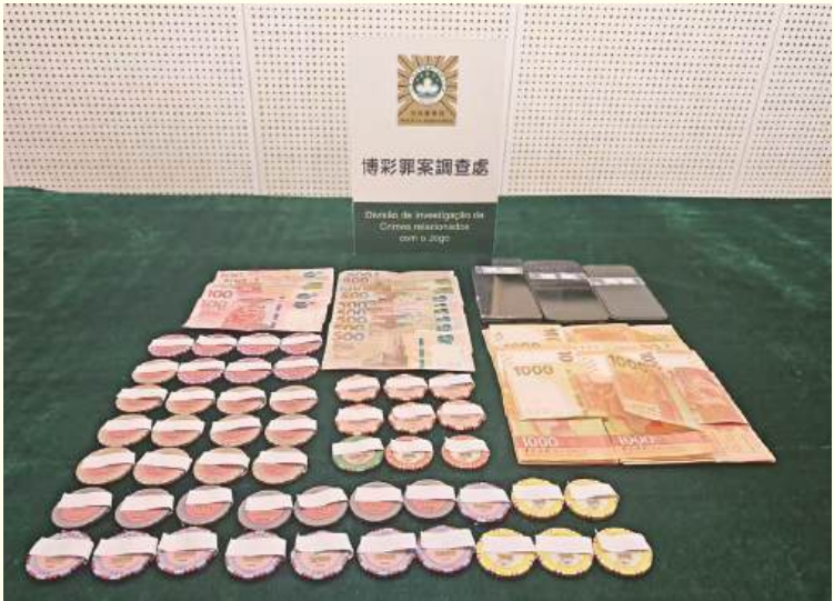
This undated handout photo provided by the Judiciary Police (PJ) yesterday shows HK$65,000 in cash, HK$100,000 in chips and three smartphones seized from the two usury and theft suspects, along with HK$890,000 in chips confiscated from the “chip-pool” gambler.