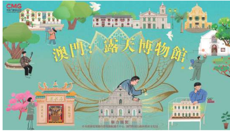
This handout undated poster provided by the Cultural Affairs Bureau (IC) yesterday promotes the documentary titled “Macau: An Open-Air Museum” about its UNESCO-listed World Heritage status.

UNESCO recognised Macau’s Historic Centre as a World Heritage site on July 15, 2005. The Macau