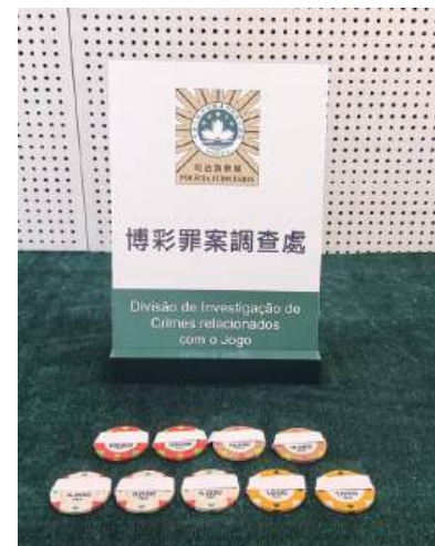
This undated handout photo provided by the Judiciary Police (PJ) yesterday shows the stolen chips.