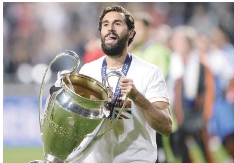
Real Madrid's defender Alvaro Arbeloa celebrates with the Champions League trophy after winning the UEFA Champions League Final against Atletico de Madrid at Luz stadium in Lisbon, on May 24, 2014.

Arbeloa also lifted the World Cup with Spain in 2010, as well as the European Championship in 2008 and 2012, playing alongside