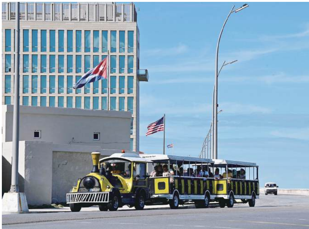
A tourist vehicle drives past the US embassy in Havana on Sunday.

Trump provided almost no details about what potential deal he referred to, or what such an arrangement would achieve.