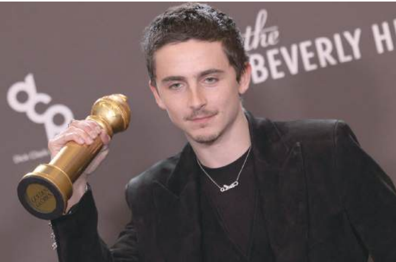
French-US actor Timothee Chalamet poses in the press room with the Best Actor in a Motion Picture – Musical or Comedy for “Marty Supreme” trophy during the 83rd annual Golden Globe Awards at the Beverly Hilton hotel in Beverly Hills, California, on Sunday.

period horror film about the segregated South of the 1930s, had been expected to prevail.