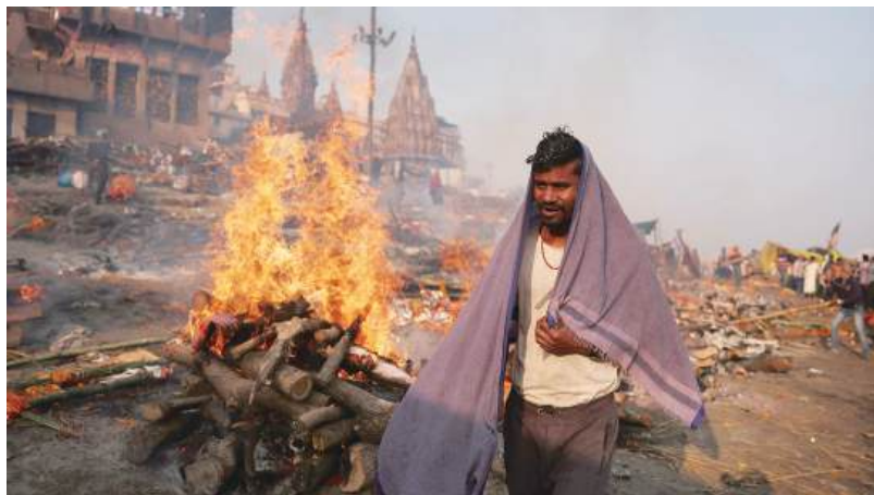
A cremator of the Dom community walks past the funeral pyres burning at the Manikarnika Ghat on the banks of the river Ganges in Varanasi, India yesterday. — AFP

North Korea is under a slew of United Nations Security Council sanctions over its nuclear and missile programme. — AFP