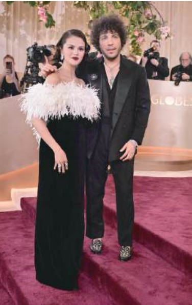
Newly-wed US actress Selena Gomez (left) and her husband US musician Benny Blanco pose upon arrival for the 83rd annual Golden Globe Awards at the Beverly Hilton hotel in Beverly Hills, California, on Sunday.

Ariana Grande (“Wicked: For Good”), who competed with Taylor for the award for best supporting actress, turned heads in a black textured Vivienne Westwood ballgown with an asymmetrical