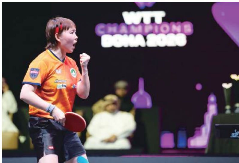
This photo downloaded from the WTT website last night shows Zhu Yuling celebrating.

"The completion of WTT Champions Doha 2026, the first event of the WTT season, has had a significant impact on the ITTF World Table Tennis Rankings, with players who delivered outstanding performances being rewarded with notable improvements in their standings", according to the statement. ■