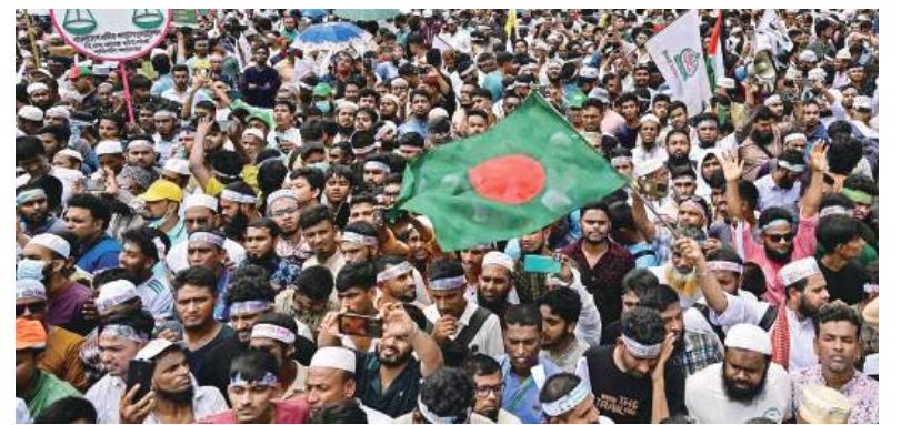
Jamaat-e-Islami party leaders and activists wave Bangladesh's national flag during a rally held to call for the introduction of a proportional representation system in the country's forthcoming general election and press other demands at the Suhrawardy Udyan in Dhaka on July 19, 2025. After years of repression, Bangladesh's Islamist groups are mobilising ahead of February 12 elections, determined to gain a foothold in government as they sense their biggest opportunity in decades. At the centre of this formidable push is Jamaat-e-Islami, the country's largest and best-organised Islamist party.

Jamaat-e-Islami, the country’s largest and best-organised Islamist party, ideologically aligned with the Muslim Brotherhood, is