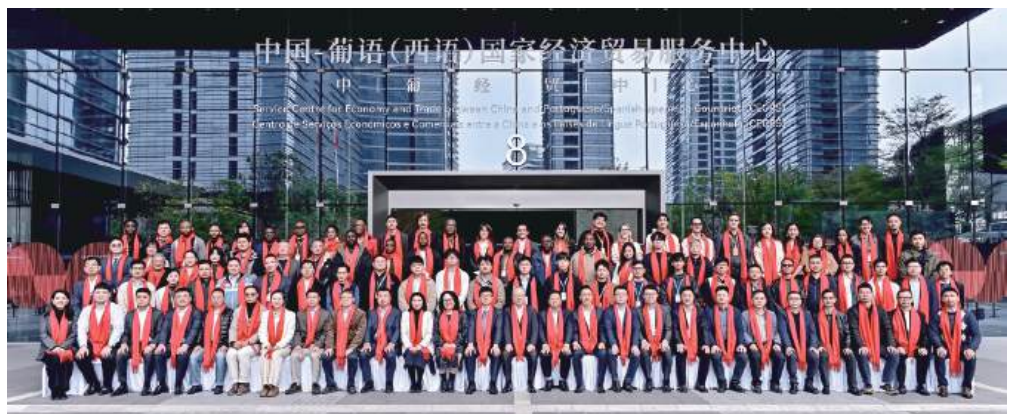
This handout photo provided by the Economic and Technological Development Bureau (DSED) yesterday shows guests and participants posing for a group photo during yesterday's opening ceremony of the "Practical Training Course in Artificial Intelligence (AI) with Huawei Certification under the Macau Technology Enterprises AI Transformation Digital Capacity Building Programme" in Hengqin.

Digital and Intelligent Transformation International Talent Training Base" was officially inaugurated, with representatives