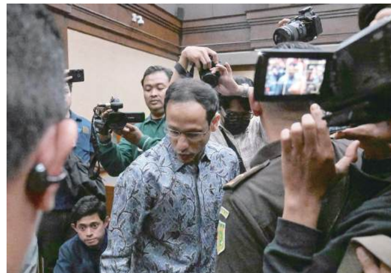
Indonesia's former education minister Nadiem Makarim (centre) attends his trial at the Corruption Court in Jakarta yesterday. Makarim, who is also a co-founder of ride-hailing app Gojek, is on trial for his involvement in a US$124 million corruption scandal linked to a government procurement project for school laptops during his tenure as education minister. – AFP

But with Suu Kyi still held in seclusion and her hugely popular party dissolved, democracy advocates say the vote has been rigged by a crackdown on dissent and a ballot stacked with military allies. – AFP