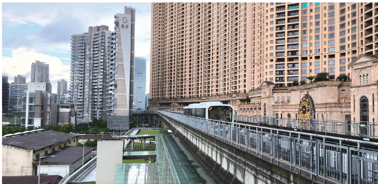
This file photo taken last year shows an LRT train leaving Jockey Club Station in Taipa.

According to the statement, residents can submit their opinions and suggestions by filling in the opinion form on the dedicated website. Alternatively, the statement said, they can also choose to provide their opinions and suggestions by mail, fax, email or phone,