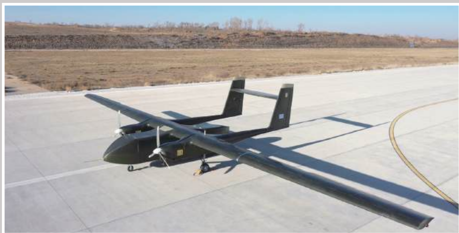
This video screenshot shows the "Tianma-1000" unmanned transport aircraft after its maiden flight on Sunday. Developed by Xi'an ASN Technology Group Co. Ltd. under China North Industries Group Corporation, the "Tianma-1000" integrates logistics transport, emergency rescue, and material delivery into a single platform. It is China's first unmanned aircraft capable of adapting to high-altitude complex terrain, achieving ultra-short takeoff and landing, and swiftly switching between cargo transport and airdrop modes, according to its developer.