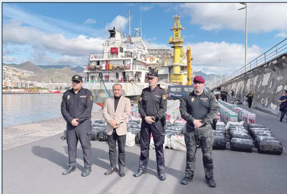
This undated handout photo released yesterday by Spanish National Police shows Spanish police officers posing in front of some of the nearly 10 tonnes of cocaine seized on a cargo ship that was sailing across the Atlantic between Brazil and Spain, at the port of Santa Cruz de Tenerife in Spain's Canary Islands. The authorities announced yesterday that they seized the largest cocaine seizure on the high seas ever made by the National Police, hidden among a shipment of salt on a cargo ship that had departed from Brazil, and arrested all 13 people on board.