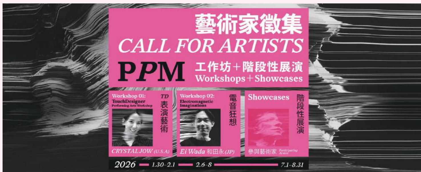
This poster recently provided by the organisers promotes the call for artists.

For registration, visit: forms.gle/arTh5AwZYtozh6ZA ■