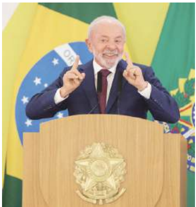
Brazil’s President Luiz Inácio Lula da Silva speaks during a breakfast with accredited journalists at the Presidential Palace in Brasília yesterday.