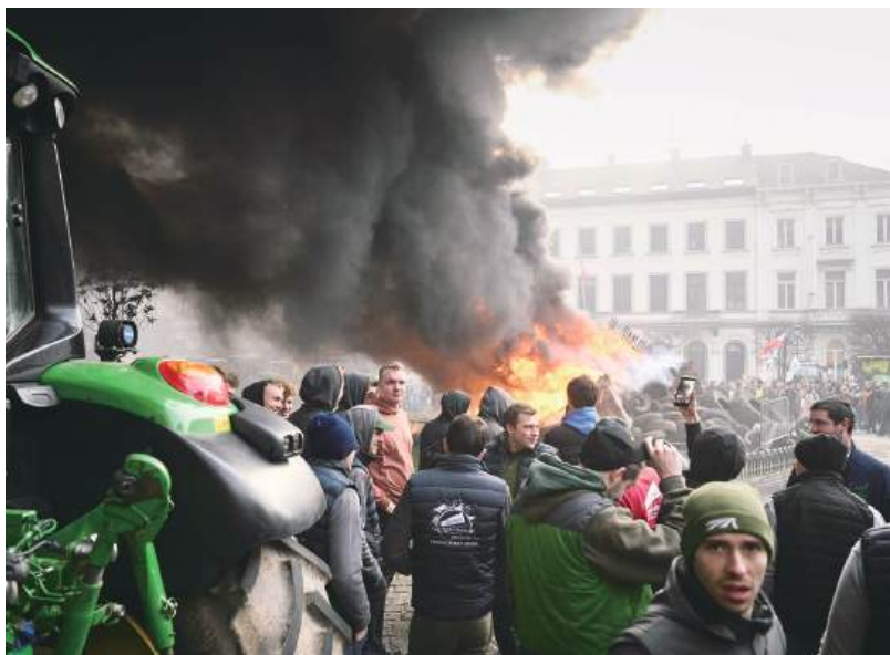
Farmers stand next to tractors and a fire near the European Parliament at the Place du Luxembourg, during a farmers’ protest to denounce the reforms of the Common Agricultural Policy (CAP) and trade agreements such as the Mercosur, in Brussels, yesterday, organised by Copa-Cogeca, the main association representing farmers and agricultural cooperatives in the EU.

The EU-Mercosur pact would create the world’s biggest free-trade area and help the EU to export more vehicles, machinery, wines and spirits to Latin America at a time of global trade tensions.