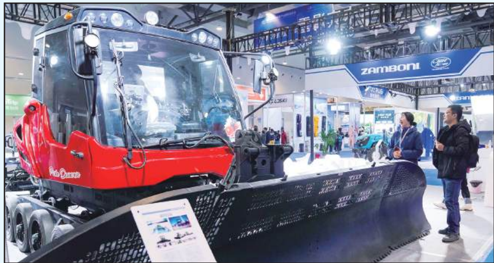
Fairgoers look at a China-made snow groomer at the 9 th Jilin International Ice and Snow Tourism Industry Exposition in Changchun, capital of Jilin Province, yesterday. The 9 th edition of the expo, with an exhibition area of over 60,000 square meters, kicked off yesterday. It showcases the vitality and prospects of Jilin's ice and snow-related business through immersive experiences in thematic pavilions. – Xinhua

This has not only severely affected the normal operations of Chinese enterprises in Europe but has also introduced uncertainty into China-EU bilateral economic and trade cooperation, the spokesperson added. – Xinhua