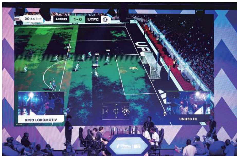
France's Team United FC (right) and Russia's team RFSO Lokomotiv compete in the digital part of the match between United FC and RFSO Lokomotiv at the Phygital games of the future Abu Dhabi, United Arab Emirates yesterday.

The government also passed a new national anti-doping bill to enhance enforcement, expand testing facilities and "ensure the highest standards of integrity" in sports.