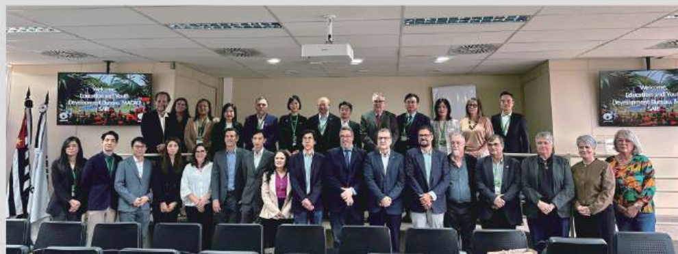
Delegation of Macao higher education leaders to Brazil in 2025

The DSEDJ has been actively strengthening international and regional educational cooperation to build a brand of higher education for Macao. Over the years, efforts have been made to expand and consolidate Macao's multi-sectoral education collaboration network with the international community, including regularly organising delegations of members of the higher education sector to PSCs for exchange and participation in education fairs.