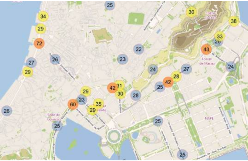
This handout image provided by the Public Security Police (PSP) on Wednesday shows differently coloured traffic accident blackspots on their new online map.

The statement also said that the updated version of the app has been uploaded to Apple iOS, Google Play and Huawei app stores and is