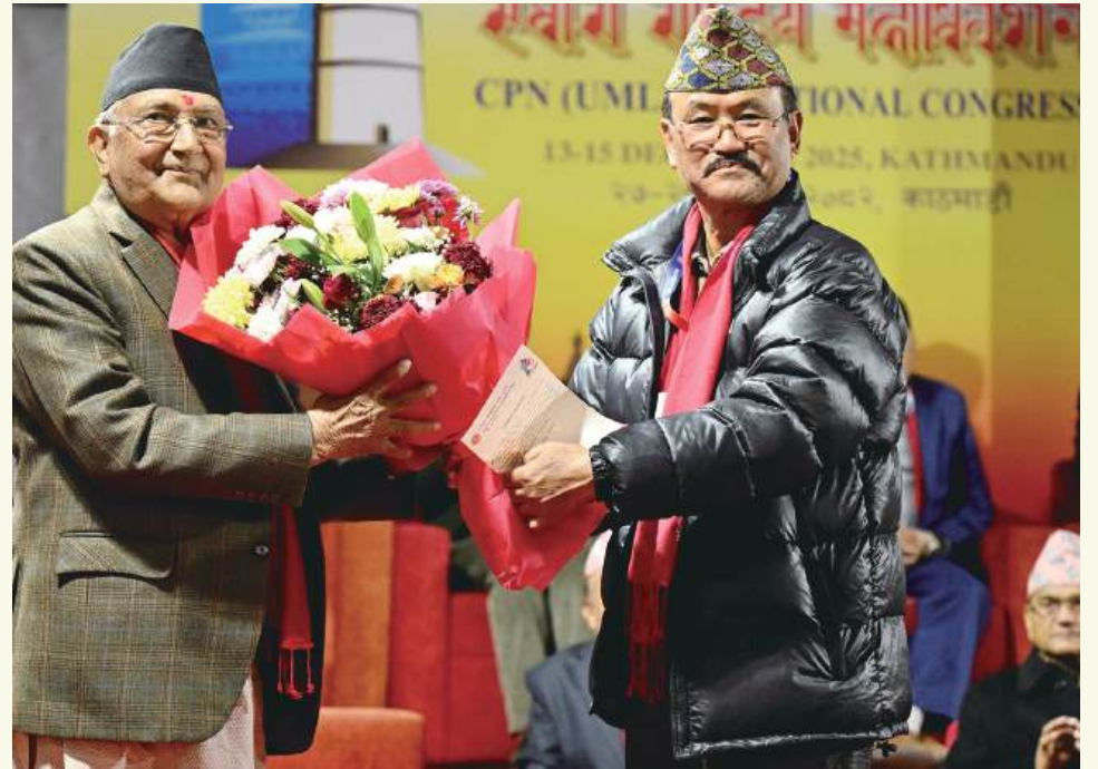
Former Nepali Prime Minister and newly elected leader of the Communist Party of Nepal - Unified Marxist Leninist (CPN-UML), KP Sharma Oli (left) receives flowers during the party's 11th general convention in Kathmandu yesterday. Members of ousted Nepali prime minister KP Sharma Oli's political party voted for him to retain leadership of the organisation yesterday, meaning he will oversee its preparations for national elections next year.

“The conflict between Thailand and Cambodia must not be allowed to spiral further. That's why the ceasefire needs to be immediately restored,” Kallas said.