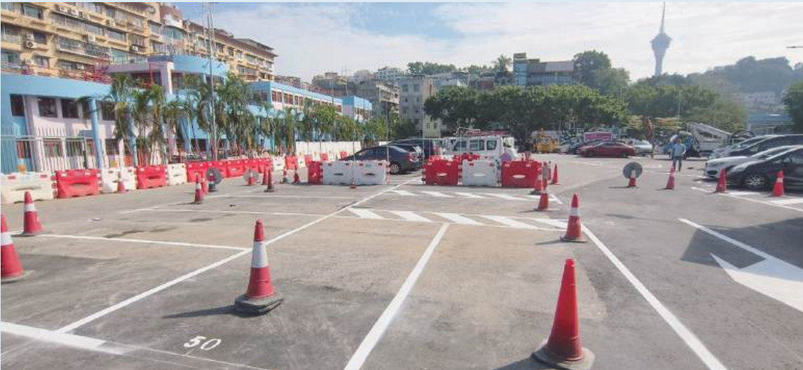
This undated handout photo provided by the Transport Bureau (DSAT) and Public Works Bureau (DSOP) yesterday shows the car park next to the Maritime Training School in Barra being converted into a managed public car park with gated access.