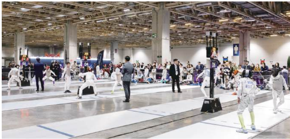
This undated handout photo provided by Sands China yesterday shows youths taking part in last year's "Sands China Asian Youth Elite Fencing League" at The Venetian Macao's Cotai Expo.

The Asian Youth Elite Fencing League aims to "develop the league into an Asian youth fencing ranking circuit, advancing sports development among young people in