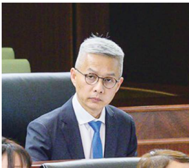
Secretary for Economy and Finance Anton Tai Kin Ip addresses yesterday's plenary session in the Legislative Assembly's (AL) hemicycle.

The government completed its first review of the minimum wage amount in 2023, assessing the implementation between November 1, 2020 and October 31, 2022. Later that year, the government submitted a minimum wage amendment bill proposing to raise the hourly amount by two patacas to 34 patacas an hour to the Legislative Assembly, which passed the bill in its final reading in December 2023. The current minimum wage of 34 patacas an hour has been in force