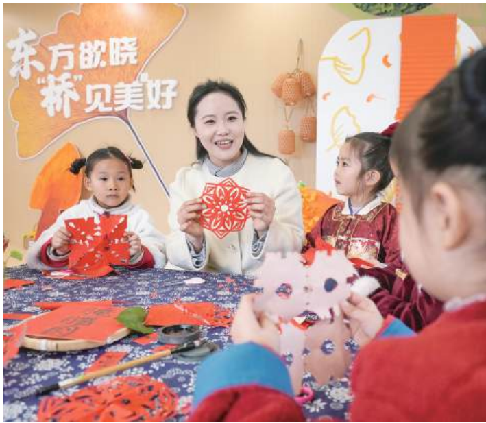
A teacher instructs children to make paper-cutting window decorations at a kindergarten in Taizhou City, Jiangsu Province, yesterday. People all over the country held diverse events yesterday to mark the Winter Solstice, which will fall on December 21 this year. Winter Solstice, the shortest day of the year, denotes the beginning of deep winter and a break from farming in traditional agricultural society in Chinese culture. Northern China has maintained the tradition of eating dumplings on this day, while people in southern China eat tangyuan (glutinous rice balls).