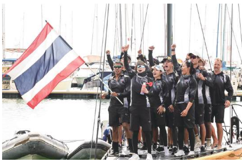
This pool photo taken and released yesterday shows Thailand's Queen Suthida (centre) celebrating with her team after winning the gold medal in the mixed keelboat SSL47 sailing event during the 33rd Southeast Asian Games (SEA Games) at the Ocean marina yacht club in Chonburi province. Queen Suthida, the wife of King Maha Vajiralongkorn, competed on a 47-foot (14-metre) sailboat with nine other crew members.