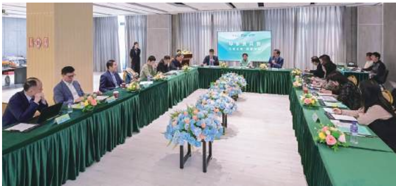
This handout photo provided by the University of Macau (UM) on Wednesday shows its first expert committee meeting on the newly launched 'Health+' Accelerator Programme at the public university in Hengqin on Tuesday.