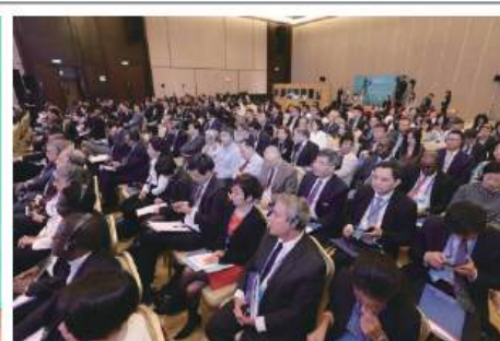
The DSEDJ organises the Forum for Rectors of Higher Education Institutions of China and Portuguese-Speaking Countries in collaboration with the Chinese-Portuguese Bilingual Talent Training Alliance

To continue the achievements of Macao's higher education institutions in fostering exchanges with PSCs and partner countries and regions of the Belt and Road Initiative (BRI), the DSEDJ organises visits every year for local higher education institutions to participate in major education fairs hosted in PSCs and BRI partner countries and regions, promoting Macao's higher education. At the events, the DSEDJ and Macao higher education institutions would set up separate booths to brief parents and students in those territories on Macao's positioning as 'One Centre, One Platform and One Base', advantages of Macao's role as a platform for cultural exchange between China and PSCs, an overview of education in Macao and information about featured programmes, attracting considerable attention from parent and student visitors.