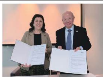
The University of Macau visited Brazil in 2025 and signed a cooperation agreement with the Federal University of Rio de Janeiro

Many international students and exchange participants from different countries and regions are opting to pursue learning in Macao, with the intention of experiencing the distinctive educational climate in Macao and the blend of Chinese and Western cultures.