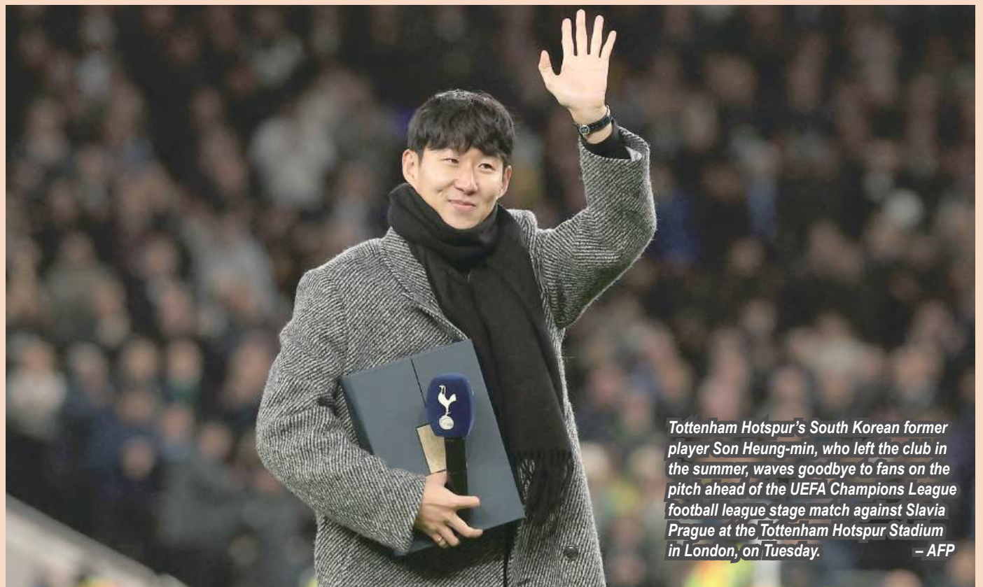
Tottenham Hotspur's South Korean former player Son Heung-min, who left the club in the summer, waves goodbye to fans on the pitch ahead of the UEFA Champions League football league stage match against Slavia Prague at the Tottenham Hotspur Stadium in London, on Tuesday.

"Sonny is a big legend at Tottenham, so when a guy like Sonny comes after he did everything, you give everything for him."