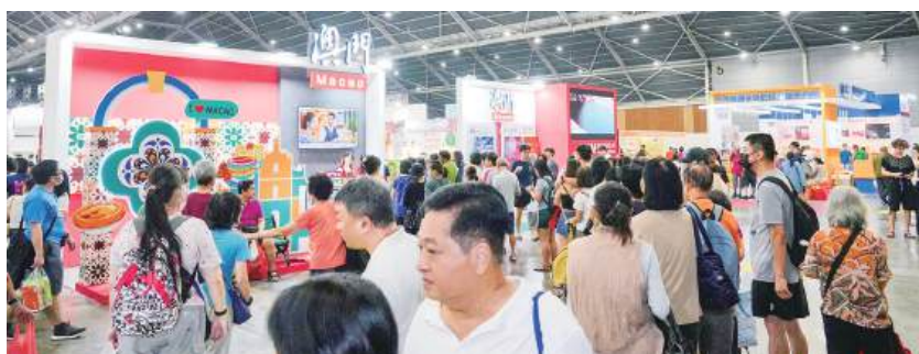
This undated handout photo recently provided by the Commerce and Investment Promotion Institute (IPIM) shows the Macao Pavilion during the “Asia Pacific Food Expo 2024”.

The Asia Pacific Food Expo, held at the Singapore Expo, is described in the statement as one of the region’s most influential food trade exhibitions. IPIM said in the statement that it will continue to organise and support local industries in participating in major international exhibitions to expand business opportunities. ■