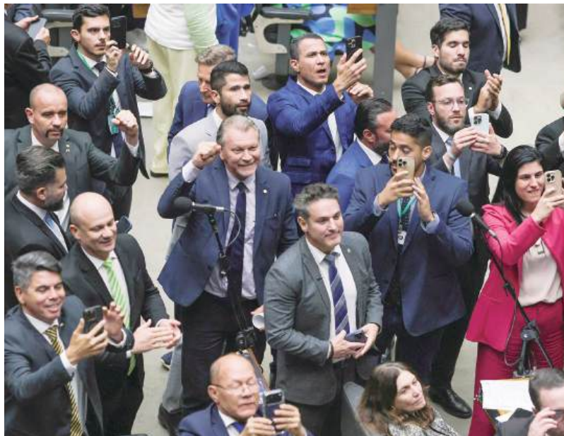
Lawmakers of Brazil’s lower house of Congress celebrate after approving a bill that could slash former president Jair Bolsonaro’s prison sentence for plotting a coup, in Brasília yesterday.