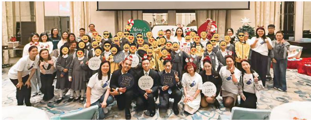
This undated handout photo provided by The Ritz-Carlton shows kids from the St. José Ka-Ho Children and Youth Home, guests and hosts during the 'A Merry Merry Kids'mas' celebration at The Ritz-Carlton in Cotai on Tuesday.