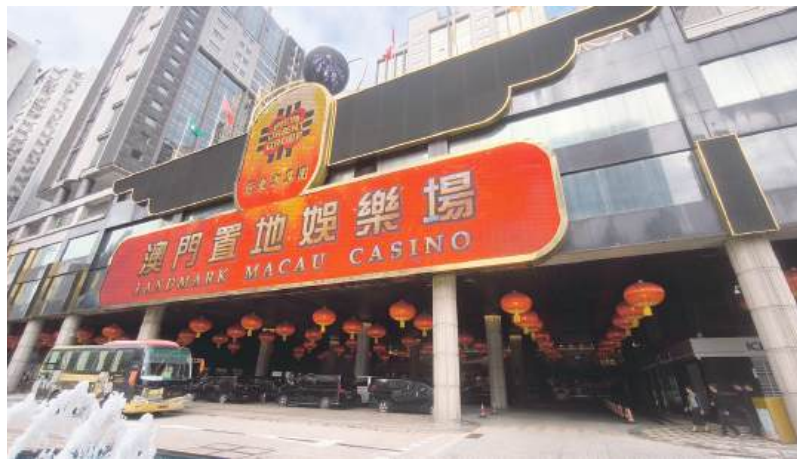
A tourist coach is parked outside New Orient Landmark Hotel on Avenida da Amizade in Zape late last month where Landmark Casino is housed on three podium floors.

The three respective gaming concessionaires, SJM, Galaxy, and Melco, decided in June to terminate the operations of all 11 satellite casinos before the expiration of the transition period based on their