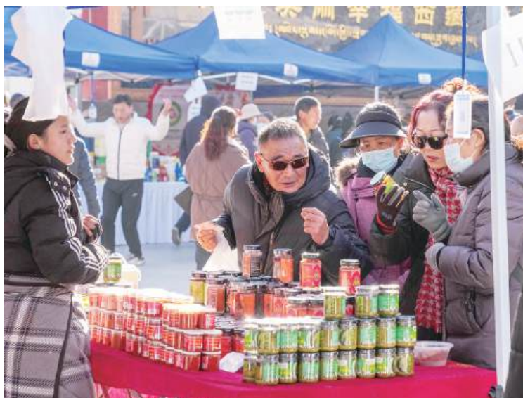
People select products during a supply and marketing fair at a park in Lhasa, the capital city of China's Xizang Autonomous Region, yesterday. The event has gathered more than 1,000 characteristic agricultural products from Xizang, including highland barley products, yak meat products, dairy products and so on, providing a platform for farmers and herdsmen to increase their income and people to purchase authentic specialties. – Xinhua

“We urge the relevant country to face up to and resolve their own severe human rights issues, take a constructive part in the international cooperation in human rights, and stop interfering in other countries’ internal affairs under the pretext of so-called human rights issues,” Guo said. – Xinhua