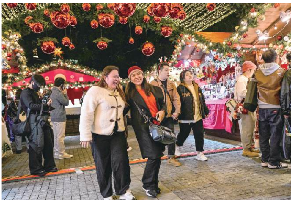
Shoppers visit a Christmas market in Shanghai’s Huangpu district yesterday.

* “One Centre, One Platform, One Base” is the local government’s strategic development blueprint for Macau – a World Centre of Tourism and Leisure; a Commercial and Trade Cooperation Service Platform between China and Portuguese-speaking Countries (PSCs); a Base for Exchange and Cooperation with Chinese Culture as the Mainstream and Coexistence of Diverse Cultures. – DeepSeek