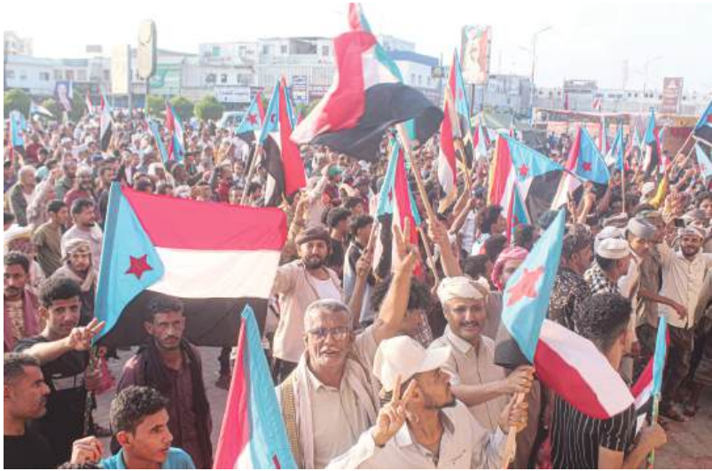
Yemeni supporters of the UAE-backed Southern Transitional Council (STC), which wants to revive an independent South Yemen, wave the old South Yemen flag, as they rally in Al-Aroud Square demanding a "second independence", in the coastal port city of Aden on Monday.