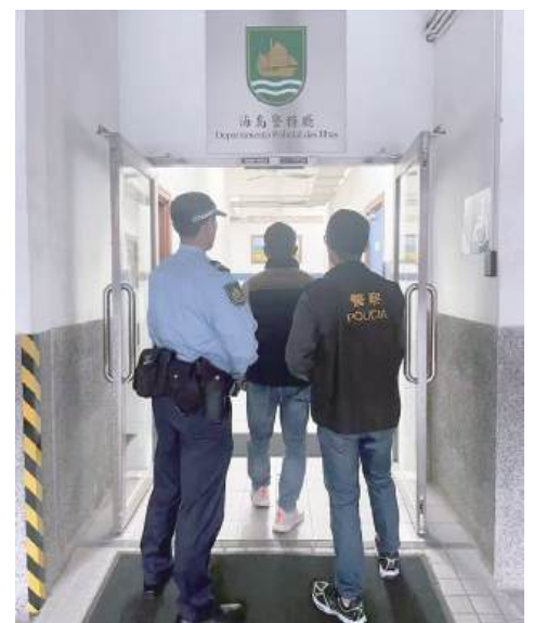
This undated handout photo provided by the Public Security Police (PSP) yesterday shows PSP officers escorting the theft suspect into a police station.