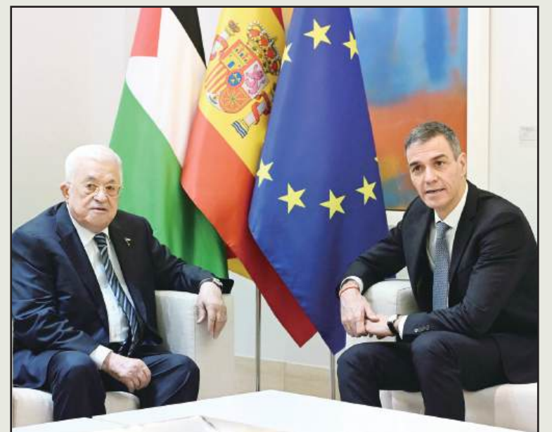
Spanish Prime Minister Pedro Sánchez (right) meets with Palestinian Authority President Mahmoud Abbas at the Moncloa Palace in Madrid yesterday.