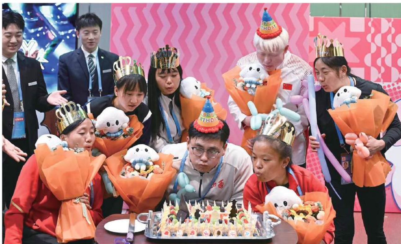
Participants blow out candles during a birthday celebration held for athletes at the 12 th National Games for Persons with Disabilities and the 9 th National Special Olympic Games in Guangzhou, Guangdong Province, yesterday.