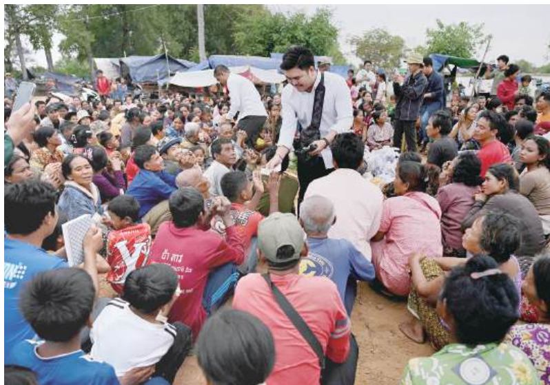
People gather to receive aid at a temporary camp after they evacuated amid clashes along the Cambodia-Thailand border in Cambodia's Siem Reap province yesterday. Half a million evacuees in Cambodia and Thailand were sheltering in pagodas, schools and other safe havens yesterday after fleeing renewed fighting in a century-old border dispute in which US President Donald Trump has vowed to again intercede.

A truce was reached in July following intervention by US President Donald Trump, "but you can see how long that lasted. I don't trust it anymore," added the Thai farmer.