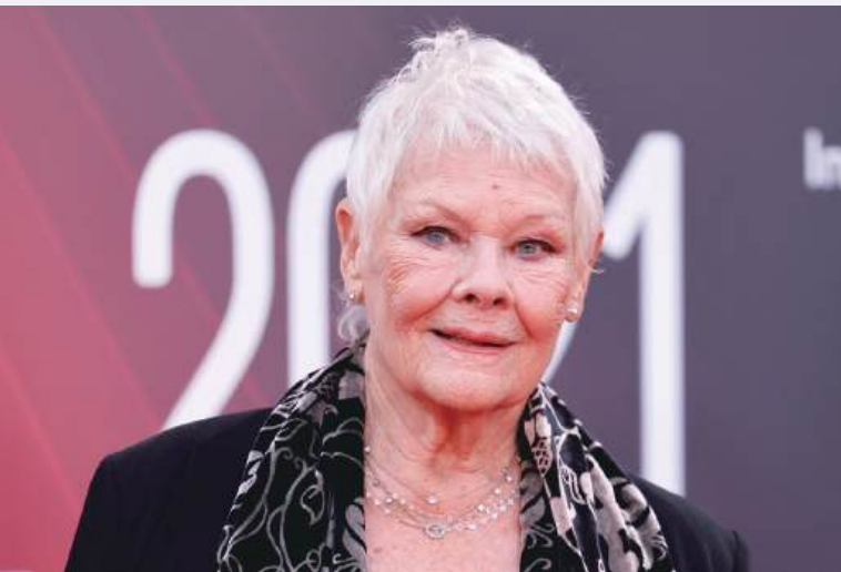
British actor Judi Dench poses on the red carpet on arrival to attend the European premiere of the film ‘Belfast’, during the 2021 BFI London Film Festival in London on October 12, 2021.

Also an acclaimed stage actress, she said she can still remember reams of Shakespeare but “can’t remember what I’m