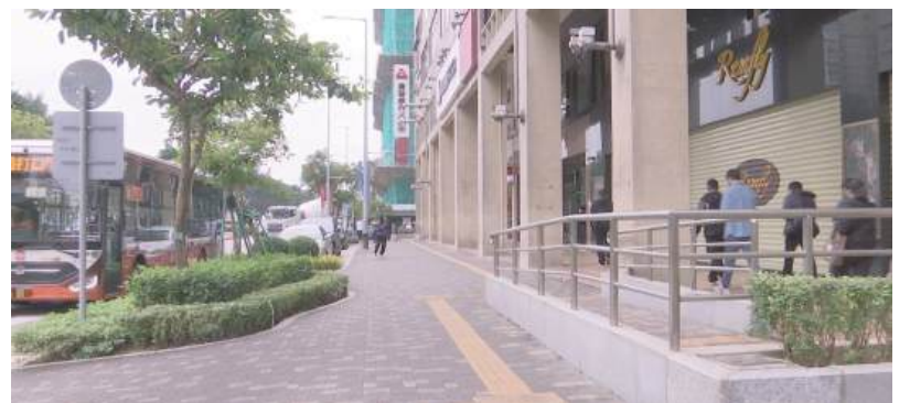
This undated file photo shows pedestrians walking on the pavement in Alameda Dr. Carlos D'Assumpção in Nape.

The bureau indicated earlier this year that it was studying the feasibility of setting up no-smoking zones in more outdoor public areas with dense pedestrian flows. ■