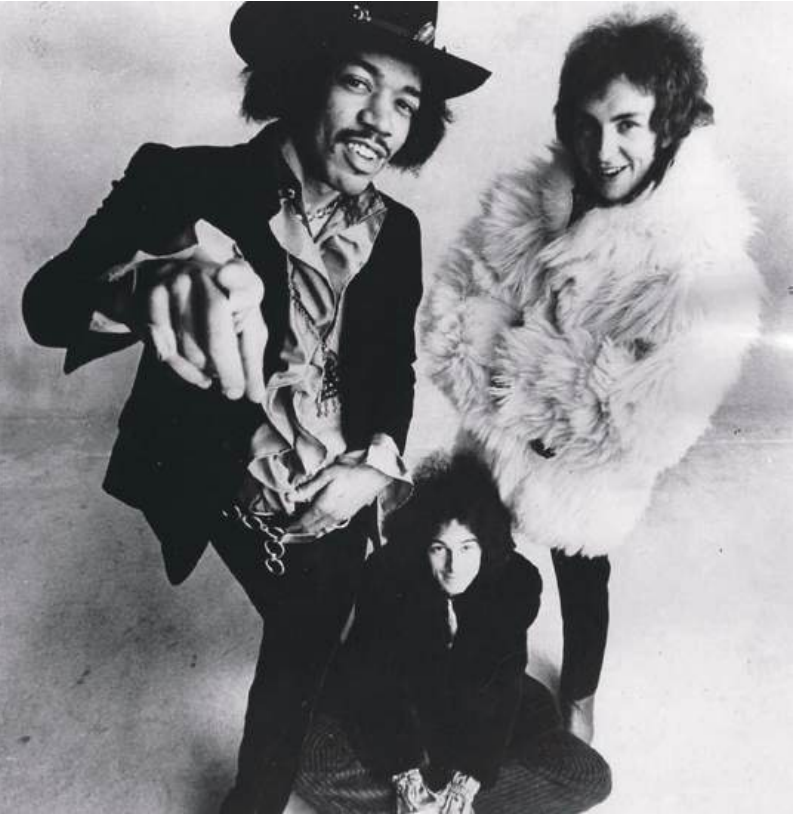
US guitarist, singer and songwriter Jimi Hendrix (left) poses with British bassist Noel Redding (right) and British drummer Mitch Mitchell in 1968. Promotional photo of The Jimi Hendrix Experience.