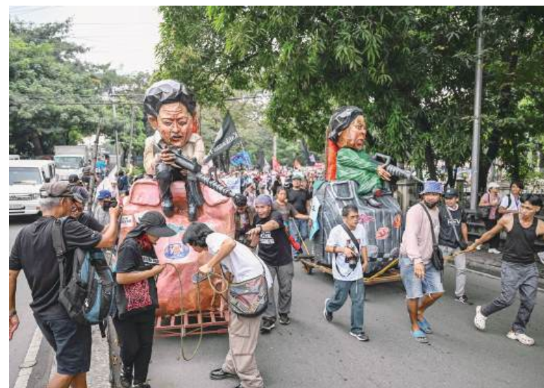
People march with effigies of Philippines' Vice President Sara Duterte and Philippines' President Ferdinand Marcos during a protest held to mark the International Human Rights Day in Manila yesterday.

It also fired similar weapons minutes before President Lee held talks with Chinese leader Xi Jinping in November, Seoul said.