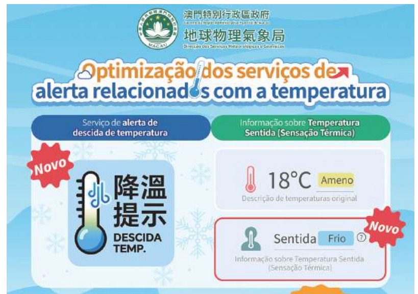
This image provided by the Meteorological and Geophysical Bureau (SMG) yesterday shows its new “temperature drop alert” and “feels-like temperature” indicator.

As of yesterday, the new alert and indicator were only available in Chinese and Portuguese. There was no announcement about whether and when both new features will be available in English as well, considering that tourism is one of Macau’s main breadwinners, based on its officially declared aim of becoming a World Centre of Tourism and Leisure. ■