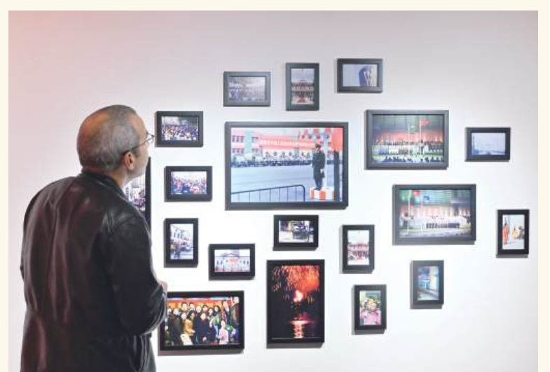
A gallerygoer views a set of images displayed among the photos unveiled yesterday in Pedro Ramos’ “Macau’s Reflections - Now and then” at the Portuguese Bookshop.