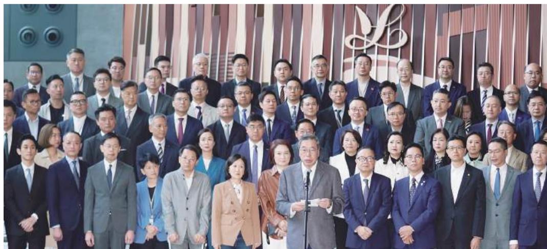
Andrew Leung Kwan-yuen (front), president of the seventh-term Legislative Council (LegCo) of the Hong Kong Special Administrative Region (HKSAR), speaks at a press briefing in Hong Kong yesterday. Members of the eighth-term LegCo of the HKSAR are expected to work with the HKSAR government to inject more vitality into Hong Kong's development, Leung said.