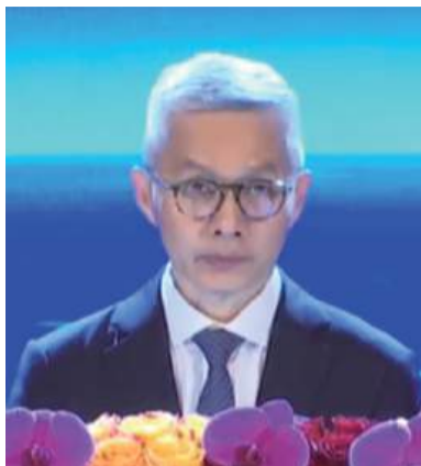
Secretary for Economy and Finance Anton Tai Kin Ip addresses yesterday's opening ceremony of the 4 th Guangdong-Hong Kong-Macao Greater Bay Area Finance Forum at Wynn Palace in Cotai.

Regarding wealth management, Tai noted, a new law regulating investment funds will take effect next month, further optimising the