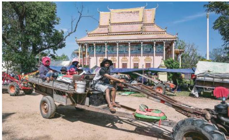
Residents gather outside a temple after they evacuated following clashes along the Cambodia-Thailand border, in Siem Reap province yesterday.

Thailand last month paused the pact's implementation – accusing Cambodia of laying fresh mines in