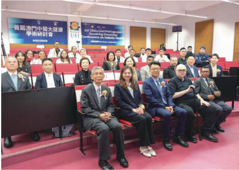
shows hosts, participants and guests posing during the "1st China and Portuguese Speaking Countries (PSCs) Conference on Holistic Health" at the private Catholic university's Don Bosco Auditorium on its Ilha Verde campus last Friday.