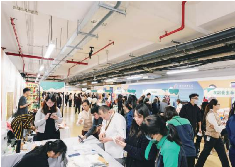
This photo provided by Galaxy Entertainment Group (GEG) shows the "Made in Macau" Market taking place at the back-of-house area of Galaxy Macau in Cotai recently.

The statement added that GEG plans to host a Coffee Expo at the Galaxy International Convention Centre (GICC) in January, with details to be announced soon. A logo and name design contest has been launched for the expo, with the winning entry to be featured across all promotional materials. ■