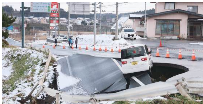
A vehicle rests on the edge of a collapsed road in Tohoku town in Aomori Prefecture yesterday, following a 7.5 magnitude earthquake off northern Japan.

Initially there were reports of several fires but government spokesman Minoru Kihara said yesterday there