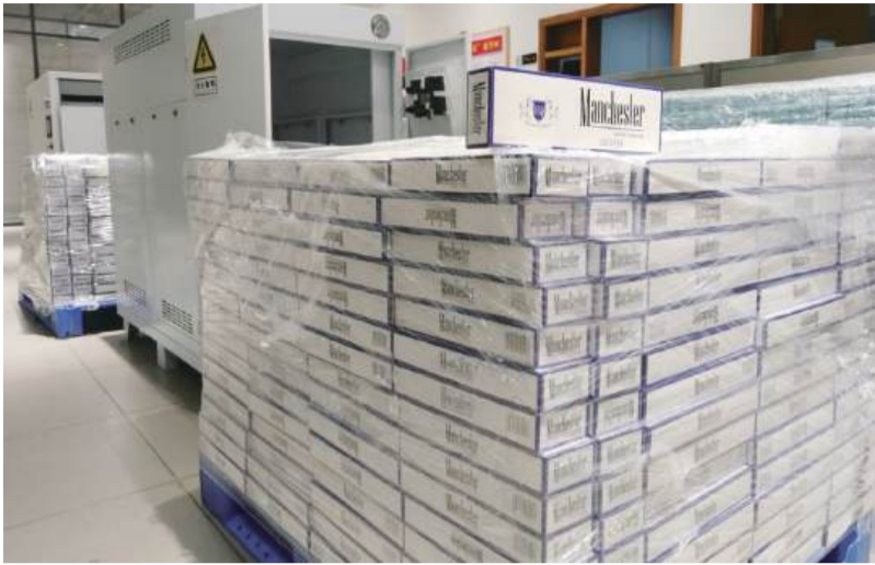
This undated handout photo provided by Zhuhai Gongbei Customs yesterday shows the Manchester cigarettes seized by its officers at HZMB Zhuhai Port (checkpoint) on November 29.

Gongbei Customs reminded the public that in line with the Chinese