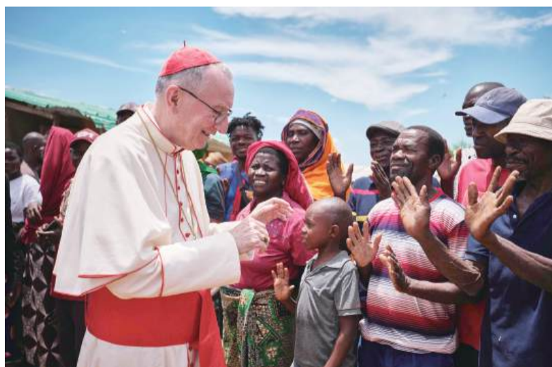
The Vatican’s Secretary of State Cardinal Pietro Parolin (left) meets displaced persons at a shelter in Naminawe, 30 km southwest of Pemba, a port city in northern Mozambique, yesterday. Cardinal Parolin is in Mozambique to mark the 30 th anniversary of the establishment of diplomatic relations between the Holy See and the Southern African nation. Northern Mozambique has been battered by a bloody jihadist insurgency since late 2017. The group often referred to as “Al-Shabaab” by locals and authorities – despite no known link to the Somali jihadist group – seeks to impose Sharia law in Cabo Delgado, a neglected outpost that has become fertile ground for radical islamism. – AFP

The plan won the backing of a coalition of countries including France, the Marshall Islands and Spain, several of which are due to hold a conference in Colombia in April 2026 on ending fossil-fuel use. – AFP