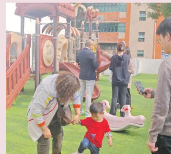
This photo provided by the School of the Nations yesterday shows attendees engaging in activities during the Kindergarten Public Information Day.