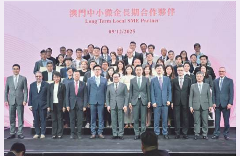
Guests and representatives pose with Sands China's long-term business partners yesterday at The Londoner Macao in Cotai.