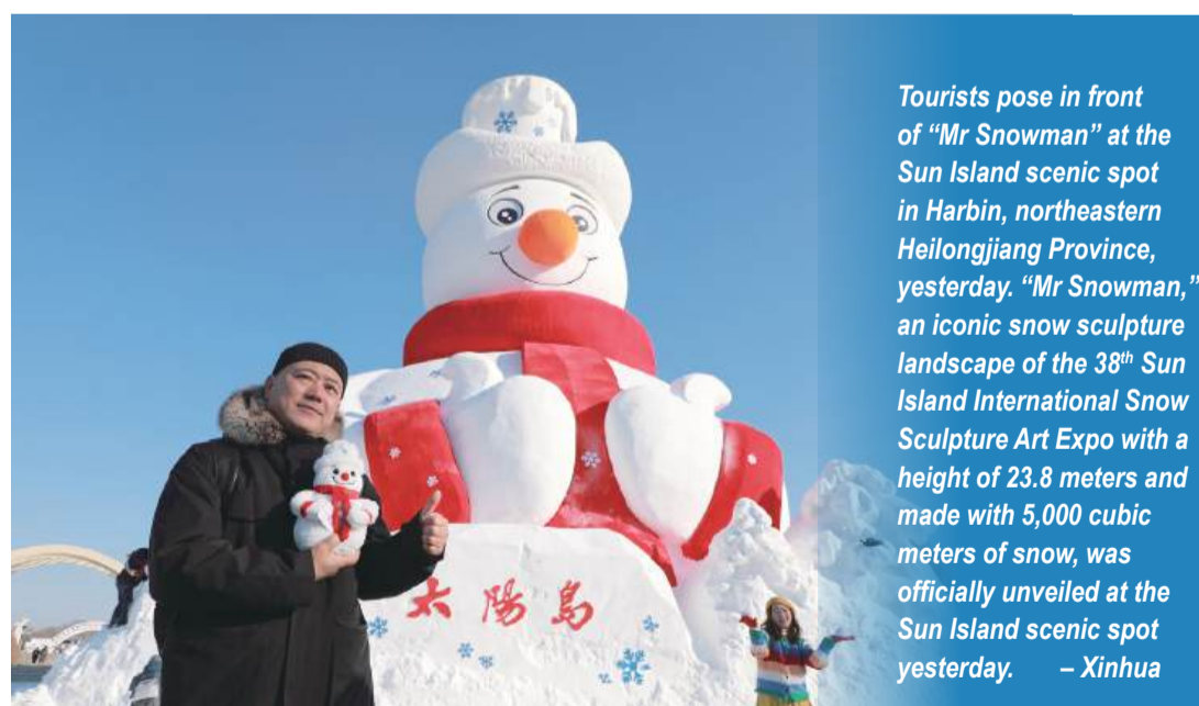
Tourists pose in front of "Mr. Snowman" at the Sun Island scenic spot in Harbin, northeastern Heilongjiang Province, yesterday. "Mr. Snowman," an iconic snow sculpture landscape of the 38 th Sun Island International Snow Sculpture Art Expo with a height of 23.8 meters and made with 5,000 cubic meters of snow, was officially unveiled at the Sun Island scenic spot yesterday.