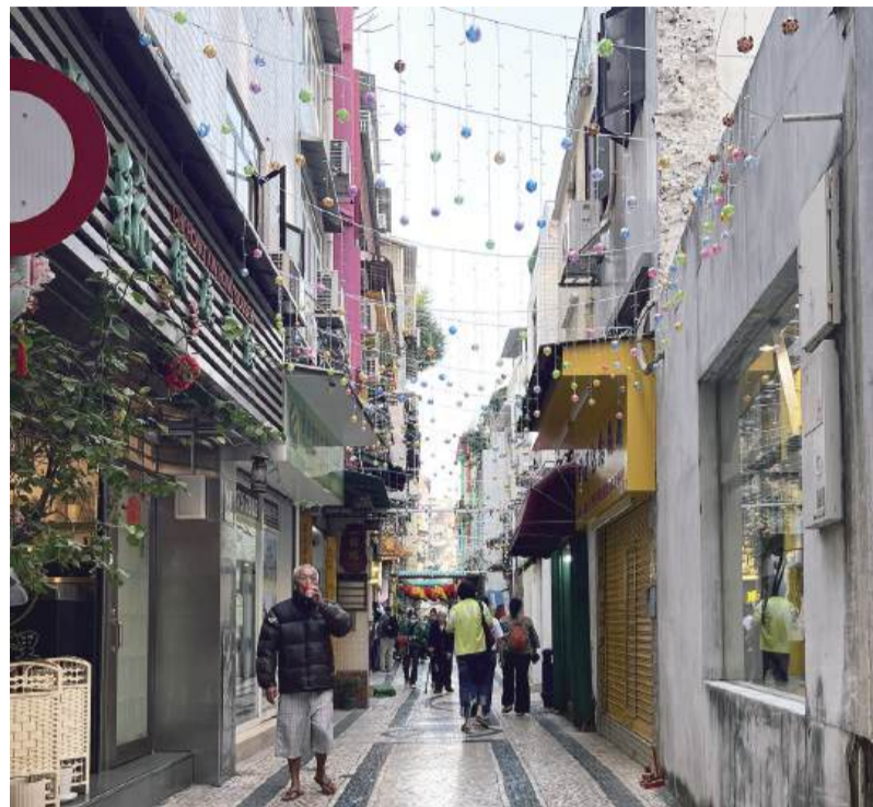
Pedestrians walk past shops on Rua dos Ervanários ("Road of the Herbalists") in the UNESCO-listed Historic Centre of Macau's "Laahn Gwai Lau" neighbourhood yesterday.