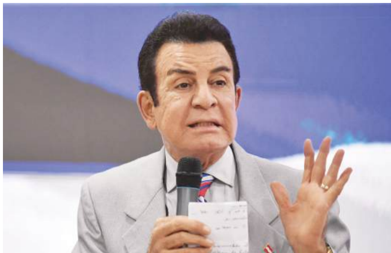
Salvador Nasralla, presidential candidate for the opposition Liberal Party, speaks to supporters in Tegucigalpa on December 5, 2025.

Nasralla claimed “the corrupt ones are the ones holding up the