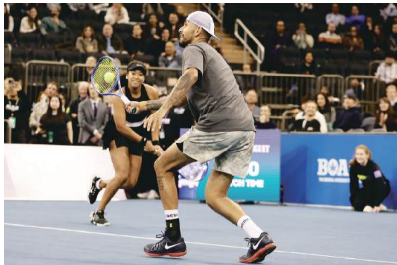
Nick Kyrgios of Australia returns a shot playing with Naomi Osaka of Japan against Aryna Sabalenka of Belarus and Tommy Paul of the United States in a mixed doubles match during the Garden Cup at Madison Square Garden on Monday in New York City.

The All Blacks will play their home Bledisloe Cup Test against Australia at Eden Park, Auckland, on October 10 with the return in Sydney a week later.