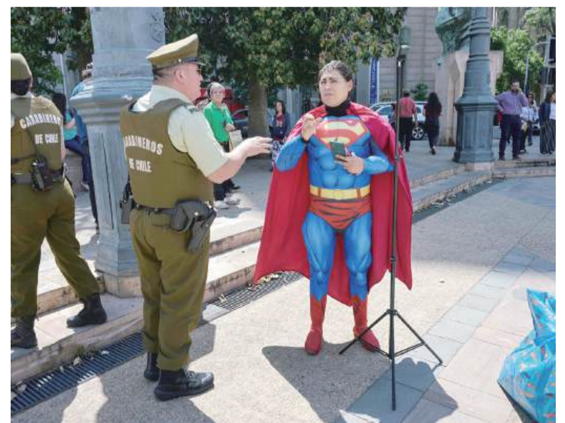
A police officer asks for identification from a cosplayer dressed up as comic character Superman recording a video outside La Moneda Presidential Palace in Santiago de Chile yesterday.

Joropo was declared a Venezuelan national cultural asset in 2014.