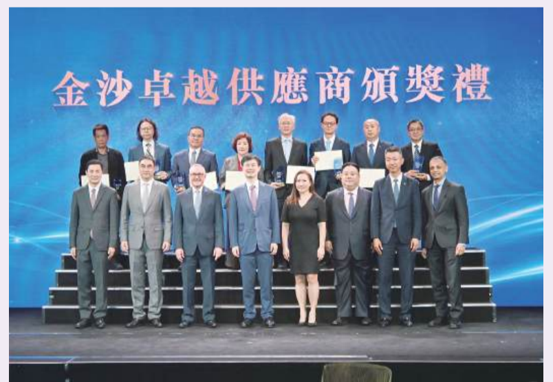
Guests and representatives pose with the prize recipients included in the 2025 Sands Supplier Excellence Awards.

promotion and training". He added that the F.I.T programme's Sands Procurement Academy has held 18 sessions with participation from over 660 local enterprises.