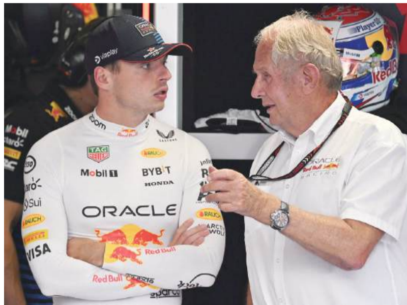
Red Bull Racing's Dutch driver Max Verstappen speaks with director of the Red Bull Formula One teams Helmut Marko (right) during second practice session, ahead of the Italian Formula One Grand Prix at Autodromo Nazionale Monza circuit, in Monza on August 30, 2024.

"Names like Sebastian Vettel and Max Verstappen stand for the many drivers who were discovered, supported, and guided to the very top under his leadership.