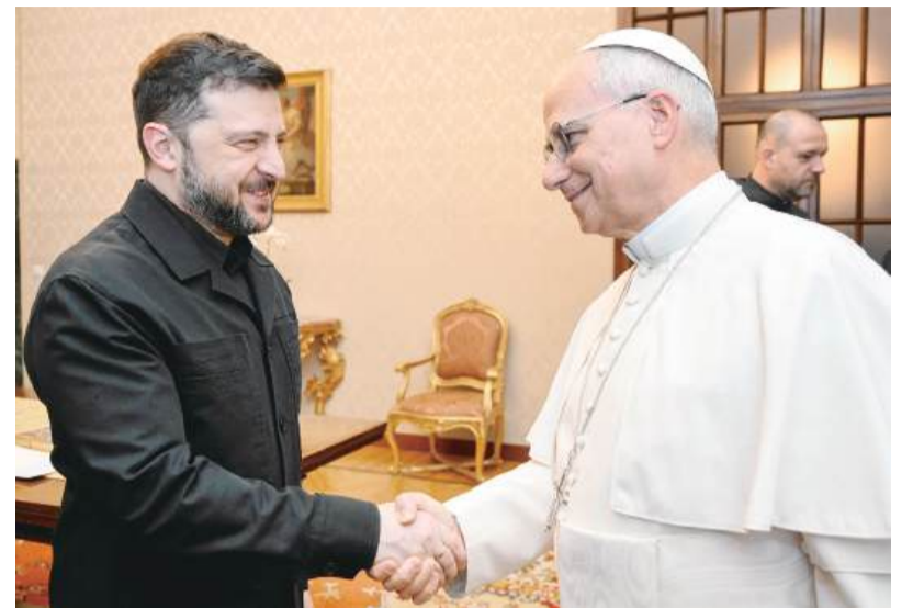
Pope Leo XIV (right) shakes hands with Ukraine's President Volodymyr Zelensky at the Vatican's Castel Gandolfo papal residence yesterday.

Washington's proposals involved Ukraine surrendering land that Russia has not yet captured – the entire Donbas region – in return for security promises that fall short