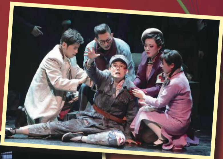
These undated photos showcase scenes from previous performances of the national opera "March of the Volunteers".