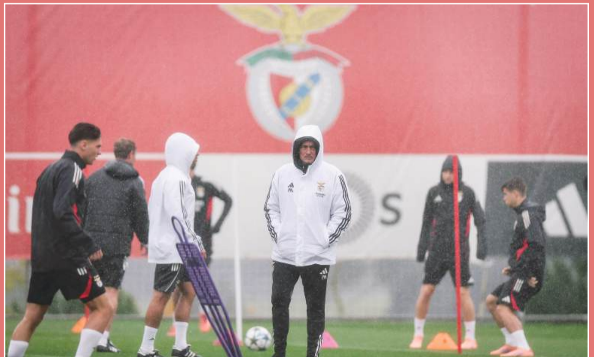
Benfica's coach Jose Mourinho attends a training session at Benfica Campus, training centre, in Seixal, on the outskirts of Lisbon yesterday, on the eve of the UEFA Champions League match against SSC Napoli. The game will be played at 4 a.m. tomorrow morning Macau time.