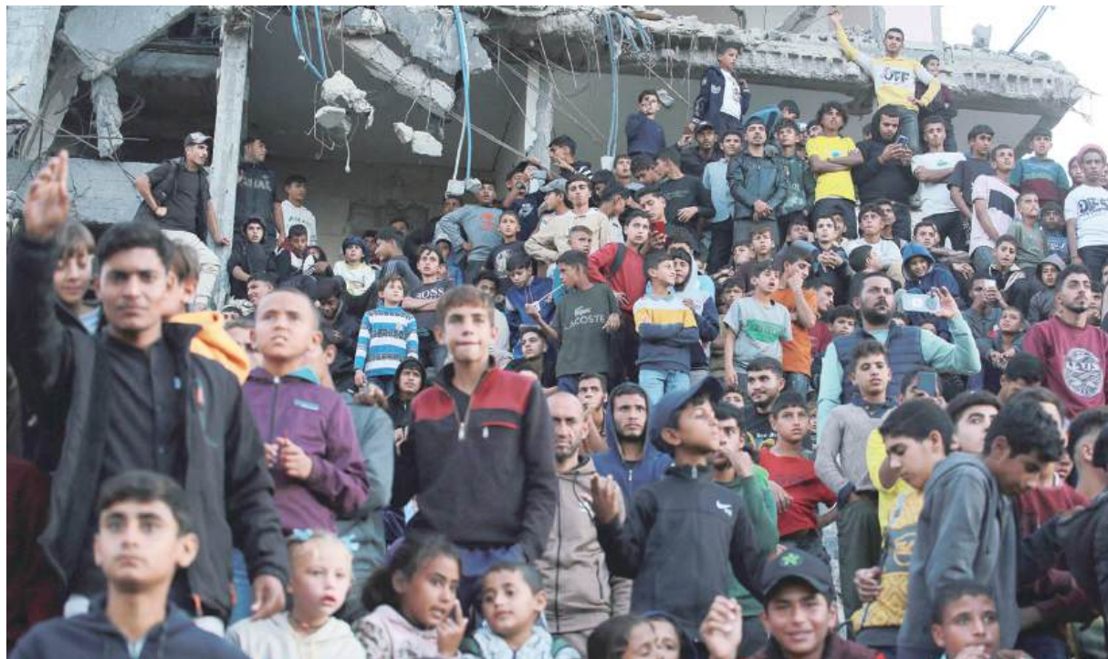
Palestinians gather on the rubble of a building destroyed by the Israeli military as they watch and celebrate the mass wedding of 54 couples dubbed the “The Dress of Joy”, organised by the Al-Fares Al-Shahm Foundation, in Khan Yunis, southern Gaza Strip, yesterday. ‘The Dress of Joy’, is a project helping 54 grooms in the Gaza Strip to get married, an initiative coinciding with the United Arab Emirates’ (UAE) 54 th National Day.