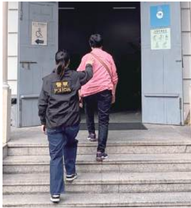
This undated handout photo provided by the Public Security Police (PSP) yesterday shows a PSP officer escorting the theft-by-finding suspect into a police station.