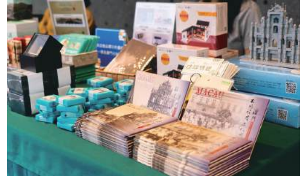
These two undated handout photos provided by the Cultural Affairs Bureau (IC) yesterday in connection with the upcoming Macau Book Festival show a “Yoga with Pet” session (left) and a stall of local creative products.