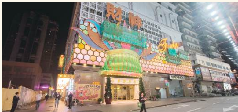
A woman crosses the road outside Fortuna Casino in Zape last week.

In 2021, Macau reached its historical peak of 42 casinos. At the end of this month, it will stand at 20 run by the six rival gaming concessionaires. ■