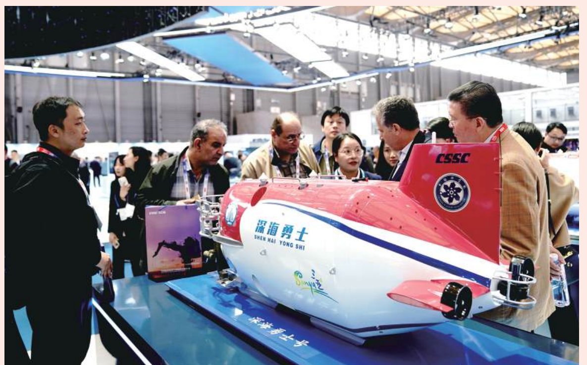
Fairgoers look at a model of the manned submersible Shenhai Yongshi ("Deep Sea Warrior") at the Marintec China 2025 exhibition at Shanghai New International Expo Center in Shanghai yesterday. Attracting over 2,200 enterprises from 16 countries and regions, the event kicked off yesterday and will conclude on Friday.