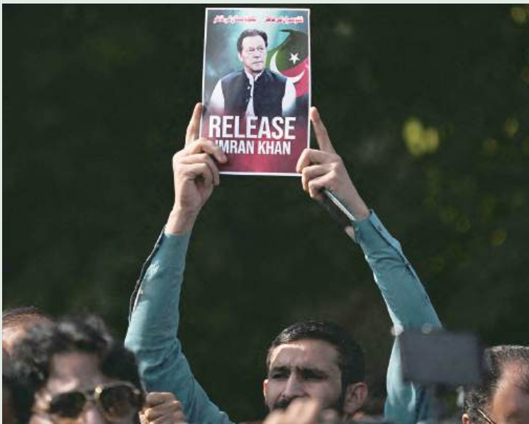
Pakistan Tehreek-e-Insaf (PTI) party supporters protest to demand the release of their jailed leader and Pakistan’s former prime minister Imran Khan, in Islamabad, Pakistan yesterday.