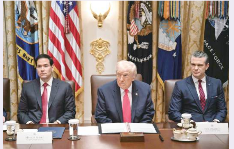
US President Donald Trump (centre), alongside Secretary of State Marco Rubio (L) and Secretary of Defence Pete Hegseth, chairs a cabinet meeting in the Cabinet Room of the White House in Washington, DC, yesterday.