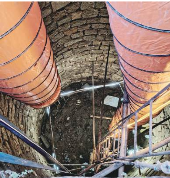
This photo taken on Monday shows the ancient well in Chi Lam Vai that still undergoing its second cleanup.