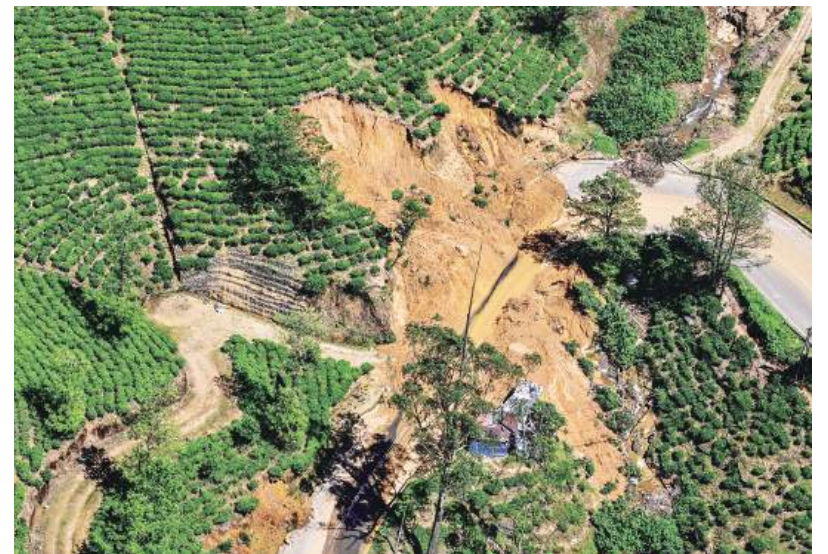
An aerial view shows a washed-out road following a landslide in Nuwara Eliya, 100 kilometres east of Colombo, Sri Lanka yesterday.

In some places, entire slopes have been sheared away, leaving