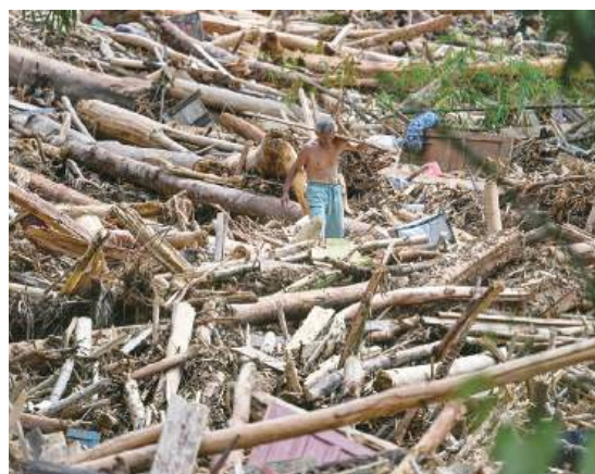
A villagers affected by flash floods walk amongst piles of logs at Tukka village, Central Tapanuli, North Sumatra province, Indonesia yesterday. The death toll from floods and landslides that have struck Indonesia's Sumatra island since last week has risen to 712, the National Disaster Management Agency said yesterday.