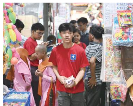
A volunteer for independent candidate Sandar Min, former parliament member of the National League for Democracy (NLD) party, walks through a market during campaigning ahead of Myanmar's general election in Yangon yesterday. — AFP

Last month Yonhap News Agency reported that South Korean authorities suspected a North Korean hacking group may be behind the recent cyberattack on cryptocurrency exchange Upbit, which led to the unauthorised withdrawal of 44.5 billion won in digital assets. — AFP