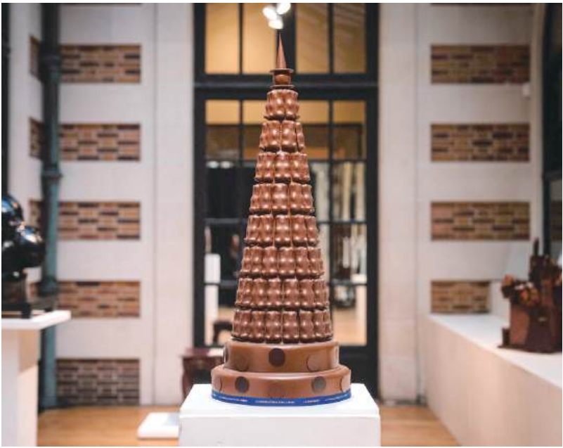
This photograph taken on Friday in Paris shows an artwork of chocolate pastry made by France’s pastry chef Cyril Lignac displayed three days ahead of an auction of 25 chefs’ pastries for the benefit of the BAB Charity association, which works for the well-being and development of children with leukaemia who are hospitalised at the Armand Trousseau Hospital in Paris.