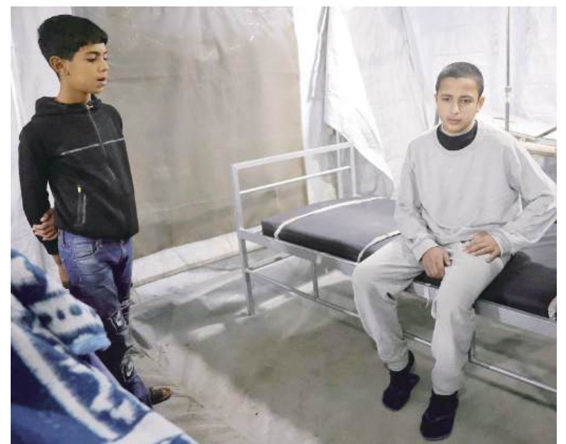
A Palestinian youth who was released from an Israeli prison under as a Gaza ceasefire and hostage exchange deal sits on a bed in a medical centre in Khan Yunis, in the southern Gaza Strip, yesterday. The ceasefire which came into effect on October 10 remains fragile, with Israel and Hamas accusing each other of violating the terms, while the Gaza Strip remains in a deep humanitarian crisis.

A decision will be handed down at an unspecified future date.