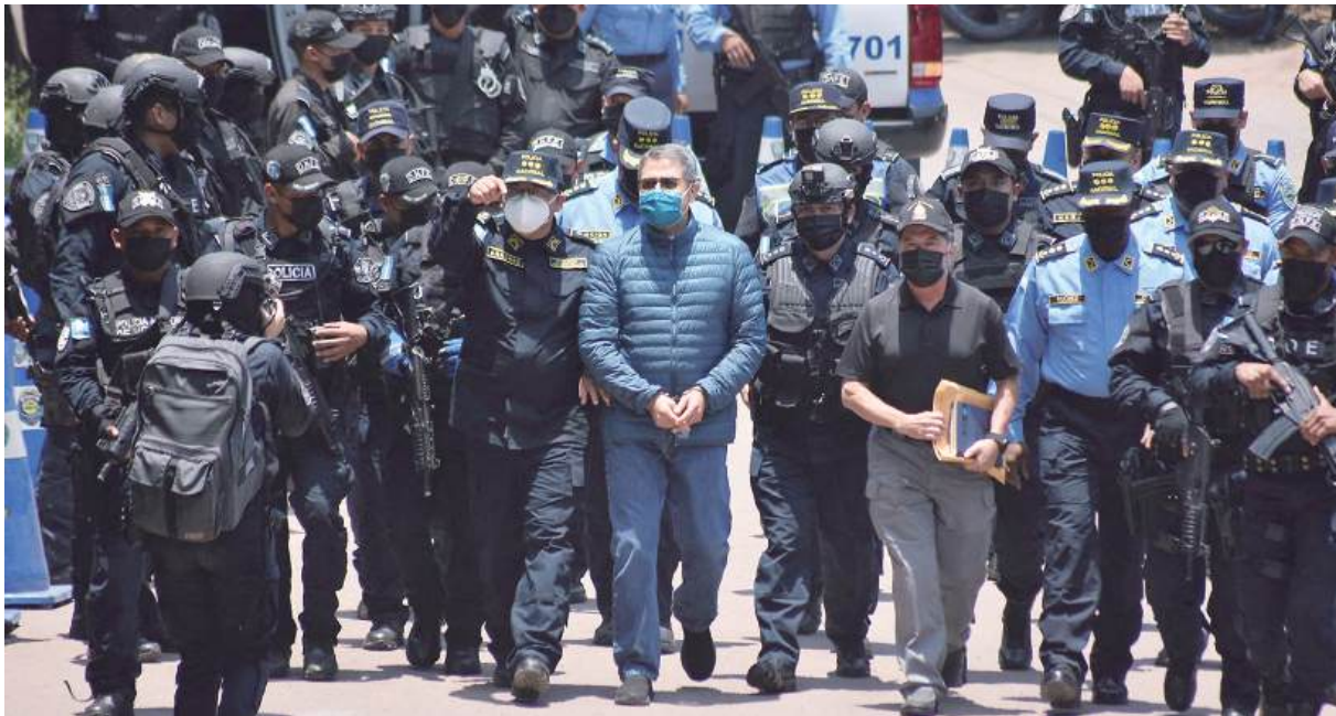
Former Honduran president Juan Orlando Hernández (centre) is escorted by police officers at the Honduran National Directorate of Special Forces before his extradition to the US to face drug-trafficking related charges, in Tegucigalpa, on April 21, 2022. Hernández was released from a West Virginia prison on Monday and was "once again a free man," his wife announced on social media.