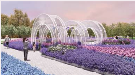
This artist's rendition provided by the Municipal Affairs Bureau (IAM) yesterday promotes the upcoming Winter Flower Show 2025 in Avenida da Praia in Taipa.

The bureau encouraged locals and tourists alike to check schedule details and workshop availability on the IAM website ( www.iam.gov.mo ) or the Macao Nature website ( https://nature.iam.gov.mo ), or to call 2833 7676 or 2888 0087 for enquiries. ■