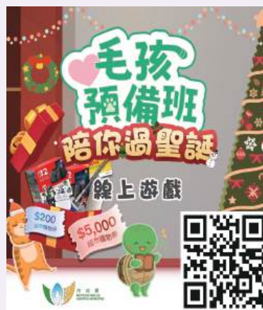
This handout image provided by the Municipal Affairs Bureau (IAM) shows its online prize-giving quiz launched yesterday and ending next Wednesday.