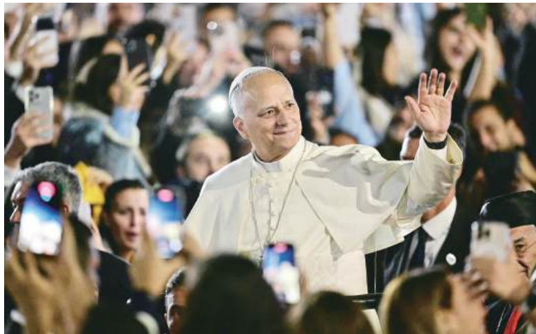
Pope Leo XIV waves to a crowd of young people upon his arrival at the Maronite Patriarchate in Bkerke, north of the capital Beirut, yesterday.

"For the world, we ask for peace. We especially implore it for Lebanon and for the entire Levant," Leo said earlier yesterday from a monastery in Annaya hosting the tomb of Saint Charbel, who enjoys