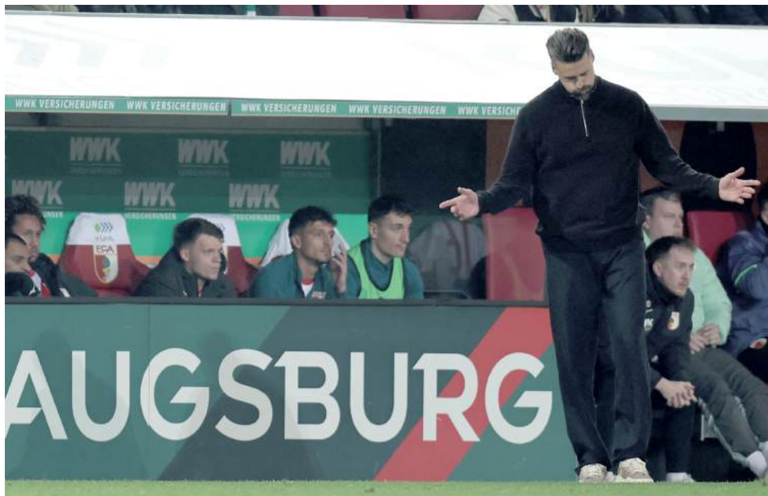
Augsburg's German head coach Sandro Wagner reacts at the end of the German first division Bundesliga match against Borussia Dortmund in Augsburg, southern Germany on October 31. Crisis-stricken Bundesliga club FC Augsburg has parted ways with coach Wagner. The 38-year-old had only taken over the position in the summer. After twelve match days, FCA is in 14th place with just ten points.