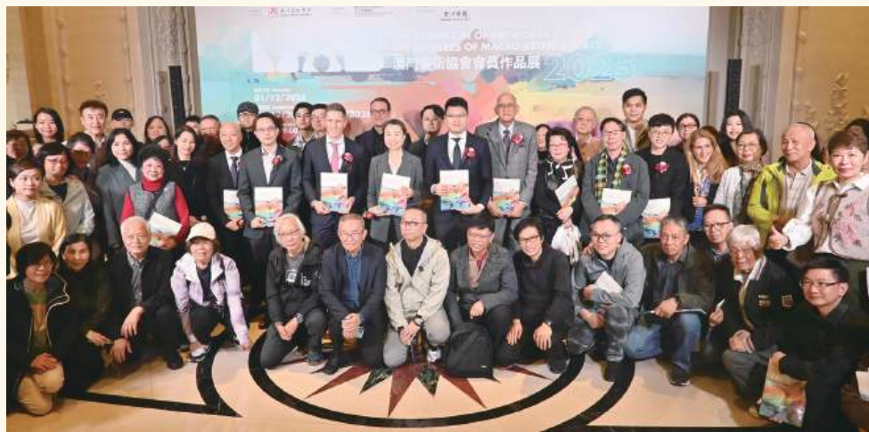
Guests and some of the many participating artists showcasing their work at "The Exhibition of Artworks of the Members of Macau Artist Society 2025" hosted by The Parisian Macao pose for a group photo during last night's opening ceremony.