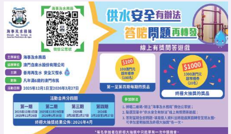
its online prize-giving quiz launched yesterday and ending on March 27 next year.

After each phase, the statement said, 100 winners will be drawn,