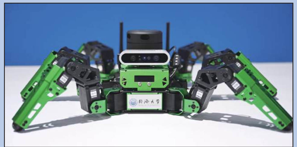
This photo shows a robot displayed at the Third Overseas Chinese Talent Conference for Development in Fuzhou, capital of Fujian Province, yesterday. Under the theme of “Uniting Overseas Chinese Talent, Forging a New Era of Innovation,” the Third Overseas Chinese Talent Conference for Development kicked off yesterday.