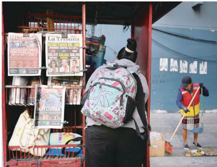
A woman stands in front of a kiosk displaying the front pages of newspapers in the Honduran capital city of Tegucigalpa yesterday, the day after national elections.

Trump's comments marked another brazen intervention in