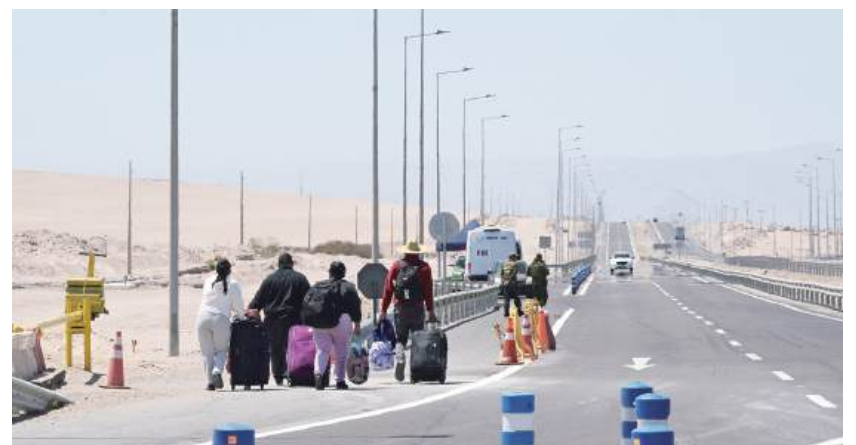
Migrants walk back to Chile after they were not allowed to enter Peru, near de Chacalluta border crossing, about 25 km north of Arica, Chile, on Sunday. Dozens of migrants seeking to leave Chile were stranded at the border with Peru, authorities said on Friday, amid fears sparked by far-right Chilean presidential candidate José Antonio Kast's threat to expel undocumented migrants.