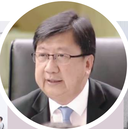
Secretary for Transport and Public Works Raymond Tam Vai Man addresses yesterday's Q&A session about his portfolio's 2026 policy guidelines in the Legislative Assembly's (AL) hemicycle.

The company's taxis, i.e., the red ones currently in operation, are not