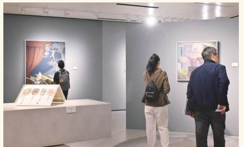
Gallerygoers explore one of the six venues showcasing the 180 artworks.

The free-admission exhibition, which runs through March 27, is open from noon through 7 p.m. daily. Stay tuned for more pictures and details in an upcoming page 4. ■