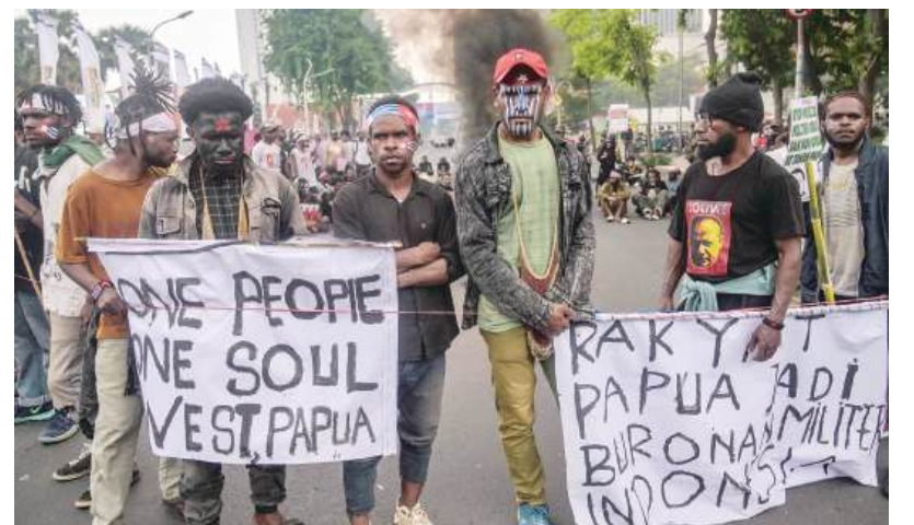
Papuan students take part in a protest calling for the independence of Papua province in Surabaya, Indonesia yesterday, to coincide with the anniversary of the Free Papua Movement.