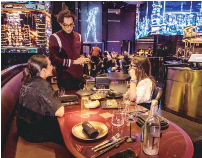
A waiter interacts with customers at Woohoo on November 12.