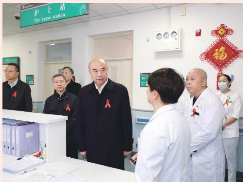
Vice Premier Liu Guozhong (center), also a member of the Political Bureau of the Communist Party of China Central Committee, inspects HIV/AIDS prevention and treatment work during a visit to Beijing Youan Hospital in Beijing, yesterday, marking the 38th World AIDS Day.

Premiering nationwide just ahead of this year's World AIDS Day yesterday, the film tells how China has been supporting young