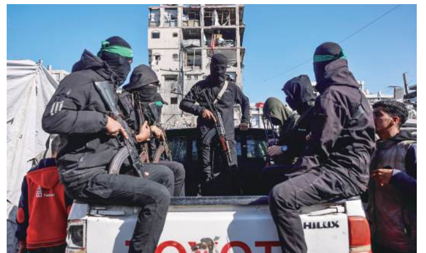
Palestinian Hamas militants arrive to secure the area as Egyptian workers, accompanied by members of the International Committee of the Red Cross (ICRC), search for the last two remaining bodies of hostages – an Israeli soldier and a Thai national – from under the rubble of the Jabalia refugee camp, in the northern of Gaza Strip, yesterday. The Gaza war was sparked by Hamas's October 7, 2023 attack on Israel, resulting in the deaths of 1,221 people and the taking 251 hostage. Israel's retaliatory assault on Gaza has killed over 70,000 people, according to figures from the health ministry that the UN considers reliable.