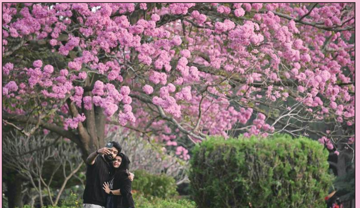
People take a selfie in front of a Tabebuia rosea tree in a park in Bengaluru, India yesterday.

Hong Kong, Taiwan, Singapore, Vietnam and Thailand are among the main importers of Japanese oysters. – AFP