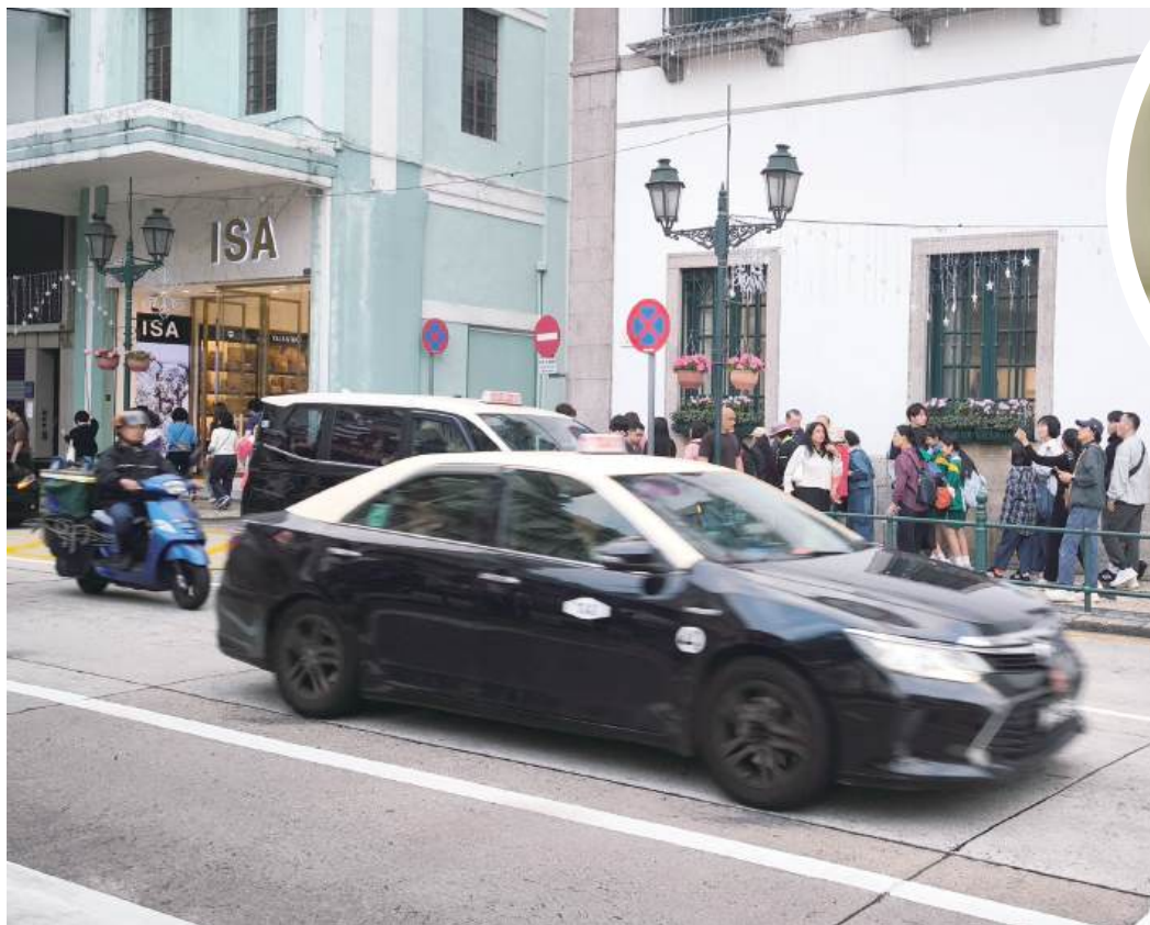
Taxis are driven along Avenida de Almeida Ribeiro, the city's main thoroughfare, yesterday.

The government granted two concessions for the city's radio taxi services, which were granted to the same company, Macau Radio Taxi Services Limited, at two different times. The first concession, with 100 radio taxis (blue), commenced on April 1, 2017 and expired on September 30 this year, while