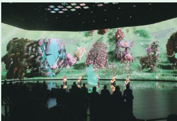
MACAU 2049, MGM’s residency show, presents “Drumming · Shadows” (top) and “Khoomei · Ethereal”, combining advanced technology with elements of Chinese cultural heritage at its eponymous theatre yesterday in Cotai.