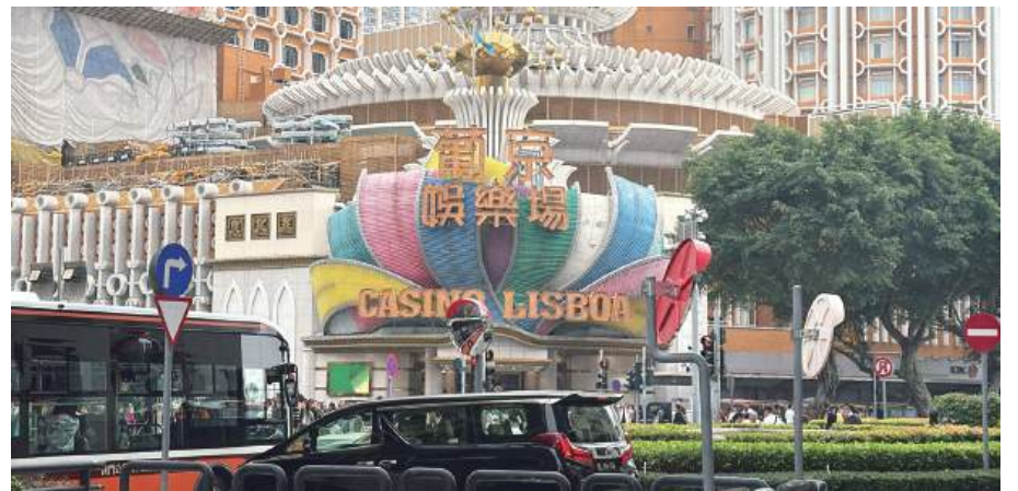
Vehicular and pedestrian traffic move in front of Casino Lisboa yesterday afternoon.

Macau’s government-concessioned gaming industry is operated by six rival integrated resort (IR) operators: Sands, Galaxy, SJM, Melco, Wynn, and MGM. Under their concession agreements with the government, the IR operators are required to strengthen their non-gaming attractions and support the promotion of Macau’s cultural heritage and old-quarter renewal projects. The operators pay 35 percent of their GGR as direct gaming tax to the government, in addition to a further 5.0 percent