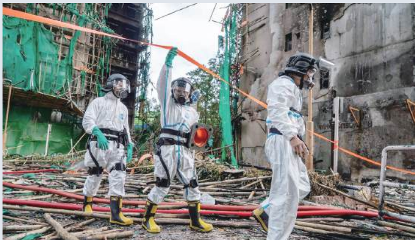
Officers from the Disaster Victim Identification Unit (DVIU) of the Hong Kong Police Force search for bodies yesterday after Wednesday's deadly fire at the Wang Fuk Court residential estate in Hong Kong's Tai Po District. The police said yesterday that they have made a total of 13 arrests over Hong Kong's deadliest blaze in decades after it killed 151 people last week, a toll that the police warned could further rise.