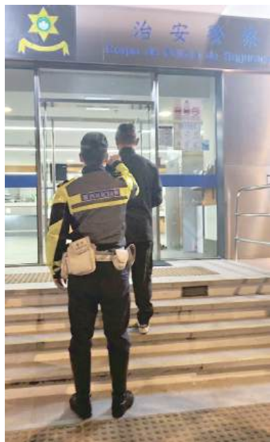
This undated handout photo provided by the Public Security Police (PSP) yesterday shows a PSP officer escorting the drunk-driving suspect into a police station.

The Public Security Police (PSP) apprehended a local man on Wednesday for drunk driving, with his blood alcohol concentration standing at 2.05 grams per litre, PSP spokeswoman Kong Chi Ian said during a