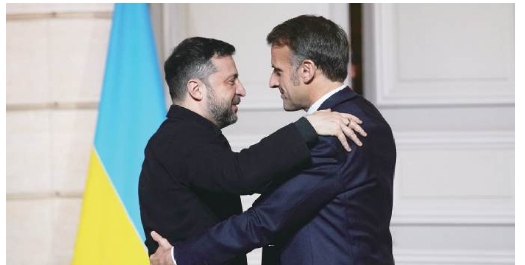
France’s President Emmanuel Macron (right) and Ukrainian President Volodymyr Zelenskyy are about to hug following a joint press conference at the Élysée Palace in Paris yesterday. Ukrainian In his meeting with Macron, Zelenskyy sought to shore up European support as US President expressed optimism of a deal to end the war in Ukraine.