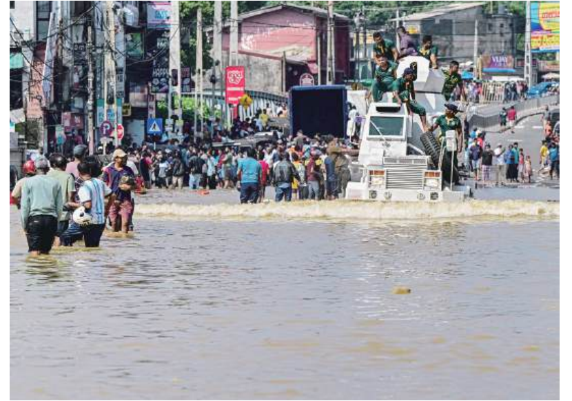
Army personnel ride a military truck as people wade along a flooded road after heavy rainfall in Wellampitiya on the outskirts of Colombo, Sri Lanka yesterday.

The air force said two infants and a 10-year-old child had also