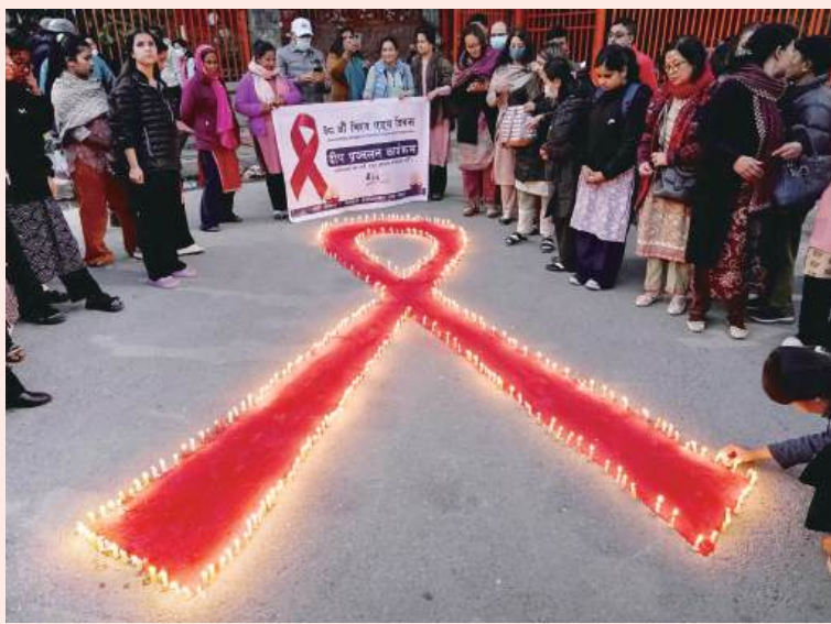
Volunteers light candles during an awareness campaign event organised on the eve of 'World AIDS Day' in Kathmandu, Nepal yesterday. — AFP

The worst flooding since the turn of the century occurred in June 2003, when 254 people were killed. — AFP