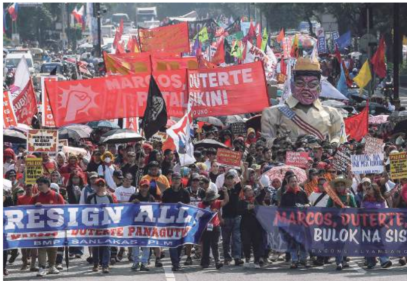
Protesters carrying an effigy of Philippine President Ferdinand Marcos march towards Malacañang palace during an anti-corruption rally in Manila yesterday.

Yesterday, marchers faced with barbed wire-wrapped barricades blocking their route to the presidential palace chanted "Police! Protectors of the corrupt!" as riot police pounded