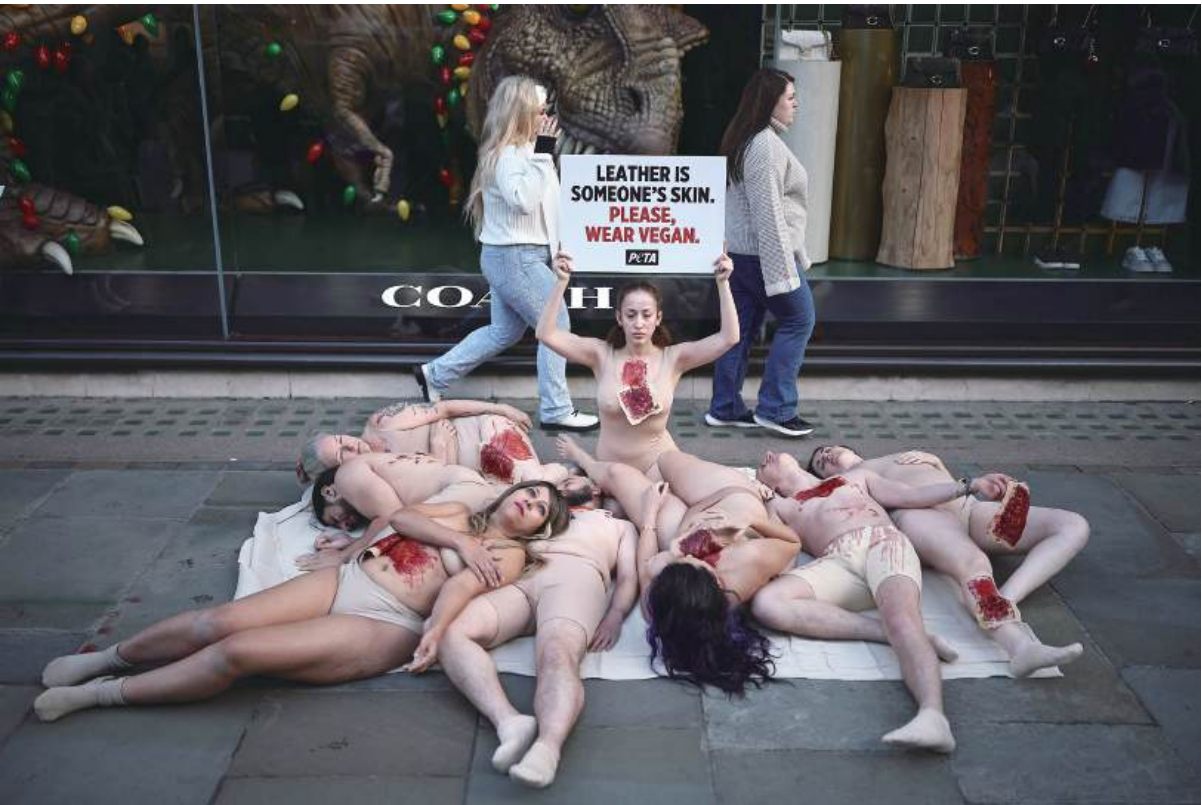
Save our skins! Members of the public make their way past protesters from animal rights group PETA, promoting their “Free the Animals Friday” campaign, outside a luxury brand shop in London on Friday. — AFP