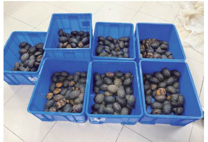
This undated handout photo provided by Zhuhai Gongbei Customs yesterday shows 374 terrapins seized by its officers at the Hong Kong-Zhuhai-Macao Bridge (HZMB) on November 7.

According to the statement, on that day, at around 3 p.m., customs