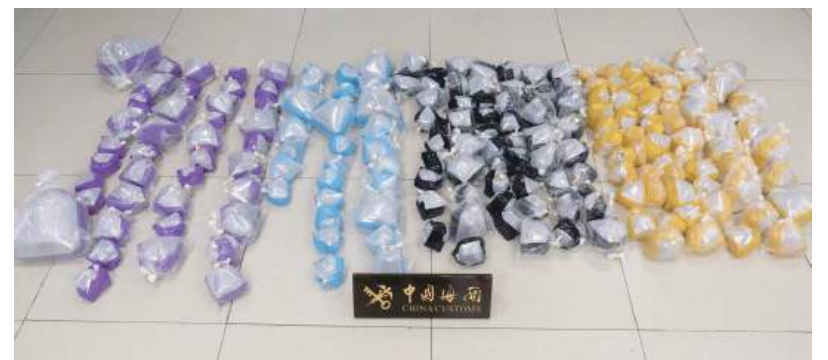
This undated handout photo provided by Zhuhai Gongbei Customs yesterday shows ornamental fish and pet crabs in individual plastic bags, seized by its officers at the HZMB on October 15.

officers at the HZMB Zhuhai Port (checkpoint) inbound passenger vehicle lane noticed an anomaly in the inspection images of a Guangdong-Hong Kong dual-plate vehicle.