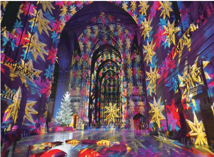
Bright stars The opening night of ‘The light before Christmas’ by Luxmuralis artist Peter Walker is displayed at Liverpool Cathedral in Liverpool, north west England on Saturday. The light installation is open to the public until December 6. Luxmuralis, with Artistic Director, Walker, is a collaborative team combining artists from different backgrounds and artistic disciplines –creating works across multiple media and presentation formats.