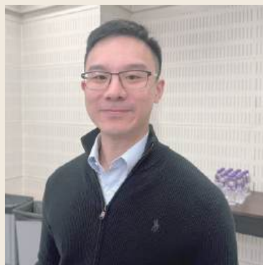
"929 Challenge" startups competition judge Derek Chui Tin Yau poses during an interview with reporters on the sidelines of yesterday's competition final at the Complex of Commerce and Trade Co-operation Platform for China and Portuguese-speaking Countries in Nam Van.

*SaaS (Software as a Service) is a method of software delivery and licensing where users access software applications over the internet (typically through a web browser) on a subscription basis, rather than buying and installing it on their own computers. —DeepSeek