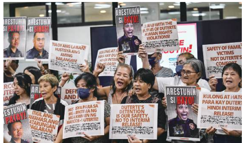
Relatives of the victims of extrajudicial killings react after they watch the live streaming of the hearing on the appeal ruling on the provisional release of former Philippine president Rodrigo Duterte, who is accused of crimes against humanity, in Quezon City, Metro Manila on Friday.