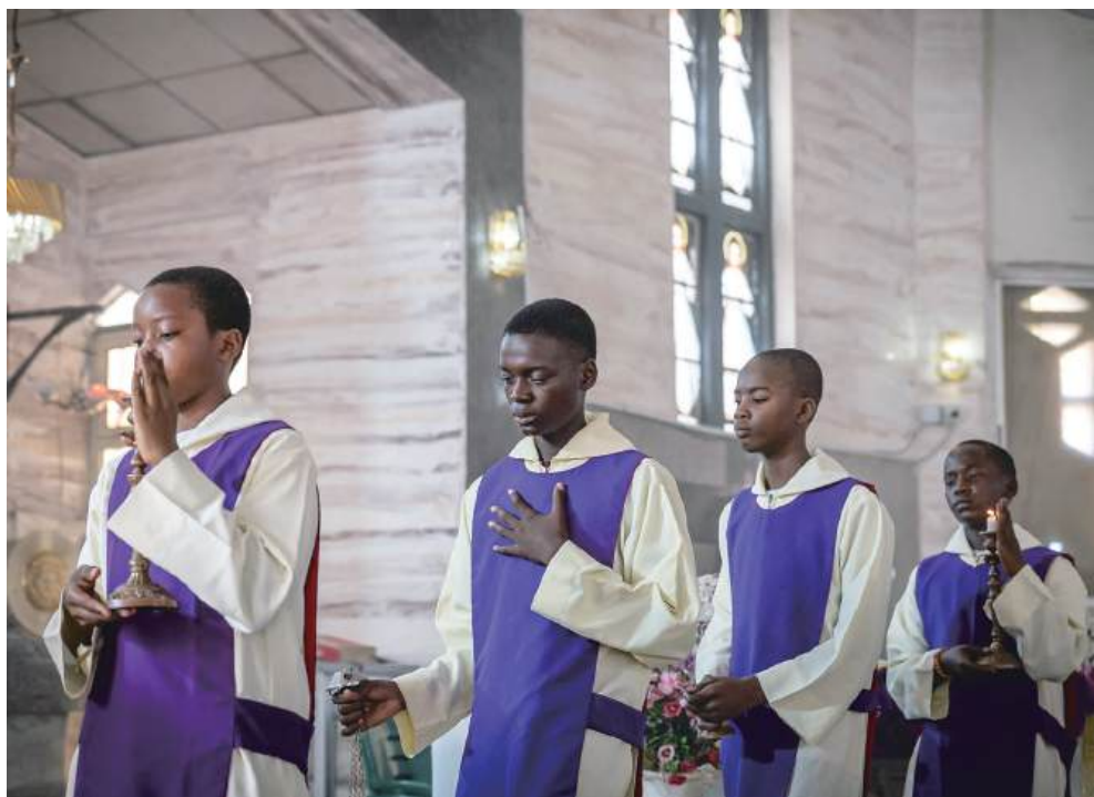
Deacons pray at the Saint Michael's Cathedral during the Sunday service in Minna yesterday, as the congregation prayed for the safe return of the abducted students of Saint Mary's Catholic School earlier this month.

Besides radical Islamists, bandit gangs have also sown violence across swathes of northwest and central Nigeria, where they