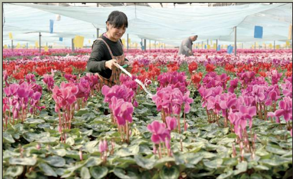
Farmers water flowers at a floriculture base in Luancheng District of Shijiazhuang City, capital of Hebei Province, yesterday. Some 200,000 flower plants of various kinds bloom at the base currently, which will be supplied to the market after selection by the farmers.

Macau's most popular English-language newspaper – Your trustworthy source of news & views