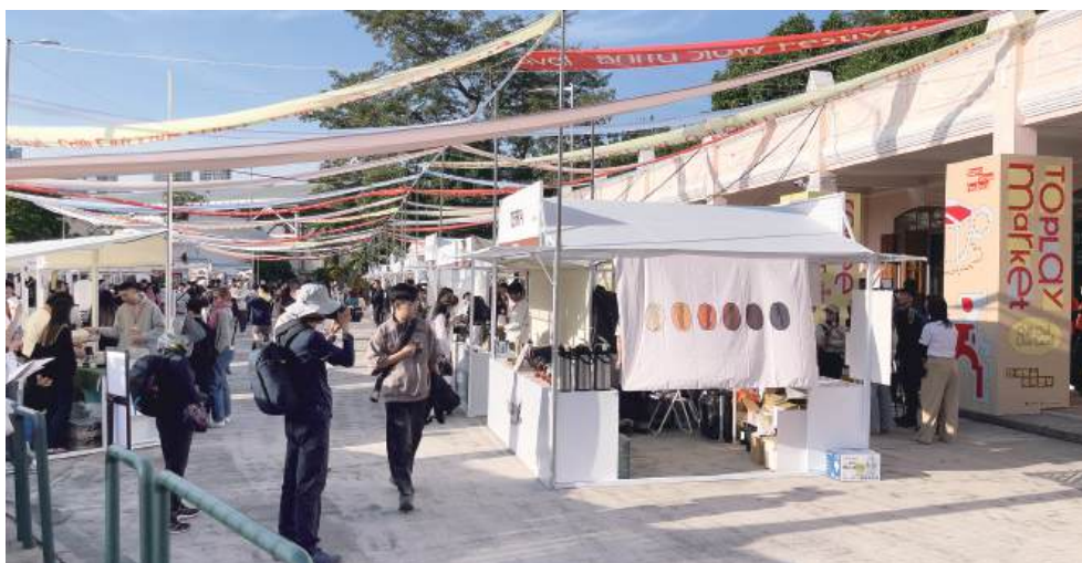
Coffee aficionados flock to the Barra Slow Festival on Friday, its opening day, in the Outdoor Plaza in Barra.