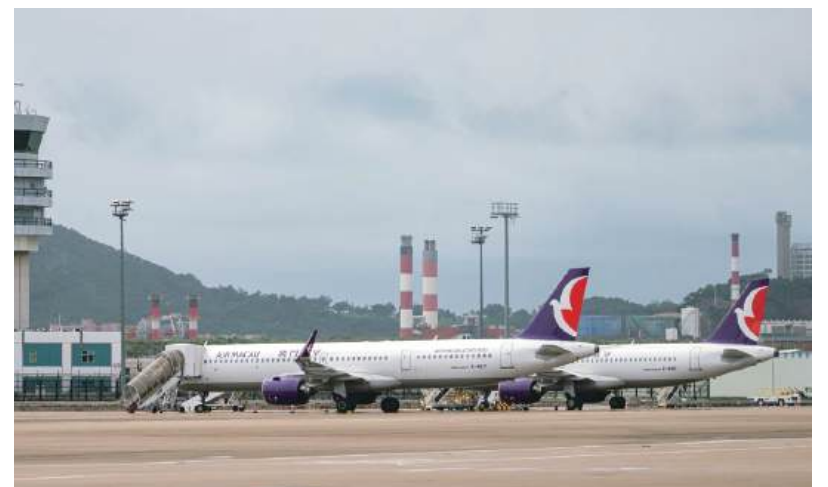
This undated handout photo provided by the Civil Aviation Authority (AACM) on Saturday shows a pair of Air Macau aircraft parked at the local airport.

statement on Saturday night, in response to the notification regarding the software upgrade for Airbus A320 aircraft, the software upgrade for the 12 affected planes had been completed by 8:30 p.m. on