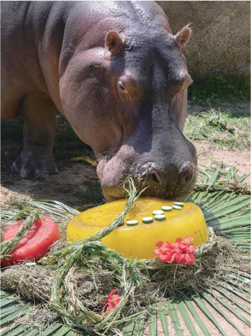
Happy hippo Tim, a hippopotamus at BioParque do Rio, eats a fruit and vegetable cake during the celebration of his 29 th birthday at the Quinta da Boa Vista zoo in Rio de Janeiro, Brazil, on Thursday.