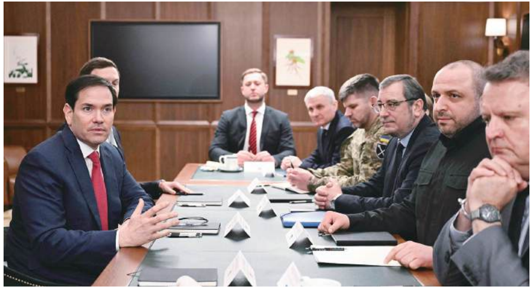
US Secretary of State Marco Rubio (left) speaks during a meeting with Ukrainian officials headed by Rustem Umerov (second from right) in Hallandale Beach, Florida yesterday.

HALLANDALE BEACH, Florida – US Secretary of State Marco Rubio kicked off high stakes talks with a Ukrainian delegation in Florida yesterday, as the United States pushes to end Russia’s war against its neighbour.