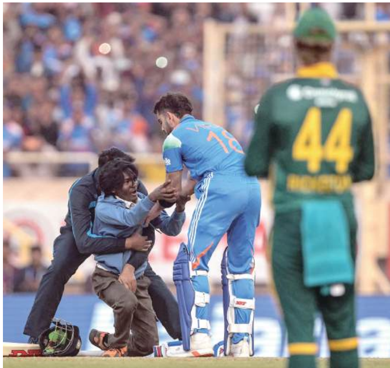
A pitch invader and fan of India's Virat Kohli (centre) greets him during the first one-day international (ODI) cricket match against South Africa at the JSCA International Stadium in Ranchi, India yesterday.