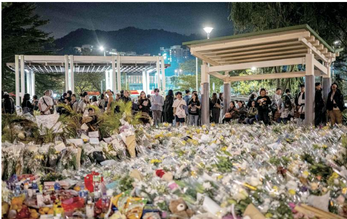
Mourners yesterday leave flowers for the victims outside the Wang Fuk Court in the aftermath of Wednesday's deadly inferno in Hong Kong's Tai Po District.