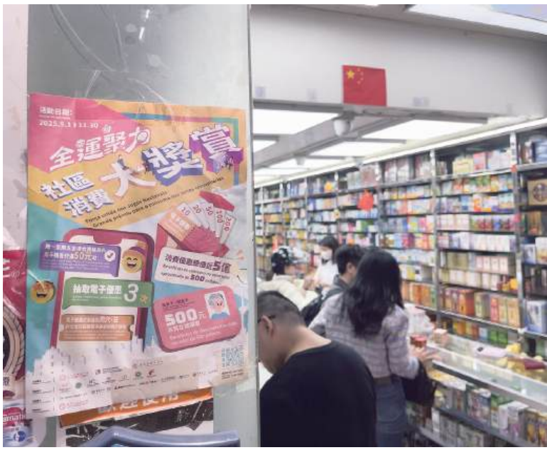
The poster displayed on the façade of a Western pharmacy on Rua dos Mercadores promotes the government's 3-month "National Games Cohesion - Community Consumption Grand Prix" reward programme, which started on September 1 and ended yesterday.