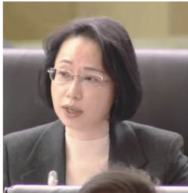
Secretary for Social Affairs and Culture Wallis O Lam addresses Friday's Q&A session about her portfolio's 2026 policy guidelines in the Legislative Assembly's (AL) hemicycle.

In terms of telling the nation's stories well, O said, the local government will revise the officially published history textbook for schoolchildren by adding the nation's latest major policies and initiatives such as the 20 th National Congress of the Communist Party of China (CPC), the Guangdong-Hong Kong-