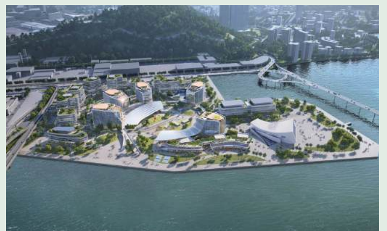
The two artist's renditions released by the government last week shows the two planned industrial parks on the Wai Long plot (top) and Zone E1.