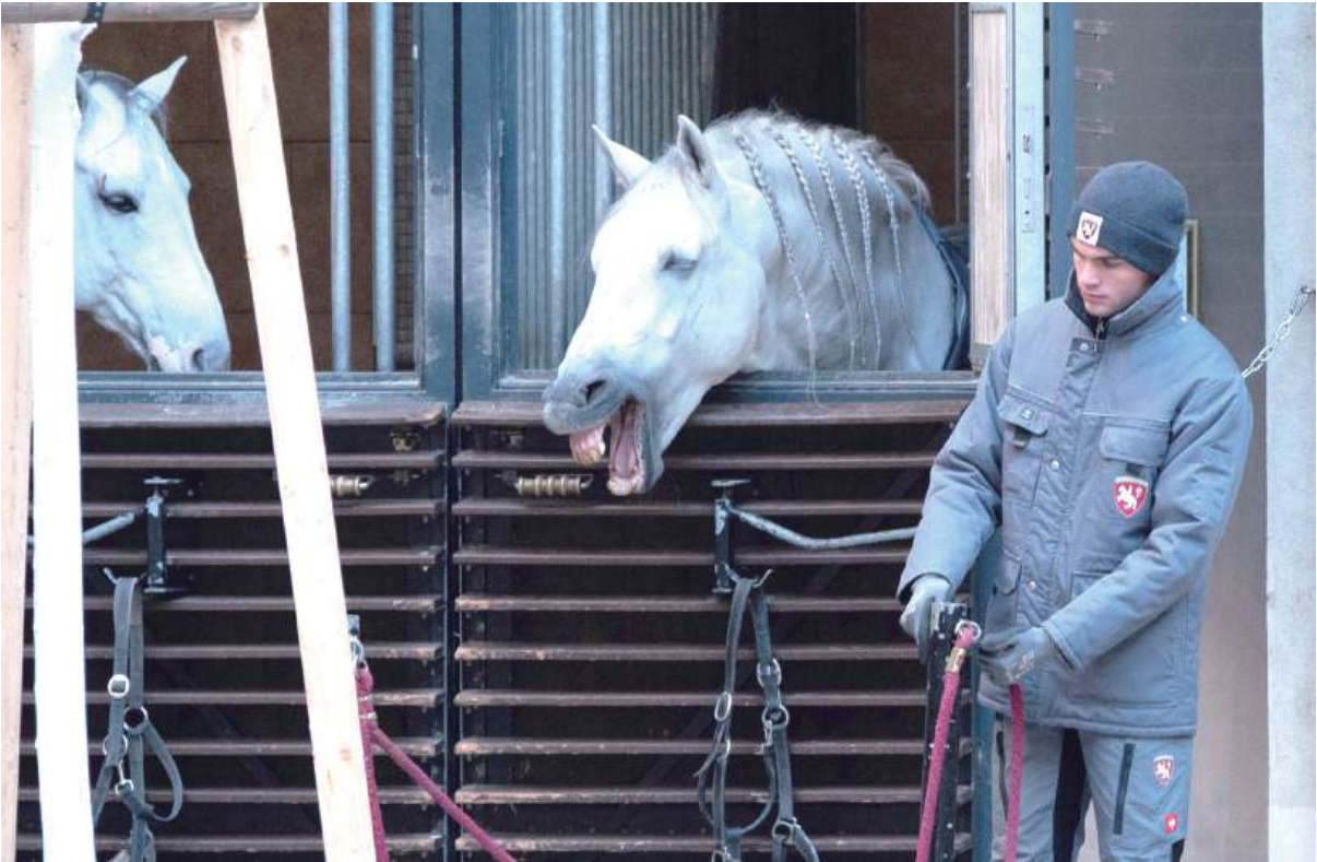
Horsey gossip! Lipizzaner horses are seen in their stables as a care taker checks a rope in the courtyard of the famous 460 years old Spanish Riding School in Vienna, Austria on Friday.