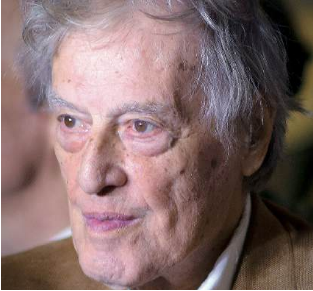
This October 2, 2022 file photo shows Tom Stoppard attending the Opening night of “Leopoldstadt” on Broadway, New York City.