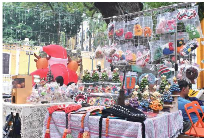
Revellers, including lots of kids, visit the one-day Christmas Creative Market at Albergue SCM yesterday.

**The association's name is directly translated as "Friends of Macau's Pátio do Espinho". The patio near one of Macau's two Na Tcha temples refers to Macau's previously walled 400-year-old