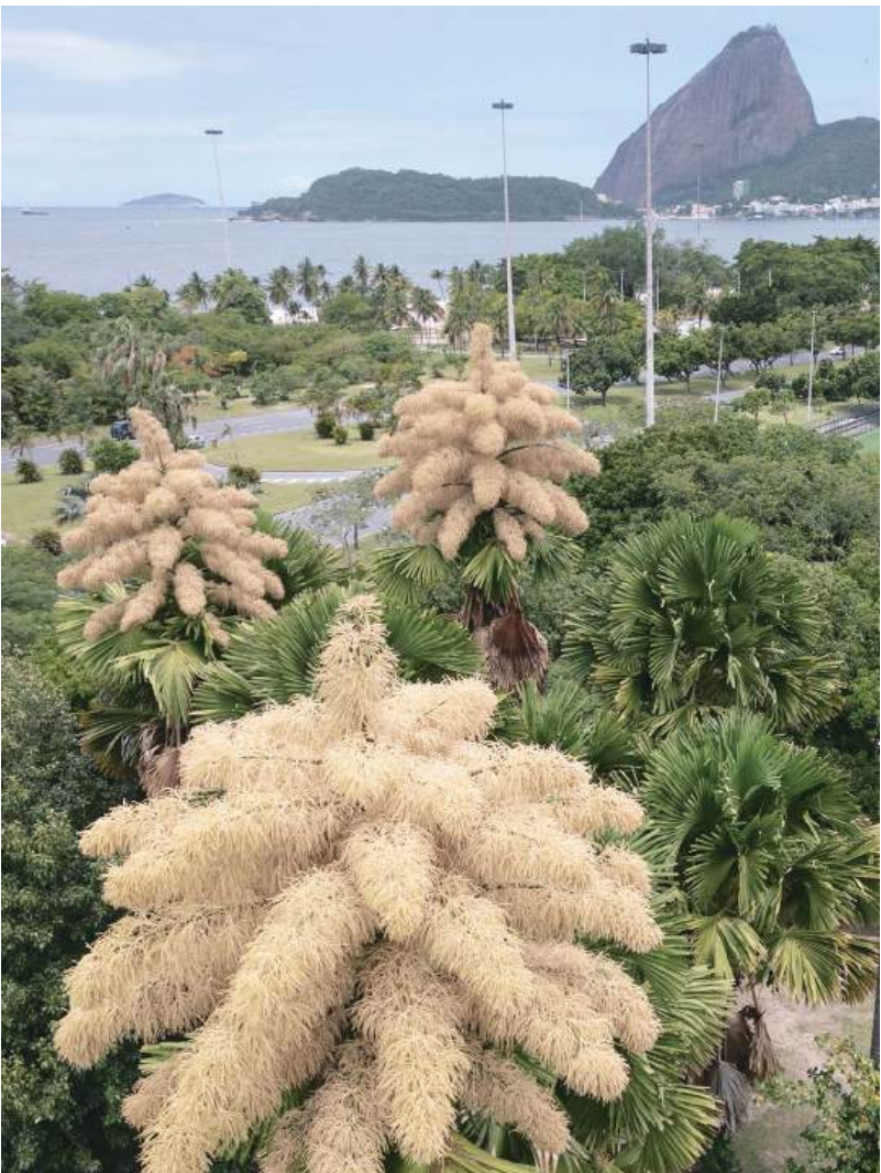
Short lived blooms Aerial view of Talipot Palms Corypha umbraculifera , blooming for the first time since they were planted about 50 years ago in Aterro do Flamengo park in Rio de Janeiro, Brazil, on Thursday.