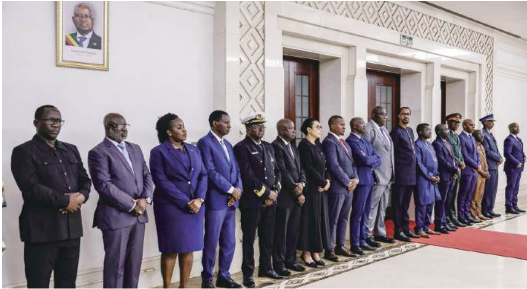
Newly elected members of the Guinea Bissau transitional government stand under the portrait of late Bissau-Guinean president Manuel Serifo Nhamadjo during a swearing-in ceremony at the Presidential Palace in Bissau on Saturday.