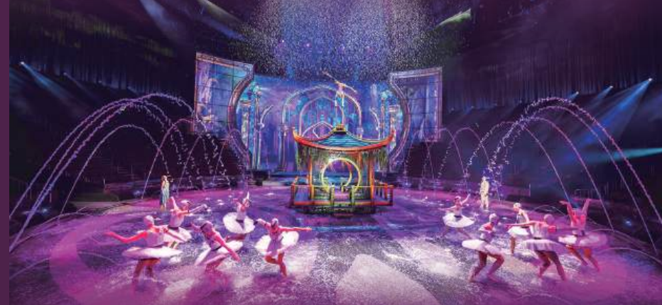
This undated handout photo recently provided by Melco Resorts & Entertainment shows a previous House of Dancing Water performance taking place at City of Dreams (COD) in Cotai.

The TITAN Brand Awards are globally recognised honours that celebrate creative and effective brand campaigns. Winners are judged by an international panel of experts.