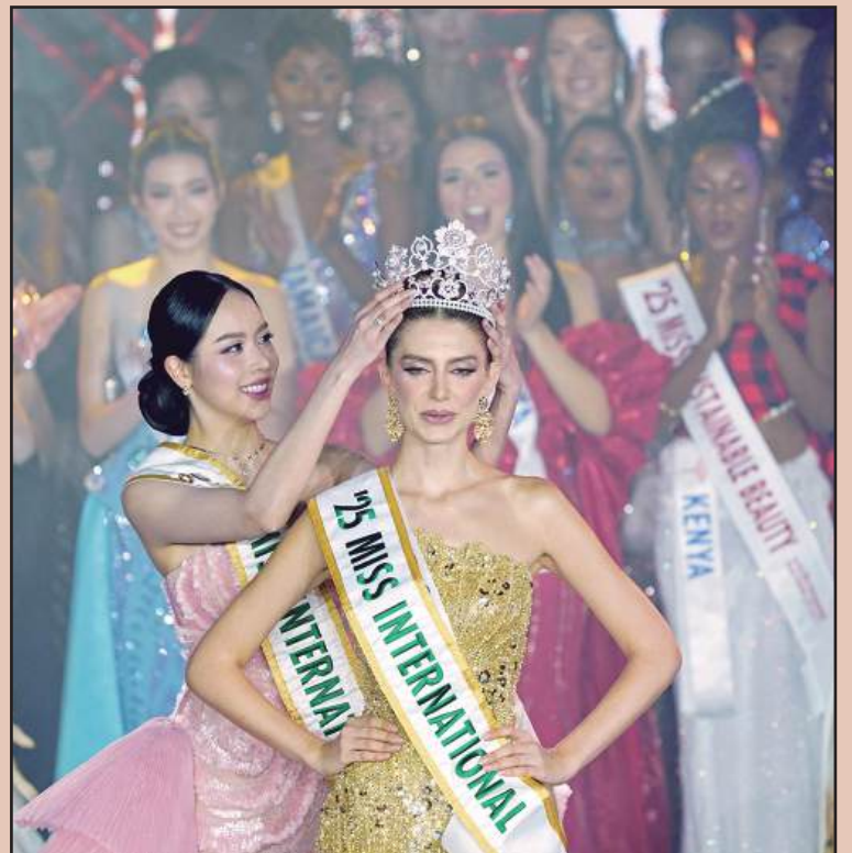
Colombia's Catalina Duque is crowned the 63rd Miss International Pageant 2025 in Tokyo yesterday.