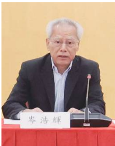
Chief Executive Sam Hou Fai addresses yesterday's meeting at Government Headquarters in Nam Van district.