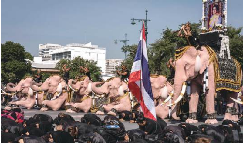
Mourners bow as mahouts gesture on painted elephants sitting during a procession to pay respects to Thailand's late former queen Sirikit near the Grand Palace in Bangkok yesterday.

BANGKOK — Eleven pink painted elephants marched through Bangkok yesterday, bowing in unison outside the Grand Palace in a lumbering tribute to the late queen mother.