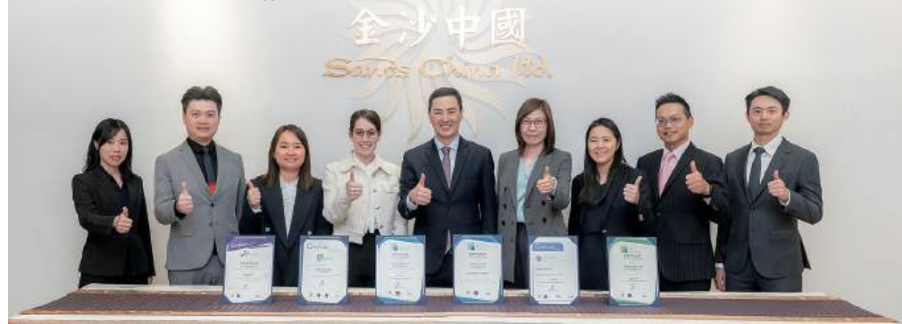
shows staff displaying the company's six certificates awarded in this year's Business Sustainability Indices (BSI).