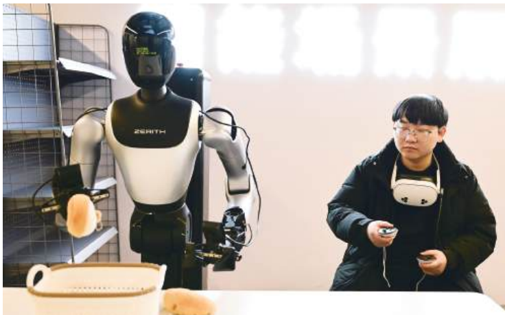
A staff member trains a humanoid robot to fetch objects for data collection purposes at Zerith, a robotics company, in Hefei, capital of Anhui Province, on Tuesday. In recent years, Hefei has been actively promoting the development of its intelligent robot industry. The city is now home to a full-chain industrial system for research, development and manufacturing of robotics that comprises 190 related enterprises.

Supported by the program, retail sales – a major indicator of the country's consumption strength – maintained a stable rise, increasing 4.3 percent year on year during the January-October period.