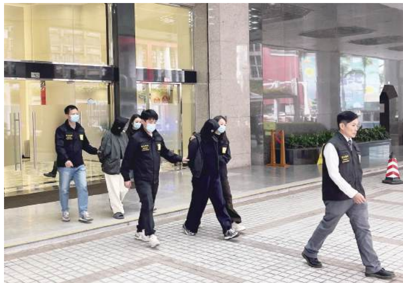
Judiciary Police (PJ) officers escort the two hooded suspects from the PJ headquarters in Zape to a van yesterday.

The duo have been transferred to the Public Prosecutions Office (MP), each facing charges of involvement in illegal currency exchange activities. ■