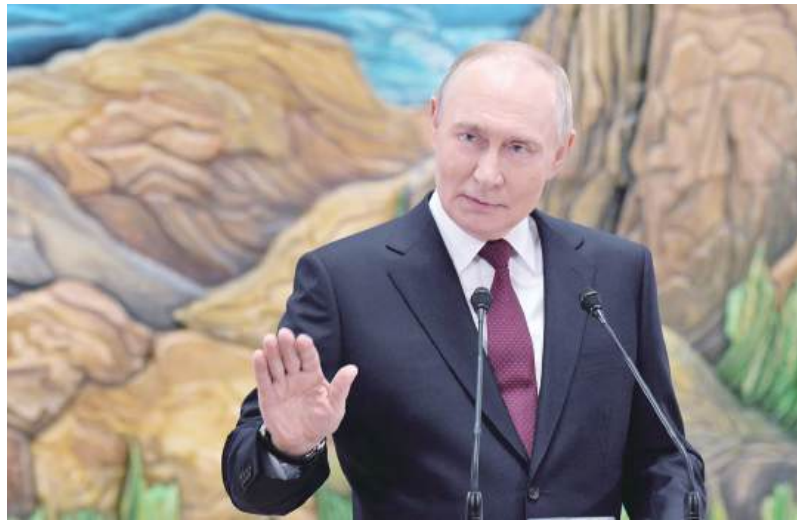
Russian President Vladimir Putin meets with the Russian media in Bishkek, capital of Kyrgyzstan, yesterday.

US negotiator Steve Witkoff was expected in Moscow next week to discuss the revised document, Putin said.