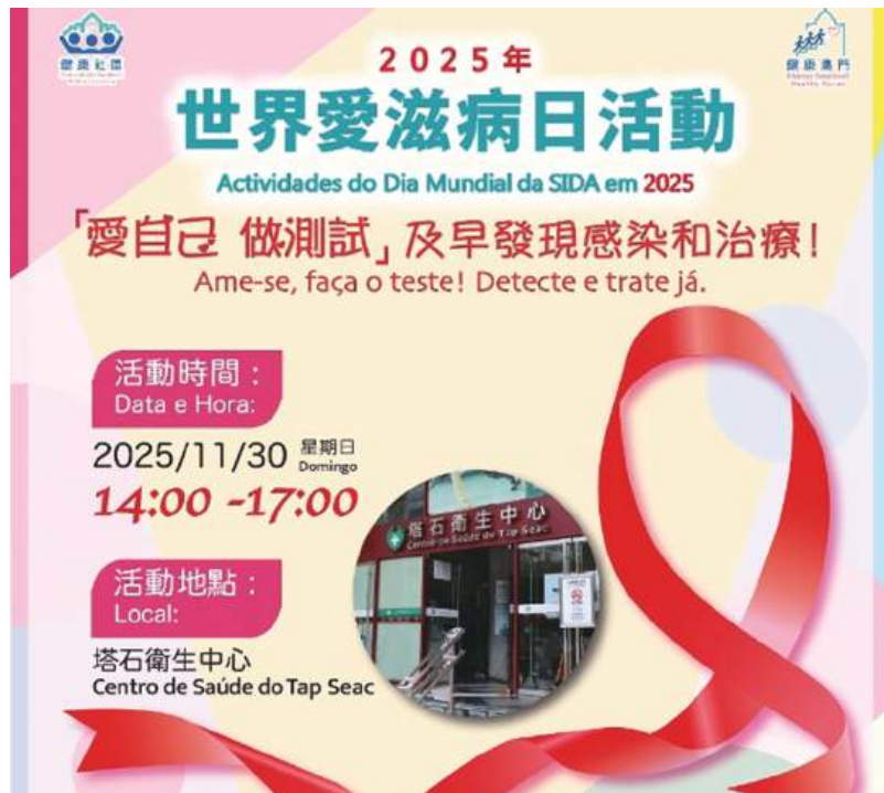
This handout poster provided by the Health Bureau (SSM) on Tuesday shows a World AIDS Day thematic event “Overcoming disruption, transforming the AIDS response” at Tap Seac Health Centre on Sunday.