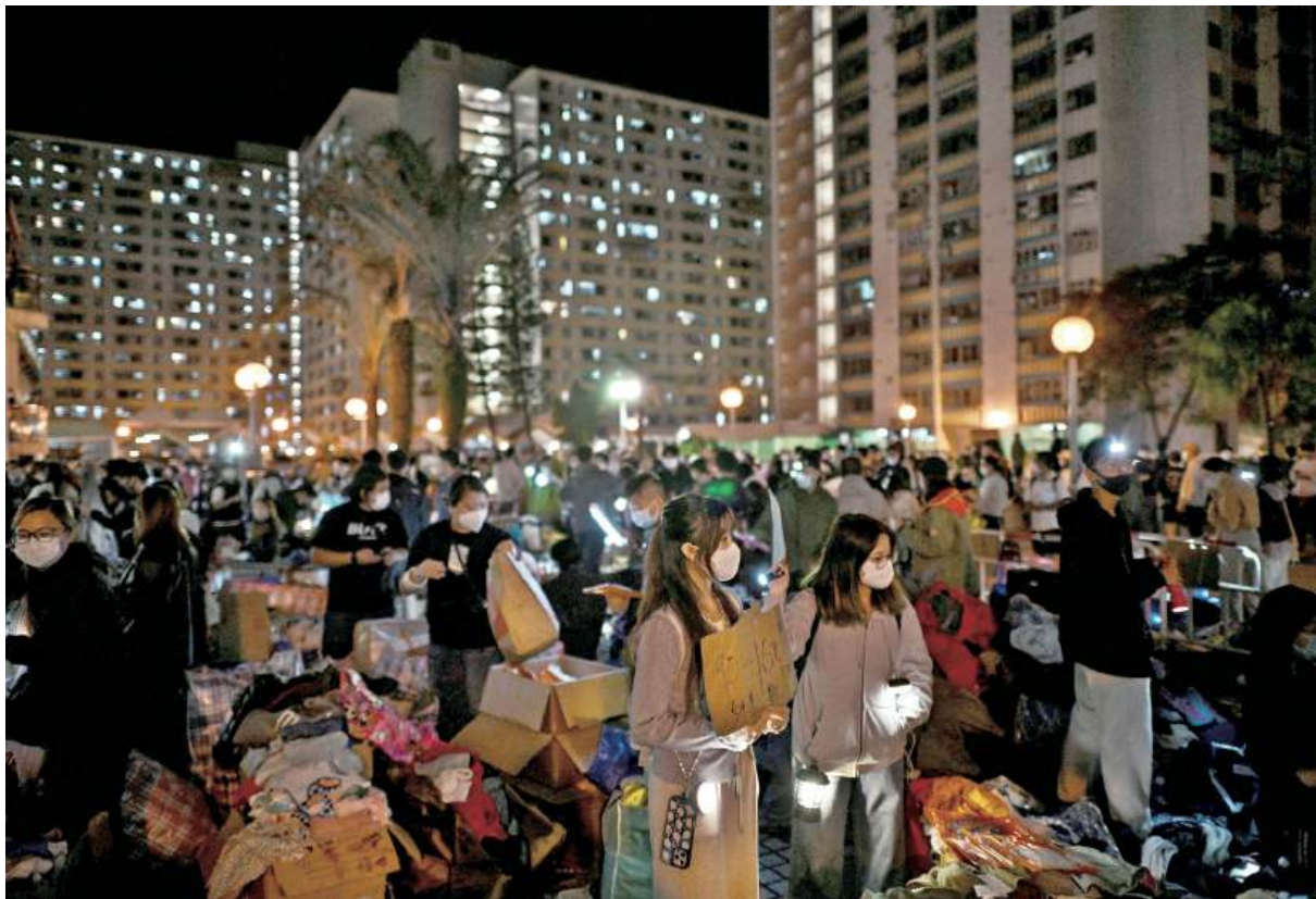
Crowds yesterday distribute daily necessities after the deadly inferno that swept through seven apartment blocks at the Wang Fuk Court residential estate in Hong Kong's Tai Po District yesterday.

on doors, alerting the neighbours, telling them to leave – that's what the situation was like," he said.