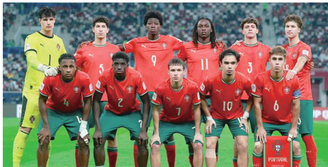
Portugal's players pose for a group picture ahead of the FIFA U17 World Cup final against Austria at Khalifa International Stadium in Al-Rayyan yesterday. Portugal won the game 1-0.

The game will be played at 3:30 a.m. tomorrow morning Macau time.