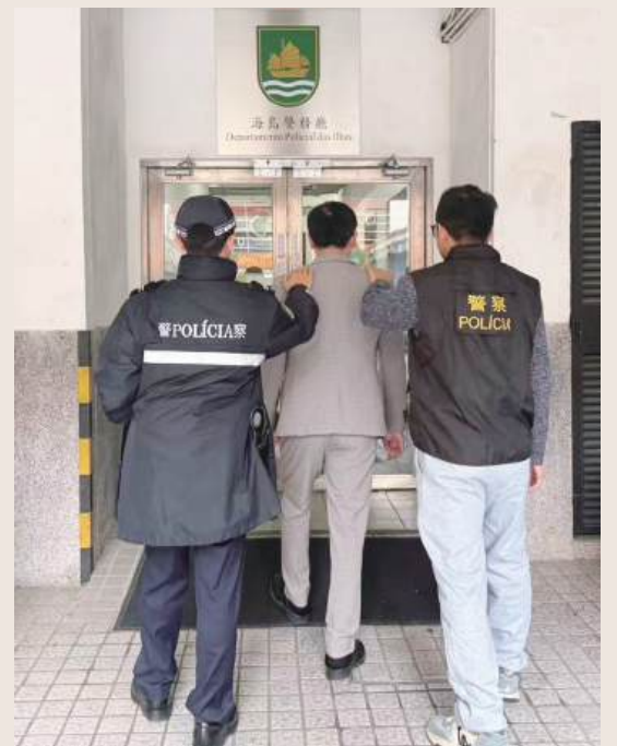
This undated handout photo provided by the Public Security Police (PSP) yesterday shows PSP officers escorting the theft suspect into a police station.