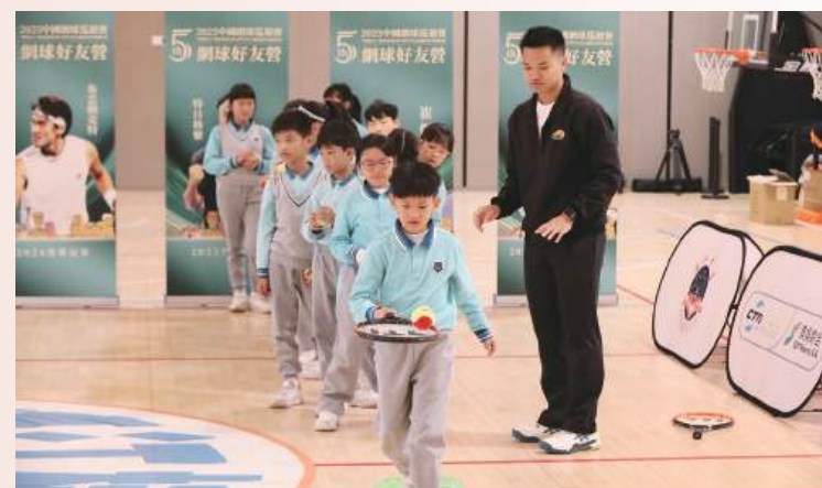
This undated handout photo recently provided by SJM Resorts shows students being trained by a coach from the Macau Tennis Association during the "Tennis Clinic" held on November 19 at Hengqin School Affiliated to Hou Kong Middle School.

The event coincided with tennis competitions of the 15th National Games in the Guangdong-Macao In-Depth Cooperation Zone in Hengqin, the statement noted.