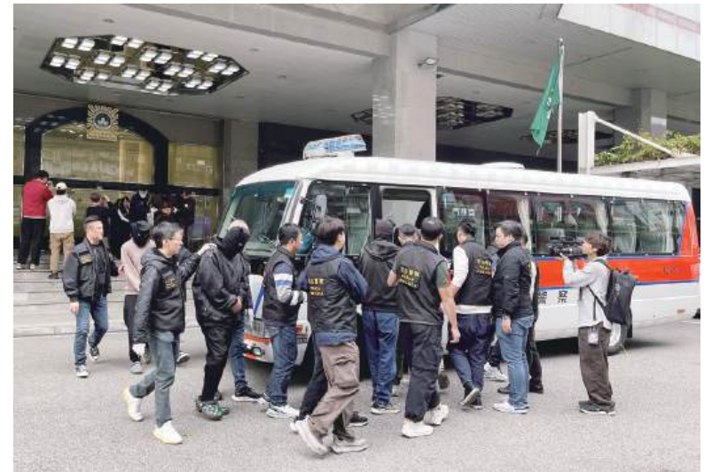
Judiciary Police (PJ) officers escort the 13 hooded suspects to a PJ bus outside the PJ headquarters in Zape yesterday.

According to informed sources, the modus operandi of “cross-hand” gambling proceeds as follows: scammers initiate conversations under false pretences to gain the victim’s trust, after which they offer “assistance” with betting. One of the scammers then intentionally blocks the victim’s view during the betting process, seizing the opportunity for their accomplice to steal chips. They then falsely claim that they placed