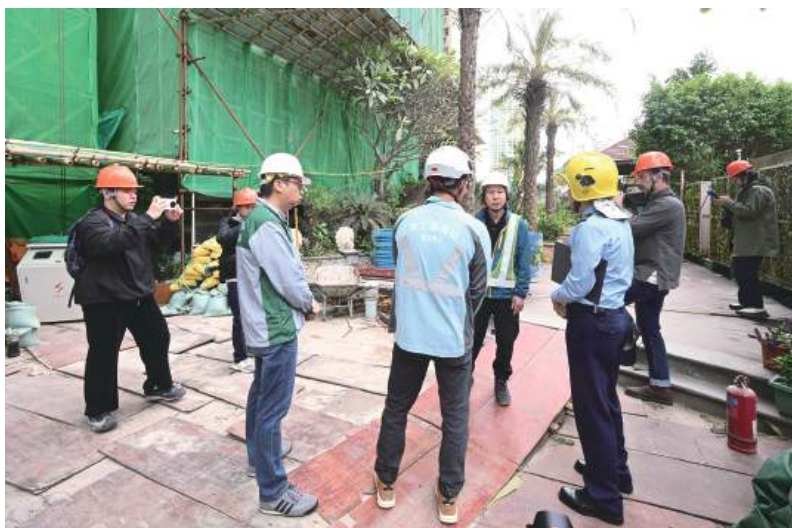
Government inspectors check a project with scaffolding for compliance with the official fire prevention standards yesterday.