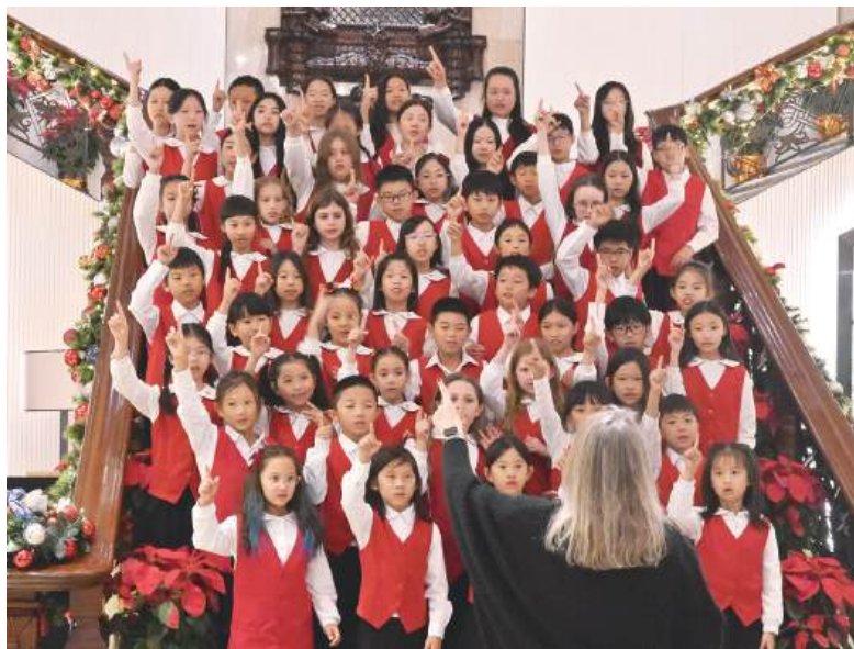
Yesterday's Tree Lighting ceremony at Artyzen Grand Lapa Macau.