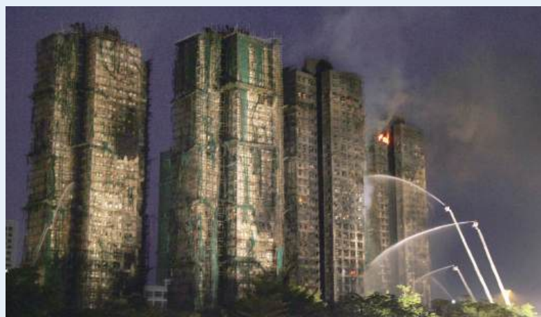
Bystanders watch as Hong Kong firefighters work hard to extinguish lingering flames at the Wang Fuk Court housing complex in Tai Po District of Hong Kong's New Territories yesterday evening, after Wednesday's deadly inferno.

Speaking to the Post , several bystanders and eye witnesses of the inferno said that they were shocked and overwhelmed by the scale and speed of the fire at the complex.