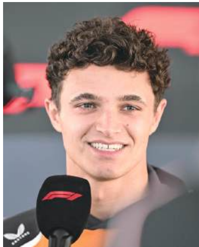
McLaren's British driver Lando Norris looks on from the paddock at the Lusail International Circuit ahead of the Formula One Qatar Grand Prix in Lusail yesterday.

Here, AFP Sport assesses what the McLaren driver must do to extinguish the challenges of Oscar Piastri and Max Verstappen and claim his maiden title in the penultimate round of the 2025 season.