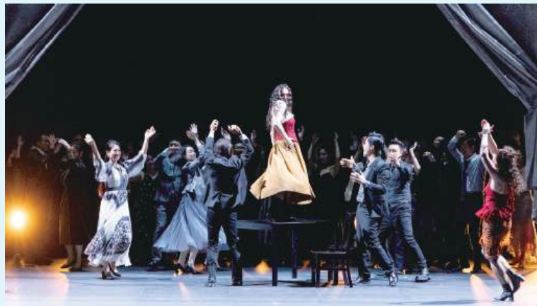
This undated handout photo provided by the Cultural Affairs Bureau (IC) on Wednesday shows the presentation of "Carmen - Opera in Four Acts by Georges Bizet" at the Macau Cultural Centre (CCM) in Nape during the 37 th Macao International Music Festival (MIMF) which concluded on November 8.

The bureau noted that it would continue strengthening the festival's international exchange platform, attracting performances while aiming to support local music development to further reinforce Macau's cultural positioning within the Greater Bay Area (GBA). ■