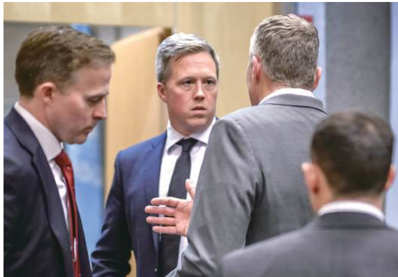
US Secretary of the Army Dan Driscoll (centre) speaks with US officials after closed-door talks with a Ukrainian delegation on a US plan to end the war in Ukraine, at the US Mission in Geneva, on Sunday. Talks between Driscoll and Russian delegates in Abu Dhabi on the US plan are “going well,” his spokesman said yesterday.

Several US media outlets reported yesterday that a US official has said Ukraine accepted a peace deal.