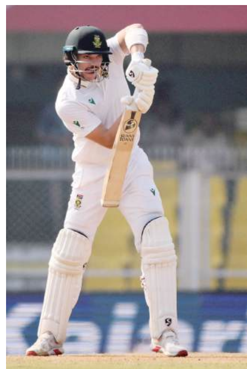
South Africa's Tristan Stubbs plays a shot during the fourth day of the second Test cricket match against India at the Barsapara Cricket Stadium in Guwahati, India yesterday. South Africa had India tottering at 27-2 after setting the hosts a mammoth target of 549 in the second Test yesterday, moving to the brink of a first series win in the country for 25 years. South Africa declared on 260-5 in the final session on day four in Guwahati after Stubbs made 94. World Test champions South Africa lead the two-match series 1-0 and even a draw would seal their first series victory in India since 2000. — AFP

India has its eyes on a bigger prize, having submitted a formal letter of intent last year to the International Olympic Committee to host the 2036 Summer Olympics. — AFP