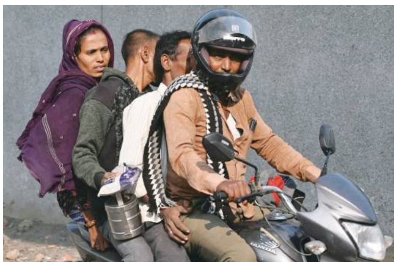
Local labourers ride a bike along a road in Ahmedabad, India yesterday. – AFP

On Facebook, Singapore police had already ordered parent company Meta to clamp down on a growing number of scammers pretending to be government officials. – AFP