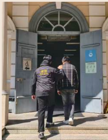
This undated handout photo provided by the Public Security Police (PSP) yesterday shows a PSP officer escorting the theft-by-finding suspect into a police station.