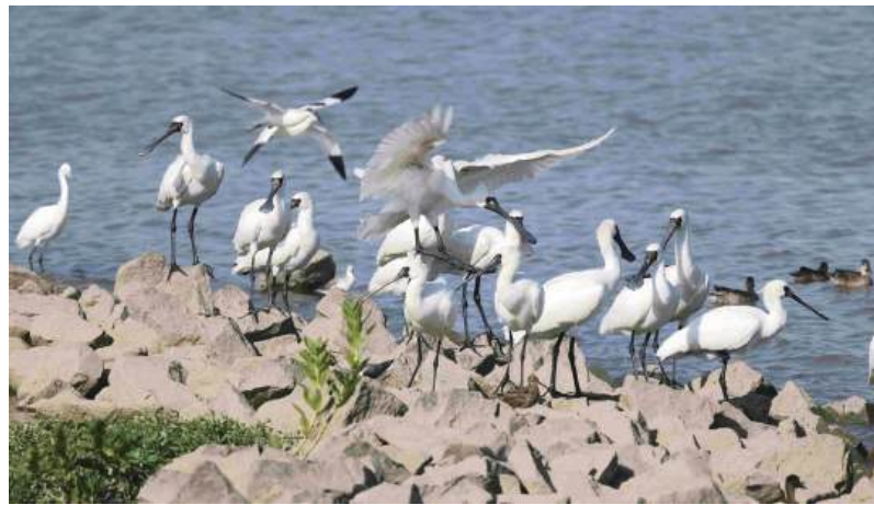
This undated handout photo provided by the Environmental Protection Bureau (DSPA) yesterday shows a flock of black-faced spoonbills that have returned to the Cotai Ecological Protection Zone for winter.

As the migratory bird season begins, the first group of black-faced spoonbills*** returned to the Cotai Ecological Protection Zone for winter last month, the statement said, adding that the season will last until April. Wetland bird-watching sessions will be held monthly, starting from December 13 at 10 a.m. and 3 p.m., with 50 spots available each time, until April. Instructors will lead participants along bird-watching routes and to observation points, providing telescopes and