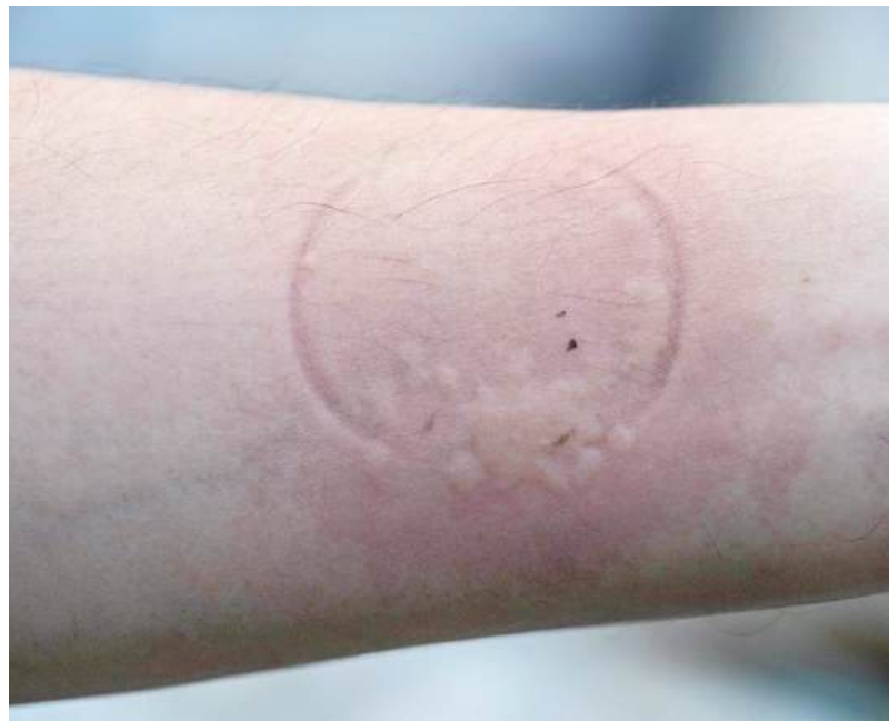
This photo taken on October 8, shows a researcher displaying a rash after allowing bed bugs to feed on his arm as part of a scientific study at a laboratory of the Science University of Malaysia (USM) in George Town, on Penang island.

With the lab’s temperature kept at a constant 23C to 24C, the insects