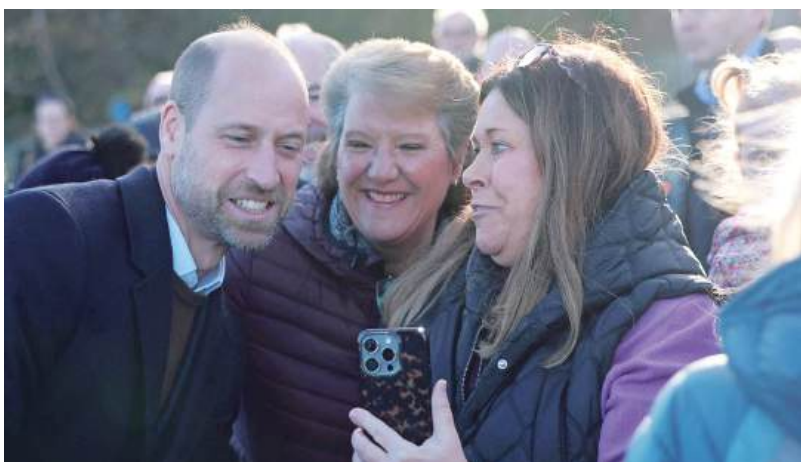
Britain’s Prince William, Prince of Wales poses for a selfie with well-wishers during a visit to the beach at Colwyn Bay, Wales, yesterday. – AFP

The Conference Board said that consumers’ plans for buying big ticket items in the next half year declined in November, while they also pulled back on expected spending on services for this period. – AFP