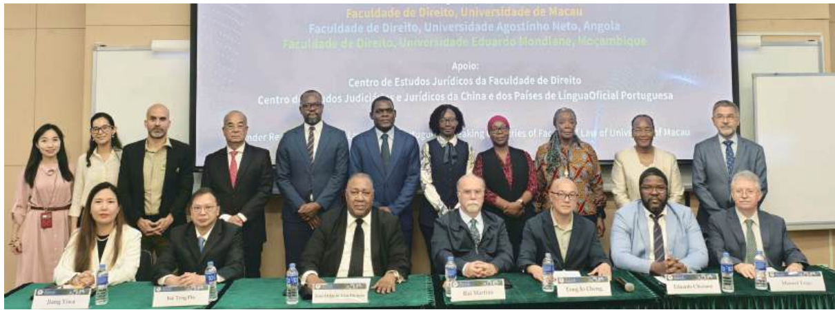
This handout photo provided by the University of Macau (UM) yesterday shows scholars, experts, and faculty members posing for a group photo at ‘The Consolidation of the Rule of Law and the Challenges of Digitalisation’ seminar on October 15. The public university released a statement on Monday about the one-day seminar.

According to the statement, the event gathered scholars, experts, faculty members, and students to