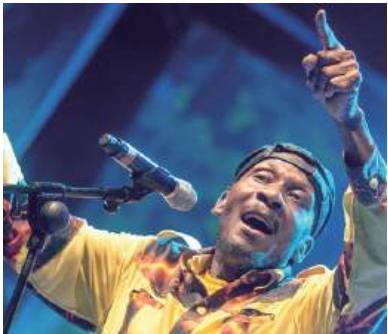
Jamaican singer Jimmy Cliff performs during the Rototom Sunsplash festival in Benicàssim, Castelló Province, Spain, on August 16, 2014.

*Ska is a music genre that originated in Jamaica in the late 1950s and is the direct precursor to rocksteady and reggae. It is characterized by a walking bass line, accented rhythms on the off-beat, and a strong horn section. – DeepSeek