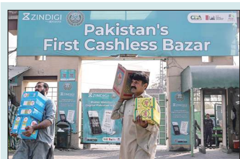
Shopkeepers carry goods past digital cashless payment QR (quick response) codes displayed at a market in Islamabad, Pakistan yesterday. – AFP

With the theme “Uniting Innovation, Connecting the Future,” the summit places the strategic role of technology in driving economic growth, cybersecurity, future mobility, smart cities, advanced healthcare, green innovation and frontier industries. – Xinhua