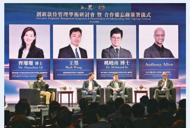
A panel discussion of the Innovative Hospitality Management Symposium takes place at The Londoner Macao yesterday.

the UN Sustainable Development Goals in three panel discussions.