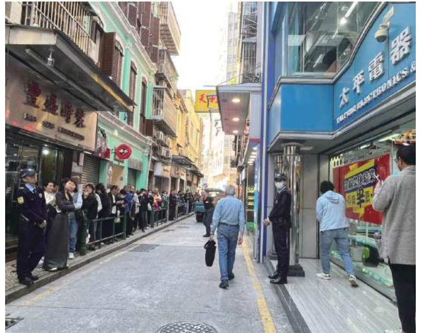
Watched over by the police, shoppers queue on the pavement opposite Tai Peng Electronics & Appliances flagship shop on Rua das Estalagens yesterday afternoon.