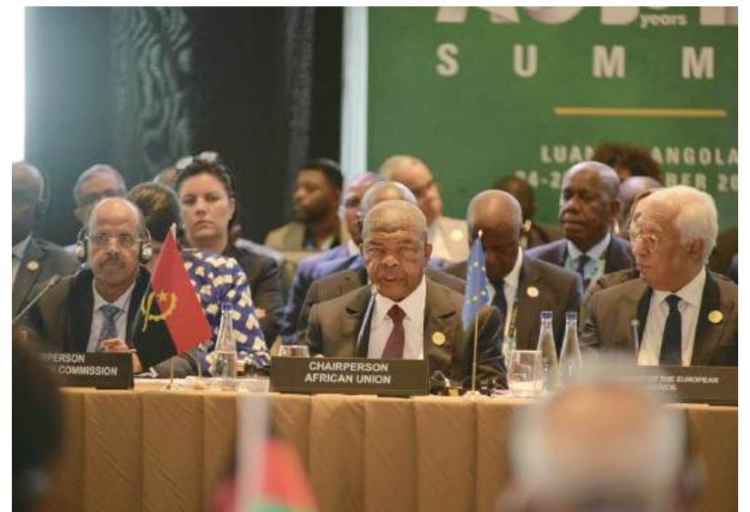
European Council President Antonio Costa (front, right) looks on as Angola’s President João Laureço addresses the plenary during the second and last day of the Africa Union-European Union Summit in Luanda yesterday. – AFP

The Supreme Court already denied one appeal of Bolsonaro’s sentence. – AFP