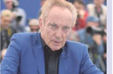
German actor Udo Kier poses during a photocall for the film “Bacurau”, a surreal Weird Western, at the 72nd edition of the Cannes Film Festival in Cannes, southern France, on May 16, 2019.