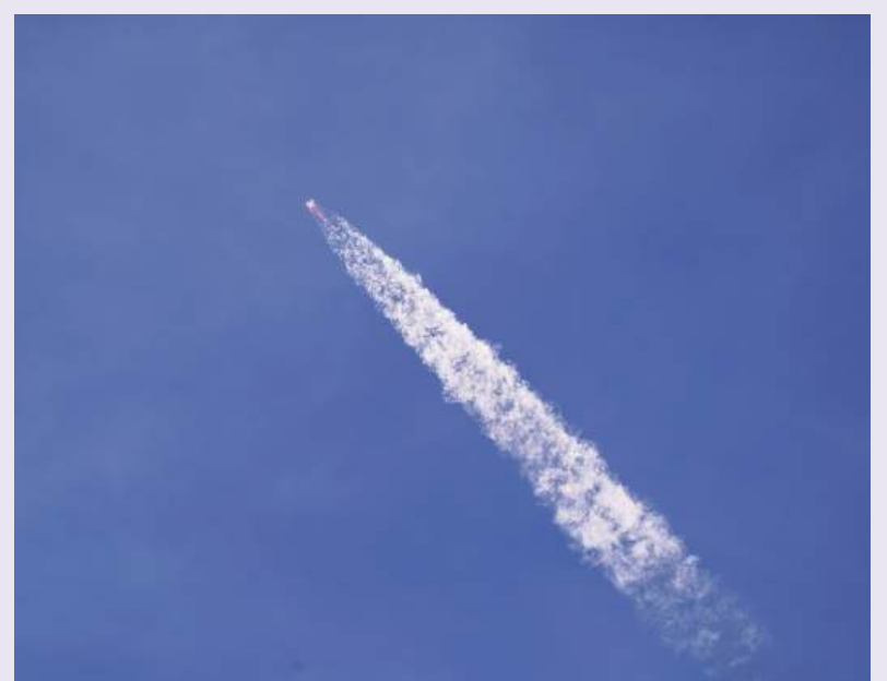
The Shenzhou-22 spaceship, atop a Long March-2F Y22 rocket, blasts off from the Jiuquan Satellite Launch Center yesterday. About 10 minutes after the launch, the spaceship separated from the rocket and entered its designated orbit. The China Manned Space Agency declared the launch mission a complete success.

"As the first ship of the new batch, Shenzhou-22 incorporates upgrades