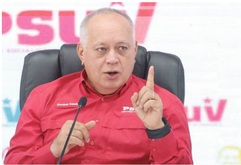
Venezuela’s Minister of Interior Relations, Justice and Peace, Diosdado Cabello, speaks during a press conference of the United Socialist Party of Venezuela (PSUV) in Caracas on Monday. Venezuela on Monday called the US designation of the alleged “Cartel of the Suns” as a terrorist organisation – which Washington links to Venezuelan President Nicolás Maduro – a “ridiculous lie”.

“Whatever they do, wherever they do it, however they do it, they will not be able to defeat Venezuela. We are invincible,”