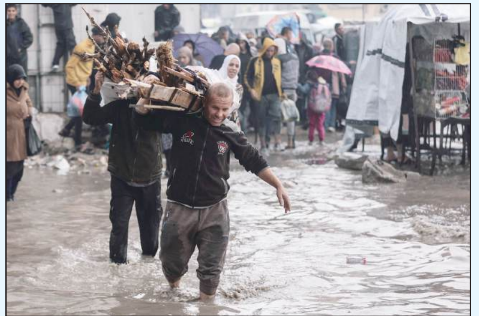
Gazans carry wood while walking in floodwaters at a makeshift camp housing displaced Palestinians following heavy rain in Gaza City yesterday. The Gaza Strip has been largely reduced to rubble after two years of fighting.

In May 2014, Francis visited Amman, Bethlehem and Jerusalem, on his second international visit as pontiff. The popemobile was used as he toured Bethlehem, greeting the